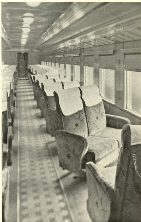
The seats in the chair car may be turned to face the windows