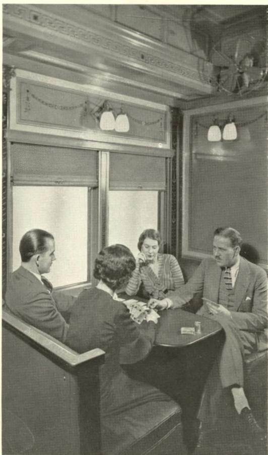
A friendly nook for the bridge fans