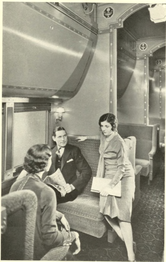
Pullman seats are adjustable for maximum comfort