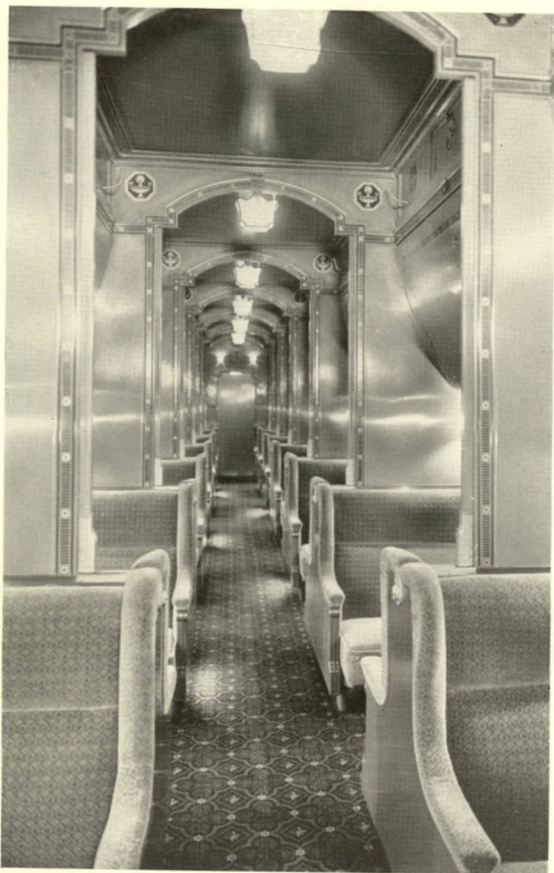
A new conception in travel luxury