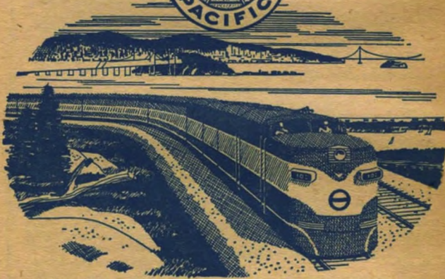
Overland Route CHICAGO · SAN FRANCISCO