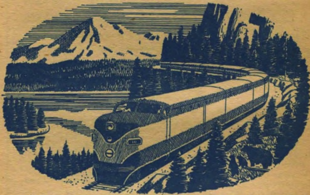
Shasta Route PORTLAND · SAN FRANCISCO