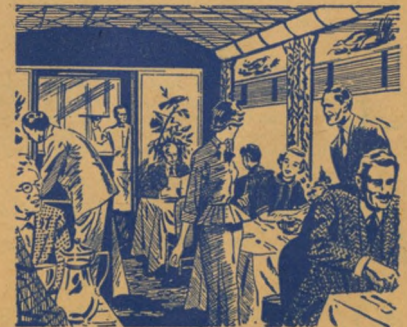
AUDUBON DINING ROOM