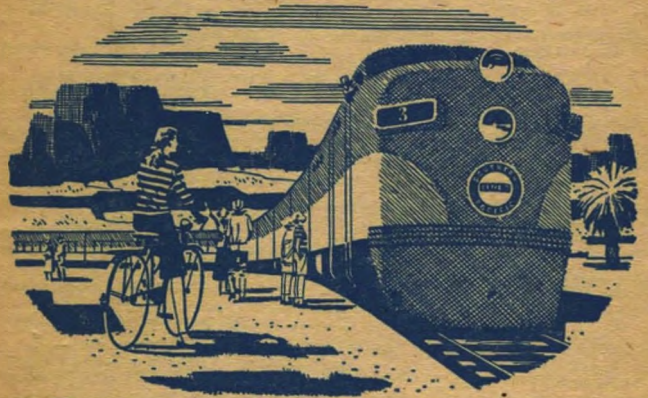
Golden State Route CHICAGO · LOS ANGELES