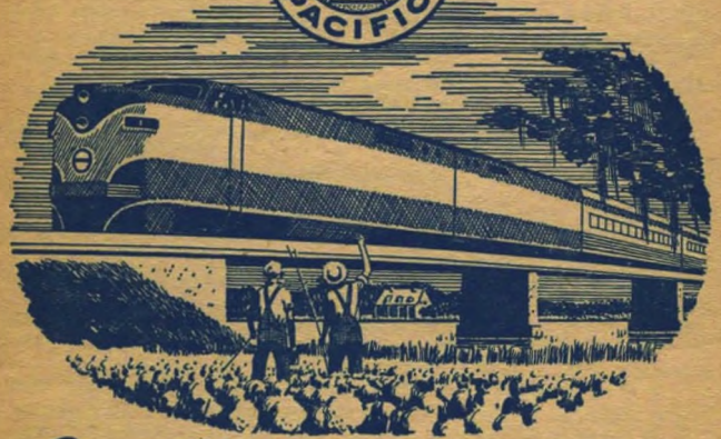
Sunset Route NEW ORLEANS · LOS ANGELES