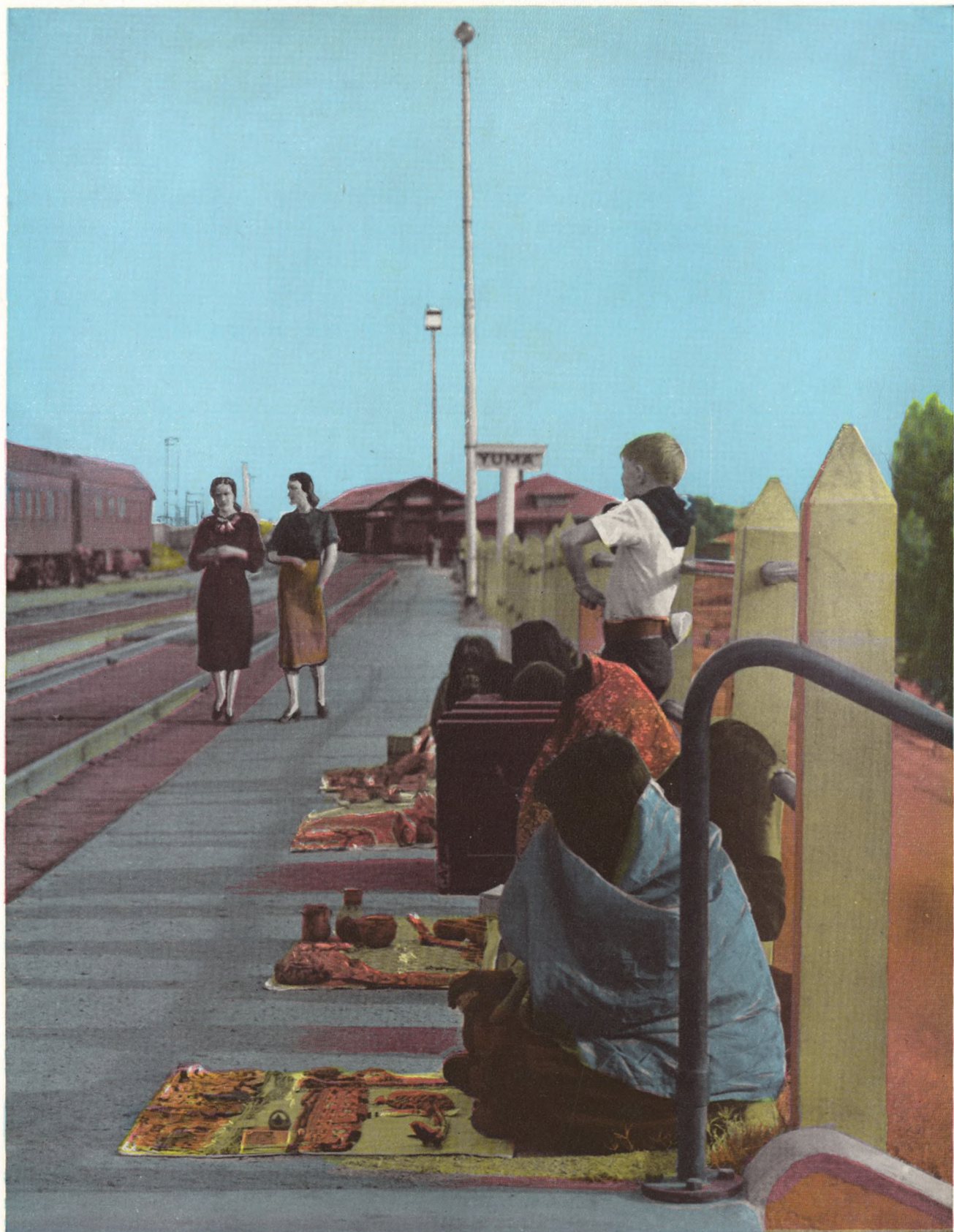
INDIANS SELLING THEIR HANDIWORK ON STATION PLATFORM, YUMA, ARIZONA