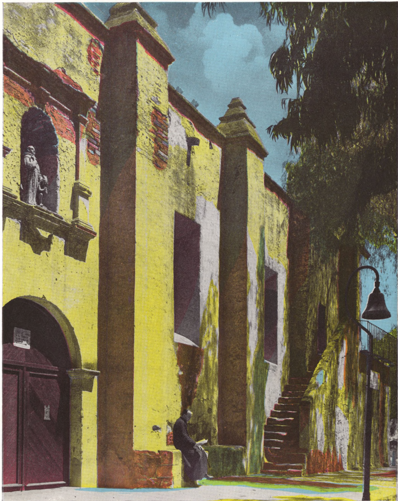
MISSION SAN GABRIEL ARCANGEL, ESTABLISHED IN 1771 AND IN OPERATION SINCE