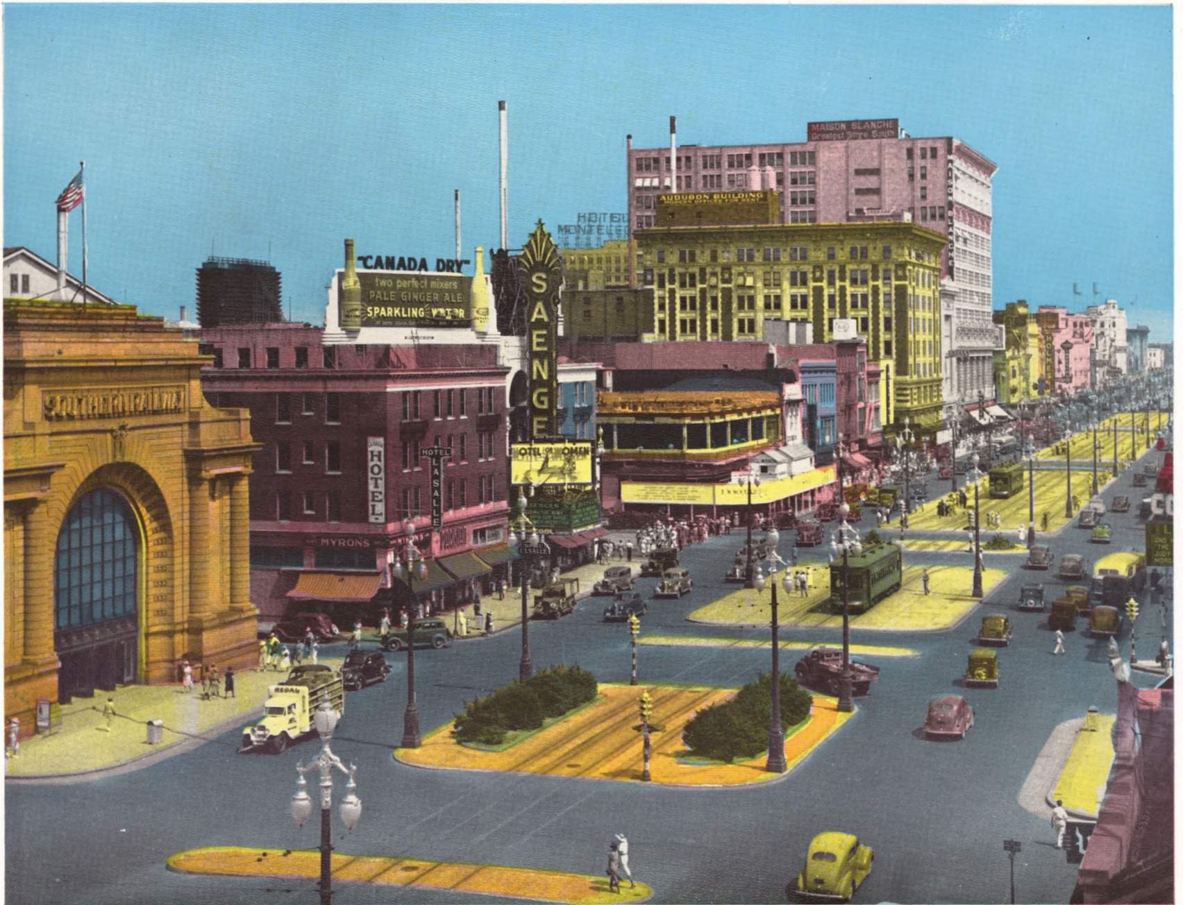
CANAL STREET, NEW ORLEANS, LA. AMERICA'S WIDEST BUSINESS STREET