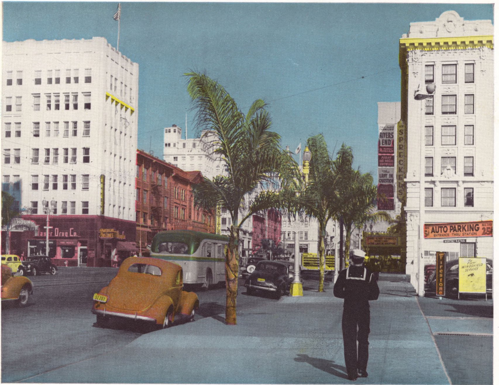
BROADWAY, SAN DIEGO, CALIFORNIA, IN THE DOWNTOWN SECTION