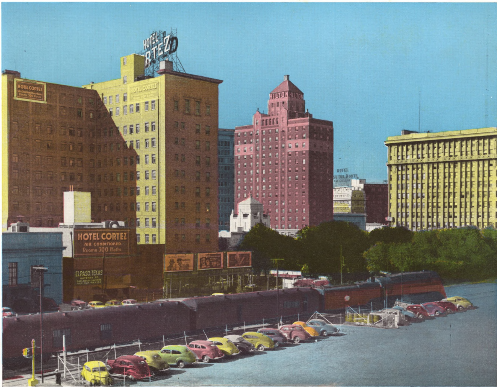
DOWNTOWN EL PASO, TEXAS. GATEWAY TO OLD MEXICO