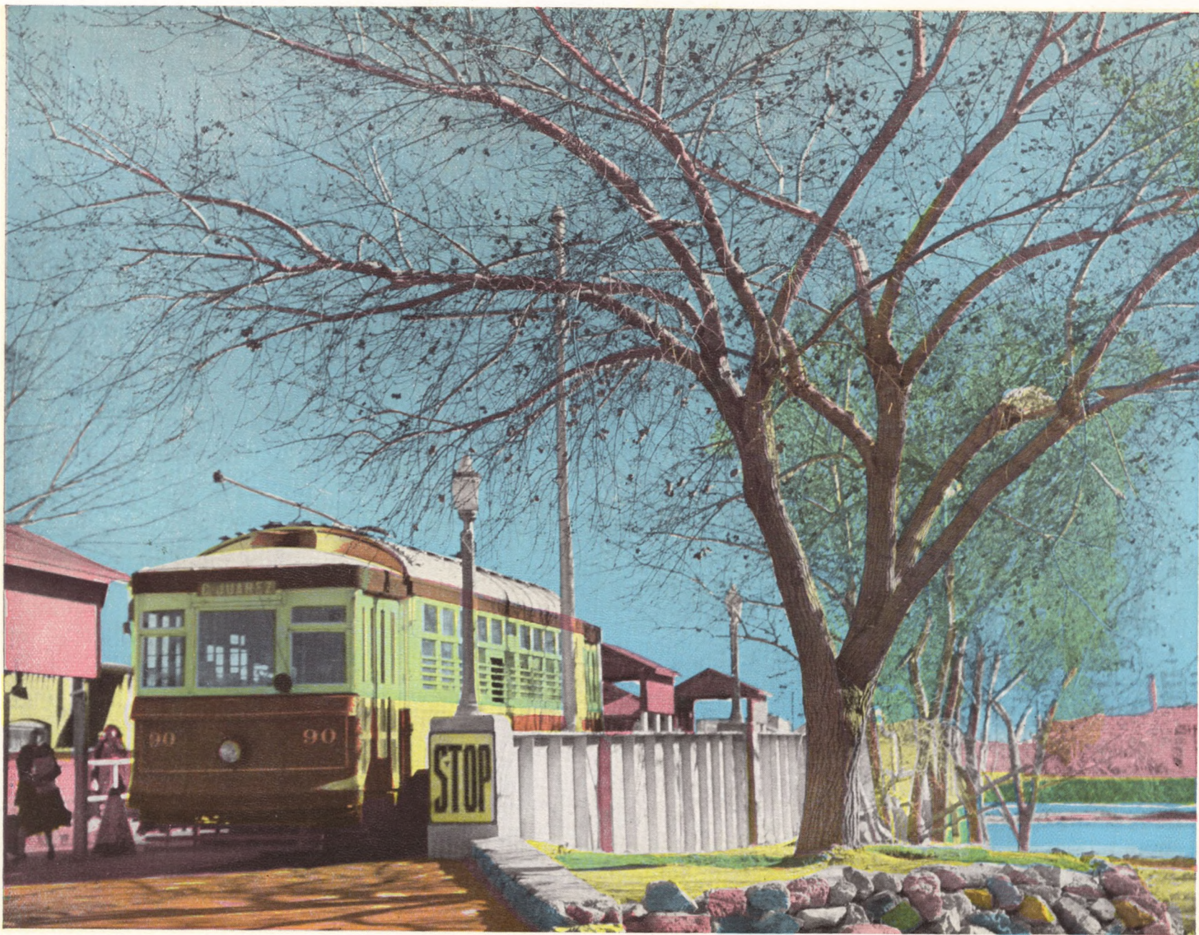
INTERNATIONAL BRIDGE OVER THE RIO GRANDE, CONNECTING EL PASO, TEXAS, AND JUAREZ, MEXICO