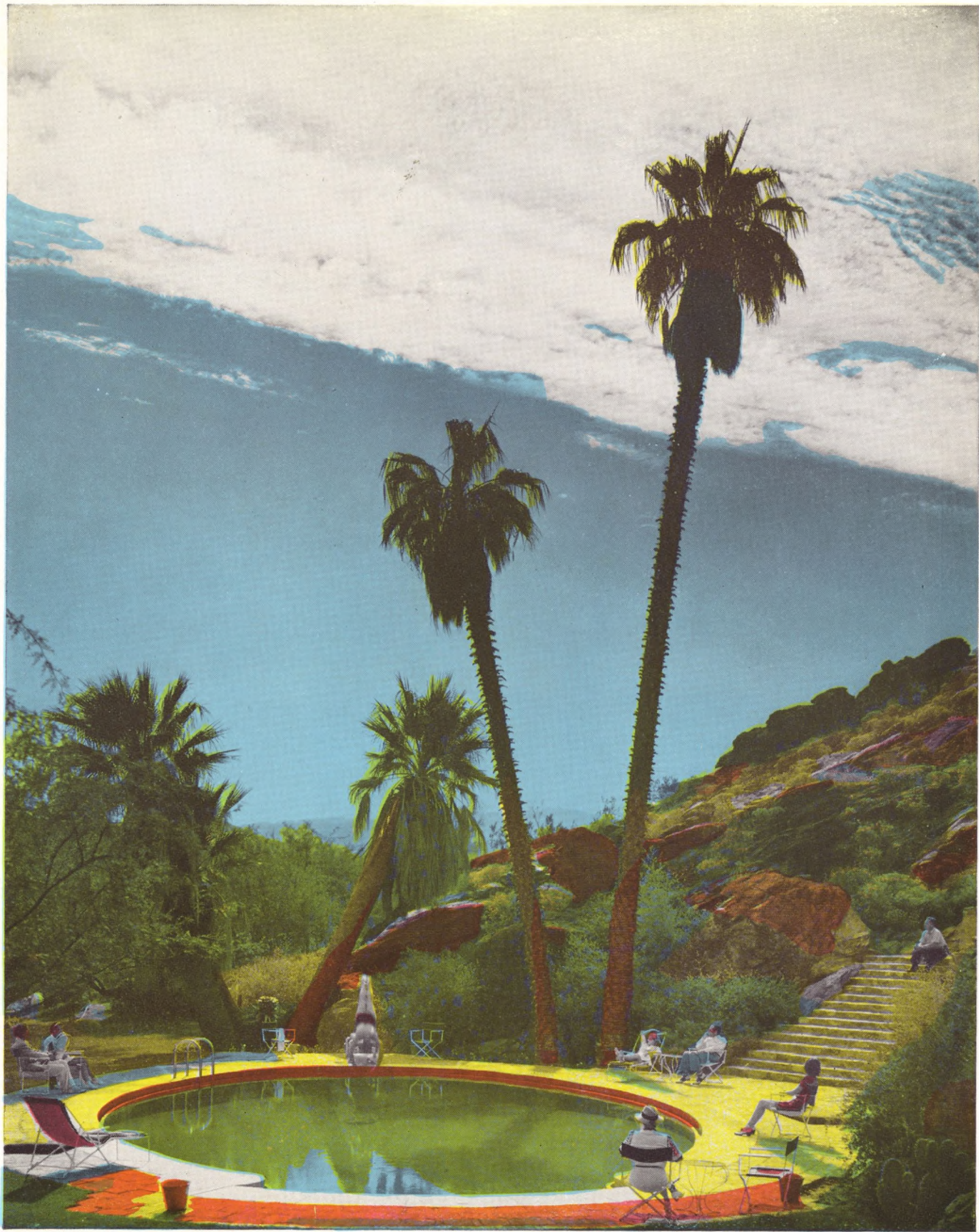
PALM SPRINGS, CALIFORNIA