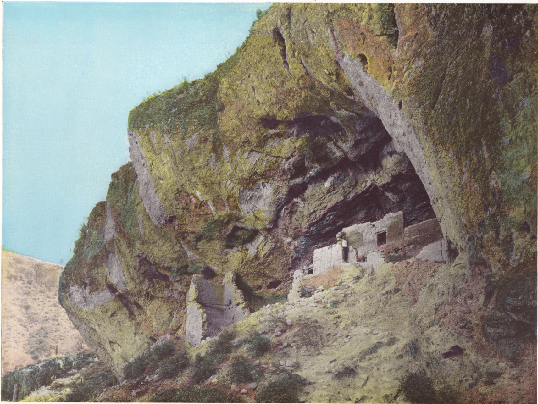
HOMES OF ANCIENT CLIFF DWELLERS, ARIZONA