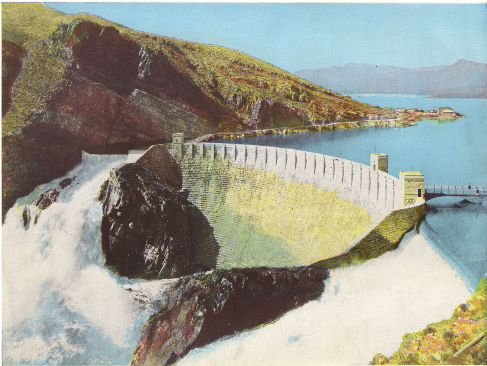
ROOSEVELT DAM, ARIZONA