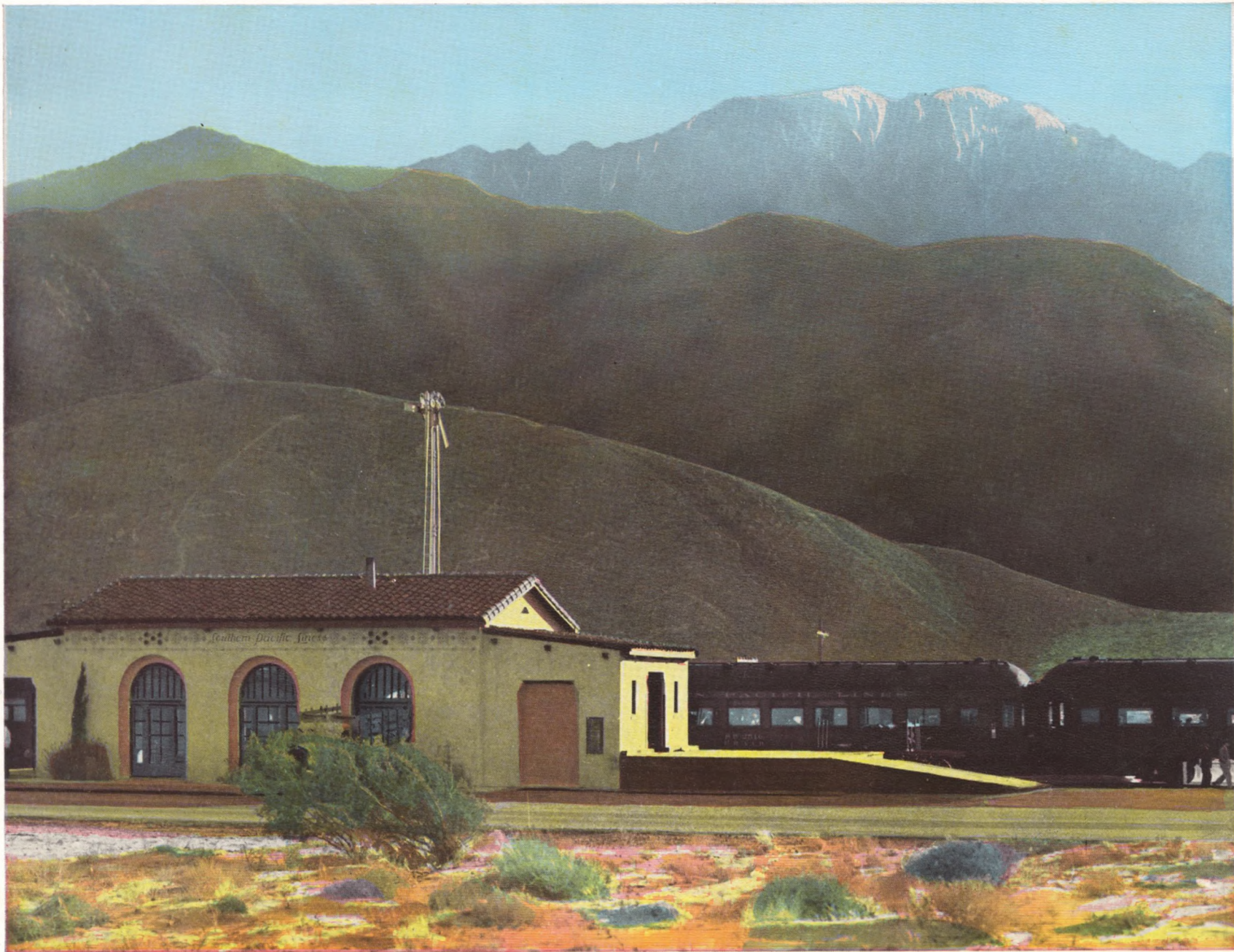
SAN JACINTO PEAK, RISING 10,300 FEET, PALM SPRINGS, CALIFORNIA