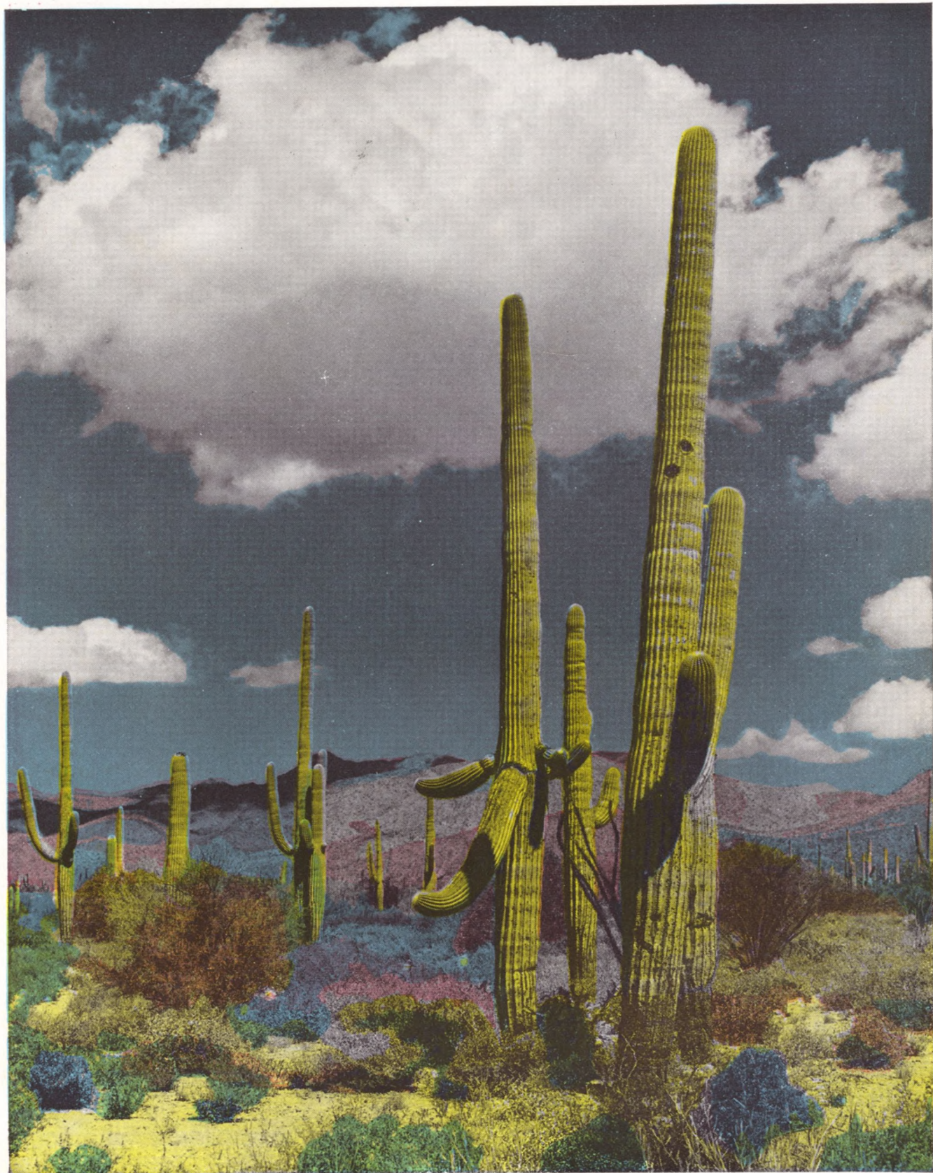
GIANT CACTUS, ARIZONA