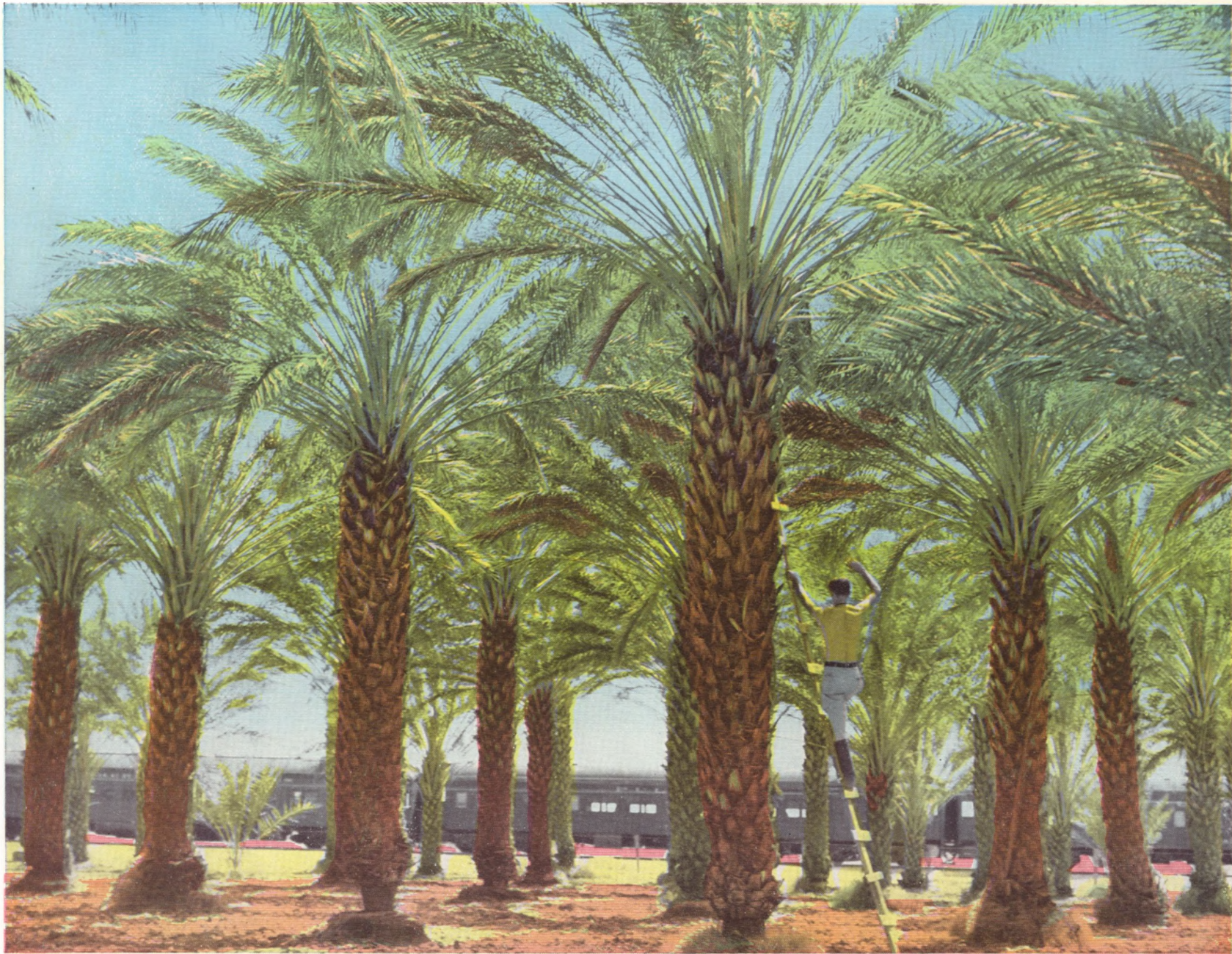
COMMERCIAL DATE ORCHARD AT INDIO, CALIFORNIA