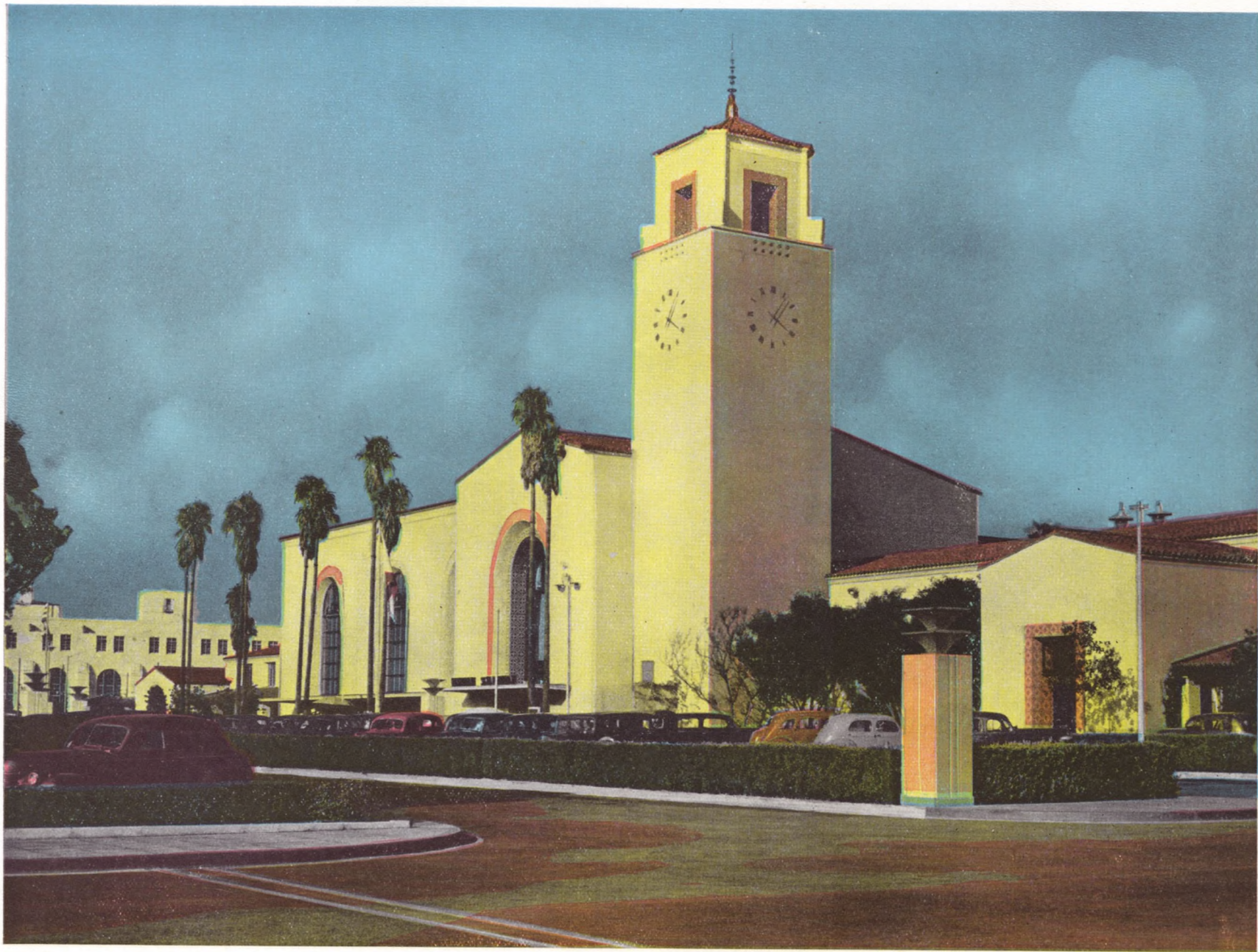
UNION STATION, LOS ANGELES