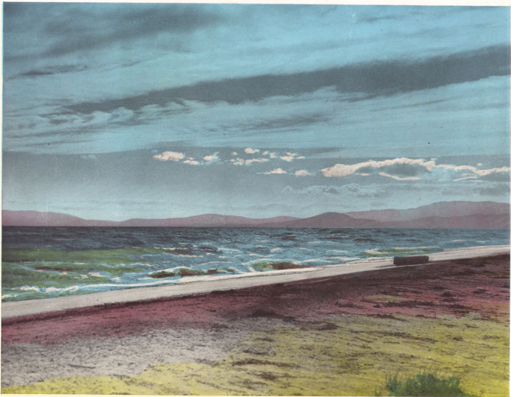
THE SALTON SEA, 248 FEET BELOW SEA LEVEL, SOUTHERN CALIFORNIA