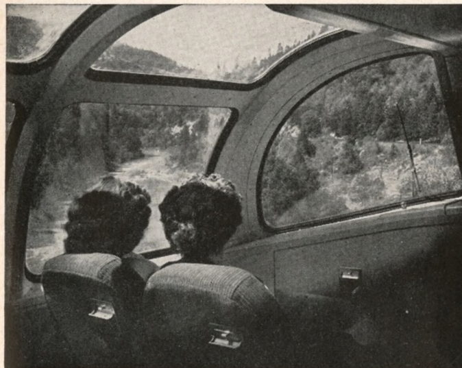
View of Beautiful Feather River Canyon from New Vista Dome Chair Car