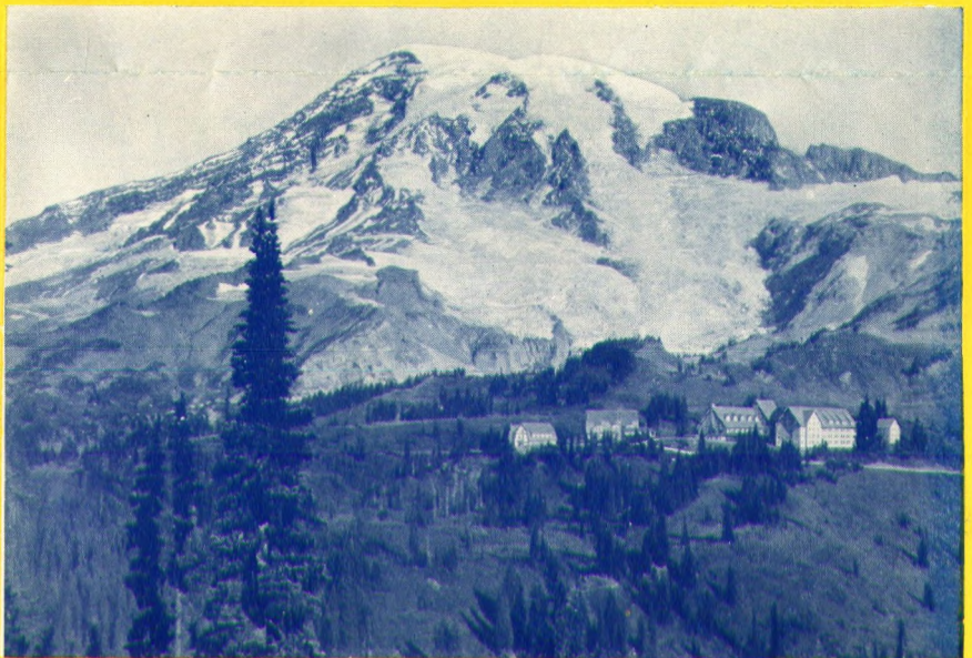
Mt. Rainier National Park