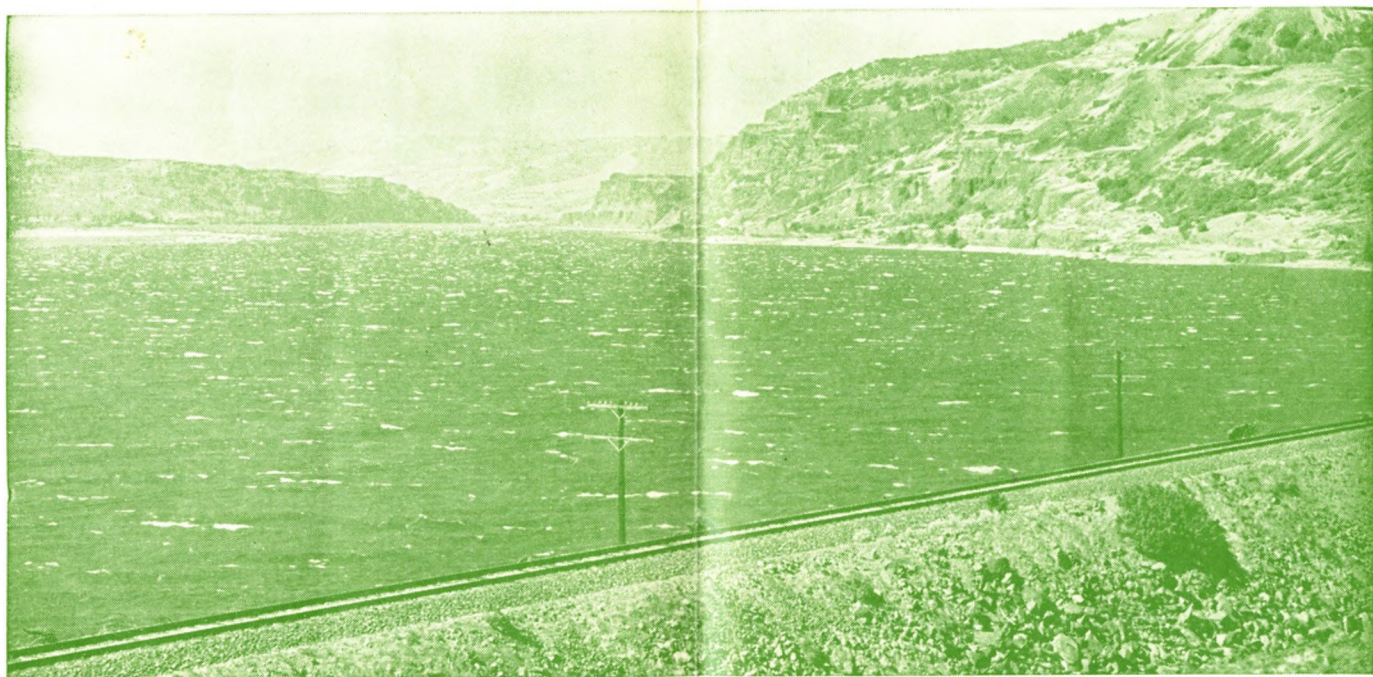
S. P. & S. Ry. Along The Columbia River Near Lyle, Washington