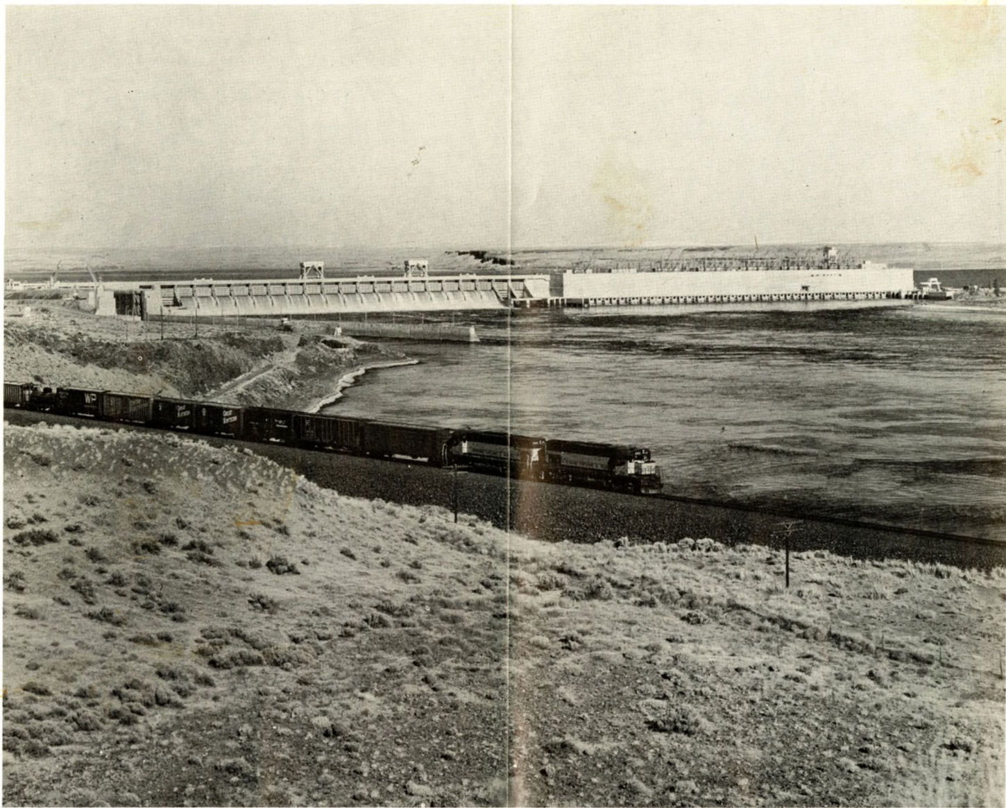
Spokane, Portland and Seattle Railway Passing McNary Dam on the Columbia River