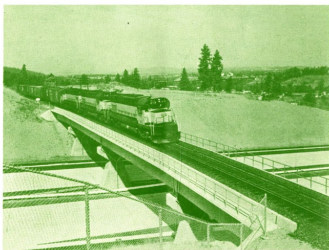
Spokane, Portland and Seattle Railway with Spokane, Washington in the background

Your Choice of ... Two Daily Trains Between PORTLAND and SPOKANE