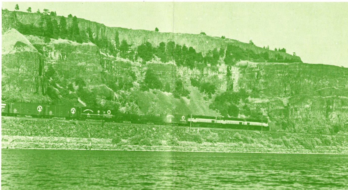
Spokane, Portland and Seattle Railway near Lyle, Washington