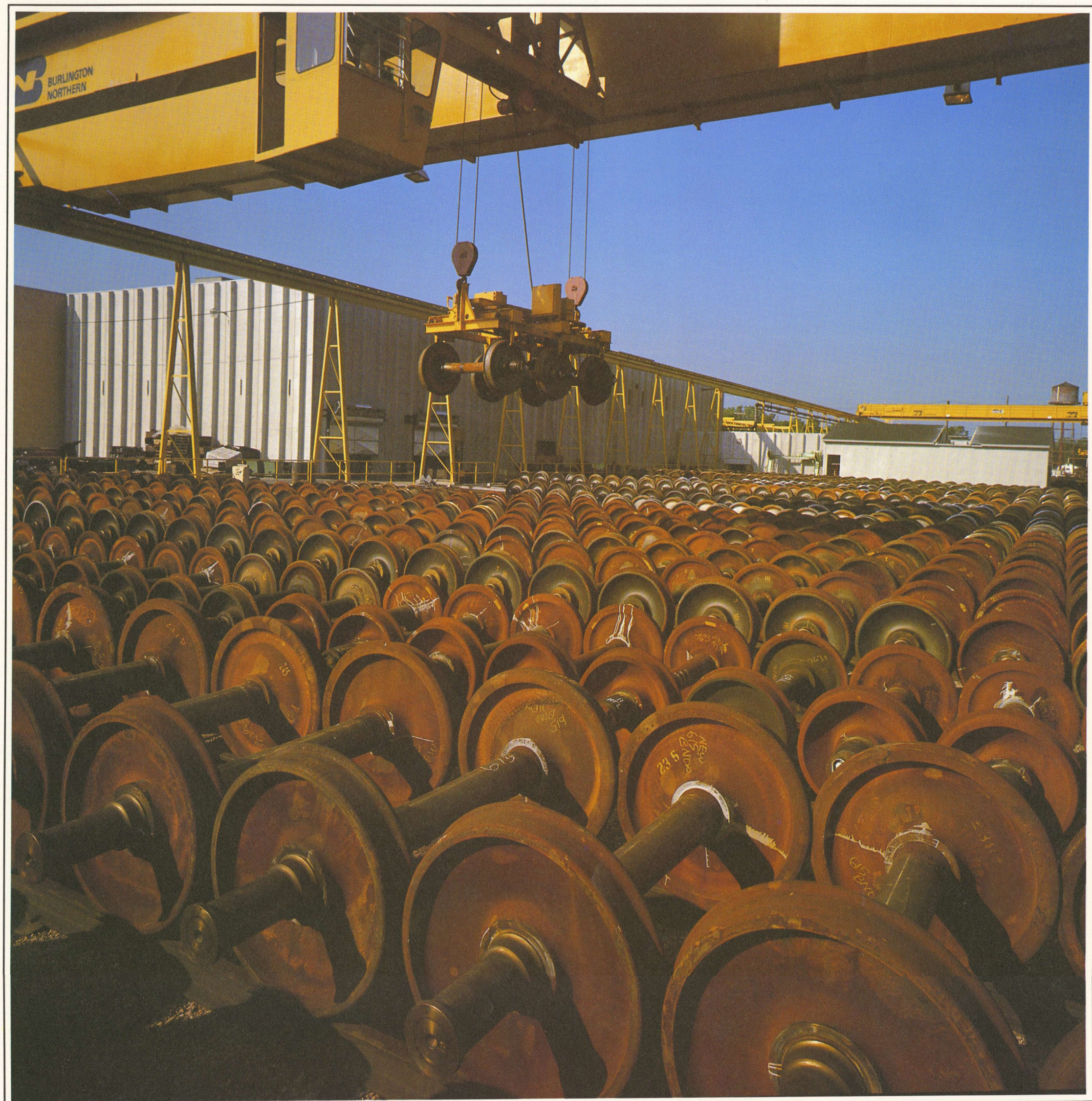
Burlington Northern's new Havelock wheel shop at Lincoln, Nebraska, featuring automated and computerized handling systems, will recondition nearly 100,000 sets of freight car wheels annually.