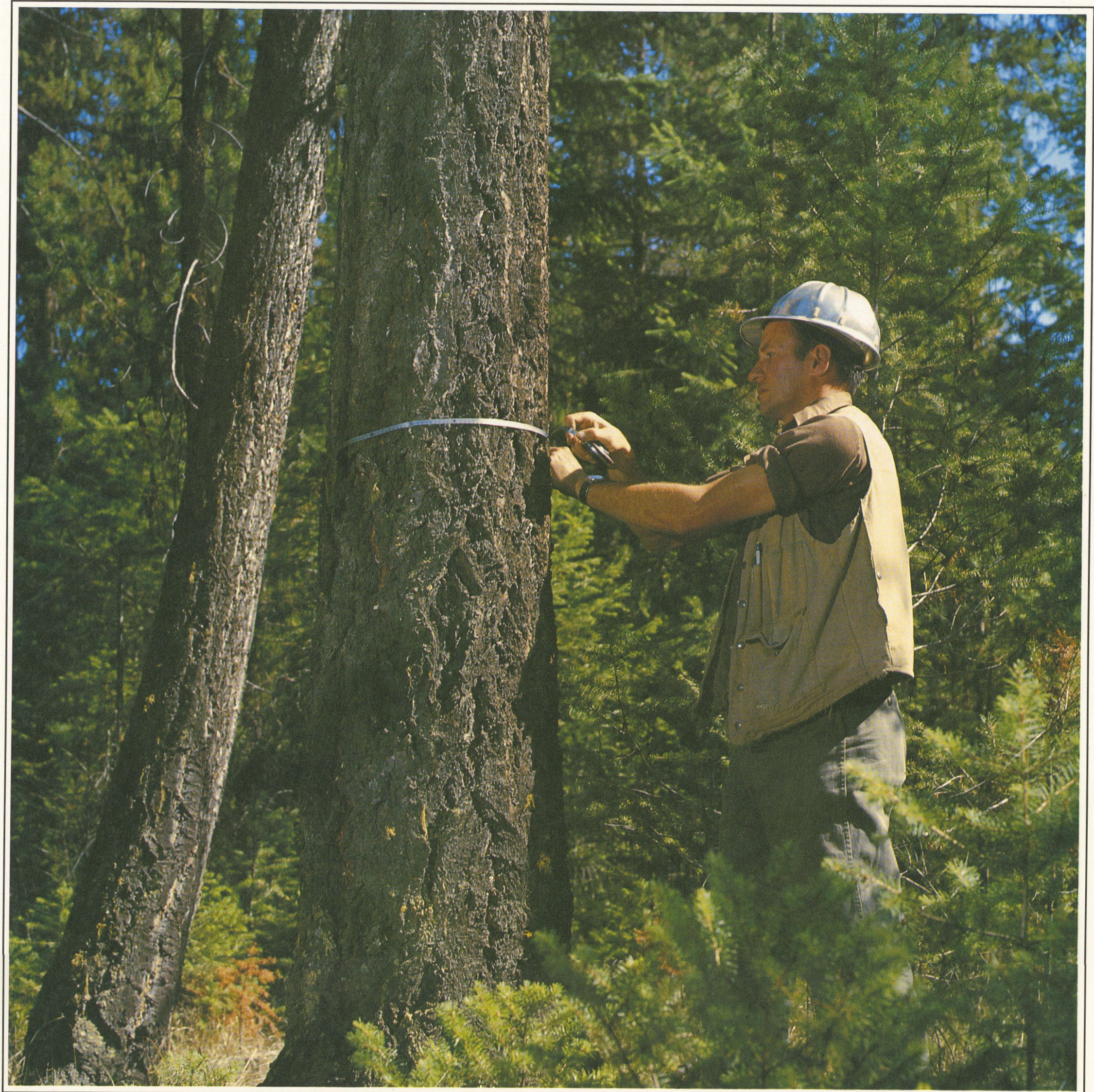
A Burlington Northern forester in Montana measures a tree to determine the amount of lumber it will yield.