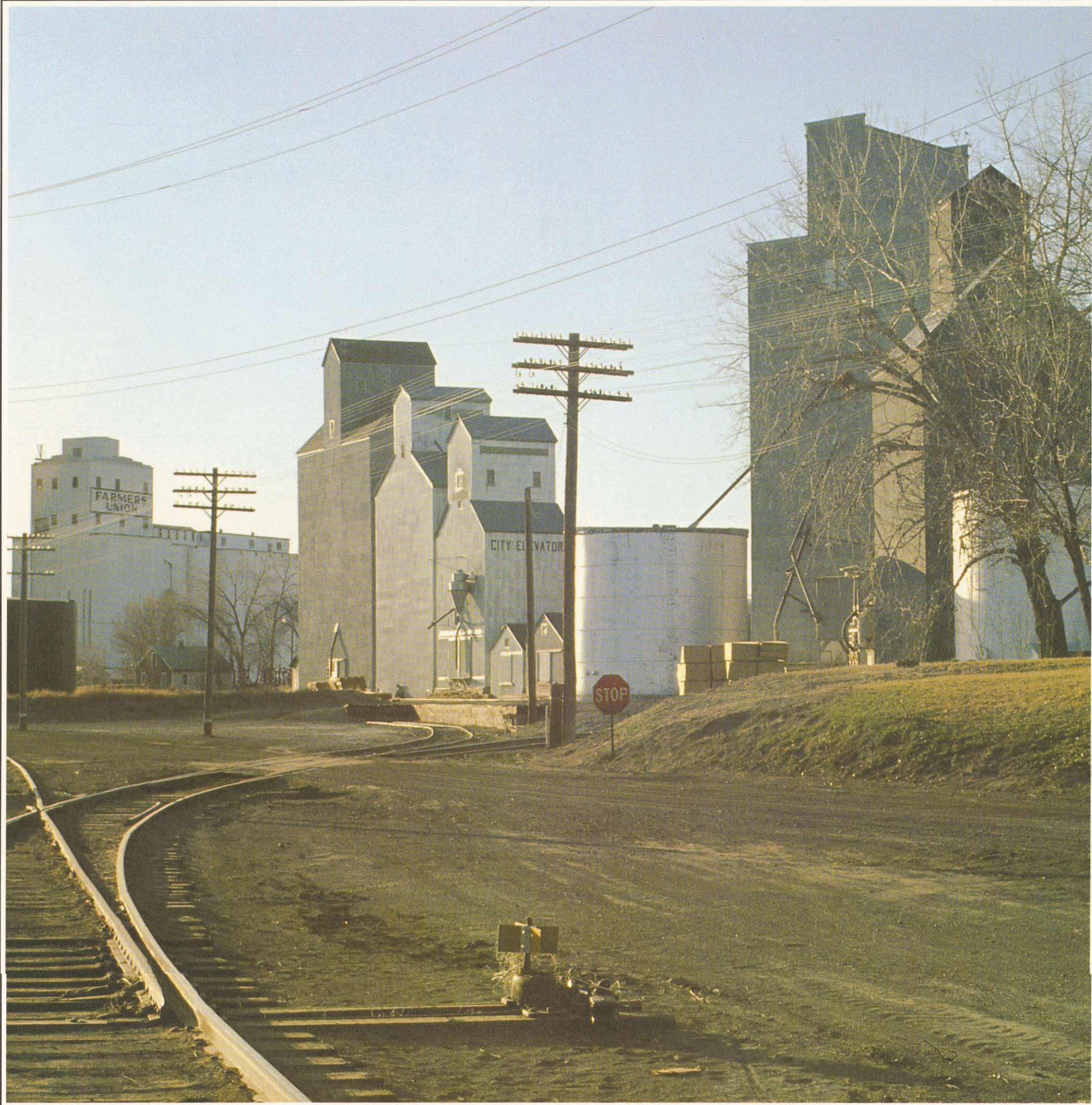
Twilight settles on the grain elevators in a typical western city in the grain-producing regions served by Burlington Northern.