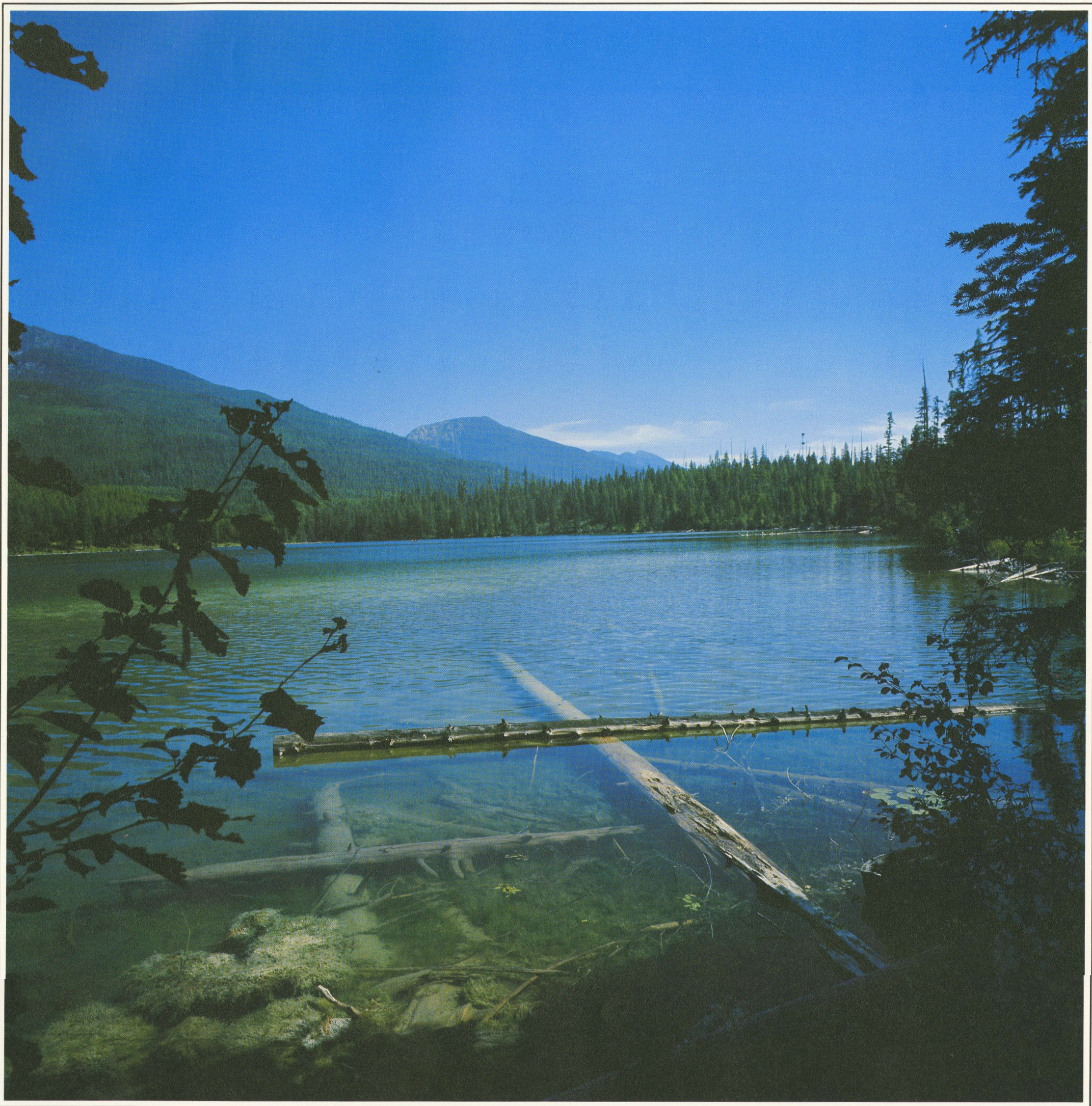
The crystal-clear waters of Van Lake in the Montana Rockies lie within 1½ million acres of western timberland owned by Burlington Northern.