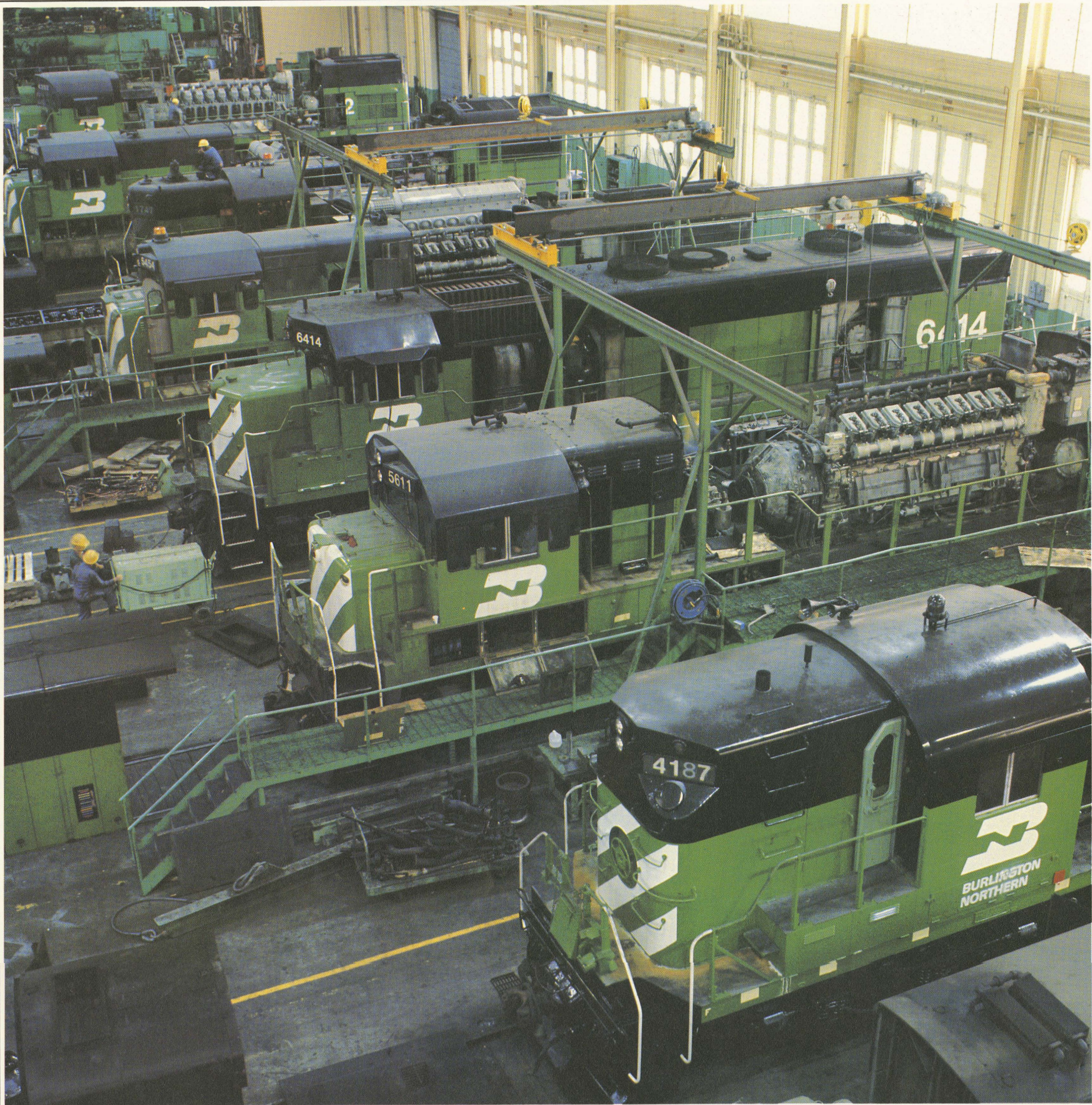
Livingston, Montana is the site of one of Burlington Northern's two major diesel repair shops where BN locomotives undergo complete overhauling.