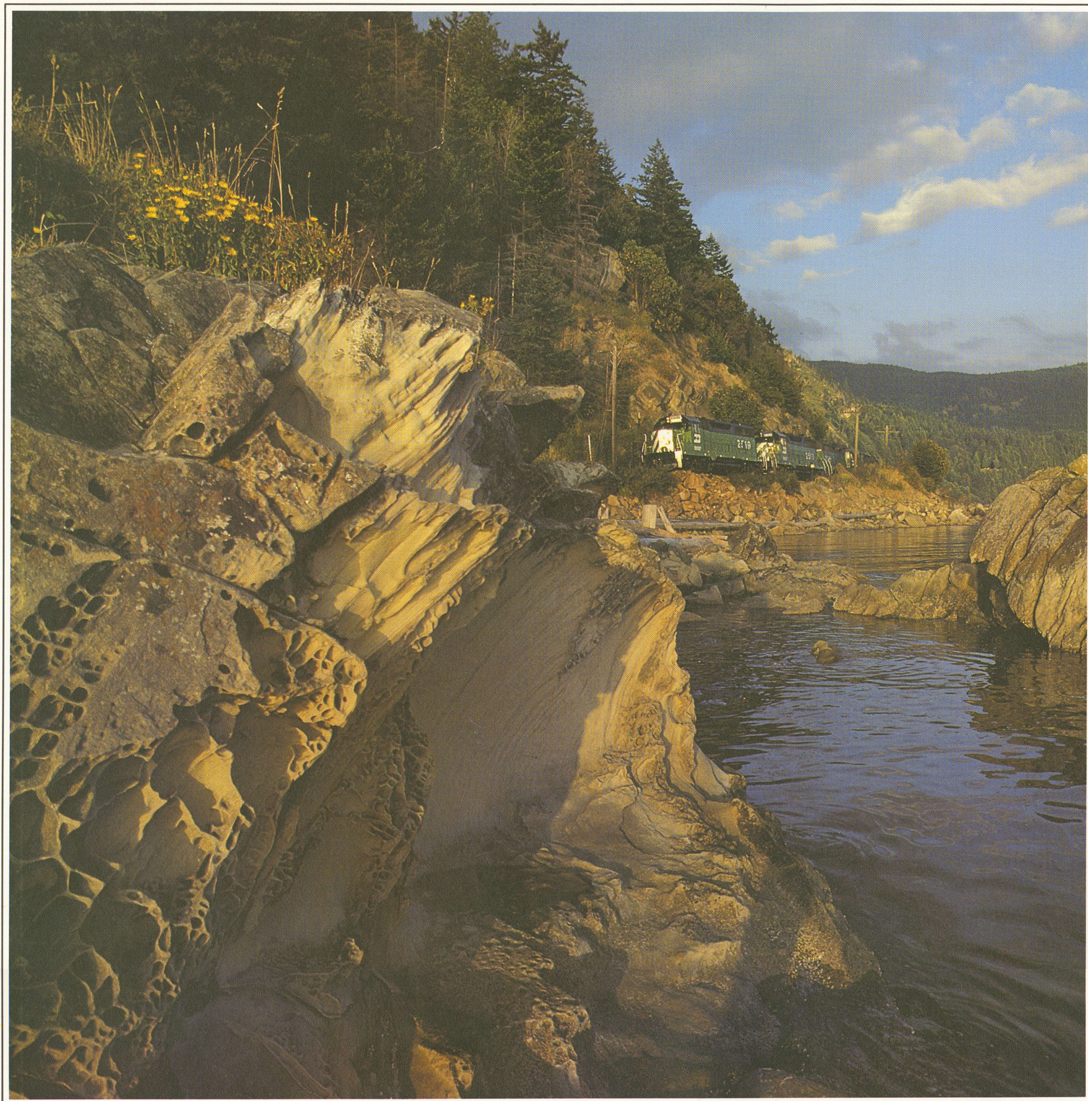
A Burlington Northern freight train moves east along the Oregon side of the scenic and vital Columbia River.