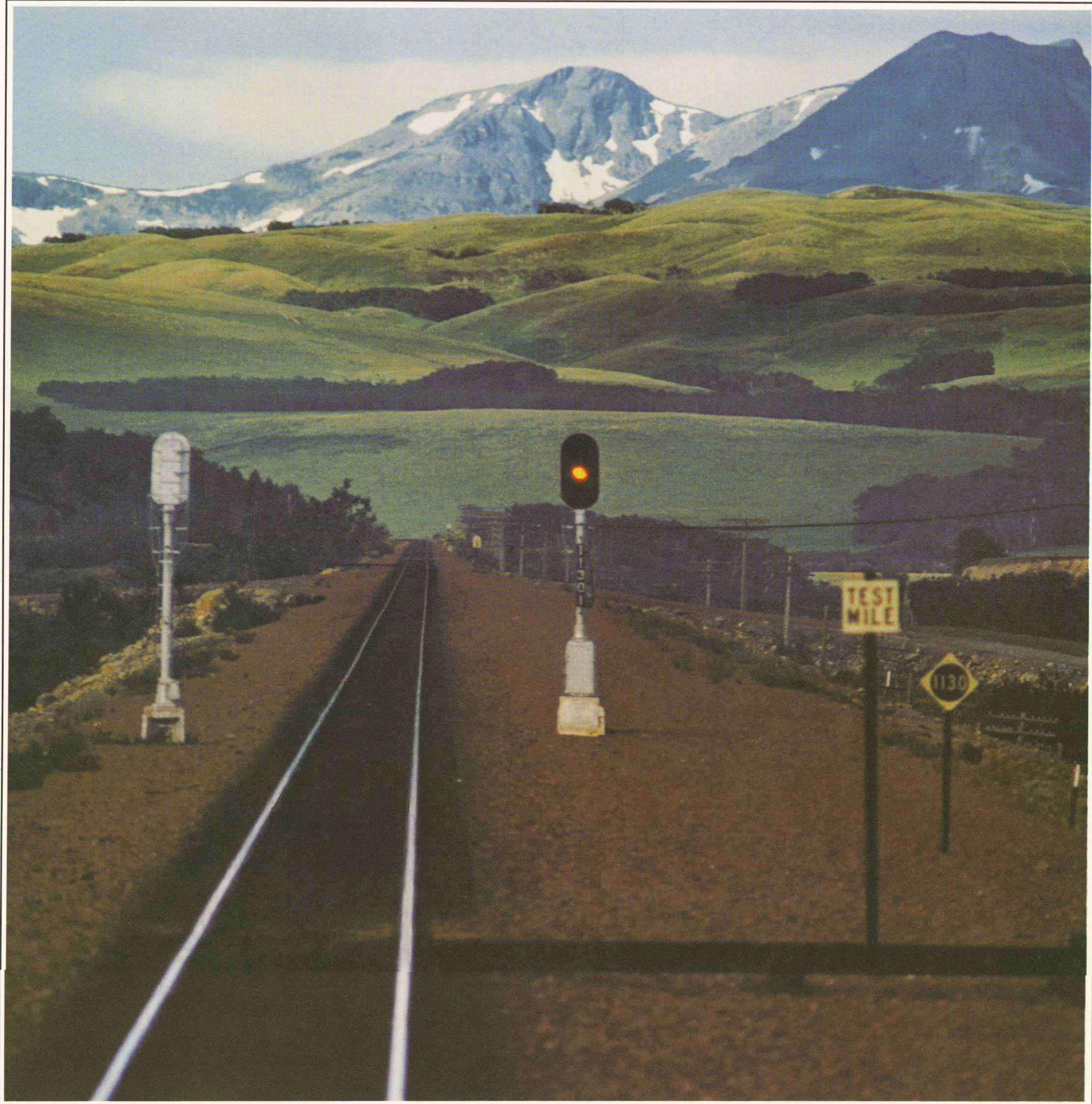
Soft morning light spills over the Montana Rockies along the Burlington Northern right of way to announce the start of another day.