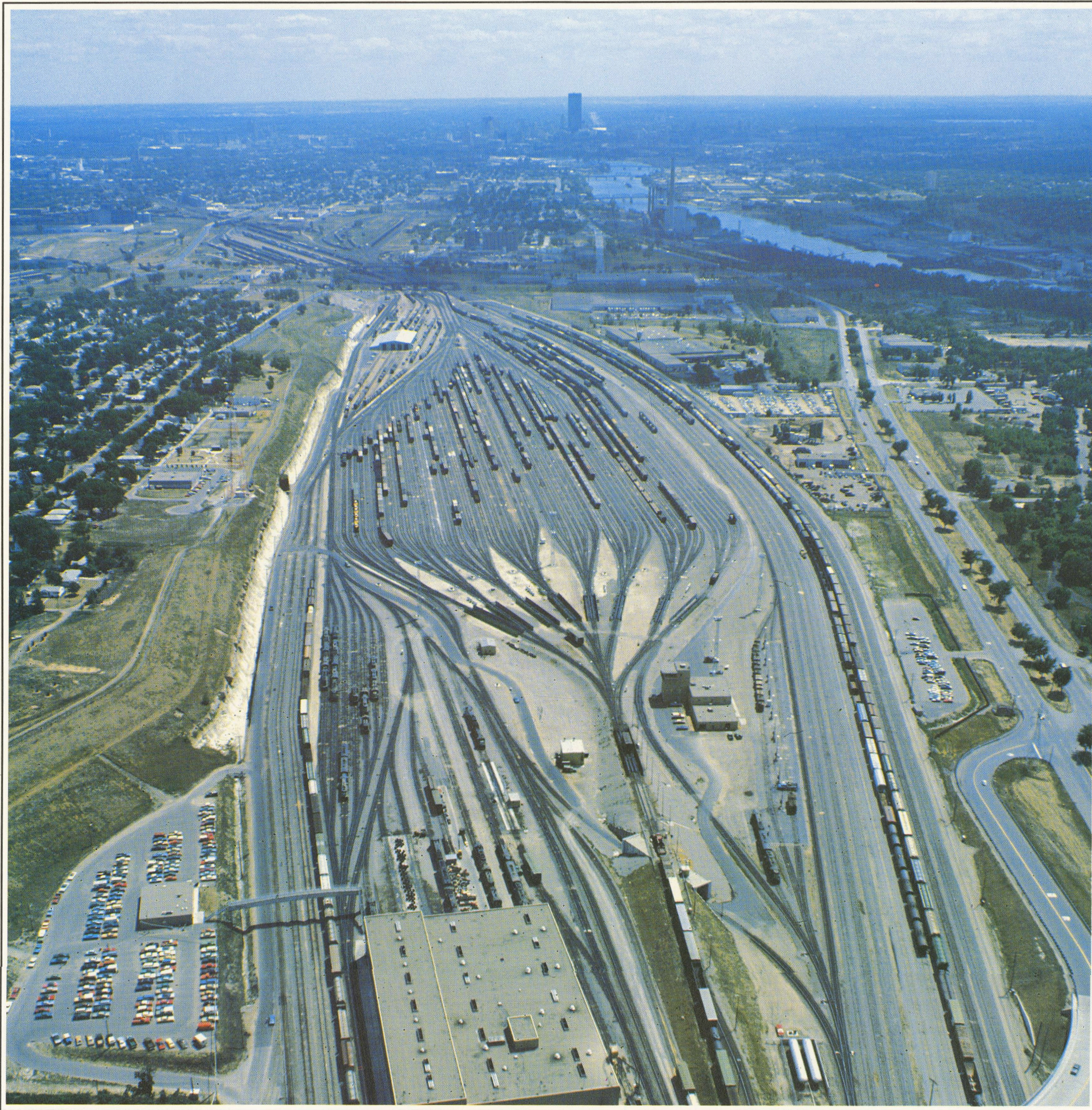
Burlington Northern's flagship electronic classification yard at Northtown in Minneapolis consolidates virtually all the work of 11 other yards in the Twin Cities.