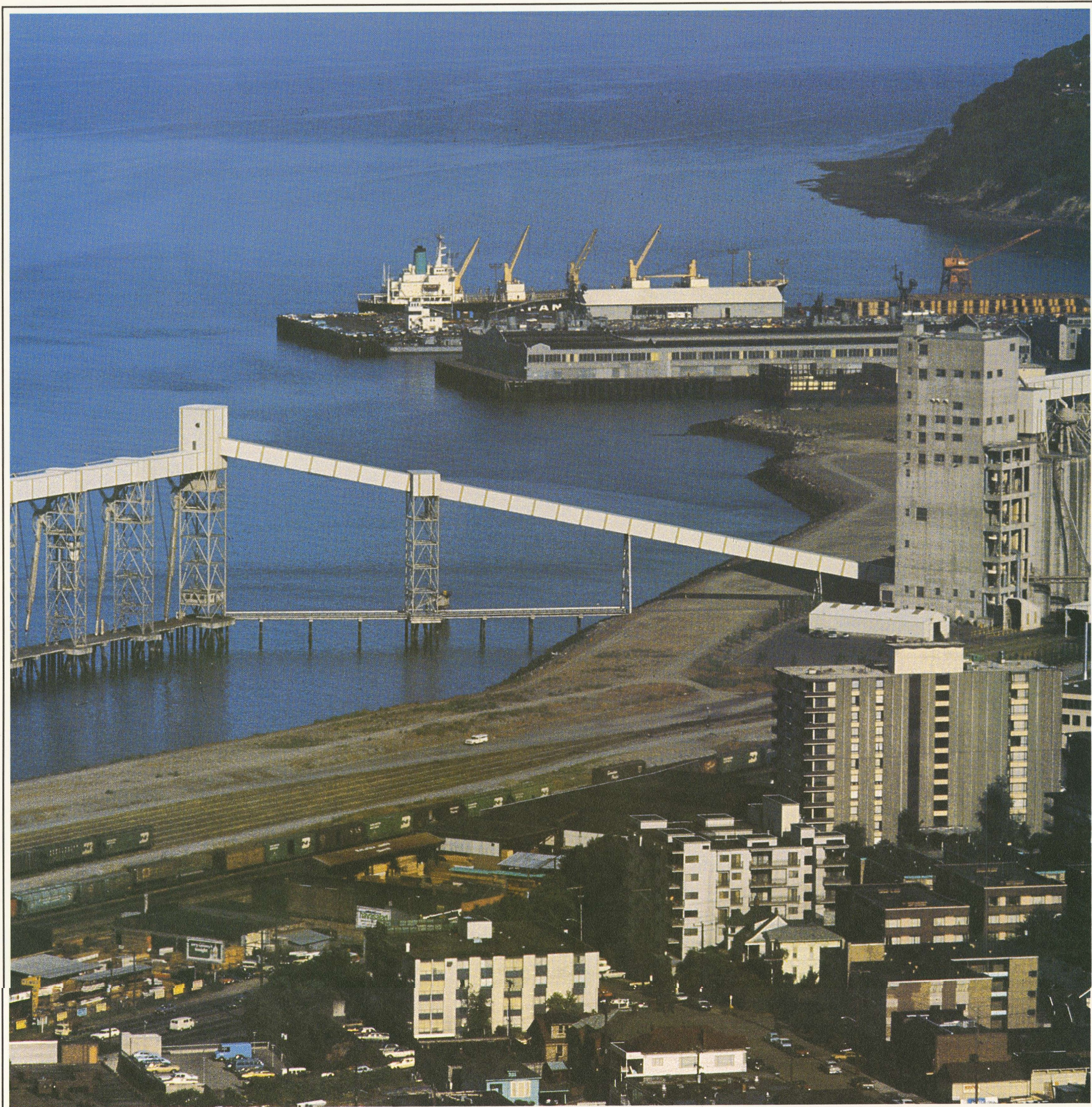
Port of Seattle's grain terminal, operated by Cargill Incorporated and served by Burlington Northern, can accommodate the world's largest grain-hauling ships.