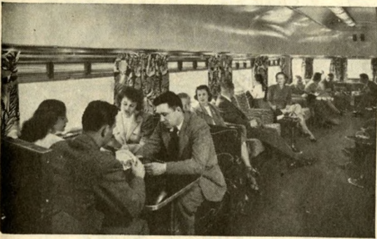
Parlor-lounge—a congenial place for relaxation of sleeping-car passengers. Refreshment service.