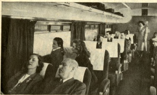
Thrifty de luxe chair coaches (above) provide deep-cushioned reclining seats which invite relaxation.