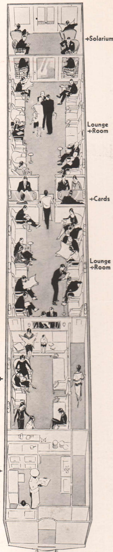
THE LOUNGE CAR