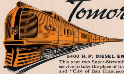
5400 H. P. DIESEL ENGINE, 17-CAR UNIT

This year two Super-Streamliners of this type will be in service to take the place of today's "City of Los Angeles" and "City of San Francisco" and meet the increased public demand. And then—Union Pacific will still be planning and designing—not only for the immediate tomorrow but also for the distant future! A research staff of engineers, chemists and metallurgists is constantly at work. Tomorrow's service must meet Tomorrow's demands. Union Pacific always pioneers!