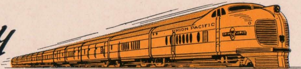
2400 H. P. DIESEL ENGINE, 12-CAR UNIT

Following our program of development the newest Union Pacific streamliners are four times as powerful as the first, with sensational improvements in comfort and interior design.