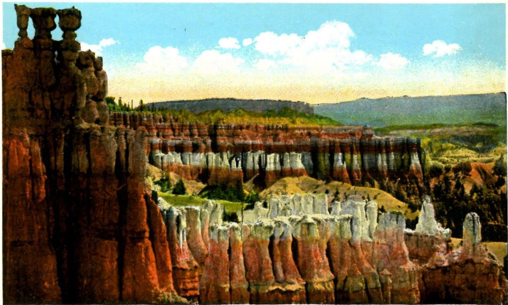
TEMPLE OF OSIRIS, BRYCE CANYON, SOUTHERN UTAH REACHED FROM CEDAR CITY, UTAH, ON THE UNION PACIFIC SYSTEM