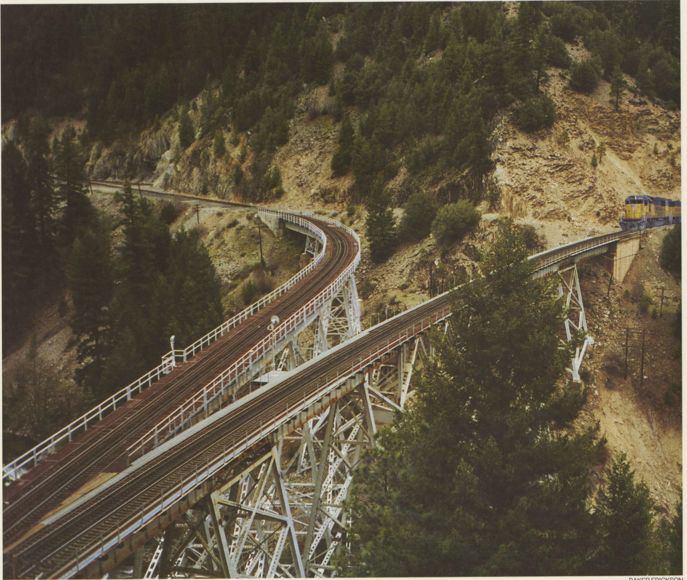
FEATHER RIVER CANYON, CALIFORNIA