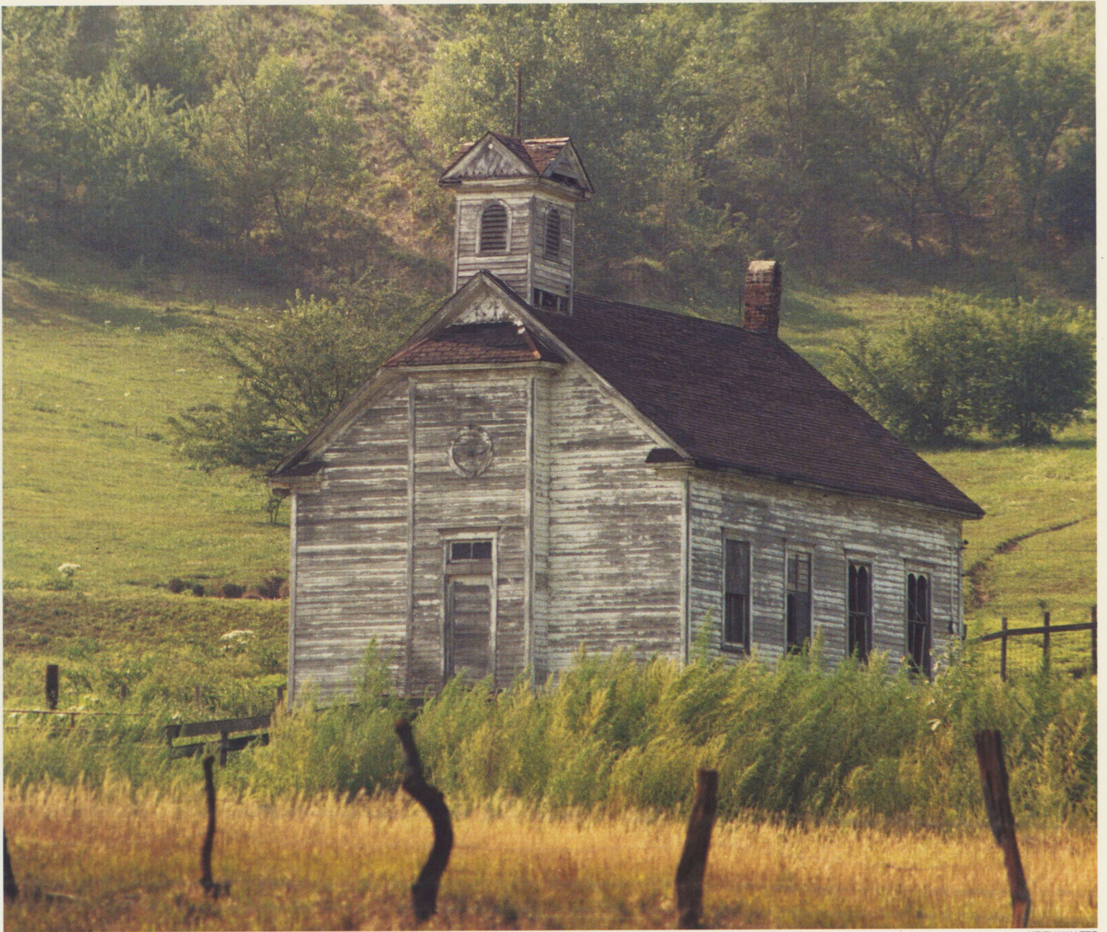
NEAR JULIAN, NEBRASKA