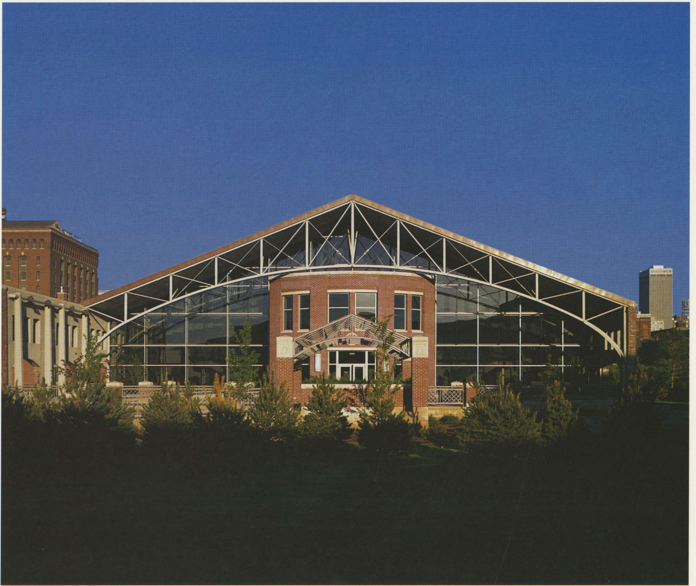
HARRIMAN DISPATCHING CENTER, OMAHA