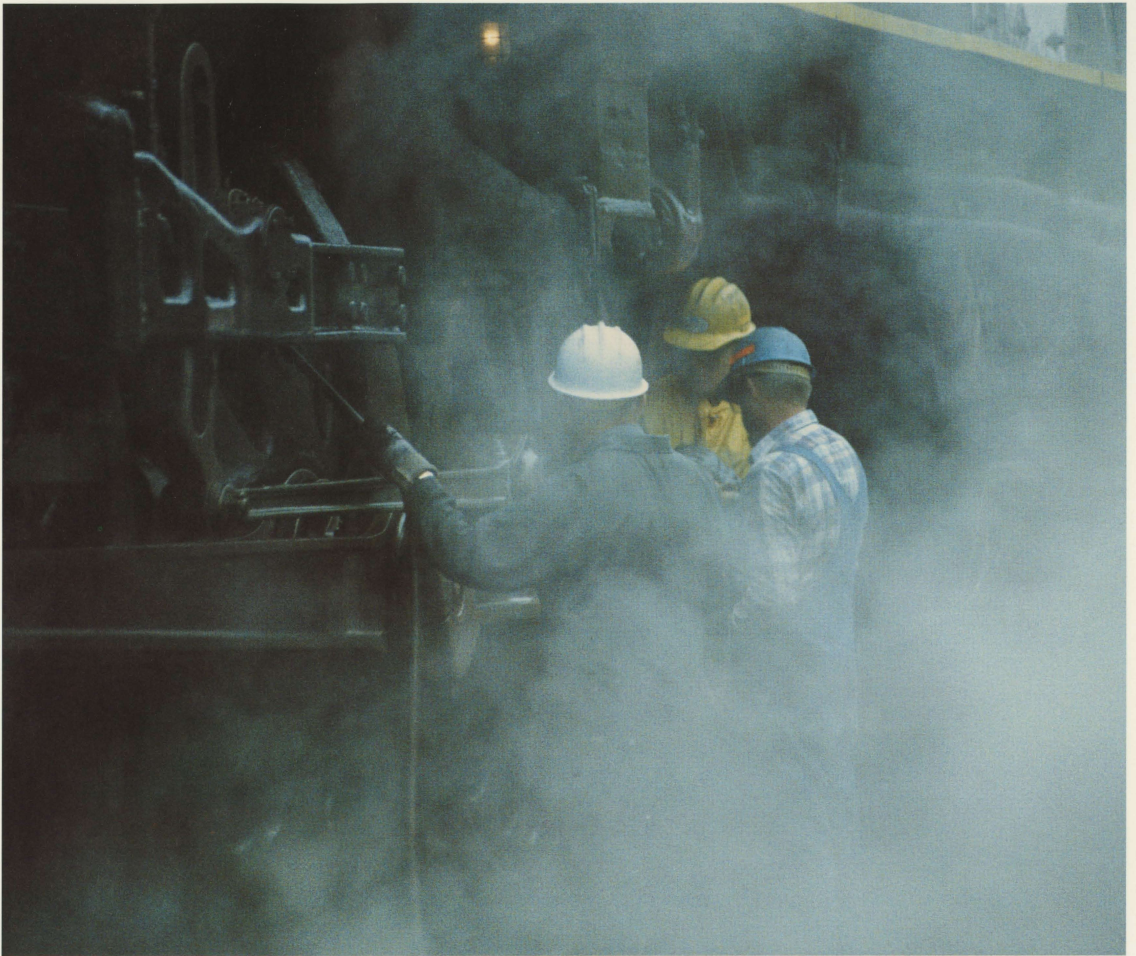
RAILROAD HERITAGE-844 MARYSVILLE, KANSAS