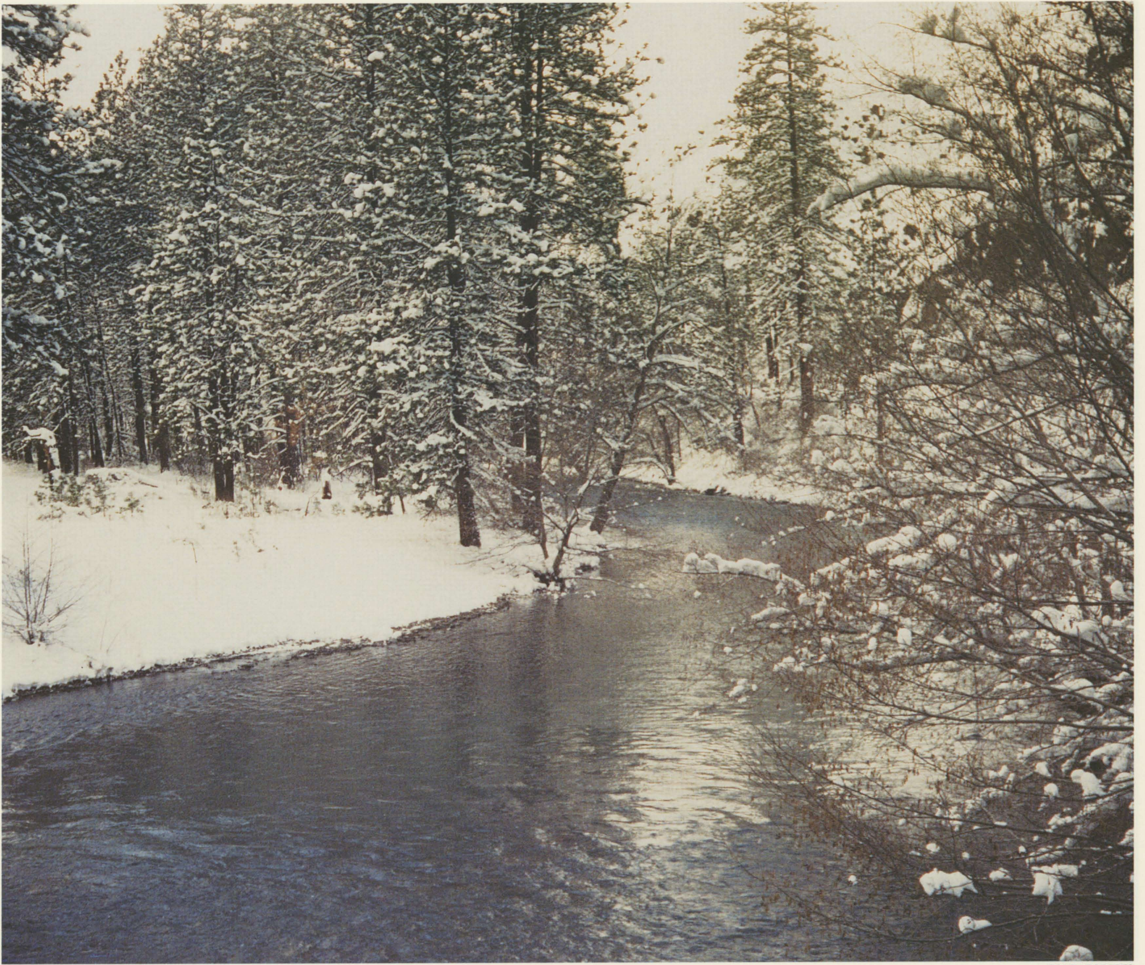
NEAR BONIFER, OREGON