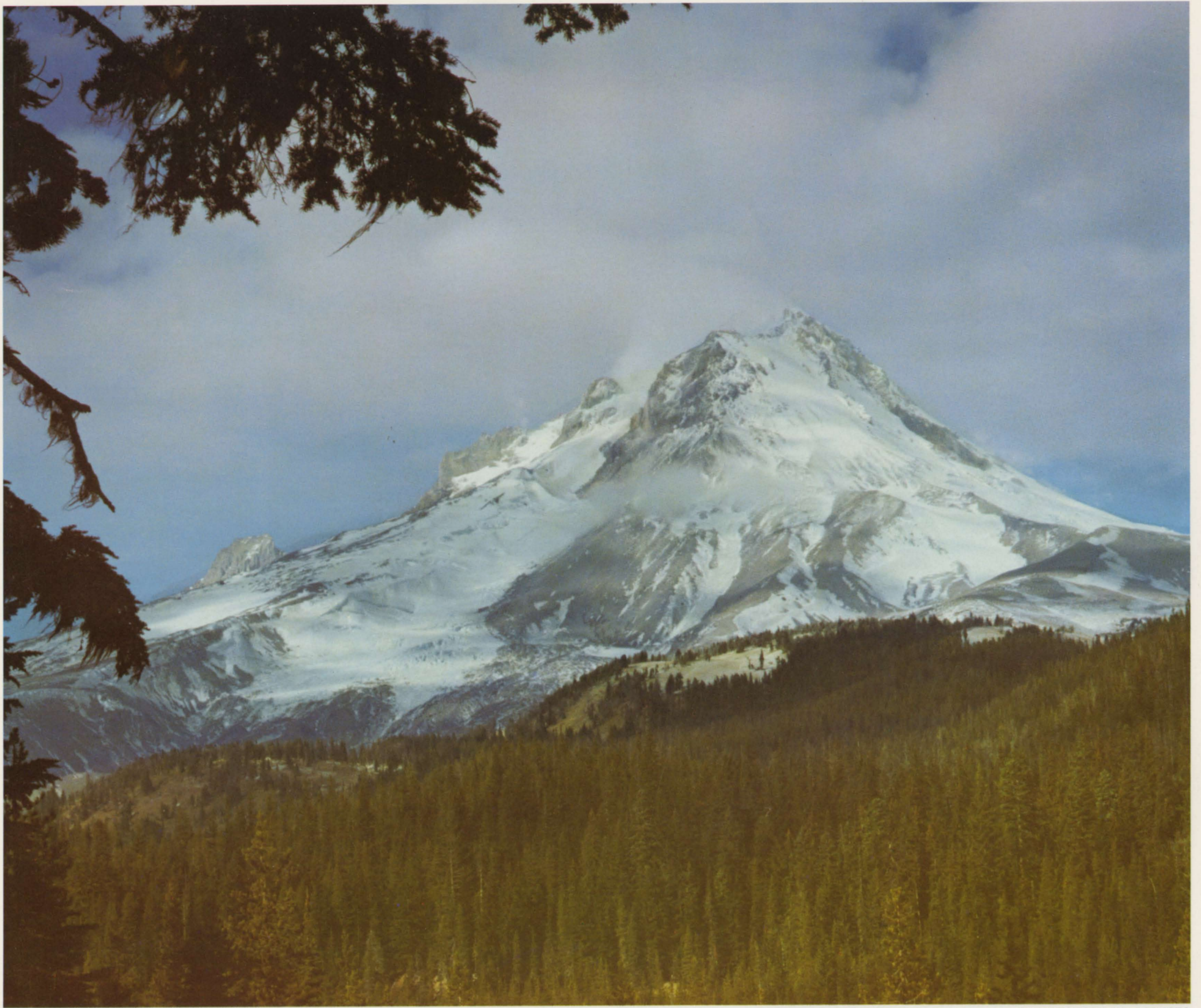
MT. HOOD, OREGON