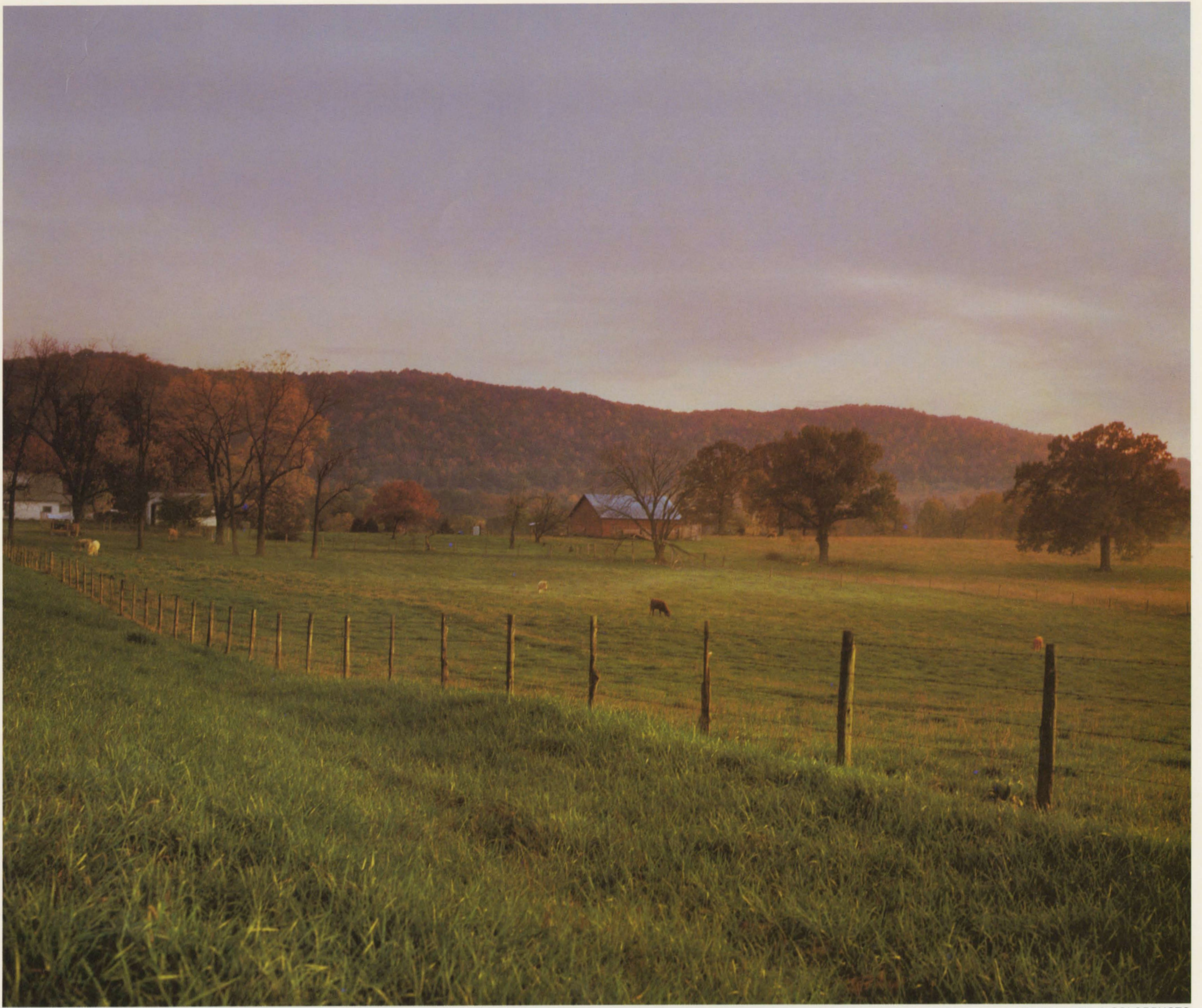
NEAR CARTHAGE, MISSOURI