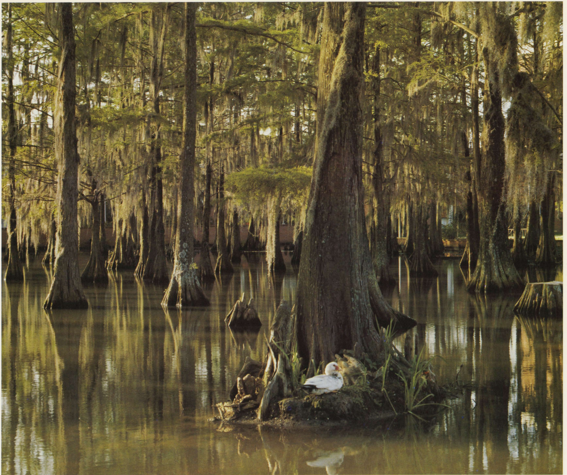
CYPRESS LAKE AT LAFAYETTE, LOUISIANA