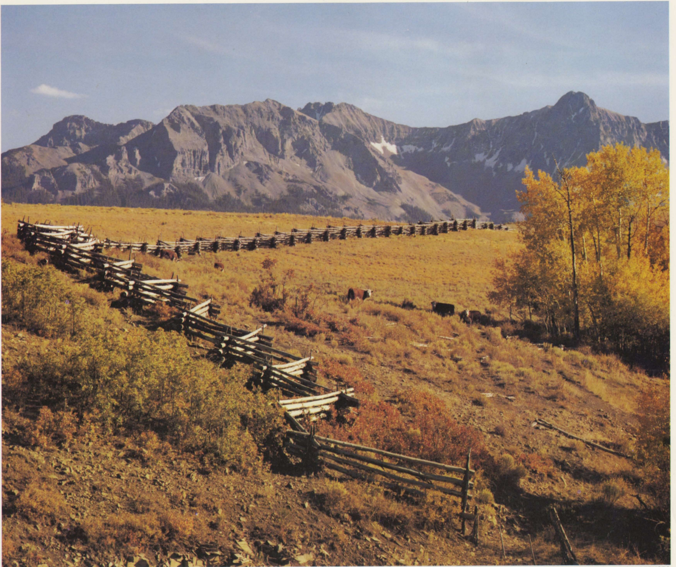
HIGH CATTLE COUNTRY, COLORADO