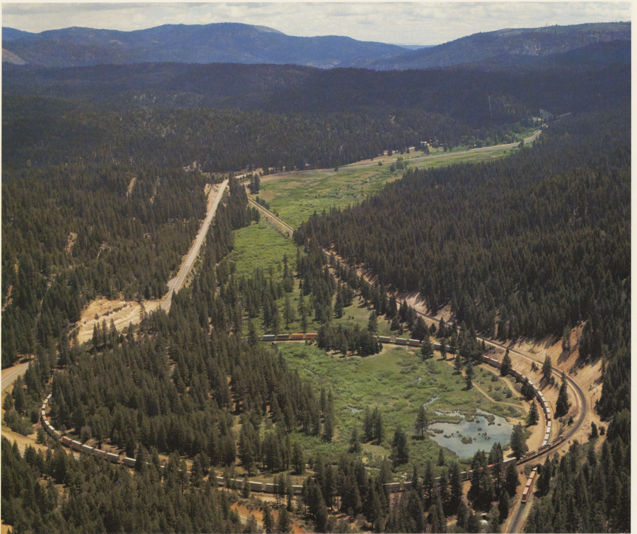
WILLIAMS LOOP IN FEATHER RIVER CANYON, CALIFORNIA