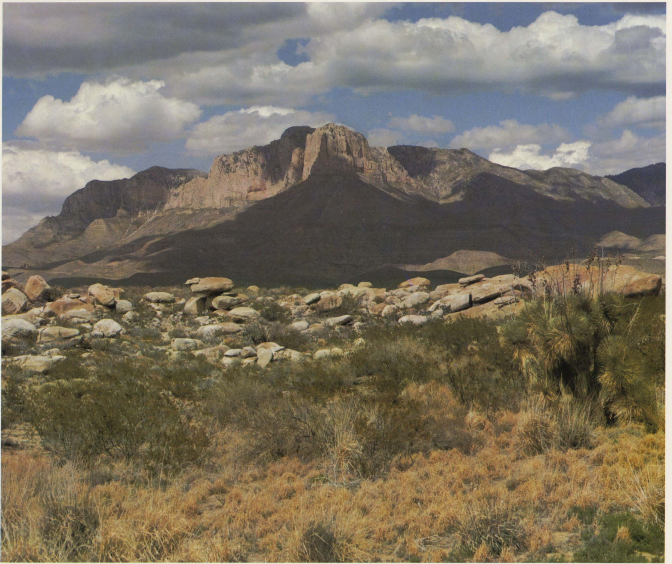
GUADALUPE MOUNTAINS NATIONAL PARK, TEXAS