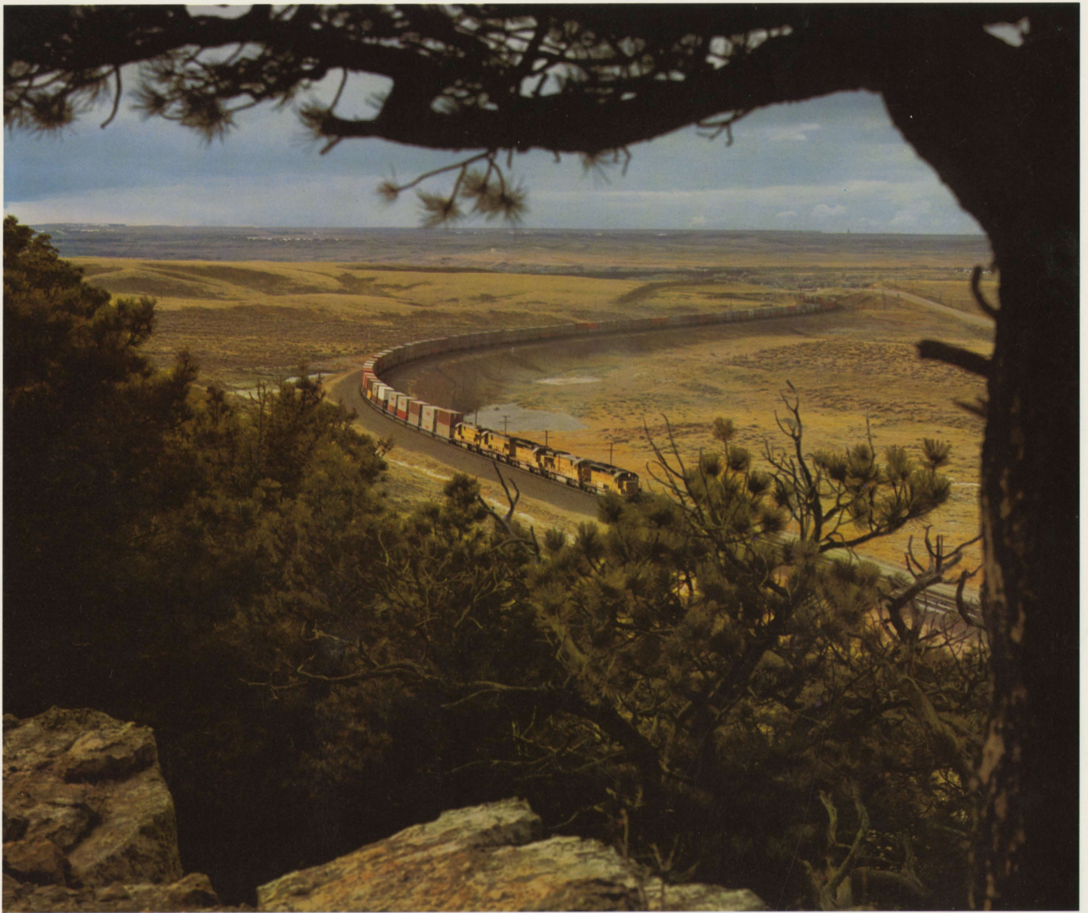
NEAR LOOKOUT, WYOMING