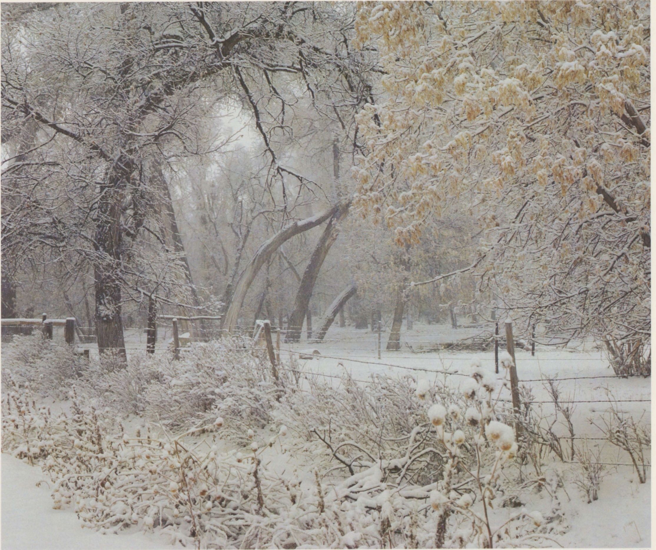
WINTER IN NEBRASKA