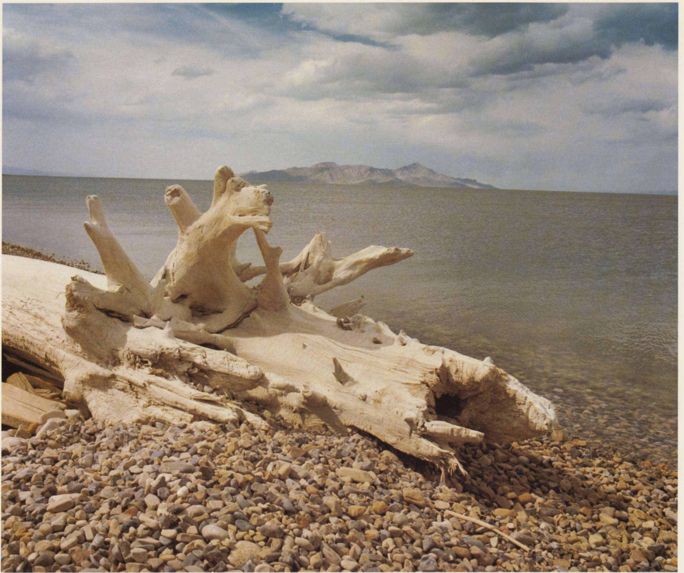
GREAT SALT LAKE, UTAH