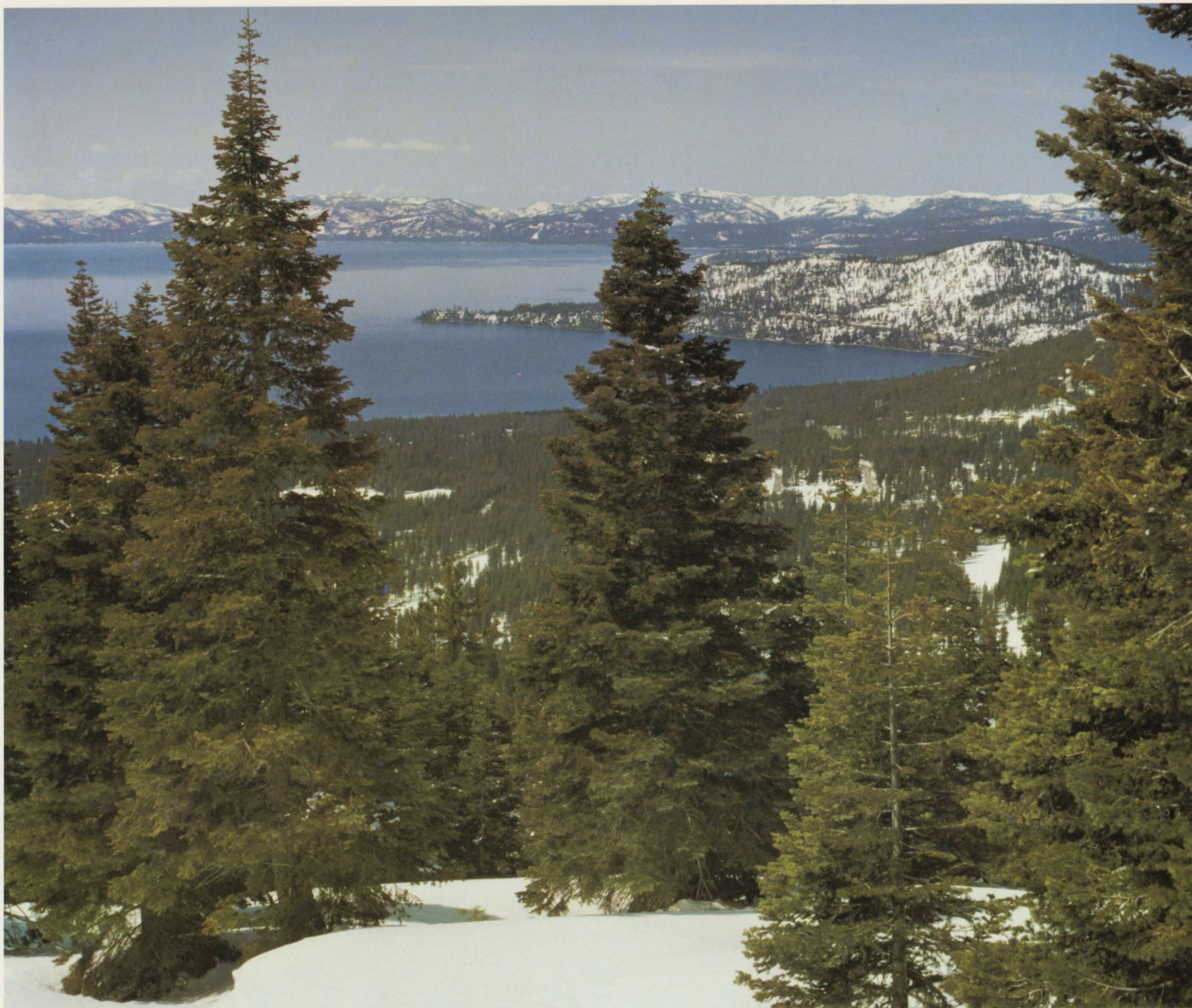
LAKE TAHOE, NEVADA