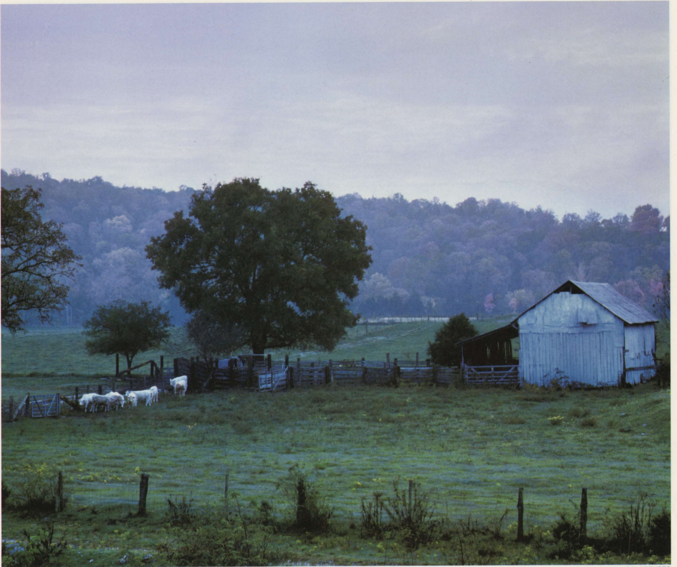
NEAR COTTER, ARKANSAS