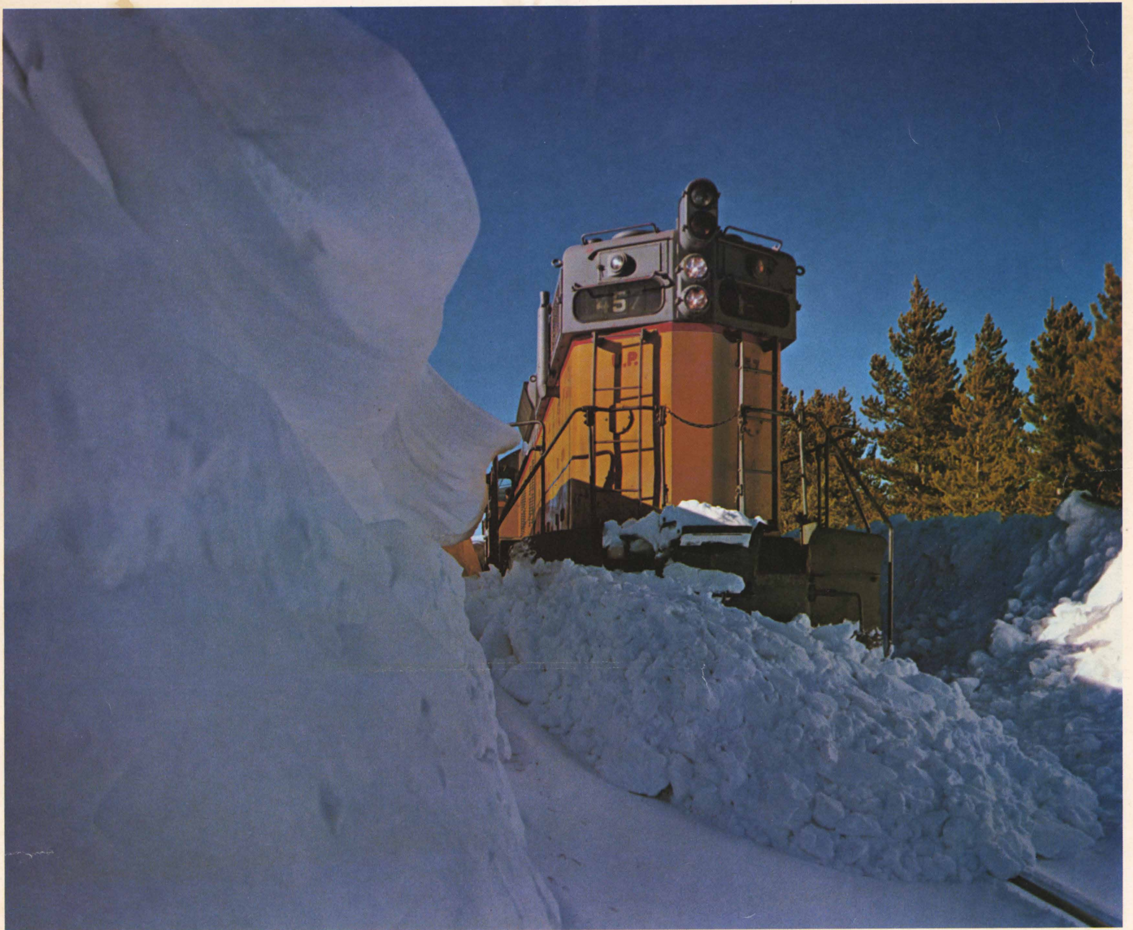
NEAR FOX PARK, WYOMING