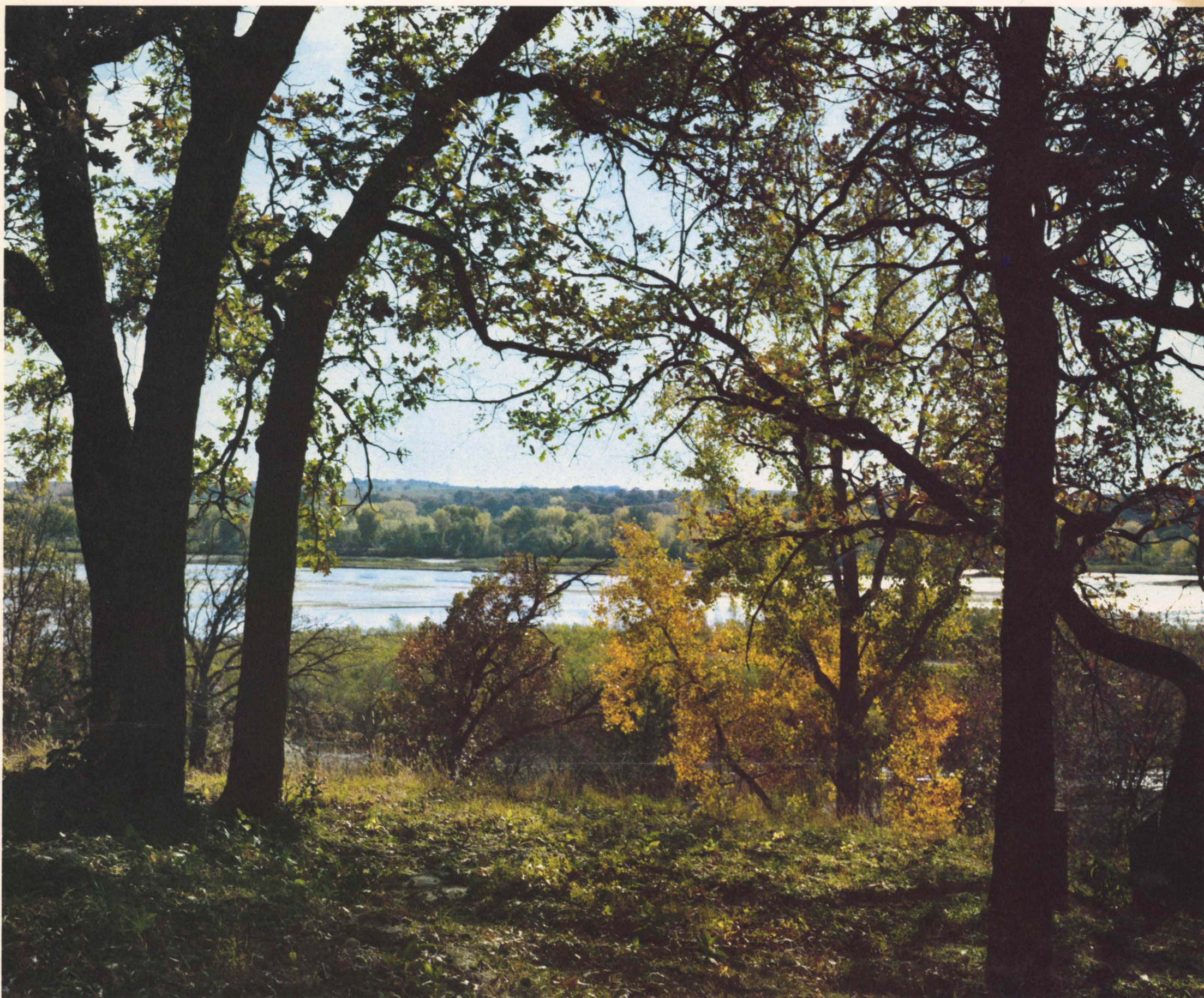
PLATTE RIVER, SOUTHWEST OF OMAHA, NEBRASKA