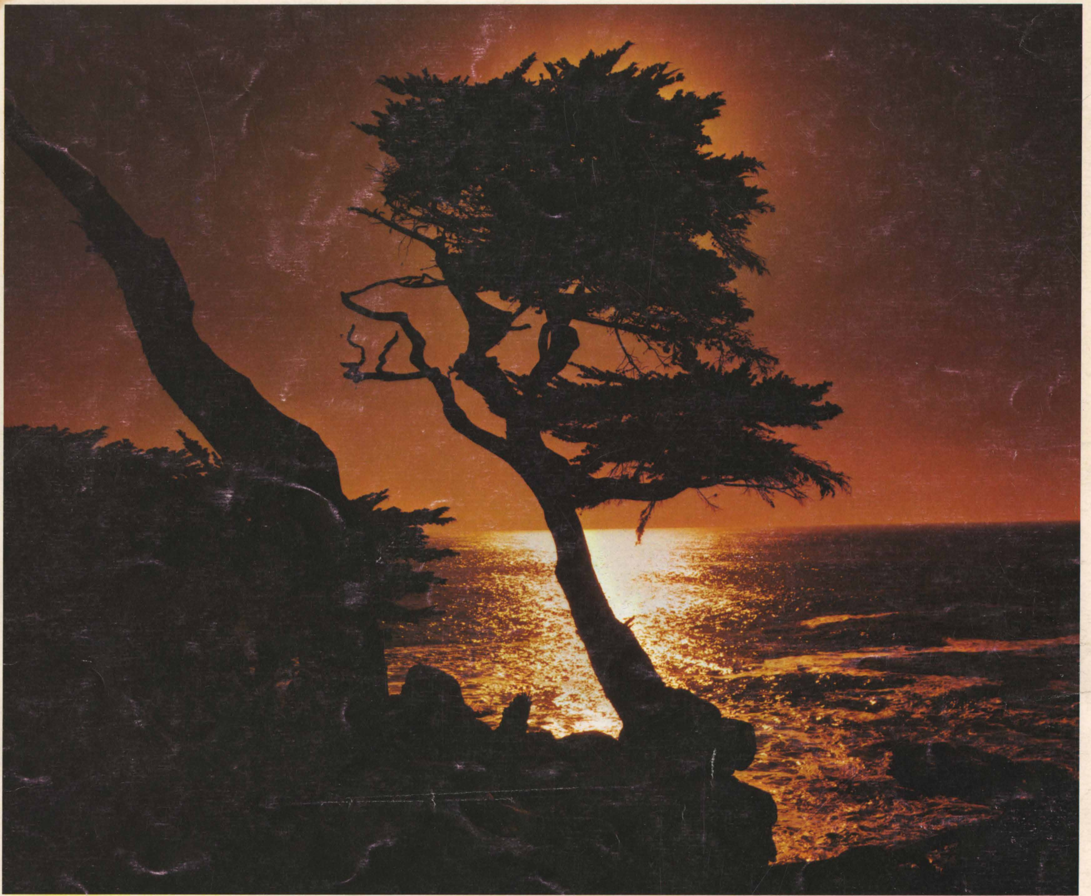
A LONE CYPRESS AND THE GOLDEN PACIFIC