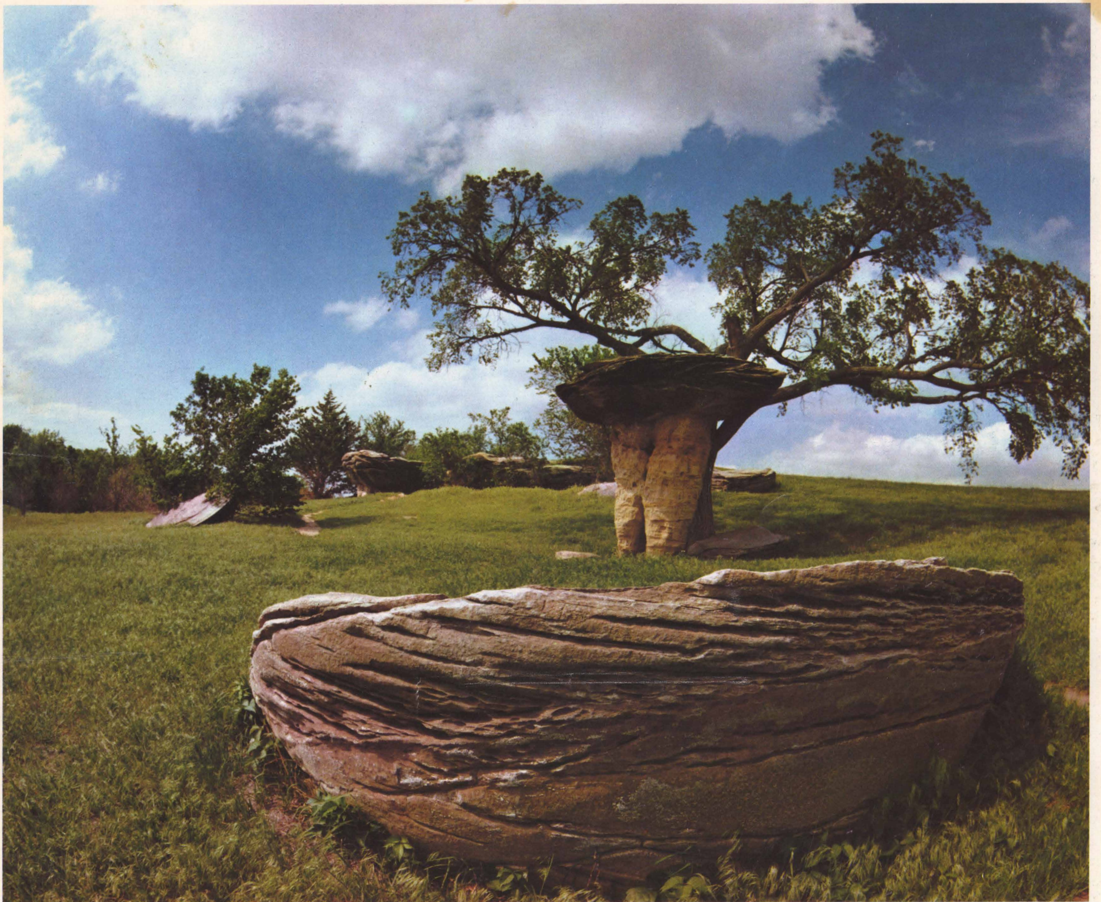
MUSHROOM ROCK STATE PARK NEAR ELLSWORTH, KANSAS