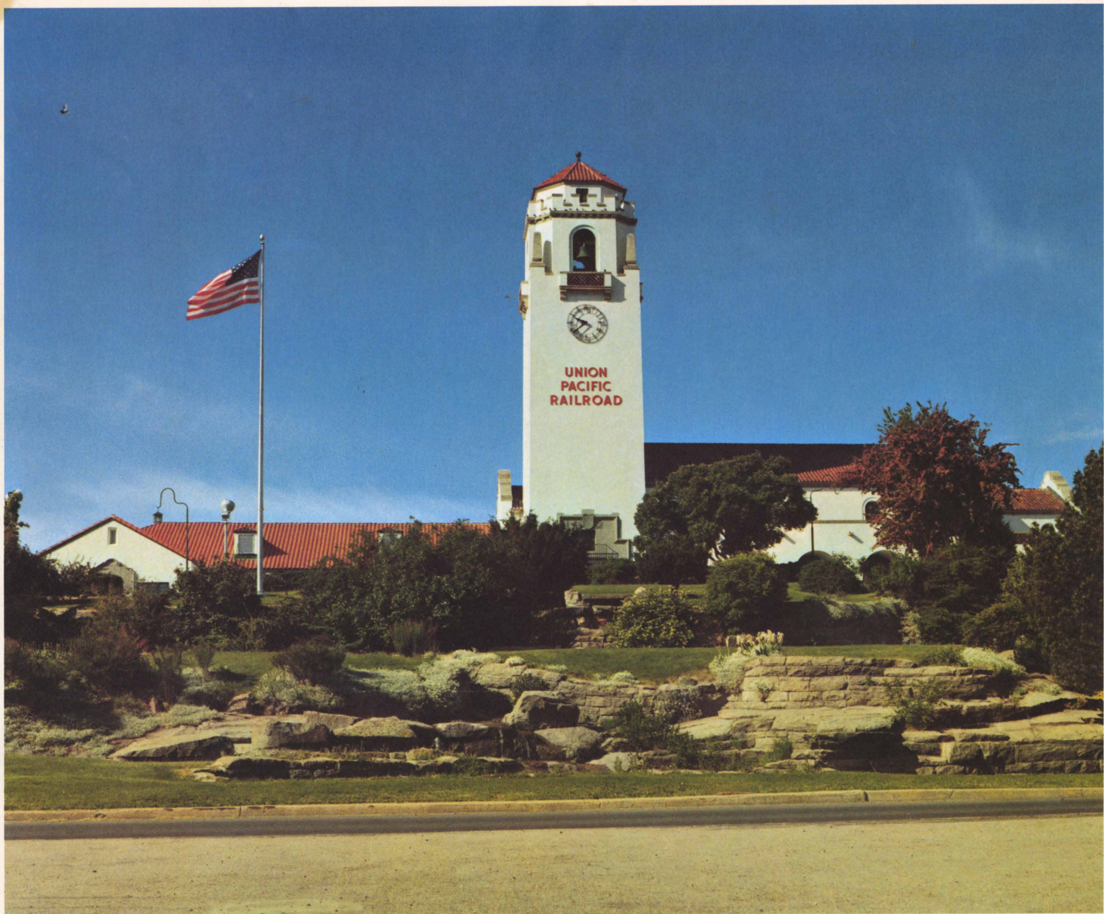
STATION AT BOISE, IDAHO