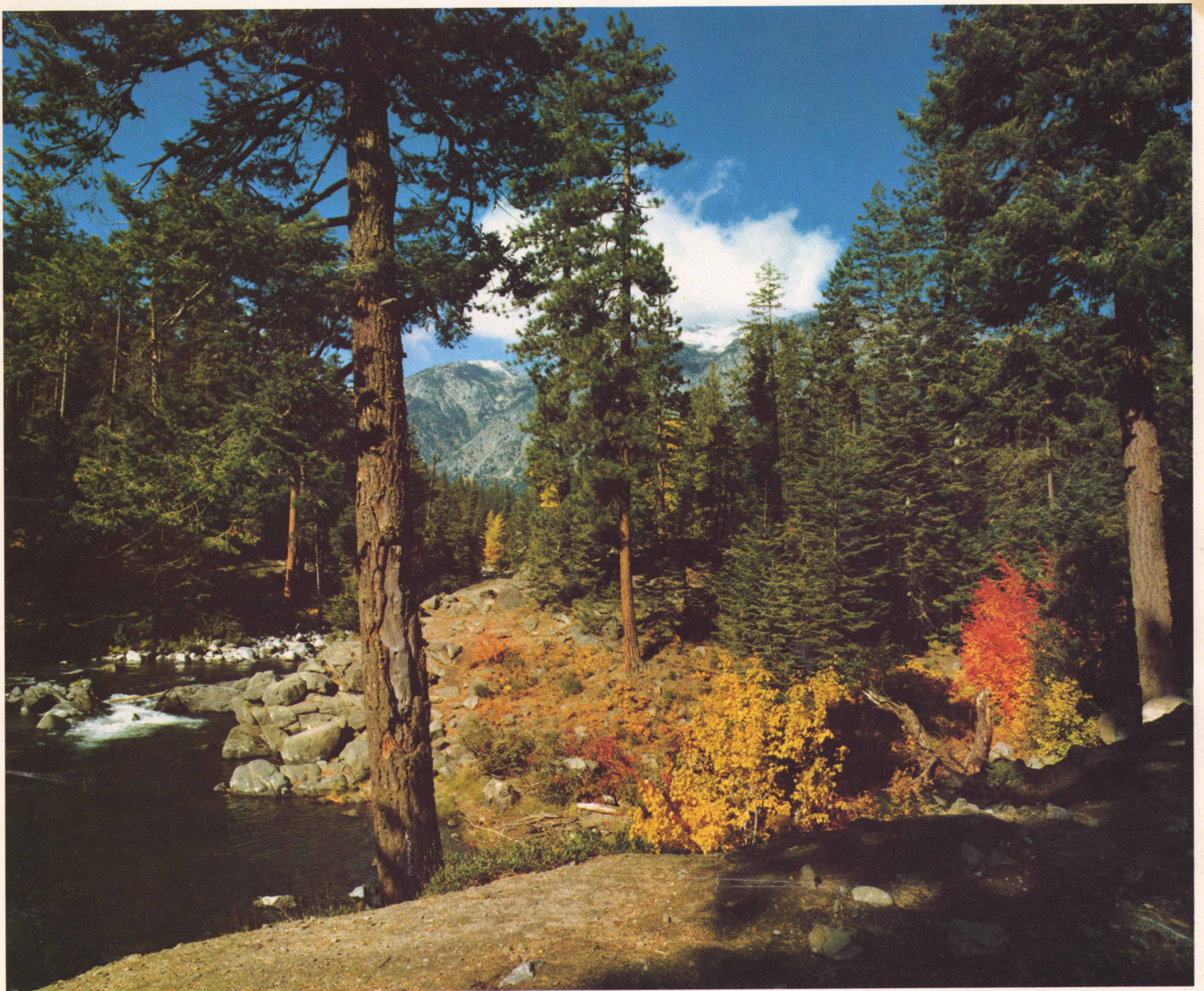
ICICLE CREEK NEAR LEAVENWORTH, WASHINGTON