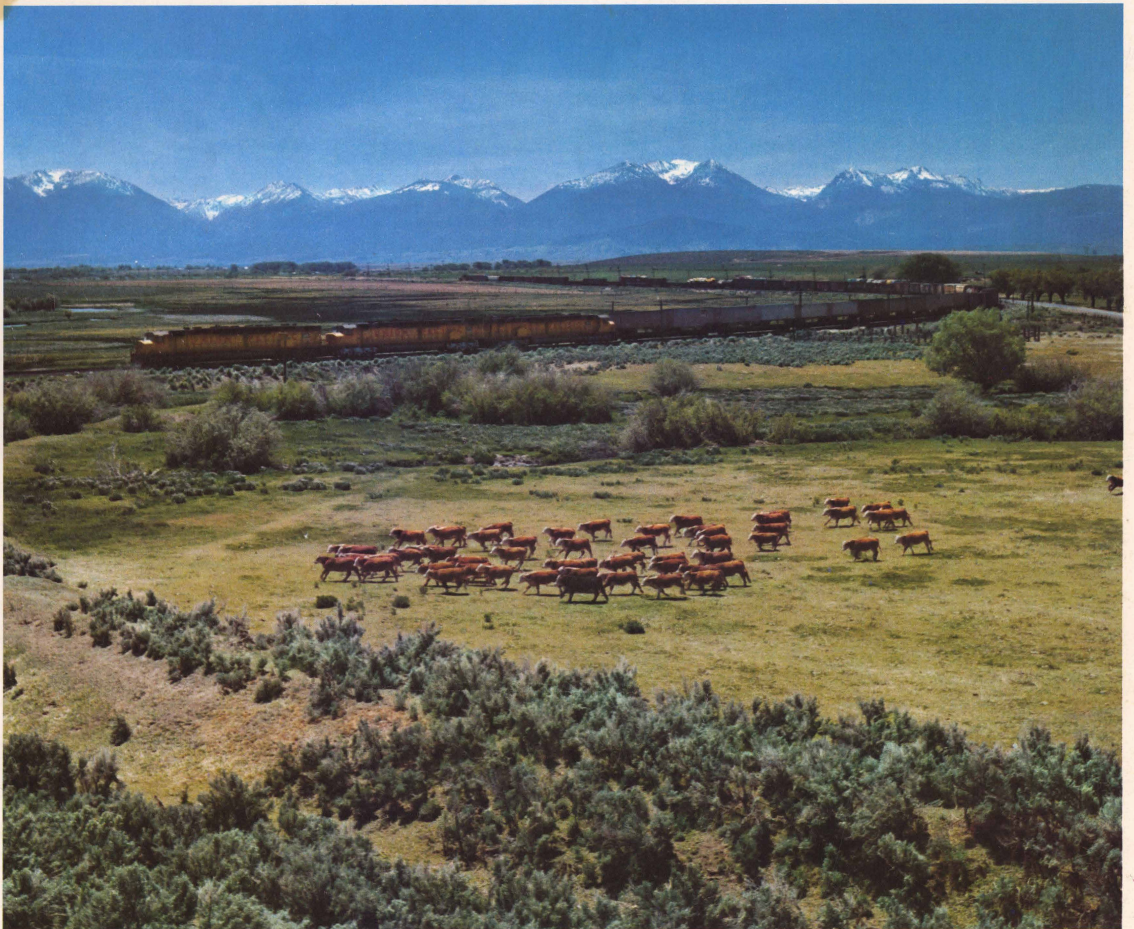
NEAR NORTH POWDER, OREGON