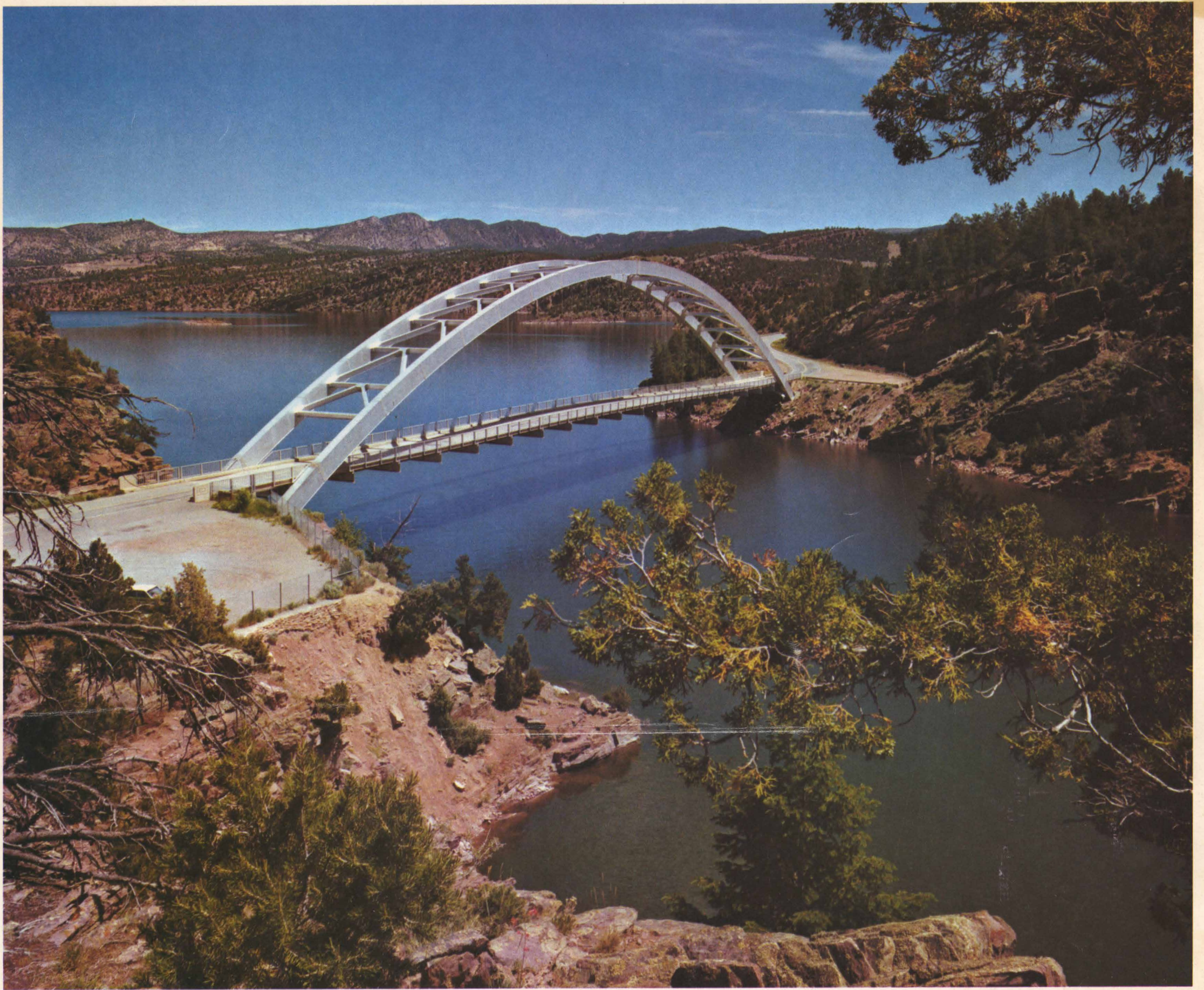
CART CREEK BRIDGE, UTAH