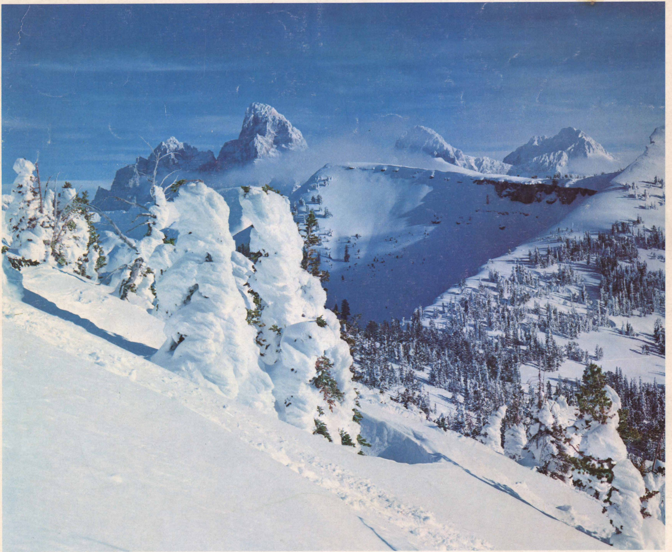
GRAND TETONS, WYOMING