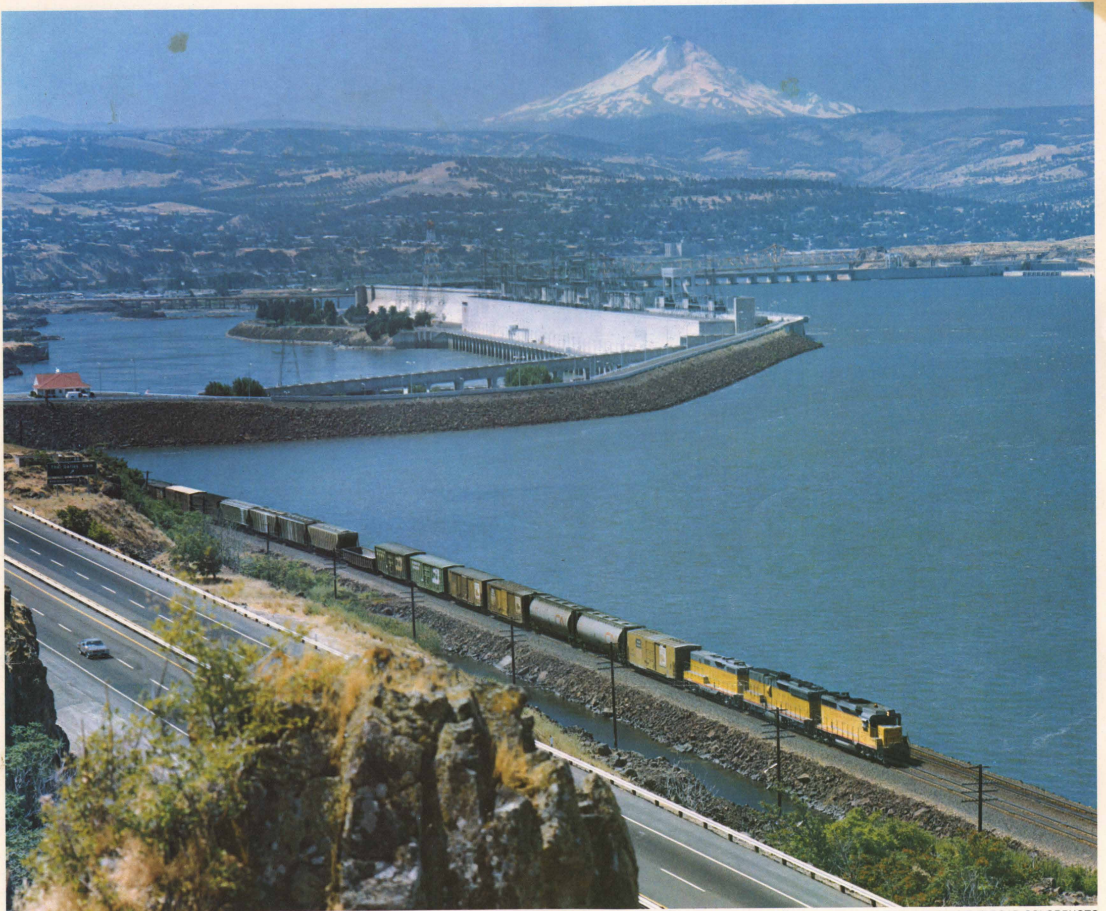
COLUMBIA RIVER AND MT. HOOD, THE DALLES, OREGON