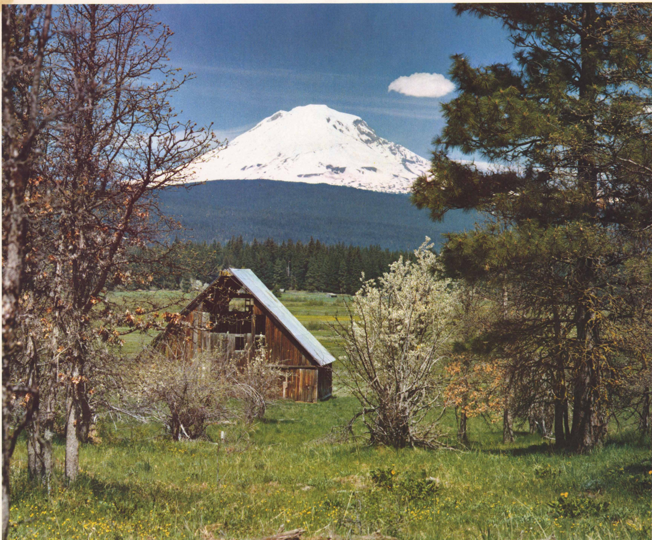
MT. ADAMS NEAR WHITE SALMON, WASHINGTON