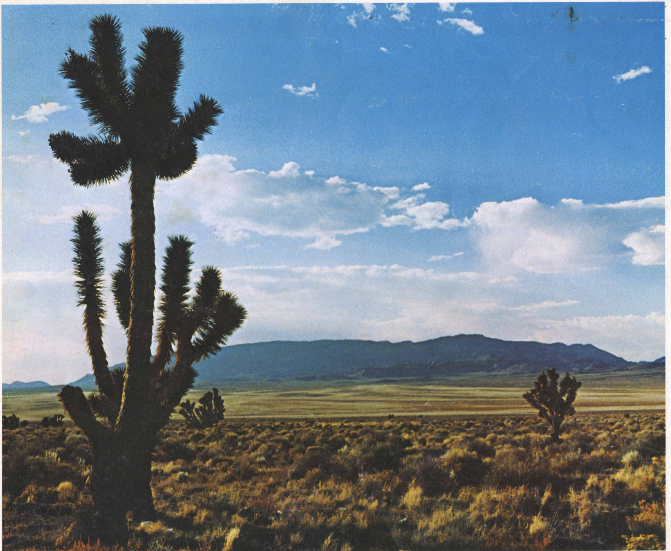
JOSHUA TREE WEST OF CALIENTE, NEVADA