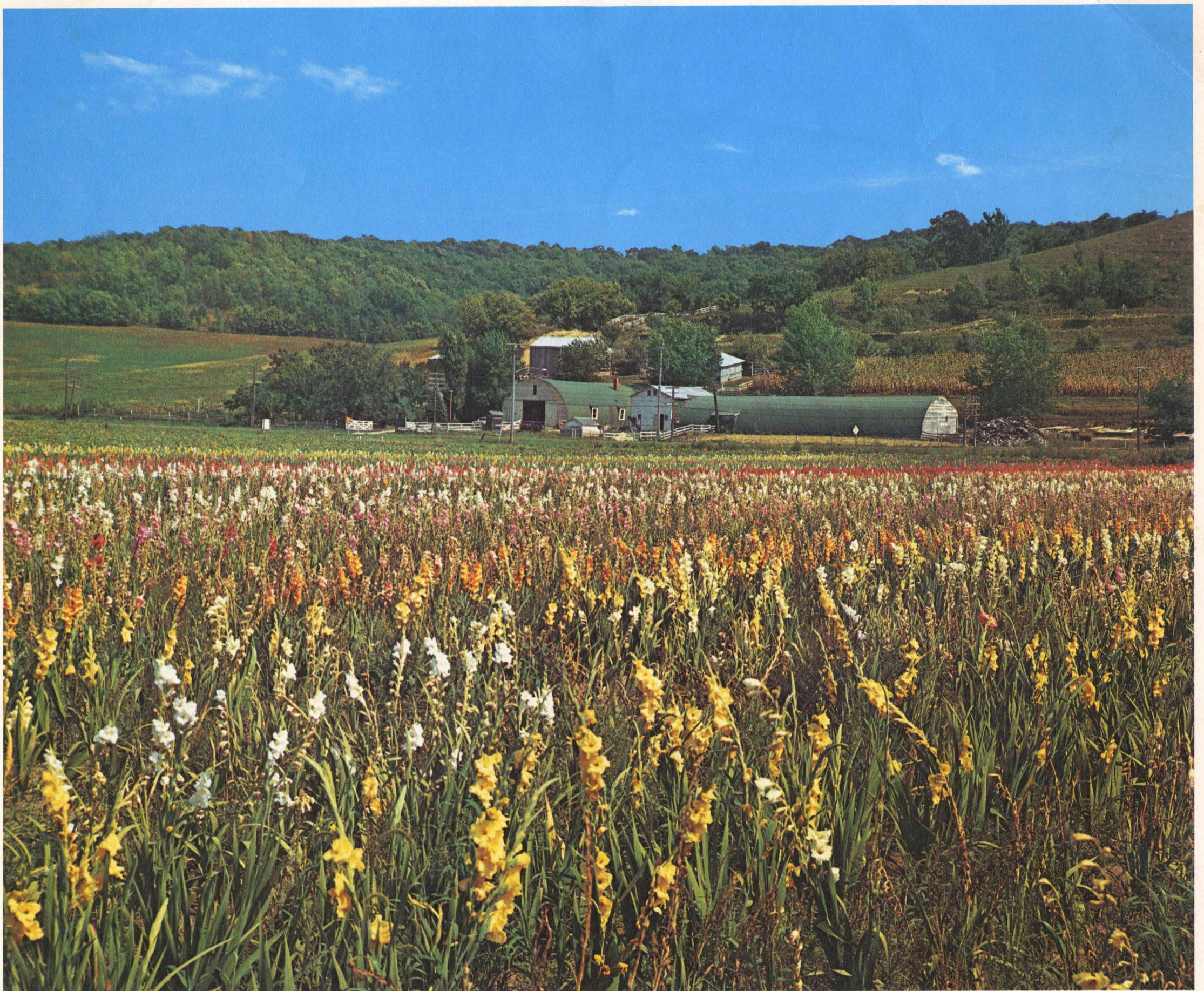
GLADIOLUS BLOOM NEAR CRESCENT, IOWA