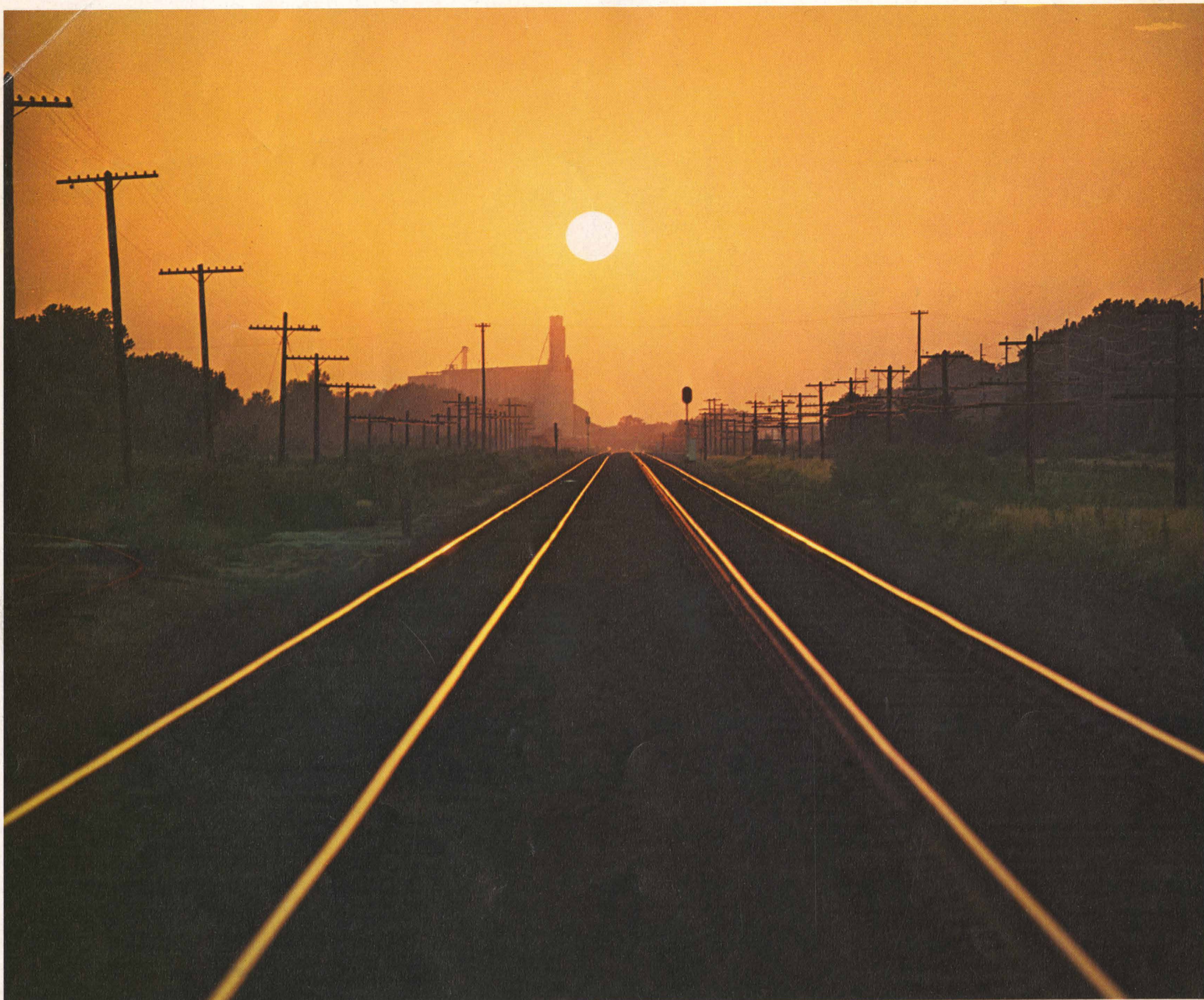
HEADING WEST FROM FREMONT, NEBRASKA