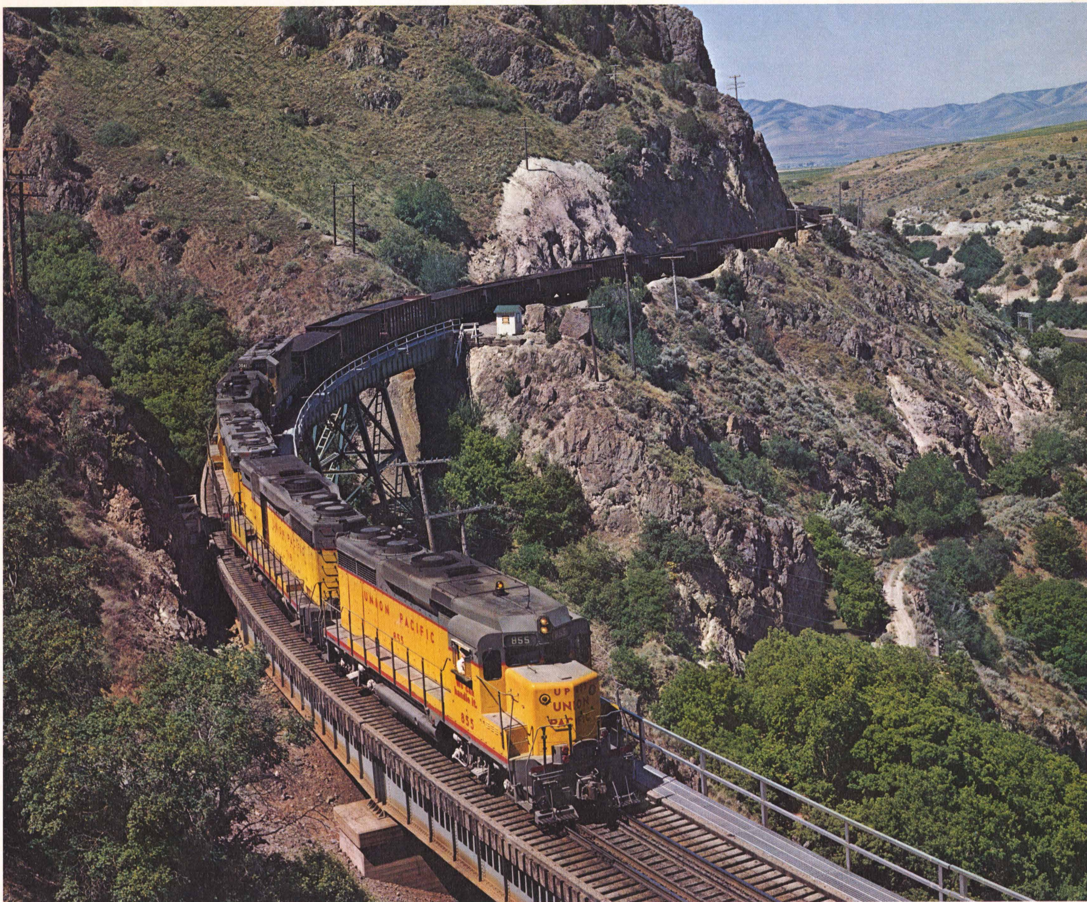
BEAR RIVER CANYON, UTAH