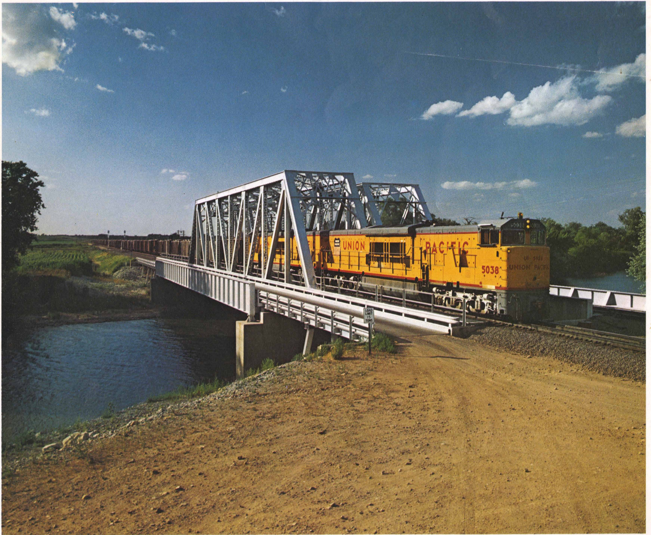
ACROSS THE BLUE RIVER AT MARYSVILLE, KANSAS