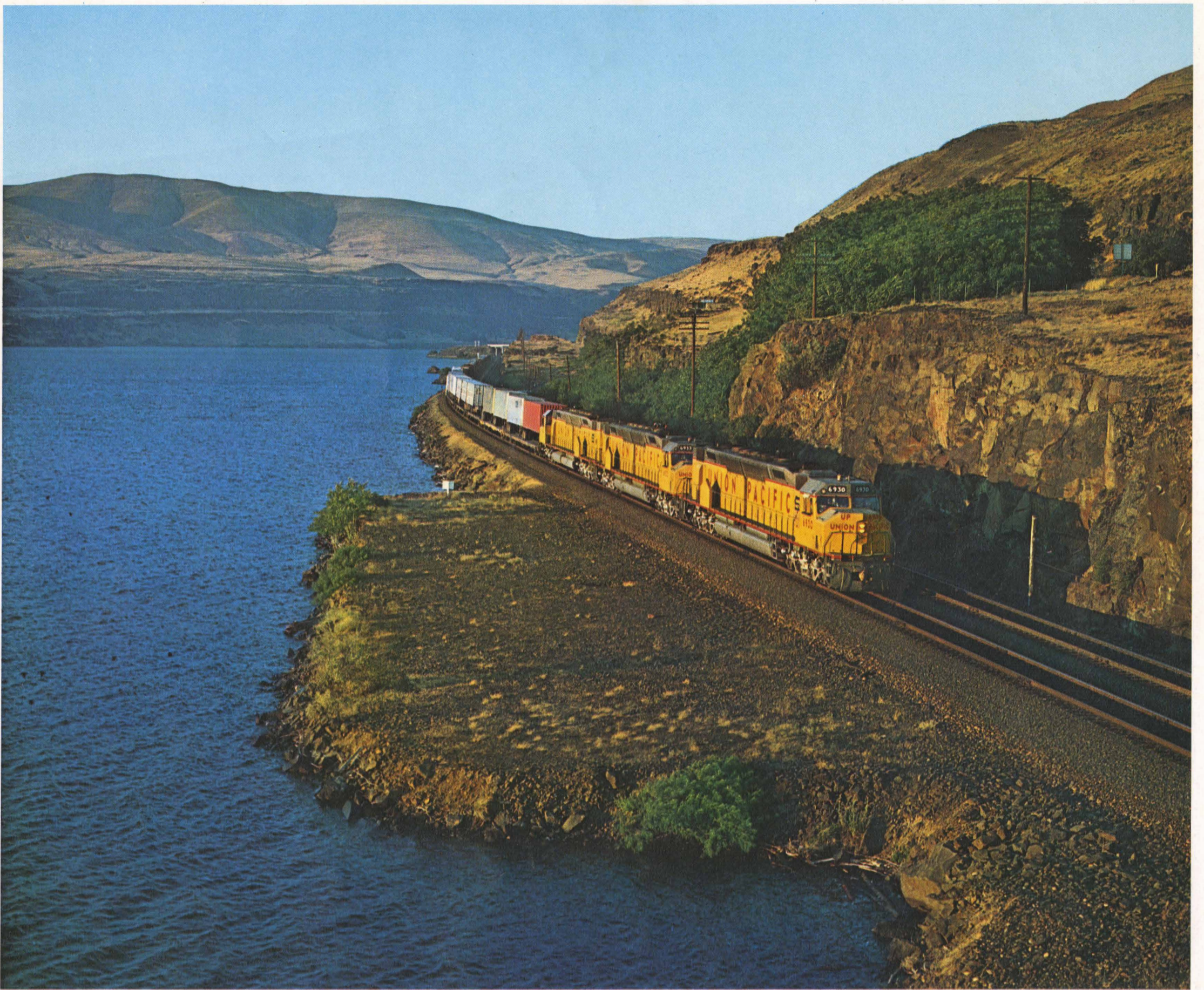
COLUMBIA RIVER NEAR THE DALLES, OREGON