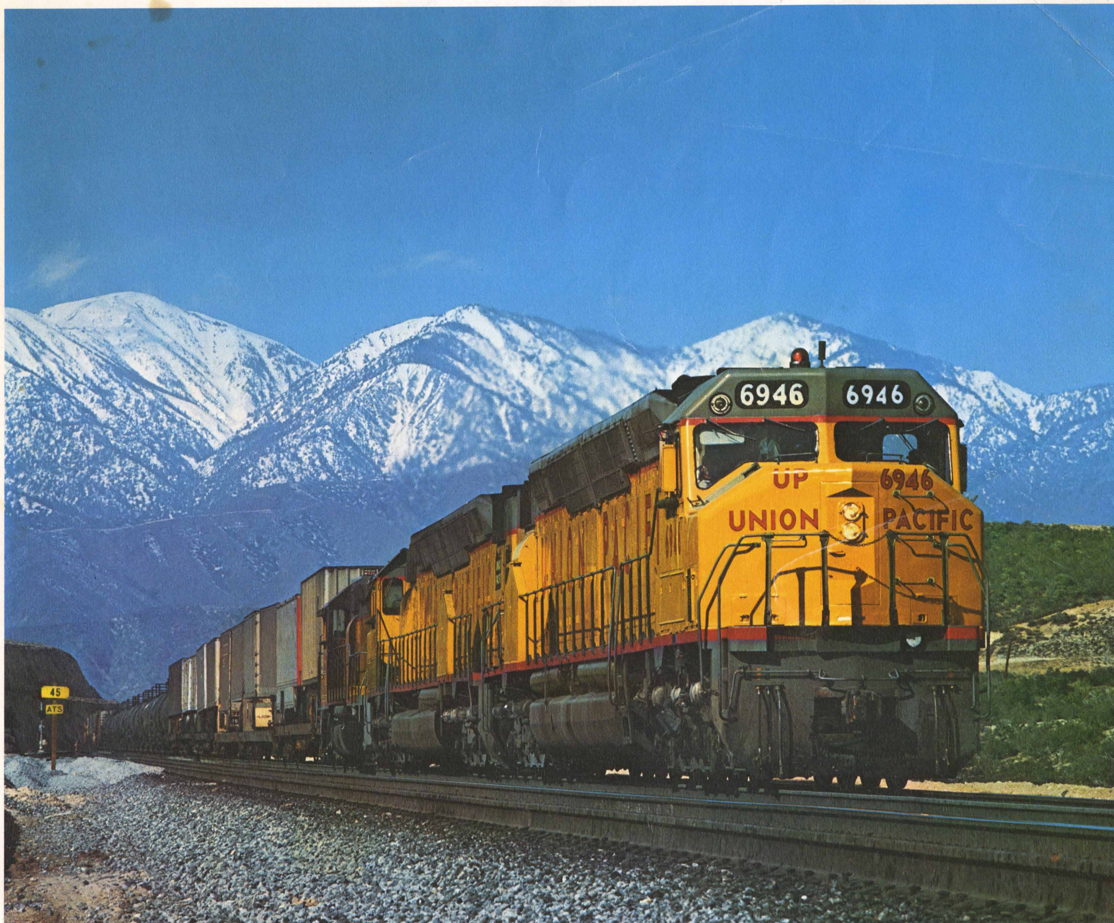
EASTBOUND IN CAJON PASS, CALIFORNIA