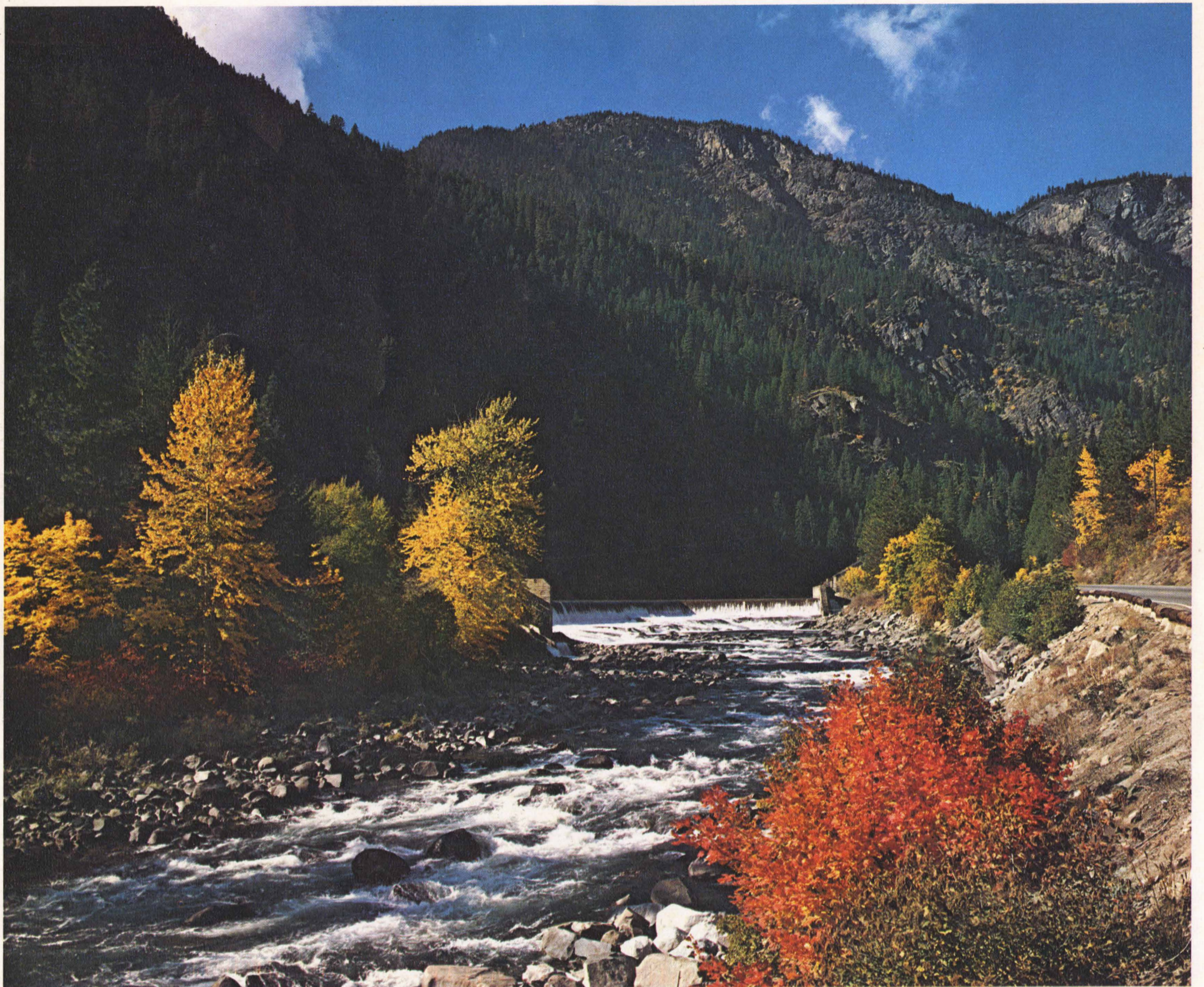
CASCADE MOUNTAINS NEAR LEAVENWORTH, WASHINGTON