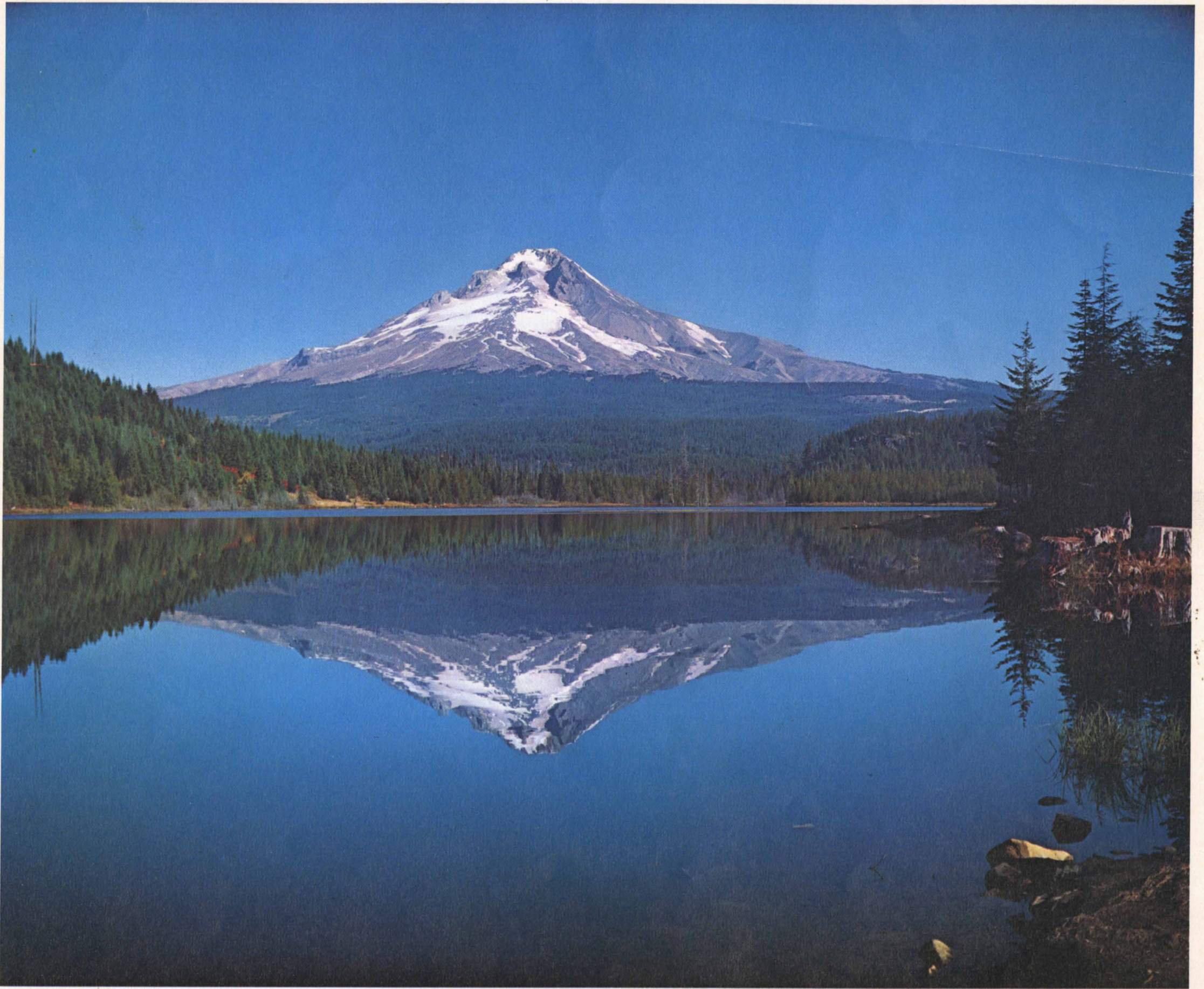
MT. HOOD, TRILLIUM LAKE, OREGON