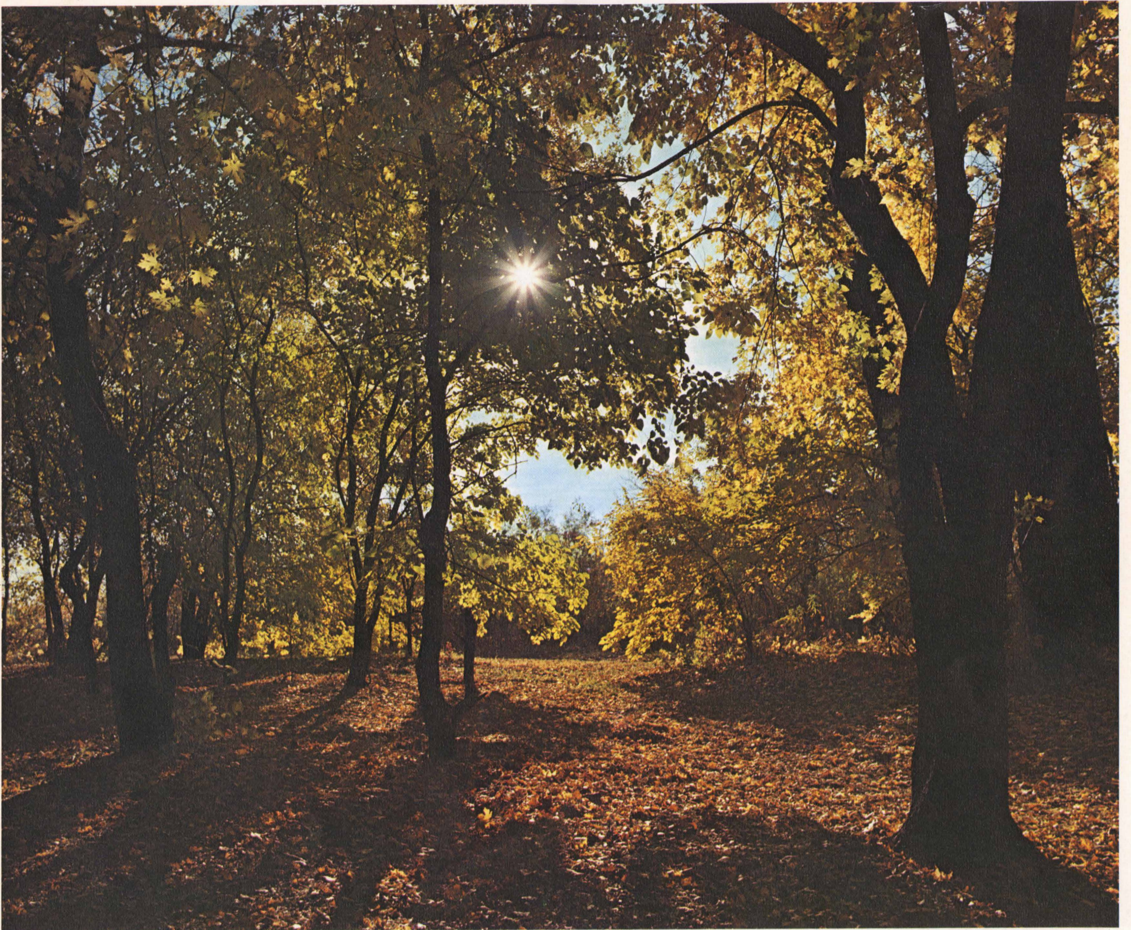
DODGE PARK, OMAHA, NEBRASKA