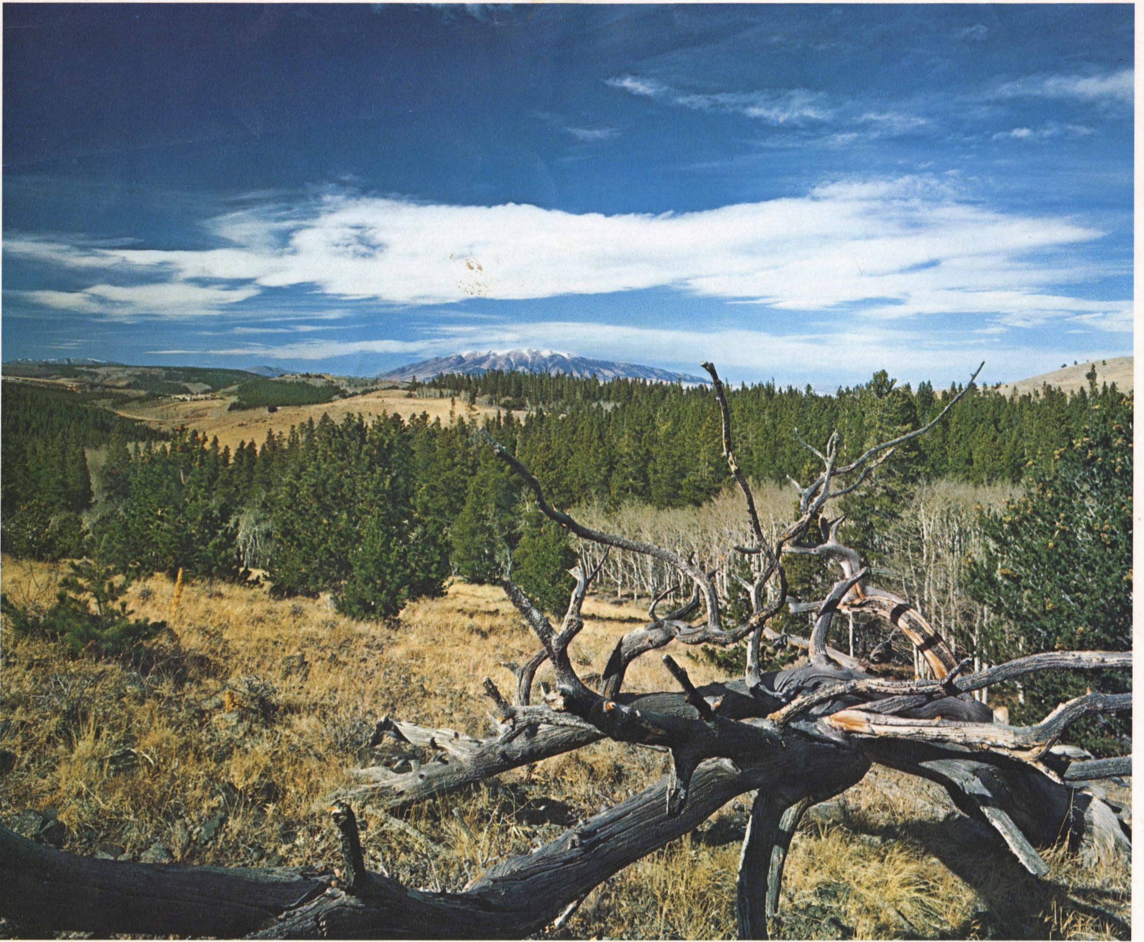
ELK MOUNTAIN, WYOMING