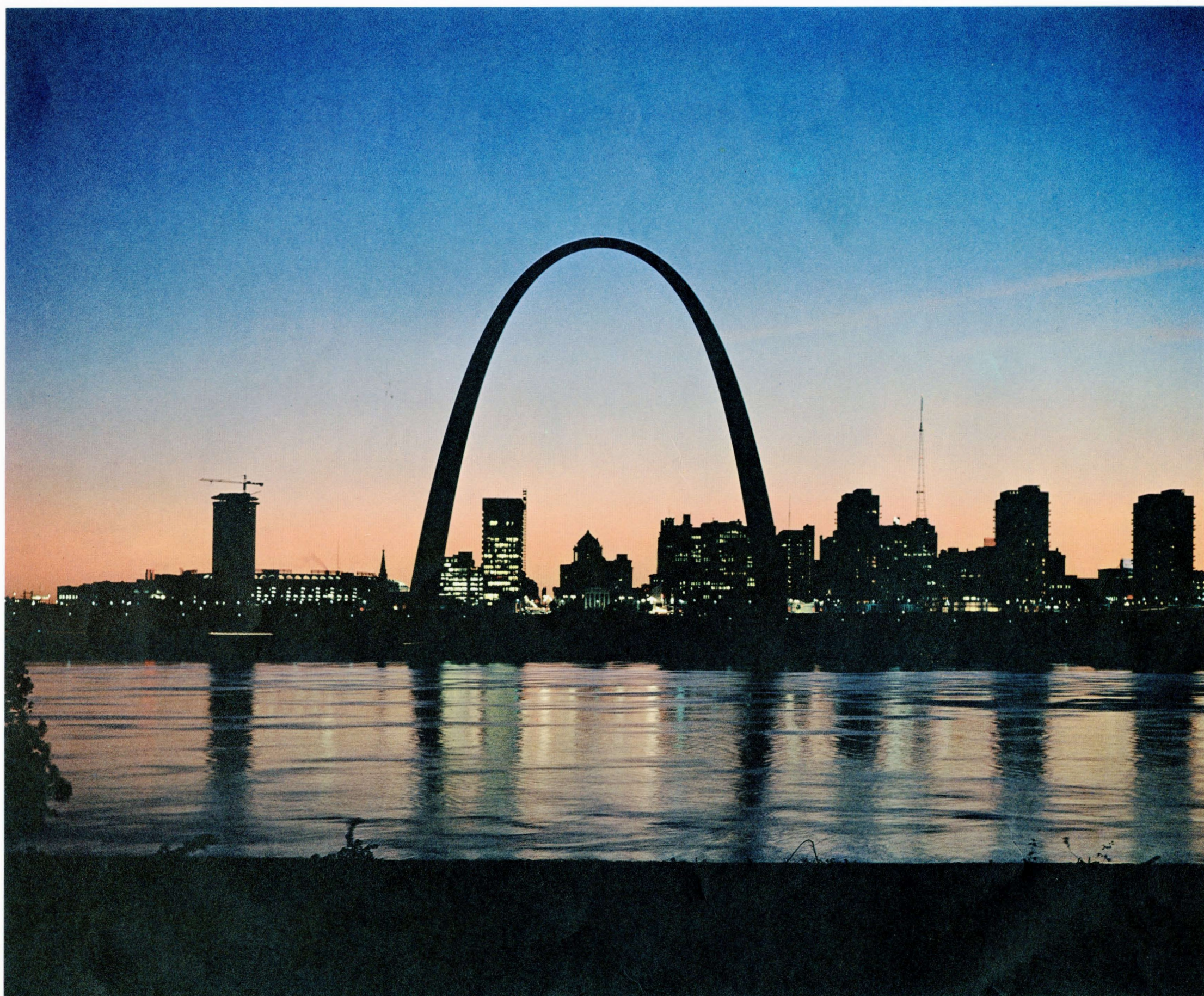
ST. LOUIS SKYLINE ACROSS THE MISSISSIPPI RIVER IN LATE EVENING