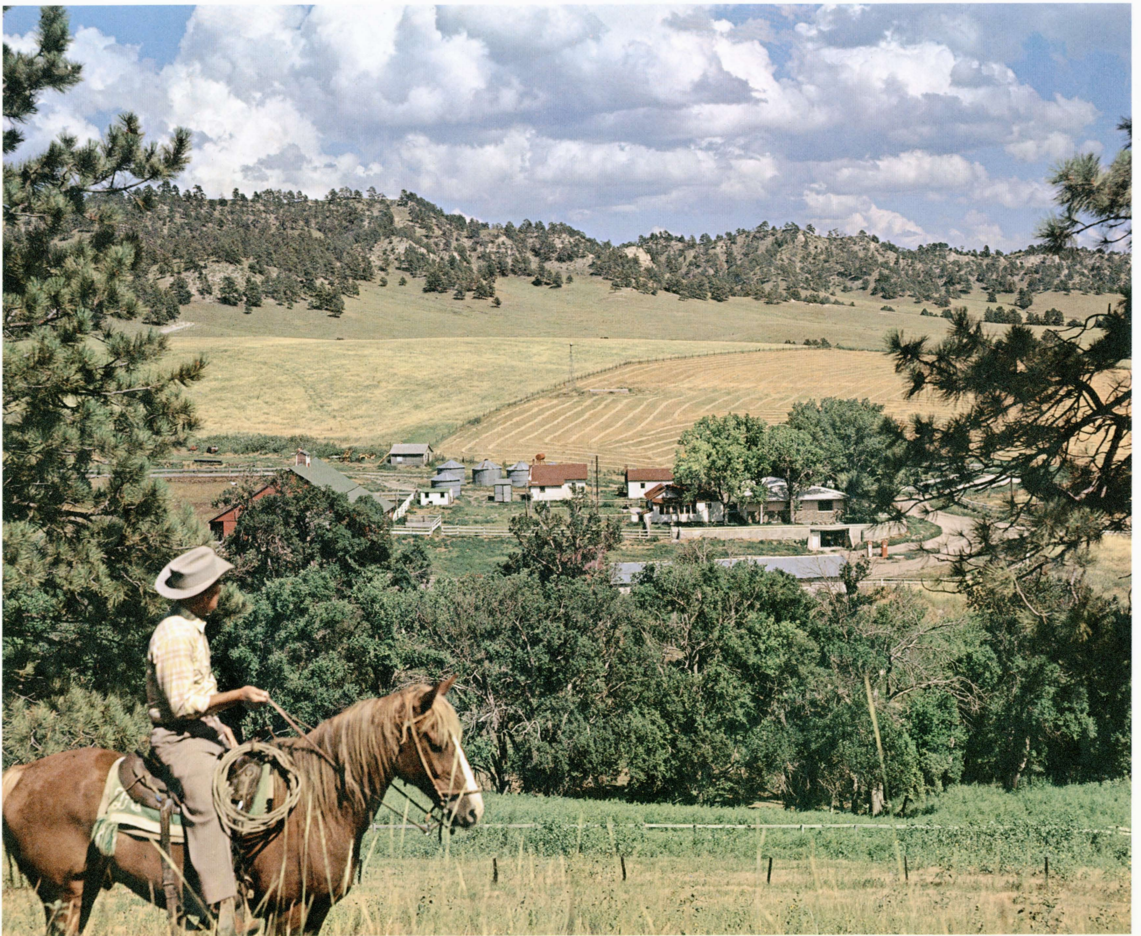
COMMEMORATING FIFTY YEARS OF AWARDING UNION PACIFIC SCHOLARSHIPS TO FARM YOUTH