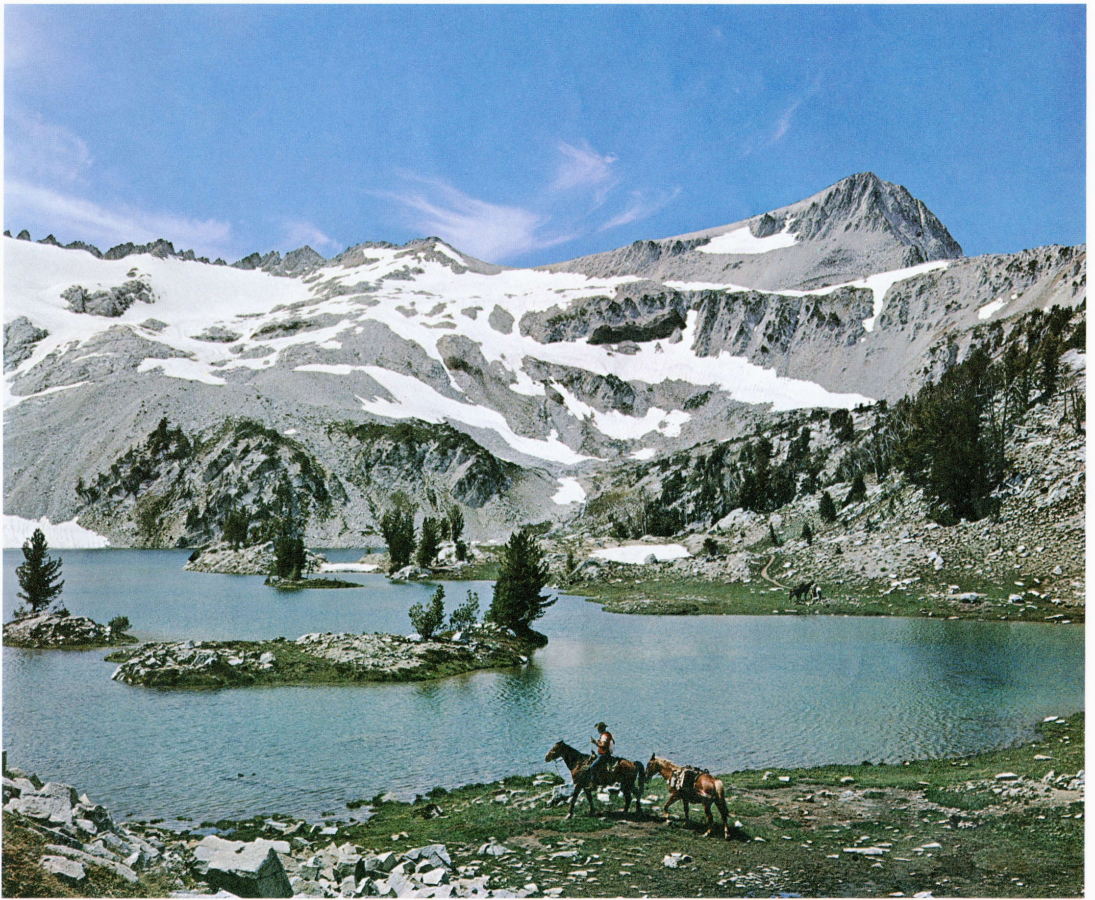
A LONE RIDER APPROACHES GLACIER LAKE IN THE WALLOWA MOUNTAINS OF OREGON