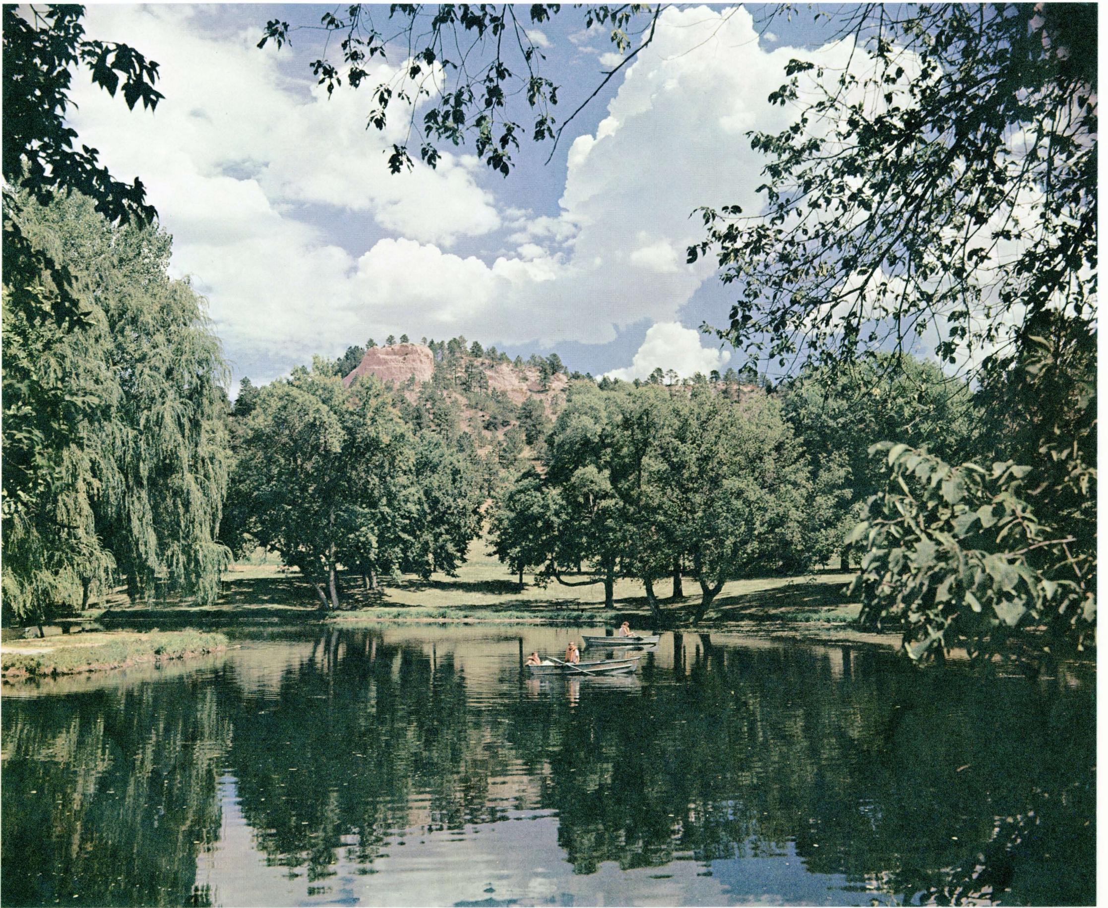
SUMMER DELIGHT AT CHADRON STATE PARK IN NORTHWESTERN NEBRASKA