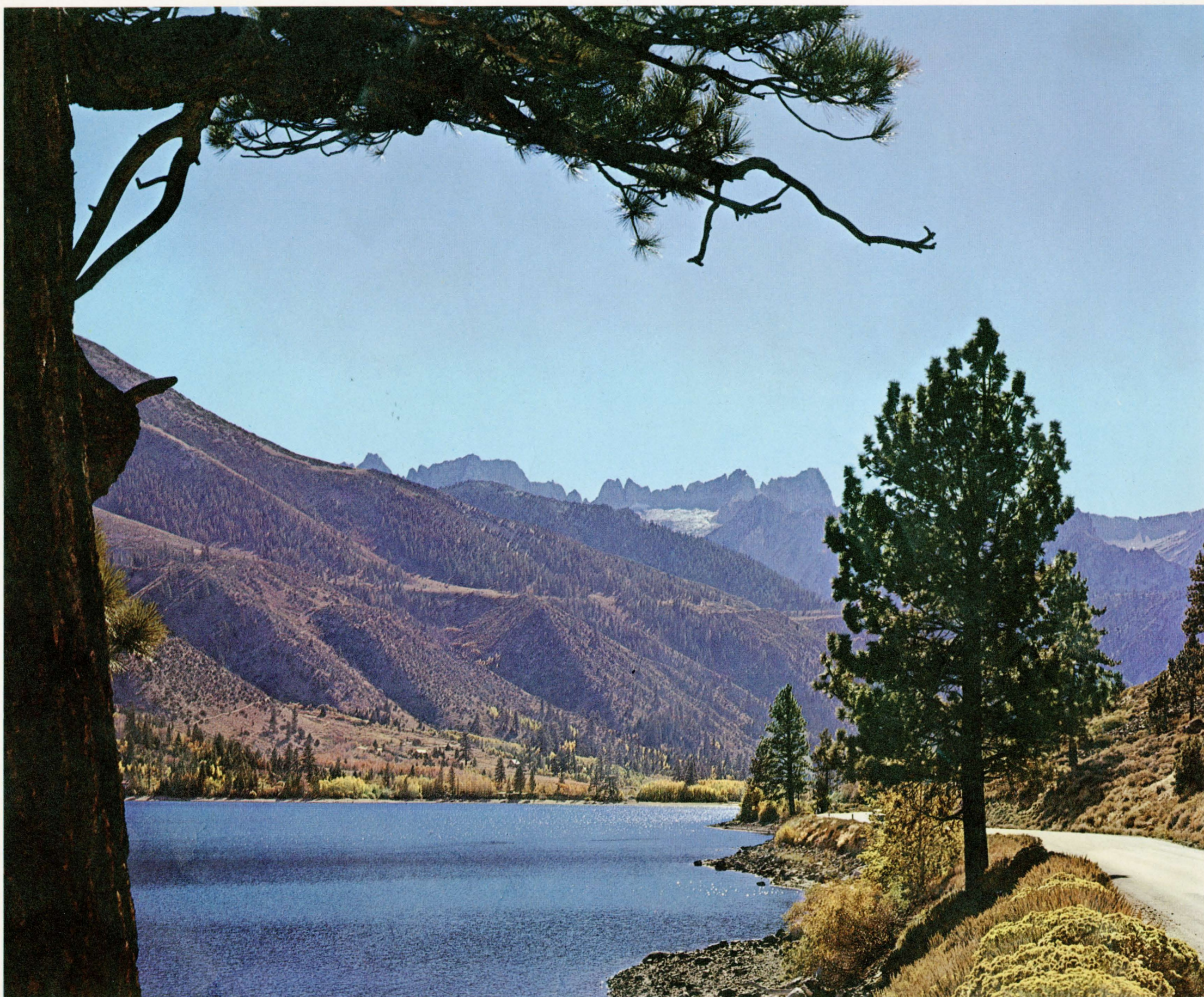
THE LOFTY SIERRAS SURROUND PEACEFUL TWIN LAKES IN CALIFORNIA