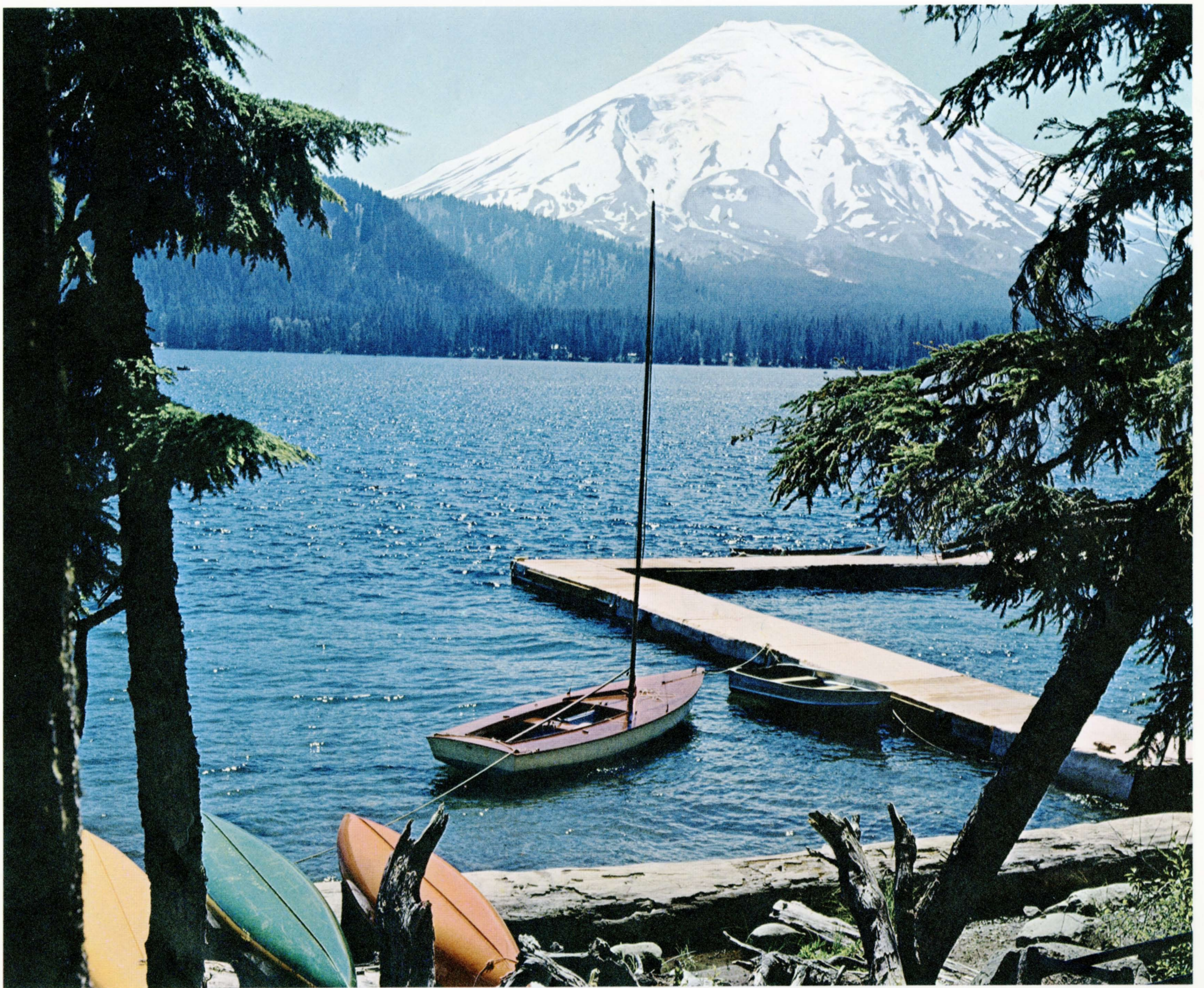
SPIRIT LAKE RIPPLES PEACEFULLY BESIDE MT. ST. HELENS IN WASHINGTON