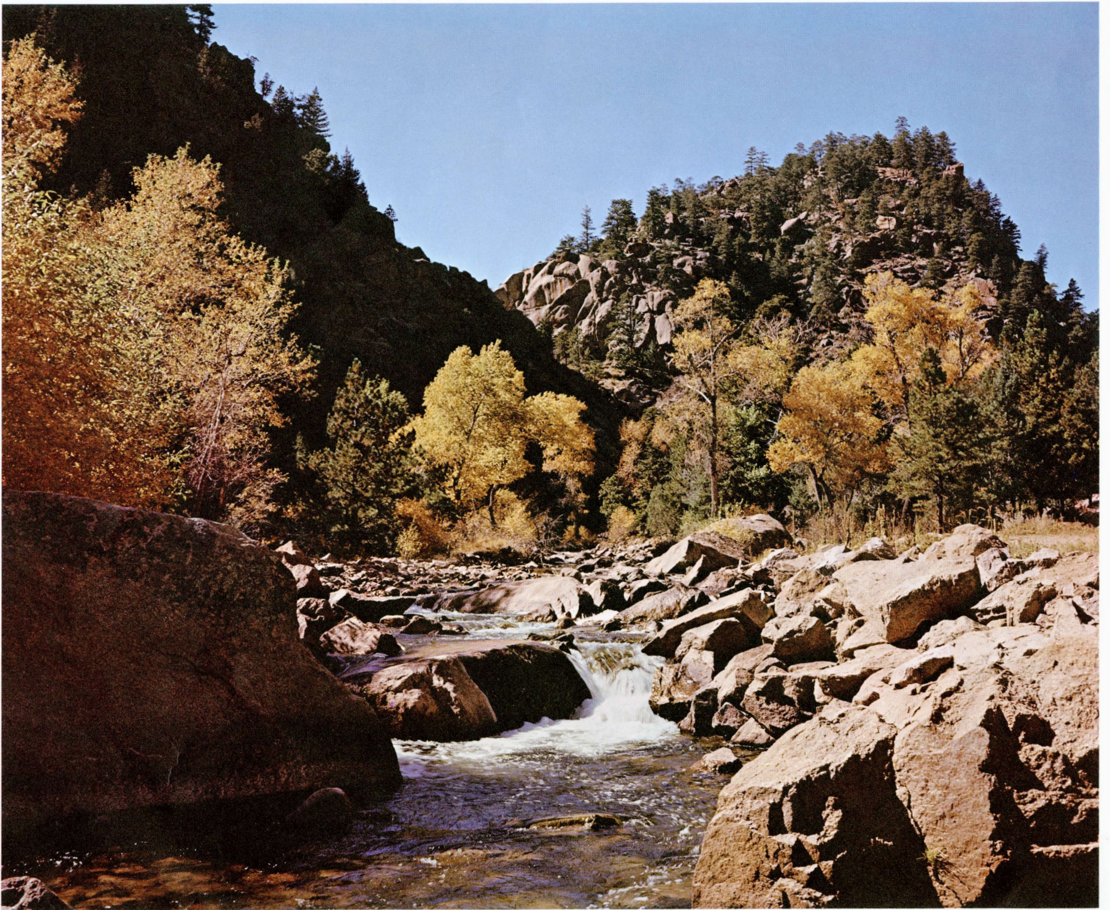
FALL COLORS SPLASH THE TREES IN ST. VRAIN CANYON IN COLORADO