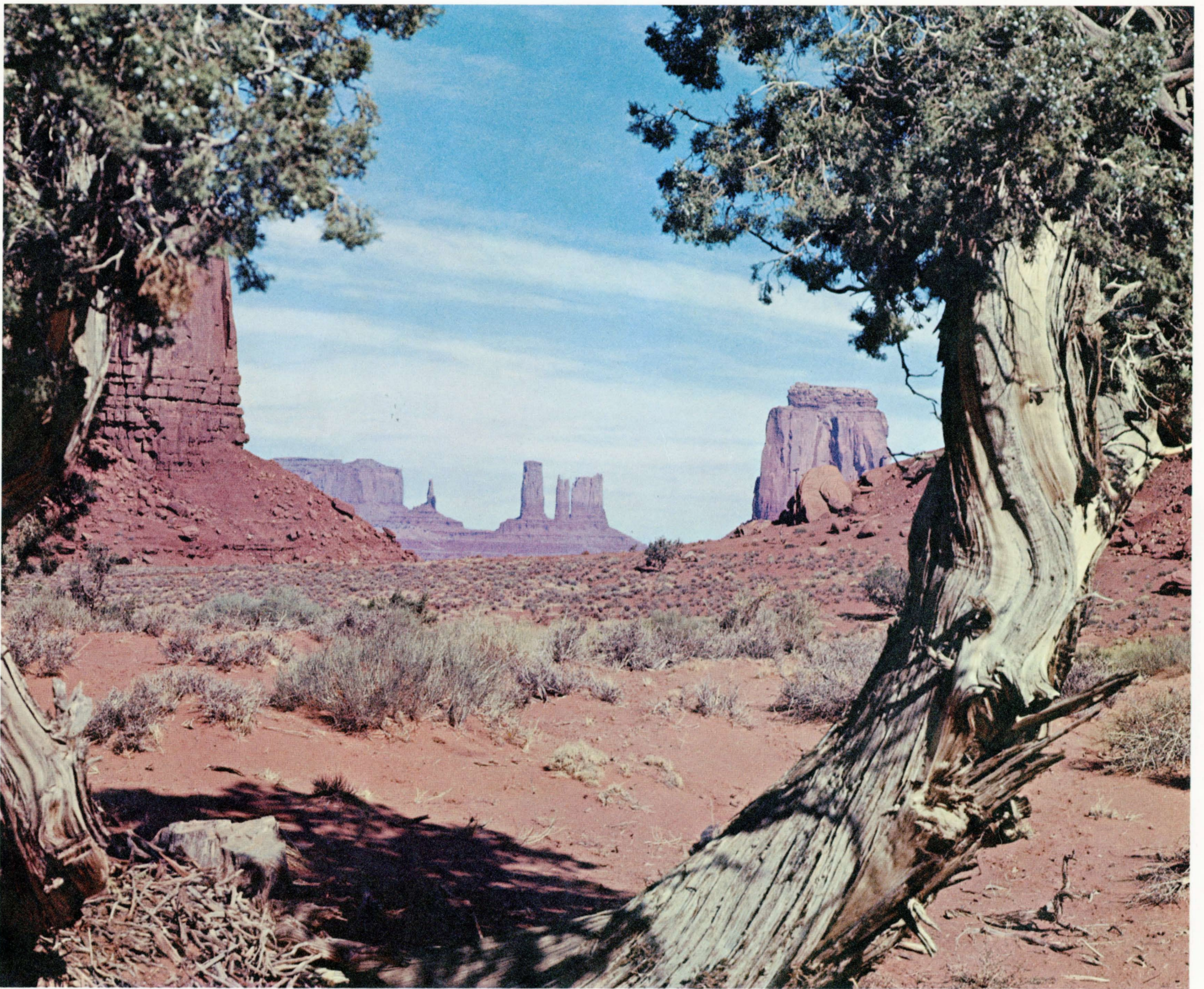
THE KING AND CASTLE IN MONUMENT VALLEY IN UTAH