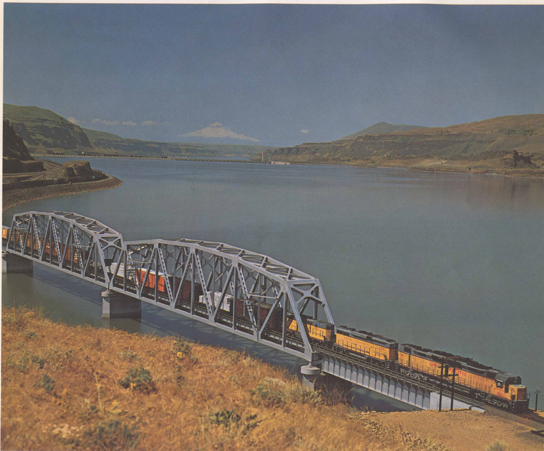
UNION PACIFIC FREIGHT TRAIN PULLS ACROSS COLUMBIA RIVER AT JOHN DAY DAM