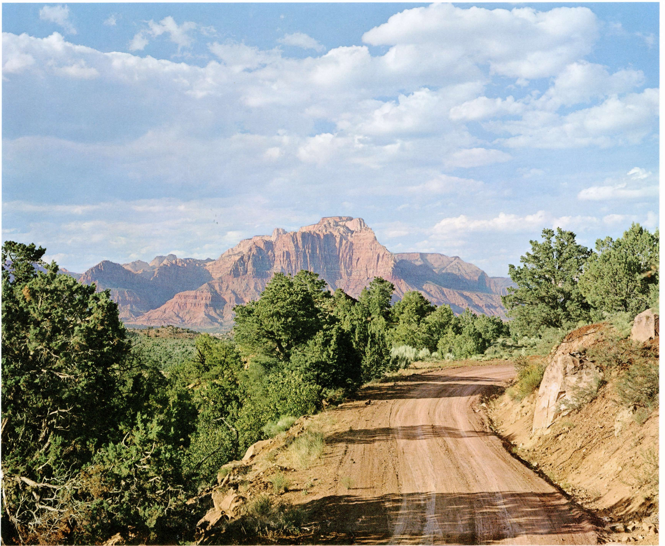
ZION NATIONAL PARK LOOMS MAJESTICALLY IN SOUTHERN UTAH