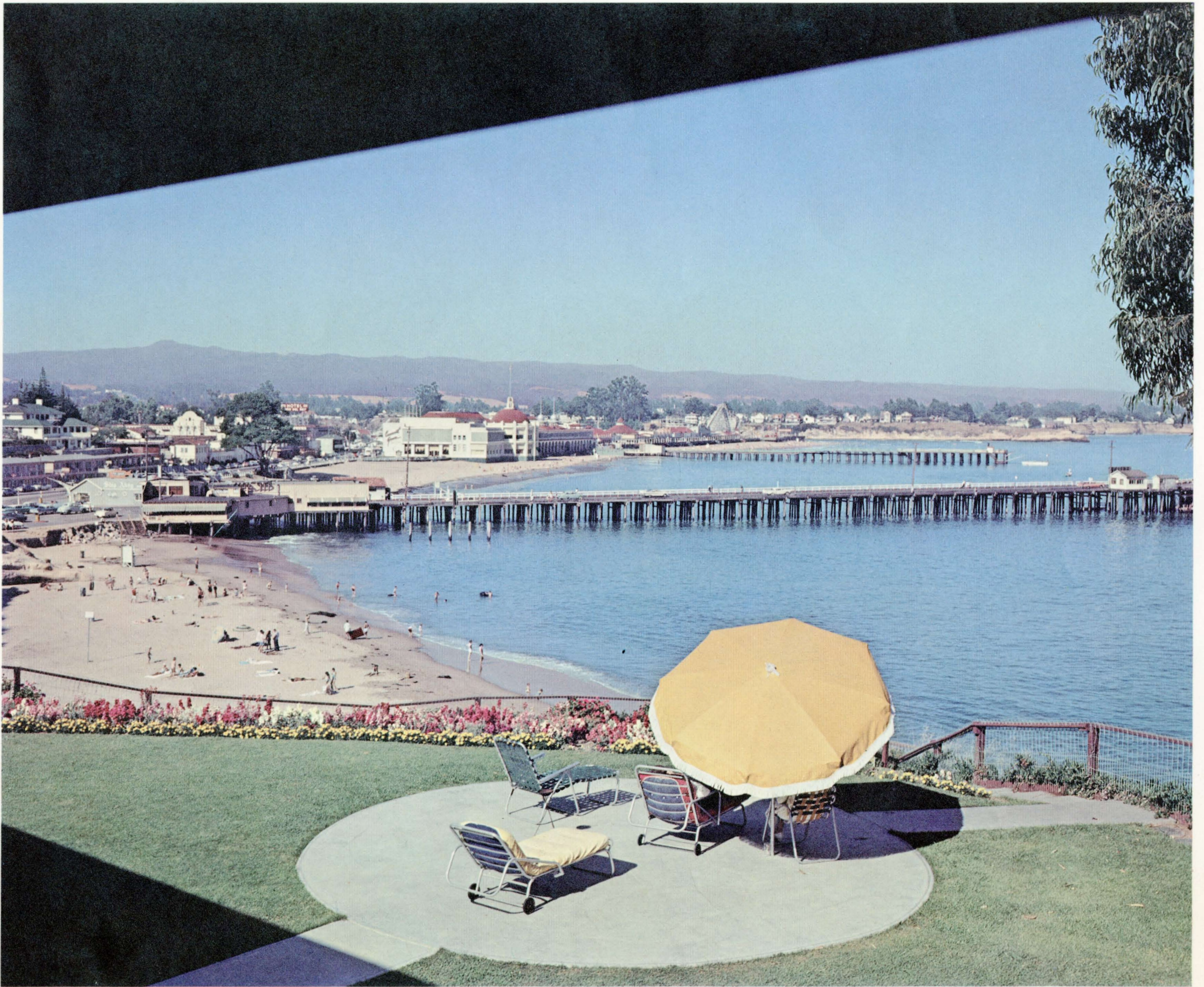
THE PACIFIC OCEAN WELCOMES BATHERS ON THE BEACH AT SANTA CRUZ, CALIFORNIA