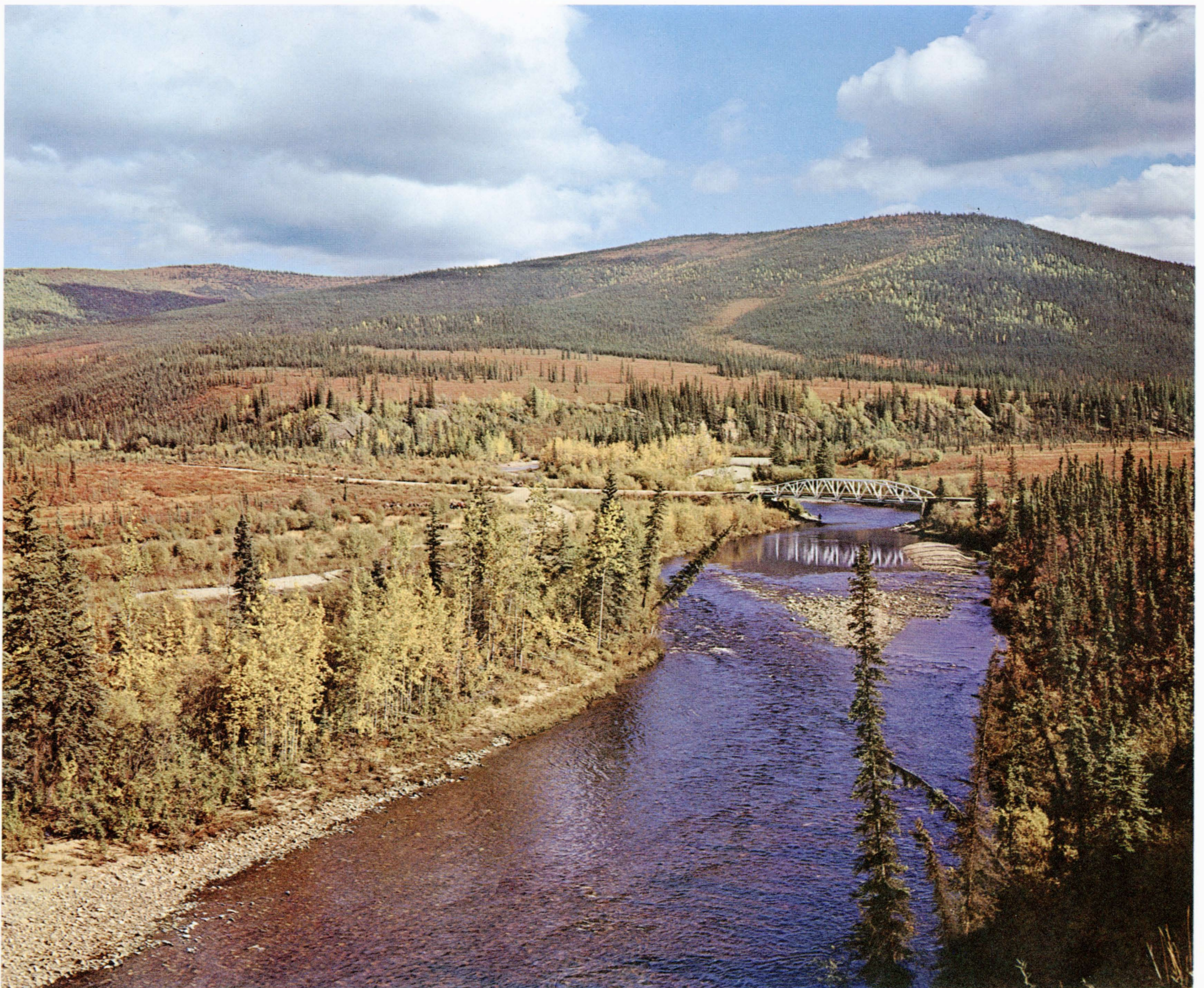
THE SUMMER SUN SHINES ON HISTORIC FORTY-MILE RIVER IN ALASKA