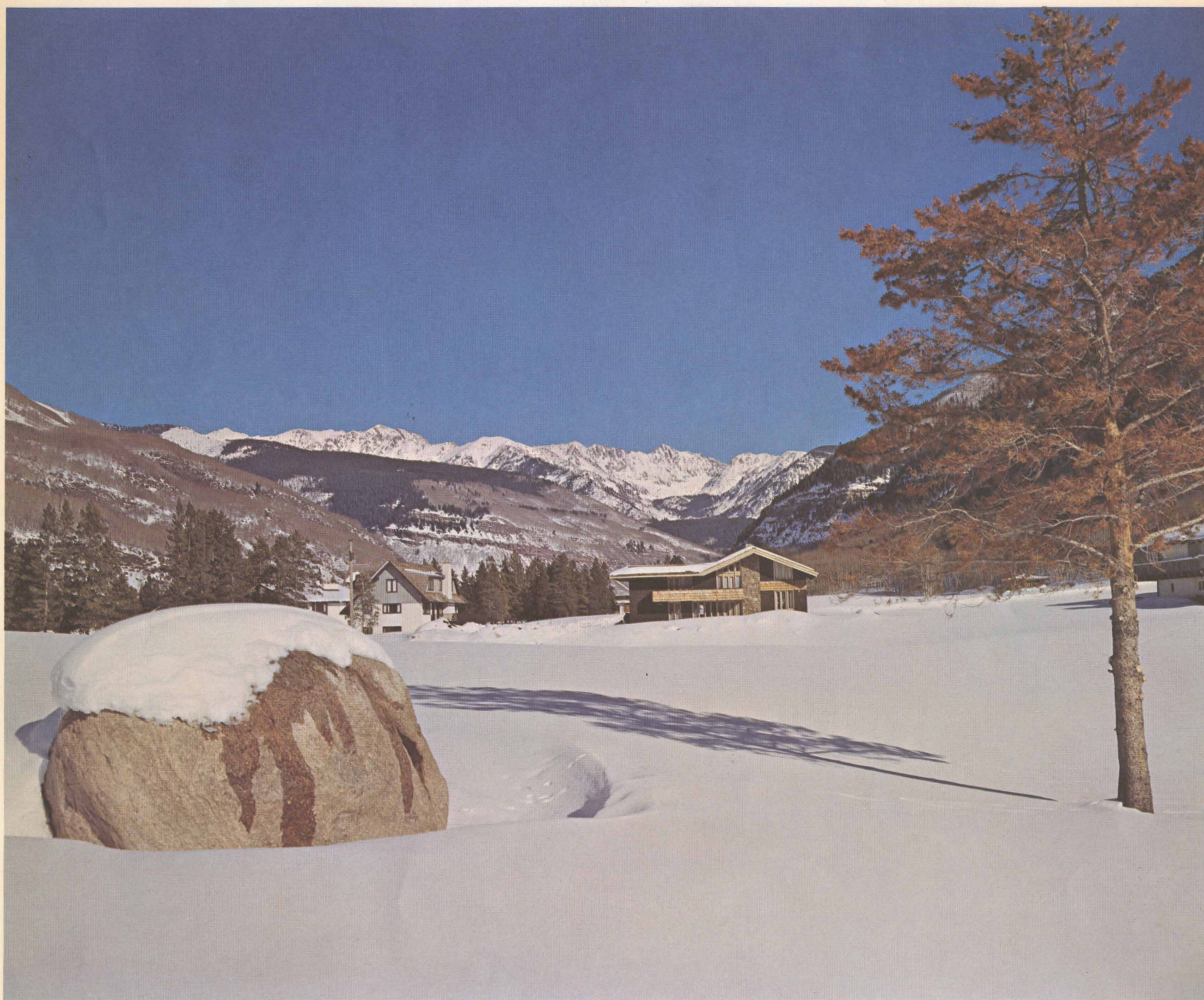
WINTER'S BEAUTY COVERS GORE RANGE NEAR VAIL, COLORADO