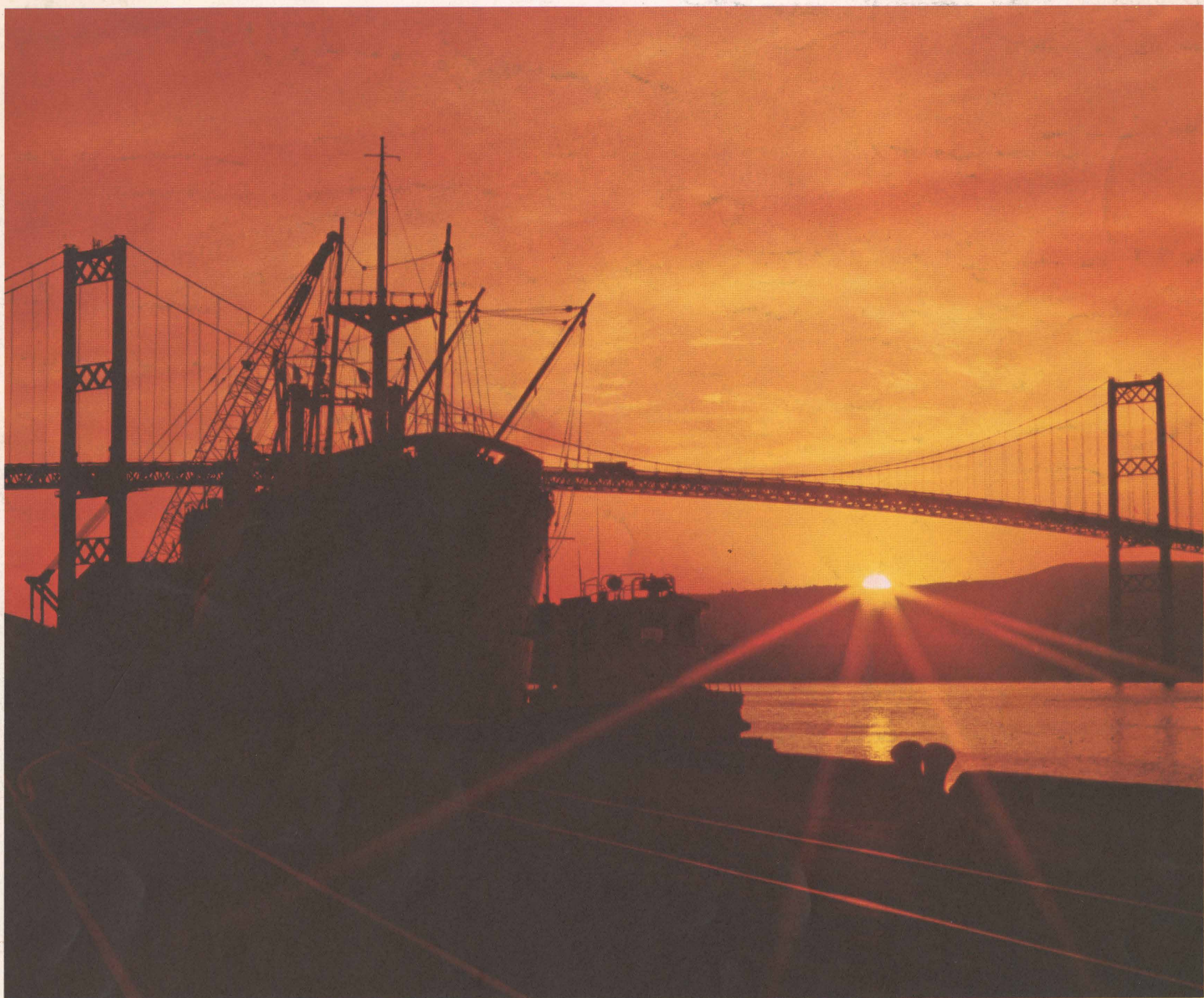
THE SETTING SUN GLEAMS ON SHIPSIDE RAILROAD TRACKS AT LOS ANGELES HARBOR