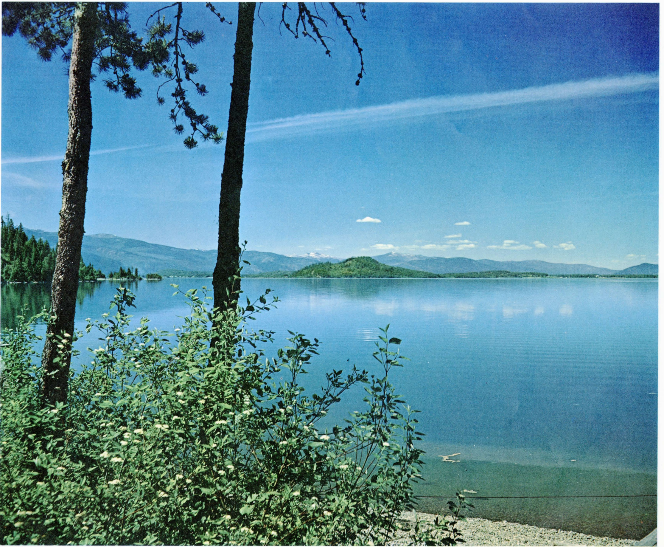
IDYLLIC IS THE SETTING OF LUBY BAY ON PRIEST LAKE IN NORTHERN IDAHO