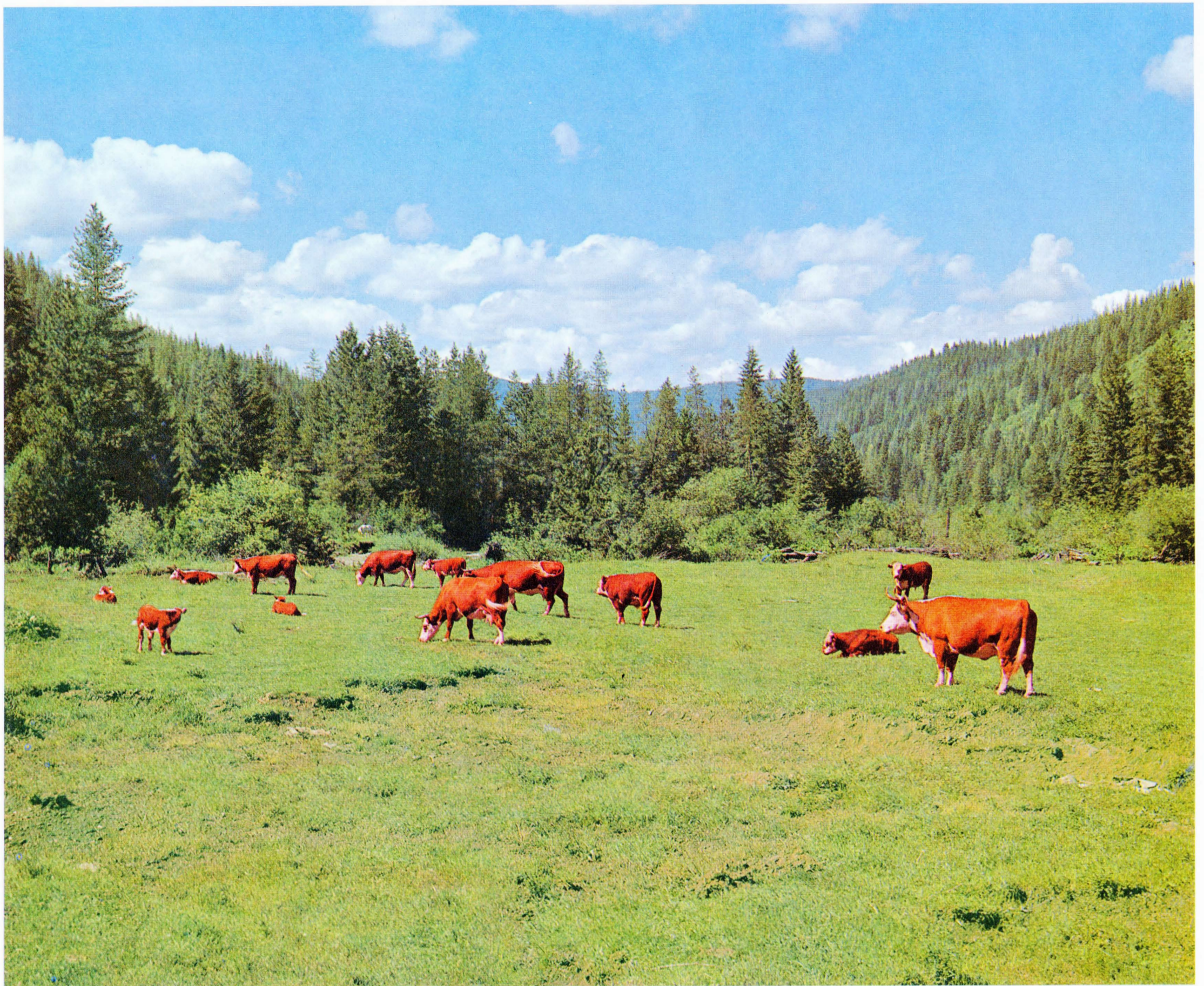
WESTERN CATTLE GRAZE AMIDST LOFTY PINES