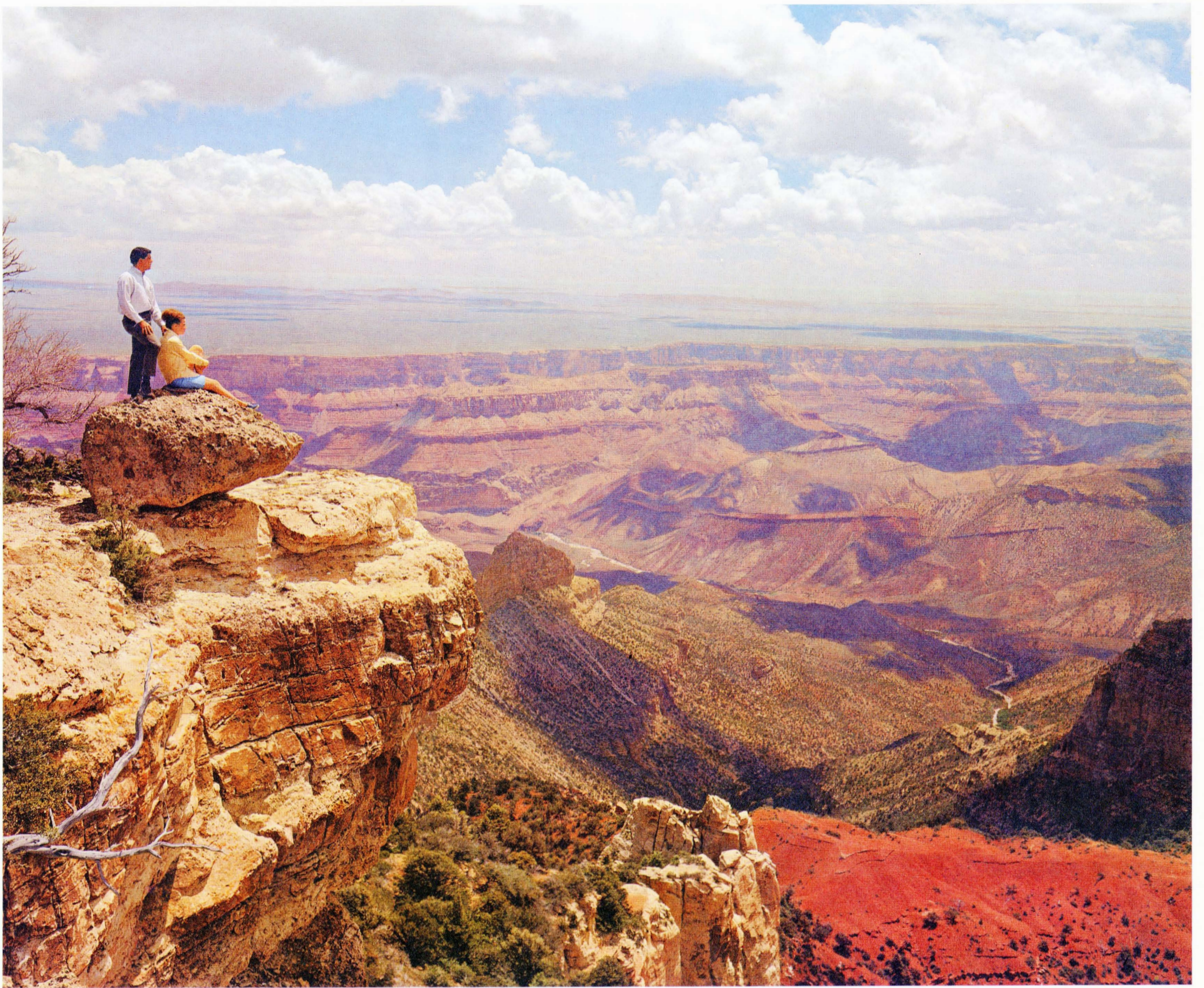
POINT IMPERIAL, GRAND CANYON...A HAUNTING PANORAMA FROM THE NORTH RIM—ARIZONA