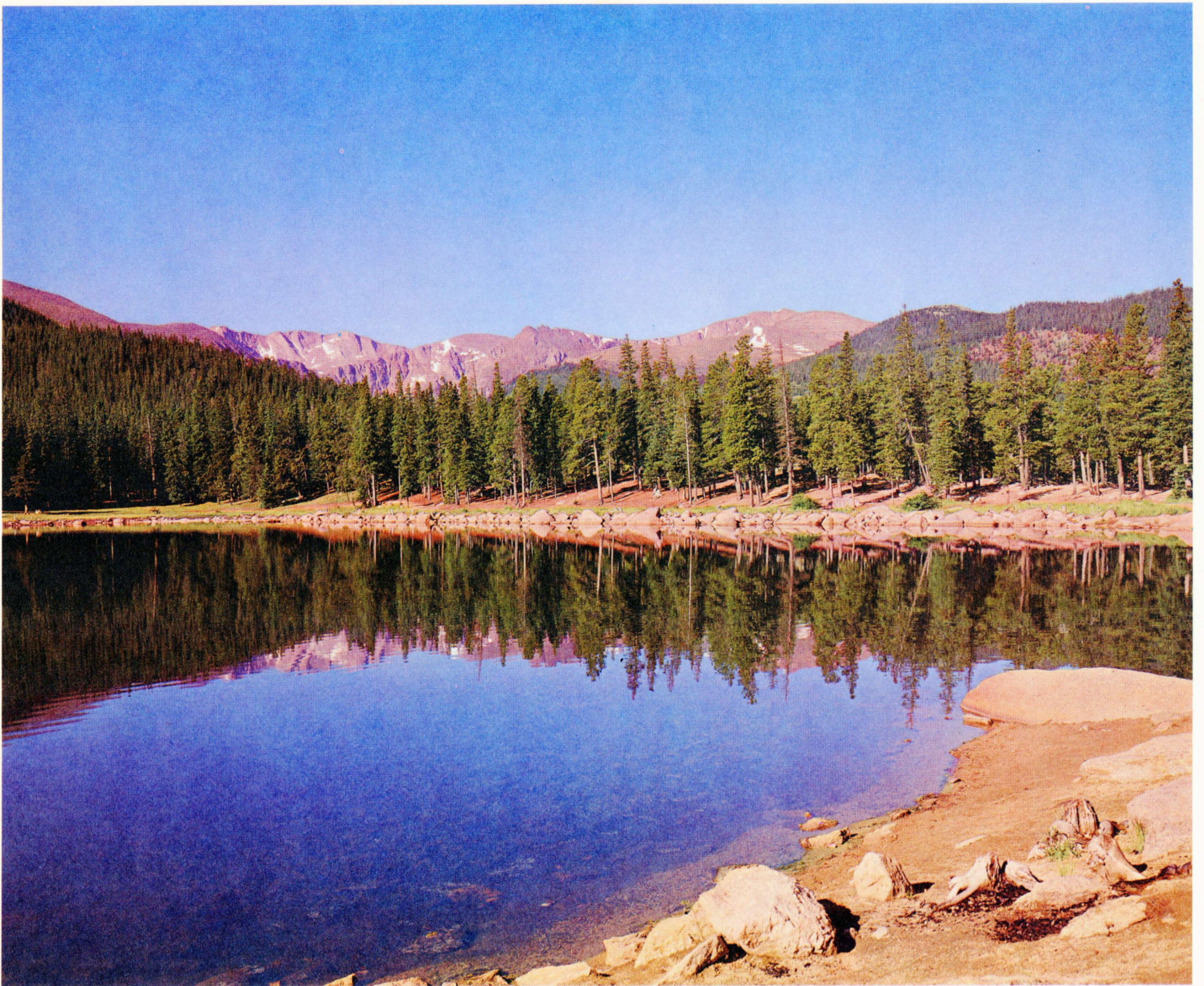
SPARKLING CLEAR WATER AND PINE RIMMED LAKES TYPIFY COLORADO