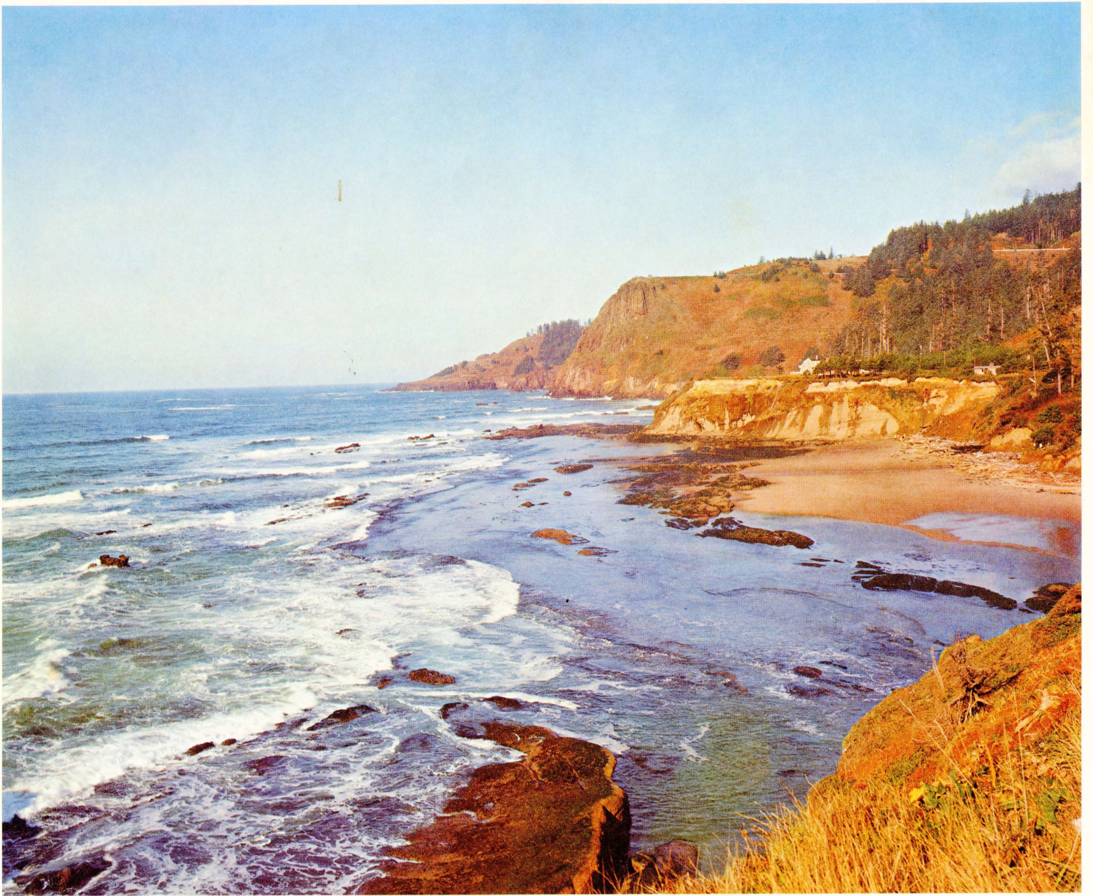
DEVIL'S PUNCH BOWL—OREGON