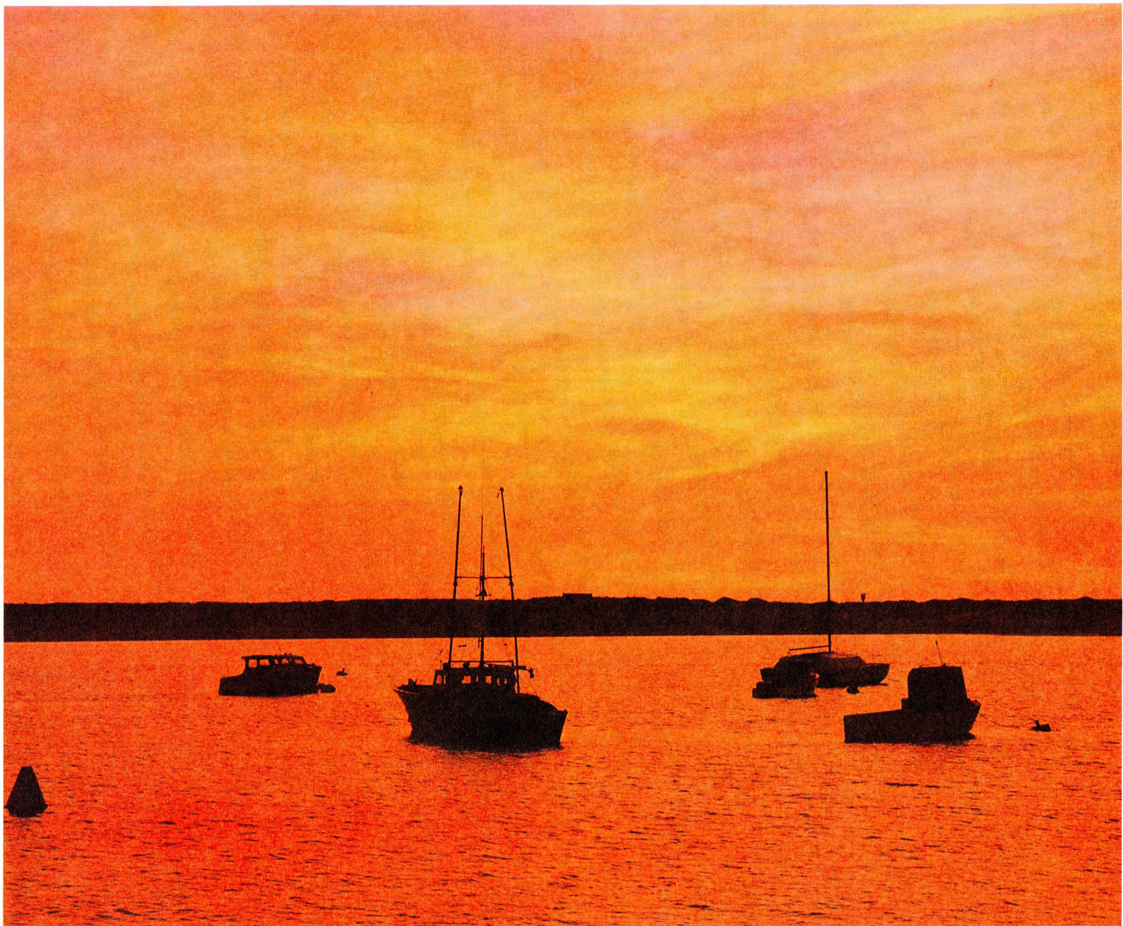
AT DAY'S END, MOMENTS OF MAGIC LINGER—MORRO BAY, CALIFORNIA