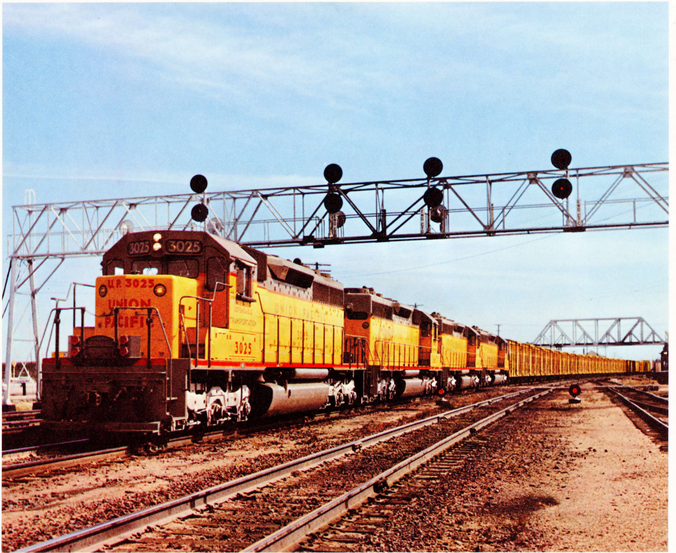
THE MODERN IRON HORSE SPEEDS AMERICAN COMMERCE THROUGH OLD CHEYENNE