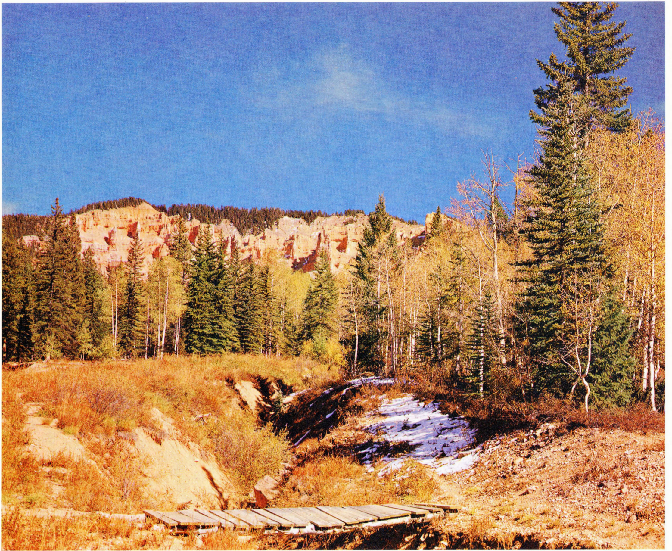
A DUSTING OF SNOW, A TANG IN THE AIR, WINTER IS NOT FAR OFF—CEDAR MOUNTAINS, UTAH