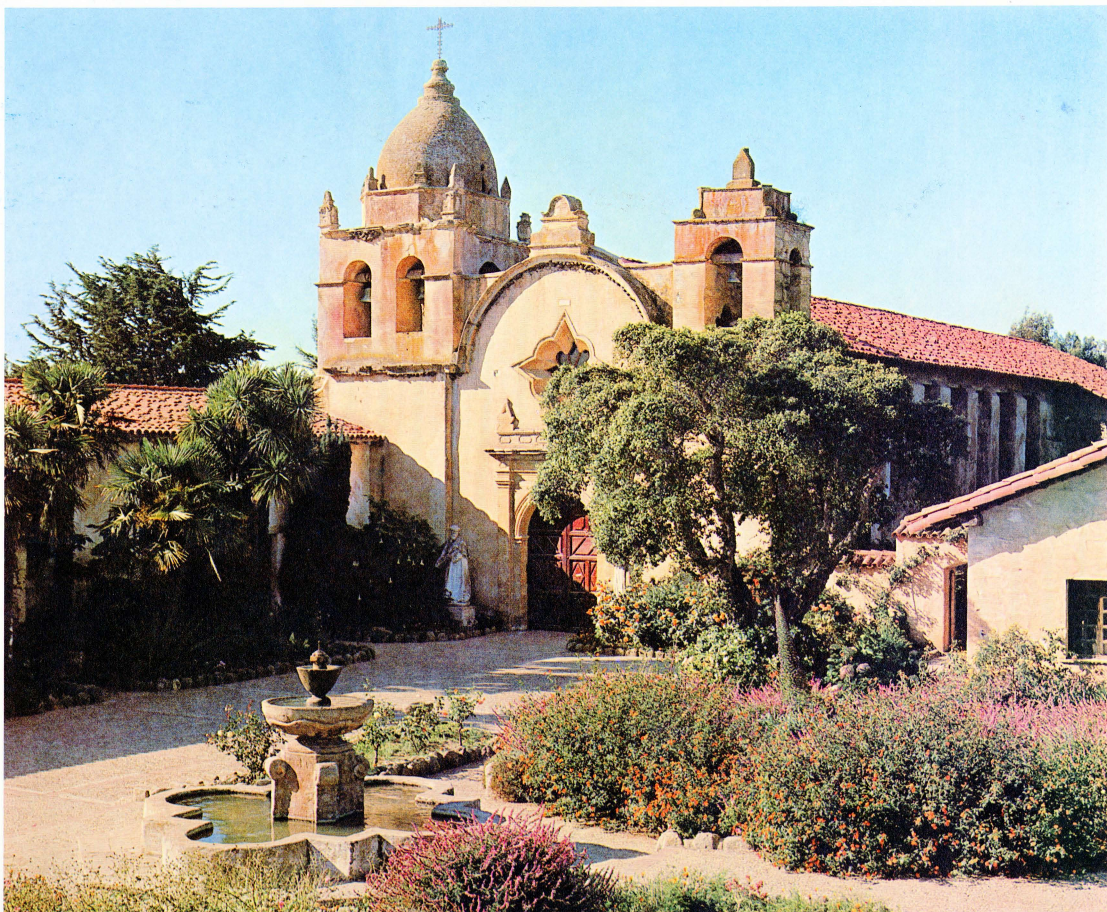
PICTURESQUE AND BEAUTIFUL—MISSION SAN CARLOS DE BORROMEO, CARMEL, CALIFORNIA