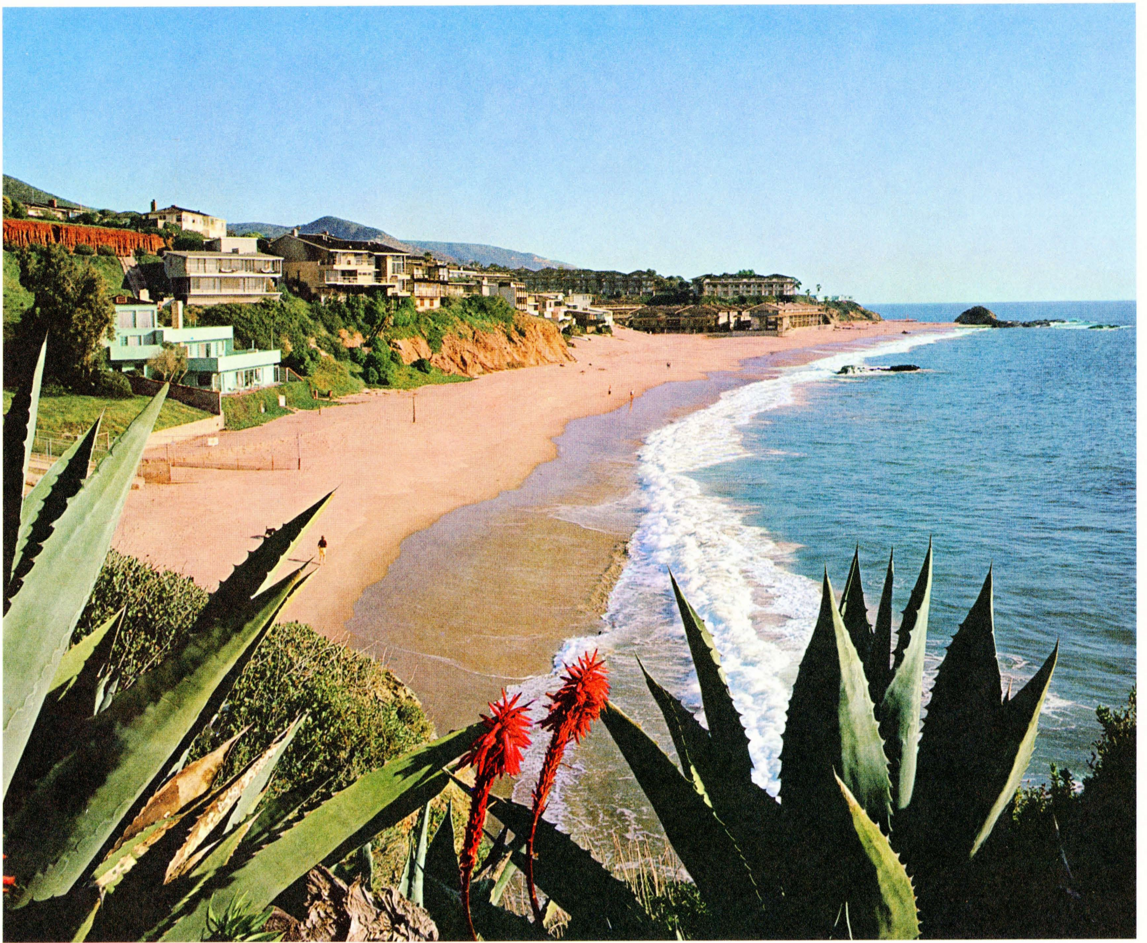
A BEAUTIFUL SETTING FOR RELAXATION, VICTORIA BEACH-LAGUNA, CALIFORNIA