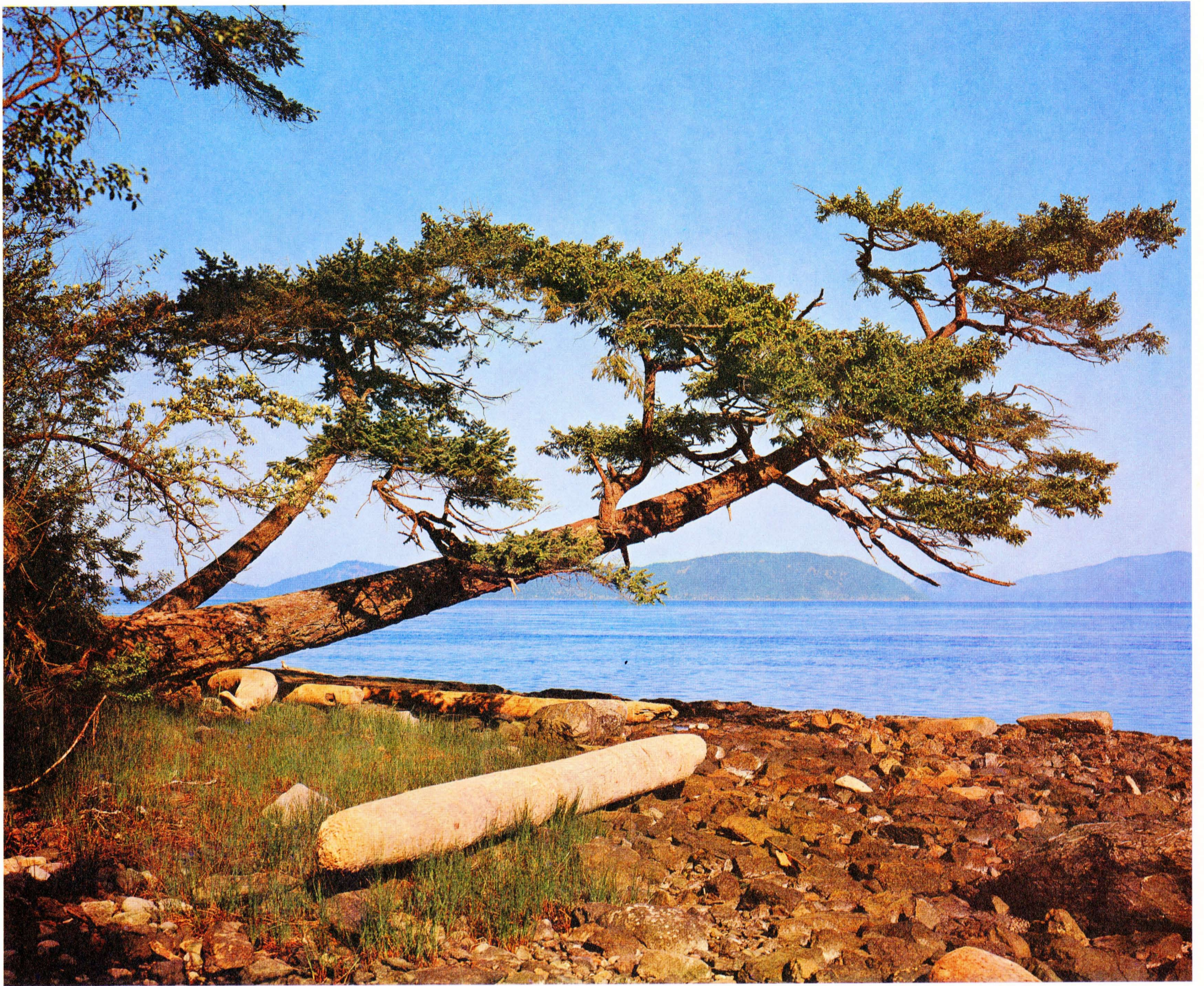
A TRANQUIL VIEW FROM ANACORTES—SAN JUAN ISLAND