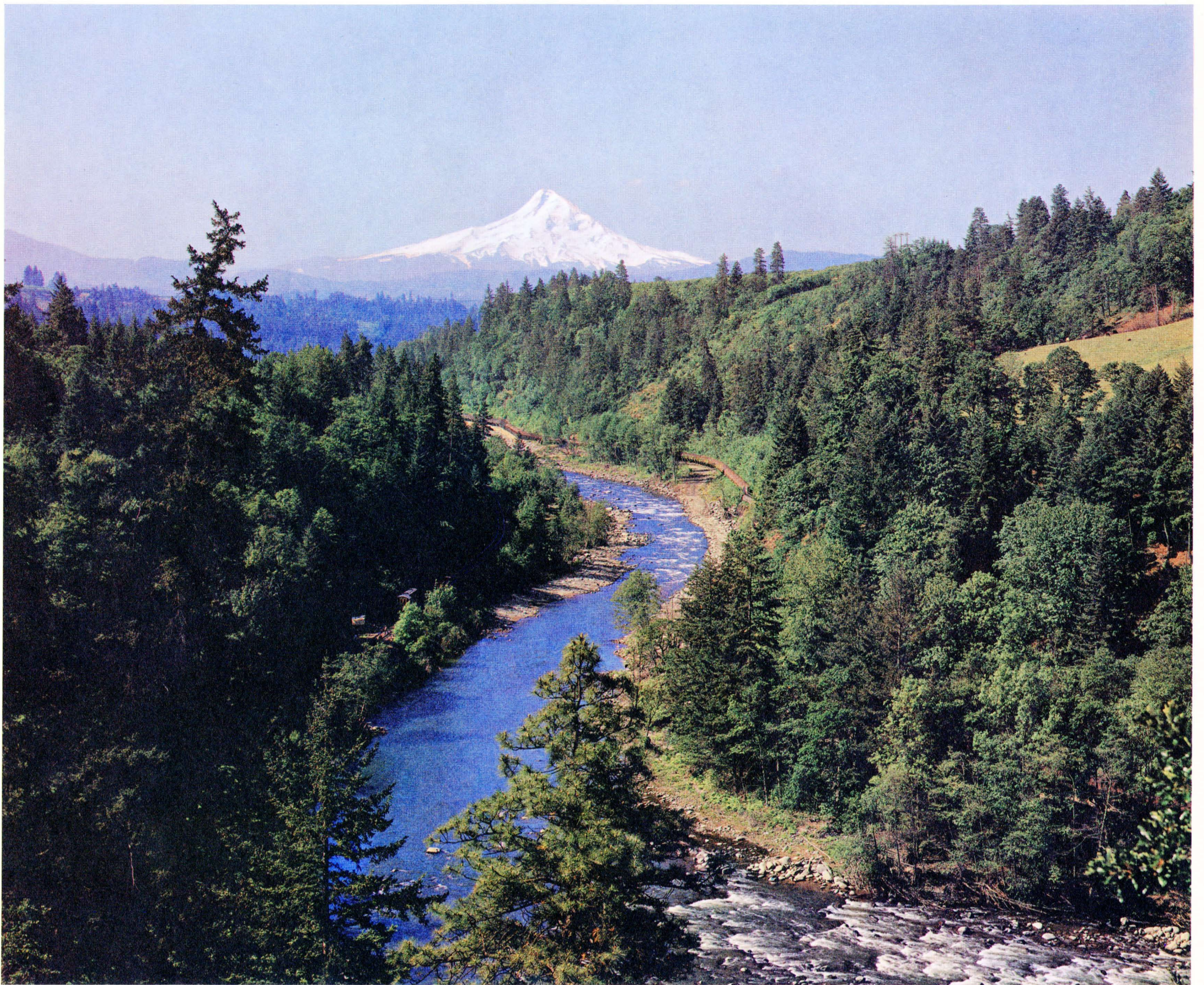
MT. HOOD RULES IN REGAL SPLENDOR OVER THE HOOD RIVER—OREGON