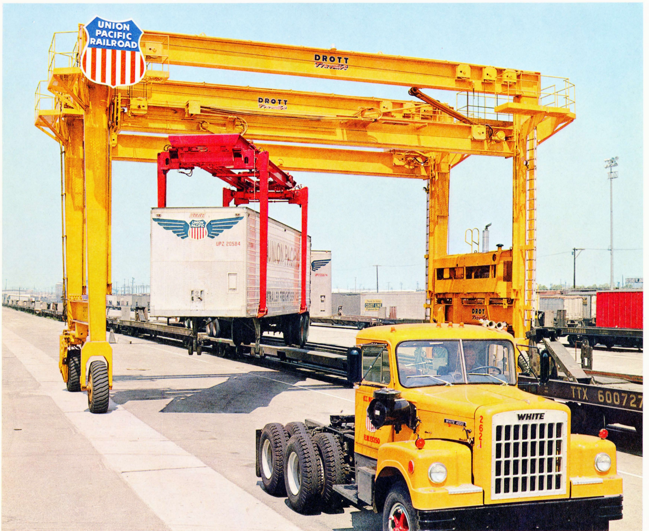
U.P.'S GIANT CRANE HAS THE MUSCLE FOR QUICK, SMOOTH HANDLING OF LOADED TRAILERS OR CONTAINERS