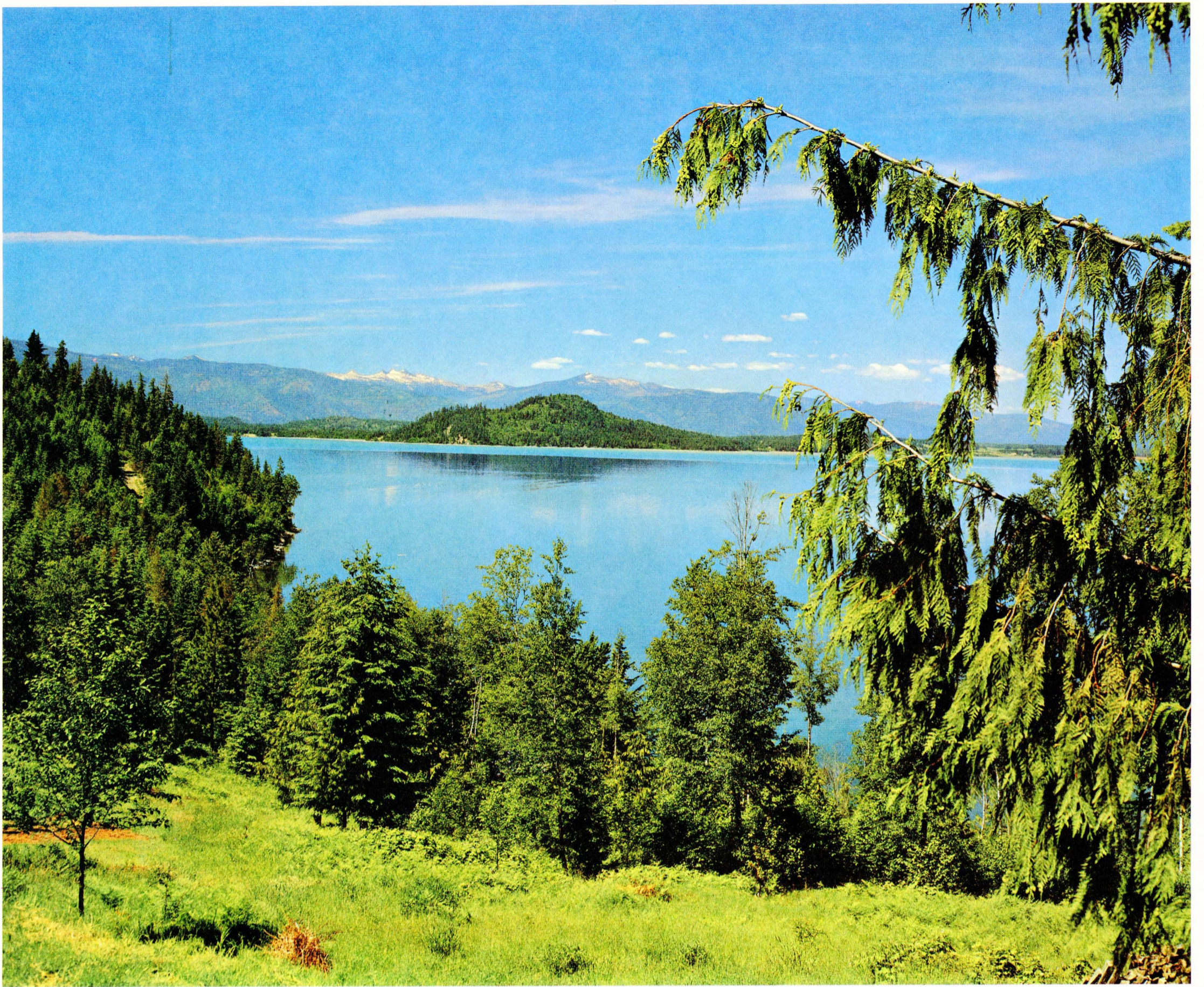
PICTURESQUE AND BEAUTIFUL—LAKE PEND OREILLE, IDAHO