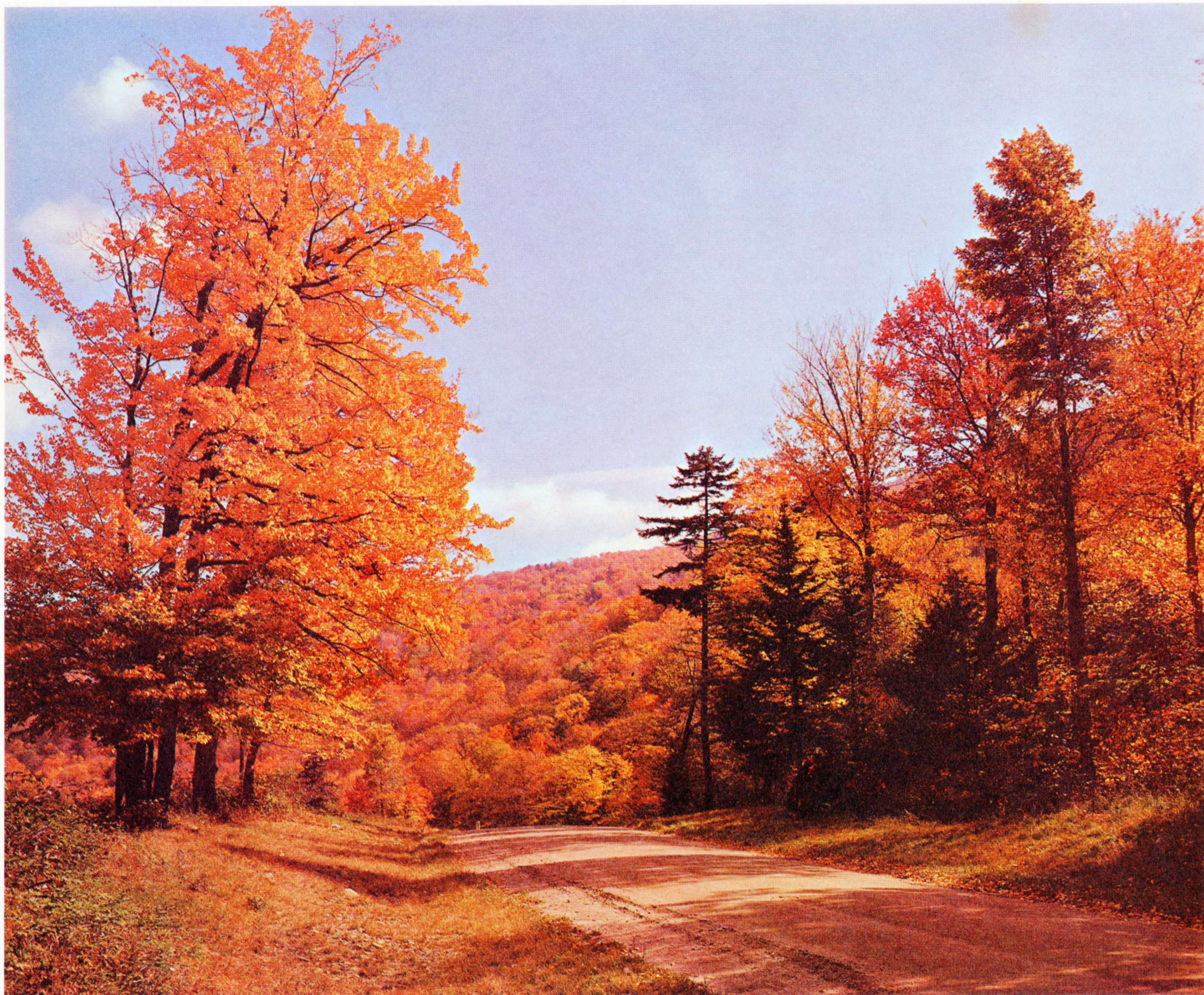
A BLAZE OF GLORIOUS COLOR HERALDS APPROACHING WINTER IN NEW ENGLAND