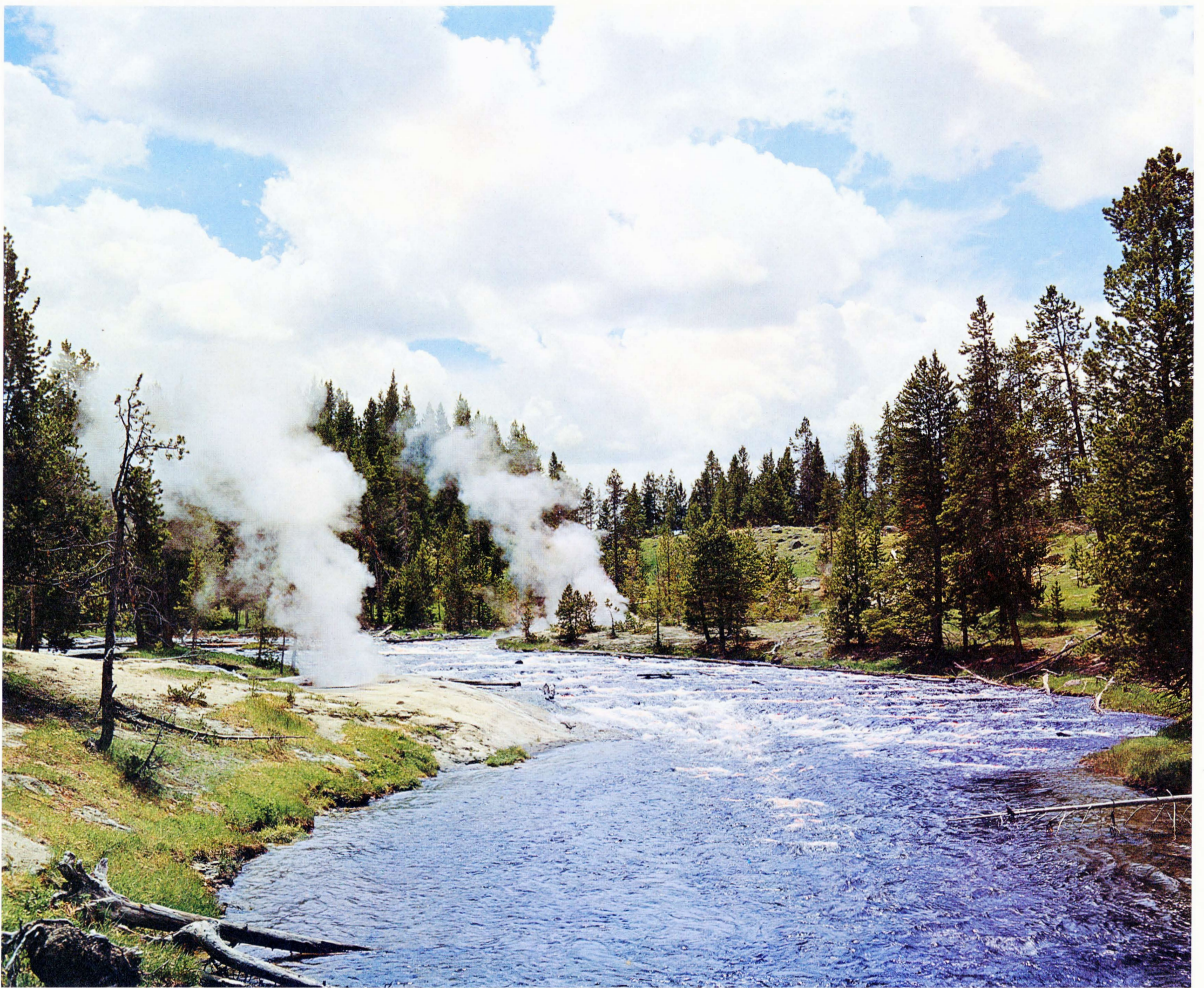
FIREHOLE RIVER FLOWS COLD AND CLEAR PAST STEAMING GEYSERS IN YELLOWSTONE NATIONAL PARK