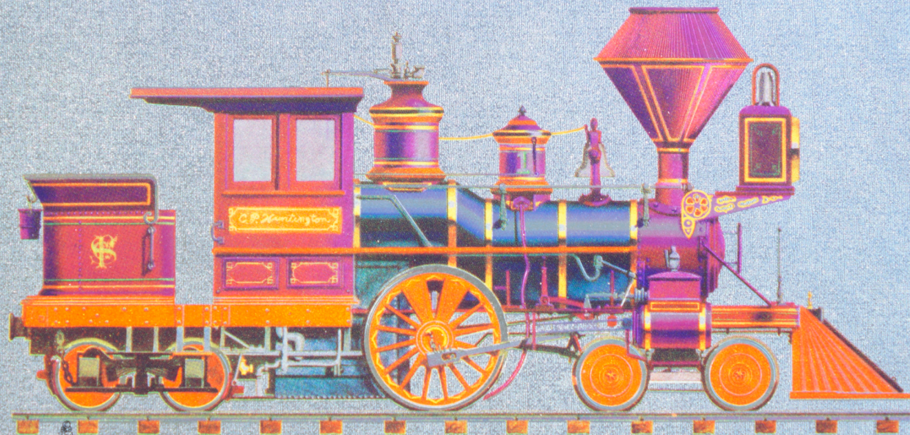
C. P. HUNTINGTON 1863

A pioneer of the Central and Southern Pacific Lines.