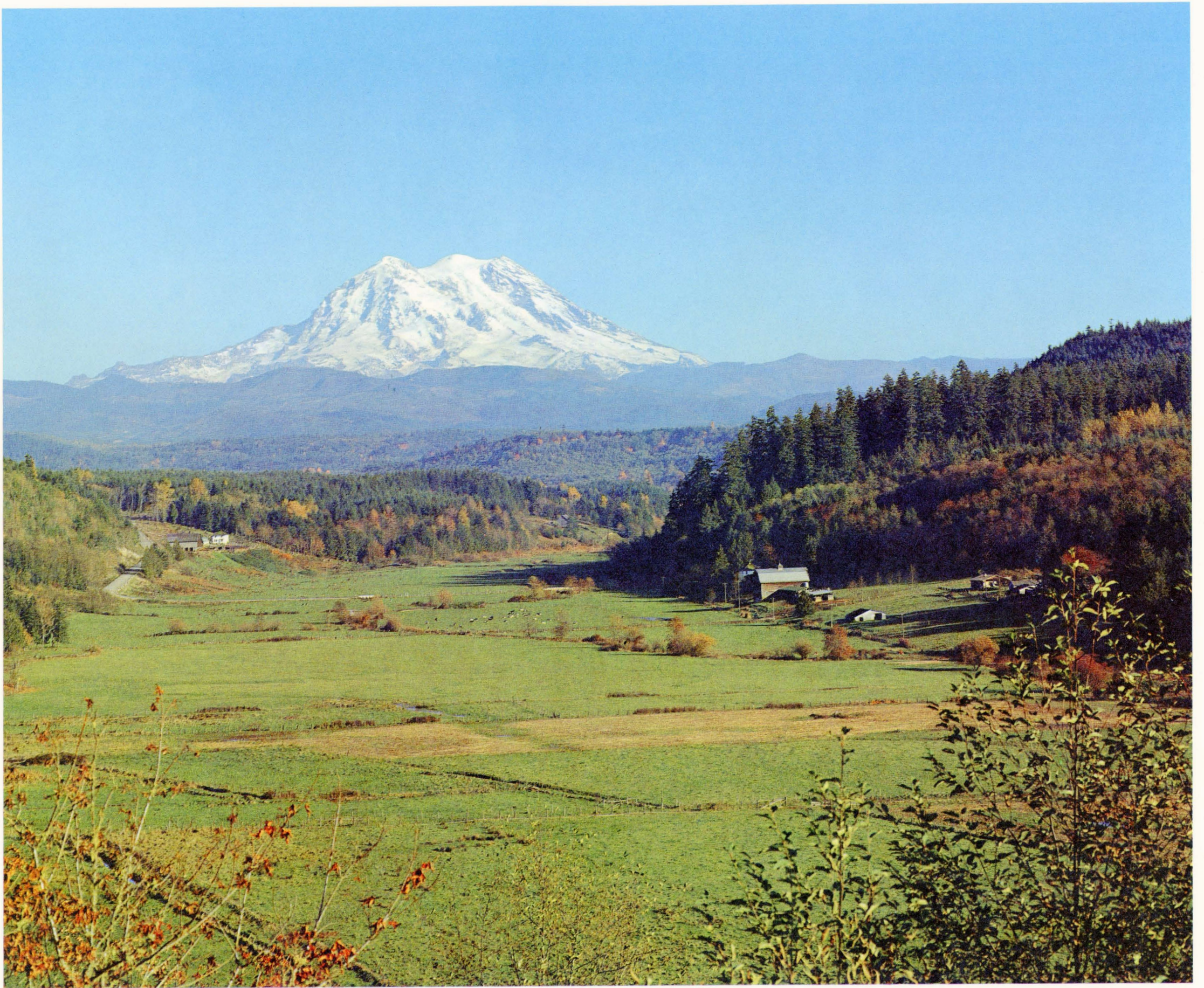
MT. RAINIER FROM OHOP VALLEY, WASHINGTON