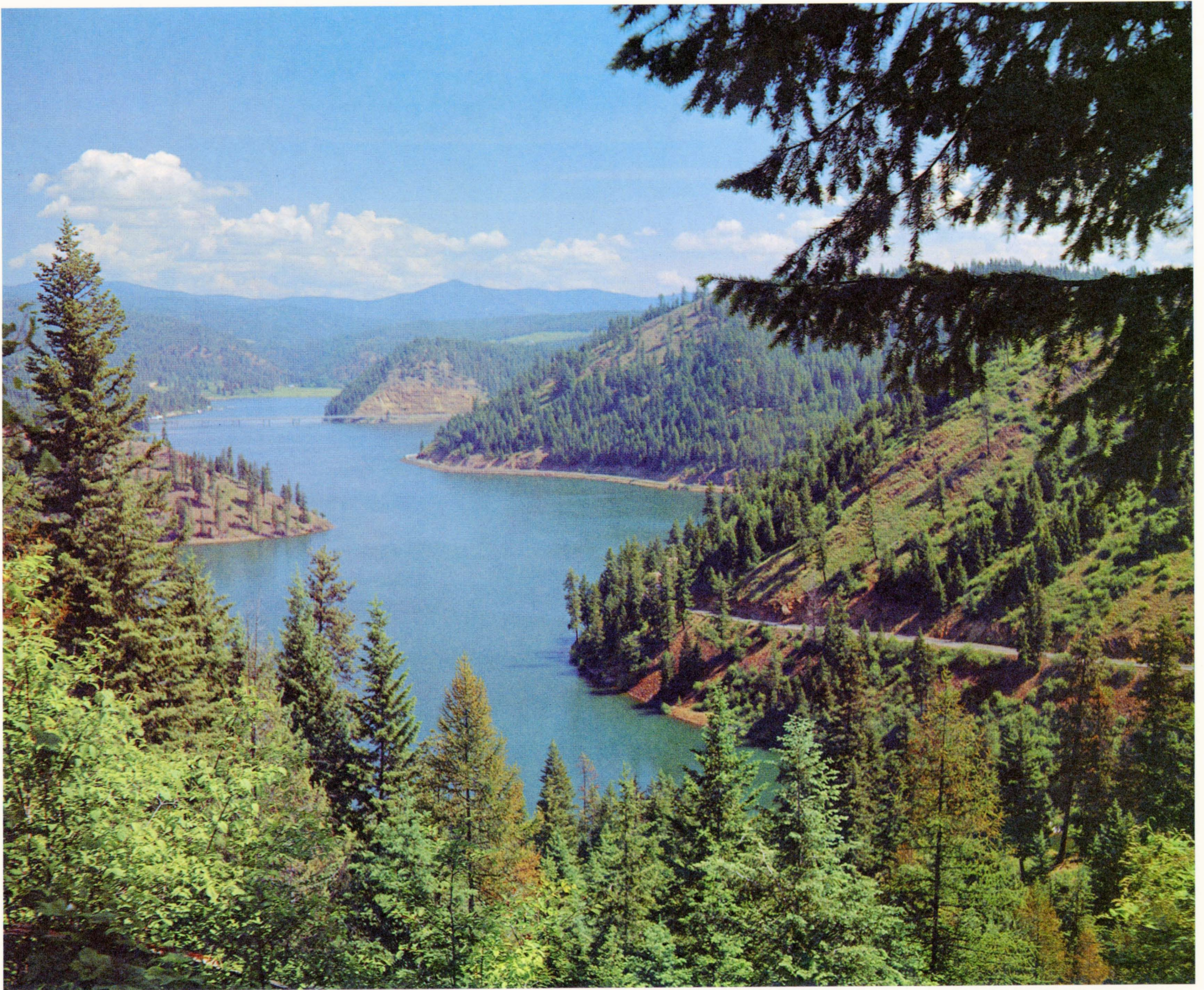
LAKE COEUR D'ALENE, IDAHO