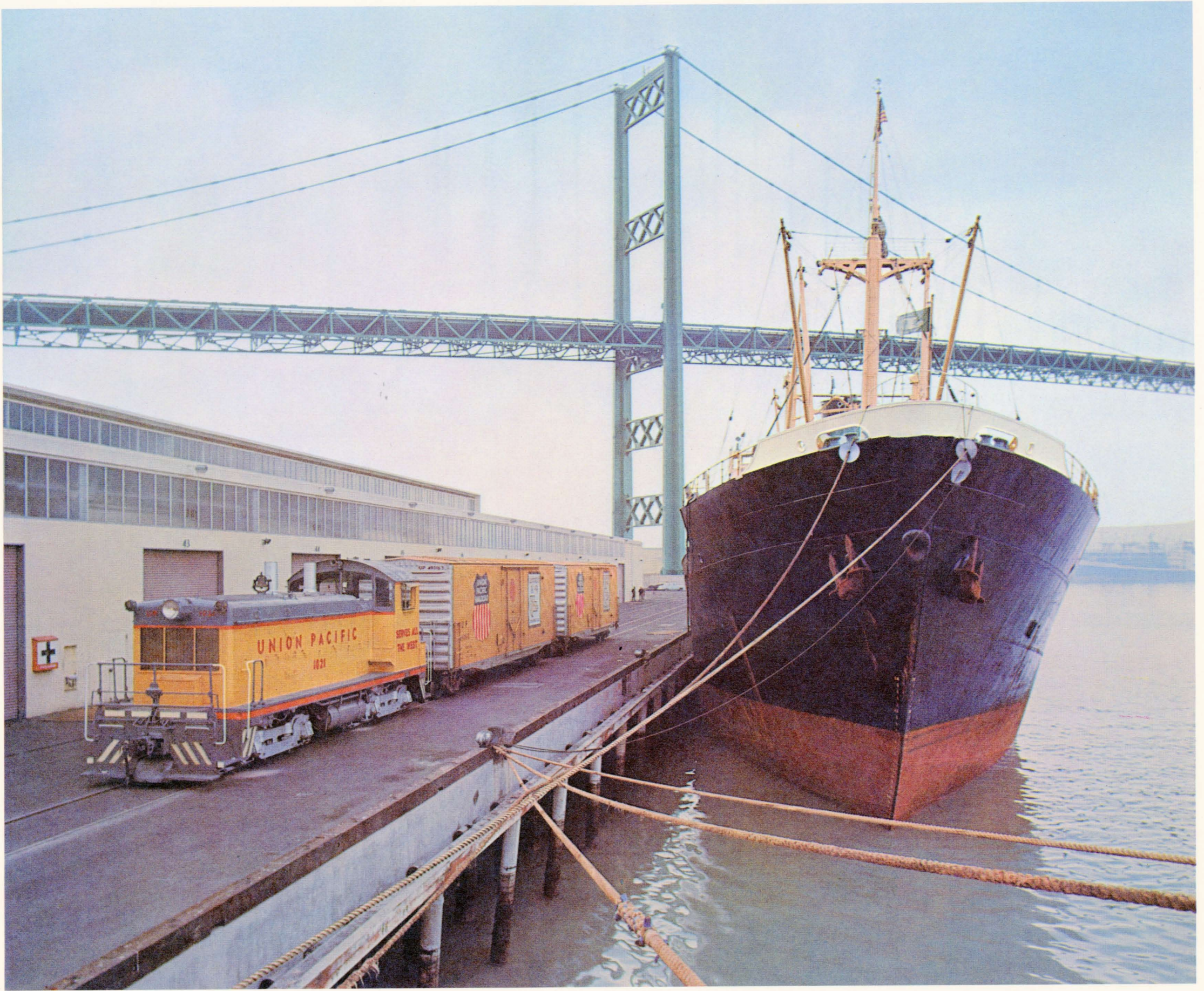
U. P. SERVES MORE WEST COAST PORTS TO PROVIDE TRULY WORLD-WIDE SERVICE