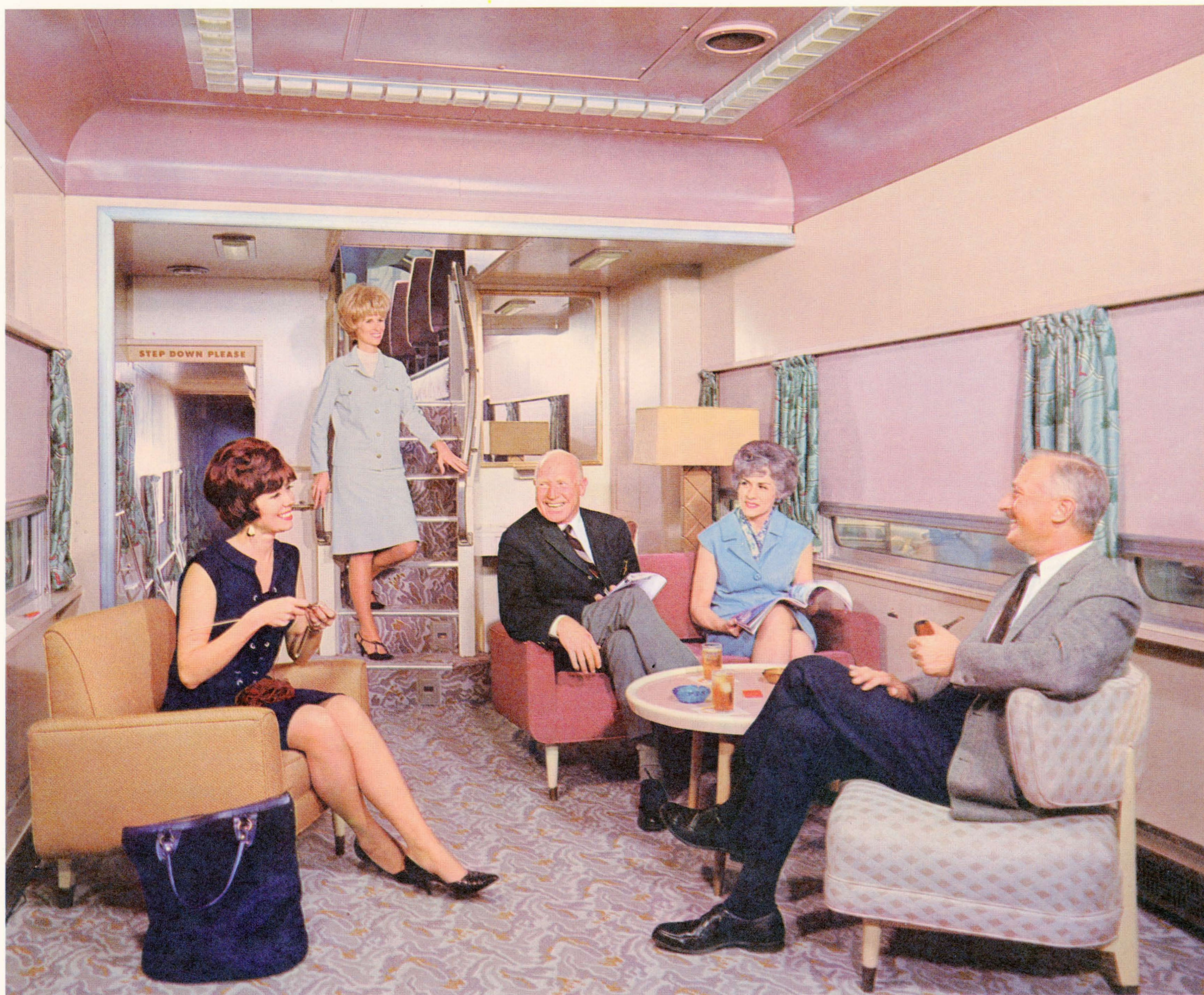
ALL THE LUXURIES OF MODERN TRAIN TRAVEL ARE YOURS TO ENJOY WHEN YOU GO U. P. DOMELINERS