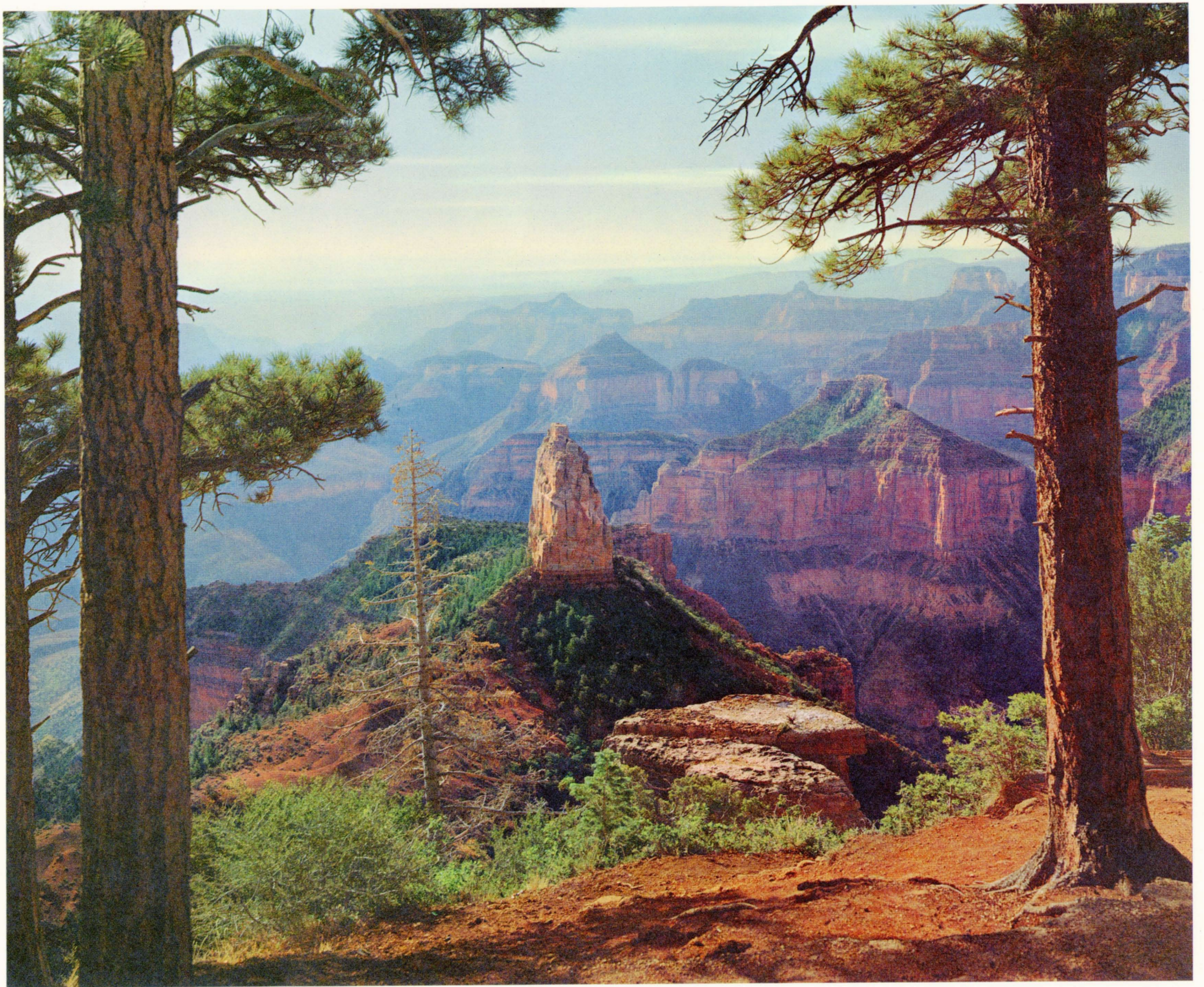
BRIGHAM'S BUTTE, GRAND CANYON NATIONAL PARK