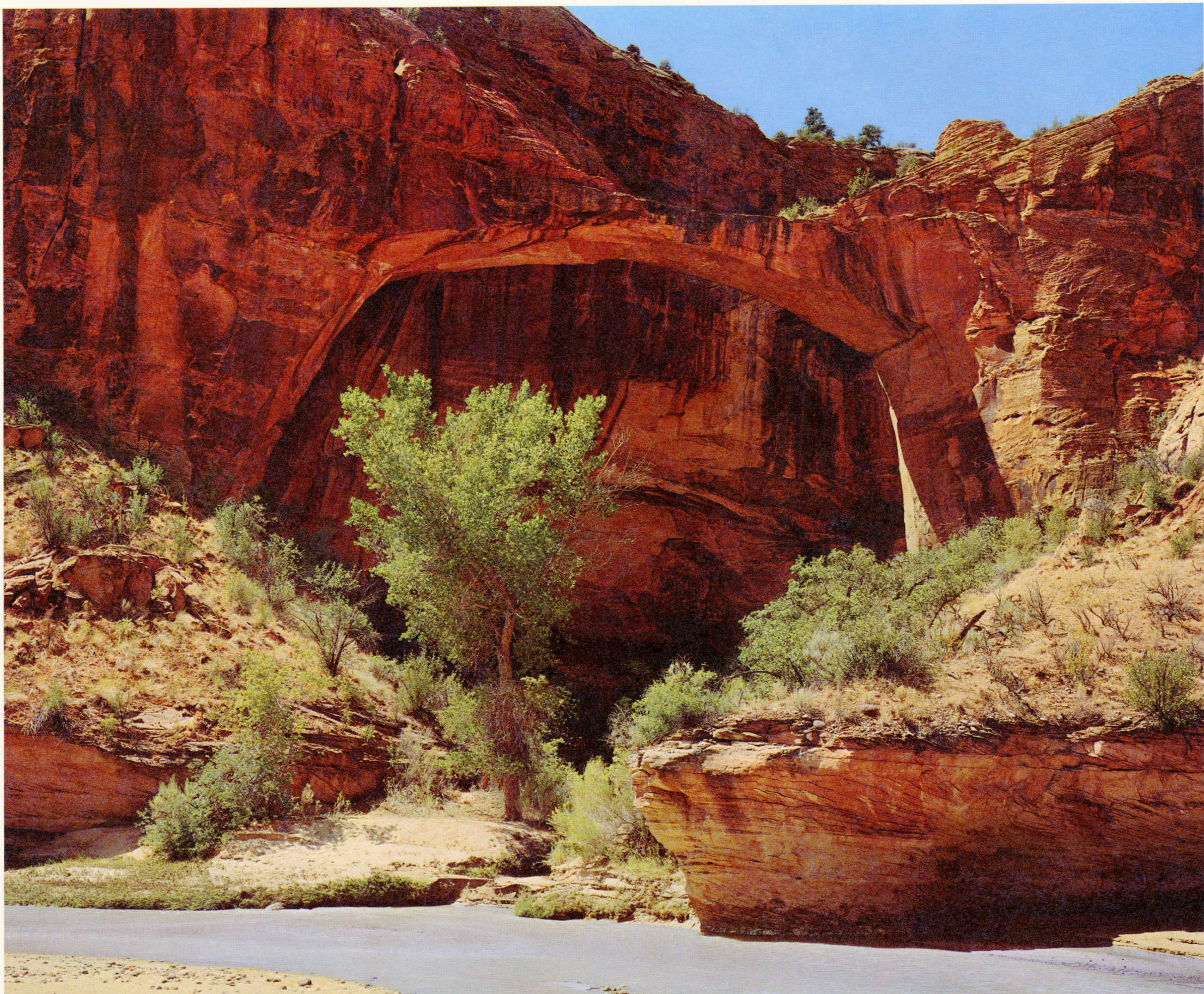
NATURAL ARCH, ESCALANTE CANYON, UTAH