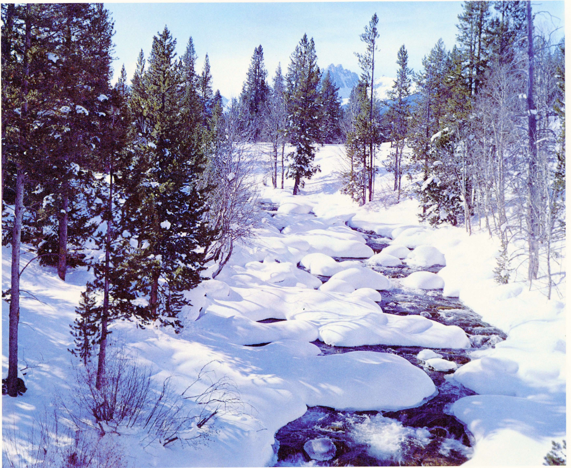
RED FISH CREEK, IDAHO