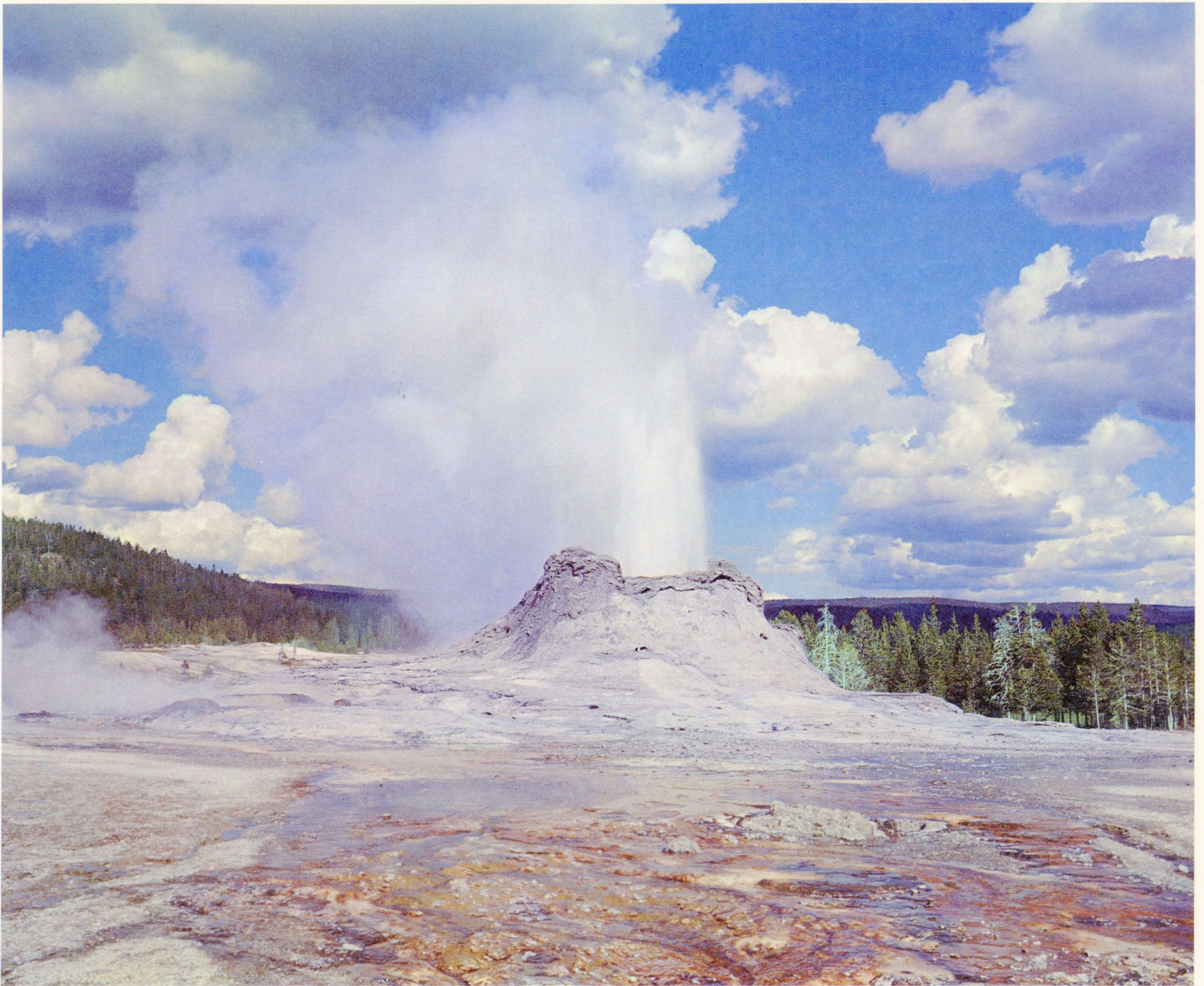
CASTLE GEYSER, YELLOWSTONE NATIONAL PARK