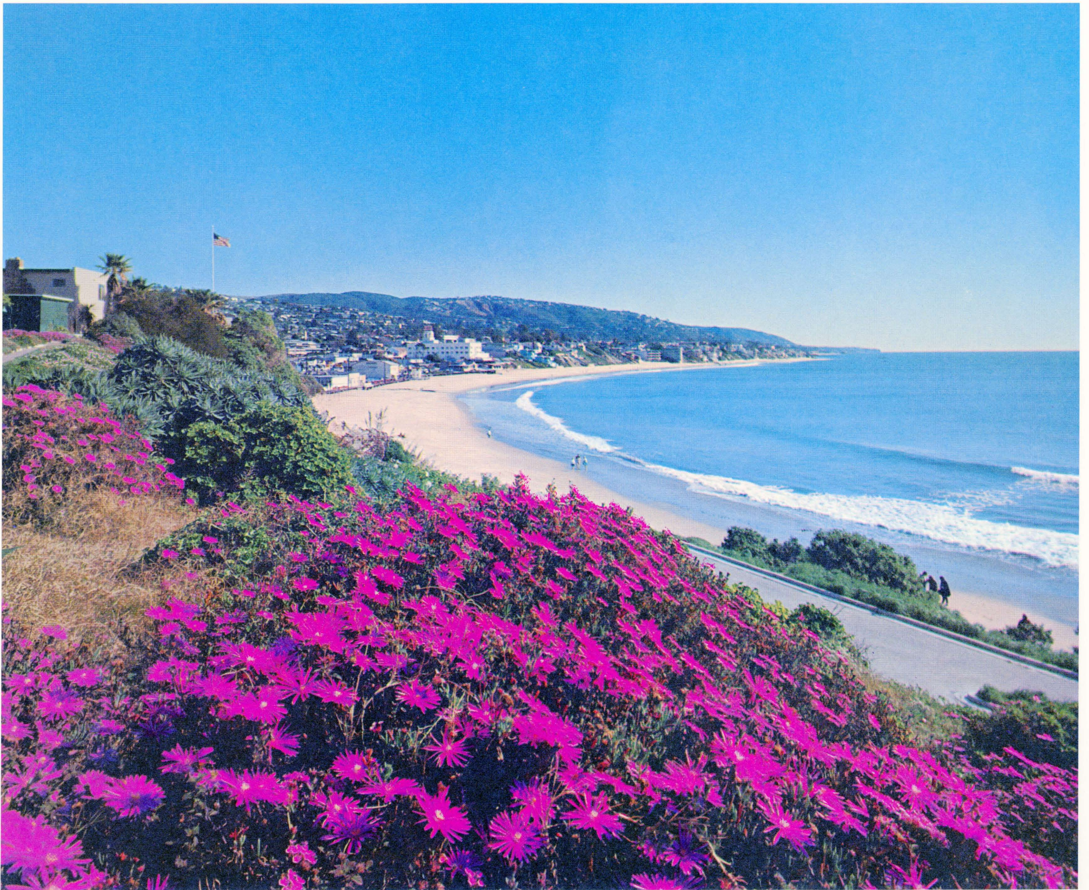
LAGUNA BEACH, CALIFORNIA