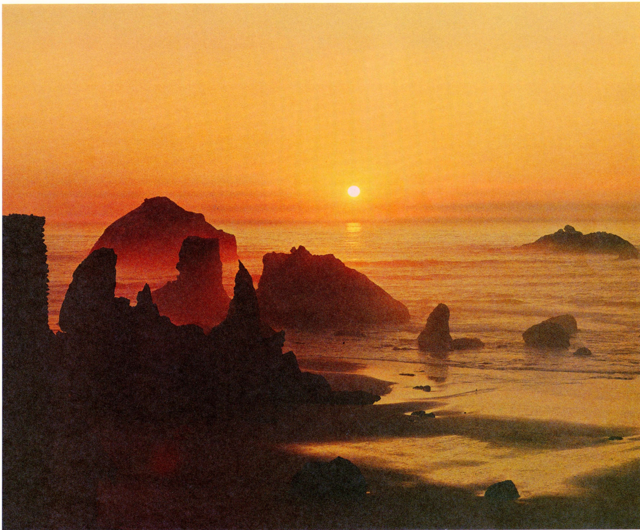
SUNSET AT BANDON, OREGON