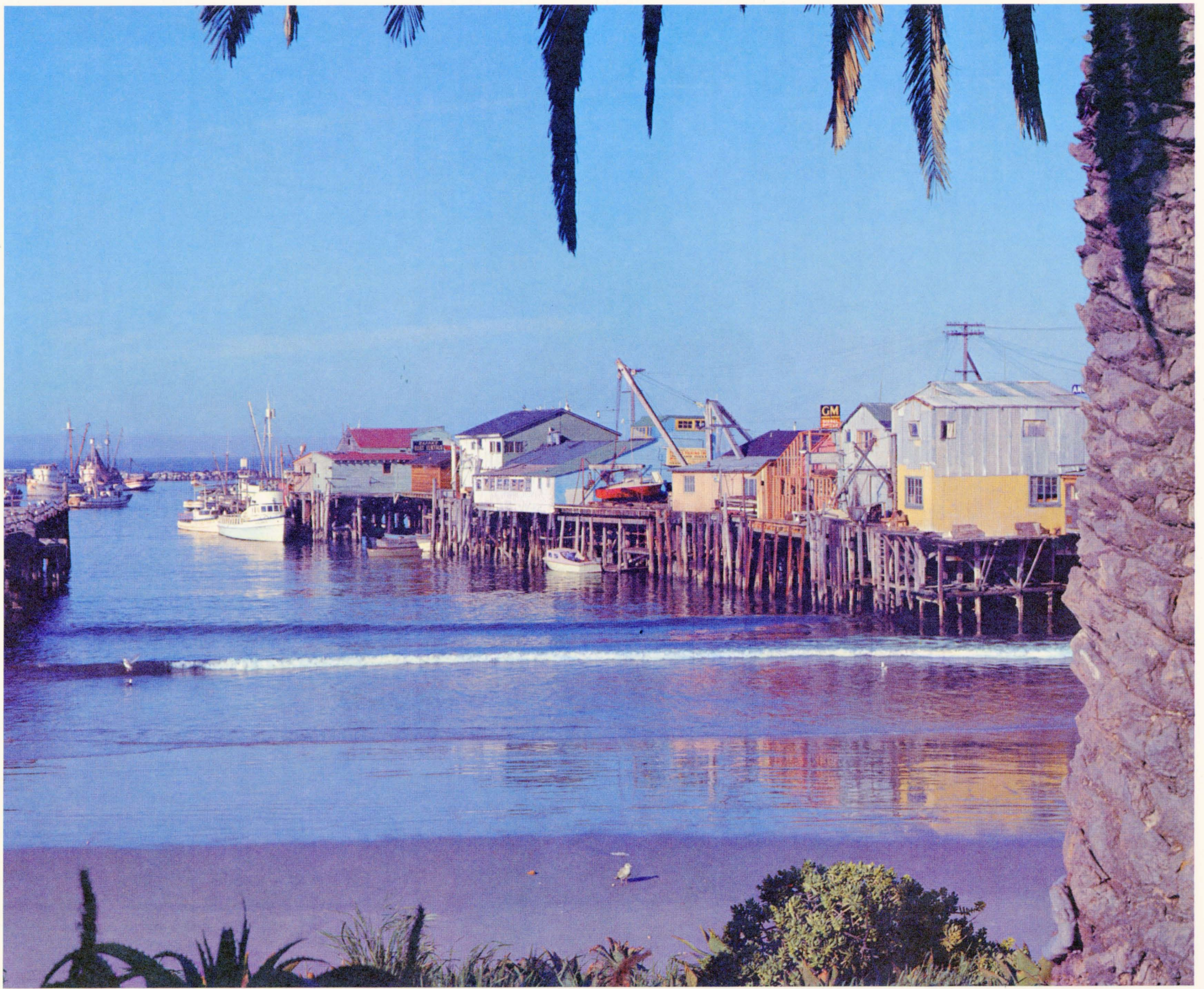
MONTEREY HARBOR, CALIFORNIA