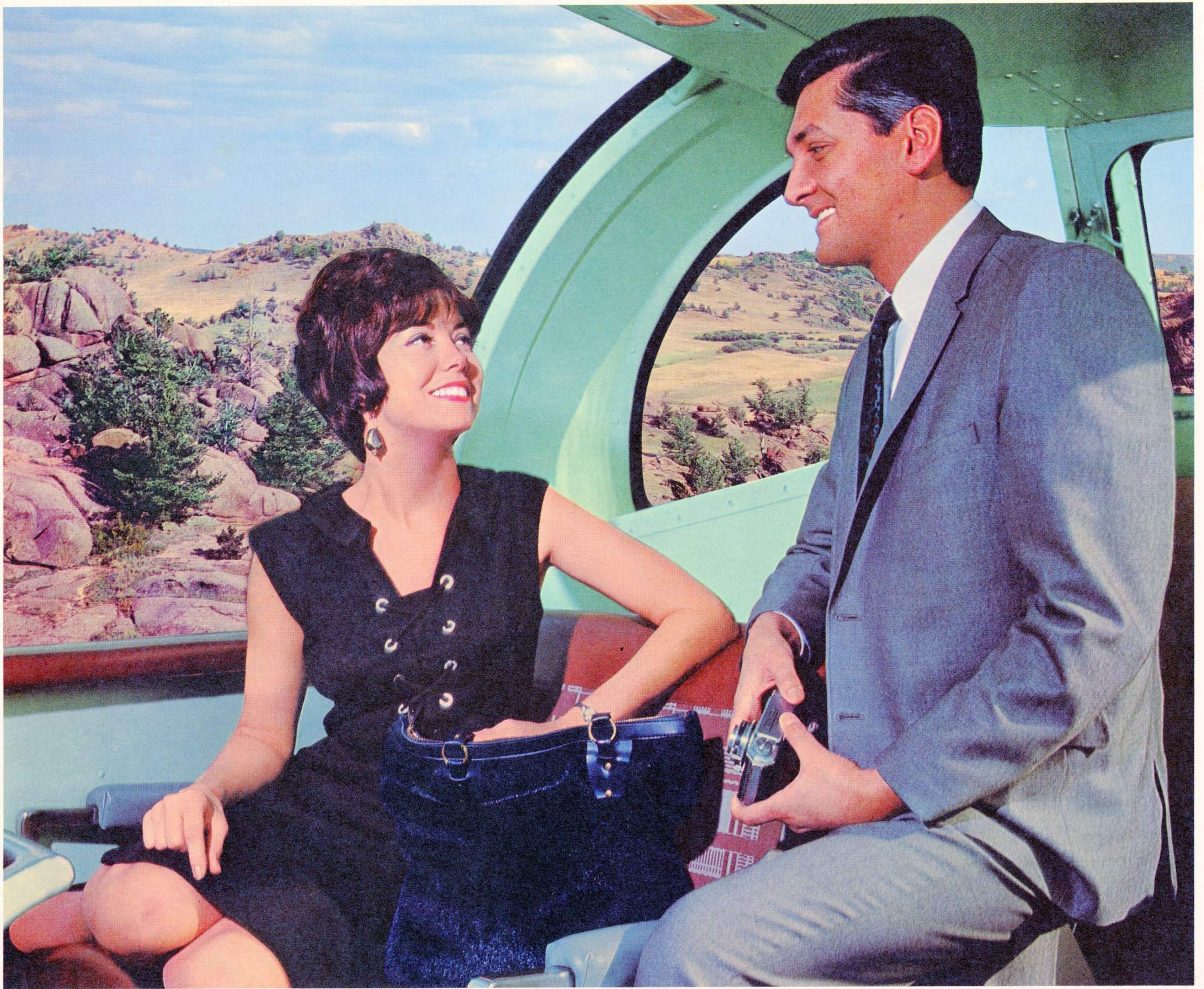
SEE LEVEL VIEWS ADD MUCH TO THE ROMANCE OF TRAVEL BY U. P. DOMELINER