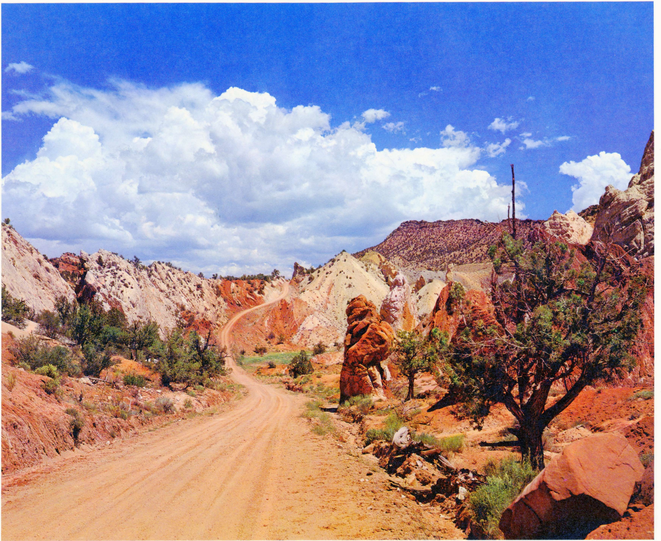
COTTONWOOD WASH, UTAH