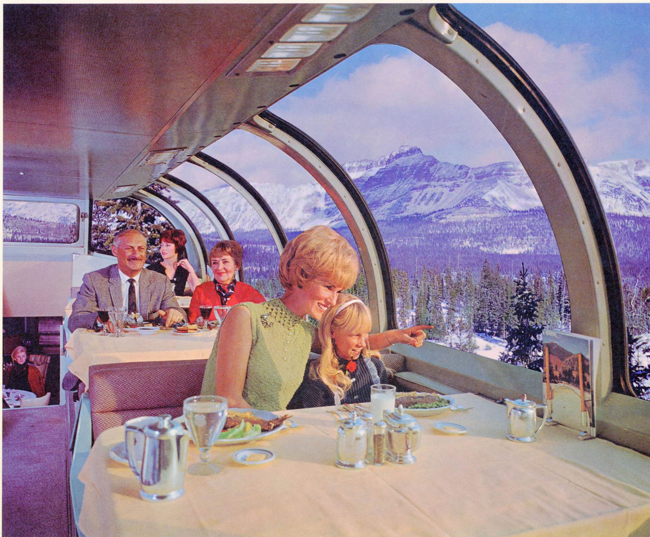
GOING HOME FOR CHRISTMAS... BY DOMELINER