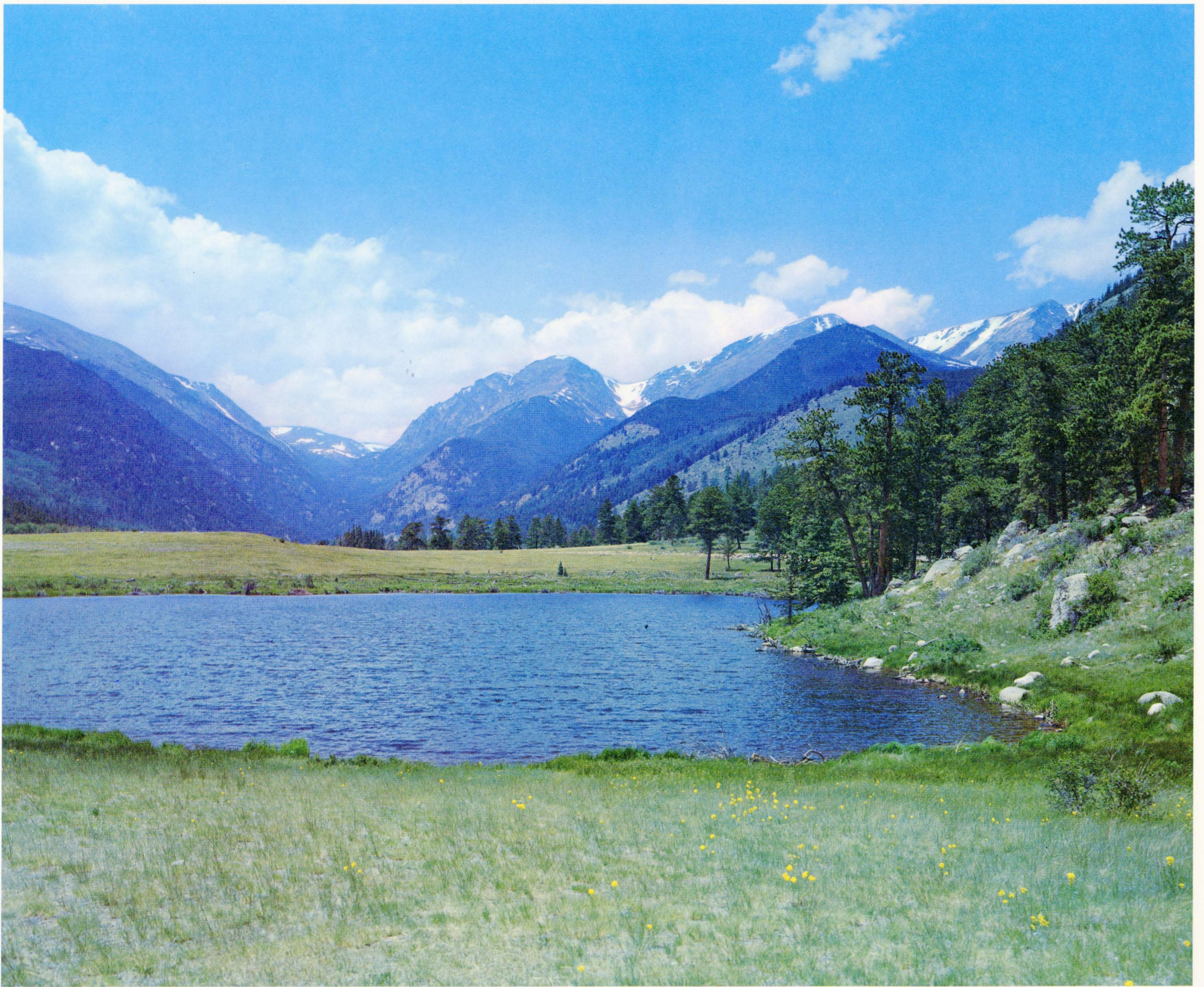
MUMMY RANGE, ROCKY MOUNTAIN NATIONAL PARK