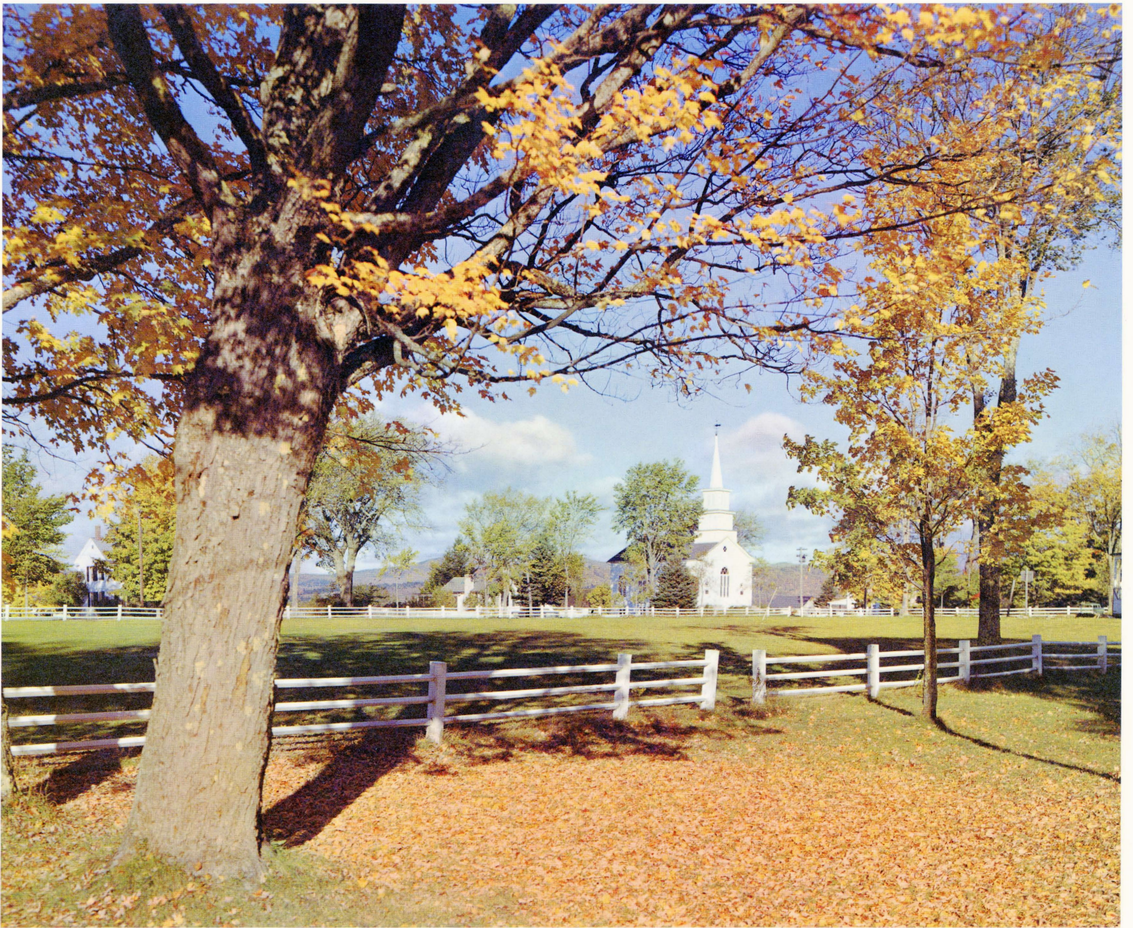
CRAFTSBURY COMMONS, VERMONT