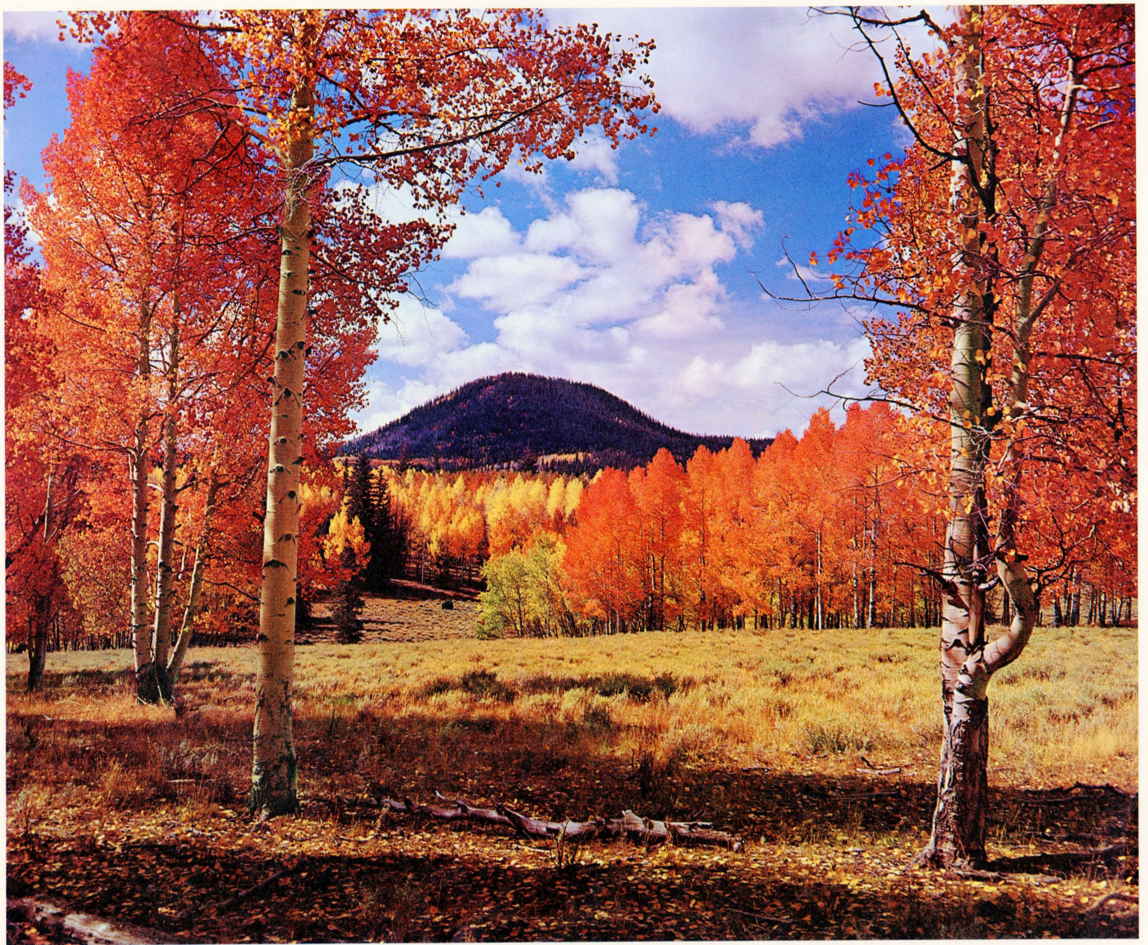
CASTLE VALLEY, NEAR ZION NATIONAL PARK, UTAH