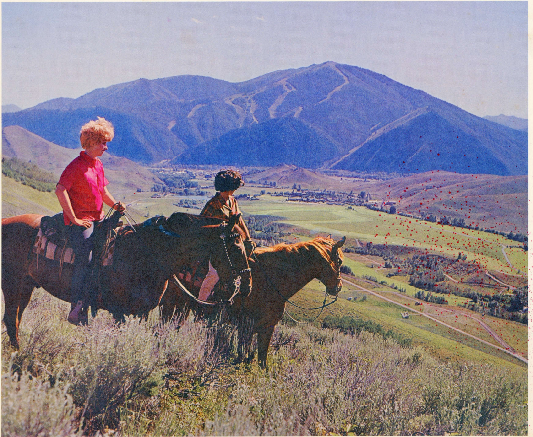
SUMMER IN SUN VALLEY, IDAHO