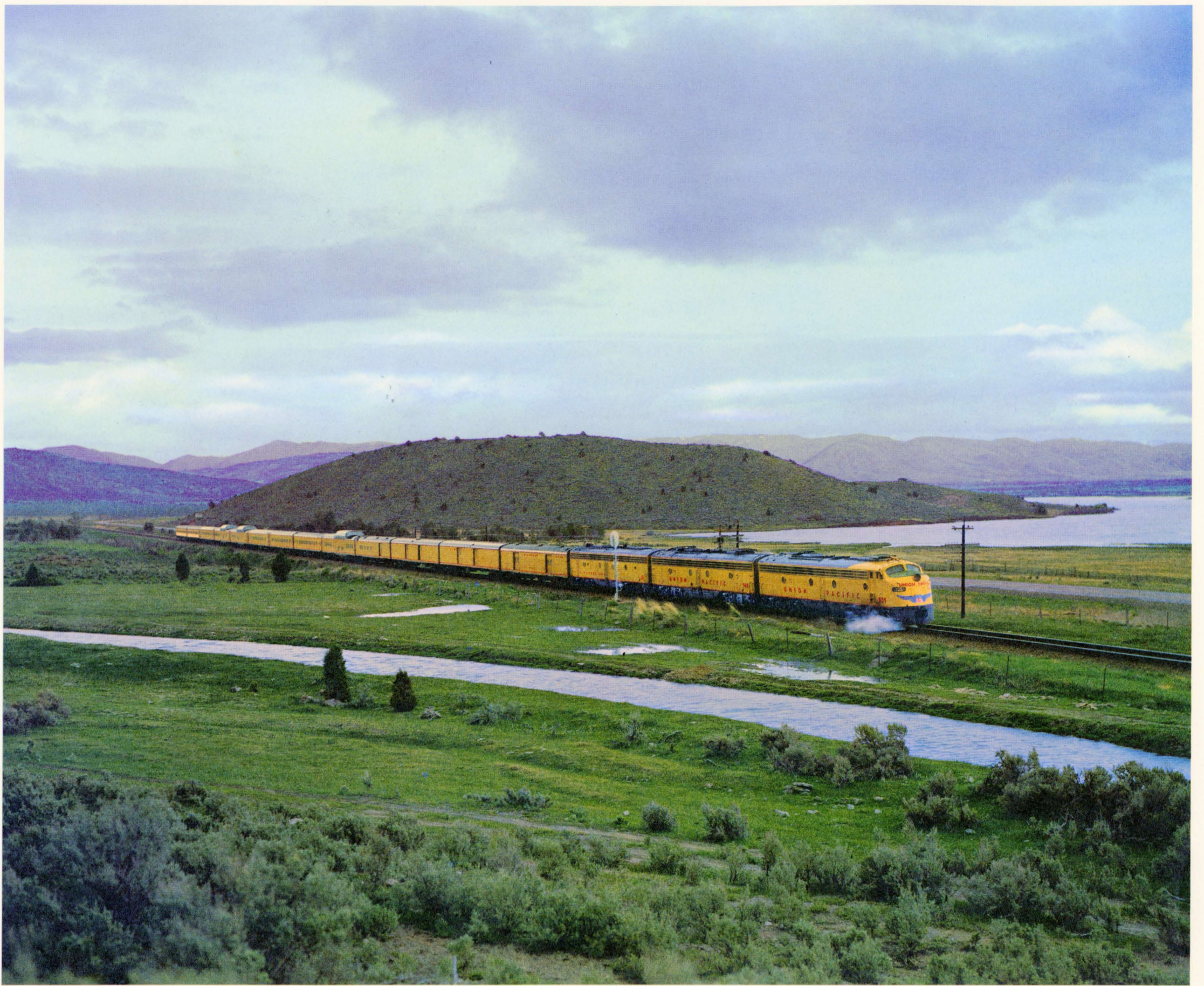
"CITY OF PORTLAND" WESTBOUND FROM SODA SPRINGS