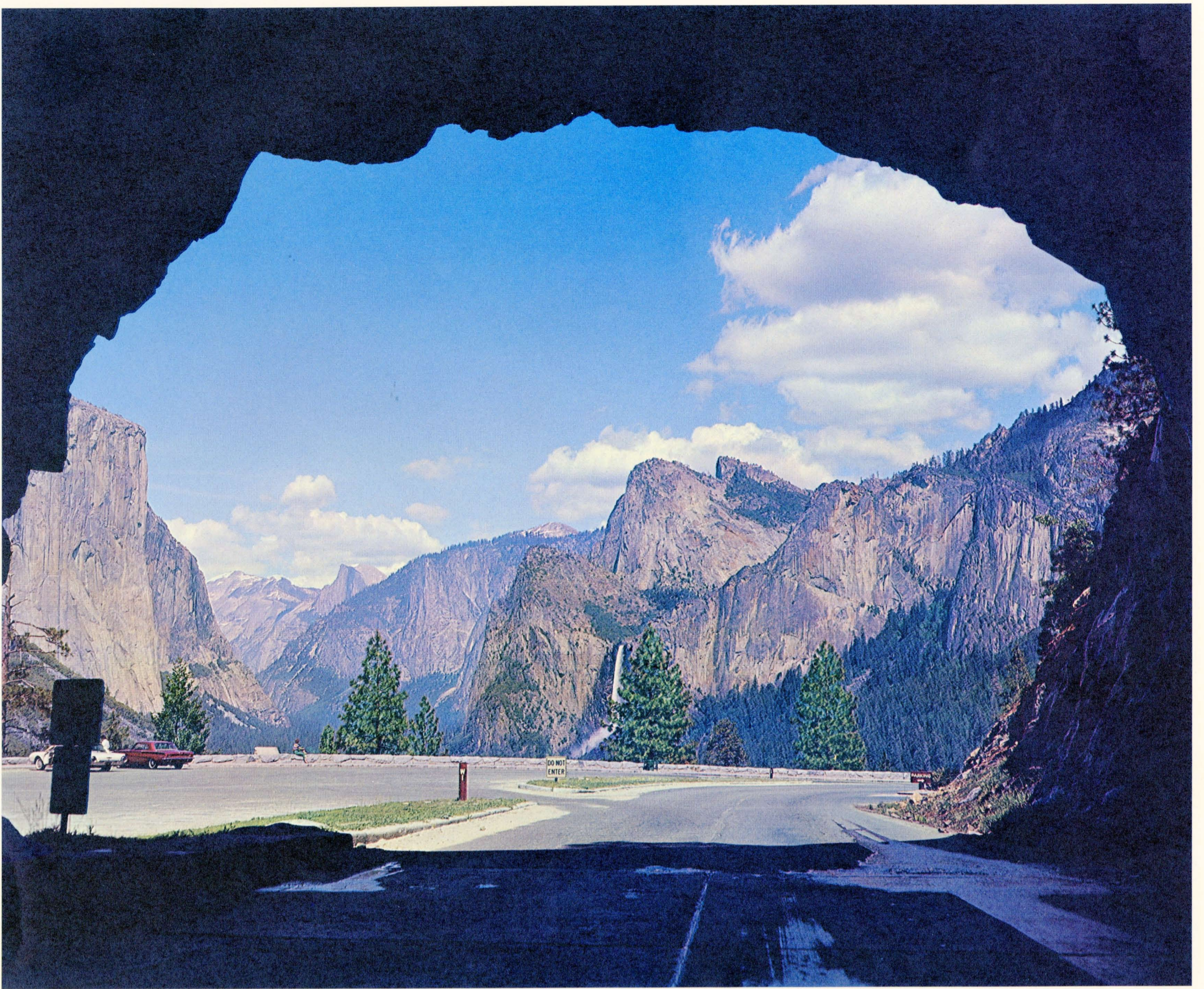
BRIDAL VEIL FALLS FROM WAWONA TUNNEL, YOSEMITE NATIONAL PARK, CALIFORNIA