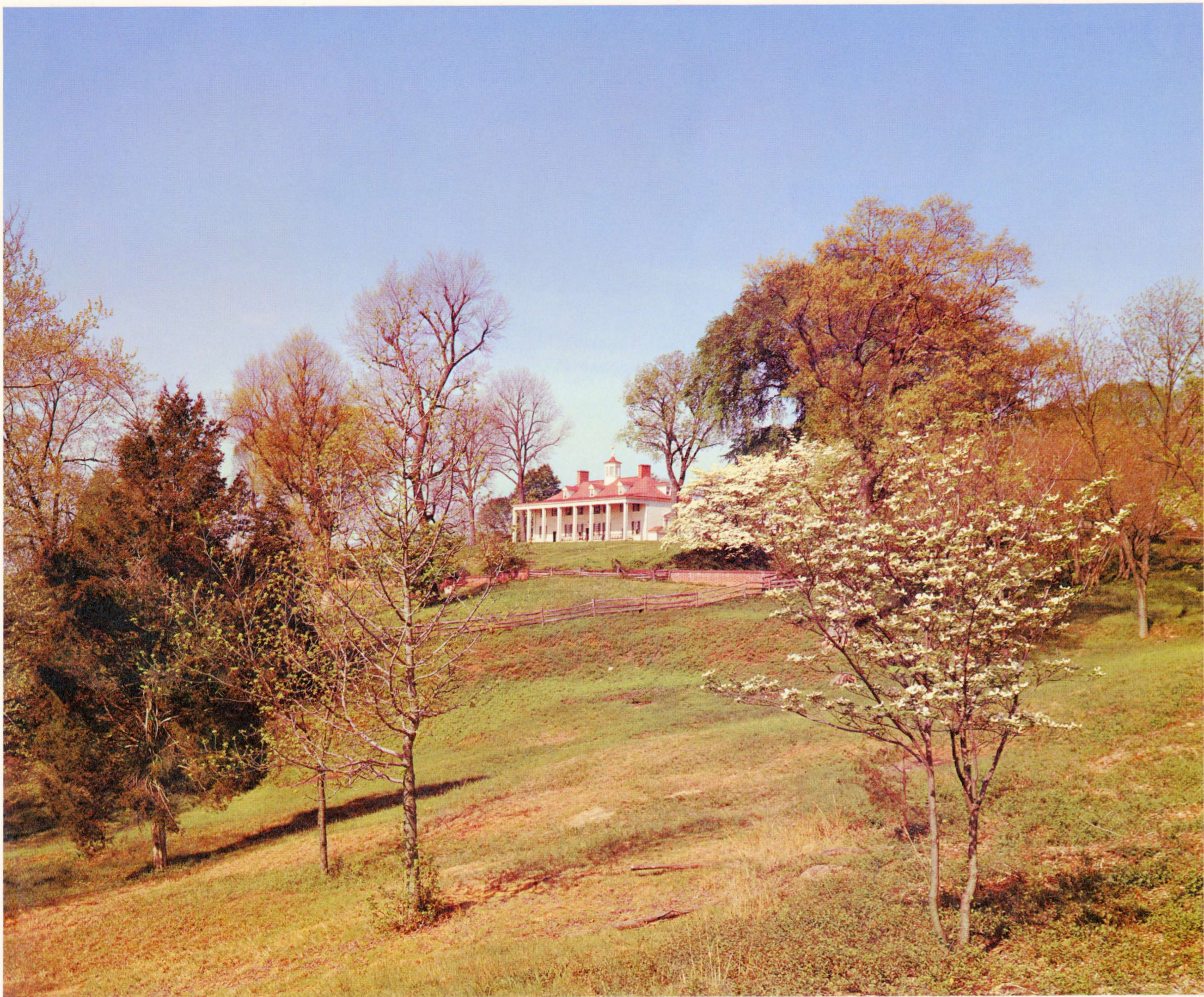
MT. VERNON, WASHINGTON, D. C.