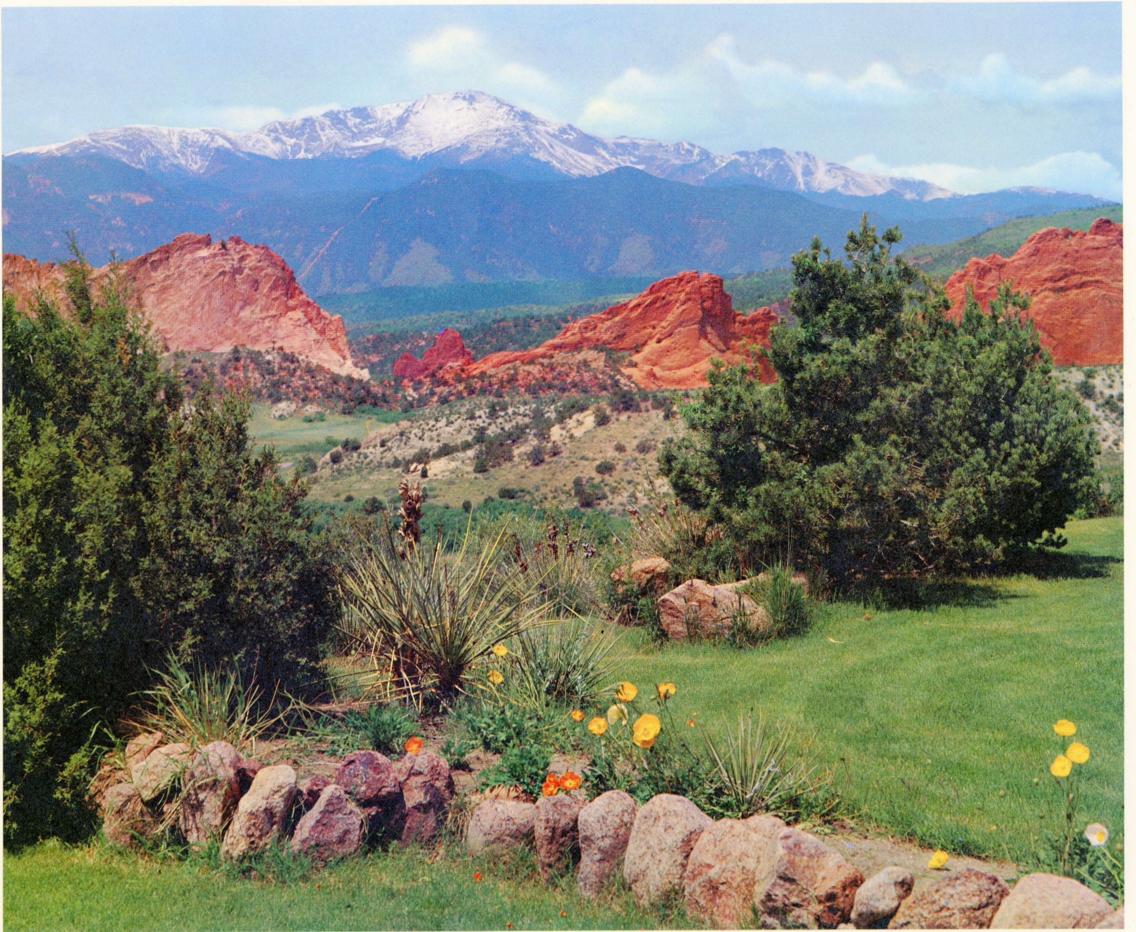
PIKES PEAK FROM GARDEN OF THE GODS, COLORADO