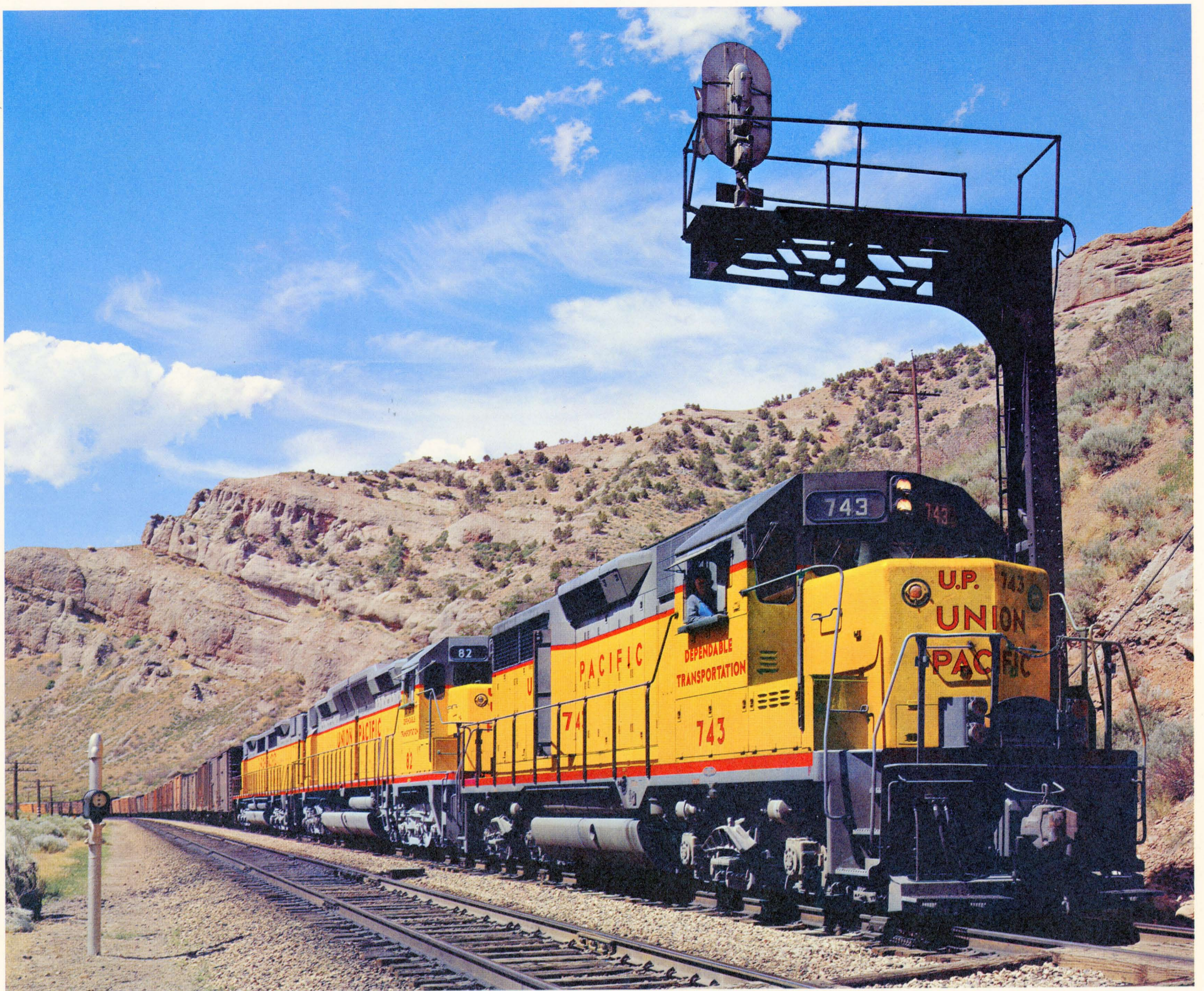
NEW DIESEL POWER DELIVERS THE GOODS