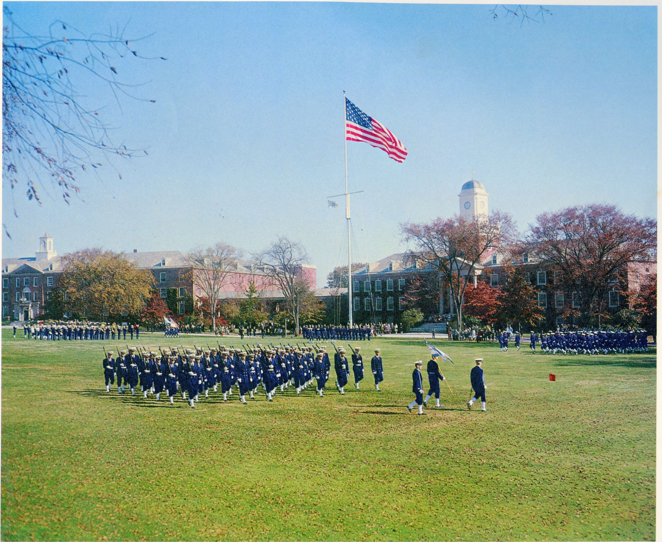
U. S. COAST GUARD ACADEMY, NEW LONDON, CONNECTICUT