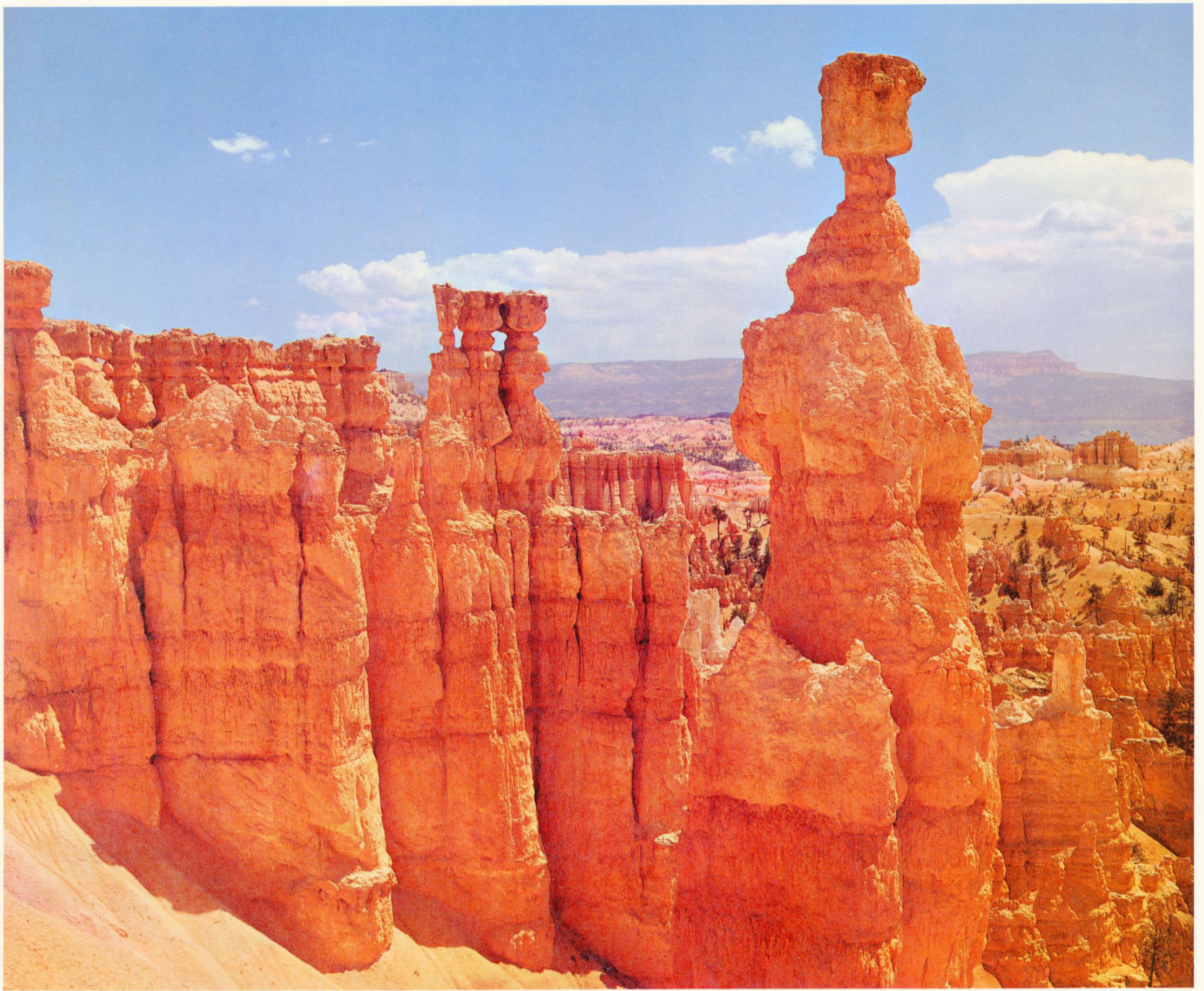
THOR'S HAMMER, BRYCE CANYON NATIONAL PARK, UTAH