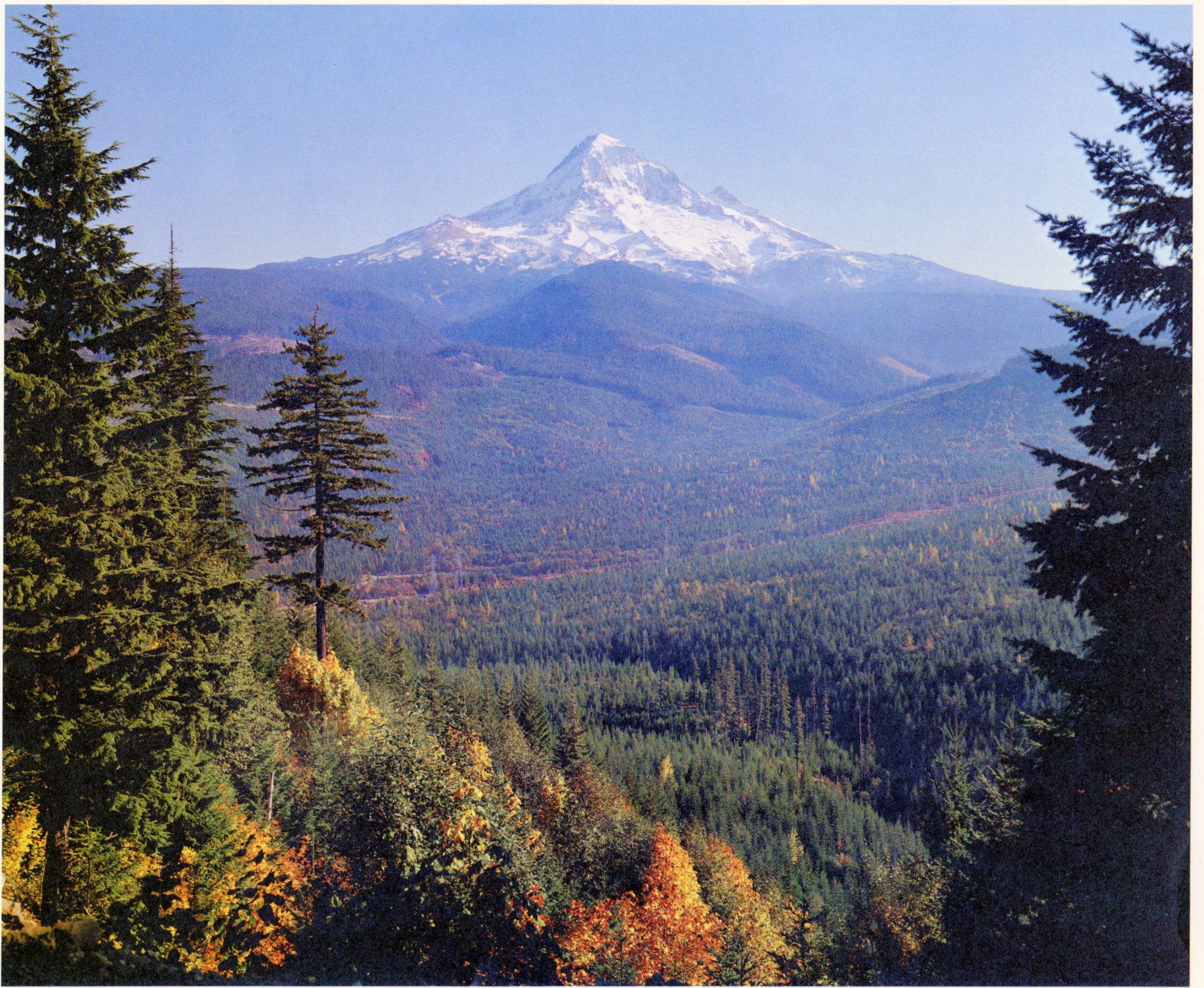
MT. HOOD, OREGON