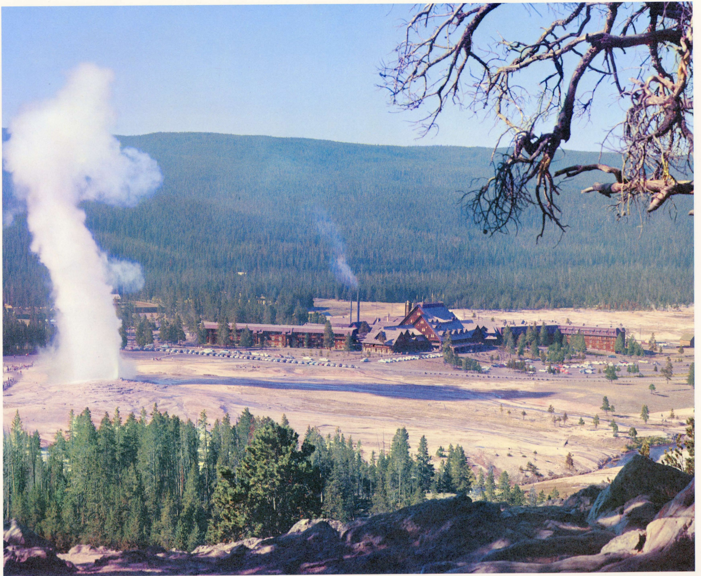
OLD FAITHFUL GEYSER, YELLOWSTONE NATIONAL PARK, WYOMING