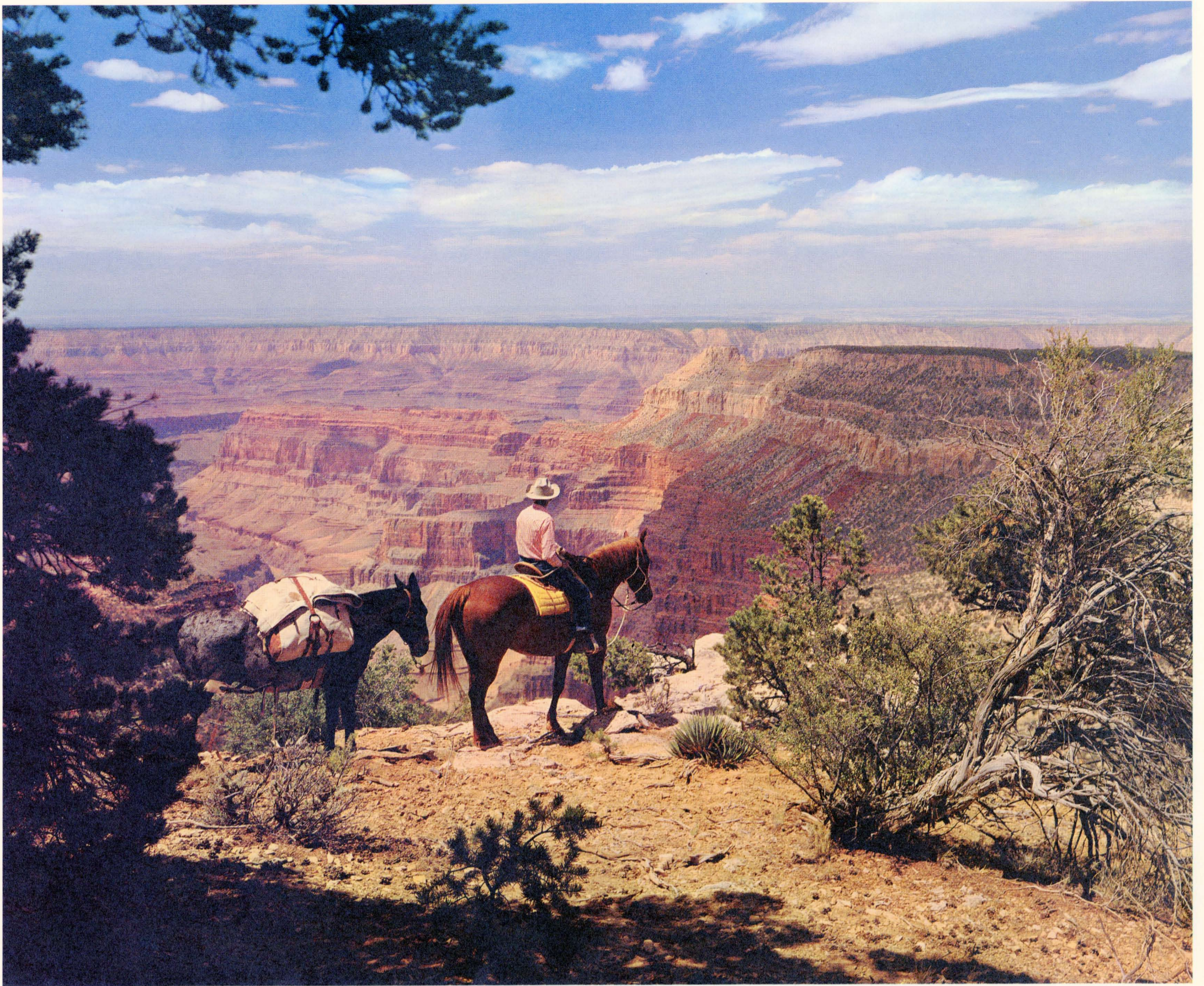
BEALE POINT, NORTH RIM, GRAND CANYON NATIONAL PARK, ARIZONA