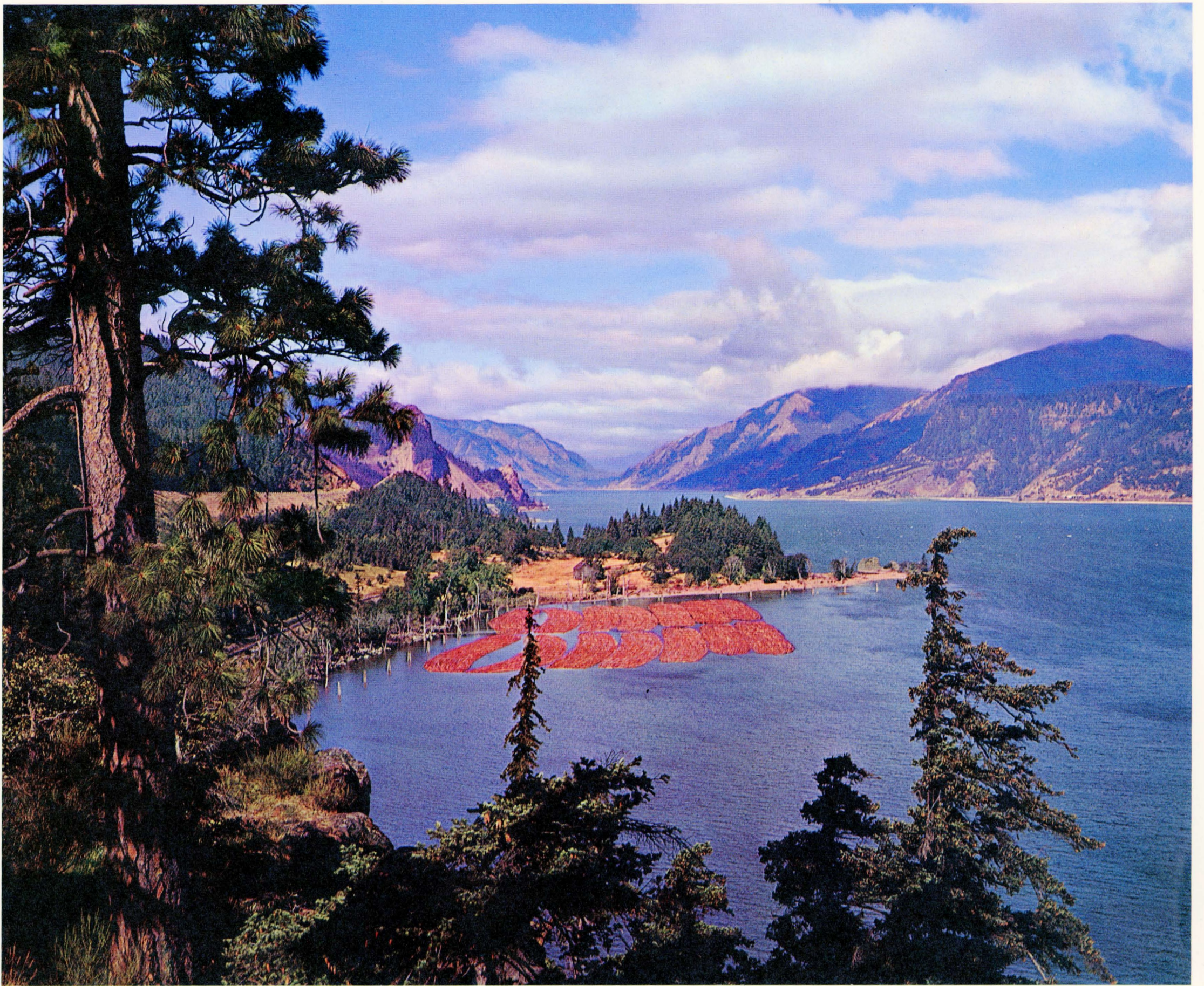
LOOKING DOWN THE COLUMBIA RIVER GORGE