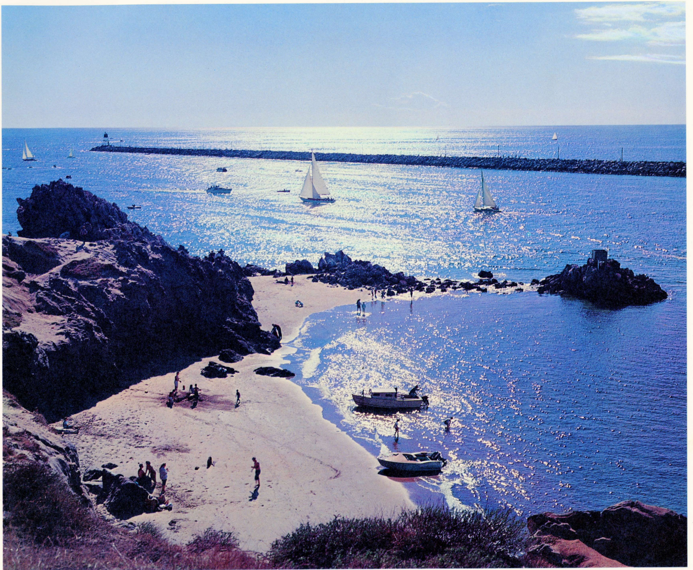
NEWPORT BEACH HARBOR, SOUTHERN CALIFORNIA