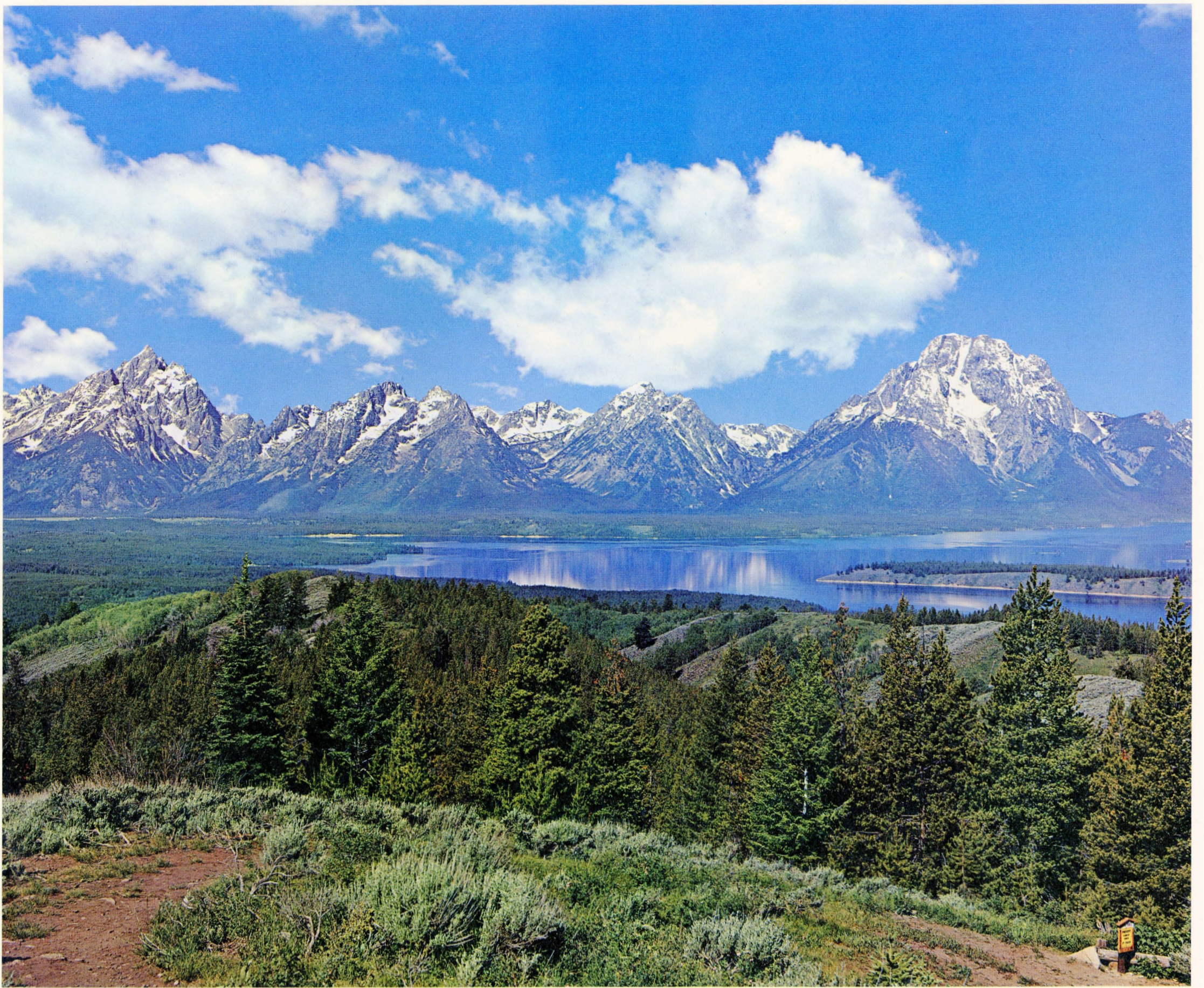
THE GRAND TETONS ACROSS JACKSON LAKE, WYOMING