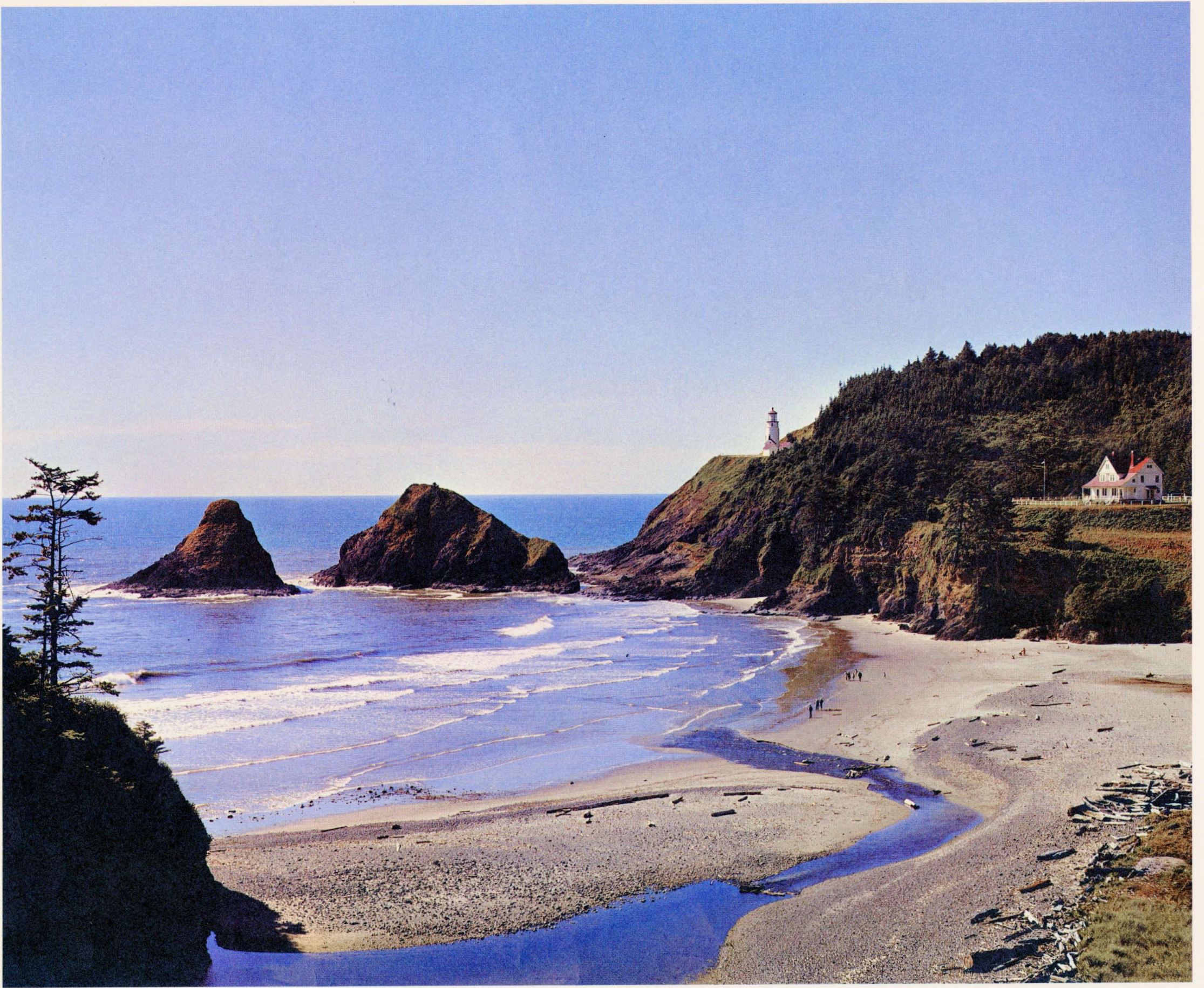
HECETA HEAD LIGHTHOUSE GUARDING OREGON'S CENTRAL COAST LINE