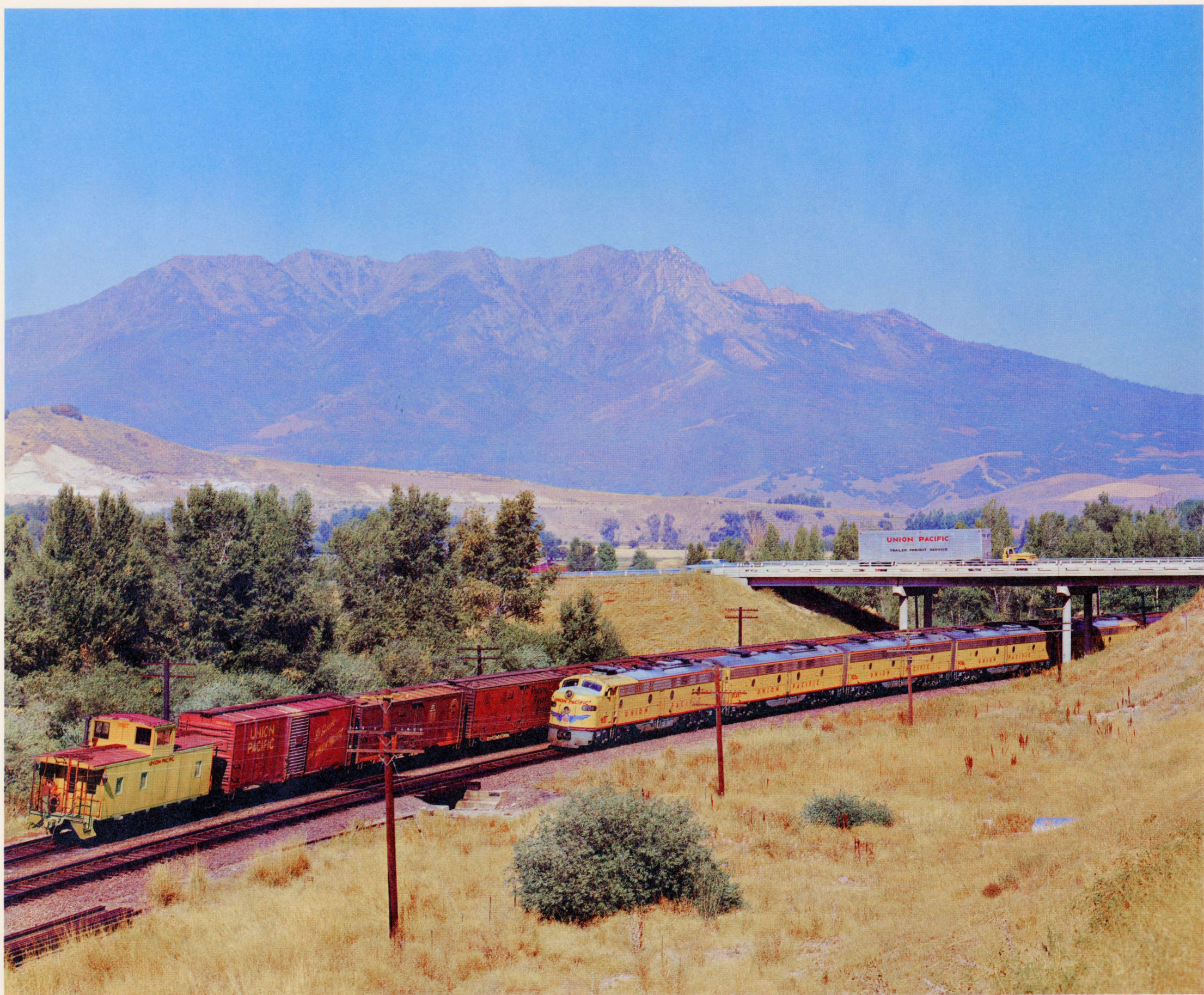
FREIGHT, PASSENGER AND MOTOR FREIGHT MEET NEAR PETERSON, UTAH