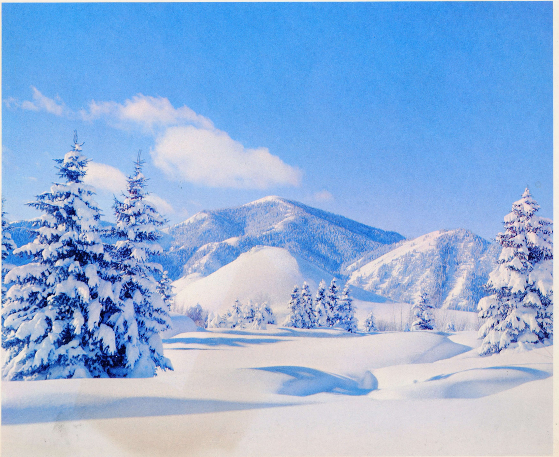
SUN VALLEY, IDAHO—SKI CAPITAL OF NORTH AMERICA