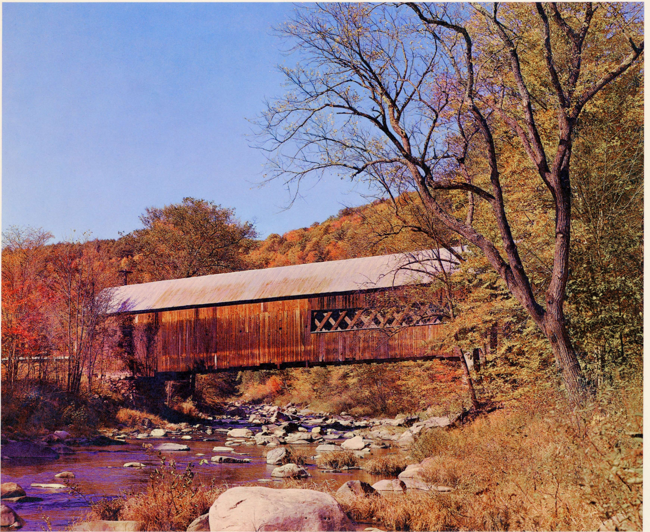
A PICTURESQUE COVERED BRIDGE STIRS PLEASANT MEMORIES