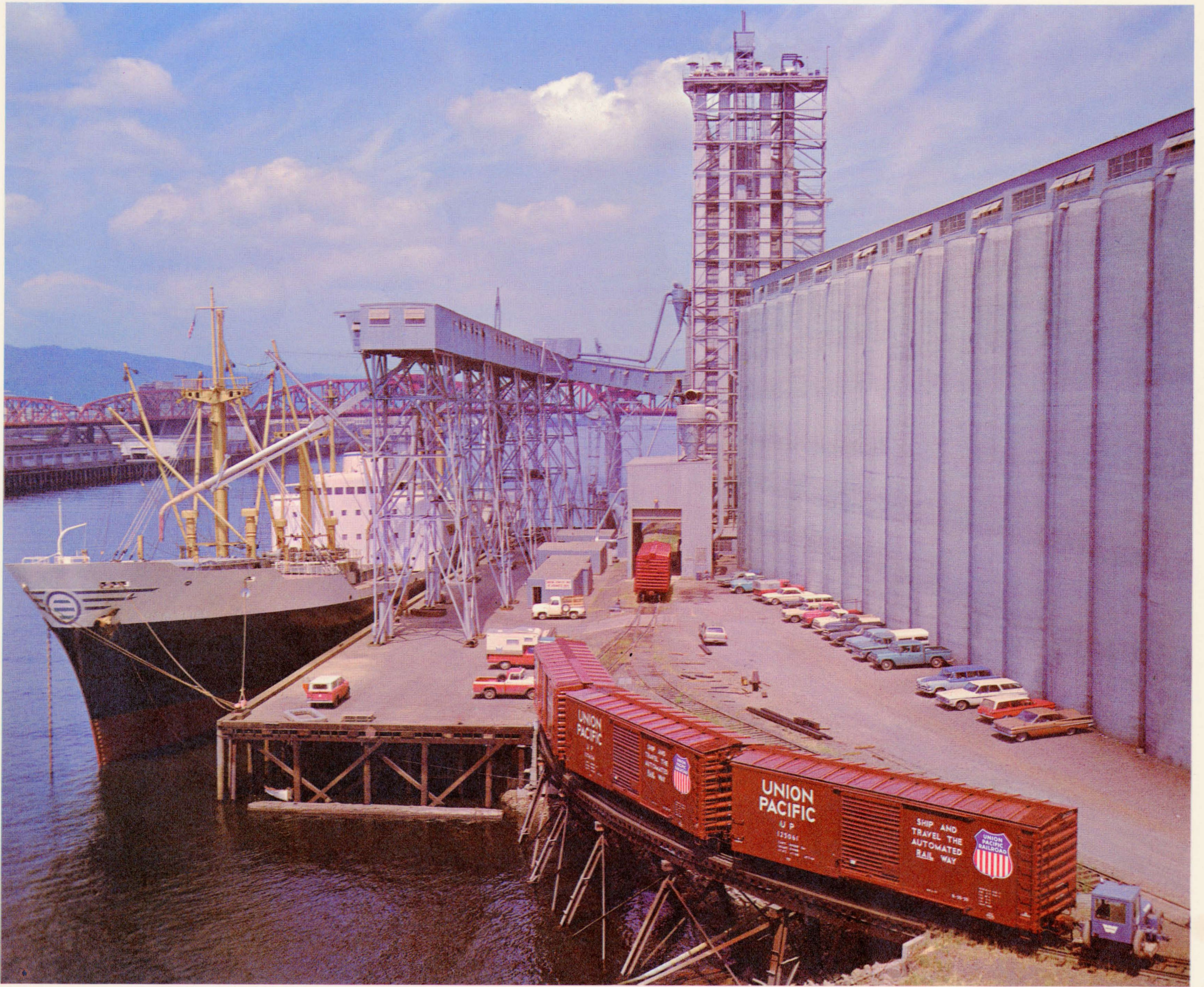
INLAND GRAIN HARVEST MOVING THROUGH PORT FOR EXPORT