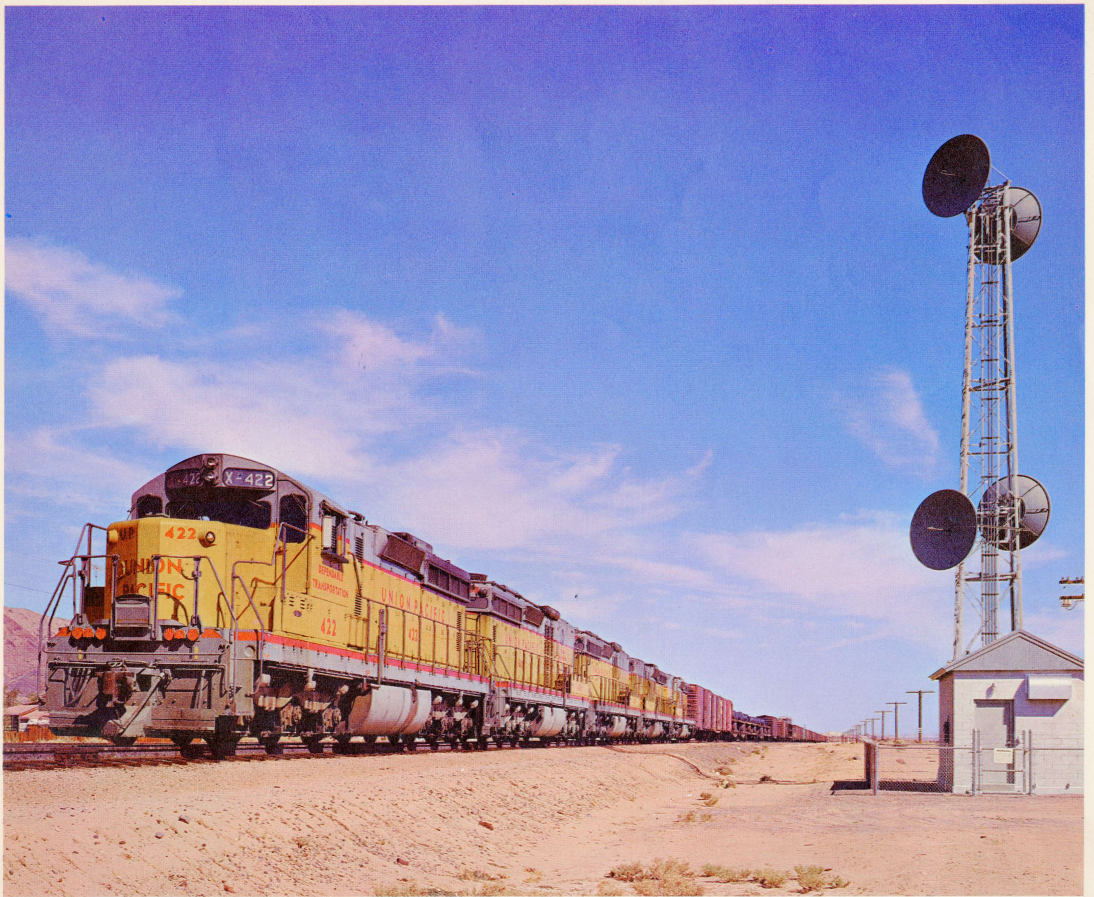
MICROWAVE COMMUNICATIONS AND DIESEL POWER COMBINE FOR TOP TRANSPORTATION PERFORMANCE