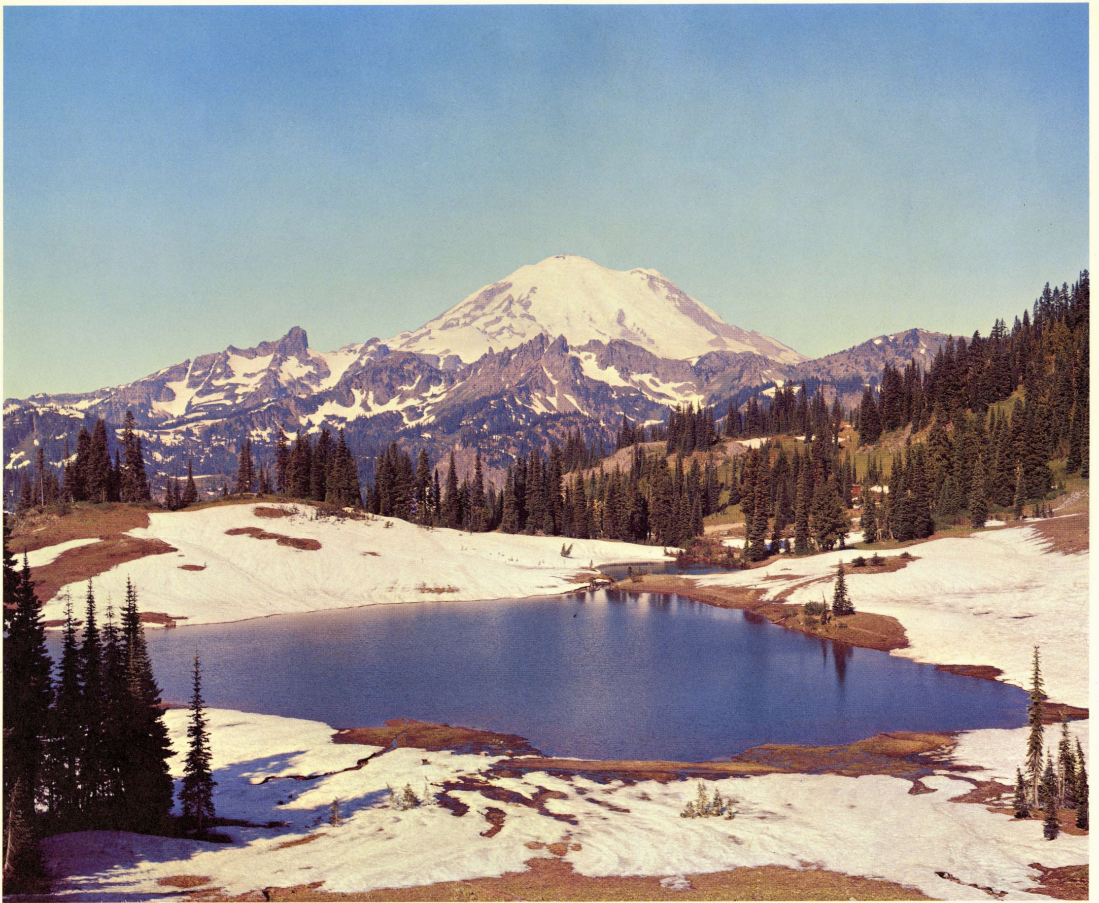
MAJESTIC MOUNT RAINIER RISING ABOVE TIPSOO LAKE, WASHINGTON