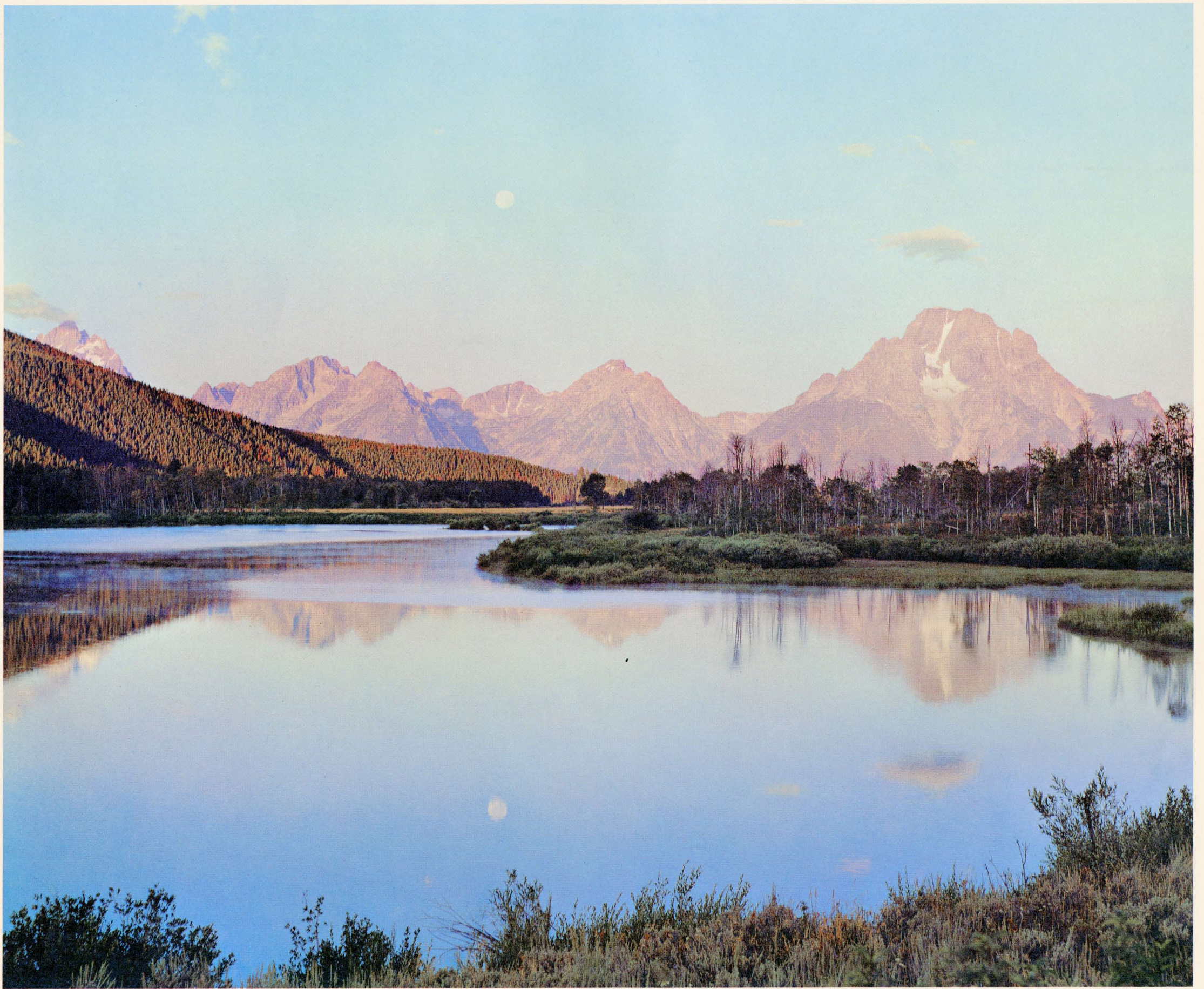
MOONSET AND SUNRISE OVER THE TETONS, GRAND TETON NATIONAL PARK, WYOMING