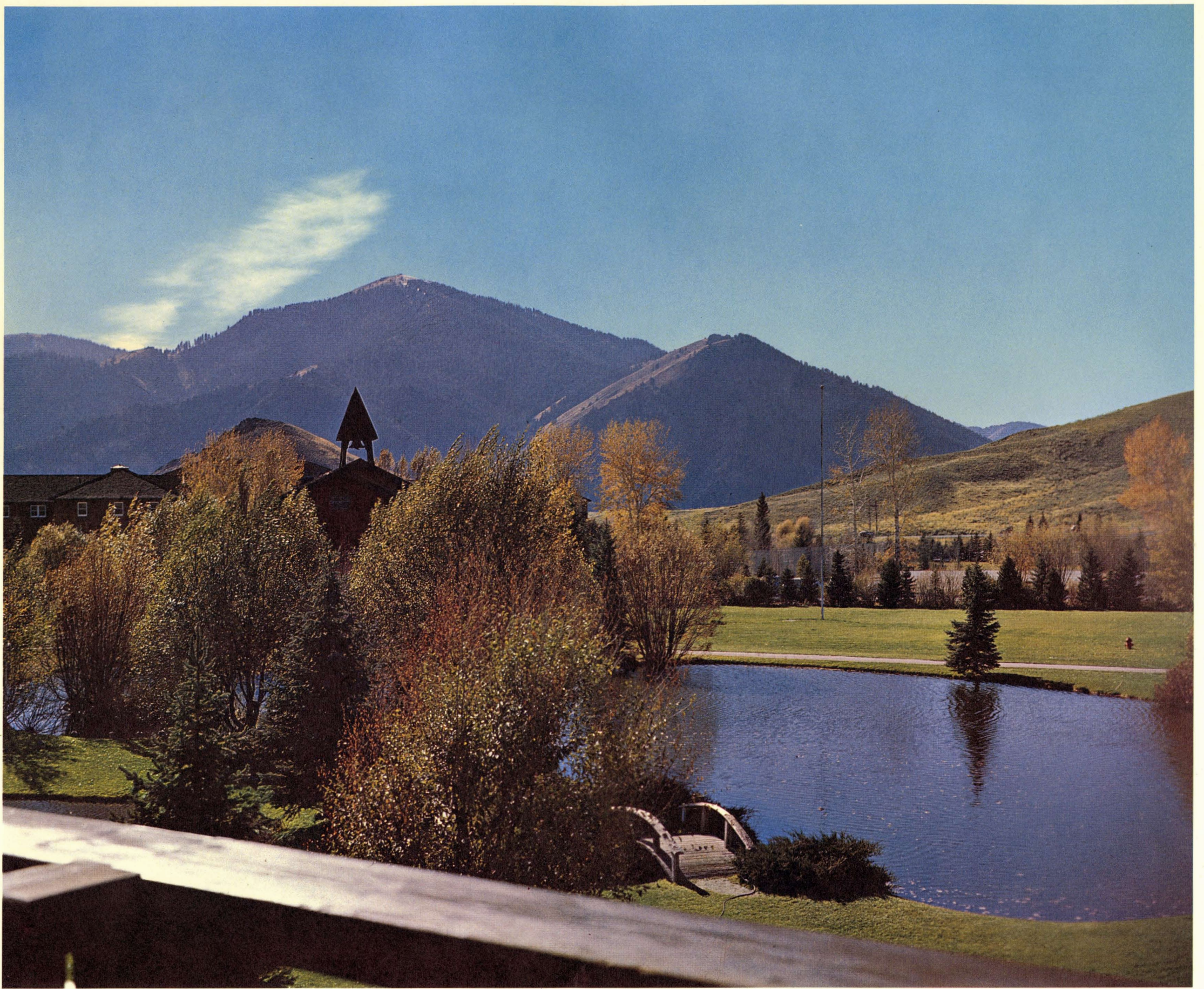
SUN VALLEY, IDAHO—PERFECT FOR A FAMILY VACATION