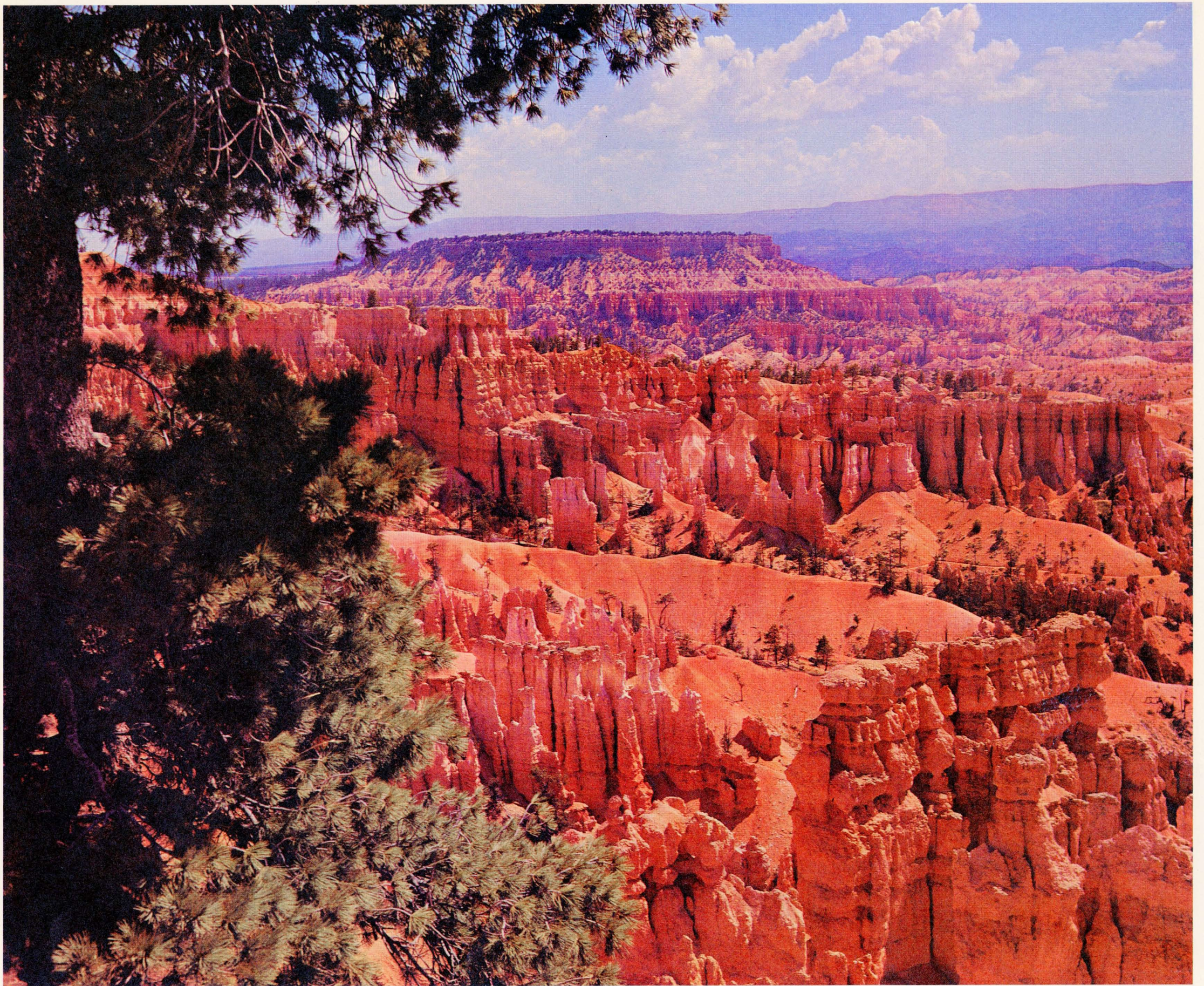
BRYCE CANYON NATIONAL PARK, UTAH