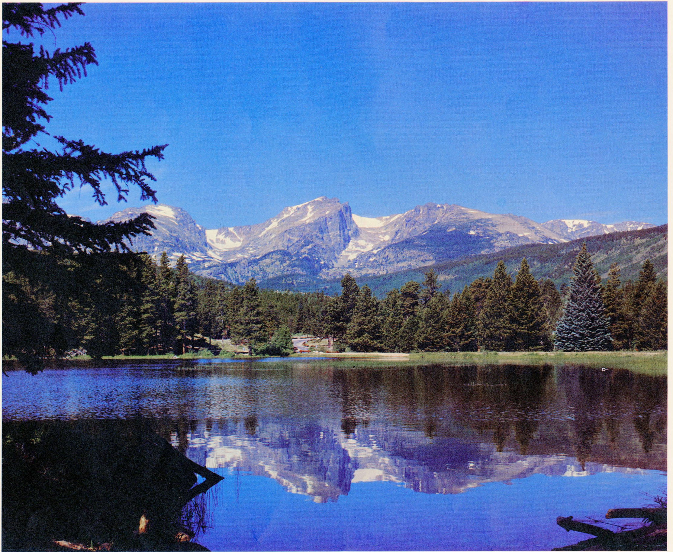
HALLETT PEAK AND SPRAGUE LAKE, ROCKY MOUNTAIN NATIONAL PARK, COLORADO