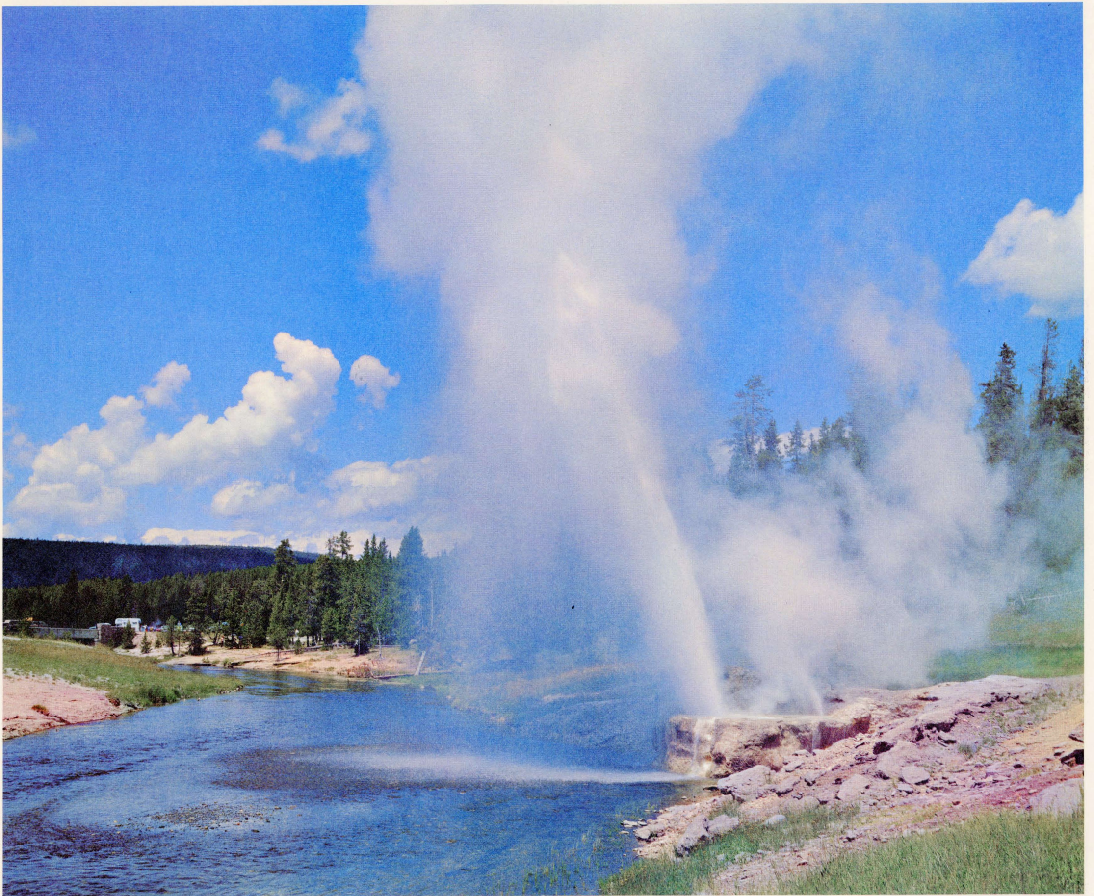
RIVERSIDE GEYSER, YELLOWSTONE NATIONAL PARK, WYOMING