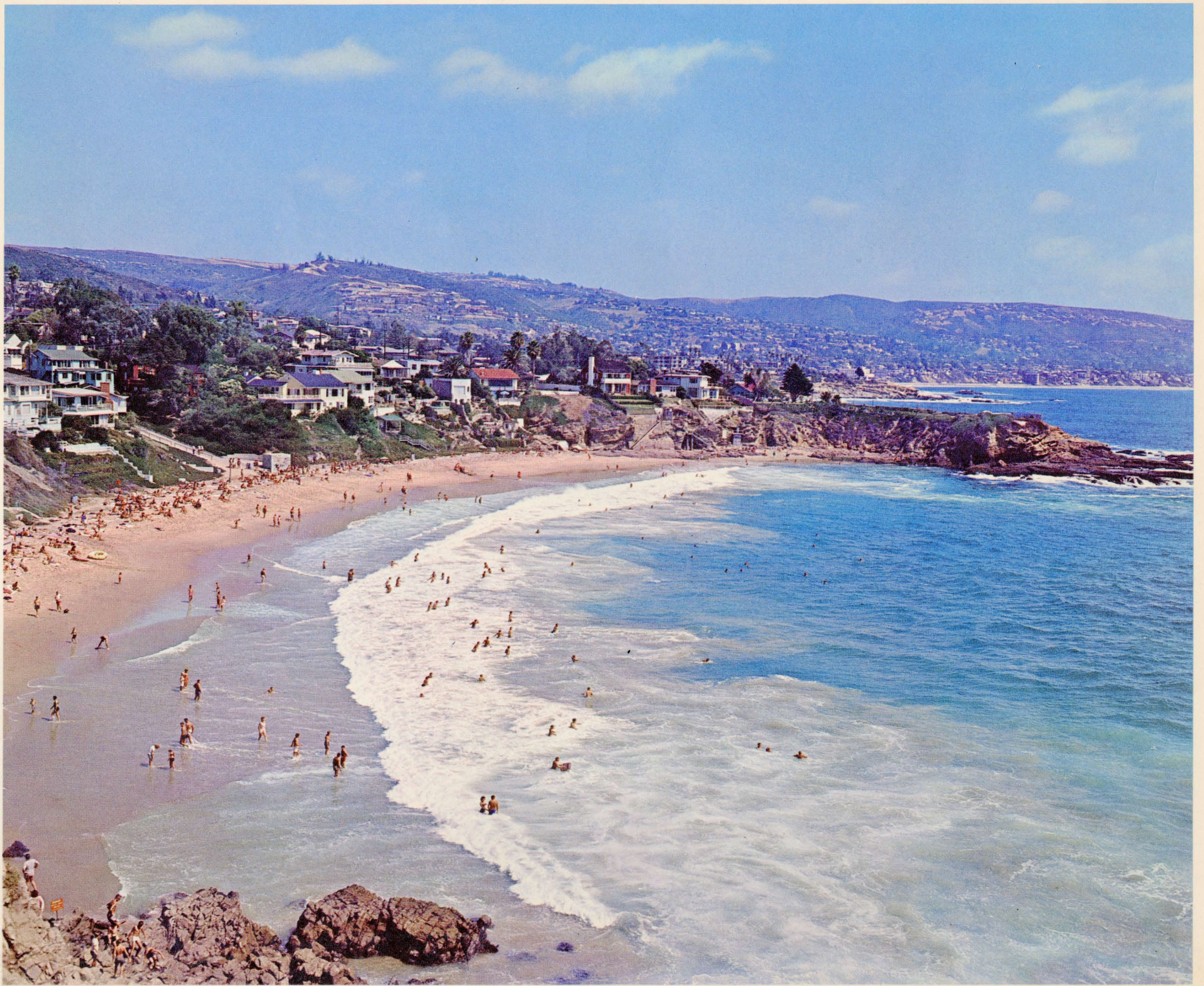
LAGUNA BEACH, CALIFORNIA, POPULAR ALL-YEAR PLAYGROUND