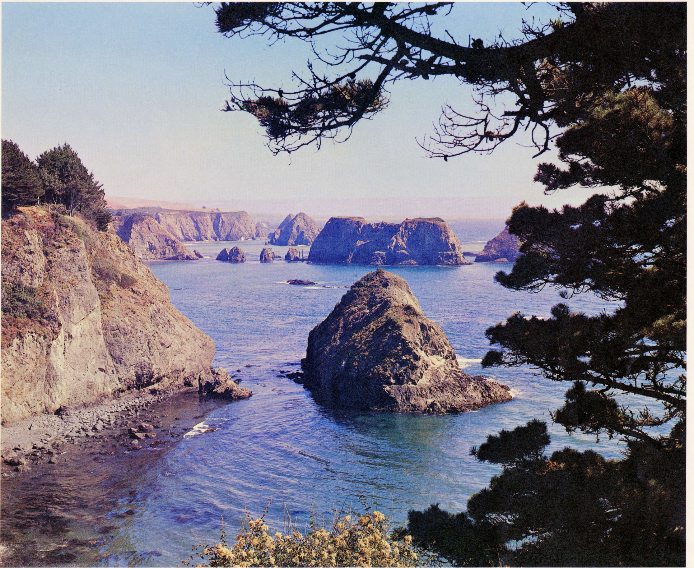
GREENWOOD COVE ON NORTHERN CALIFORNIA'S BEAUTIFUL COAST LINE