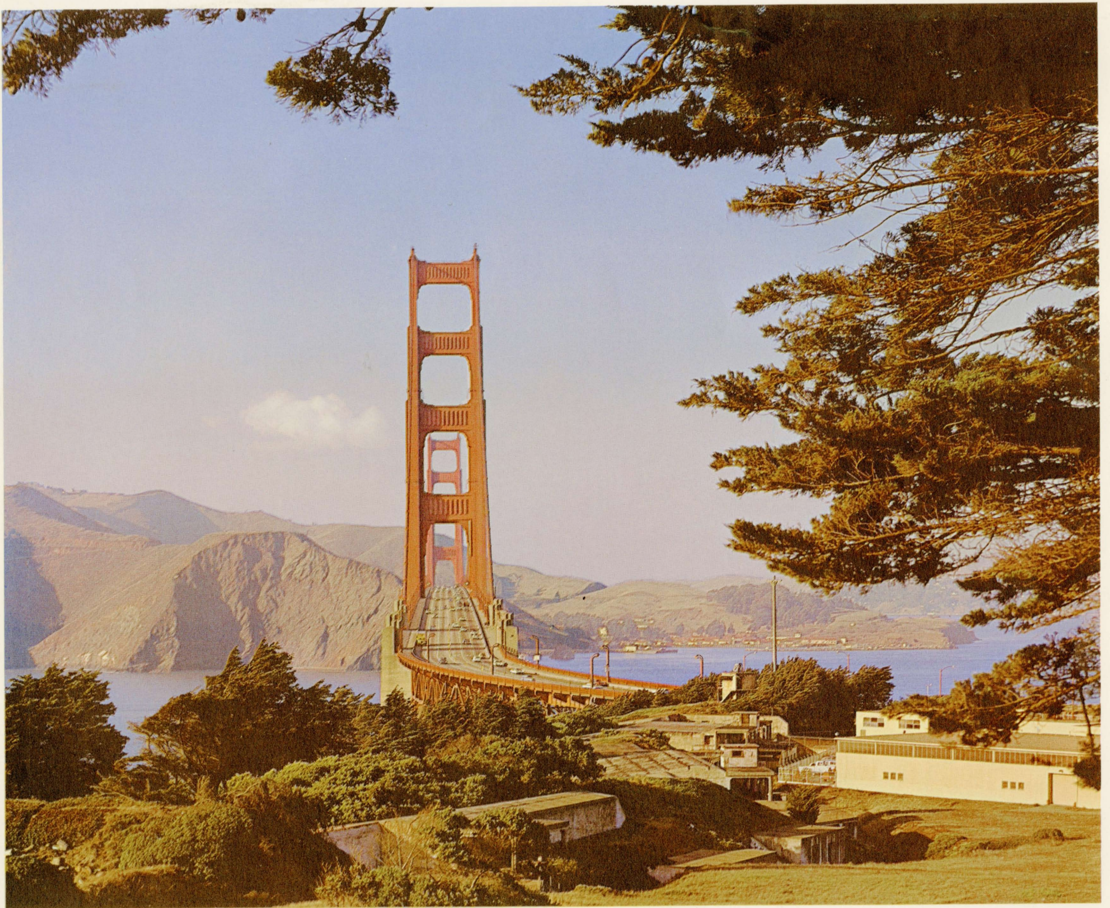
LOOKING ACROSS THE GOLDEN GATE, SAN FRANCISCO, CALIFORNIA