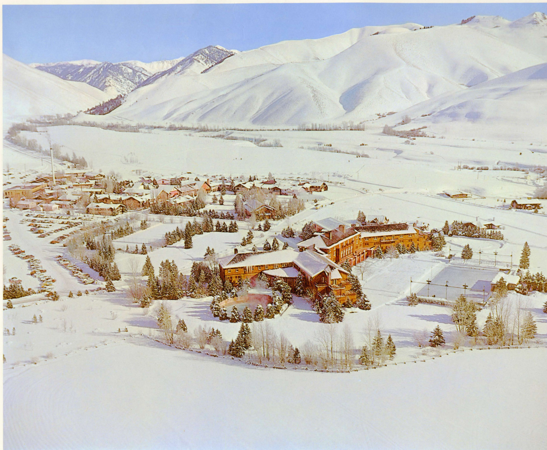
SUN VALLEY, IDAHO BECKONS SKIERS FROM NOVICE TO OLYMPIC COMPETITOR