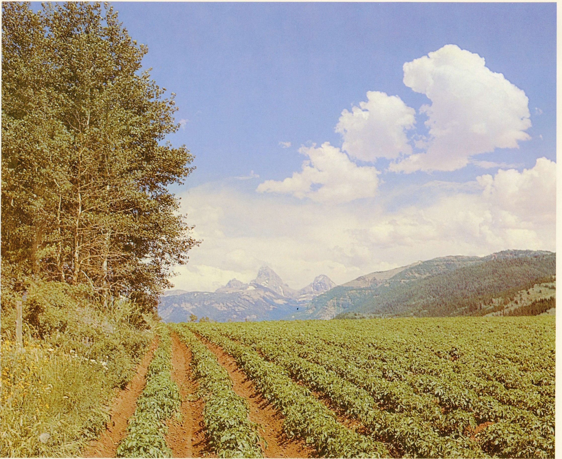
POTATOES GROWING IN IDAHO'S RICH RED SOIL, TETON MOUNTAINS IN DISTANCE