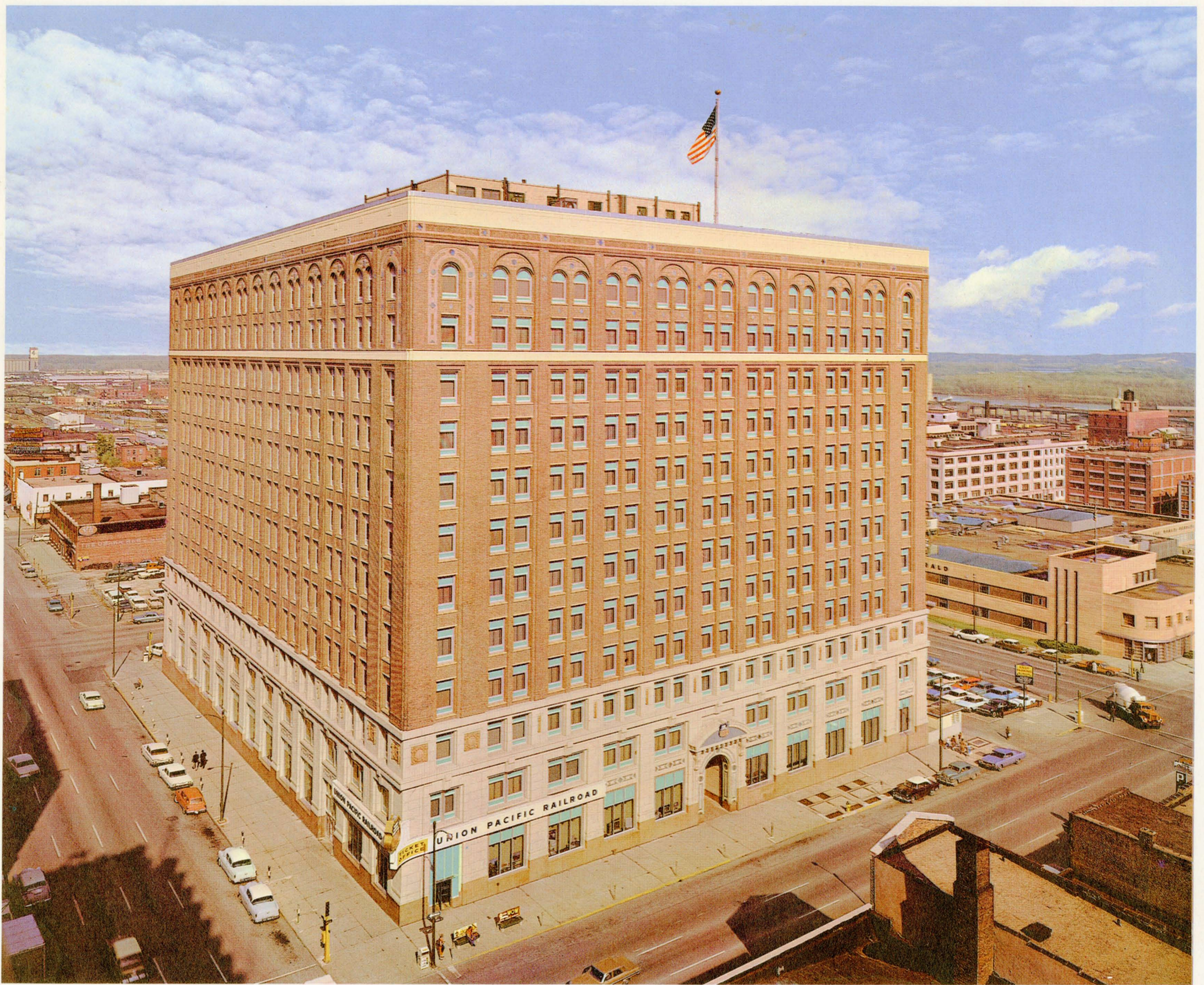
HEADQUARTERS BUILDING OF THE UNION PACIFIC RAILROAD, OMAHA, NEBRASKA