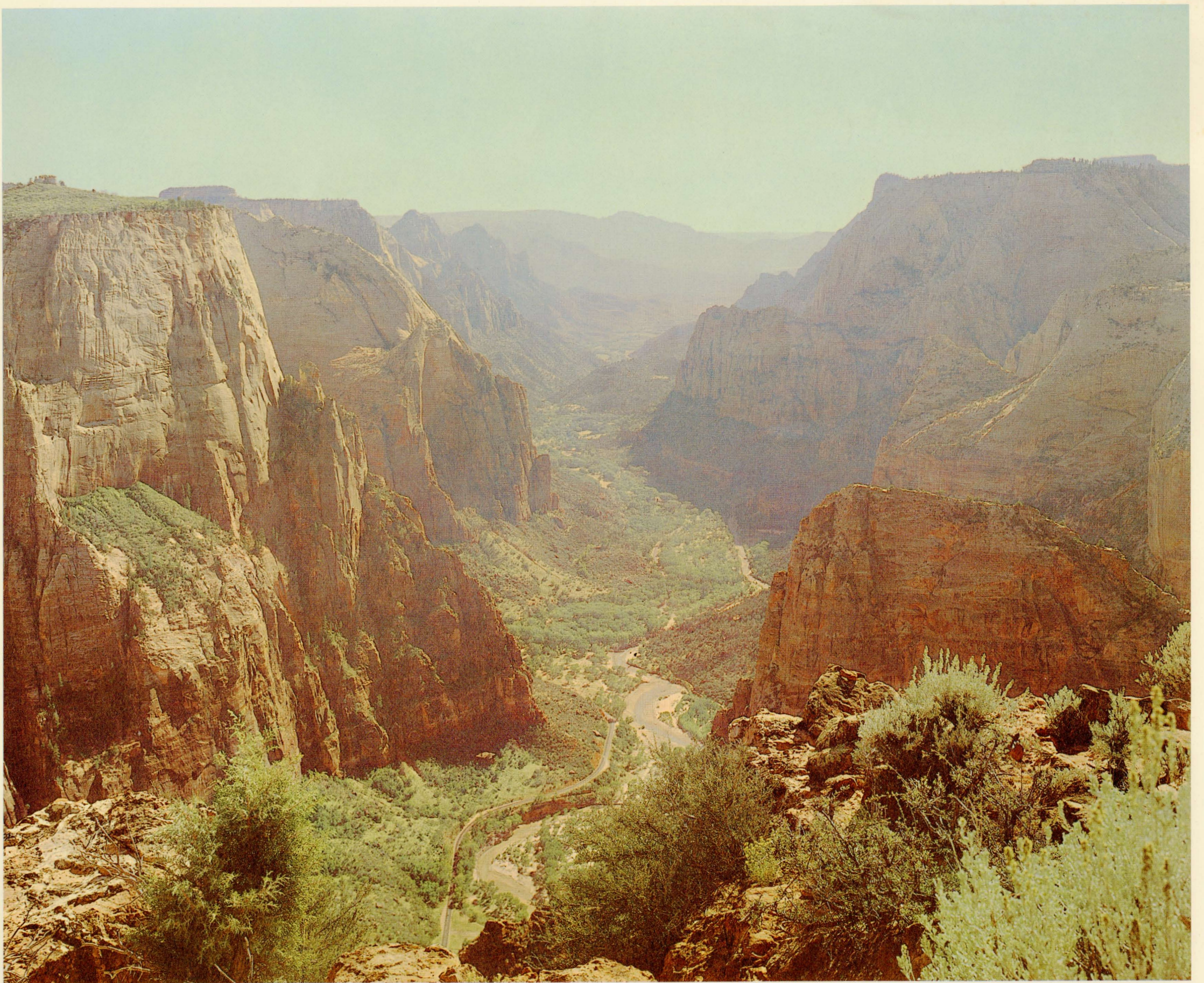
ZION CANYON IN ZION NATIONAL PARK, UTAH