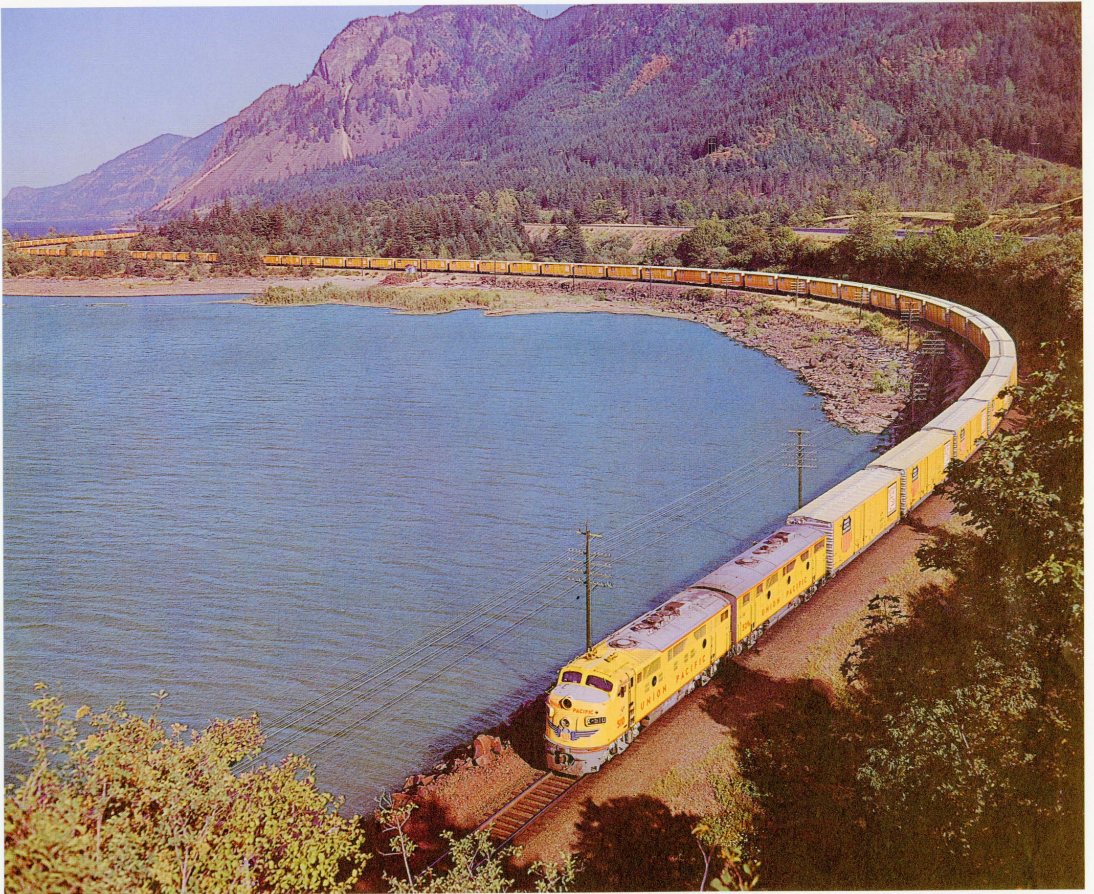
UNION PACIFIC FREIGHT WINDS THROUGH THE BEAUTIFUL COLUMBIA RIVER GORGE