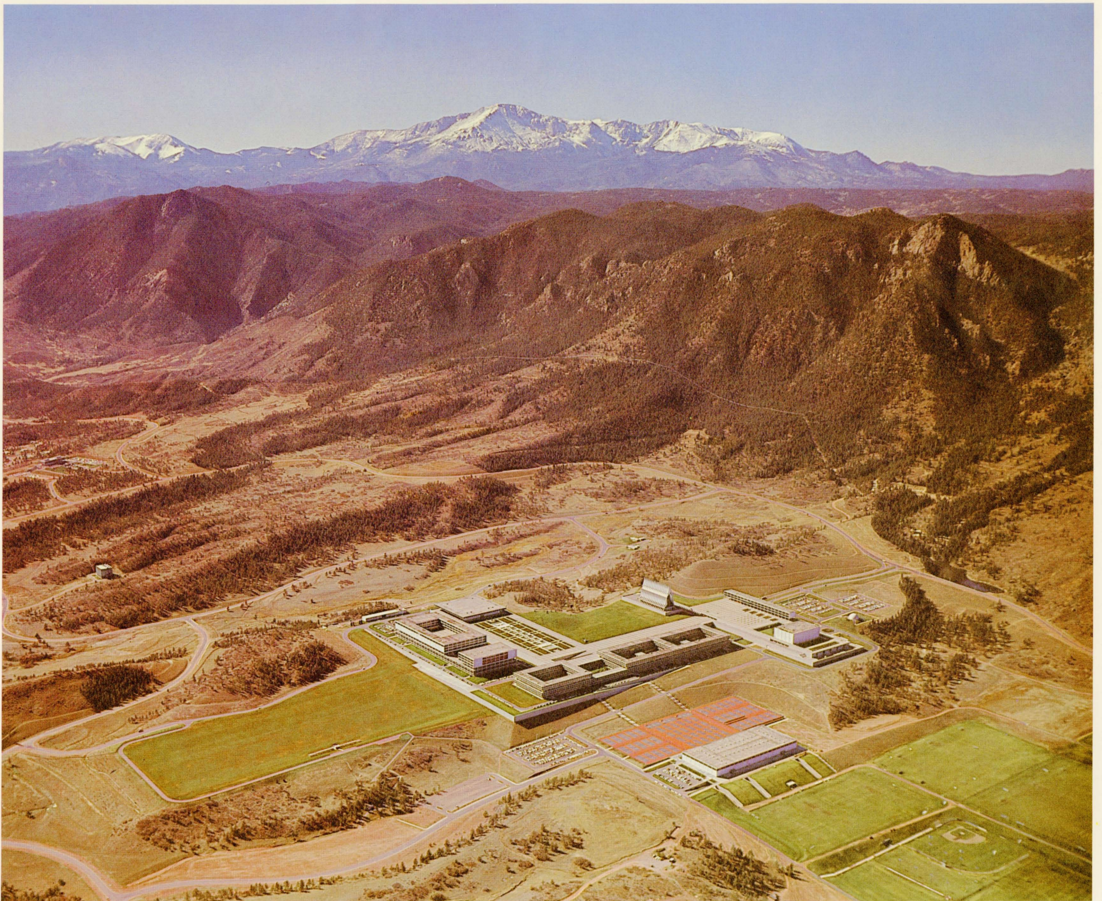
THE U. S. AIR FORCE ACADEMY AND PIKES PEAK, NEAR COLORADO SPRINGS, COLORADO