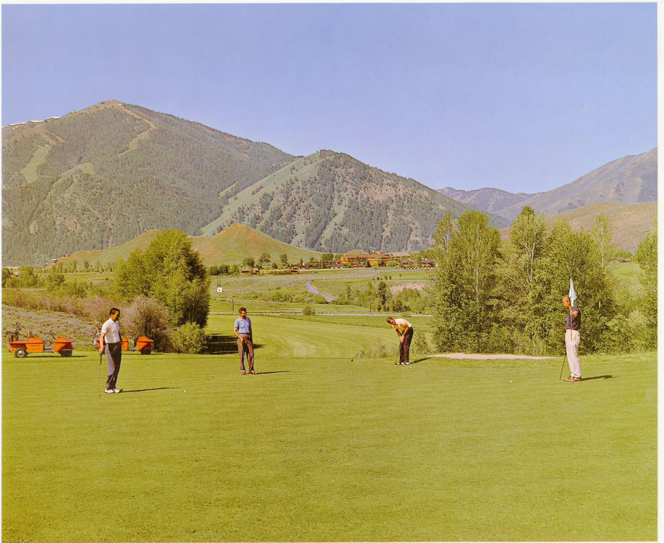
WARM SUN AND CRISP AIR MAKE FOR PERFECT GOLFING AT SUN VALLEY, IDAHO