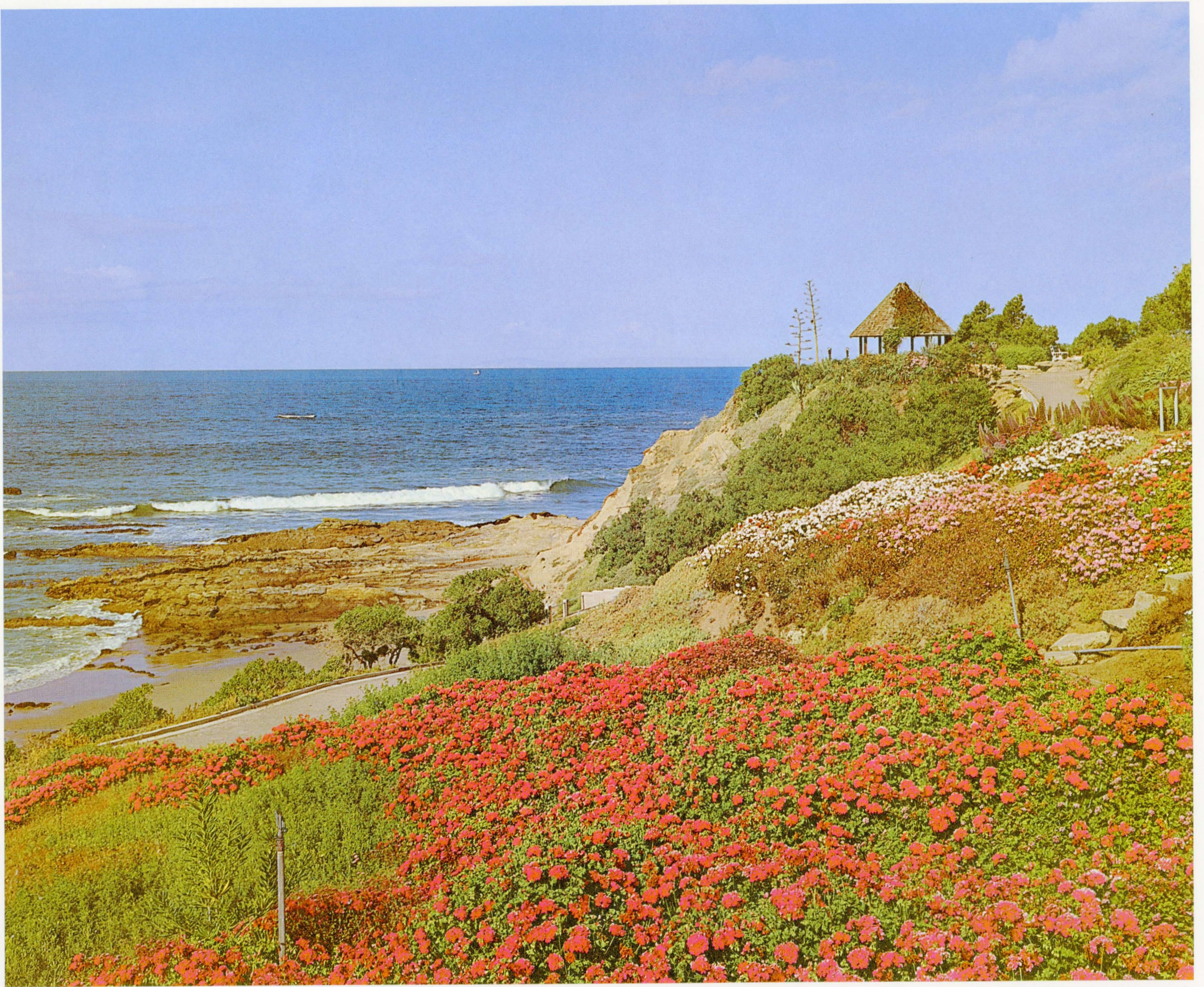
BEAUTIFUL GARDENS AND THE SPARKLING PACIFIC AT LAGUNA BEACH, CALIFORNIA