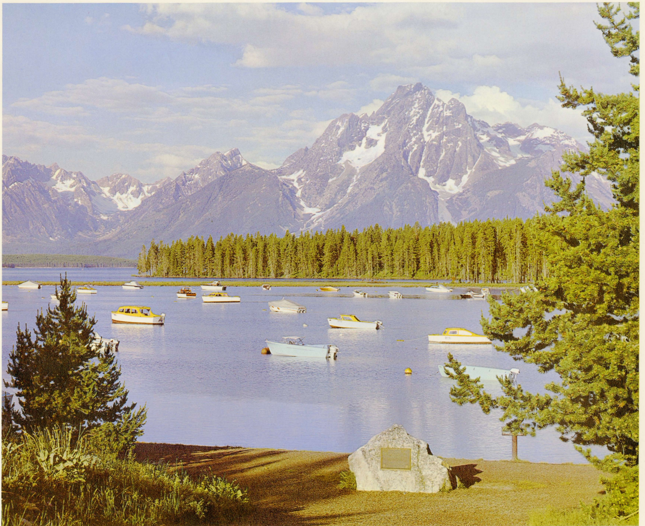
COLTER BAY, JACKSON LAKE, GRAND TETON NATIONAL PARK, WYOMING