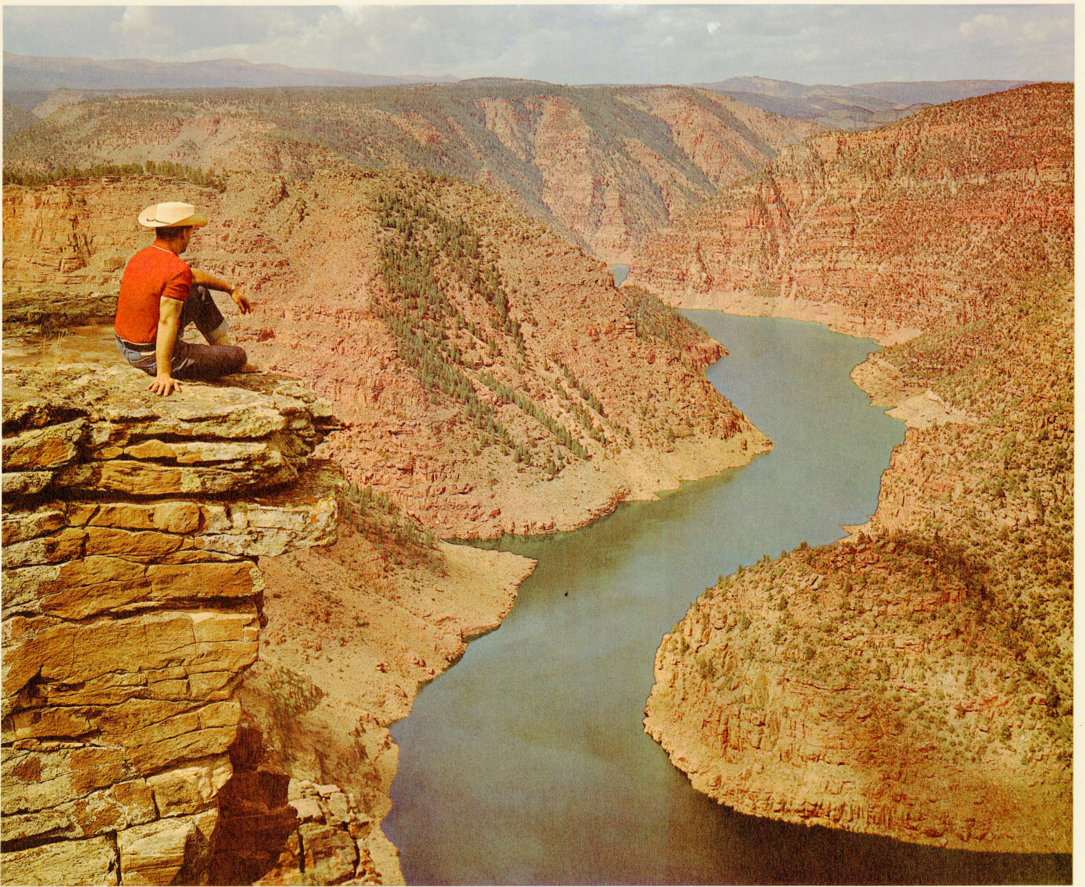
RED CANYON OVERLOOK ABOVE FLAMING GORGE LAKE, NORTHEASTERN UTAH