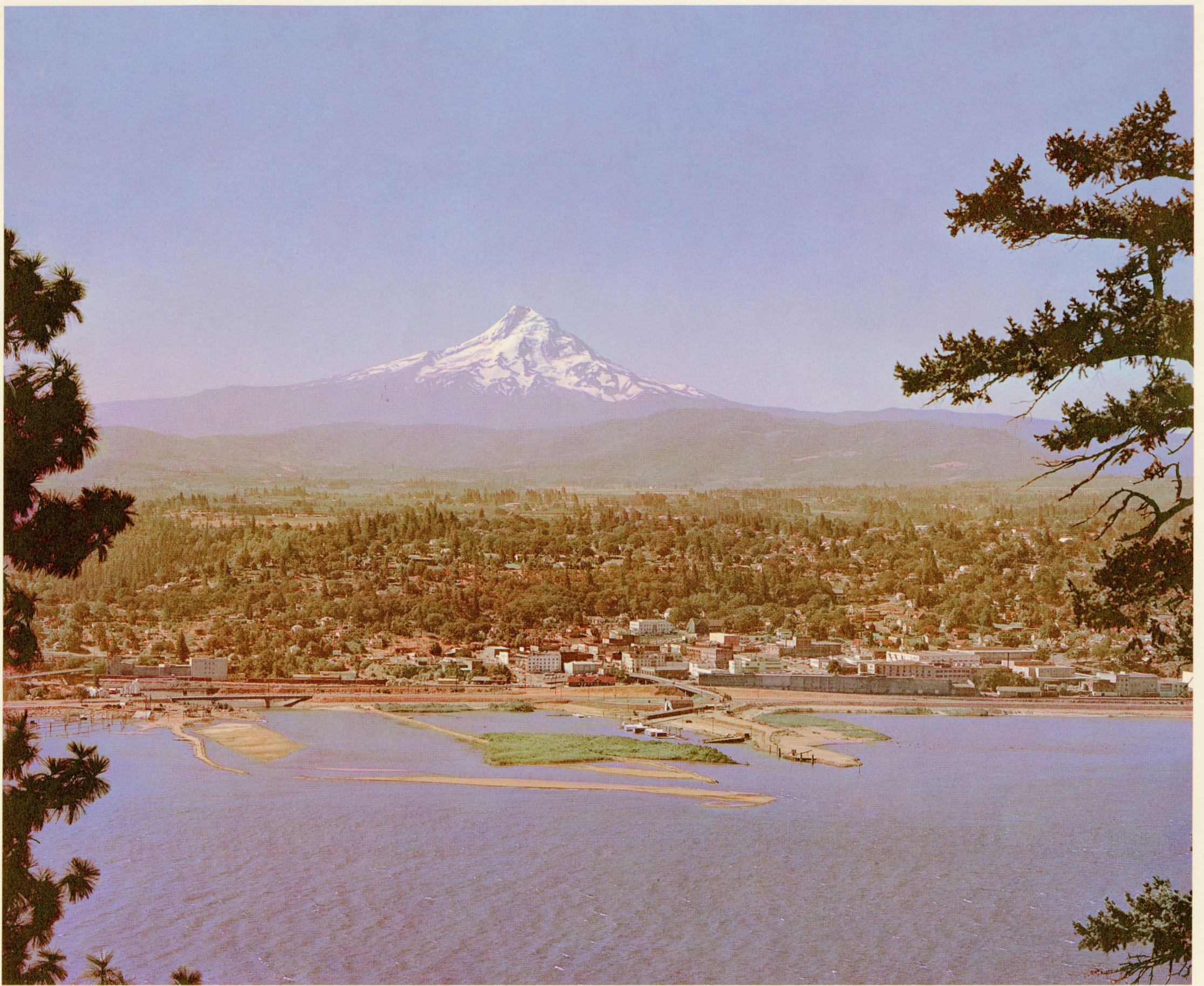
MT. HOOD STANDS ABOVE HOOD RIVER, OREGON ON THE COLUMBIA RIVER