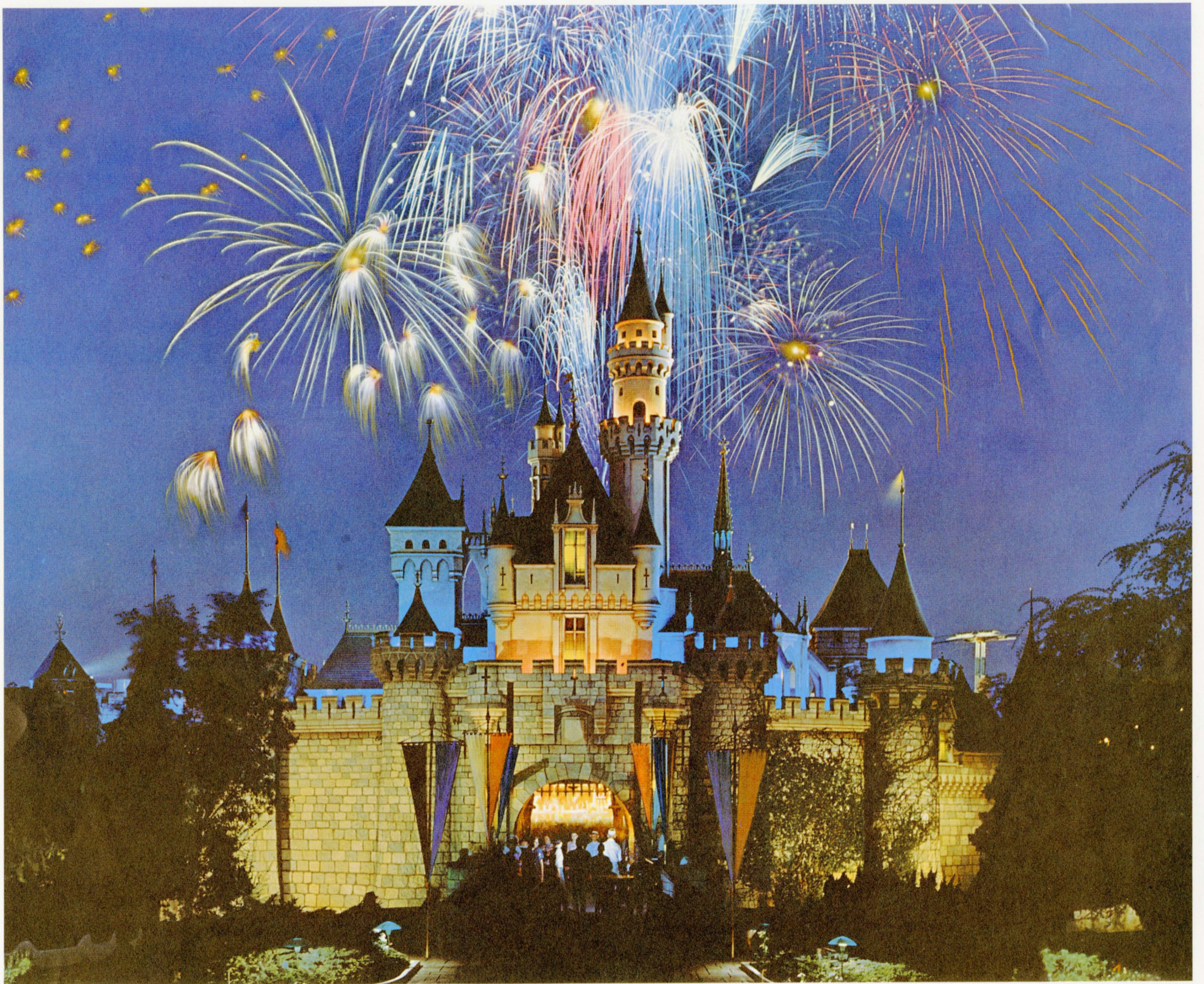
THIS MONTH MARKS DISNEYLAND'S FIRST DECADE