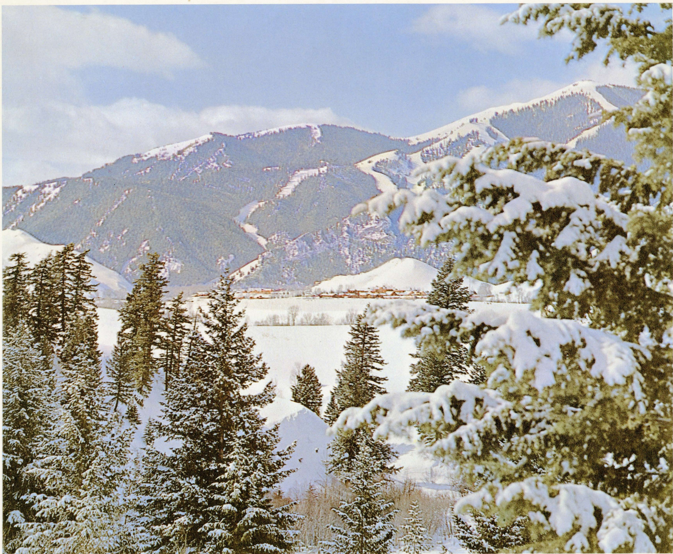
SUN VALLEY, IDAHO—SKIERS' PARADISE, MANTLED WITH FRESH SNOW