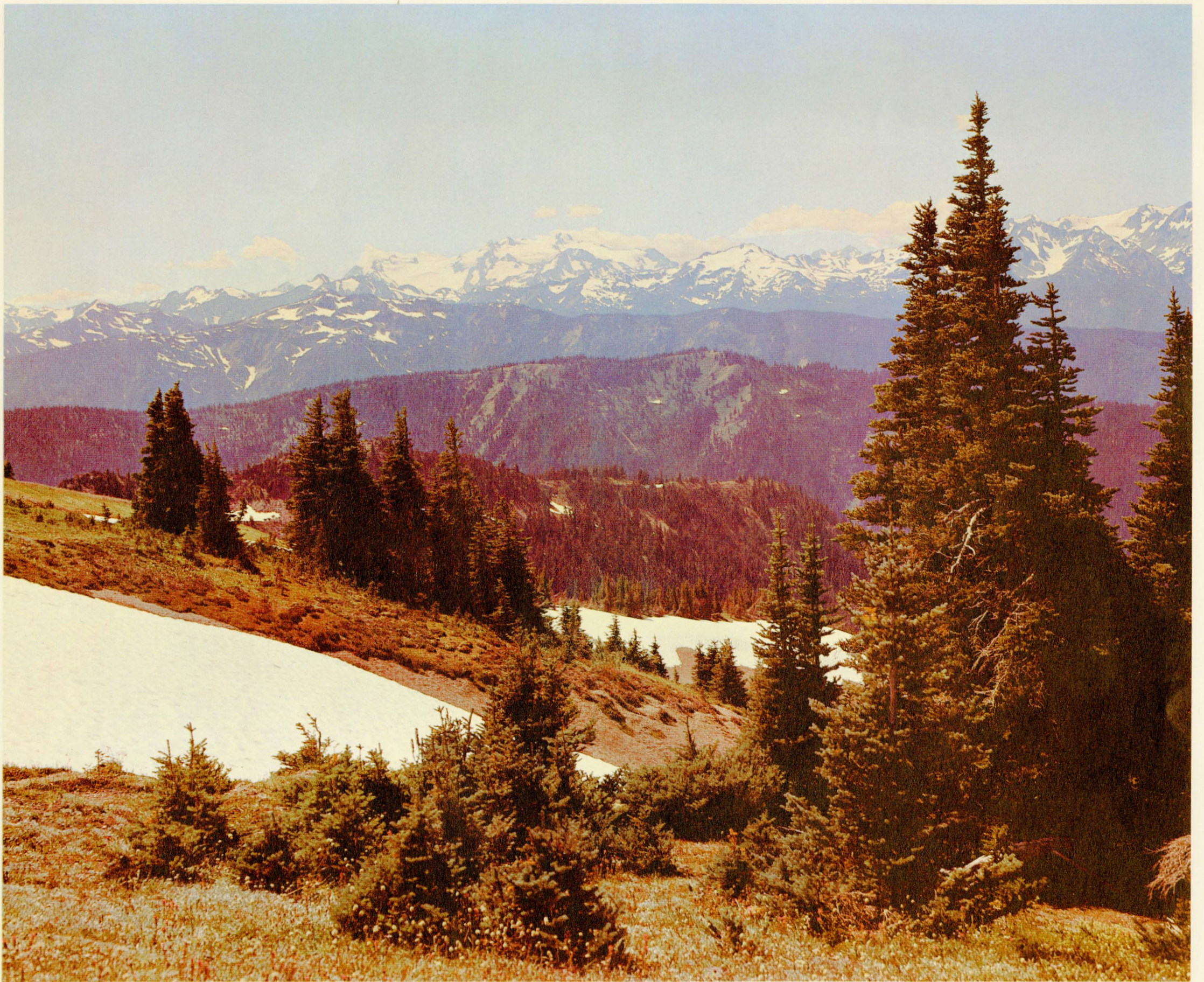
OLYMPIC MOUNTAINS, OLYMPIC NATIONAL PARK, NORTHWEST WASHINGTON