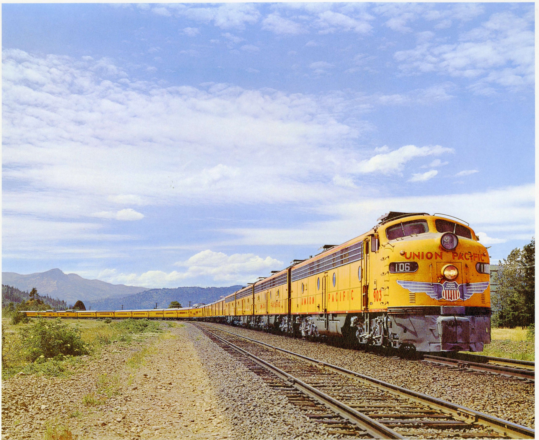
DOMELINER "CITY OF PORTLAND—CITY OF DENVER" IN THE COLUMBIA RIVER GORGE