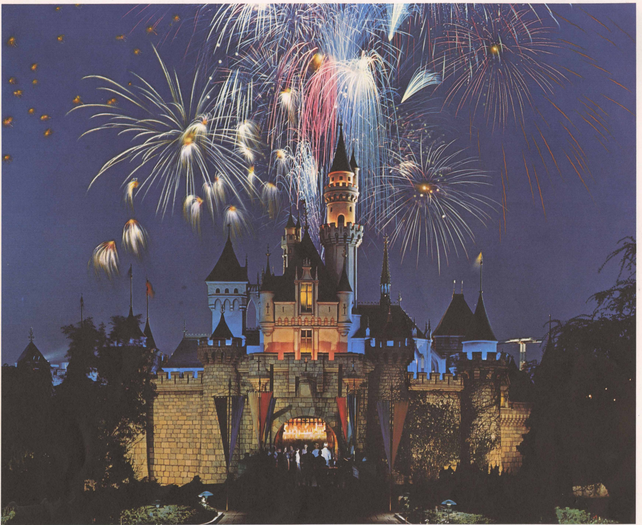
THIS MONTH MARKS DISNEYLAND'S FIRST DECADE