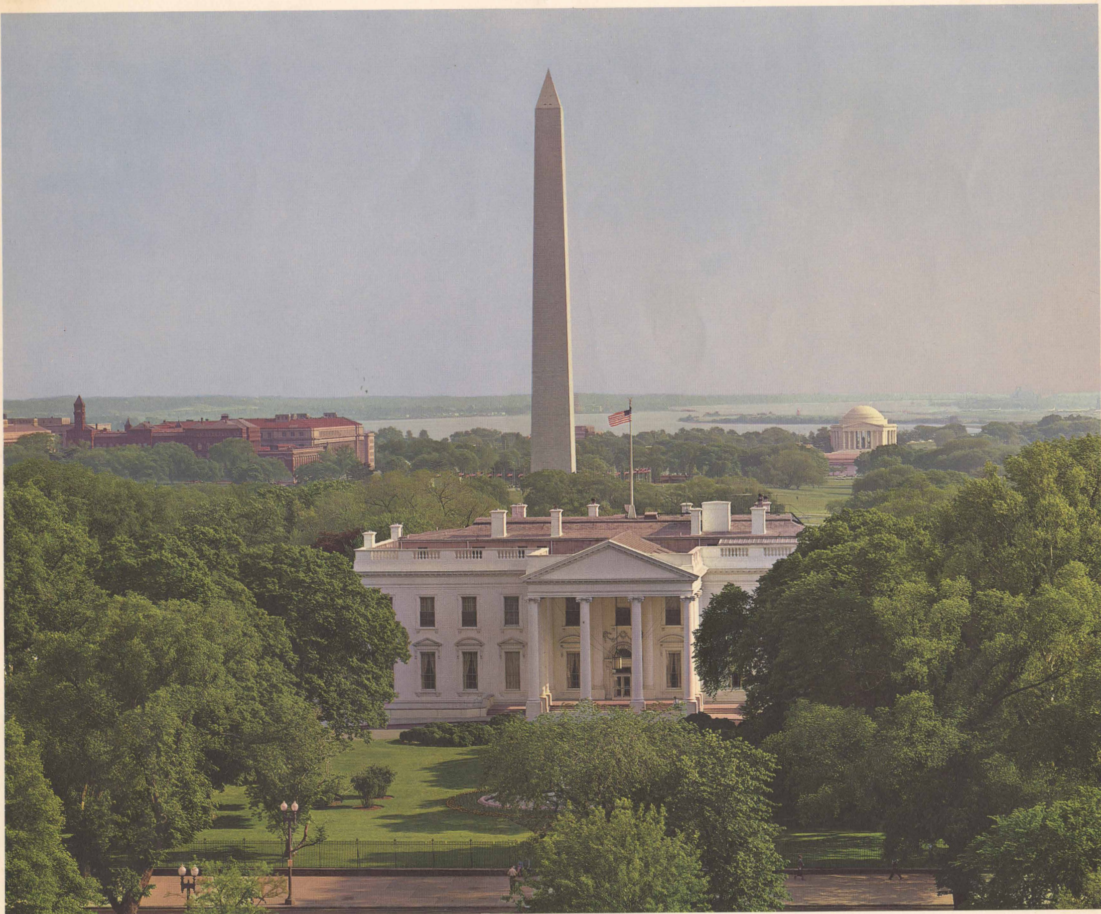
THE WHITE HOUSE, WASHINGTON MONUMENT AND THOMAS JEFFERSON MEMORIAL, WASHINGTON, D. C.