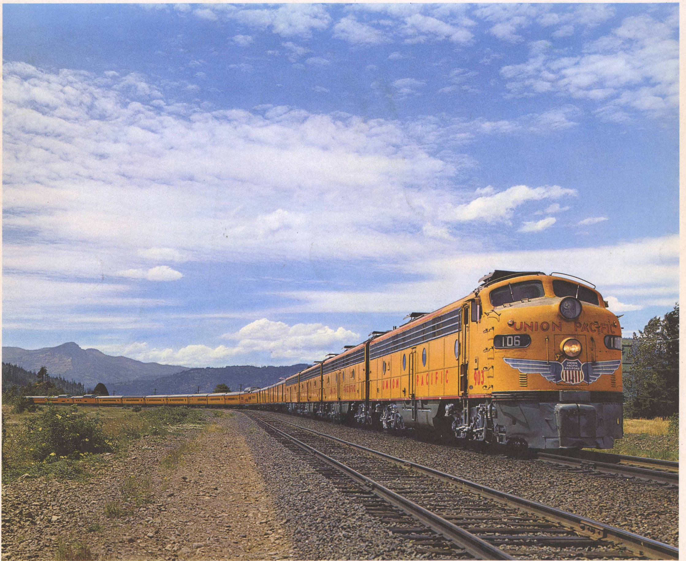
DOMELINER "CITY OF PORTLAND—CITY OF DENVER" IN THE COLUMBIA RIVER GORGE