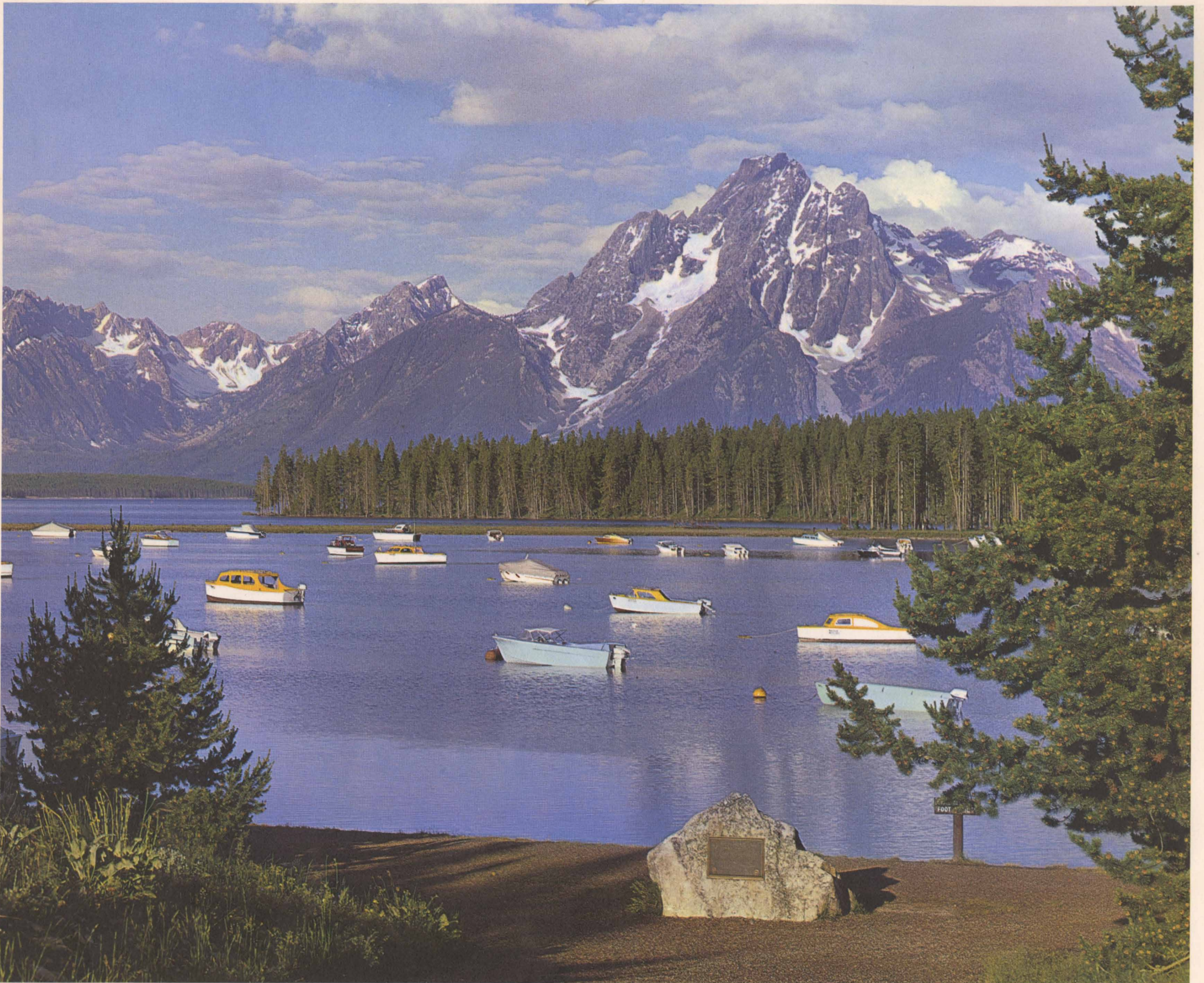
COLTER BAY, JACKSON LAKE, GRAND TETON NATIONAL PARK, WYOMING