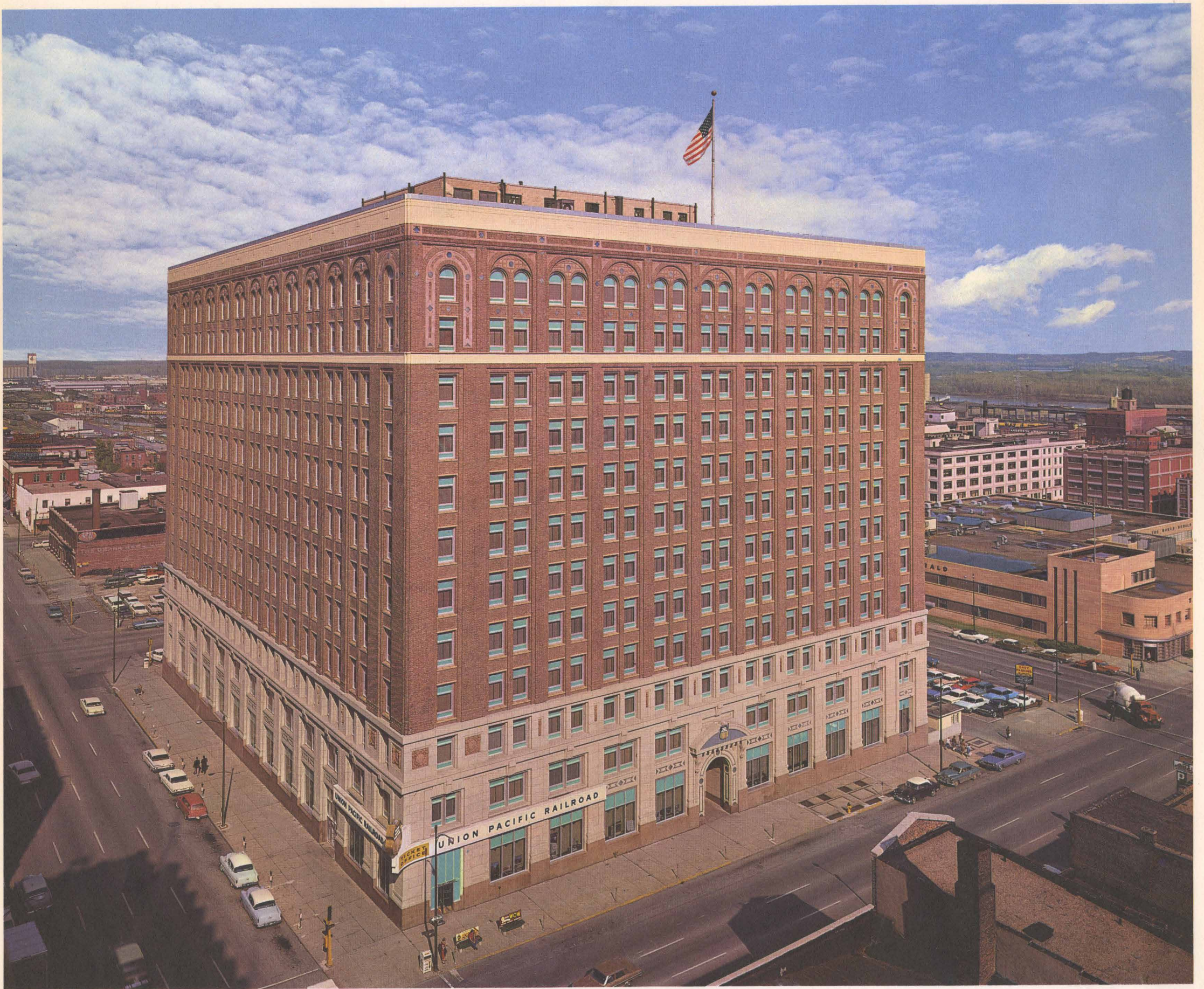
HEADQUARTERS BUILDING OF THE UNION PACIFIC RAILROAD, OMAHA, NEBRASKA