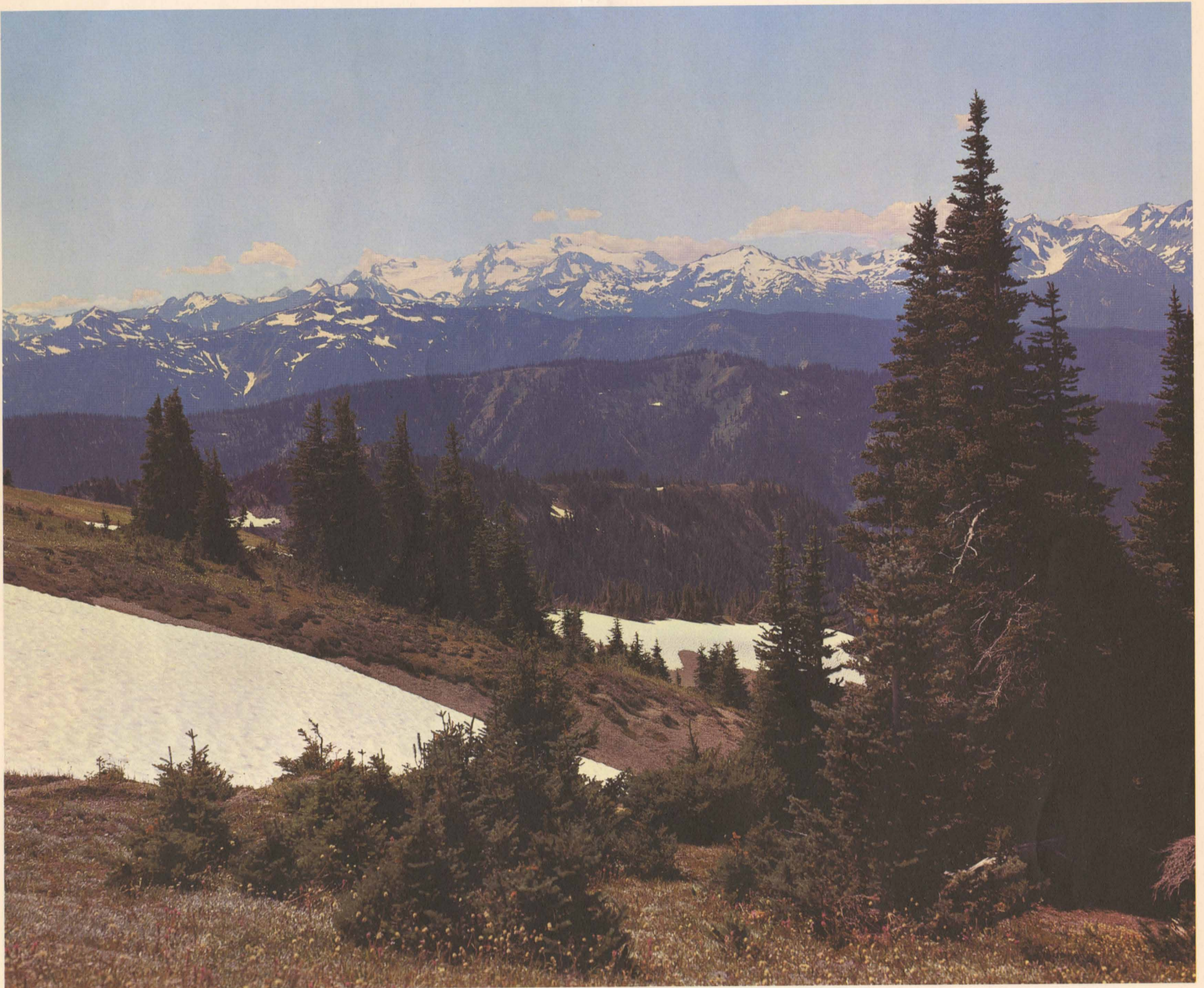
OLYMPIC MOUNTAINS, OLYMPIC NATIONAL PARK, NORTHWEST WASHINGTON