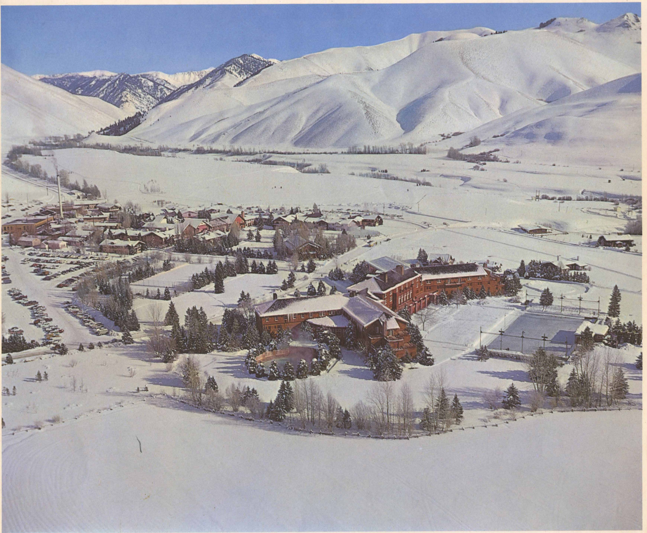
SUN VALLEY, IDAHO BECKONS SKIERS FROM NOVICE TO OLYMPIC COMPETITOR