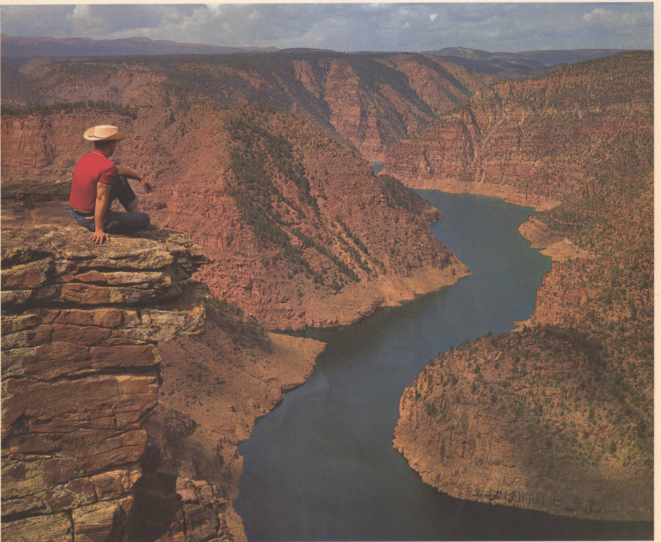
RED CANYON OVERLOOK ABOVE FLAMING GORGE LAKE, NORTHEASTERN UTAH