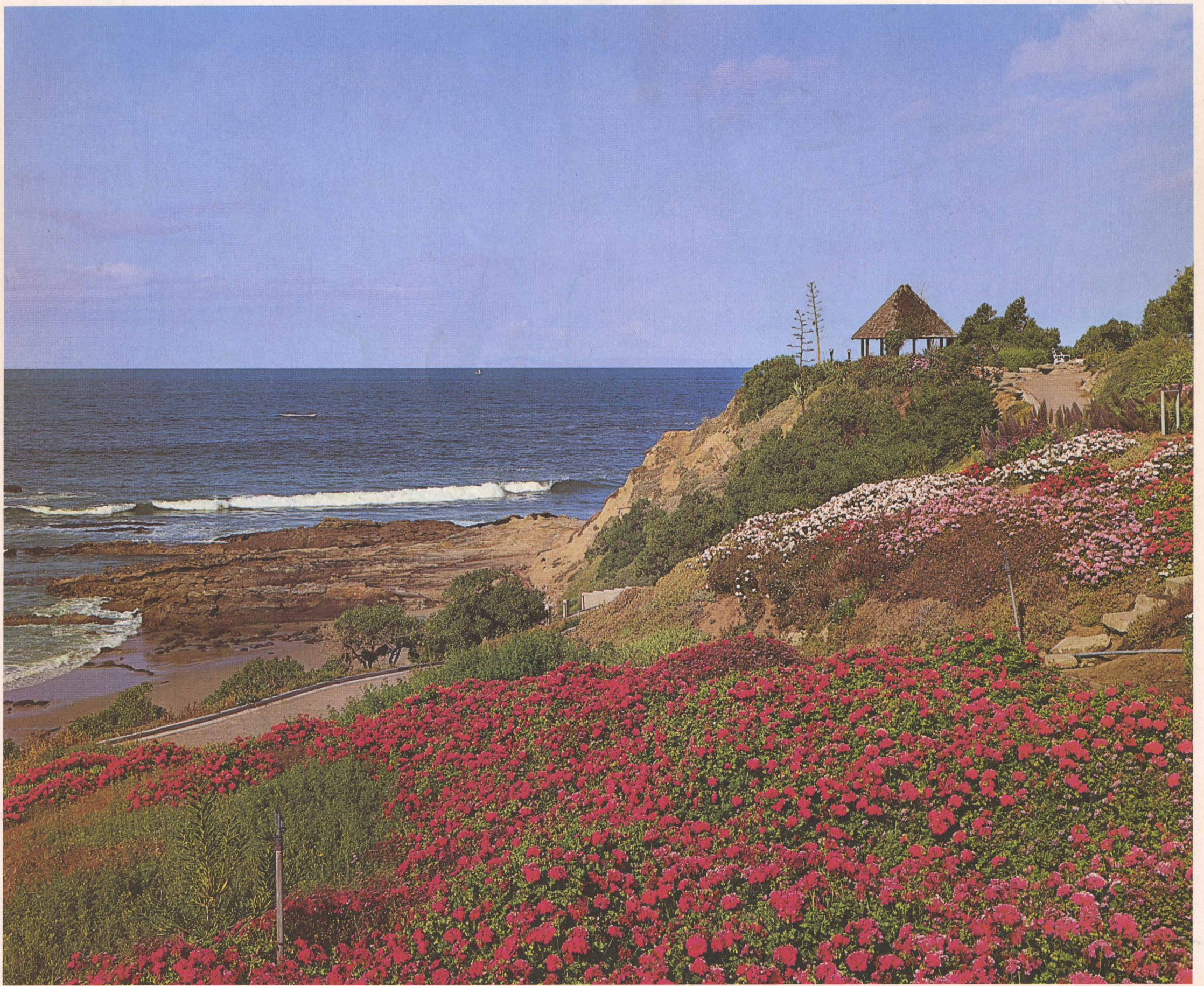
BEAUTIFUL GARDENS AND THE SPARKLING PACIFIC AT LAGUNA BEACH, CALIFORNIA