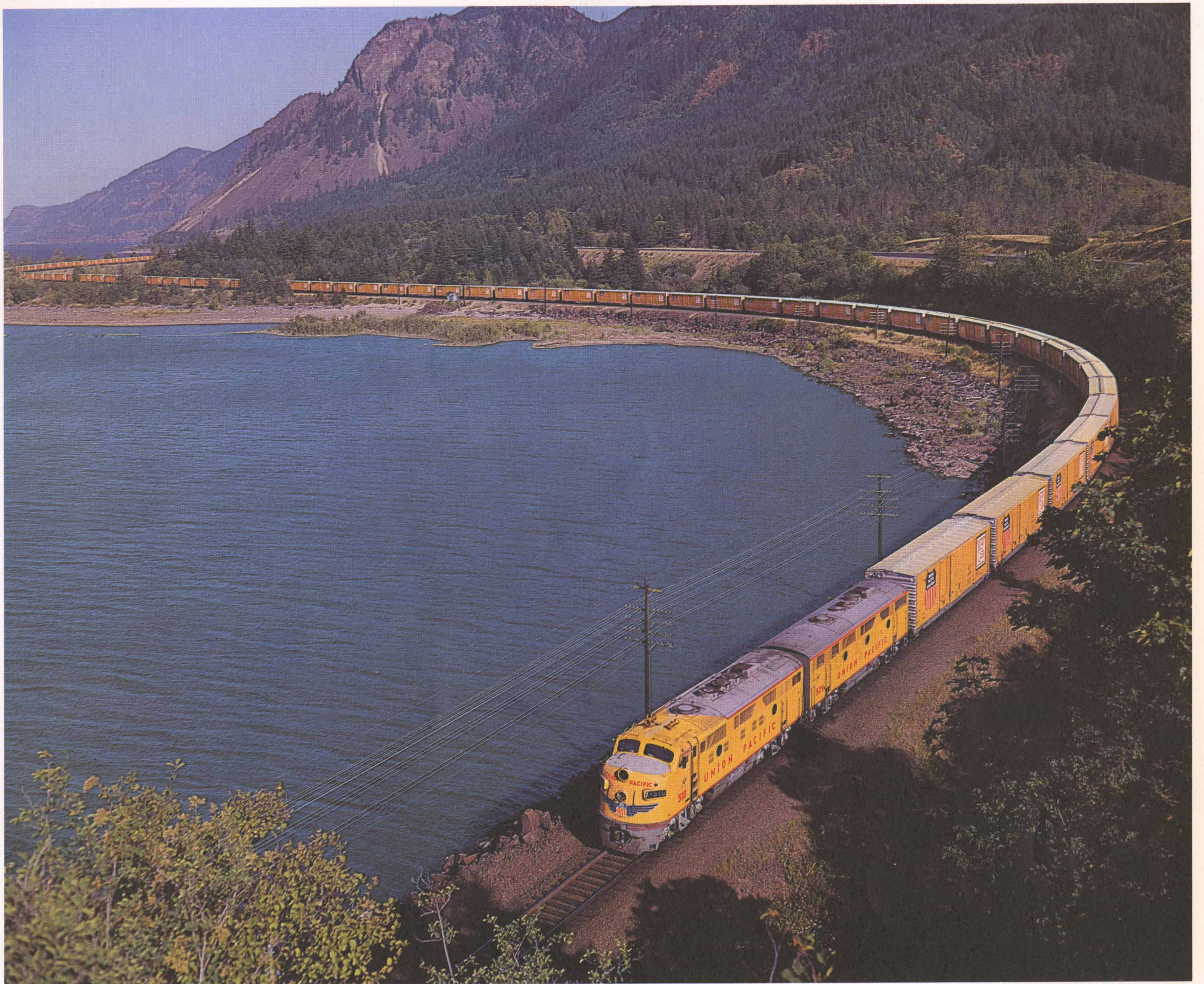
UNION PACIFIC FREIGHT WINDS THROUGH THE BEAUTIFUL COLUMBIA RIVER GORGE