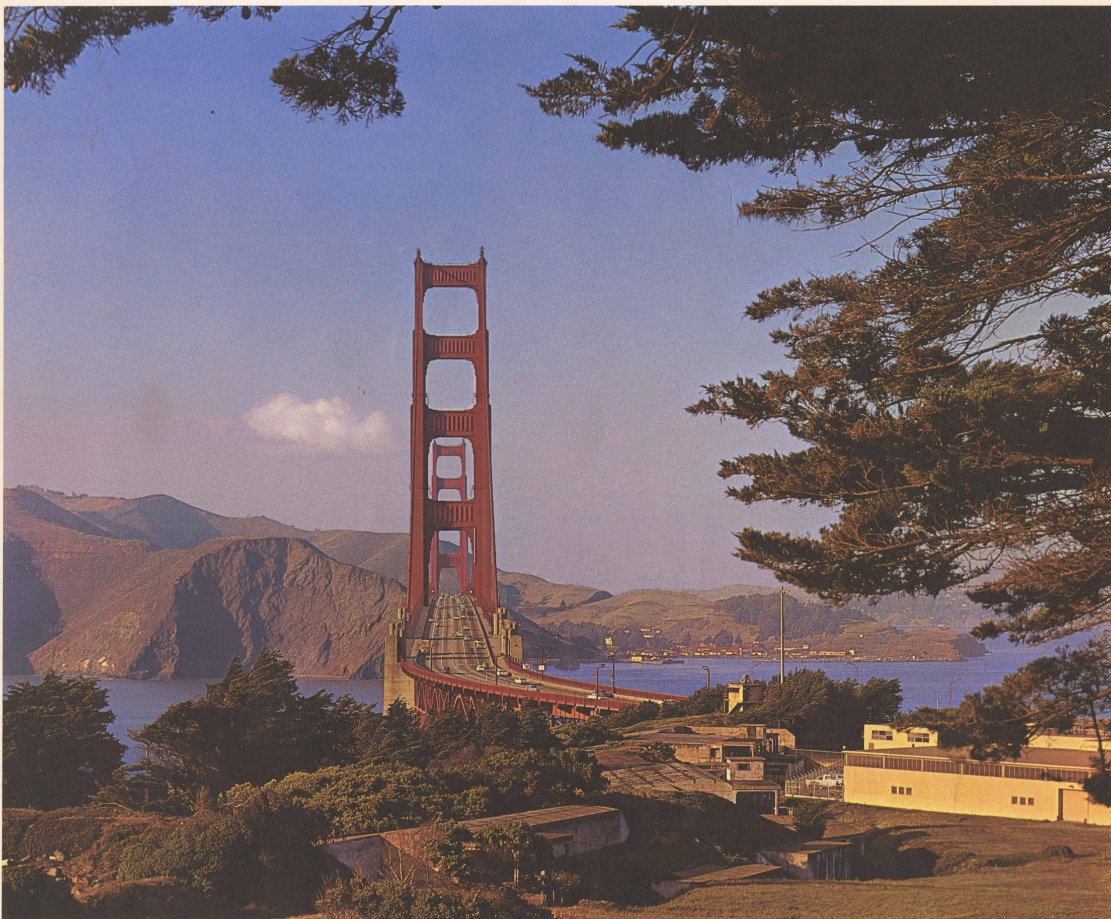
LOOKING ACROSS THE GOLDEN GATE, SAN FRANCISCO, CALIFORNIA