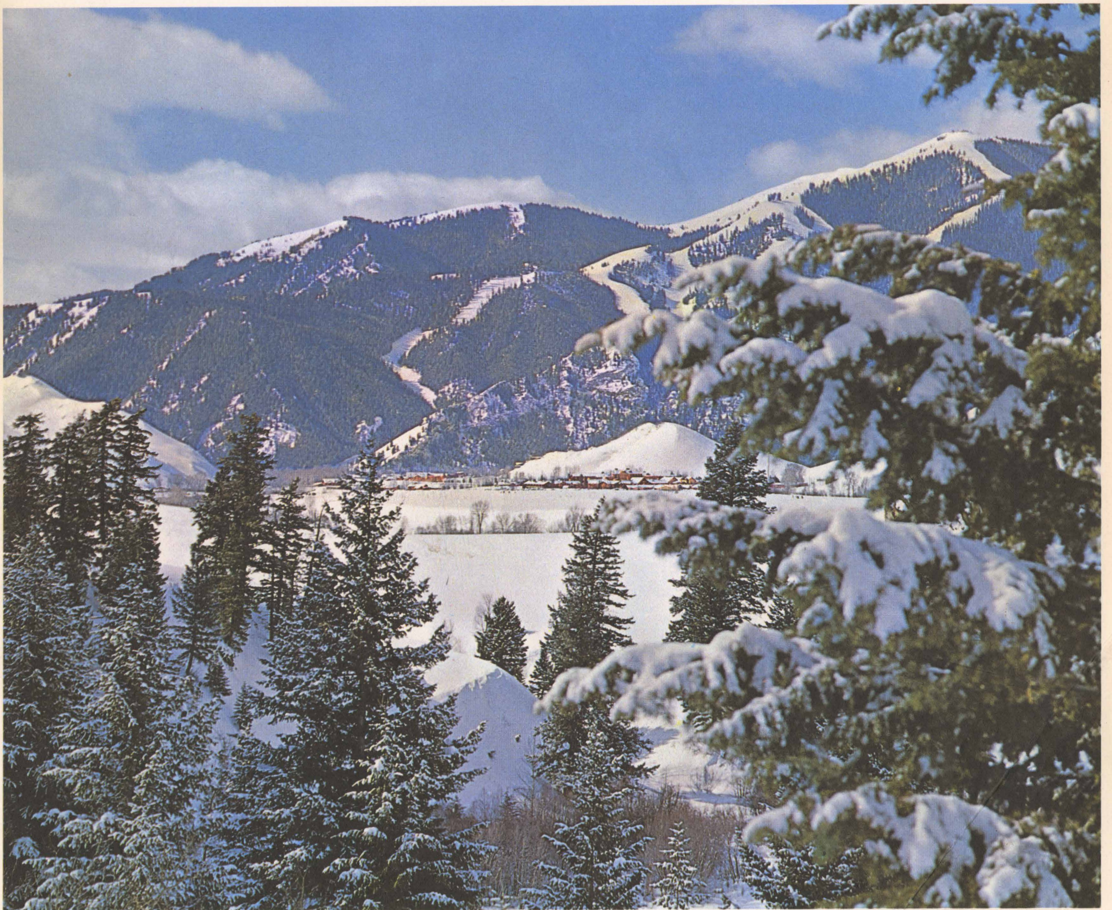
SUN VALLEY, IDAHO—SKIERS' PARADISE, MANTLED WITH FRESH SNOW