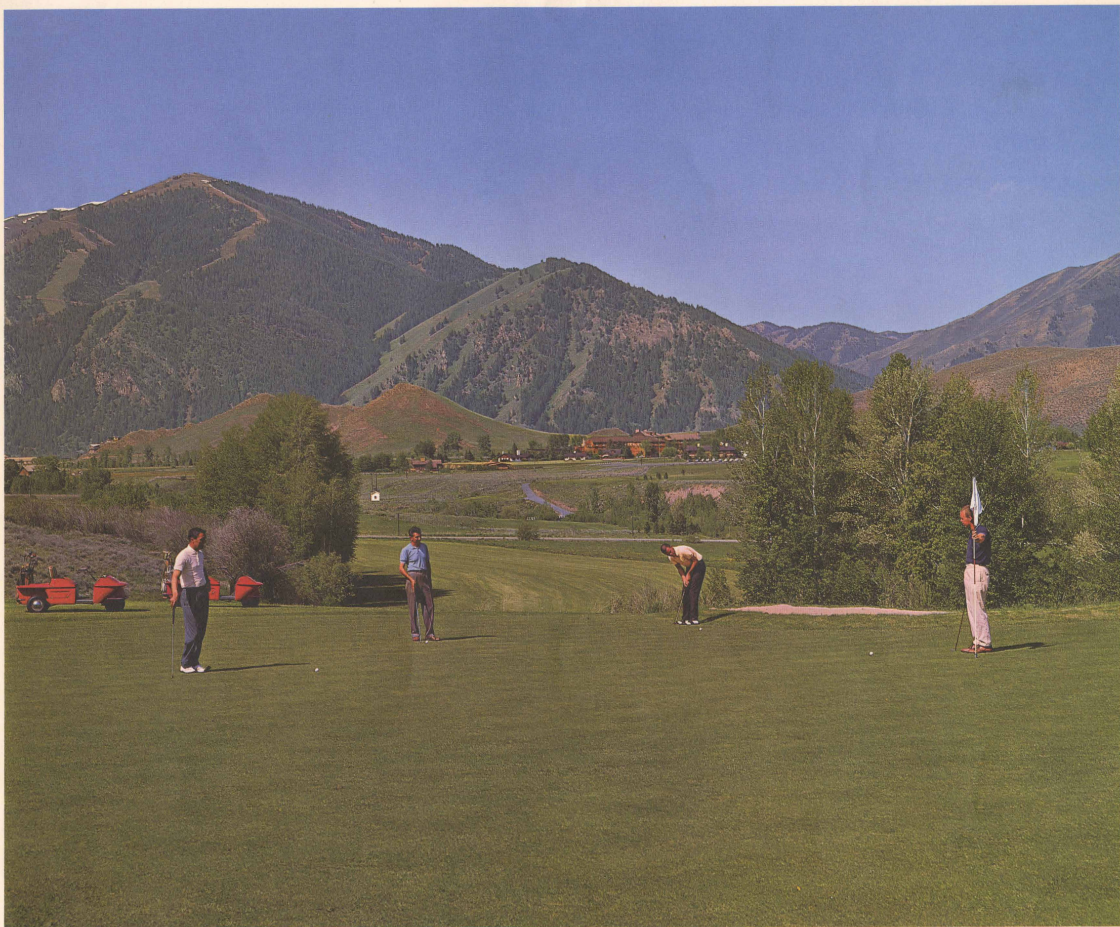
WARM SUN AND CRISP AIR MAKE FOR PERFECT GOLFING AT SUN VALLEY, IDAHO