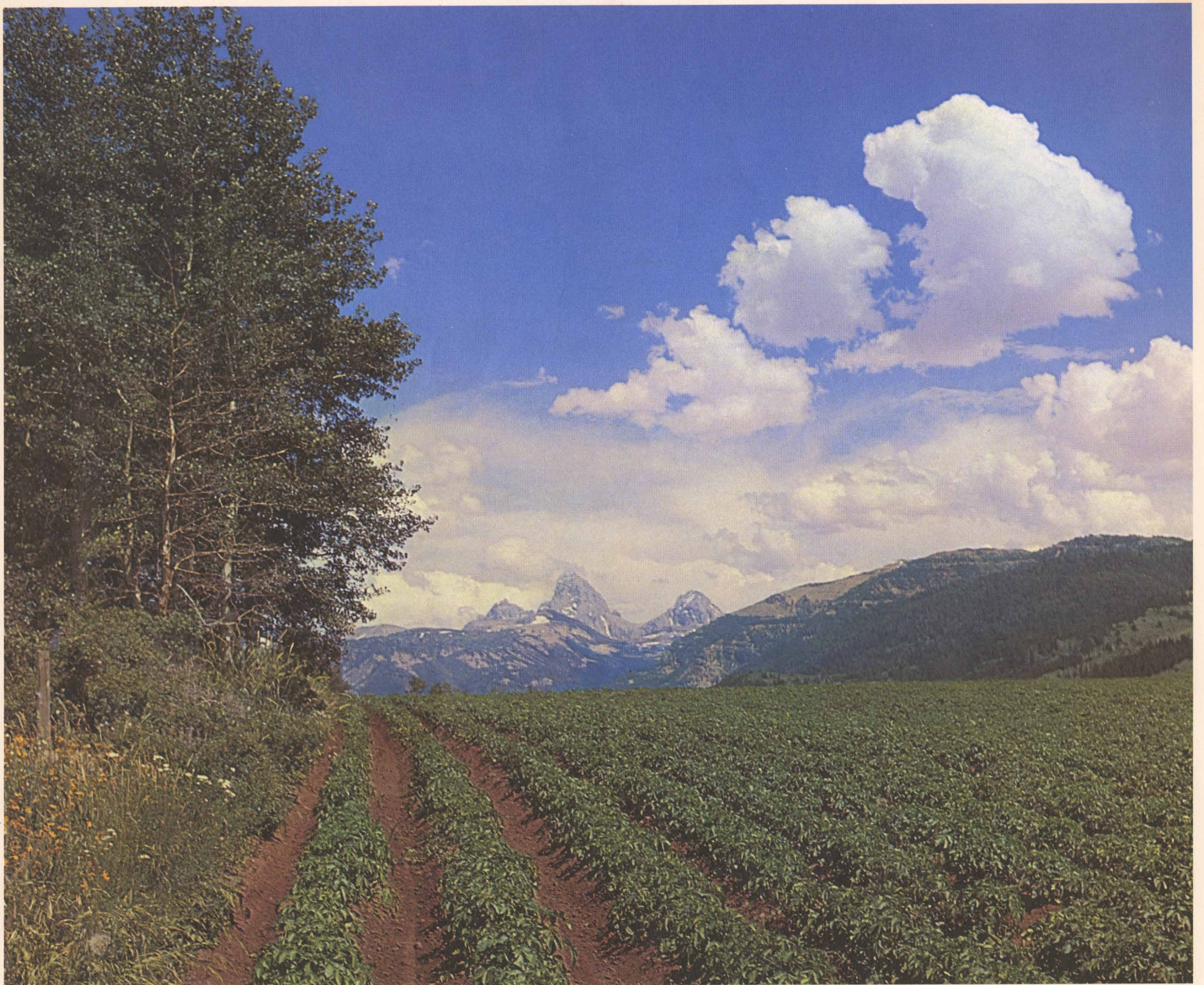
POTATOES GROWING IN IDAHO'S RICH RED SOIL, TETON MOUNTAINS IN DISTANCE