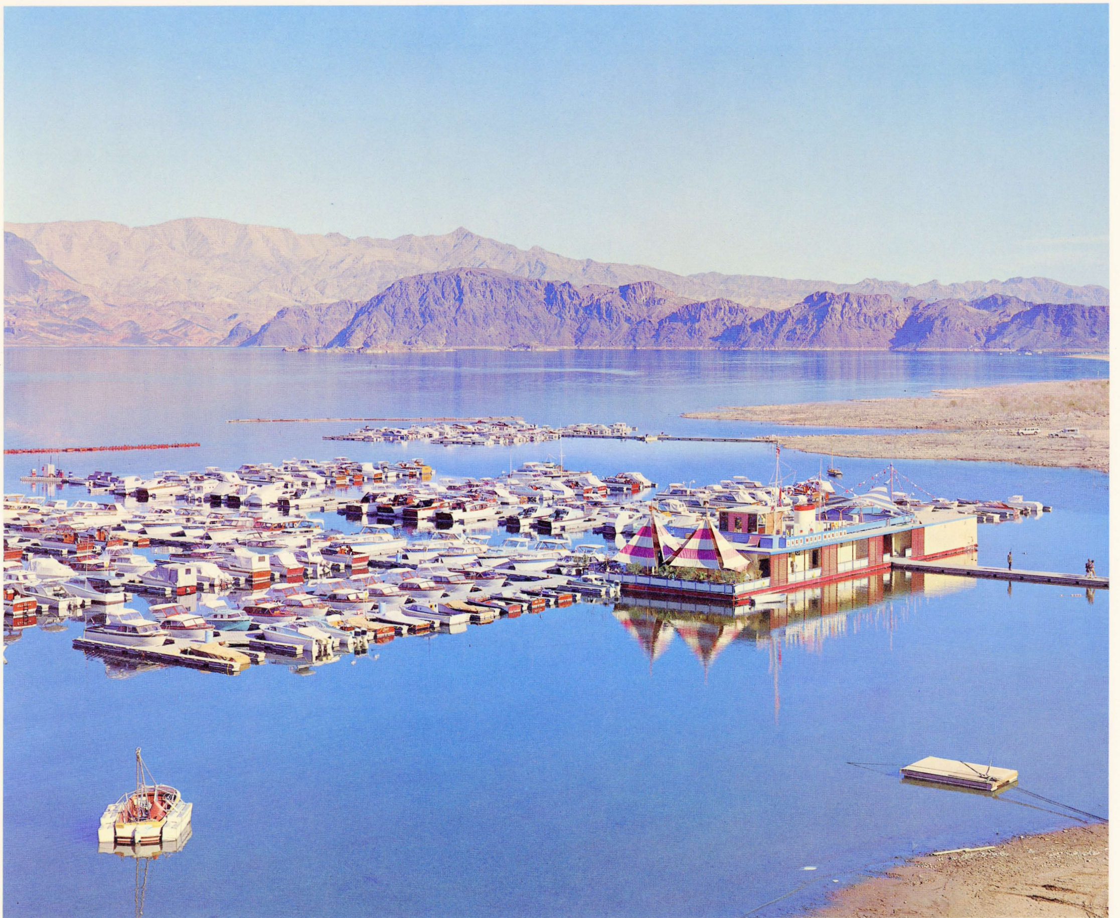
NEW MARINA, LAKE MEAD NATIONAL RECREATION AREA, NEAR LAS VEGAS, NEVADA