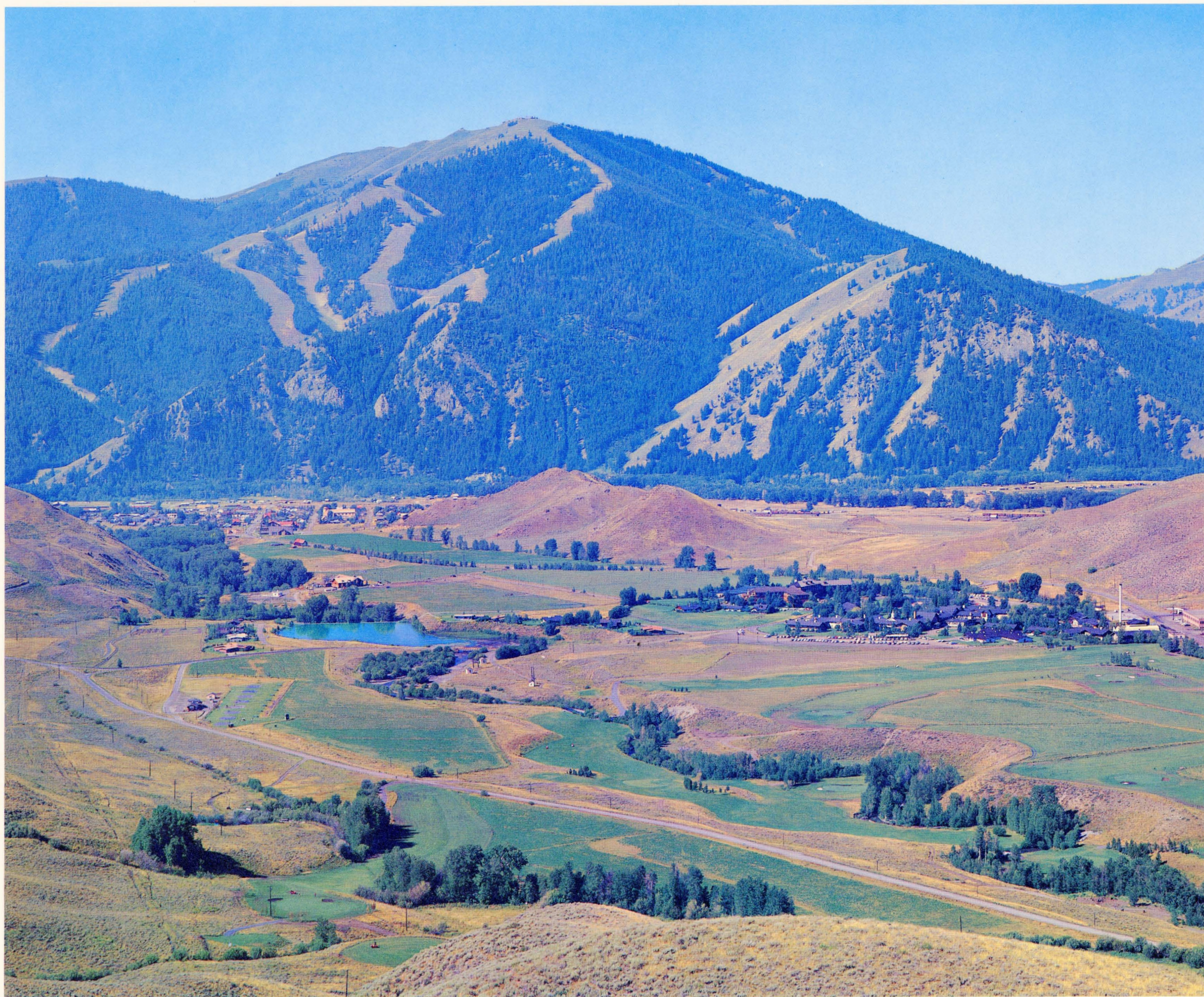
EVERYTHING TO MAKE A PERFECT FAMILY VACATION, SUN VALLEY, IDAHO