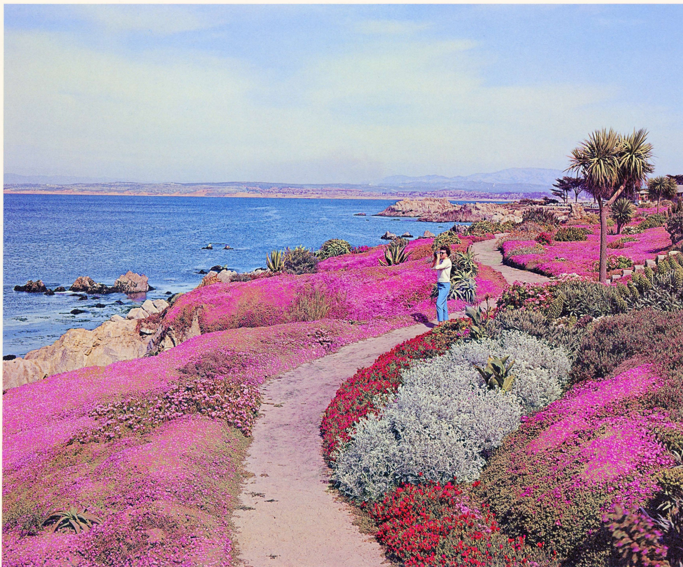
MUNICIPAL FLOWER BEDS OF PACIFIC GROVE, MONTEREY PENINSULA, CALIFORNIA