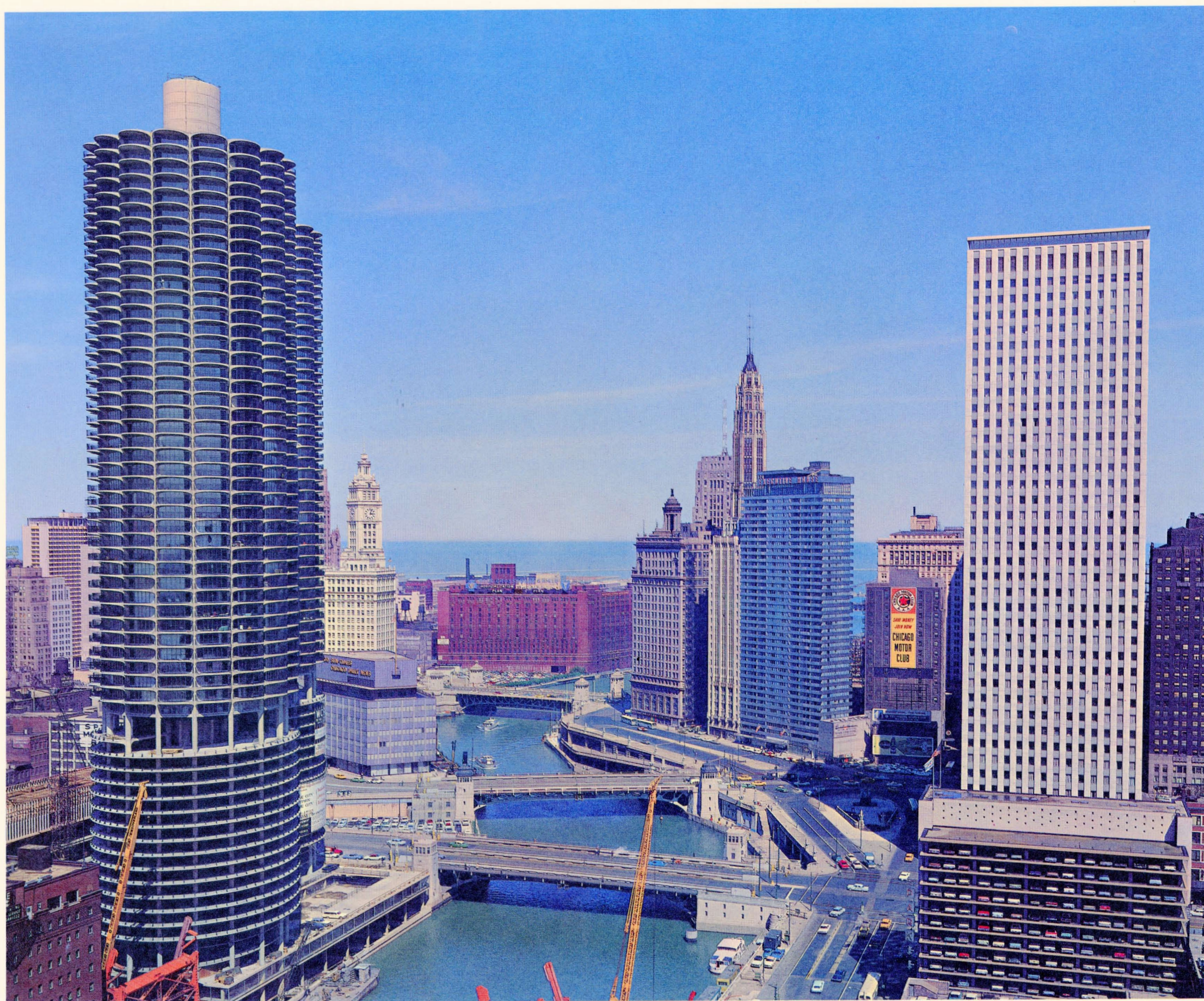
NEW SKYLINE ALONG CHICAGO RIVER AND WACKER DRIVE . . . LAKE MICHIGAN