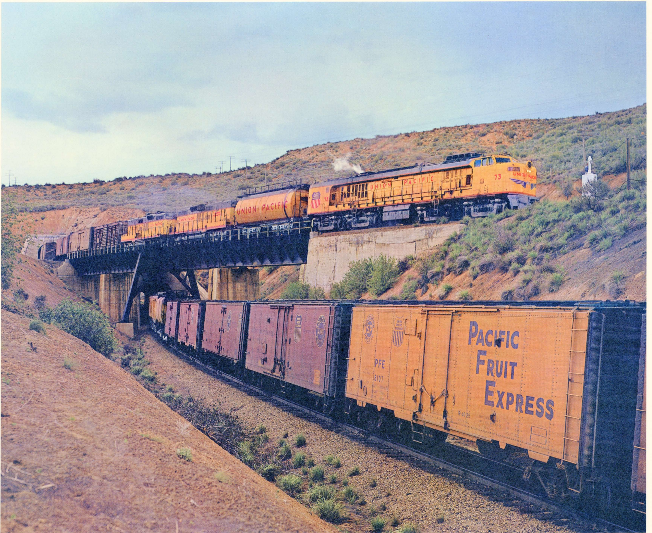
"WHERE EAST MEETS WEST", WEST OF WAHSATCH, UTAH