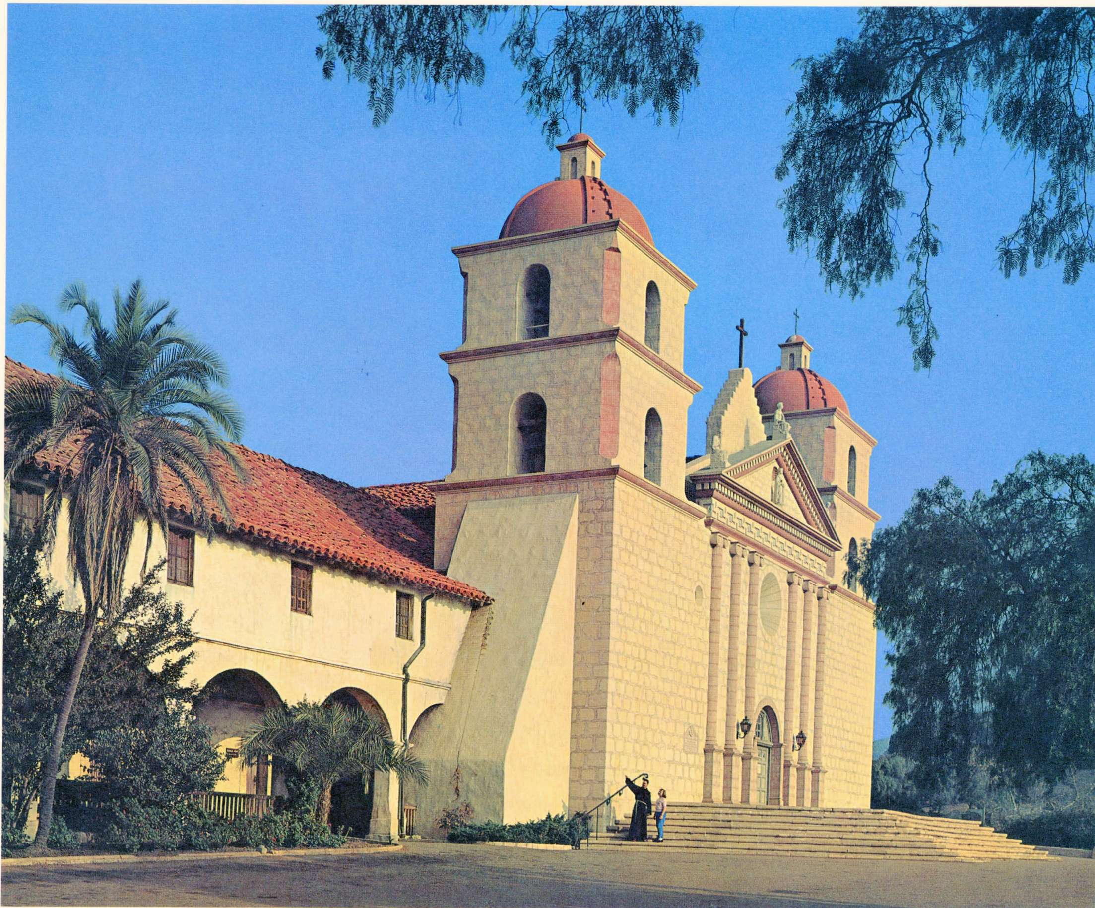
MISSION SANTA BARBARA, CALIFORNIA . . . A CLASSIC EXAMPLE OF SPANISH ARCHITECTURE