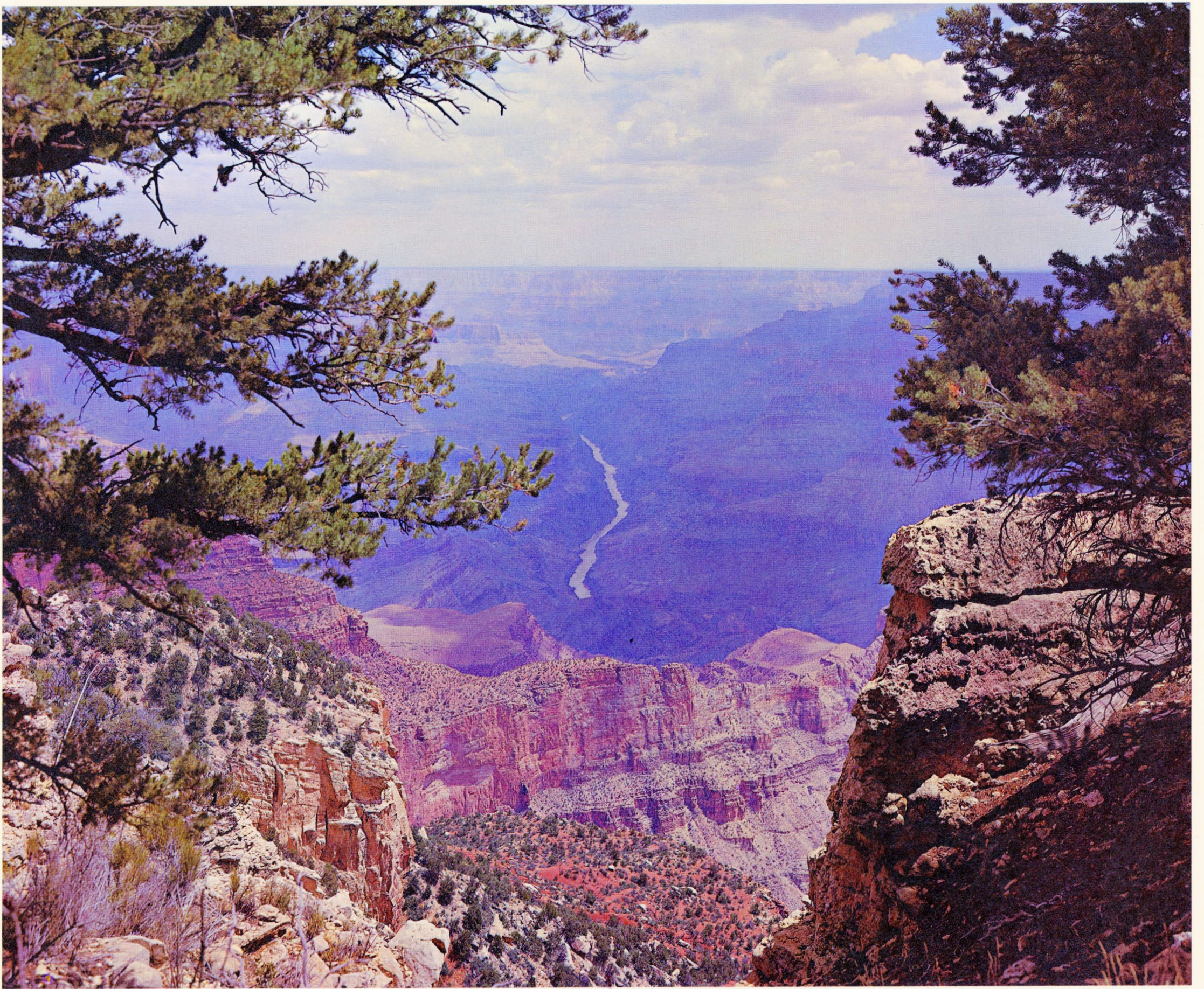
COLORADO RIVER FROM WHEELER POINT, (NORTH RIM) GRAND CANYON NAT'L. PARK, ARIZONA