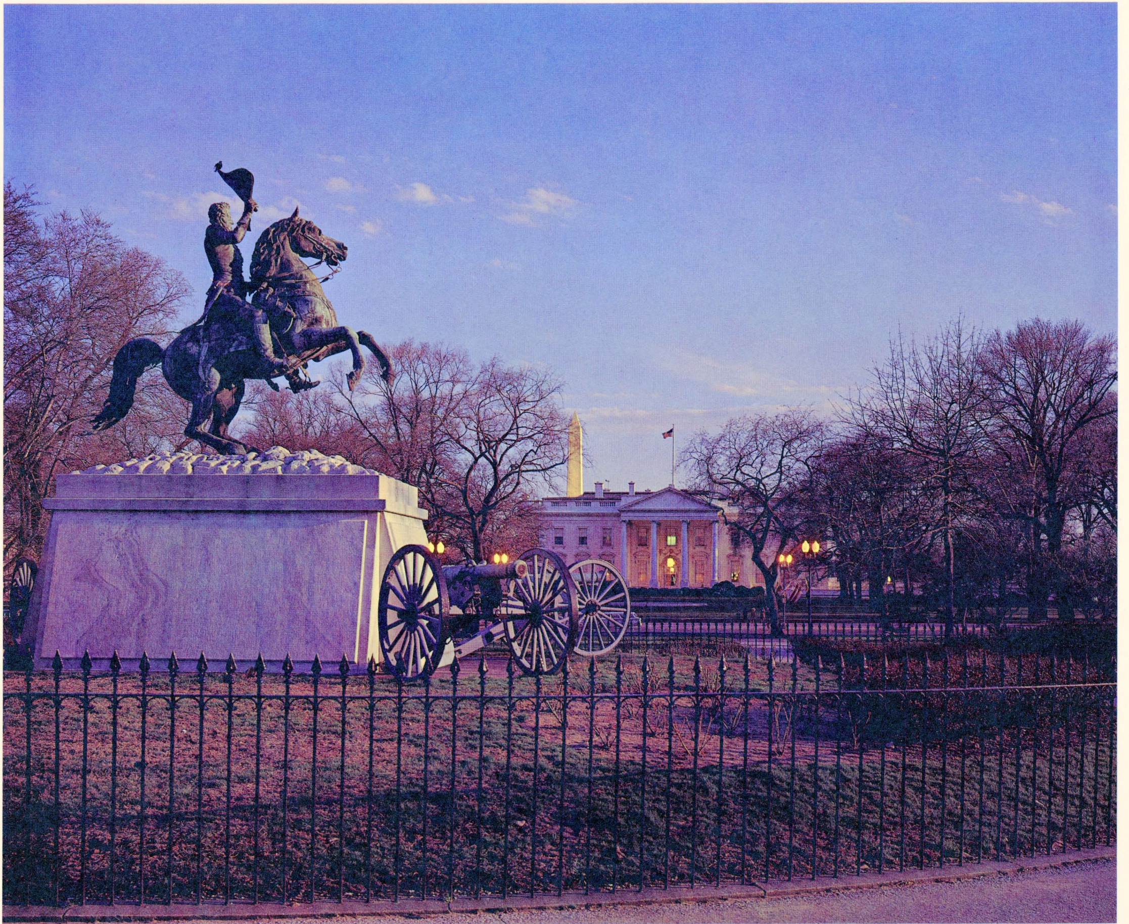
WHITE HOUSE AND ANDREW JACKSON STATUE AT DUSK, WASHINGTON, D. C.