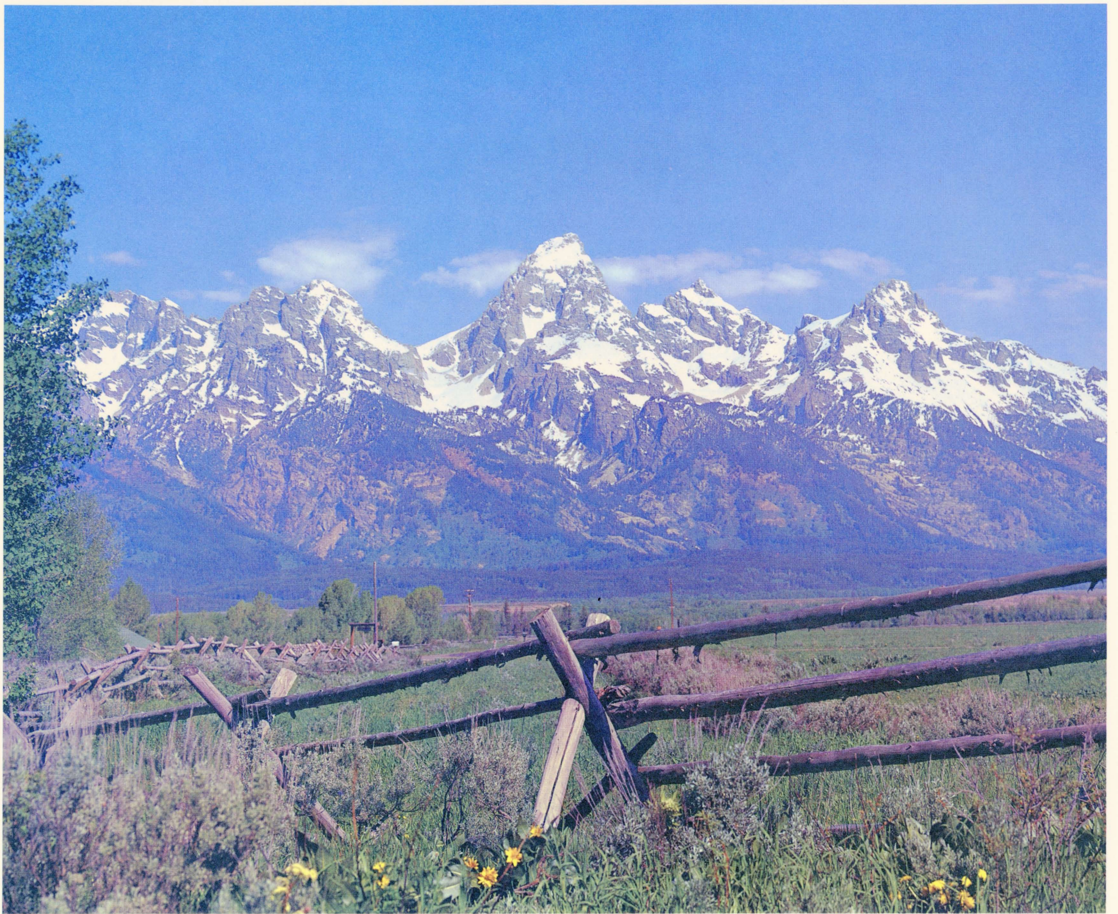
"MAJESTIC" IS THE WORD FOR GRAND TETON NATIONAL PARK, WYOMING