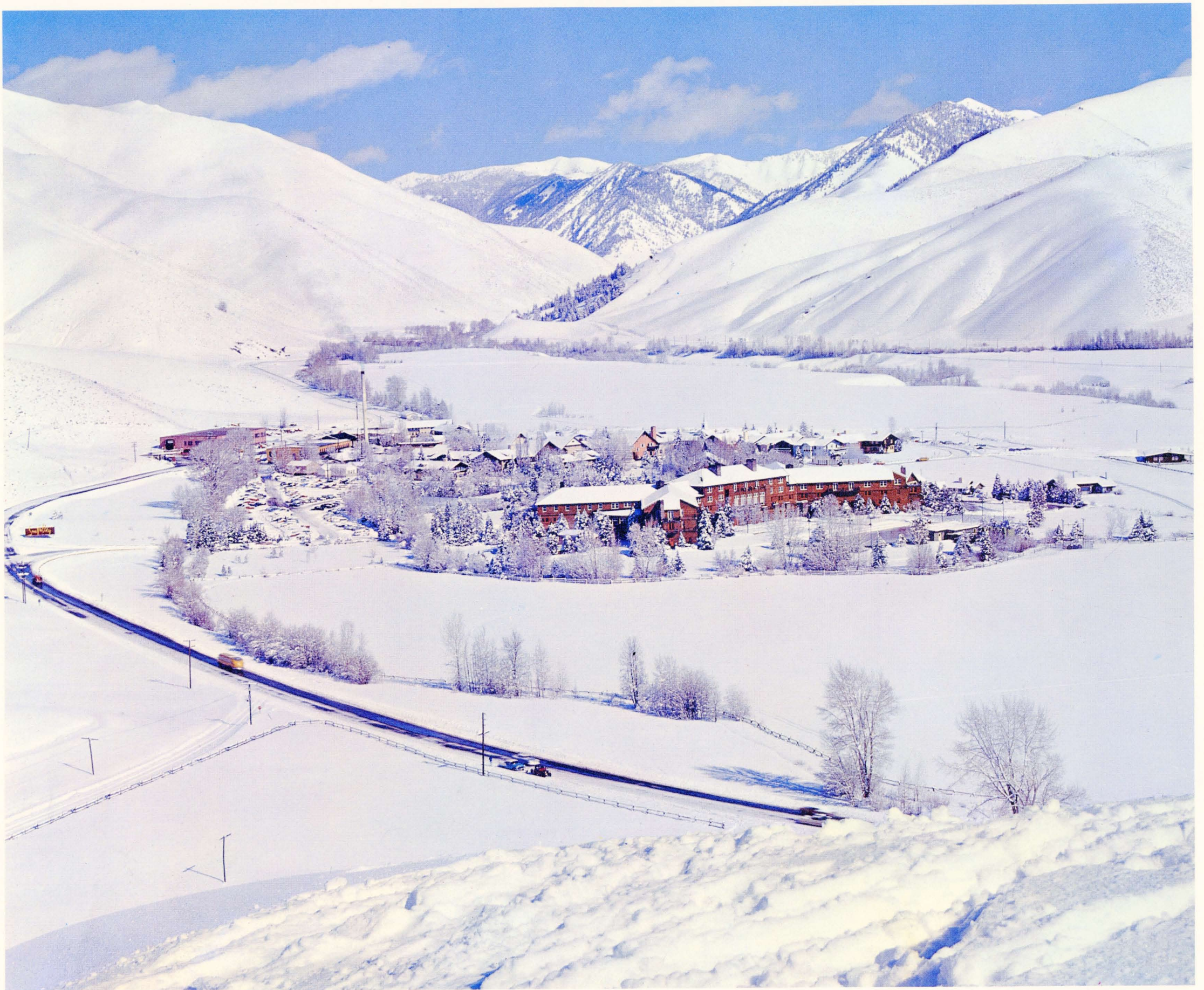
ONE OF THE WORLD'S FINEST SKI RESORTS, SUN VALLEY, IDAHO