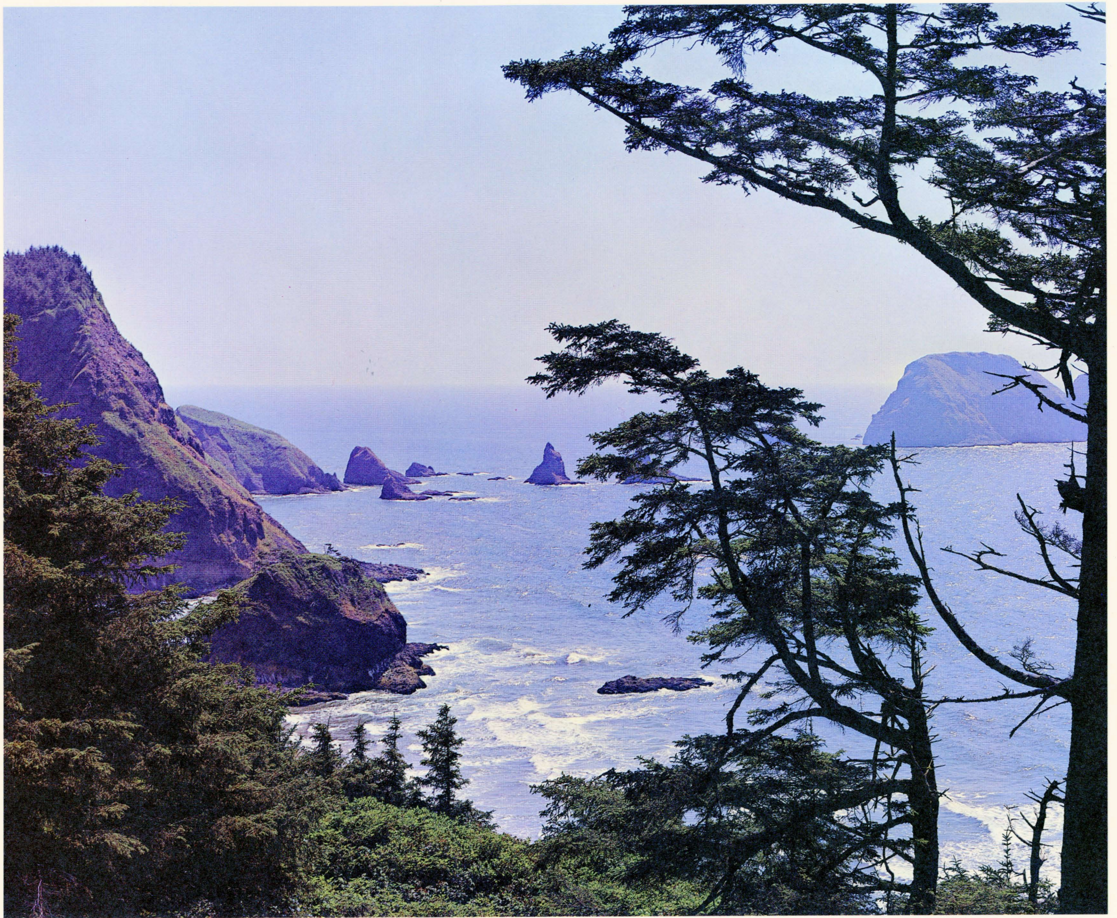
PICTURESQUE COASTLINE NEAR CAPE MEARS, OREGON