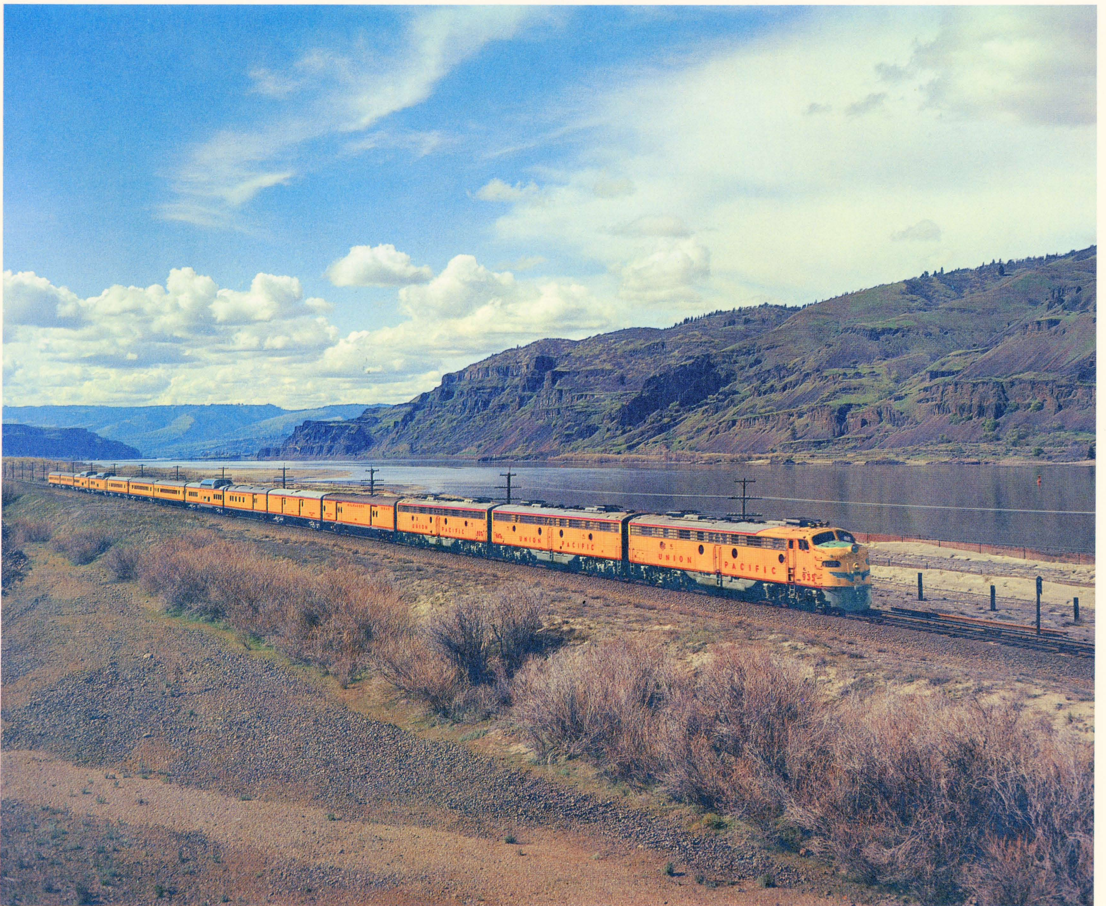
DOMELINER "CITY OF PORTLAND" AND COLUMBIA RIVER, NEAR THE DALLES, OREGON