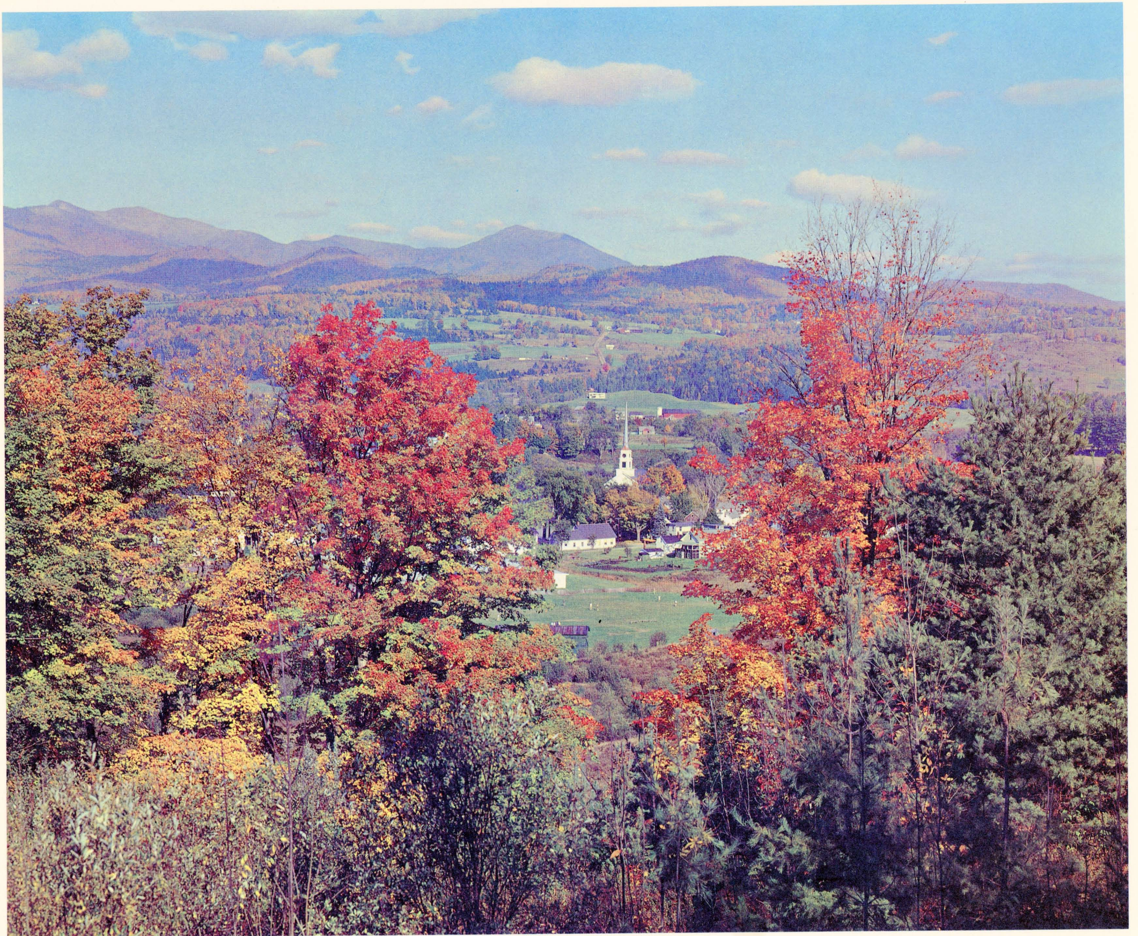
TYPICAL FALL SPLENDOR IN NEW ENGLAND, STOWE, VERMONT