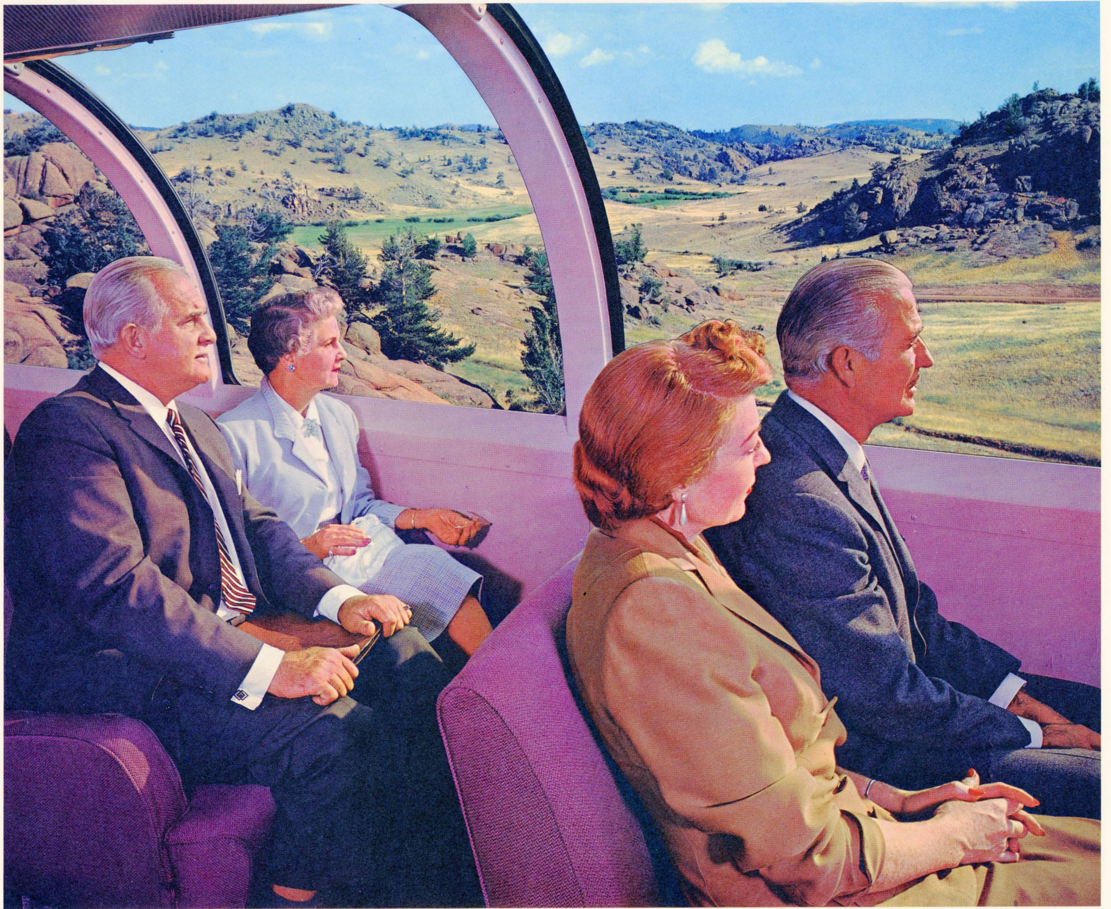
EVERCHANGING WESTERN PANORAMAS FROM UNION PACIFIC ASTRA-DOME LOUNGE CARS