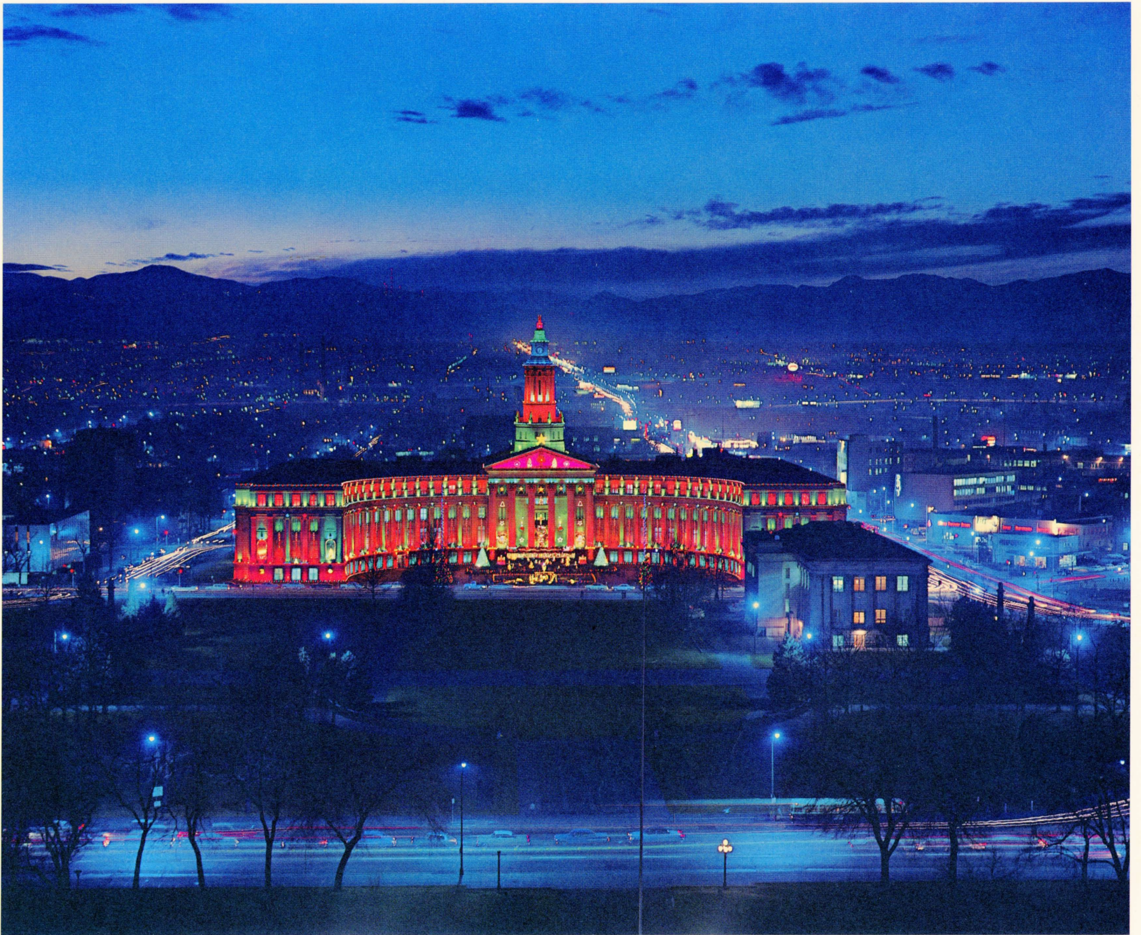
CITY AND COUNTY BUILDING, AGLOW WITH CHRISTMAS LIGHTS, DENVER, COLORADO