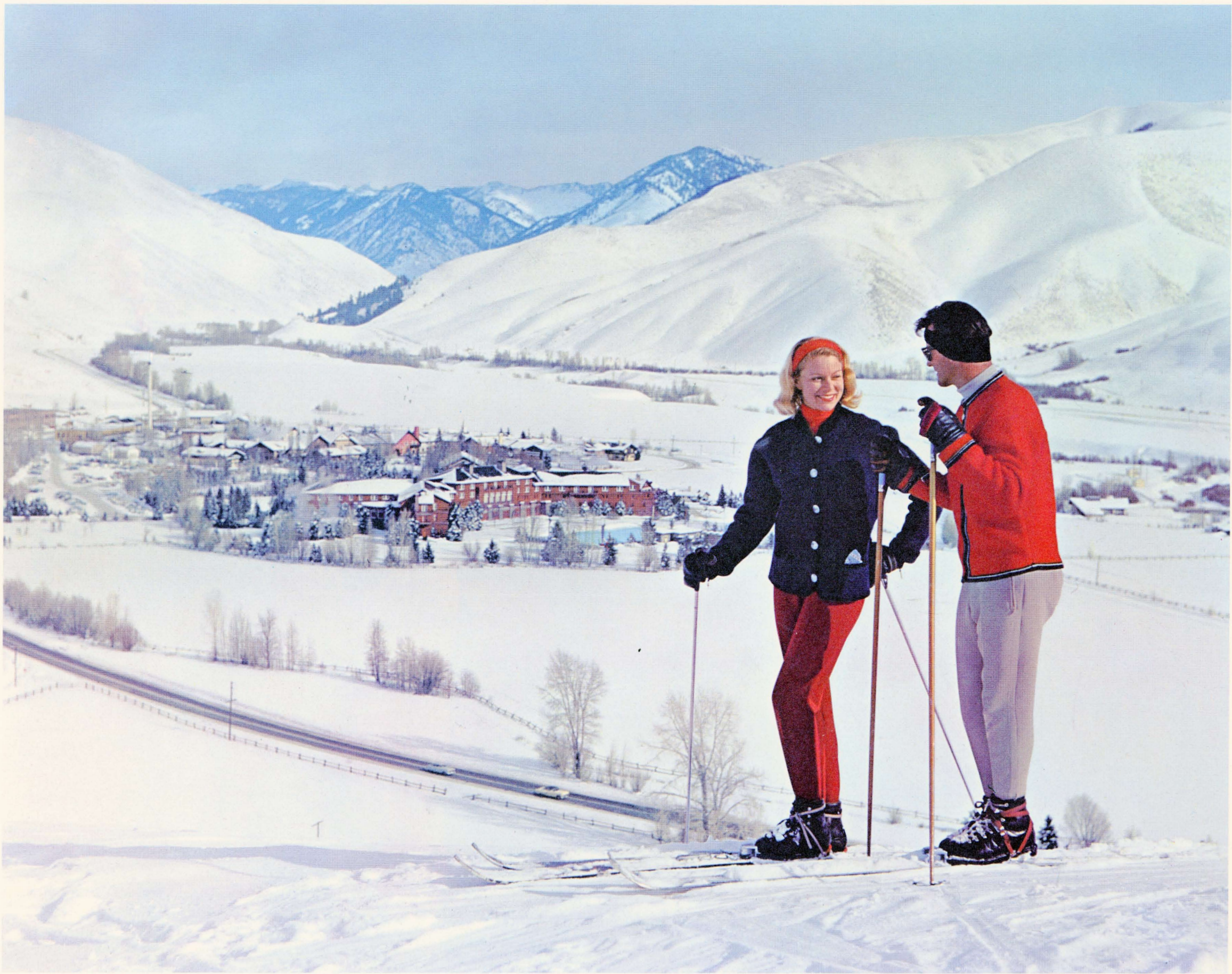
FOR OVER TWENTY-FIVE YEARS A SKIER'S PARADISE, SUN VALLEY, IDAHO