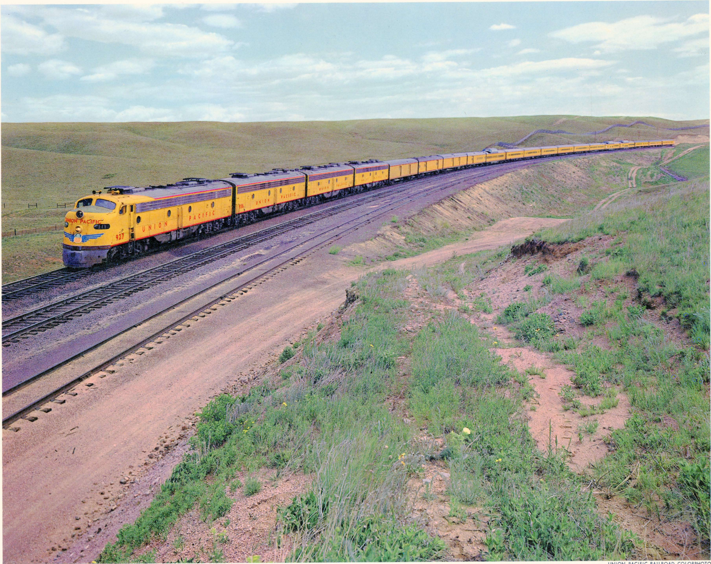
UNION PACIFIC DOMELINERS ARE UNSURPASSED FOR TRAVEL COMFORT