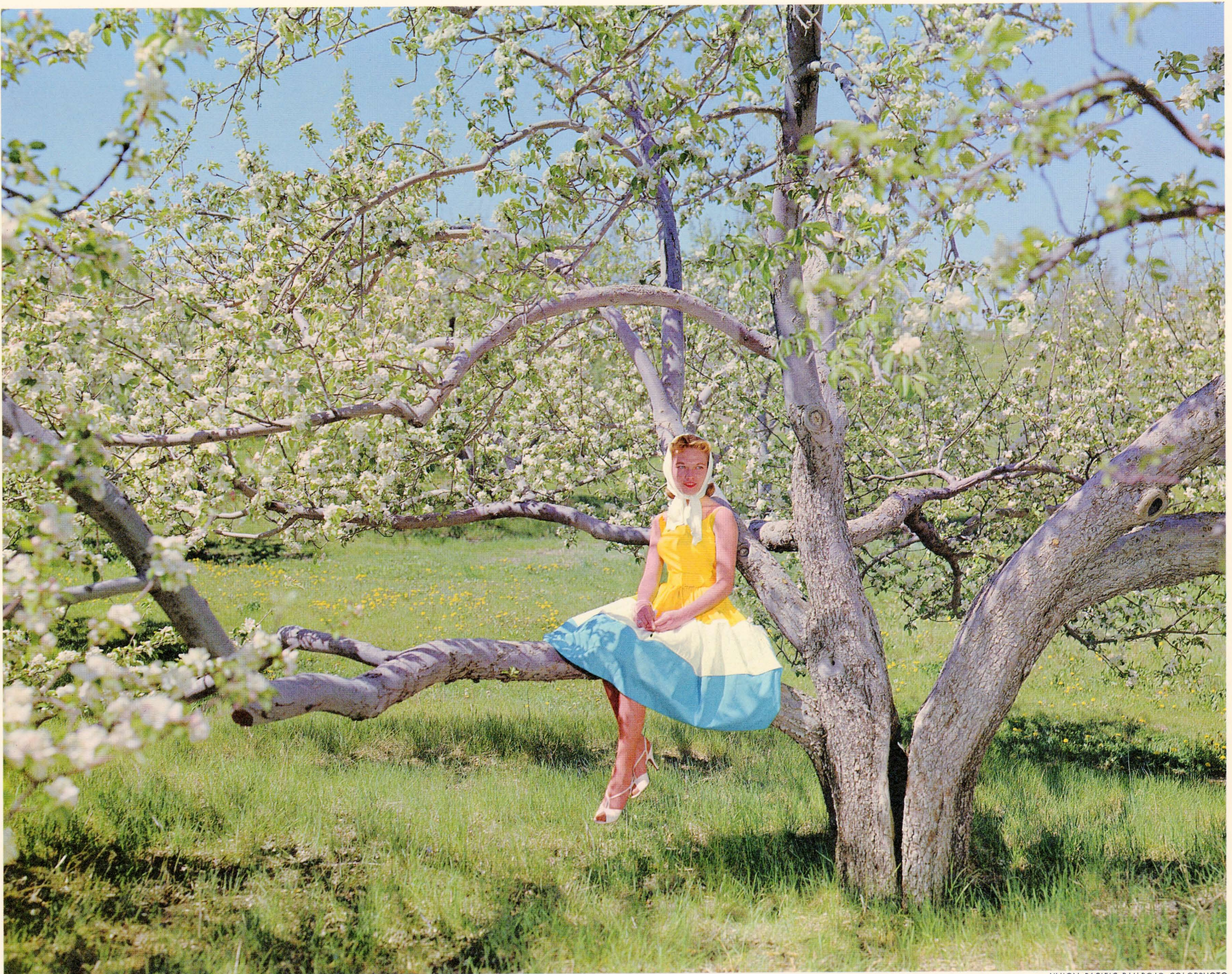
WHEN IT'S APPLE BLOSSOM TIME . . . IN THE MIDWEST