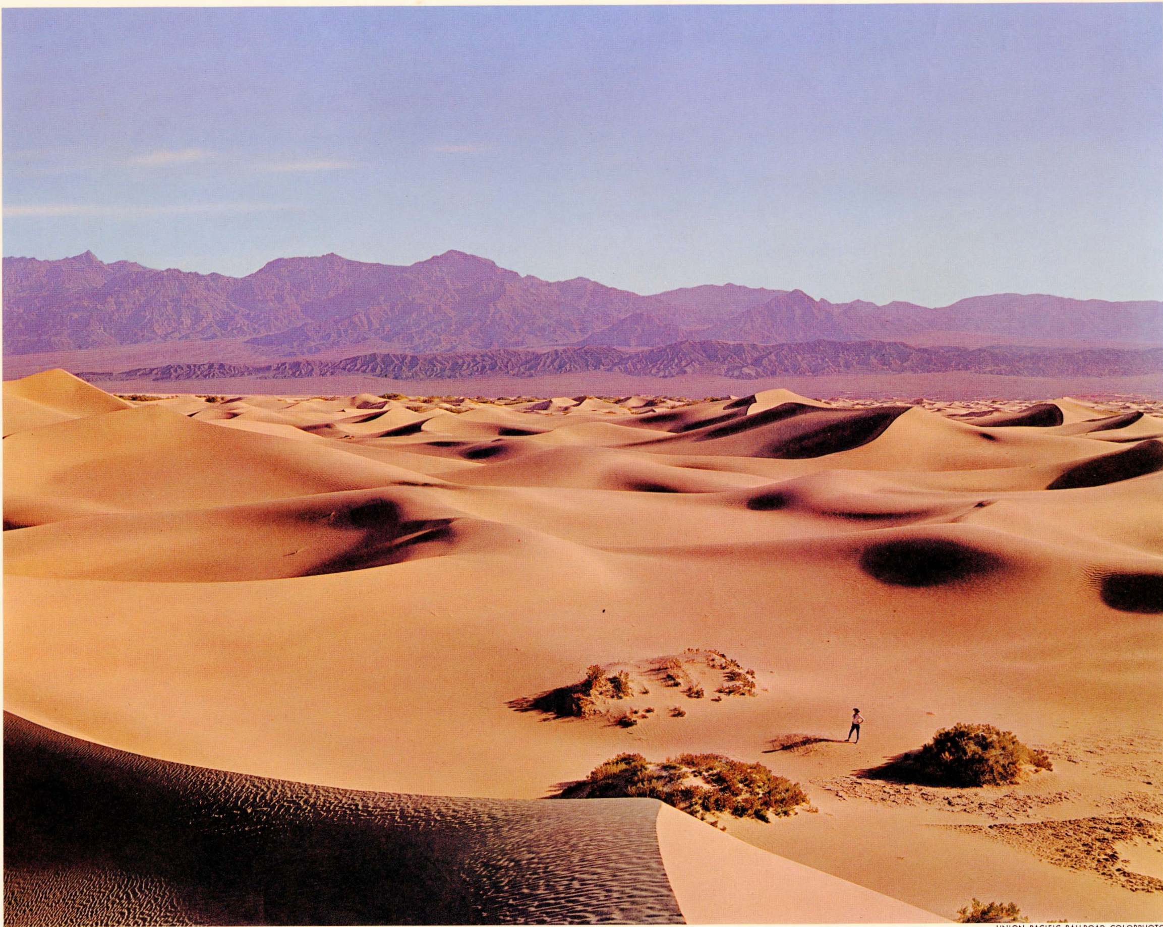
UNION PACIFIC RAILROAD COLORPHOTO