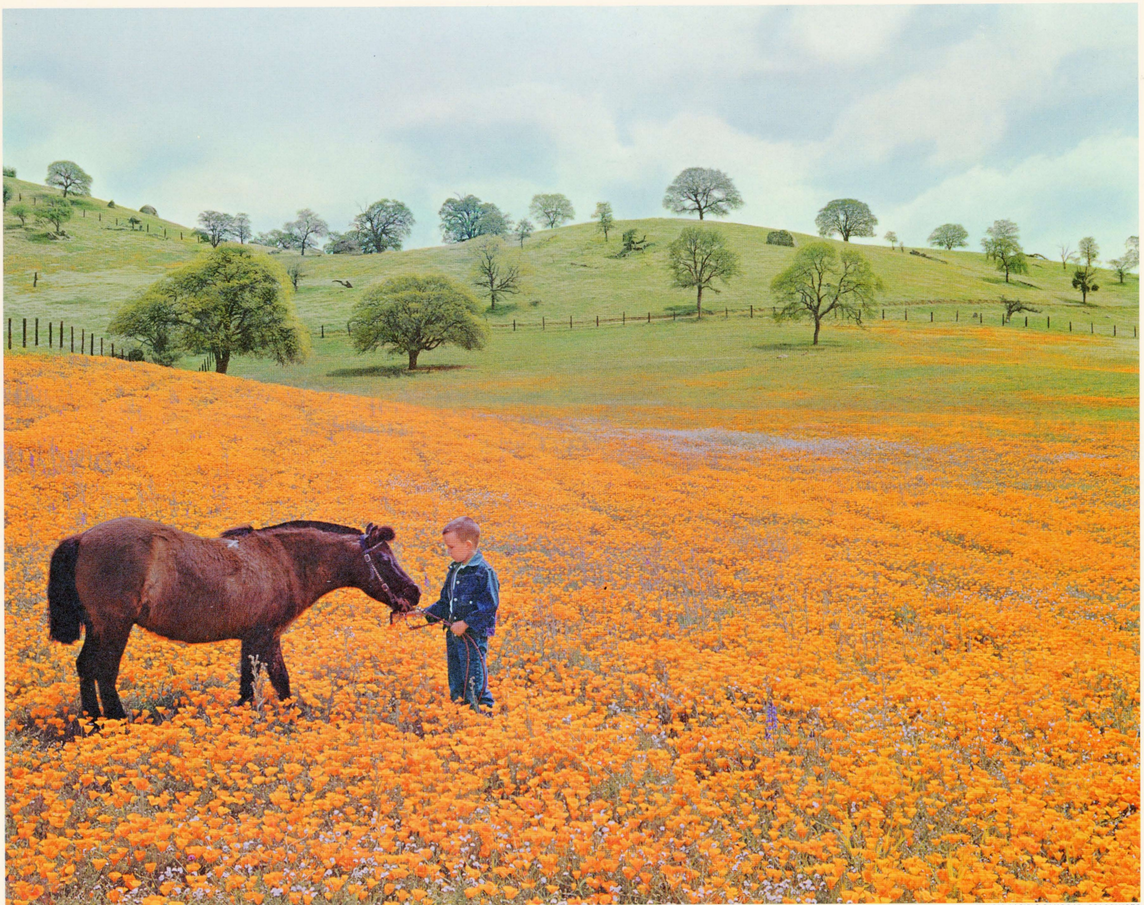
GOLDEN POPPY—THE STATE FLOWER OF CALIFORNIA