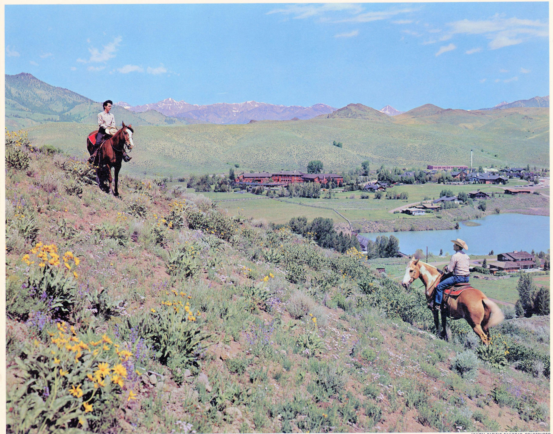
UNION PACIFIC RAILROAD COLORPHOTO

PERFECT SETTING FOR A THRILLING VACATION . . . SUMMER OR WINTER . . . SUN VALLEY, IDAHO