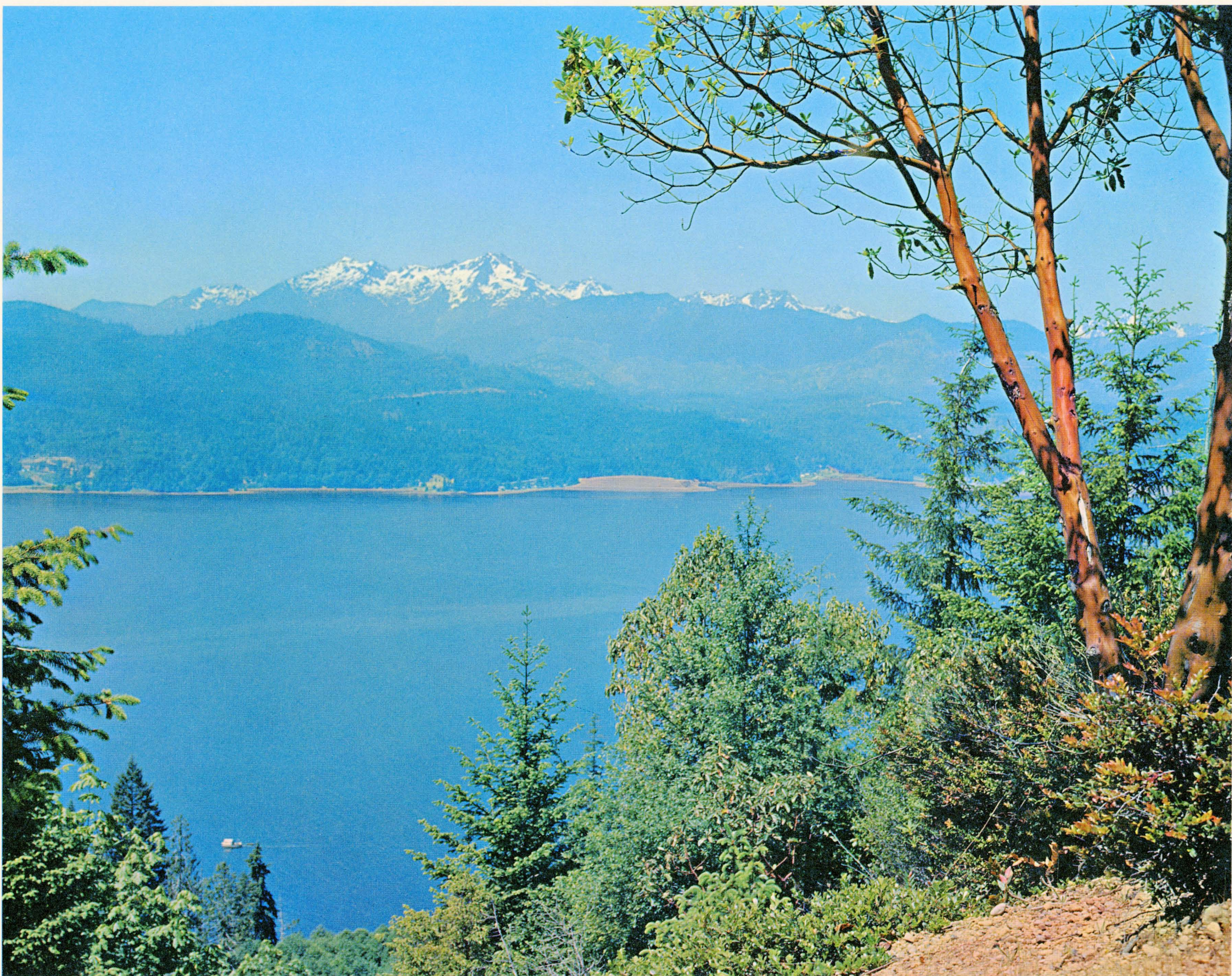
OLYMPIC RANGE, OLYMPIC NATIONAL PARK, WASHINGTON, AS SEEN FROM HOOD CANAL