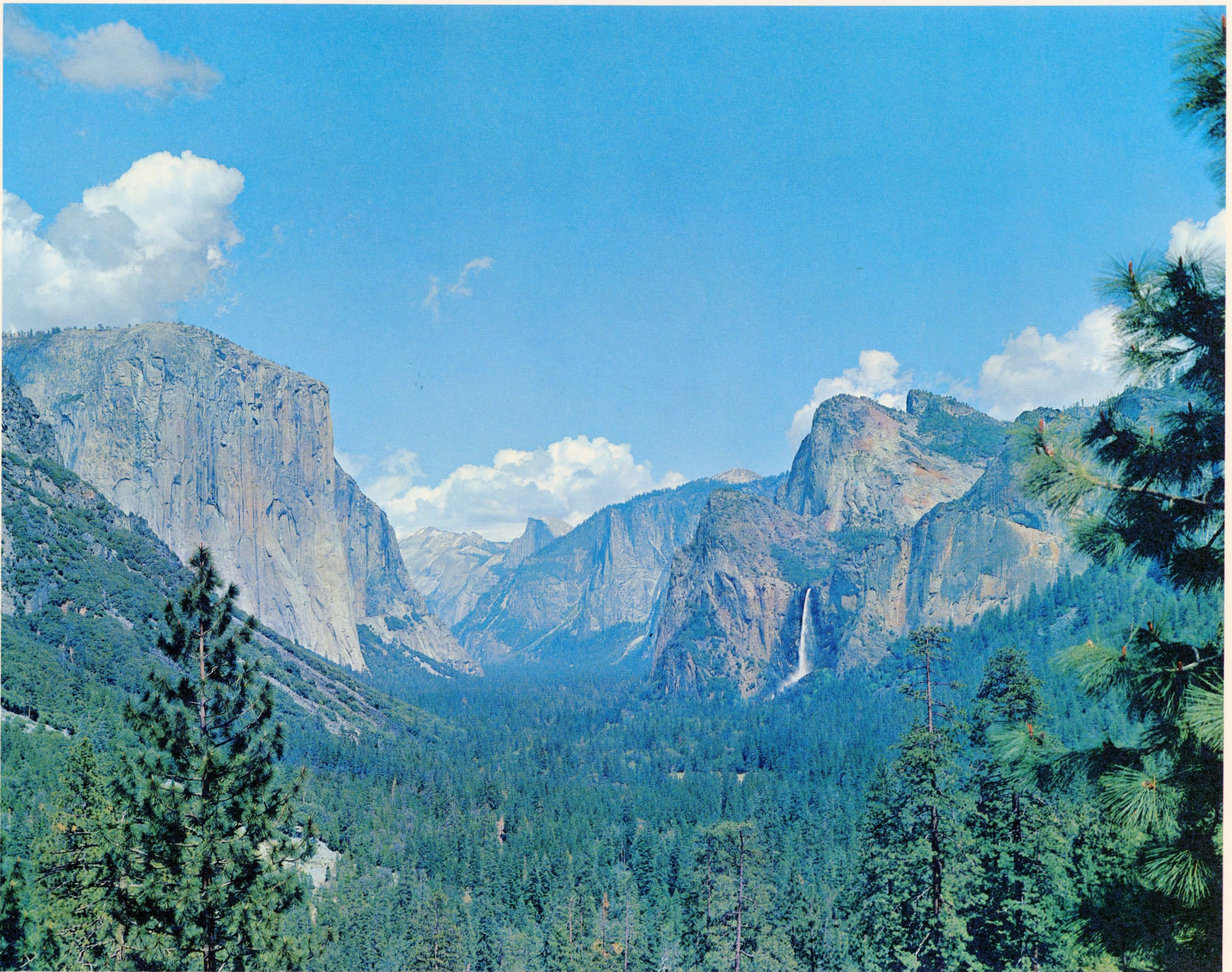
THE MAJESTIC SWEEP OF YOSEMITE NATIONAL PARK, CALIFORNIA