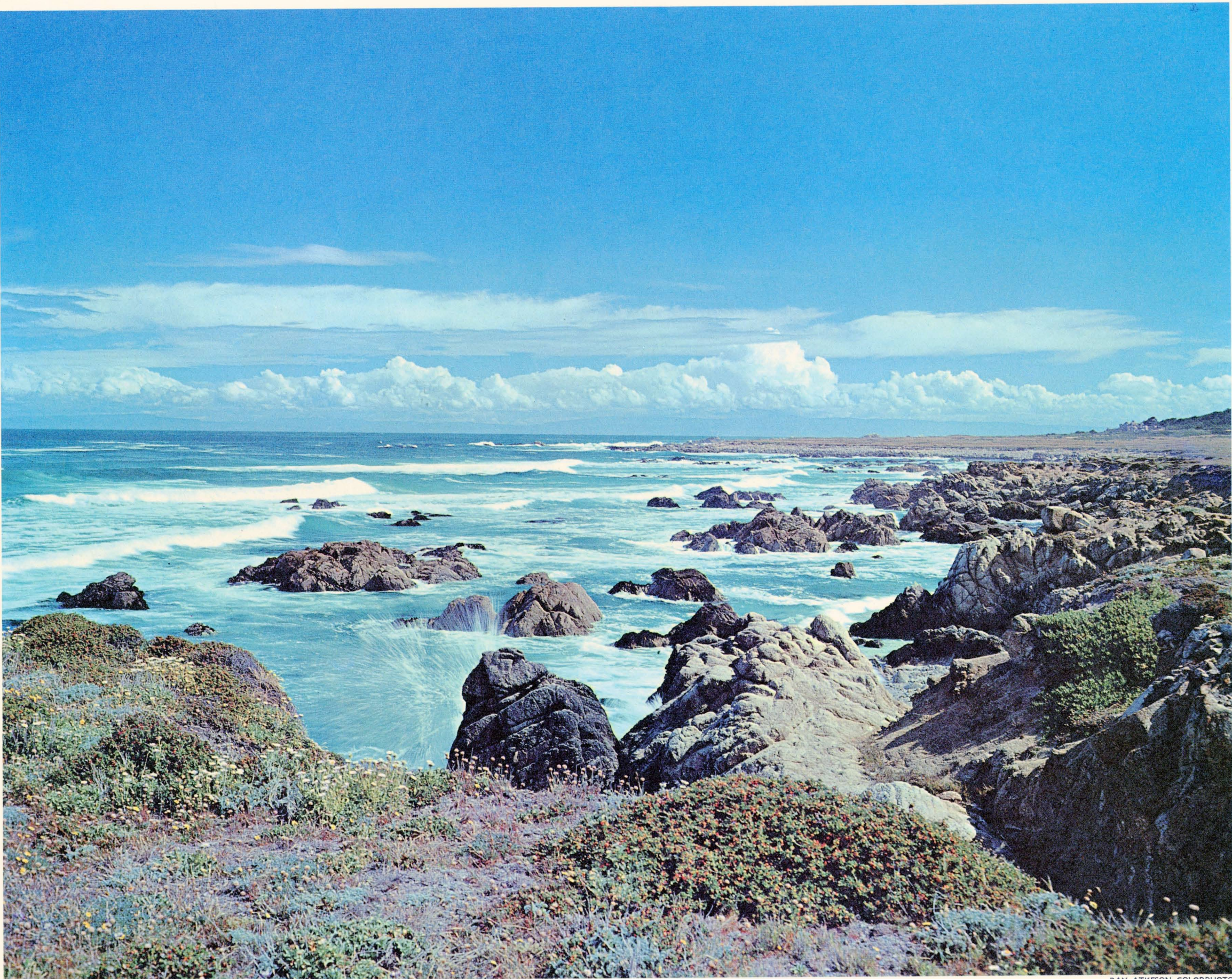
THE BLUE PACIFIC'S RUGGED SHORELINE NEAR MONTEREY, CALIFORNIA