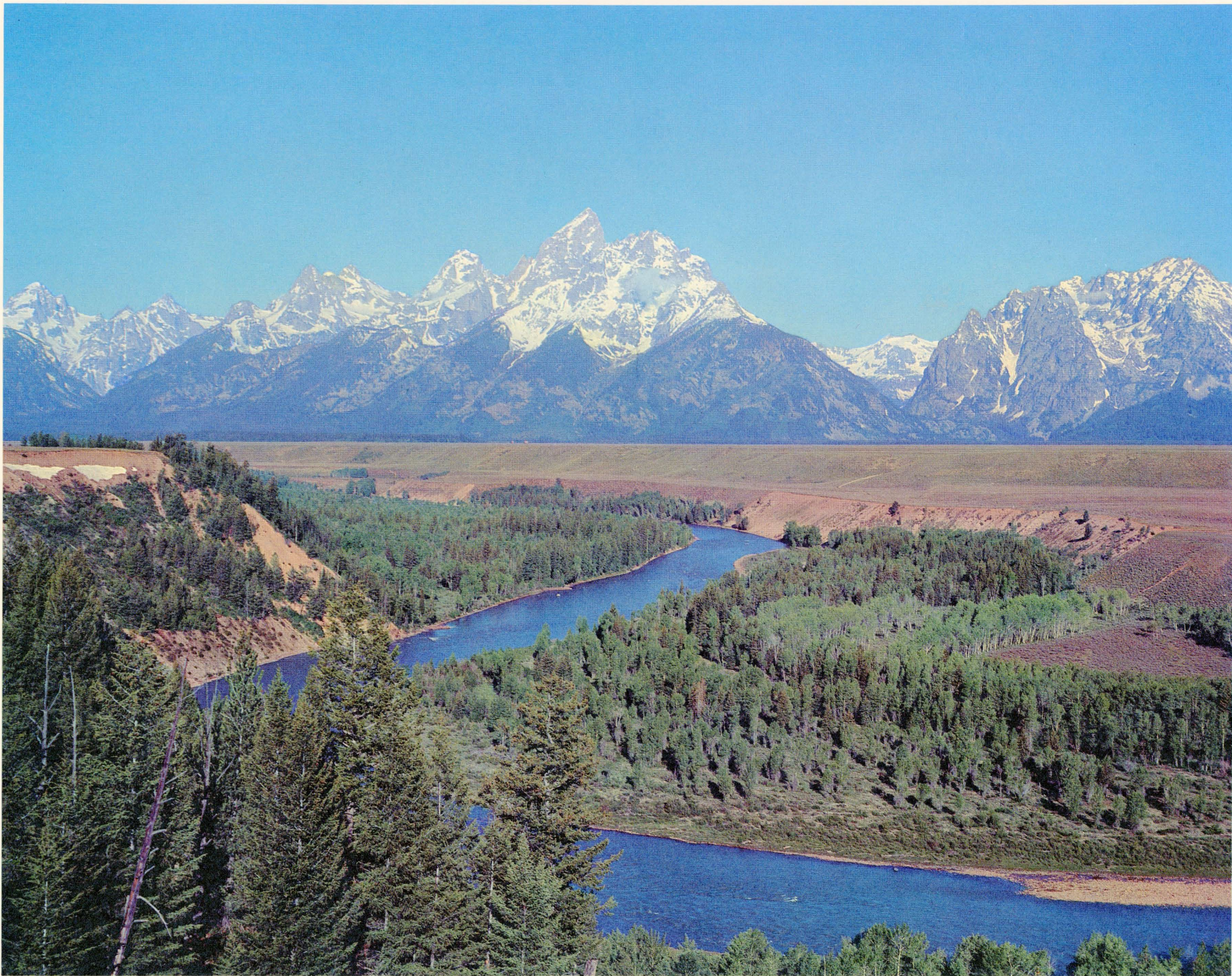
SNAKE RIVER AND TETON MOUNTAINS, GRAND TETON NATIONAL PARK, WYOMING