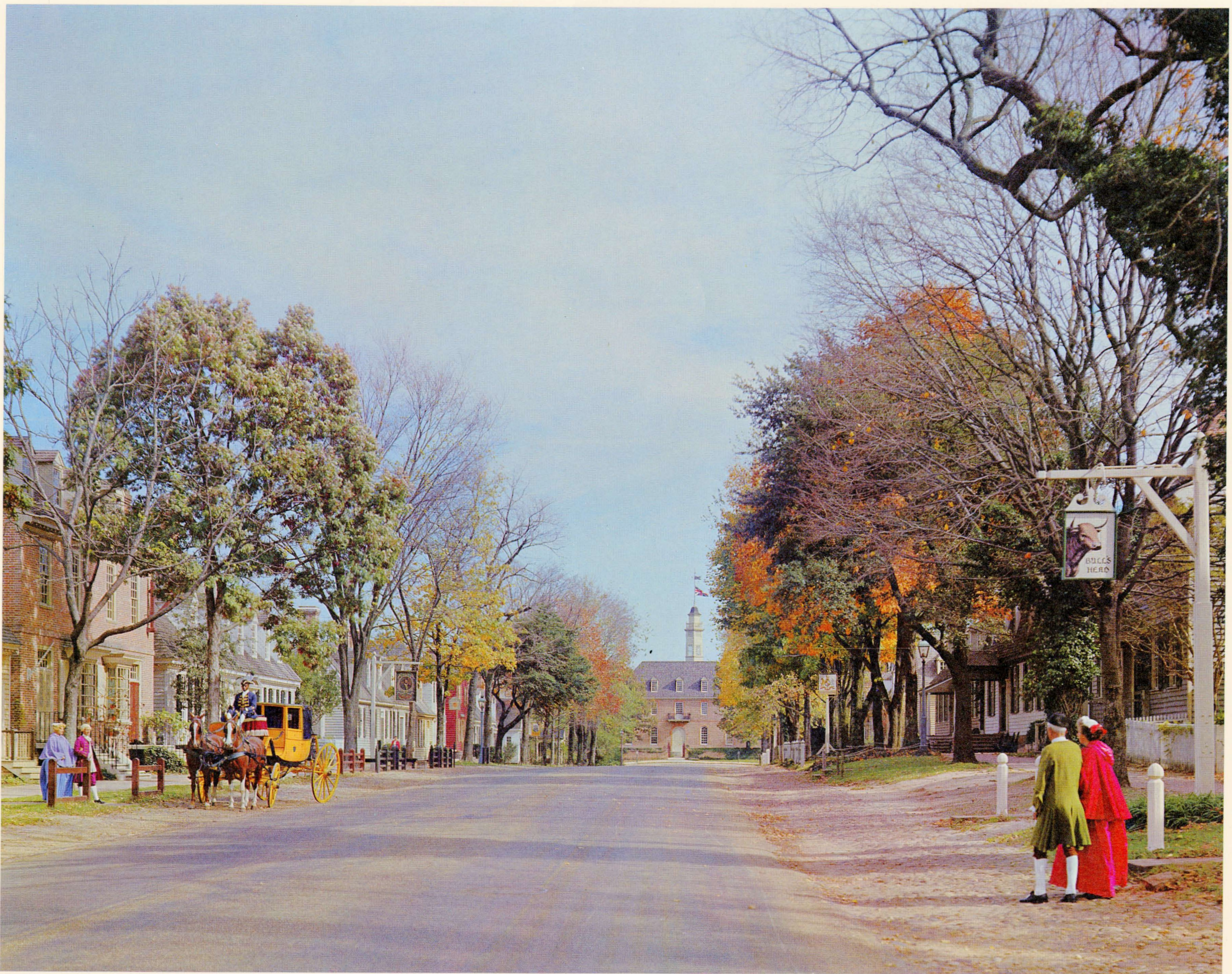
DUKE OF GLOUCESTER STREET IN HISTORIC COLONIAL WILLIAMSBURG, VIRGINIA