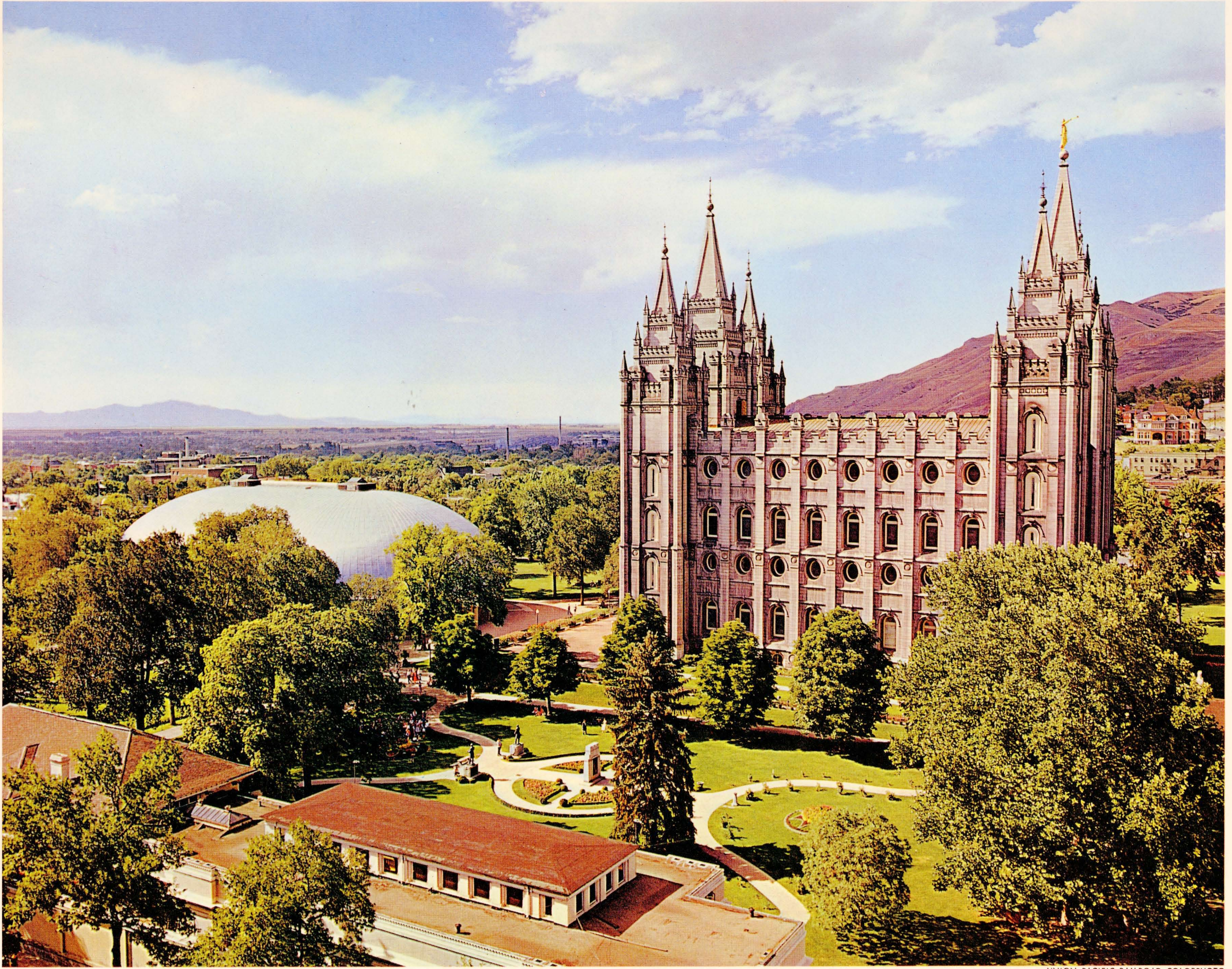
MORMON TEMPLE AND TABERNACLE, TEMPLE SQUARE, SALT LAKE CITY, UTAH