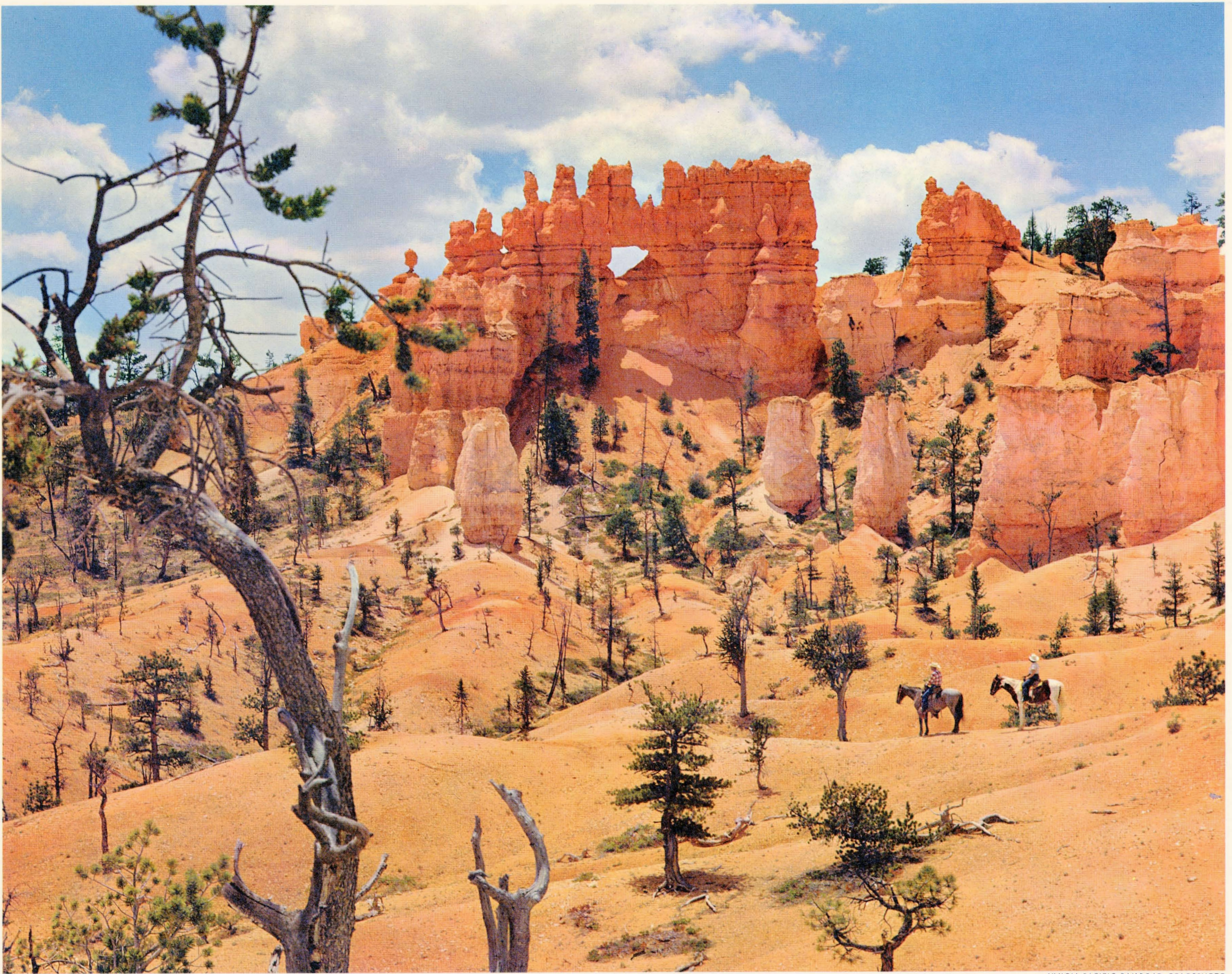
ON THE TRAIL TO OASTLER'S CASTLE, BRYCE CANYON NATIONAL PARK, UTAH