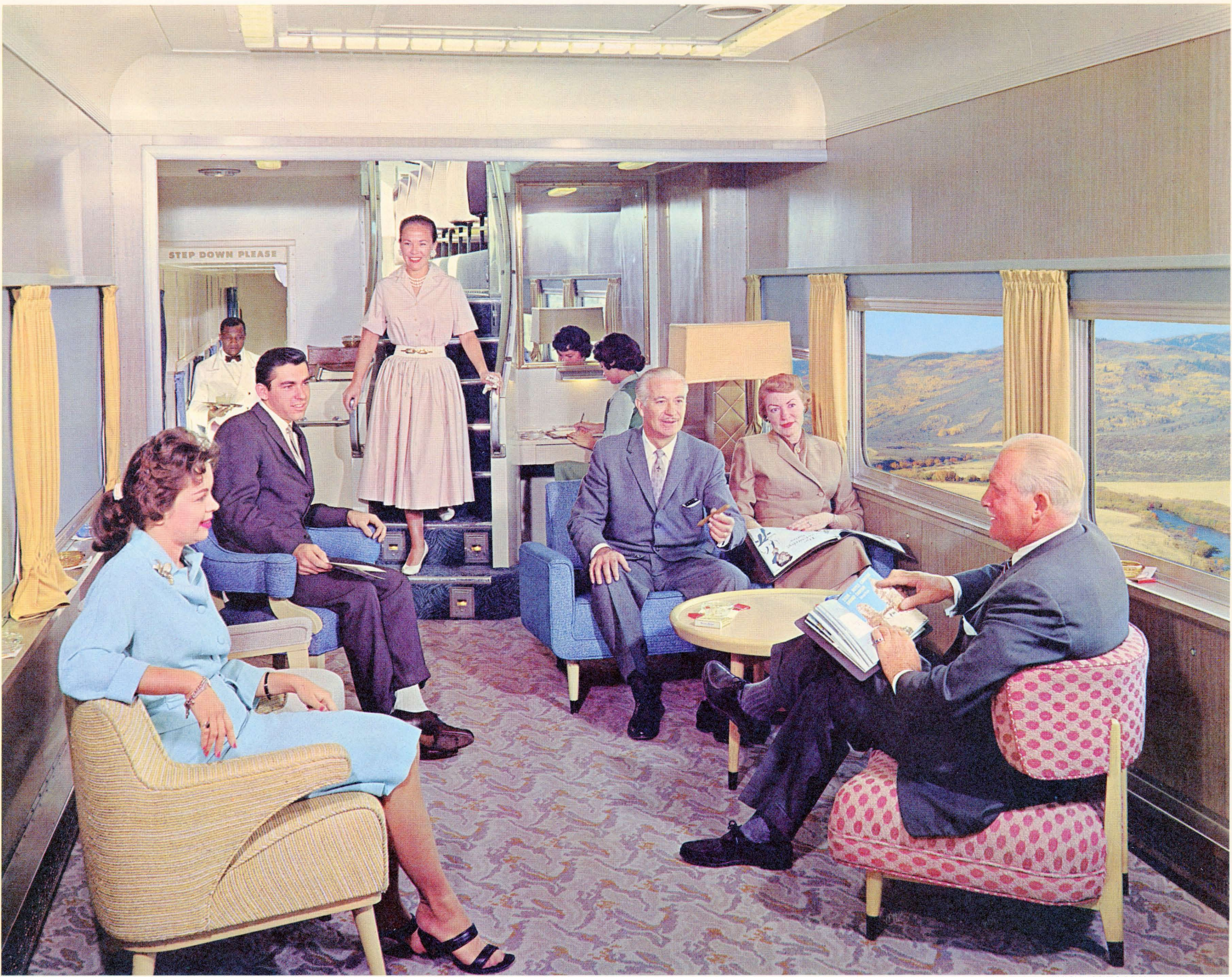
PART OF LUXURIOUS MAIN LOUNGE IN UNION PACIFIC DOME LOUNGE CAR