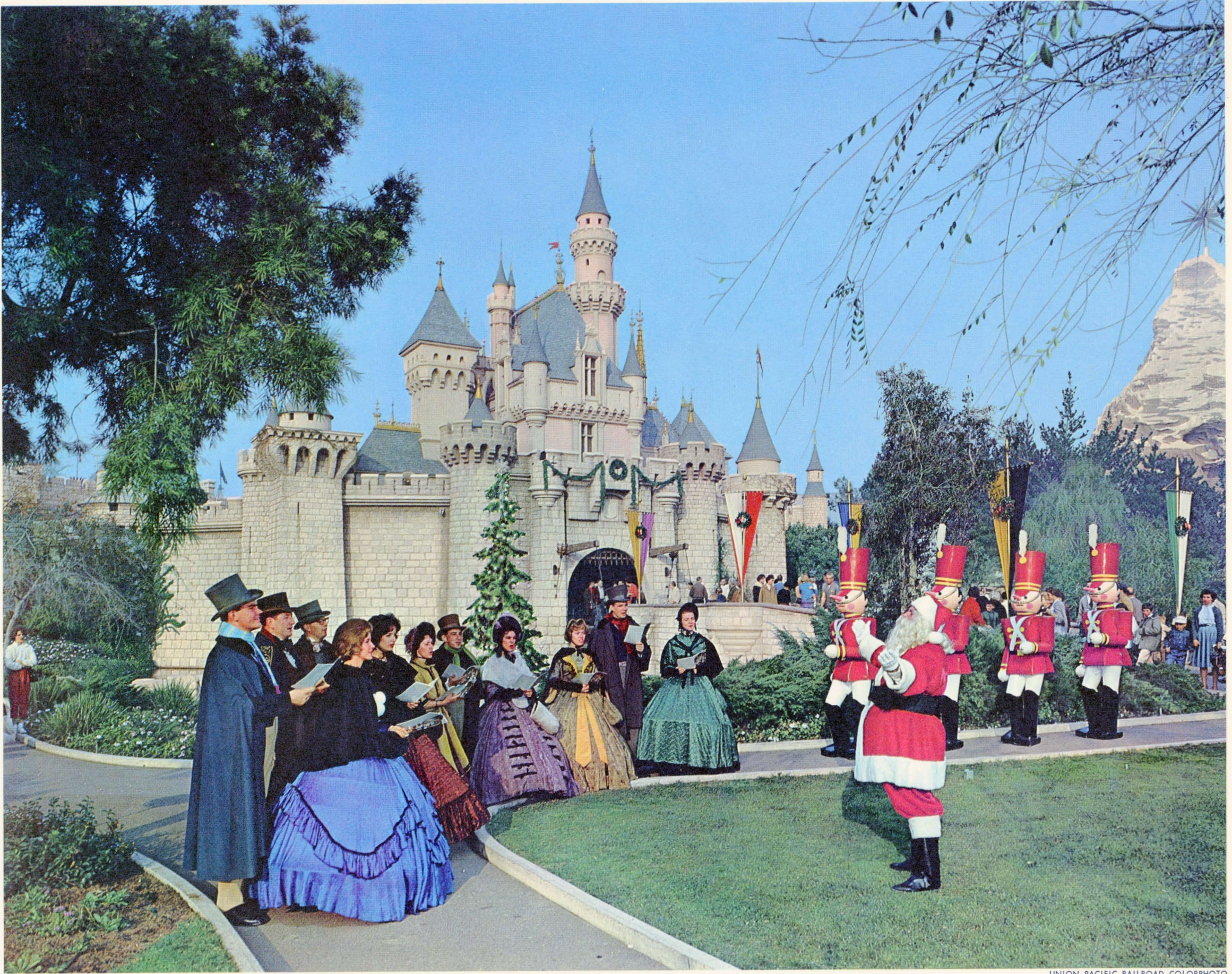
CHRISTMAS CAROLS—A FEATURE OF THE HOLIDAY SEASON'S FESTIVITIES, DISNEYLAND, CALIFORNIA