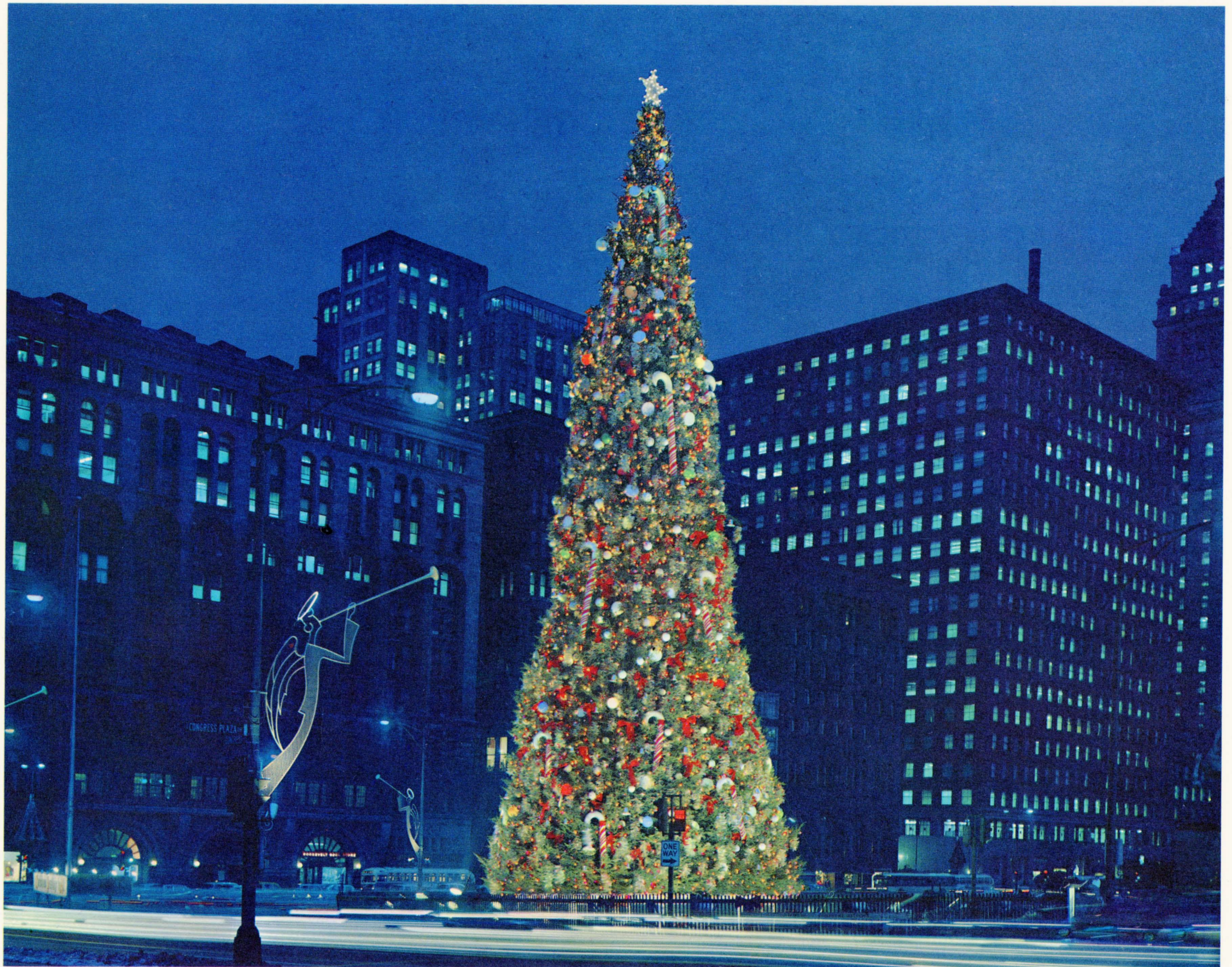
CONGRESS PLAZA AND MICHIGAN AVENUE, CHICAGO

CHICAGO ARCHITECTURAL COLORPHOTO (PUBLIX)