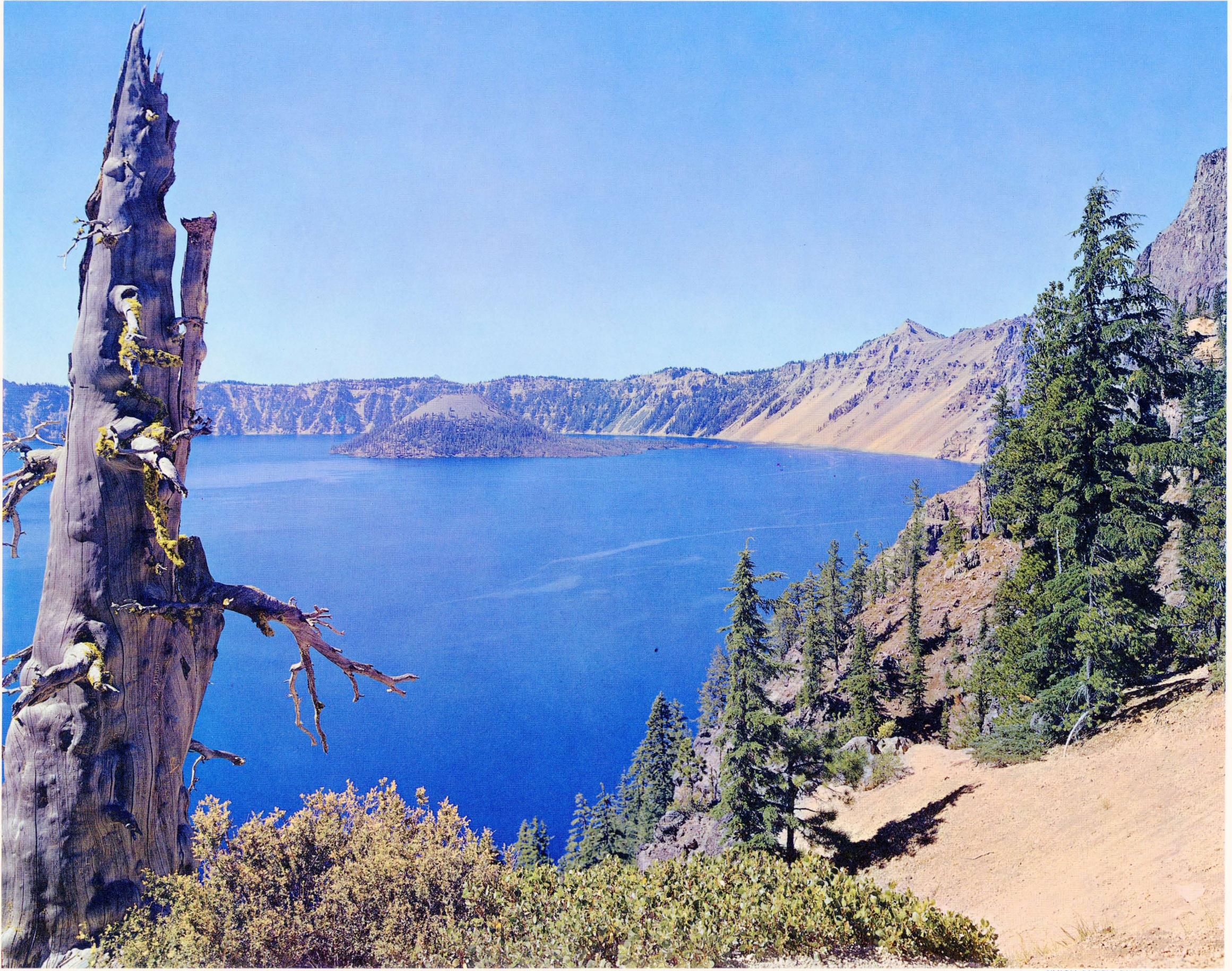
CRATER LAKE AND WIZARD ISLAND, CRATER LAKE NATIONAL PARK, OREGON