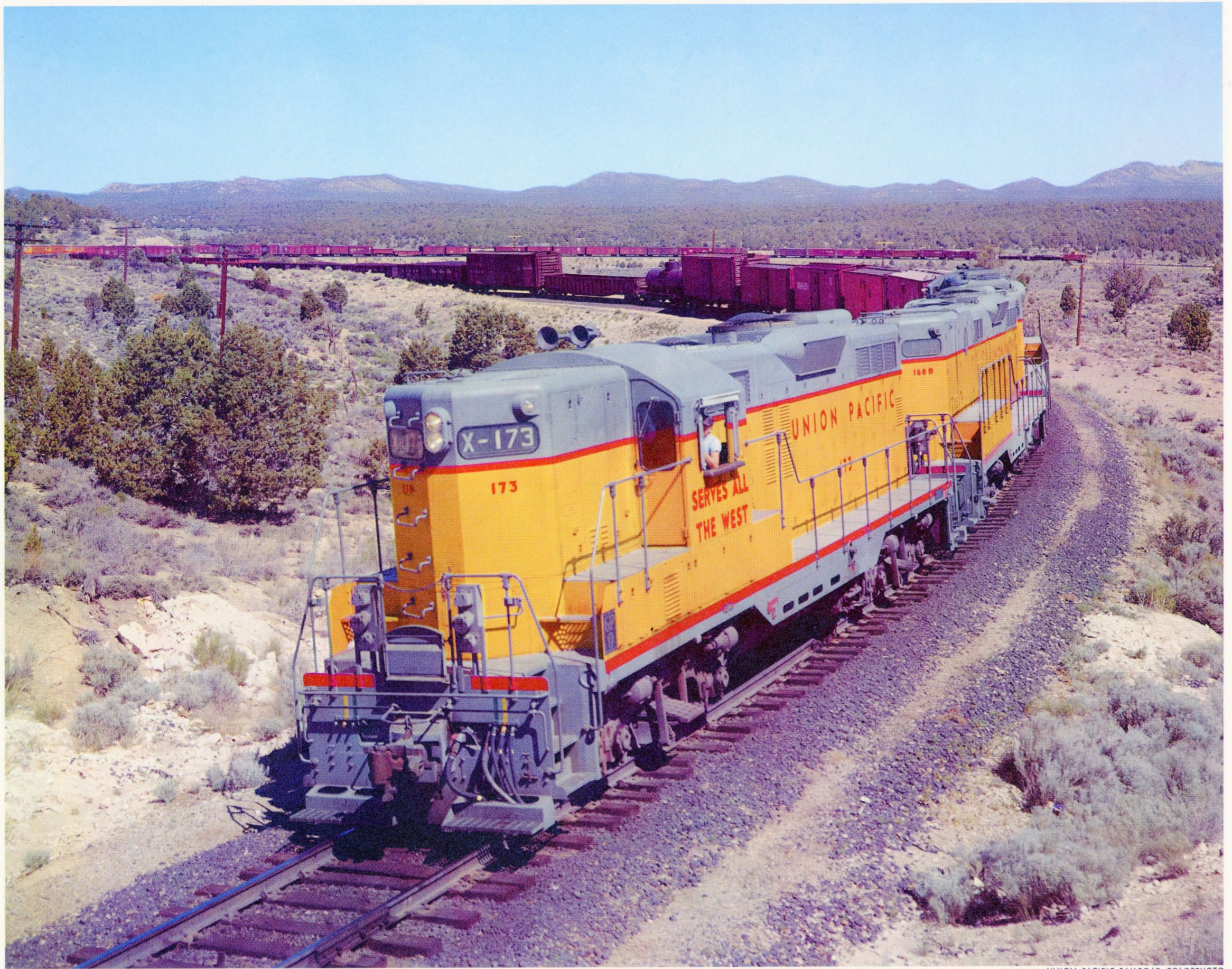
UNION PACIFIC FREIGHT TRAIN NEAR CRESTLINE, NEVADA