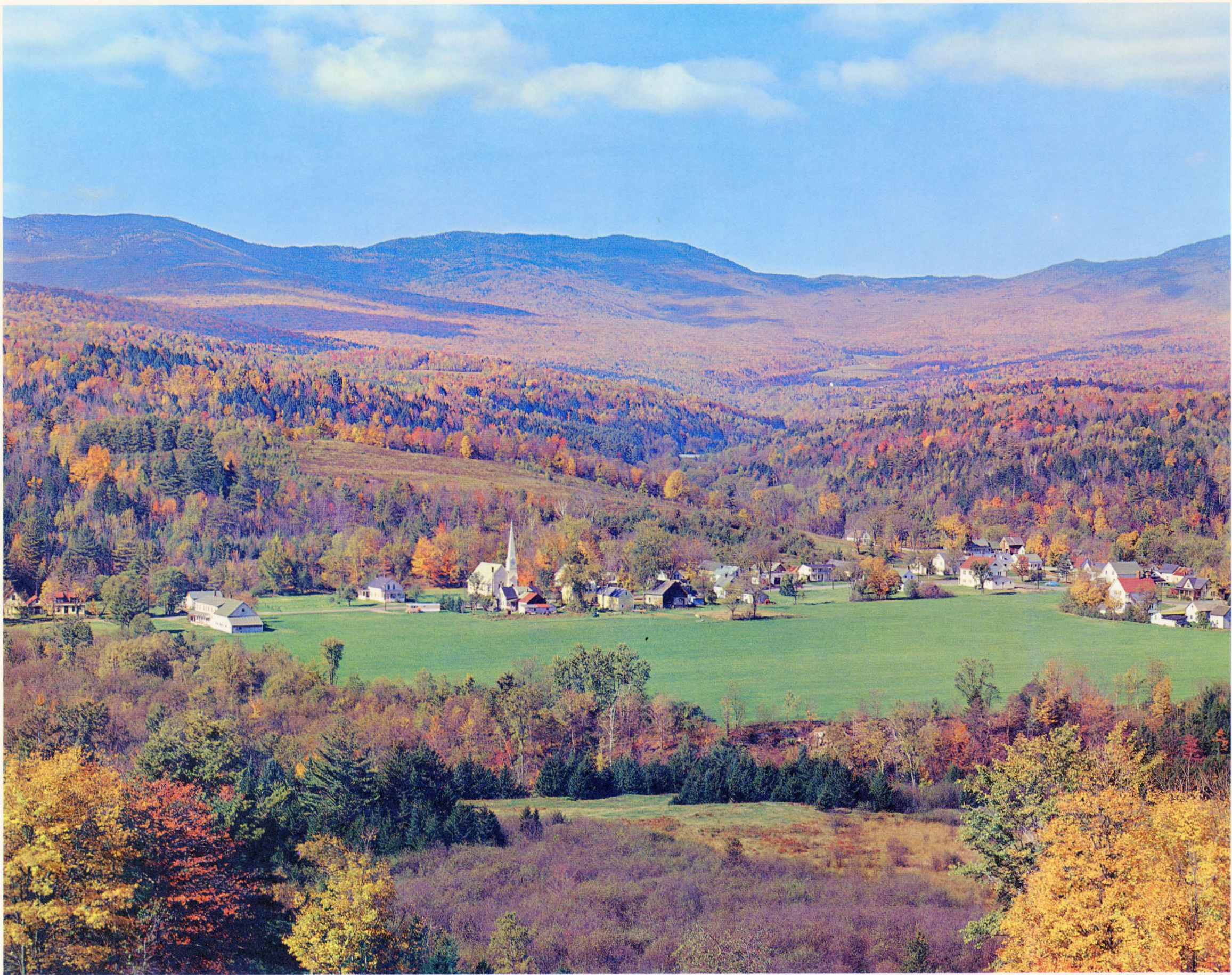
FALL IS A COLORFUL SEASON "BACK EAST" (WORCESTER, VERMONT)