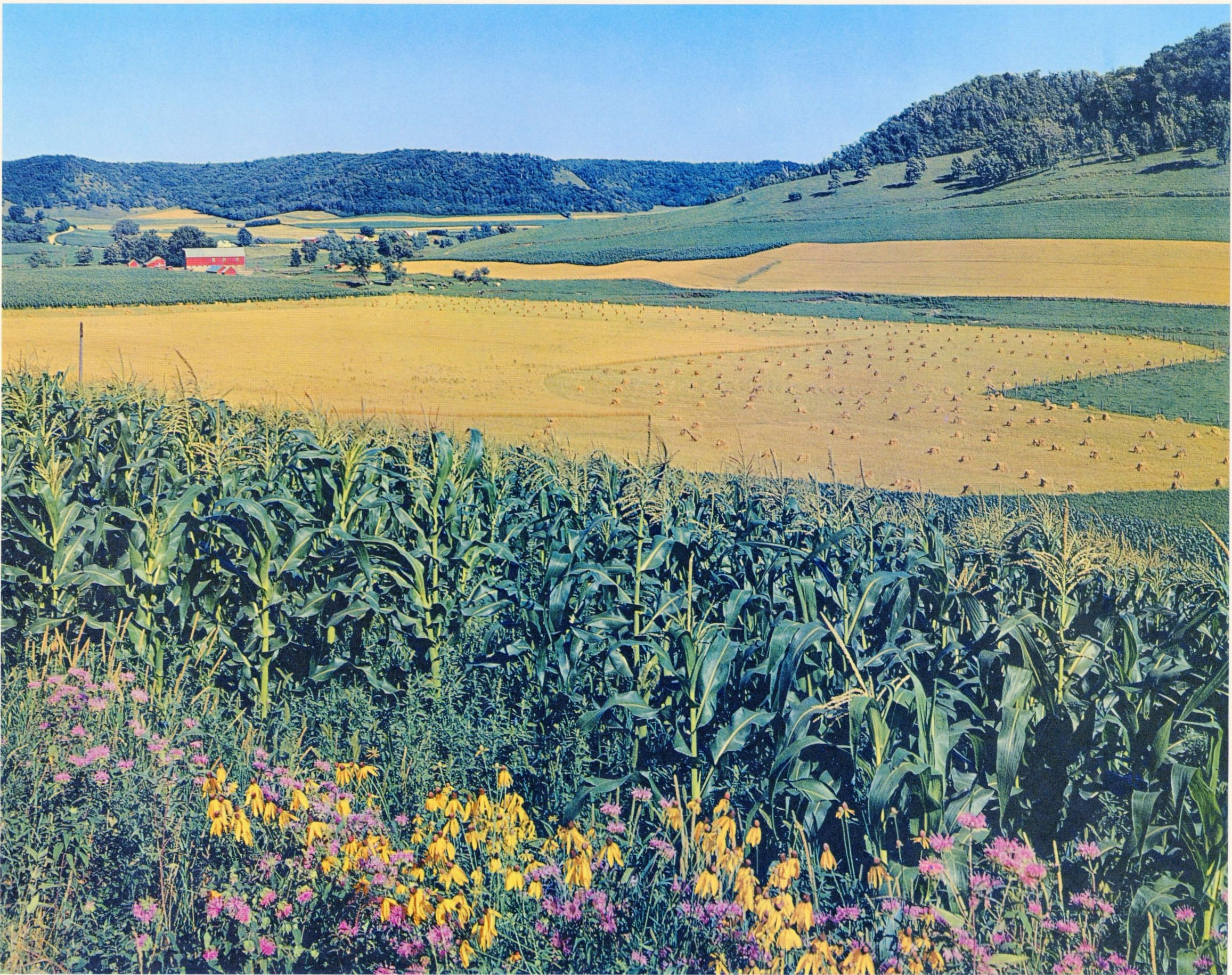
TYPICAL MIDWESTERN FARM SCENE