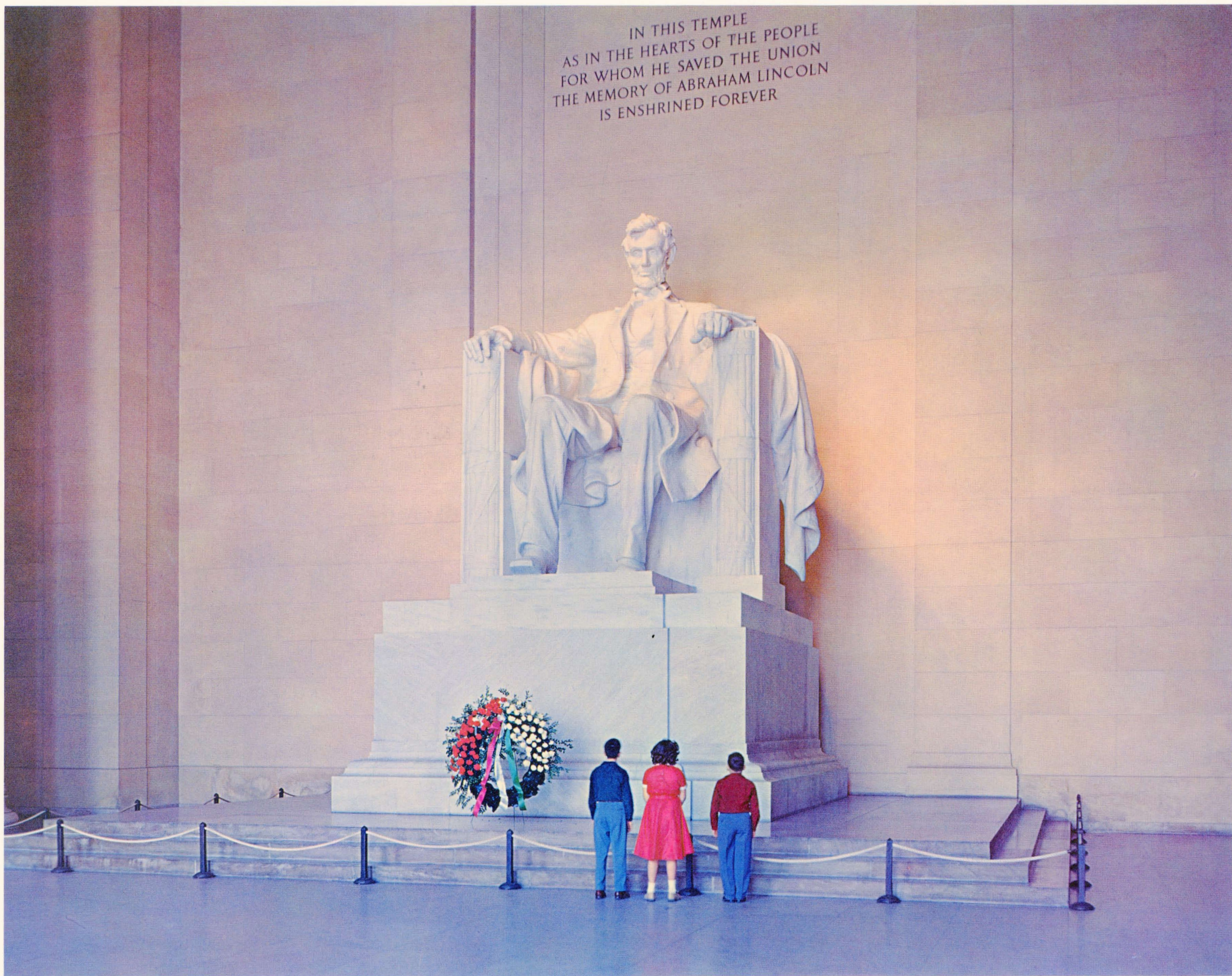
INSPIRING STATUE OF LINCOLN BY DANIEL CHESTER FRENCH, LINCOLN MEMORIAL, WASHINGTON, D. C.

IN THIS TEMPLE AS IN THE HEARTS OF THE PEOPLE FOR WHOM HE SAVED THE UNION THE MEMORY OF ABRAHAM LINCOLN IS ENSHRINED FOREVER