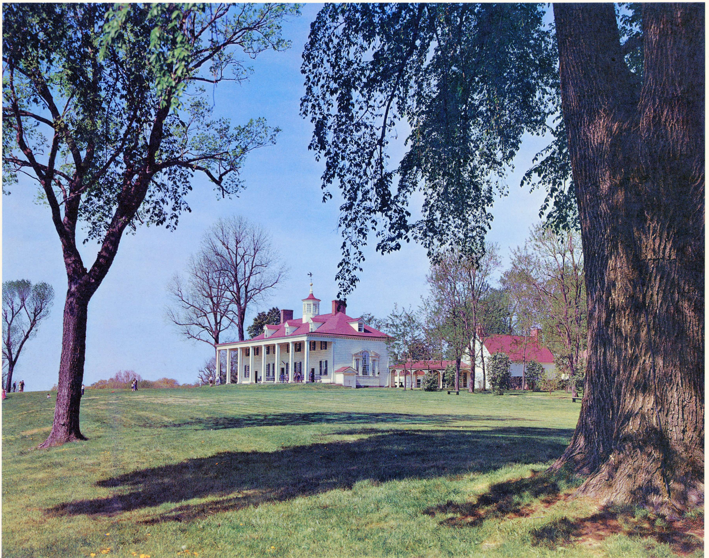
GEORGE WASHINGTON'S MANSION AT MOUNT VERNON, VIRGINIA