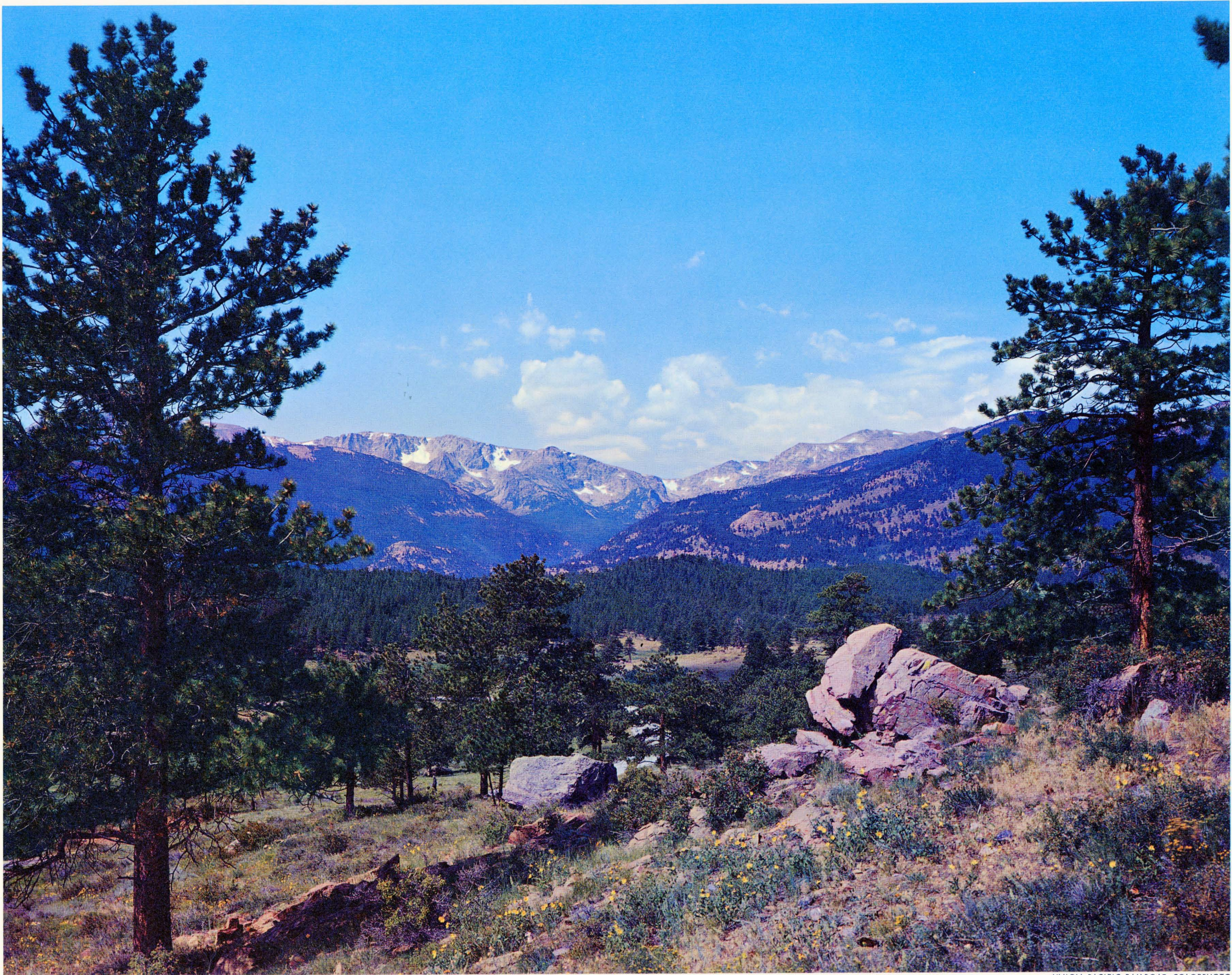
MUMMY RANGE FROM TRAIL RIDGE ROAD, ROCKY MT. NATIONAL PARK, COLORADO