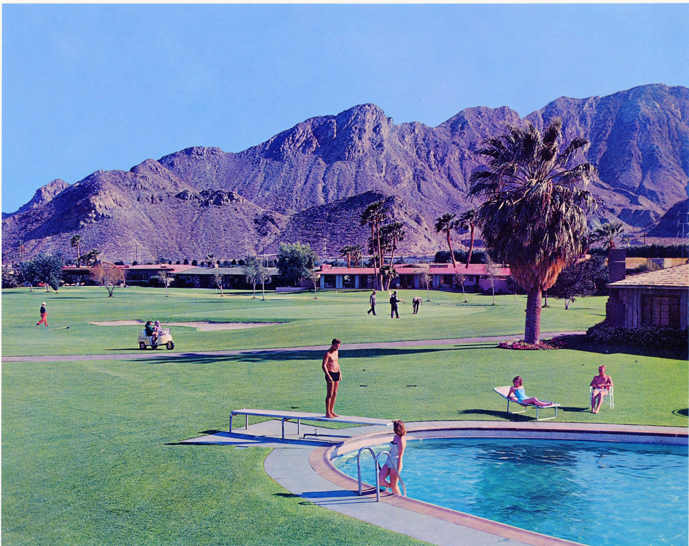
ONE OF SEVERAL CHAMPIONSHIP GOLF COURSES, PALM SPRINGS, CALIFORNIA