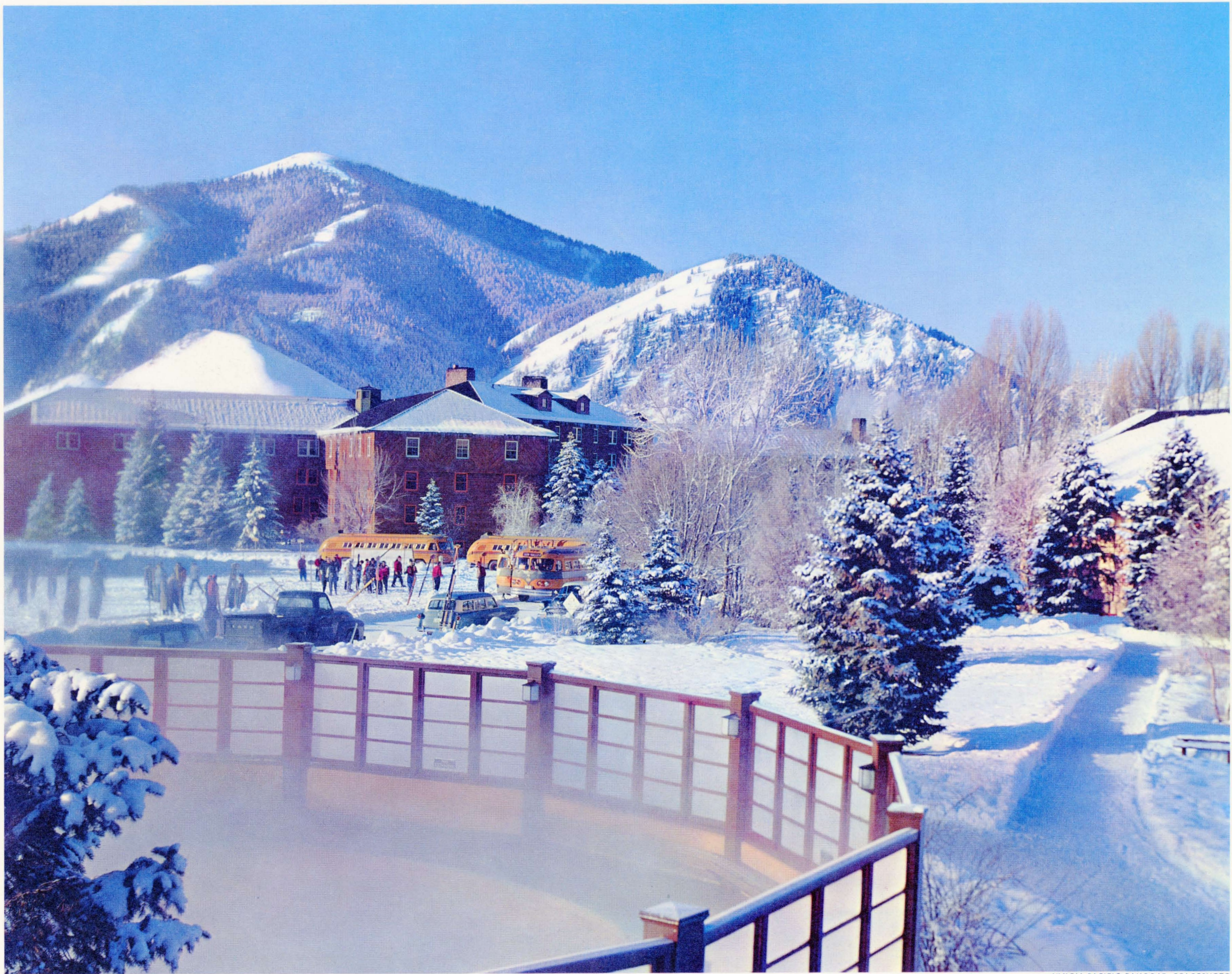
"MEETING PLACE" OF THE SKI WORLD FOR 25 YEARS, SUN VALLEY, IDAHO