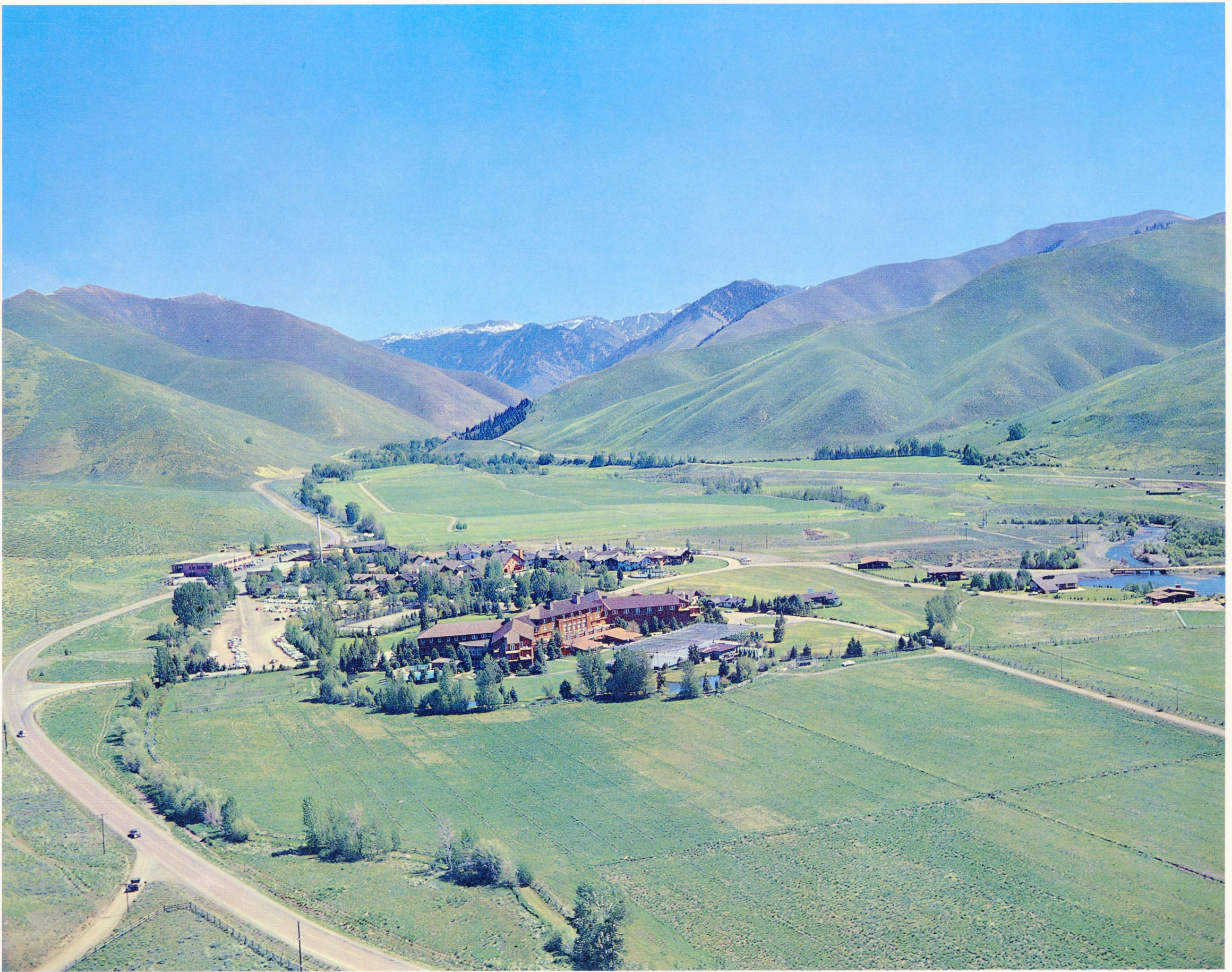
BIRD'S-EYE VIEW OF SUN VALLEY, IDAHO