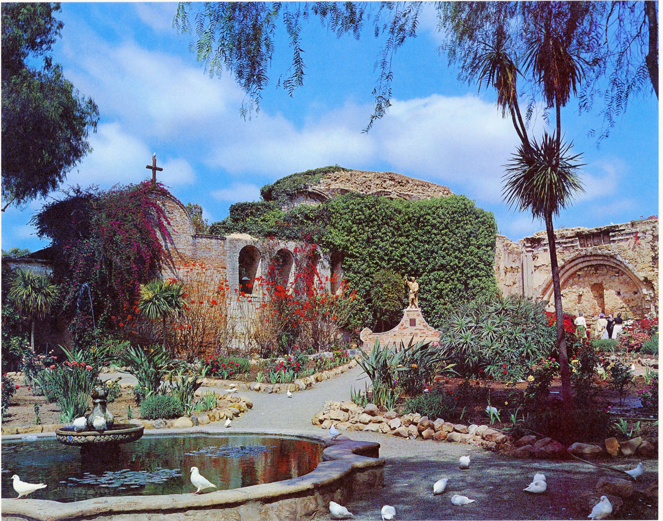
SAN JUAN CAPISTRANO MISSION (1806), SOUTHERN CALIFORNIA