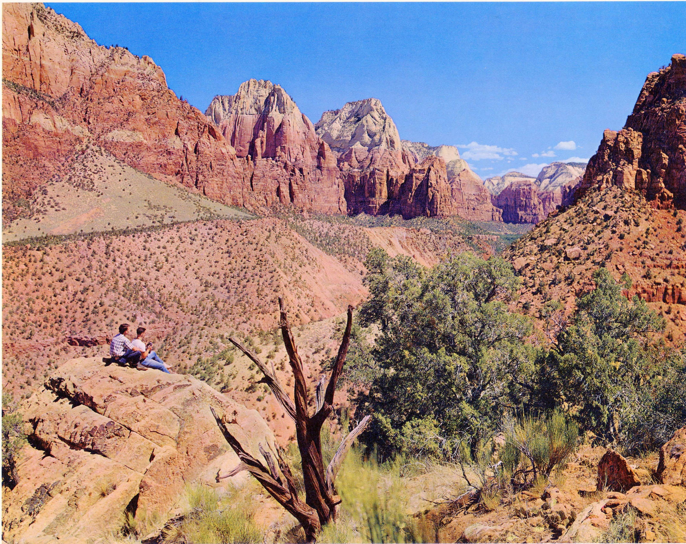
LOOKING UP ZION CANYON, ZION NATIONAL PARK, UTAH