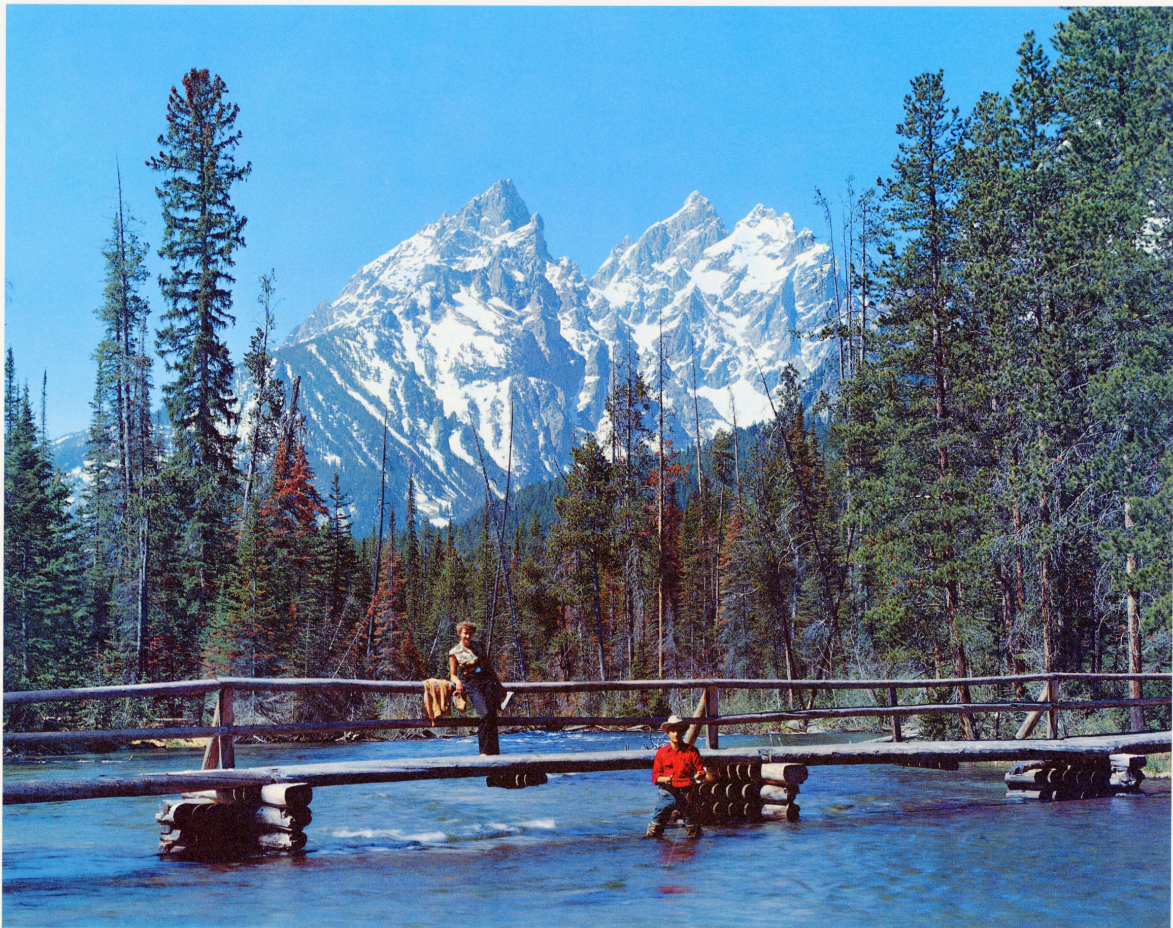
FISHING'S FINE IN GRAND TETON NATIONAL PARK, WYOMING