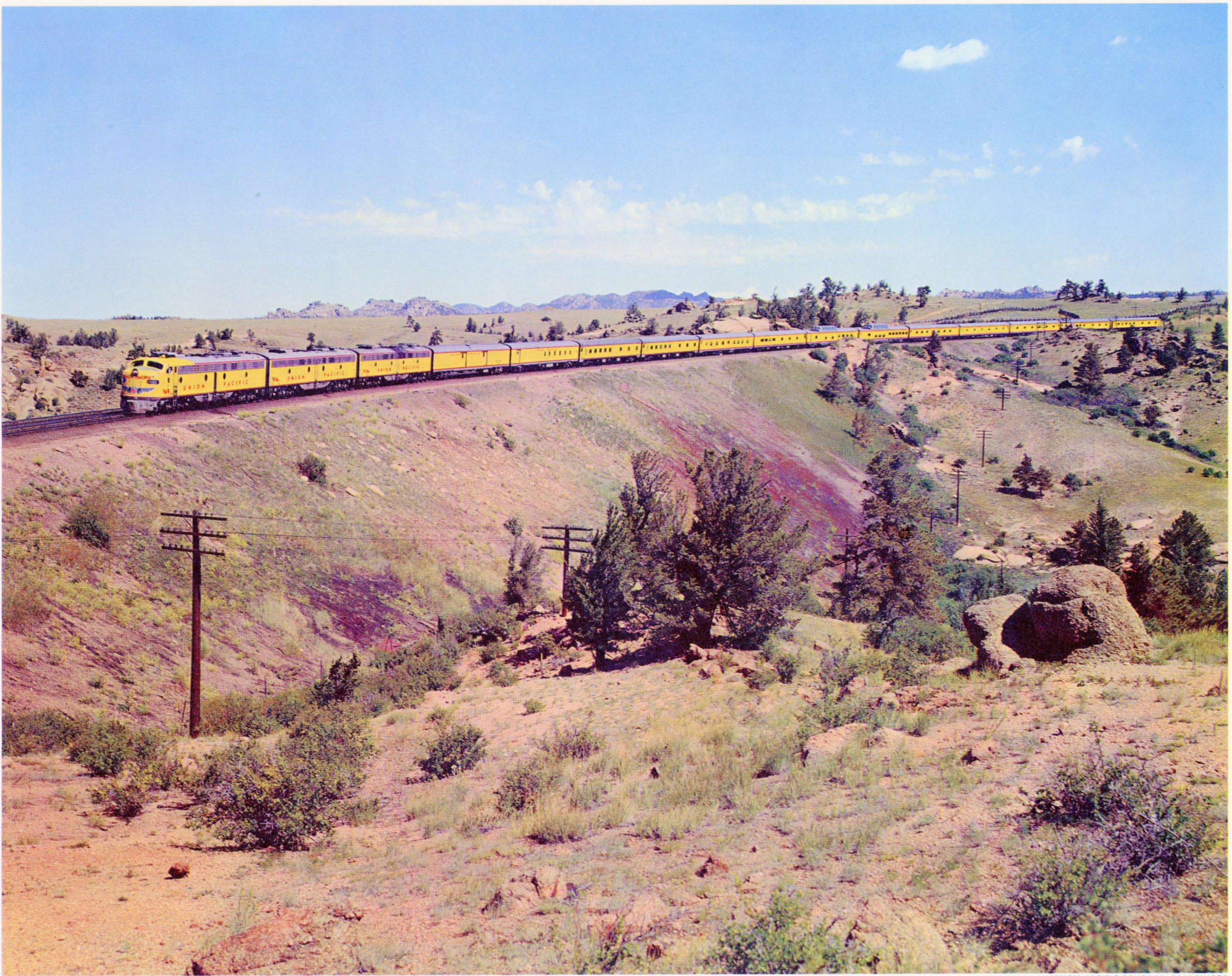
UNION PACIFIC RAILROAD COLORPHOTO