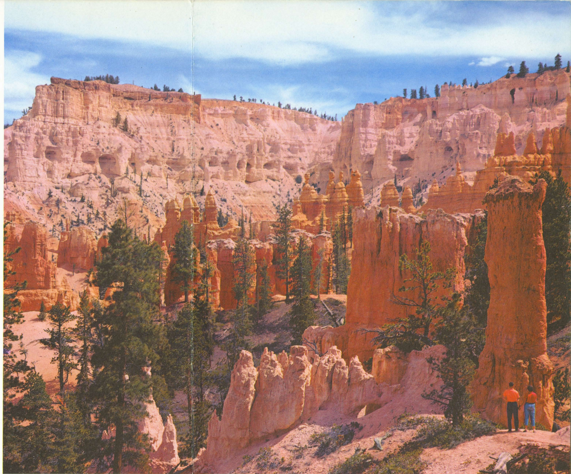
The Grottoes from Peek-A-Boo Trail, Bryce Canyon National Park, Utah.

Bryce Canyon National Park is reached by motor bus tours from Cedar City, Utah on the Union Pacific Railroad, and the tour includes Zion and Grand Canyon National Parks.