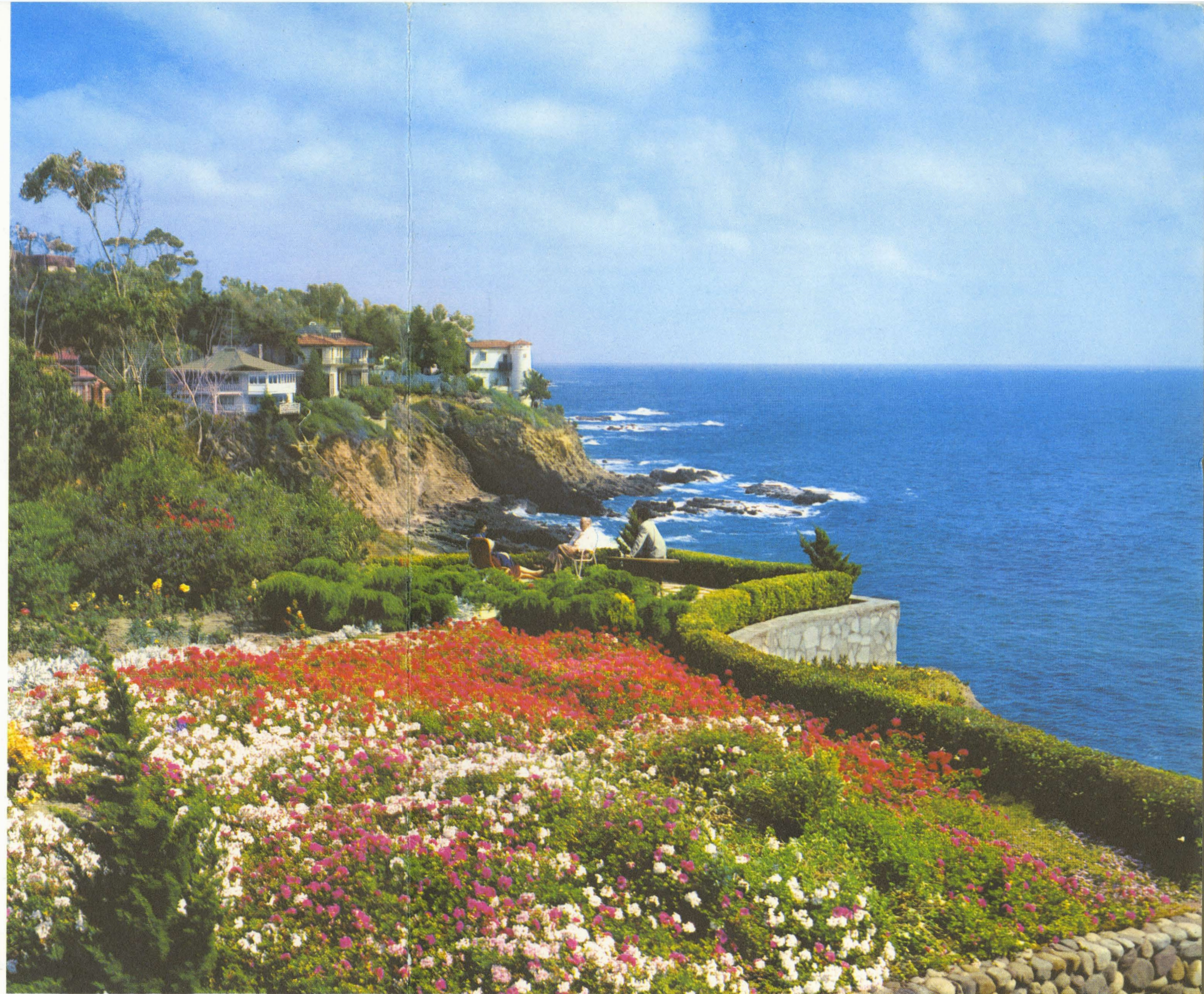
Looking west into the trackless Pacific from a garden at Laguna Beach, California.

The cities of California are among the most interesting and romantic in the world: San Diego with its year around equable climate, Los Angeles with its nearby movie colonies, San Francisco at the Golden Gate, reminiscent of pioneer and gold-rush days, and many others.