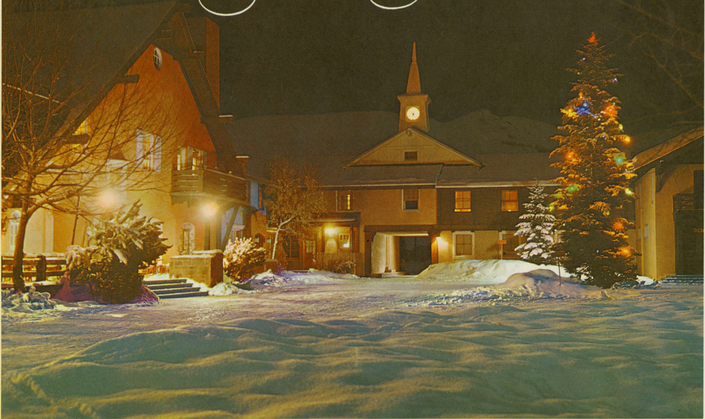
A "CHRISTMAS CARD" VIEW OF CHALLENGER INN, SUN VALLEY, IDAHO