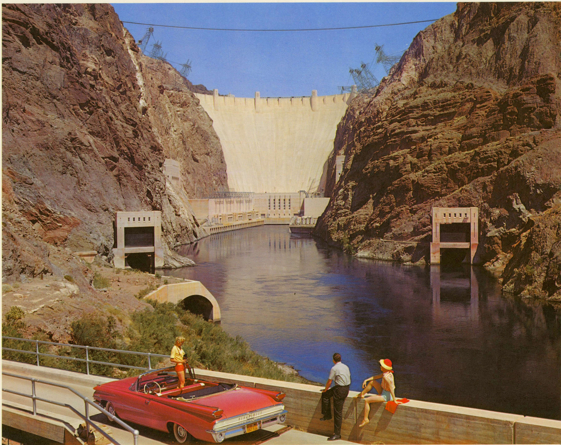
THE DOWNSTREAM FACE OF HOOVER DAM, NEAR EXCITING LAS VEGAS, NEVADA