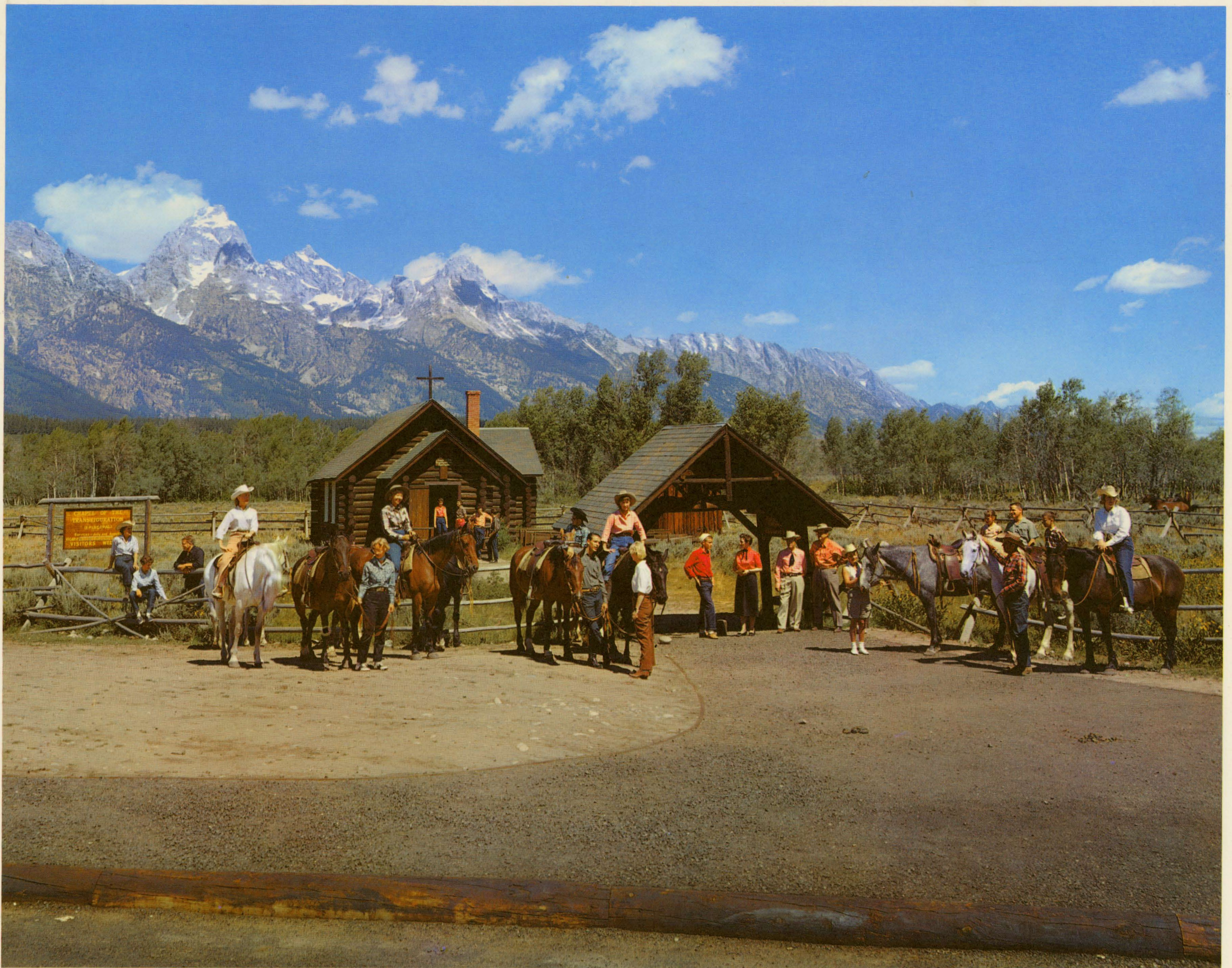
CHAPEL OF TRANSFIGURATION IN JACKSON HOLE, GRAND TETON NATIONAL PARK, WYOMING