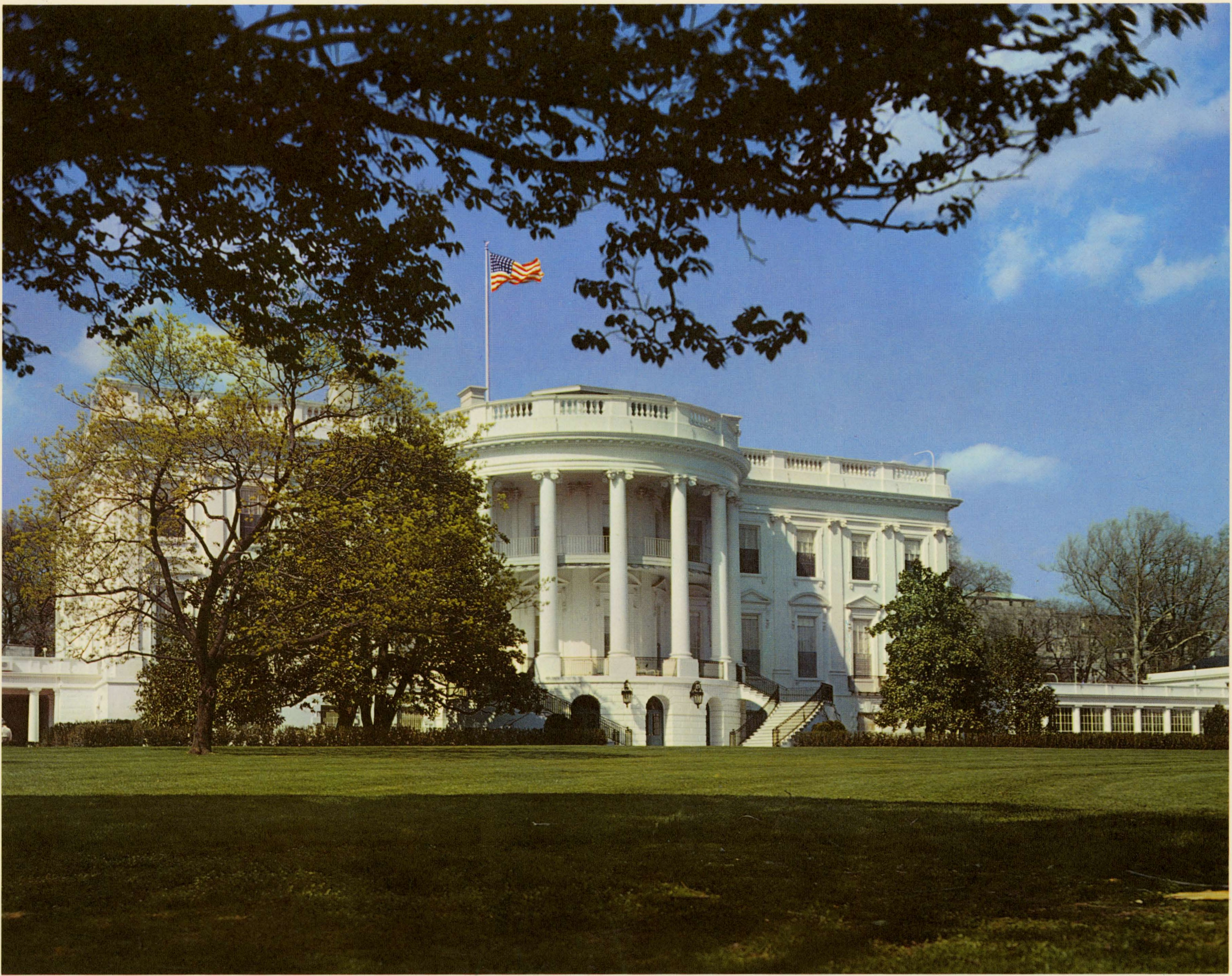
THE WHITE HOUSE, HOME OF OUR PRESIDENTS SINCE 1800