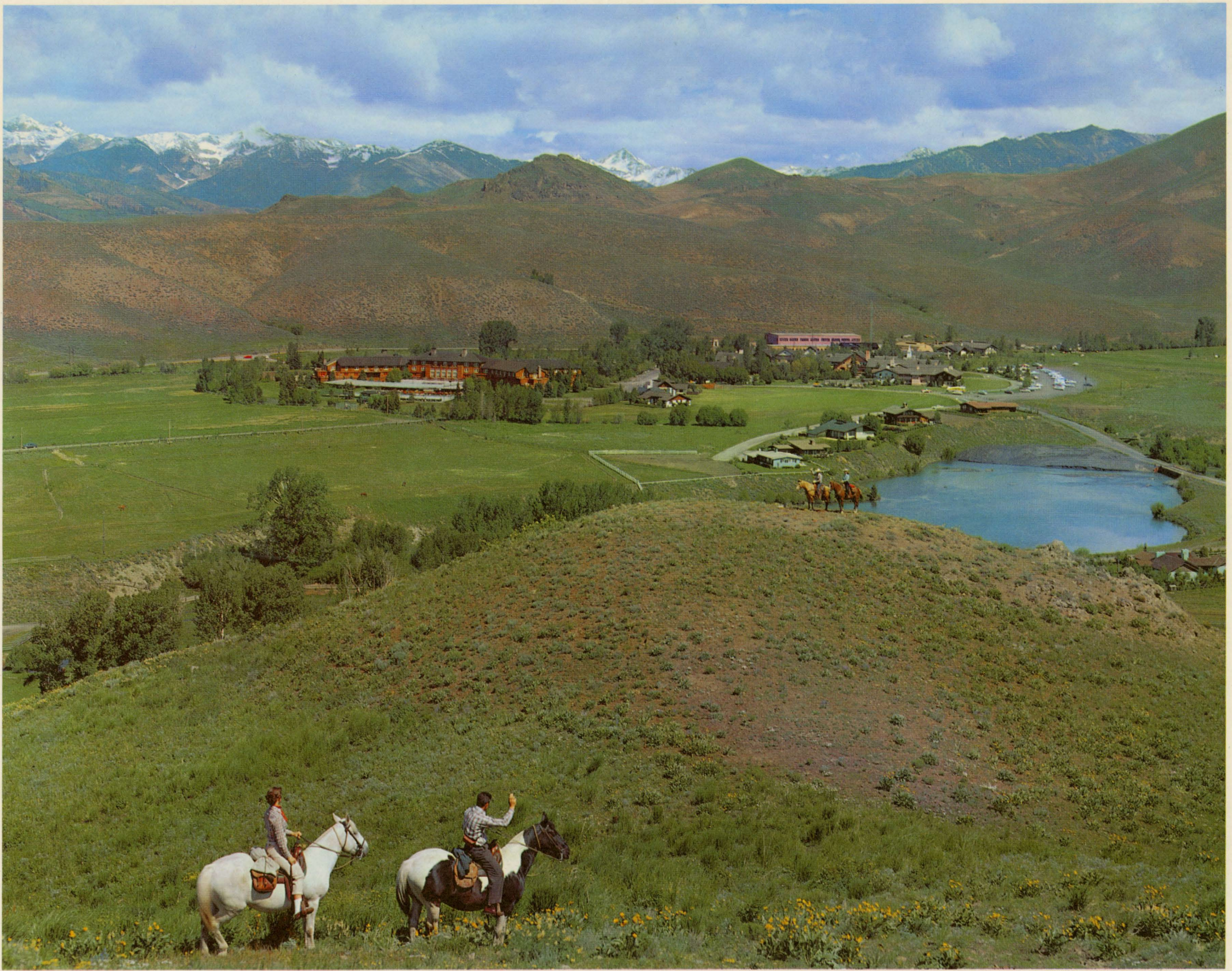
THERE IS FUN FOR EVERYONE IN THE FAMILY . . . EVERY DAY AT SUN VALLEY, IDAHO