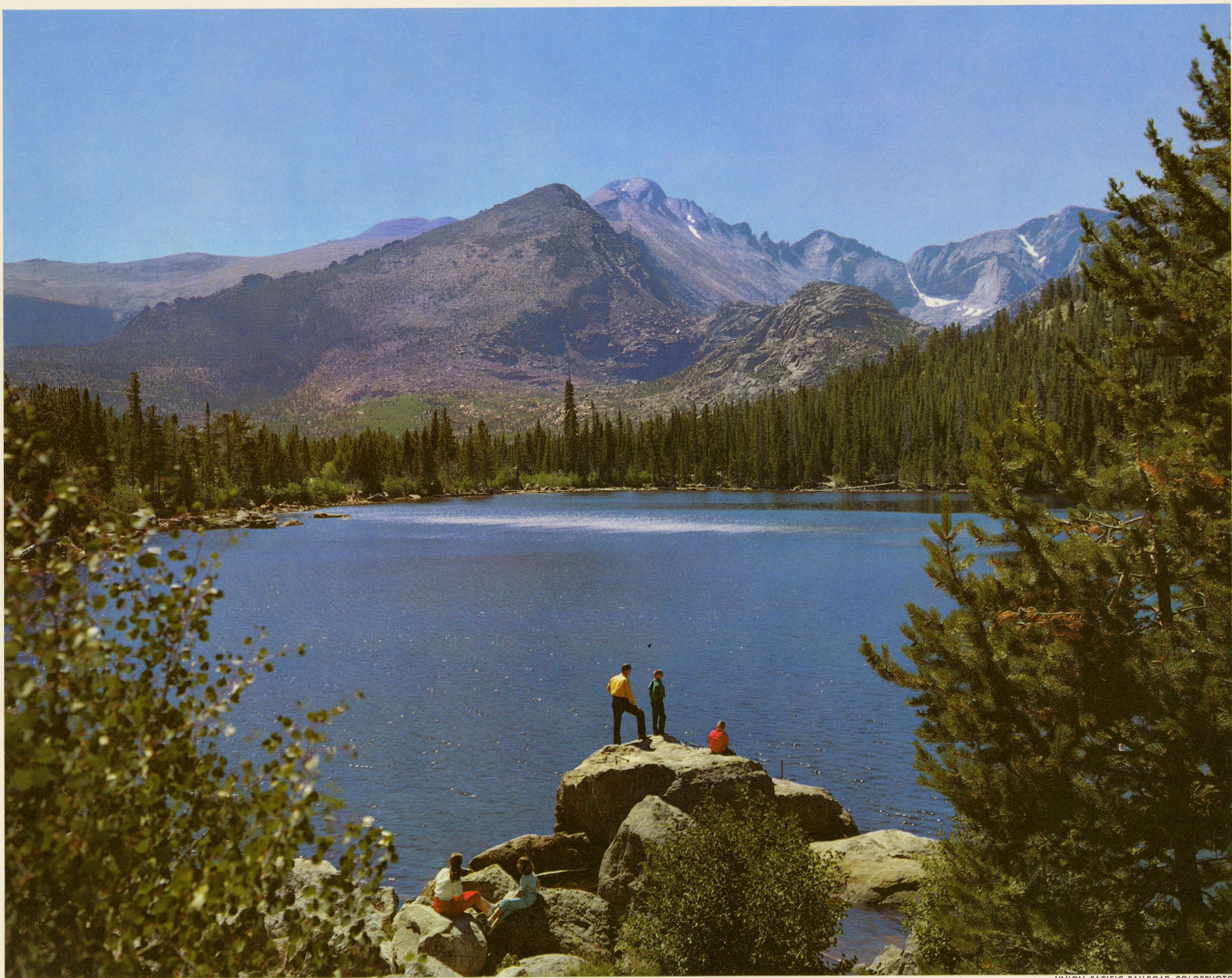
LONGS PEAK AND BEAR LAKE, ROCKY MOUNTAIN NATIONAL PARK, COLORADO