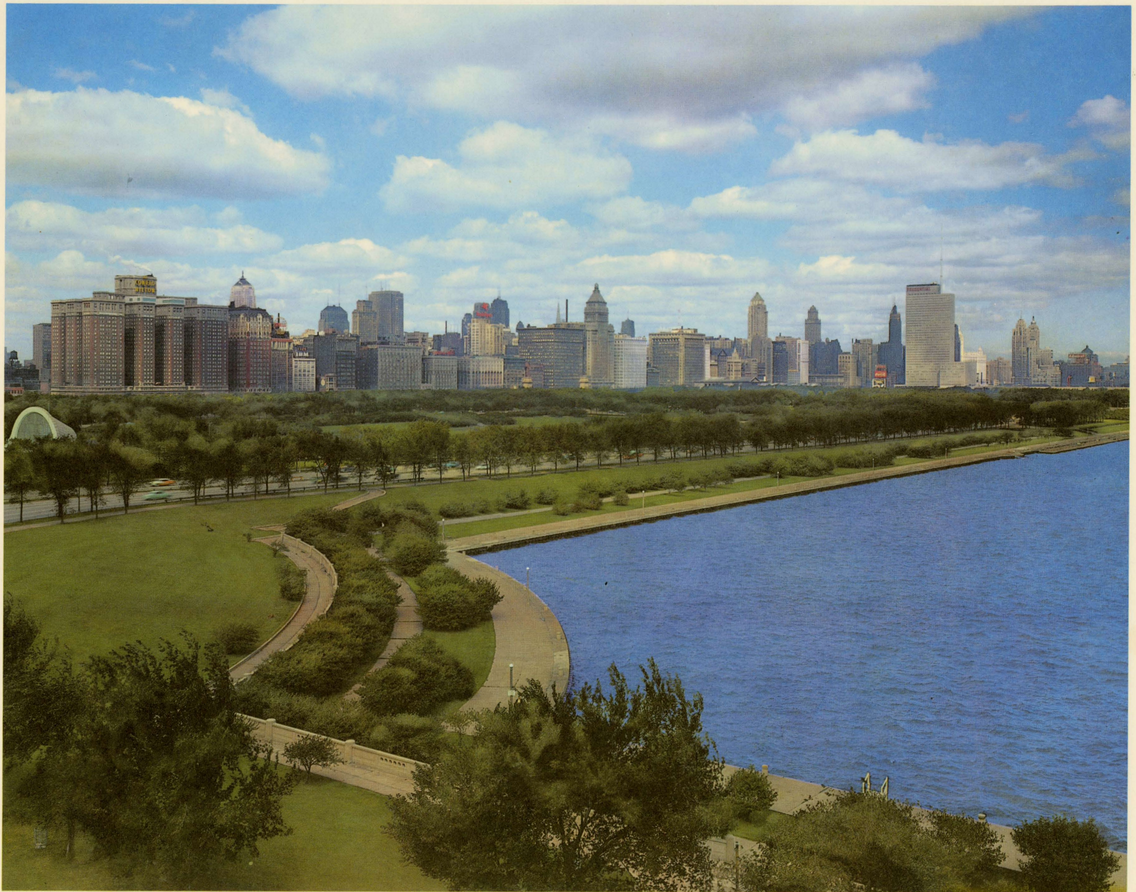
CHICAGO'S NEW MICHIGAN BOULEVARD SKYLINE AND GRANT PARK