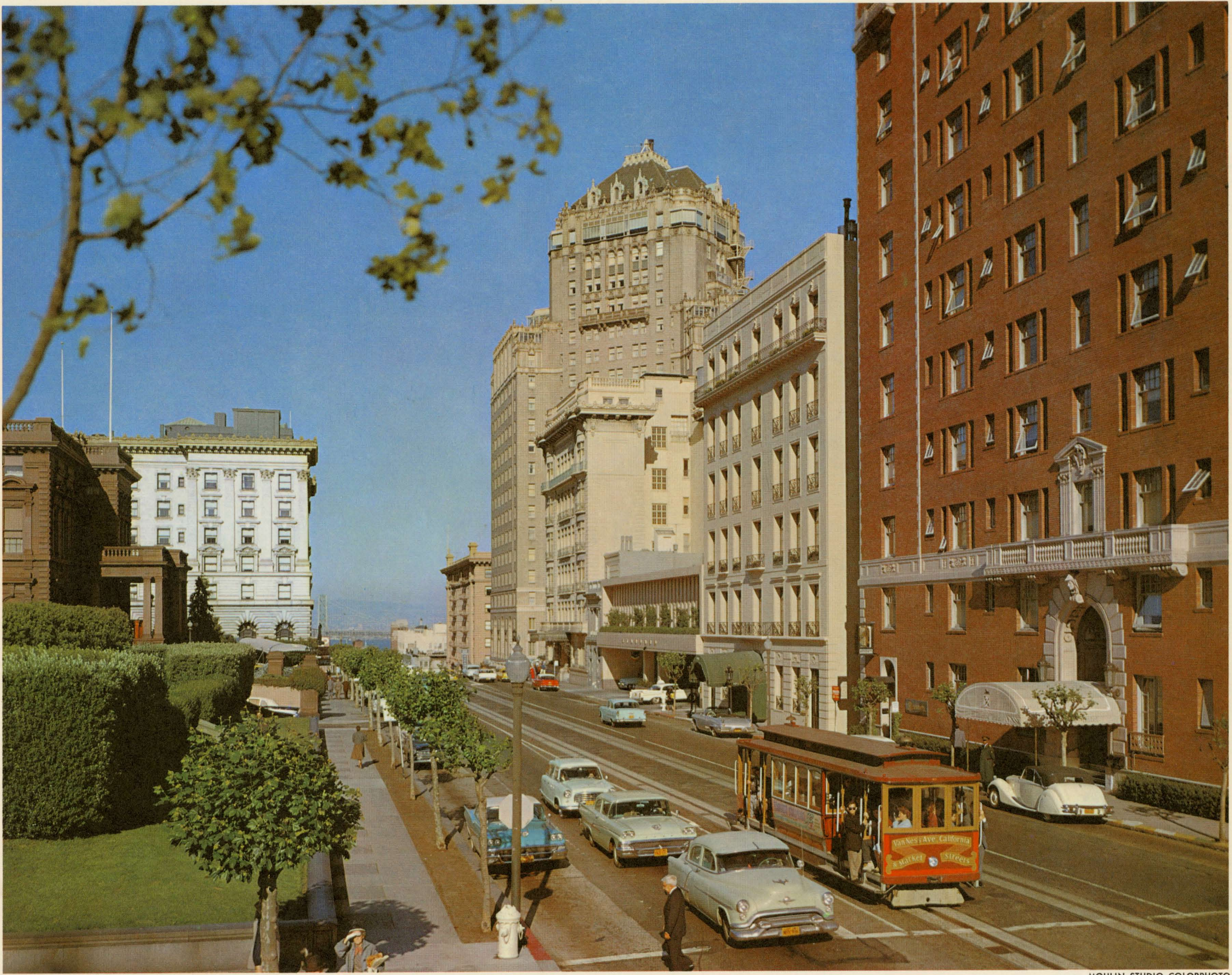
CALIFORNIA AND POWELL STREET CABLE CARS SERVE SAN FRANCISCO'S FAMOUS NOB HILL