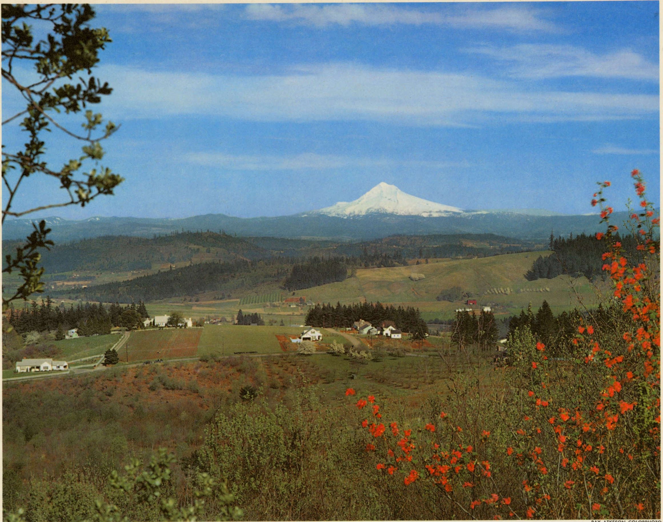
SNOWCLAD MOUNT HOOD LOOMS OVER THE FARMS AND ORCHARDS OF OREGON