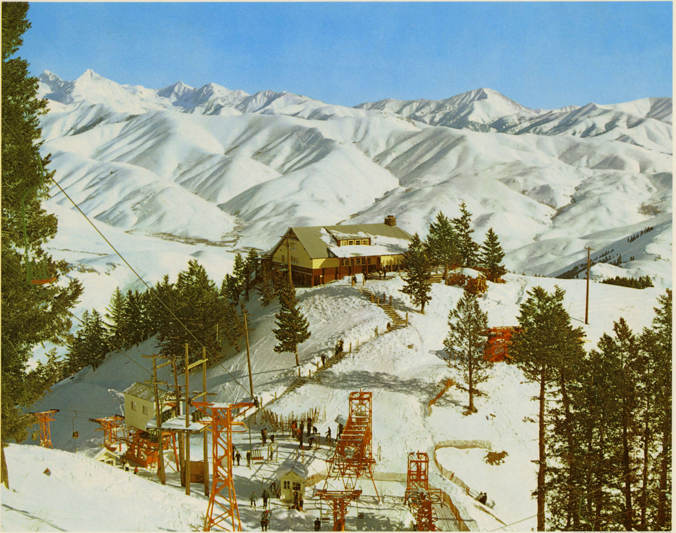
THE "ROUNDHOUSE," ON MOUNT BALDY, IS A REFRESHMENT CENTER FOR SKIERS