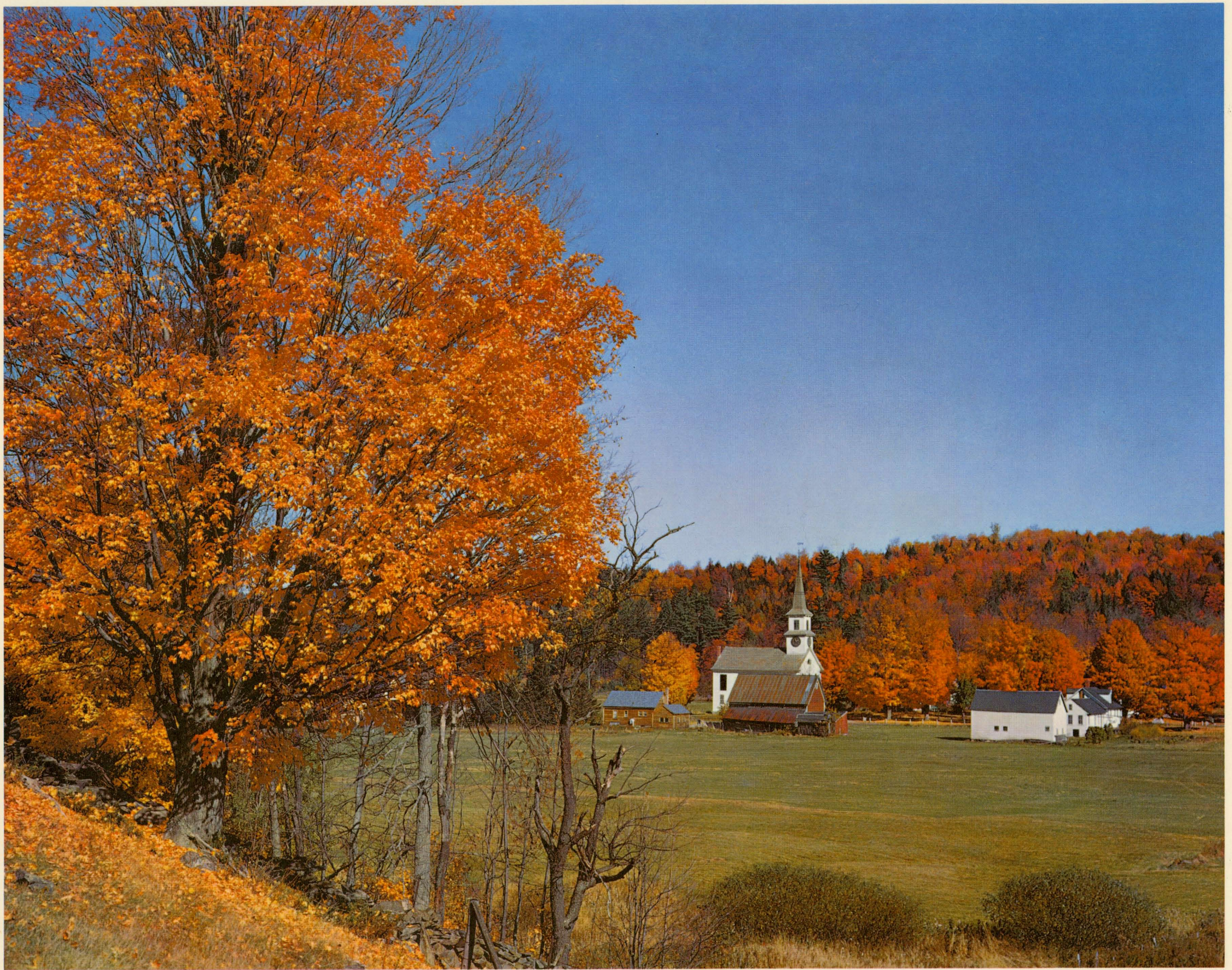
KABEL ART COLORPHOTO

AUTUMN IS A MOST COLORFUL AND POPULAR SEASON IN NEW ENGLAND