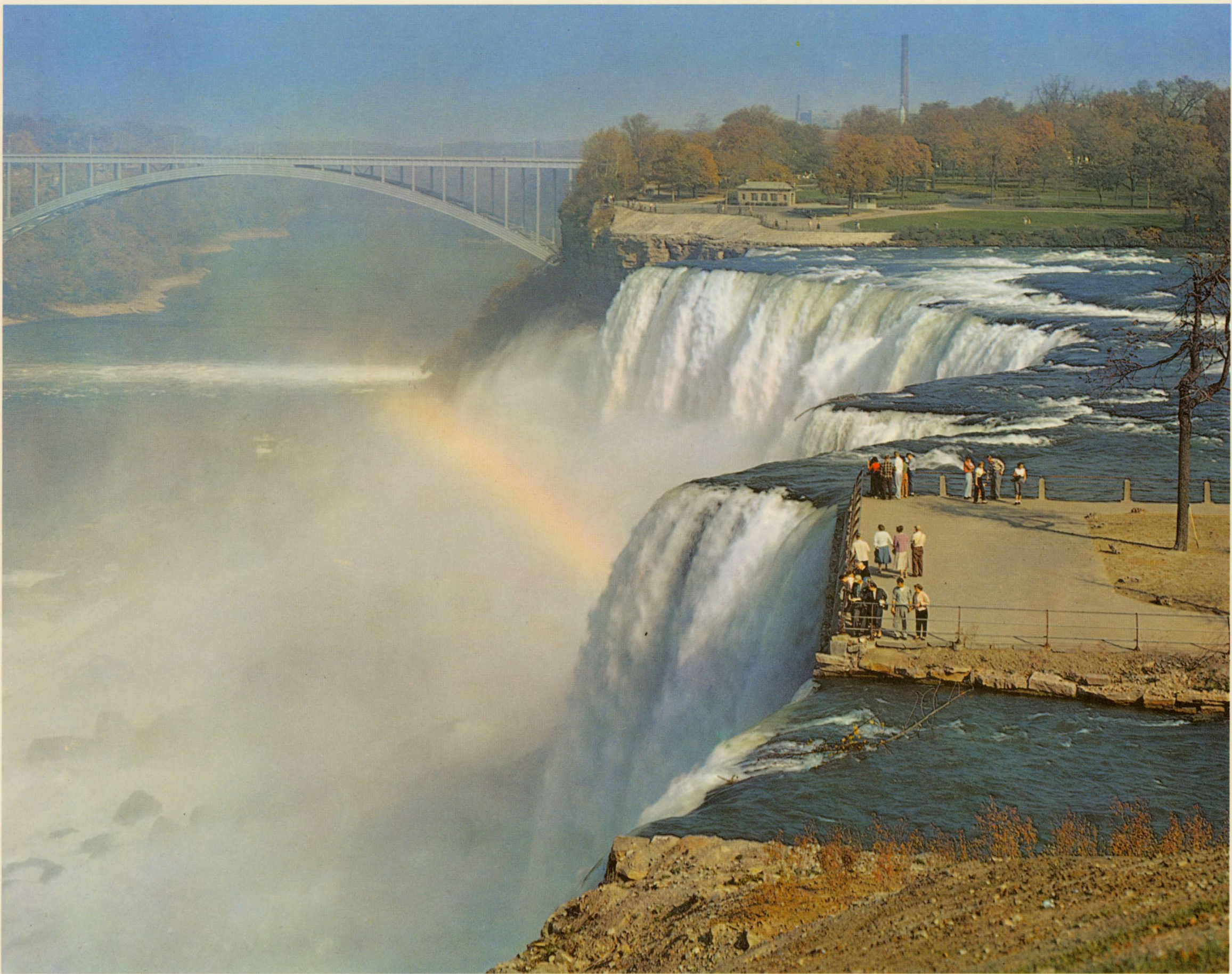
THOMAS PETERS LAKE COLORPHOTO