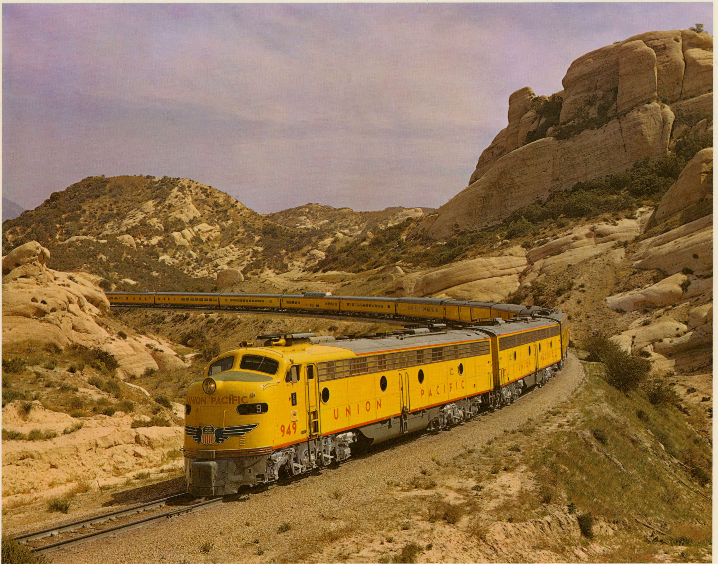
THE DOMELINER "CITY OF ST. LOUIS" IN SCENIC CAJON PASS, CALIFORNIA