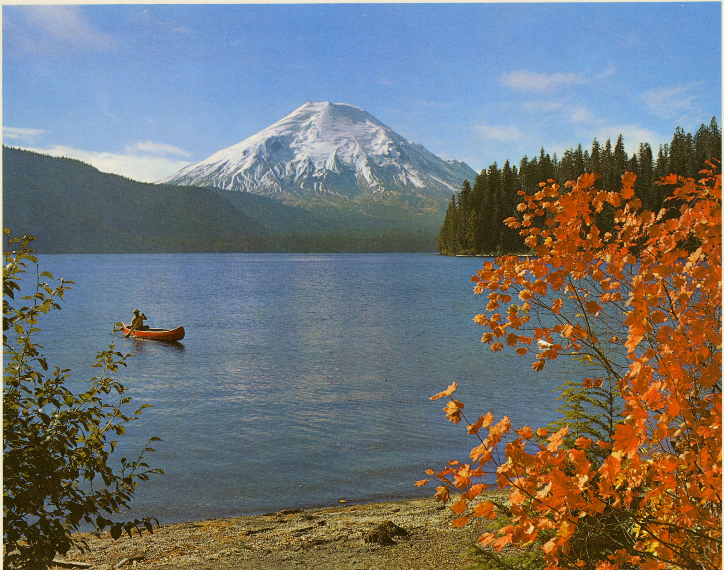
SPIRIT LAKE AT THE FOOT OF MOUNT ST. HELENS IN SOUTHERN WASHINGTON