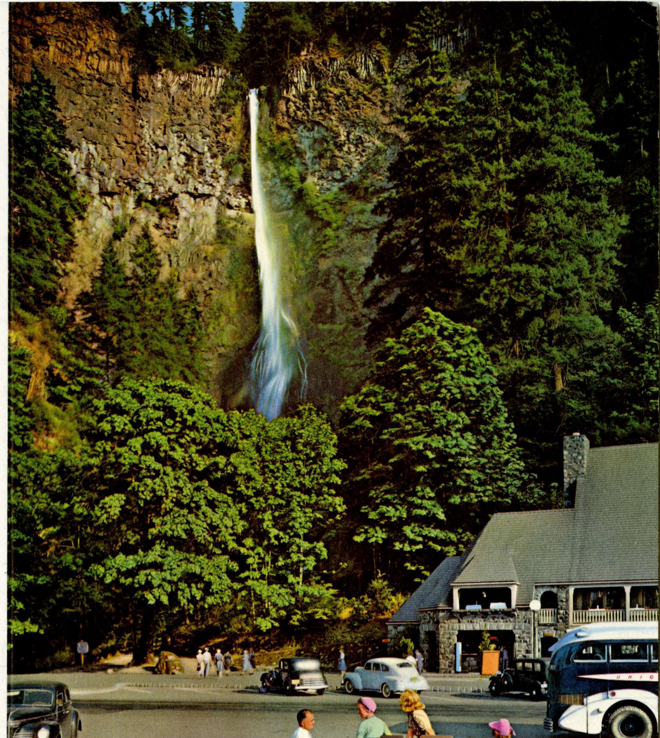
Graceful Multnomah Falls drops daintily a distance of 620 feet into a tree-fringed bowl sending up a cloud of misty spray.