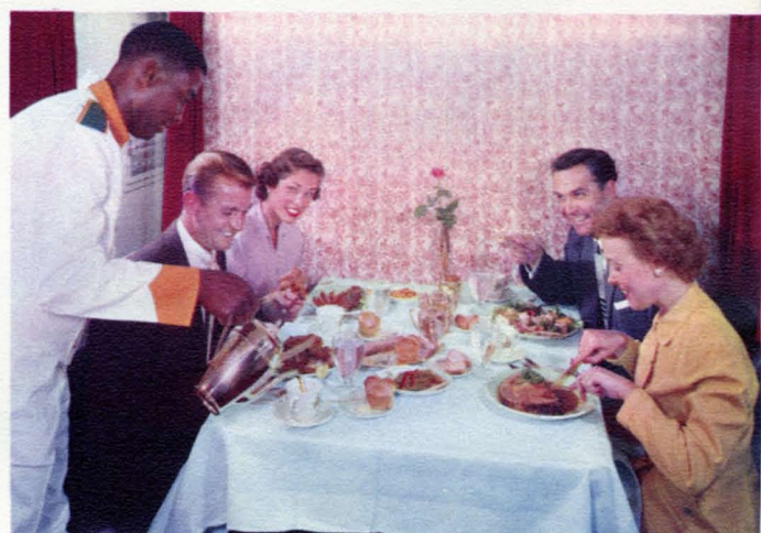
The exquisite Gold Room was designed for private dinner parties.