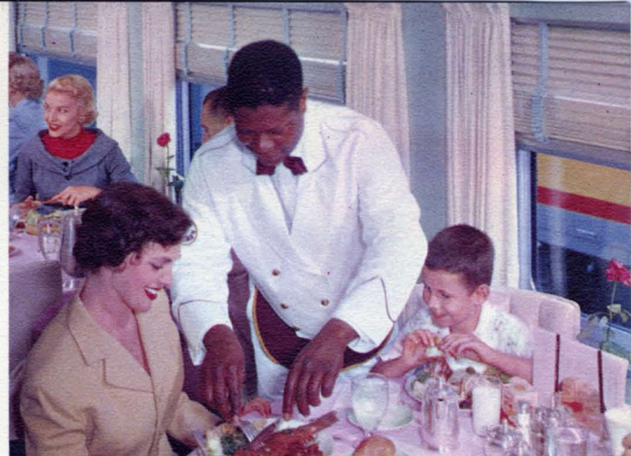
Patrons can dine regally in the luxurious main dining room.

You can offer your patrons a new adventure in dining on the "City of Portland." Note the wide picture windows which frame ever-changing views of western scenery. As you would expect, the food is of highest quality, freshly prepared and graciously served. Union Pacific is the only American railroad featuring dining in a dome .