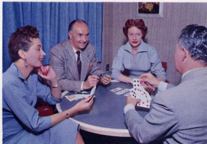
A corner of the Lounge car is set apart for the enjoyment of card players.