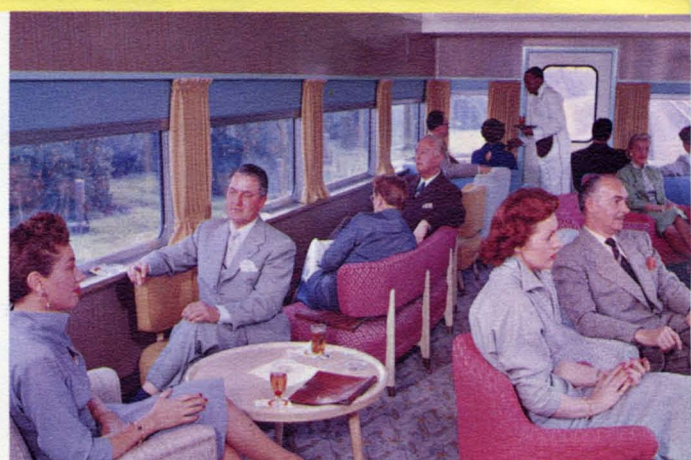
The main Observation Lounge has a distinctively different seating arrangement.

Can you imagine a more enjoyable and relaxing way of viewing picturesque western America than on a Domeliner? For example, the route of the "City of Portland" parallels the enchanting Columbia River for nearly 200 miles. In the Observation Lounge, above, and Dome Coach, pictured below, the seats are placed at an angle to give all occupants a perfect view.