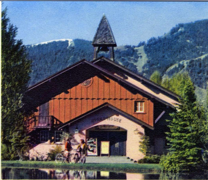
Sun Valley lies in the heart of the Sawtooth Mountain region.

If time permits, a very interesting trip can be worked out by routing patrons south from Portland to San Francisco-Los Angeles and then back east.