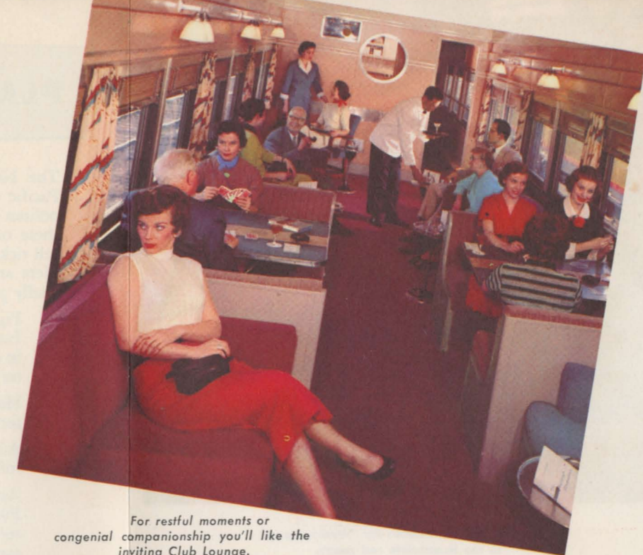
For restful moments or congenial companionship you'll like the inviting Club Lounge.

On the "City of San Francisco" Streamliner there is no extra fare . . . just extra pleasure.