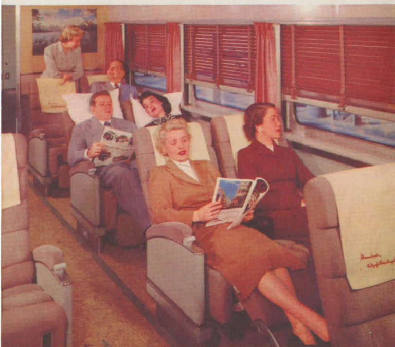
Day and night comfort is provided in Coach seats with stretch-out leg rests and adjustable backs.