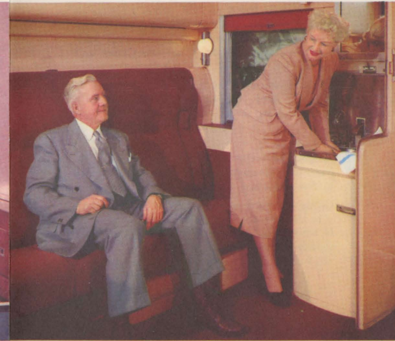
A bedroom or compartment resembles a completely equipped hotel room on wheels.