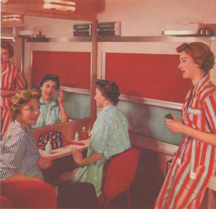
You'll find all the facilities for "freshening-up" in the immaculate rest rooms.

The "City of San Francisco" offers a variety of restful, modern Pullman accommodations including drawing rooms, compartments, bedrooms—single and en suite—roomettes and berths.