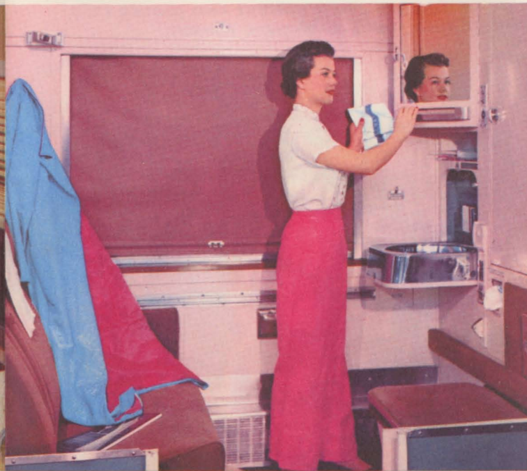
The convenient roomette was designed for economical Pullman travel.