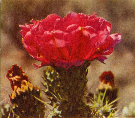
Beavertail Cactus Flower

T HE all-expense motor bus tours of this great color-splashed Canyon Country include, in addition to the three National Parks, the vast and beautiful Kaibab National Forest in Arizona, the Zion-Mount Carmel Highway with its mile-long window tunnel, and the gorgeously colored amphitheatres of Cedar Breaks National Monument in Utah. The tours start from and return to Cedar City, Utah. Tours range from the one-day tour to Zion National Park only, to the five-day tour which includes all of these colorful regions. Rates are very reasonable. Stop-overs can be arranged at any of the Parks.