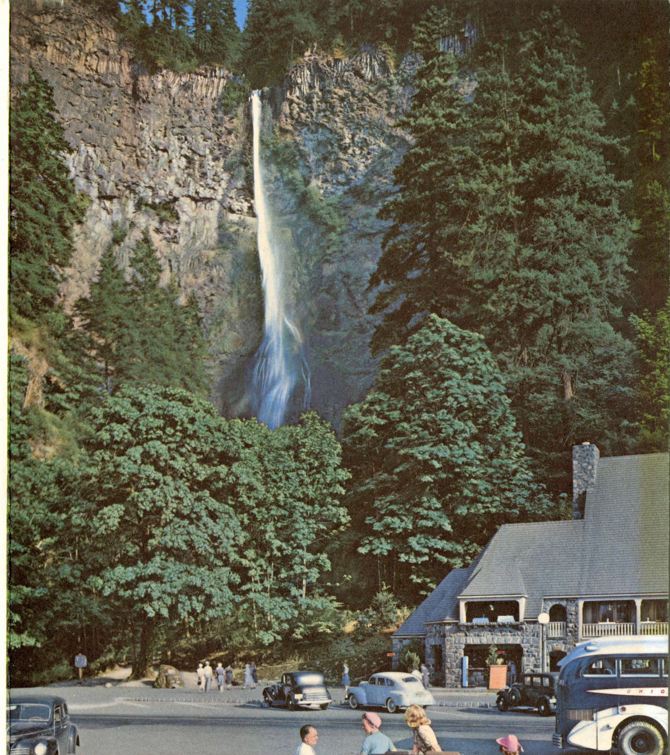
Graceful Multnomah Falls drops daintily a distance of 620 feet into a tree-fringed bowl, sending up a cloud of misty spray.