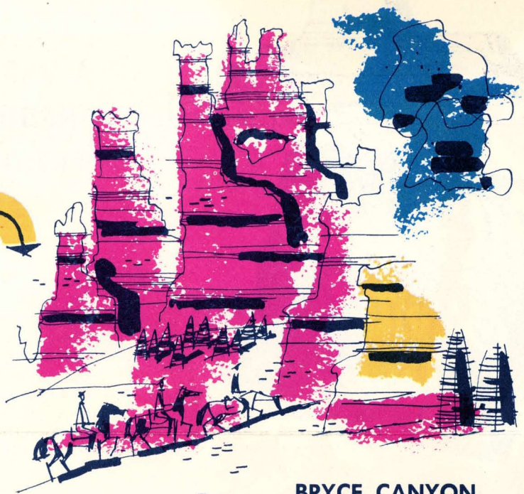
BRYCE CANYON NATIONAL PARK