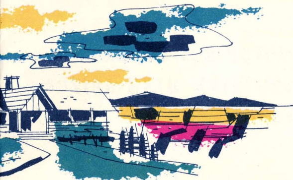
CEDAR BREAKS NAT'L MON.