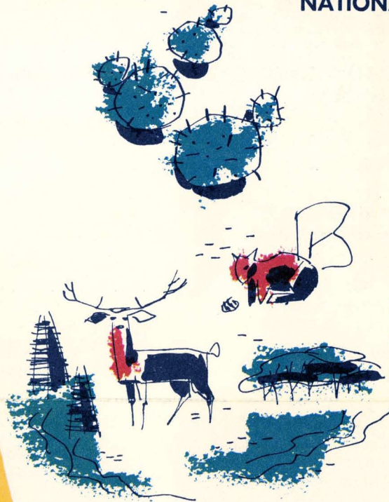
KAIBAB NATIONAL FOREST