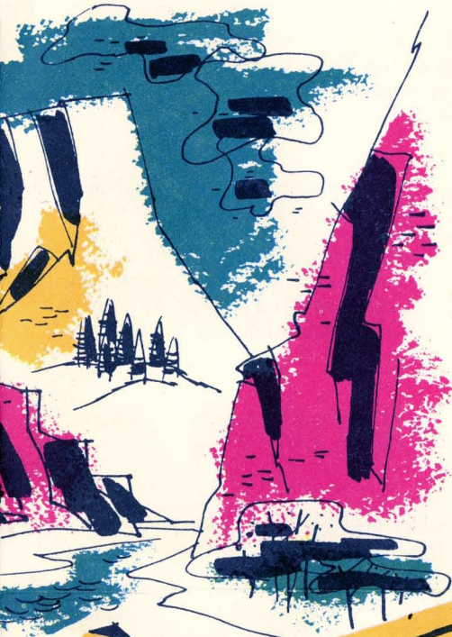
ZION NATIONAL PARK