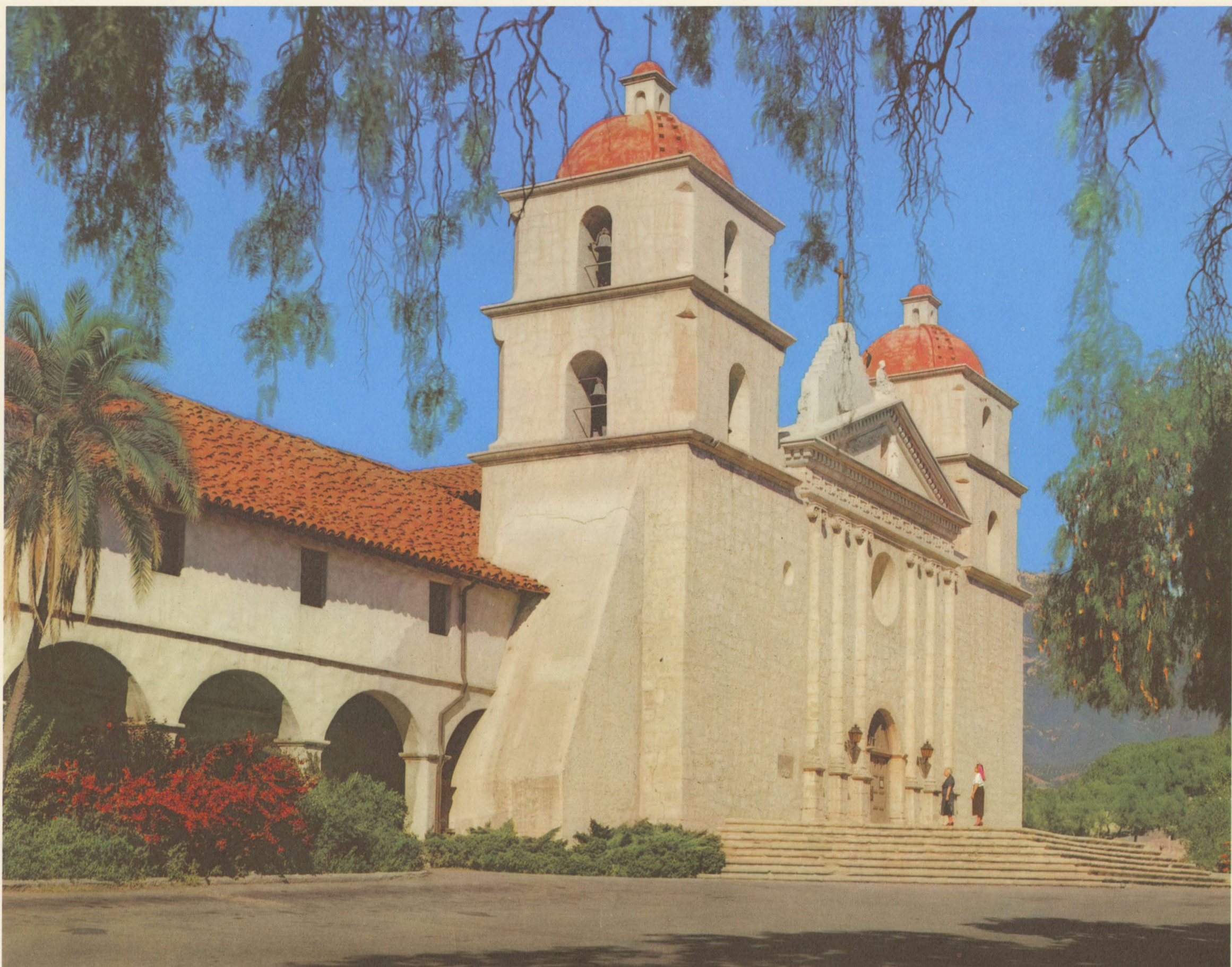
SANTA BARBARA MISSION, CALIFORNIA IS A FINE EXAMPLE OF EARLY SPANISH ARCHITECTURE