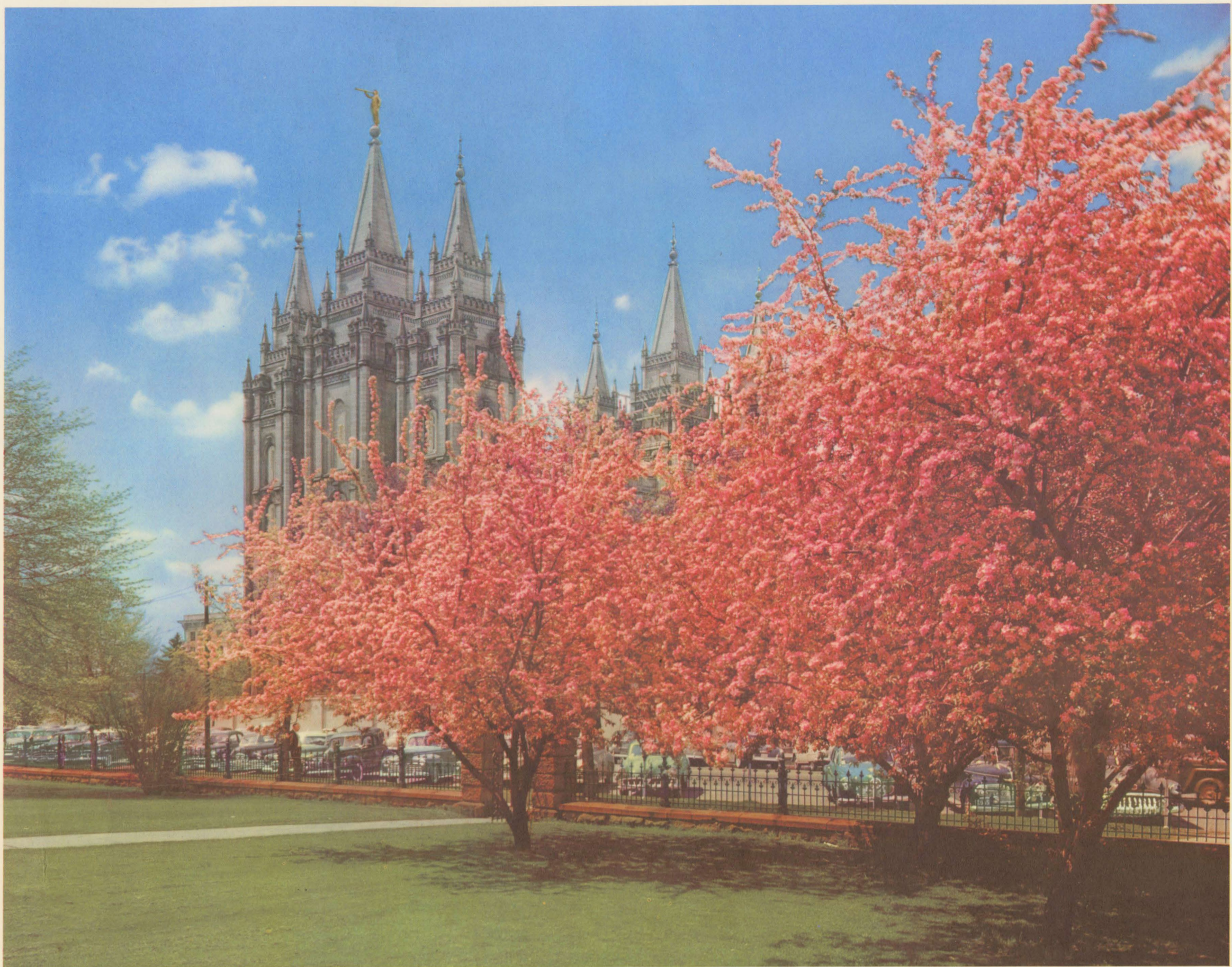
THE STATELY MORMON TEMPLE, SALT LAKE CITY, UTAH