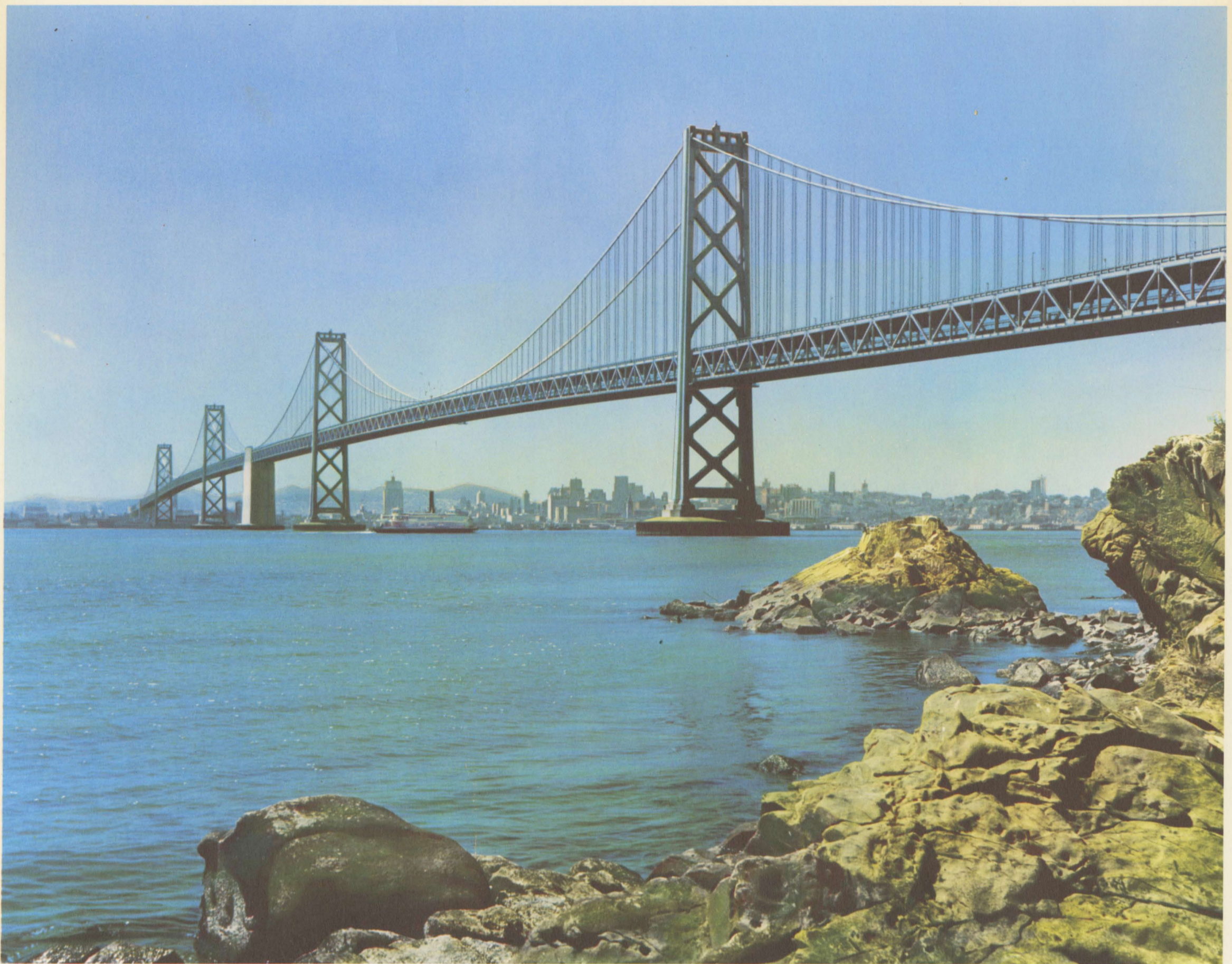
THE TOWERING SAN FRANCISCO-OAKLAND BAY BRIDGE IS AN INSPIRING SIGHT