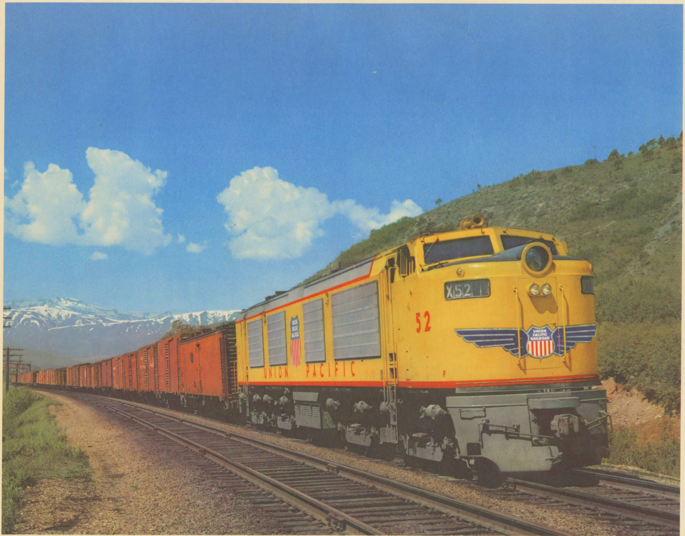
UNION PACIFIC RAILROAD COLORPHOTO

MODERN MOTIVE POWER ASSURES EFFICIENT HANDLING OF FREIGHT SHIPMENTS VIA UNION PACIFIC