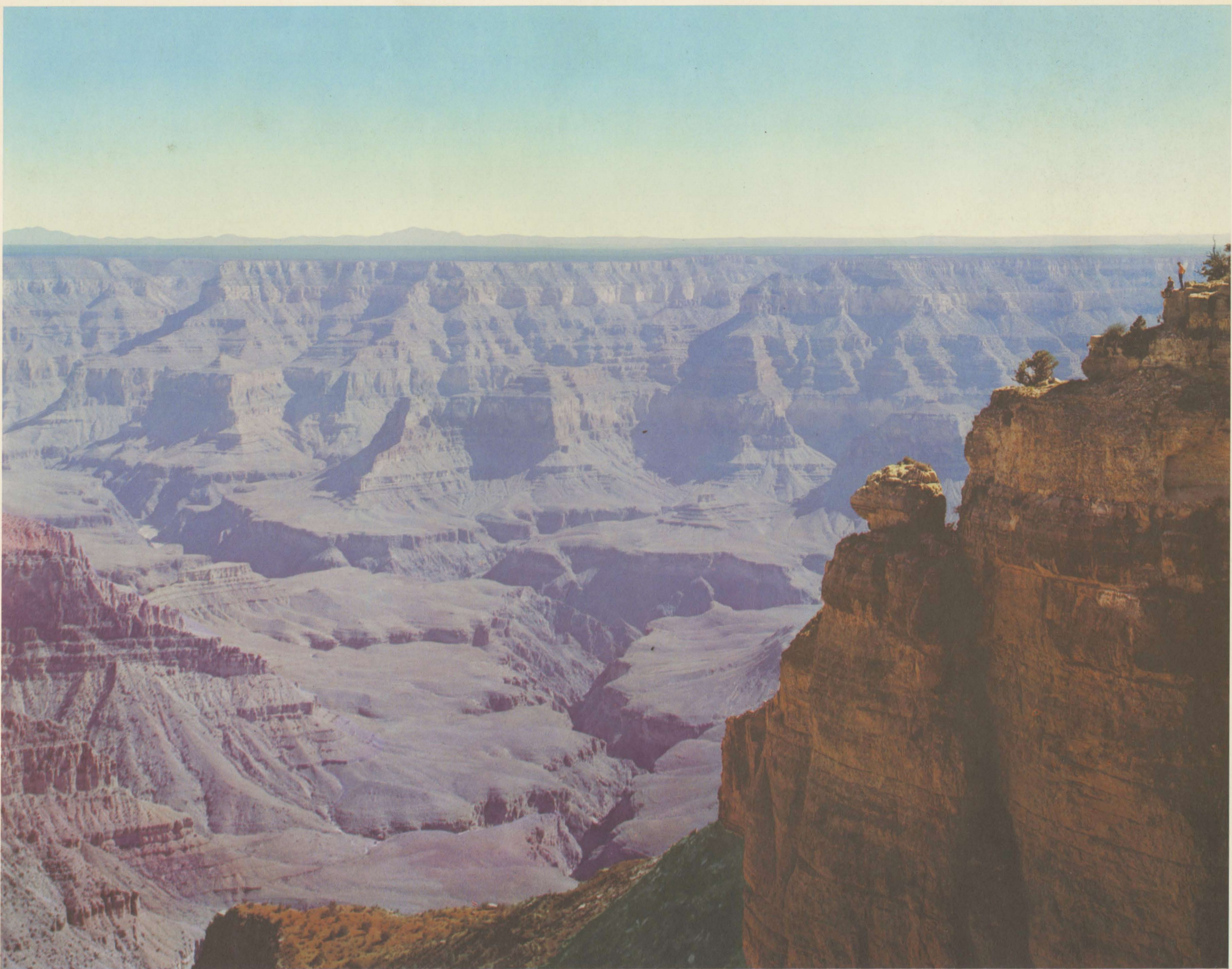
A SOMBER MOOD OF THE GRAND CANYON IN ARIZONA — A CANYON OF MANY MOODS