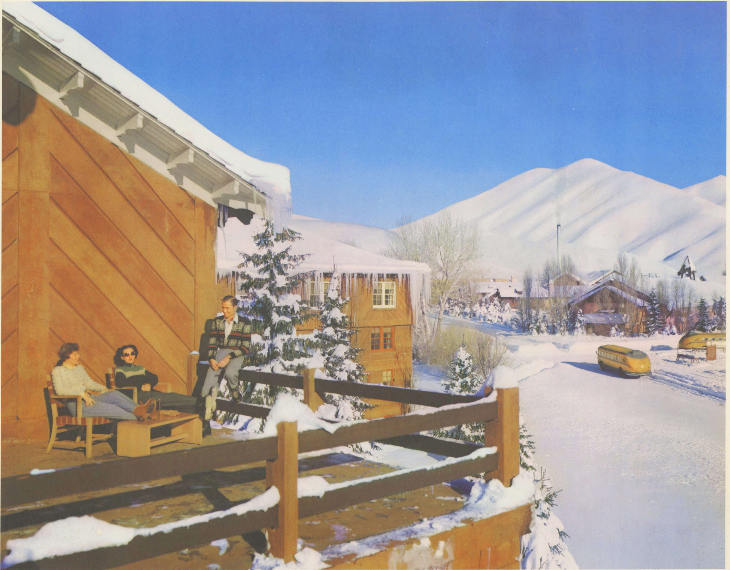
SUN VALLEY, IDAHO OFFERS A VARIETY OF WINTER SPORTS UNDER A SUMMER SUN