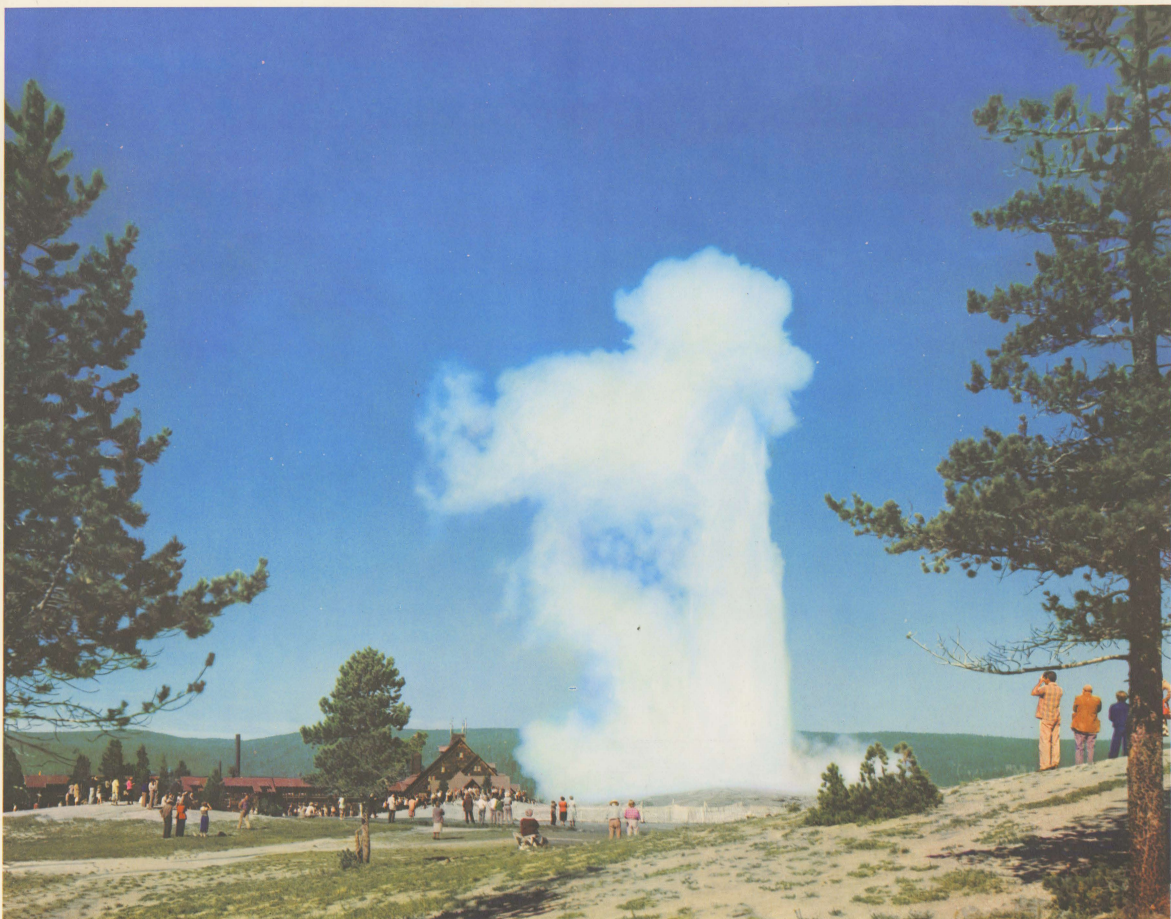
"OLD FAITHFUL" GEYSER IN YELLOWSTONE NATIONAL PARK IS ALWAYS A FAVORITE