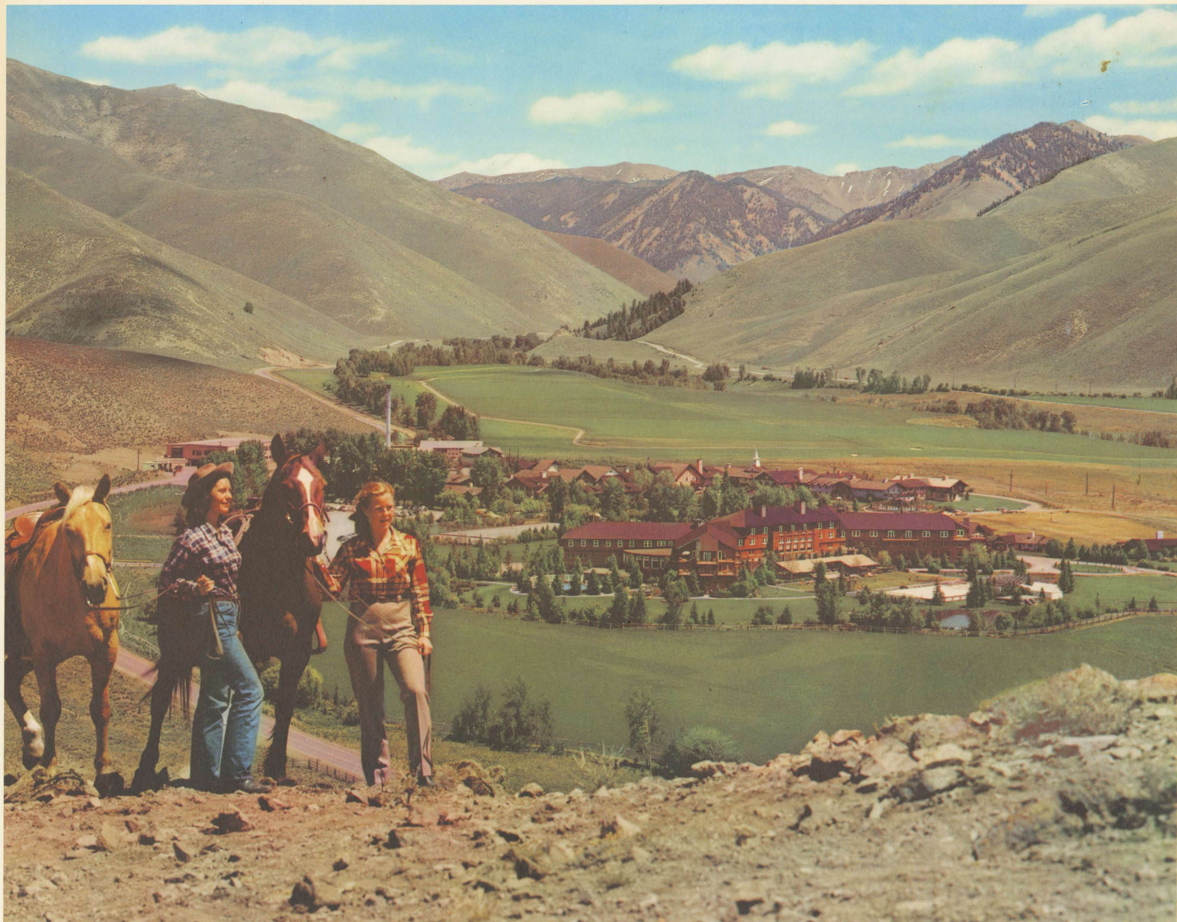
FABULOUS SUN VALLEY, IDAHO PROVIDES EVERYTHING FOR AN IDEAL SUMMER VACATION