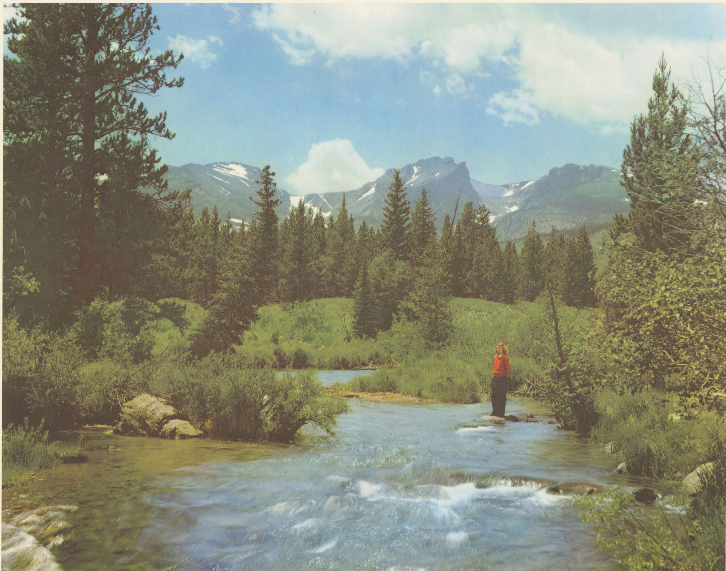
CRYSTAL CLEAR STREAMS AND LOFTY, SNOW-CAPPED PEAKS TYPIFY COLORADO