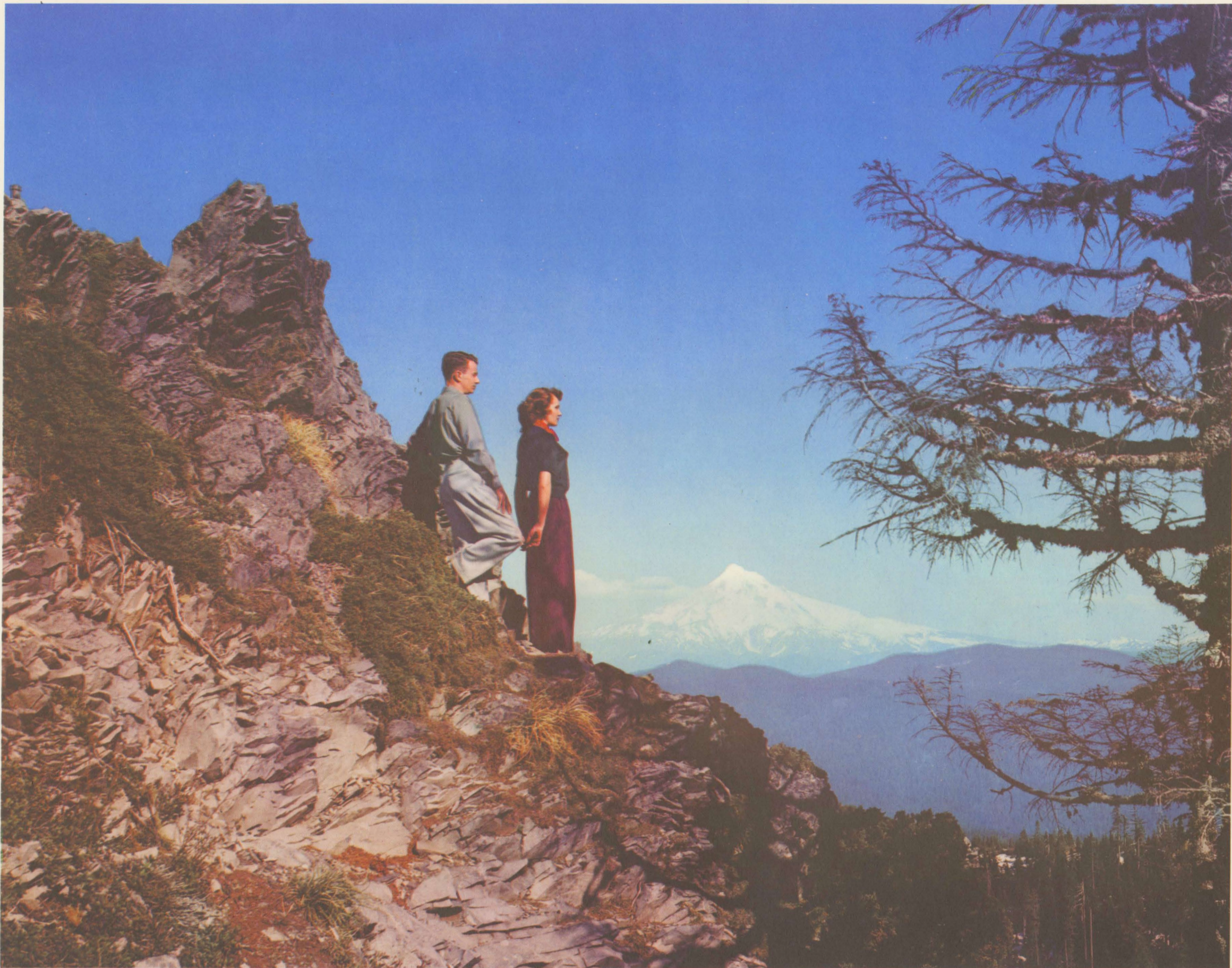
MAJESTIC MT. HOOD IS BUT ONE OF MANY SCENIC DELIGHTS OF THE PACIFIC NORTHWEST