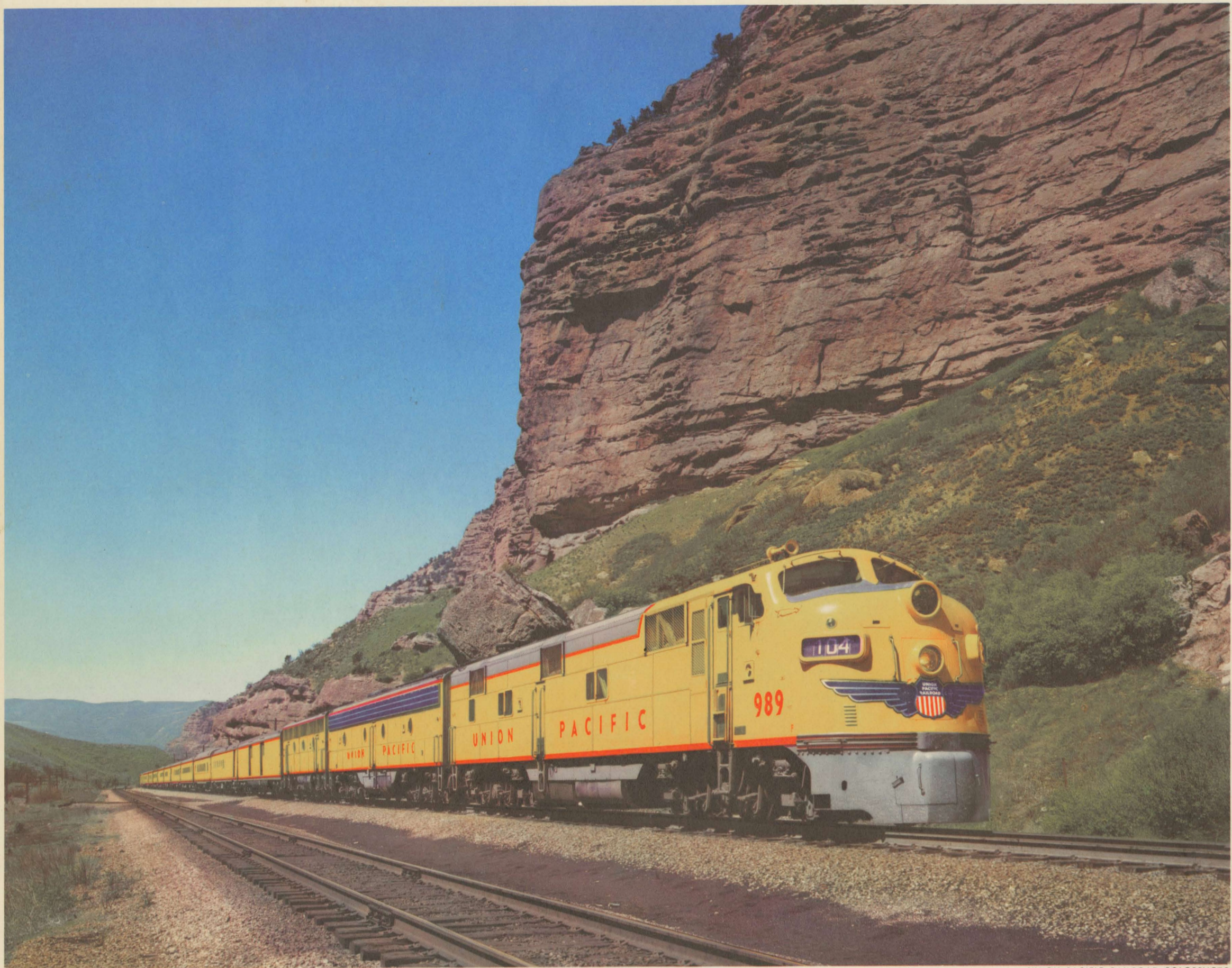
UNION PACIFIC RAILROAD COLORPHOTO

UNION PACIFIC'S MODERN STREAMLINERS TRAVERSE SCENIC COUNTRY, RICH IN HISTORIC LORE