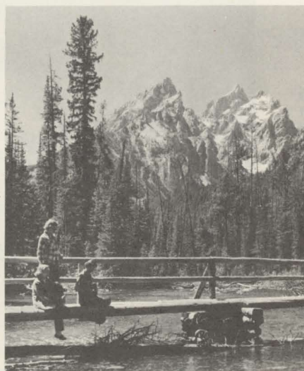
Jagged crests of the Teton Mountains.