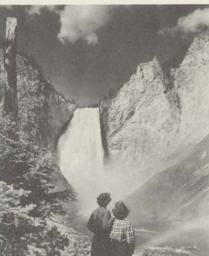
High Yellowstone Falls in a colorful canyon.