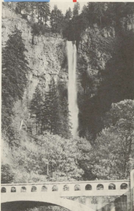
Along the Union Pacific route, Multnomah Falls tumbles in shimmering mists.