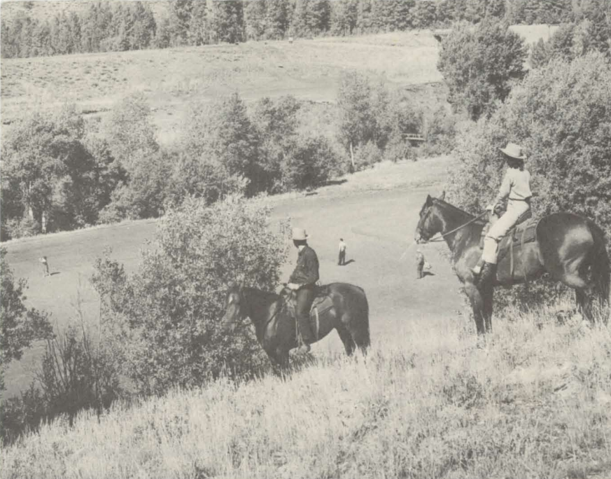
Sports are the feature at Sun Valley, Idaho, summer and winter.