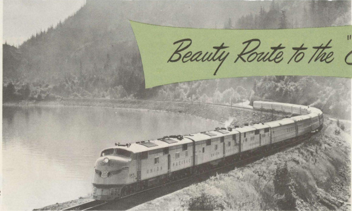
Early morning in the 200-mile Columbia River Gorge, en route to Portland.

Scenic Inside Waterway Passage to ALASKA