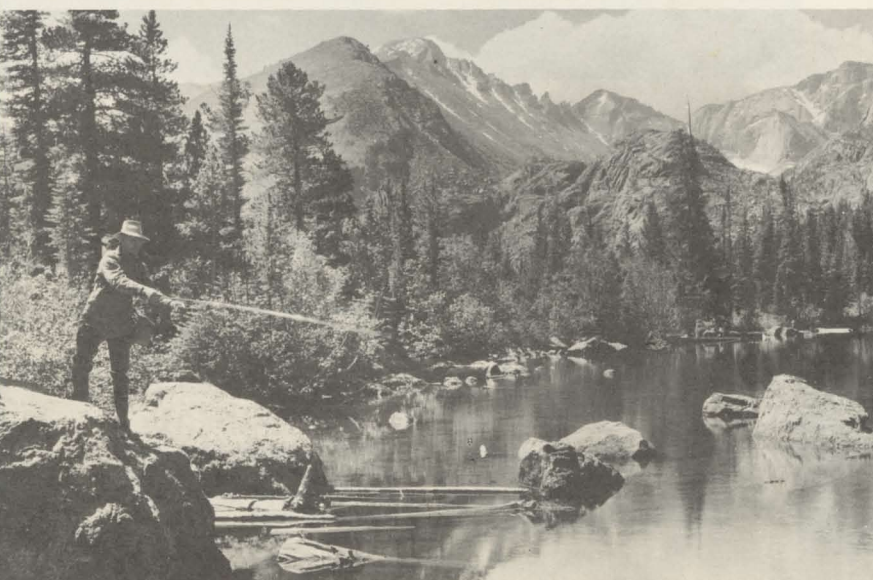
14,000-foot peaks rise above lakes of Rocky Mountain National Park.