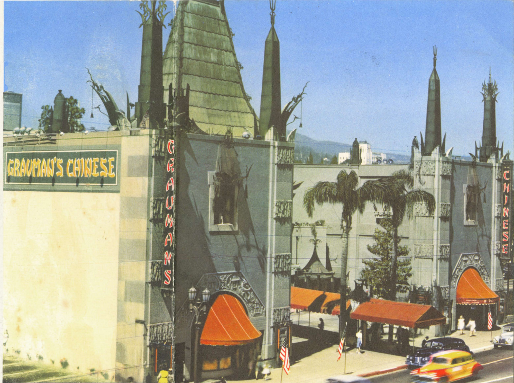
Famous Grauman's Chinese Theatre on Hollywood Boulevard in the film capital, the scene of many a motion picture premiere.

Within recent years Hollywood has grown in importance as a radio center and many national network programs now originate there. Hollywood and its neighbors Westwood Village and Beverly Hills have some of the finest department stores, smart shops, restaurants and night clubs in the country. Westwood Village embraces the campus of the University of California at Los Angeles.