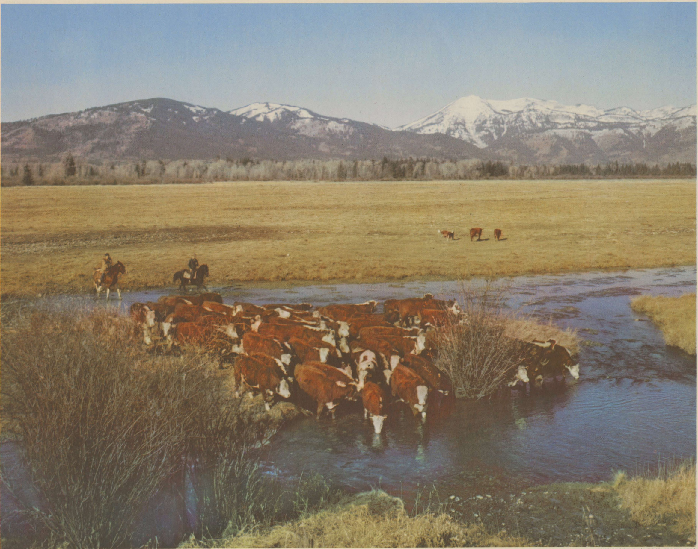
WESTERN BEEF CATTLE ARE ROUNDED UP FOR QUICK MOVEMENT TO MARKET BY UNION PACIFIC