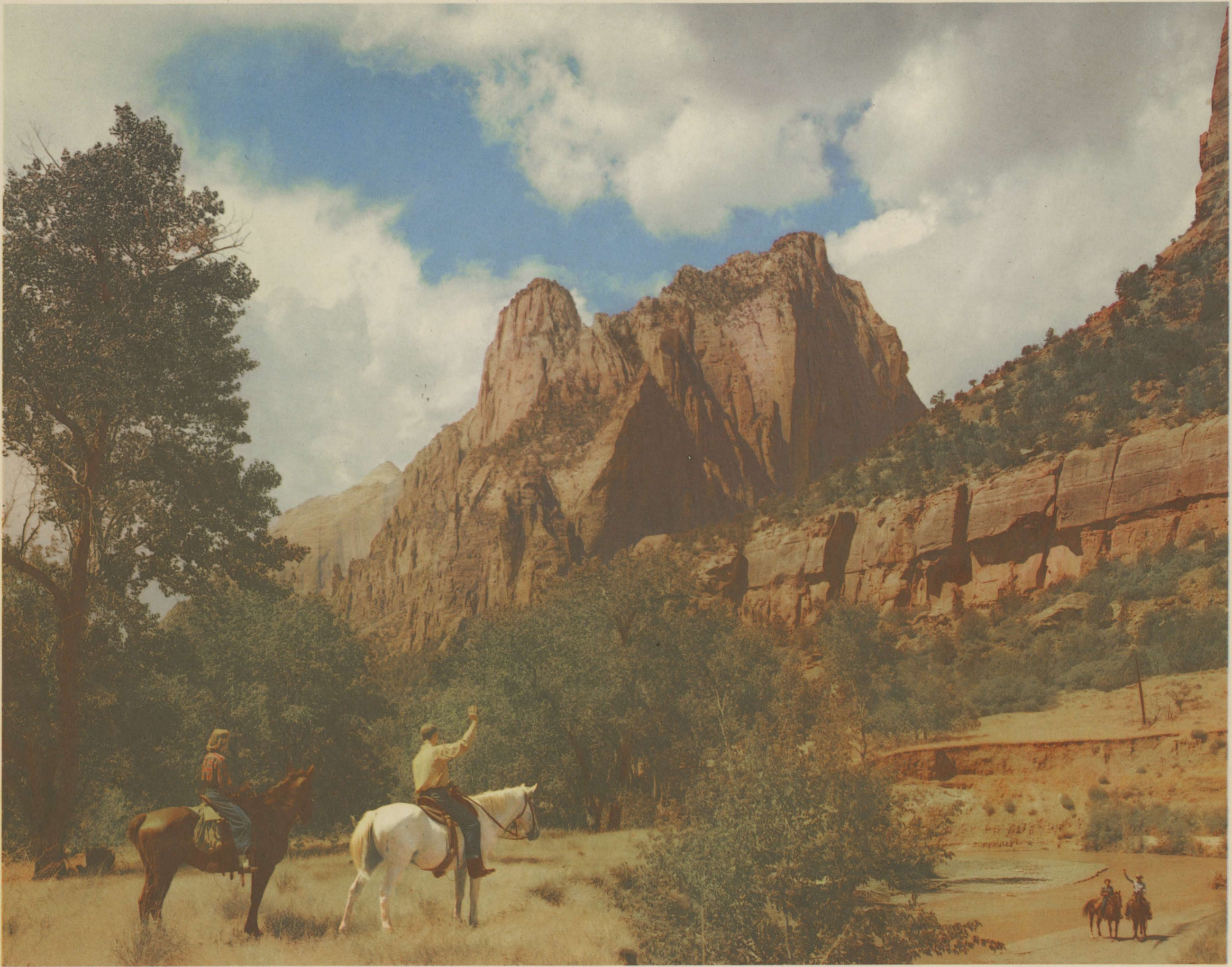
LOFTY SENTINEL PEAK IN WEST WALL OF ZION CANYON, ZION NATIONAL PARK, UTAH