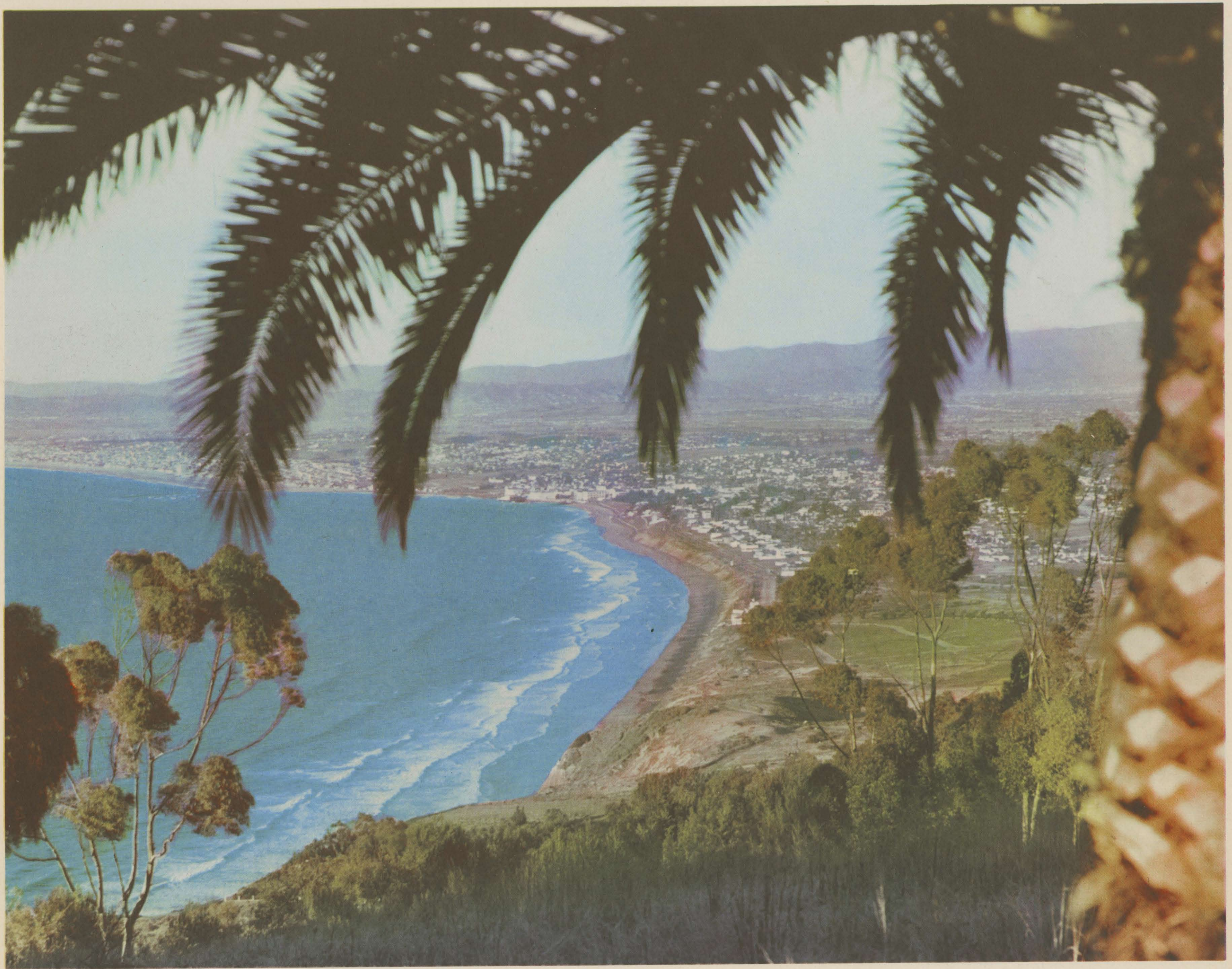
OVERLOOKING REDONDO AND HERMOSA BEACHES FROM PALOS VERDES HILLS NEAR LOS ANGELES