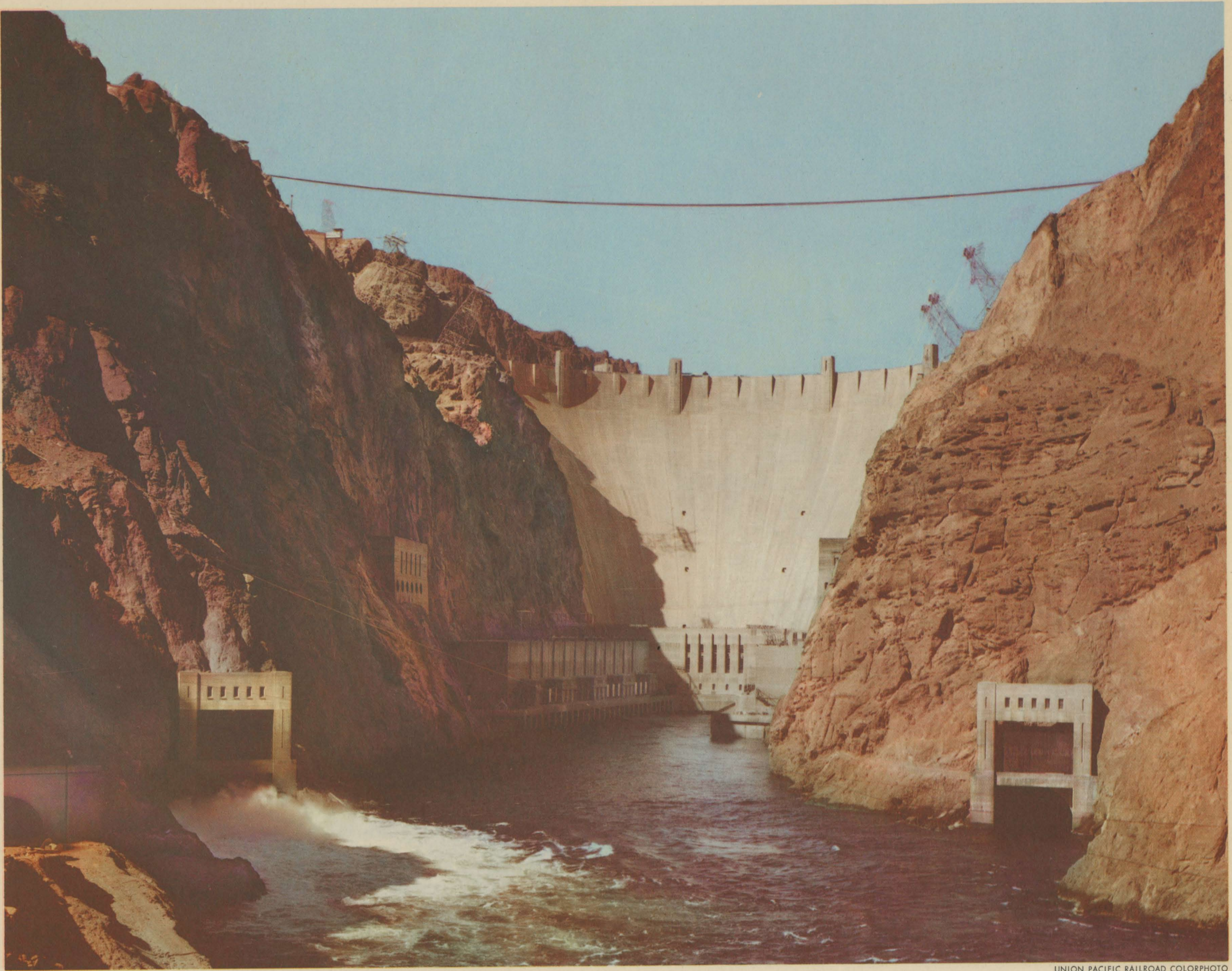
LOWER FACE OF COLOSSAL HOOVER DAM, NEAR LAS VEGAS, NEVADA