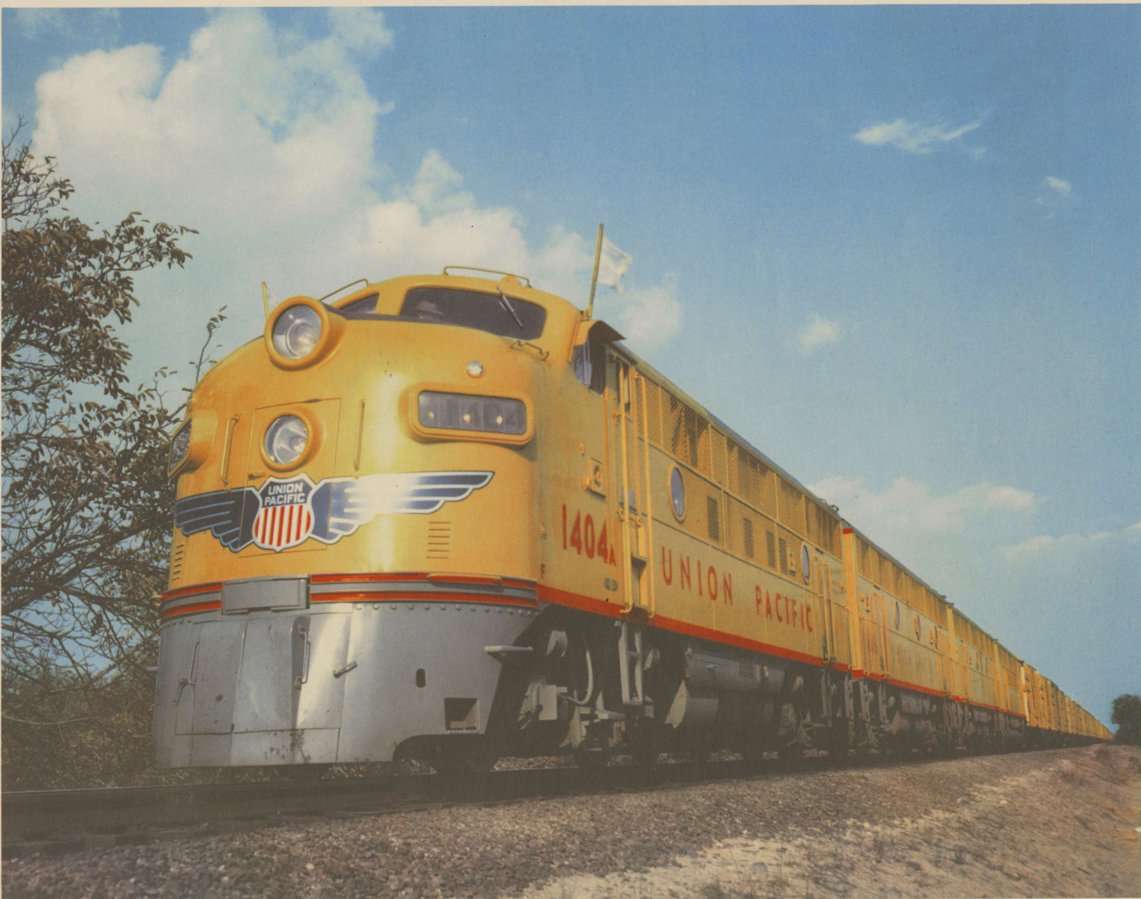
UNION PACIFIC RAILROAD COLORPHOTO

MODERN UNION PACIFIC FREIGHT DIESELS SPEED SHIPMENTS TO ON-TIME DELIVERIES