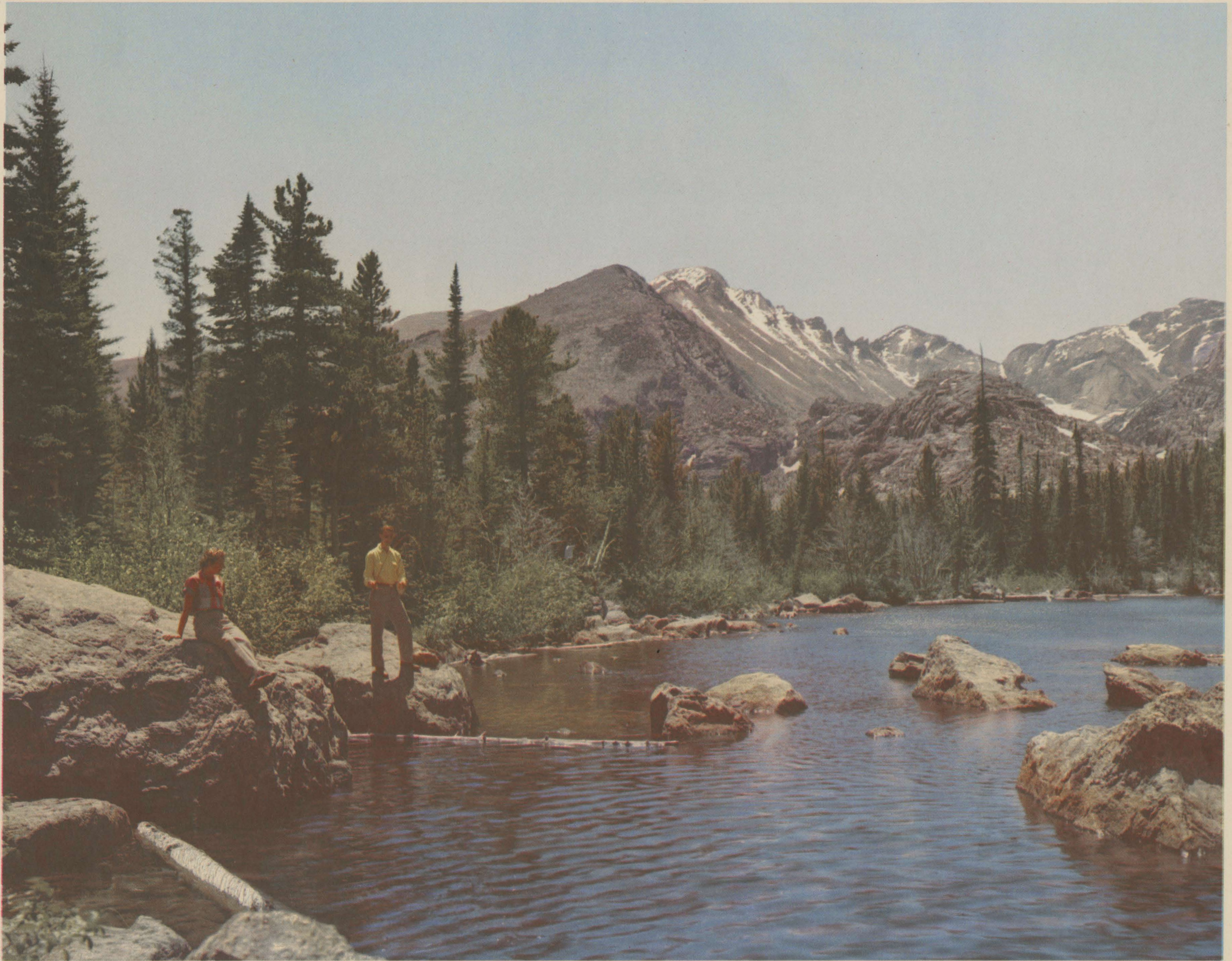
BEAR LAKE AND LONGS PEAK, ROCKY MOUNTAIN NATIONAL PARK, COLORADO