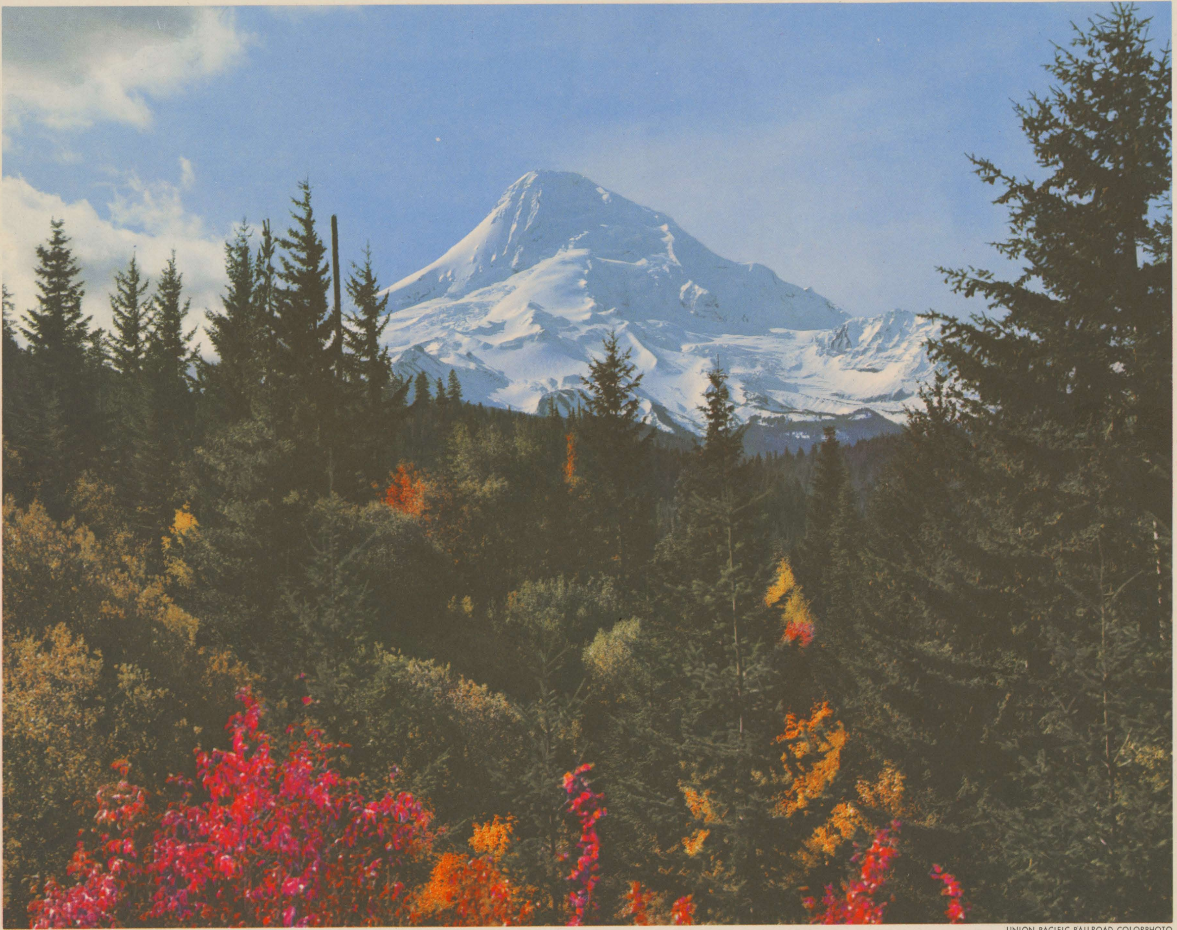
UNION PACIFIC RAILROAD COLORPHOTO