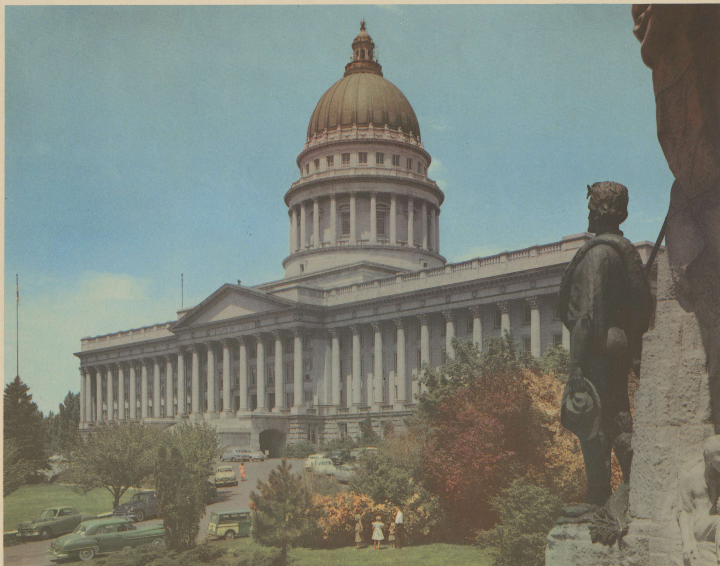
THE STATELY AND BEAUTIFUL CAPITOL BUILDING OF UTAH, SALT LAKE CITY