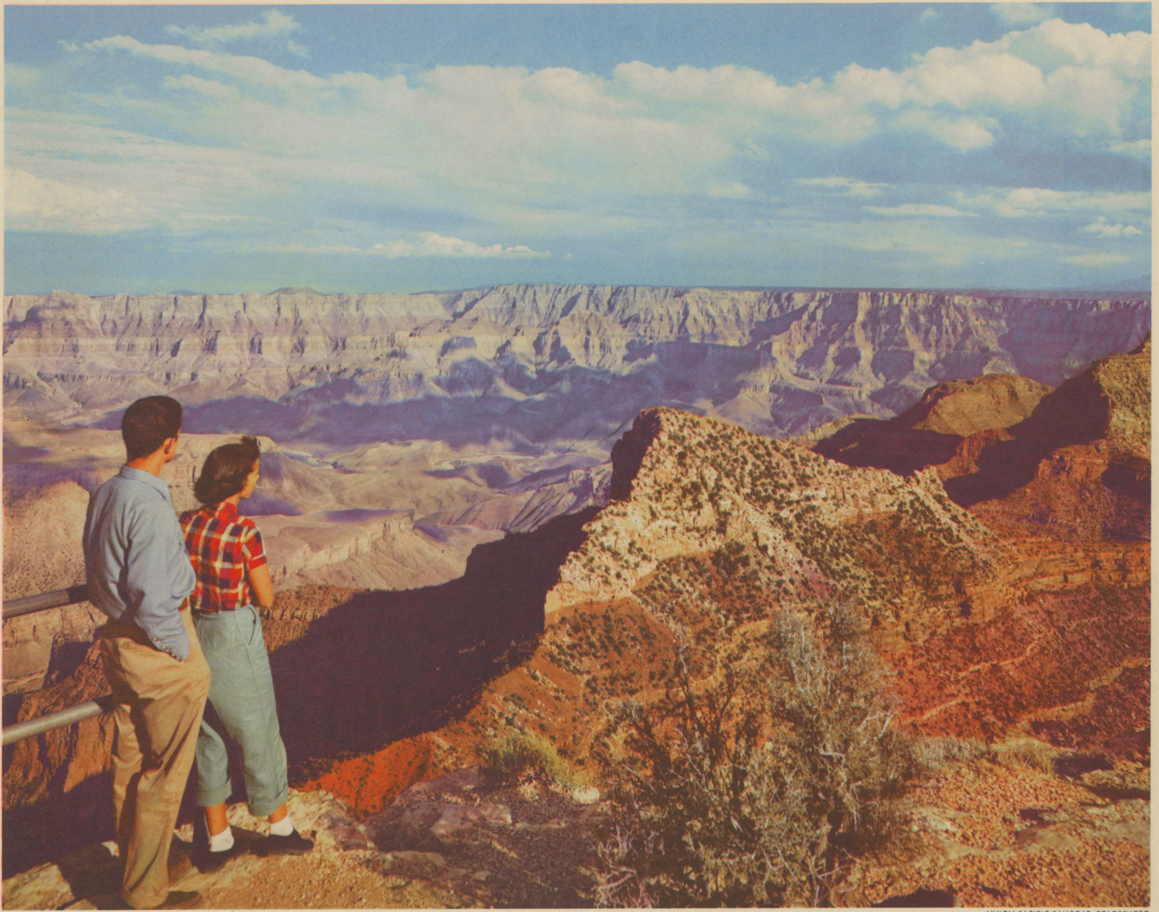
BREATH-TAKING GRAND CANYON AND COLORADO RIVER FROM CAPE ROYAL ON NORTH RIM