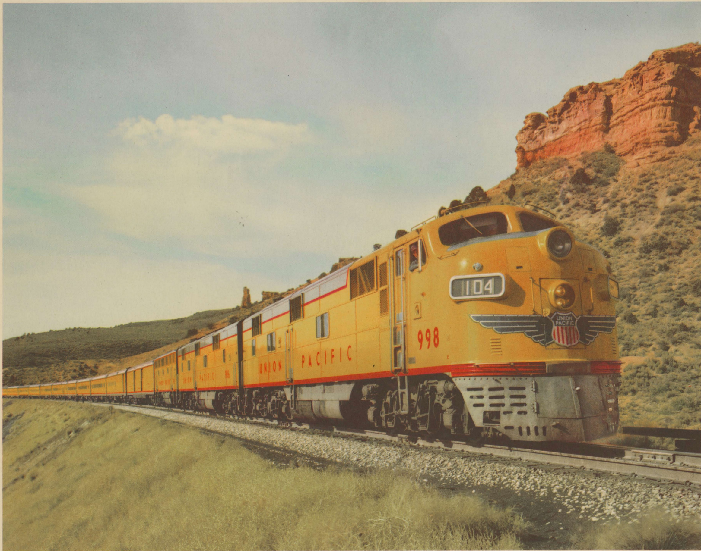
THE STREAMLINER CITY OF LOS ANGELES IN ECHO CANYON, UTAH