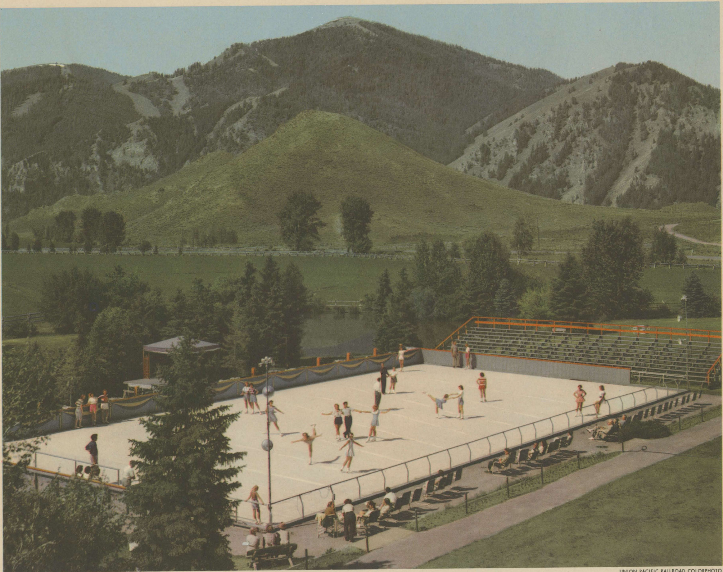
UNION PACIFIC RAILROAD COLORPHOTO