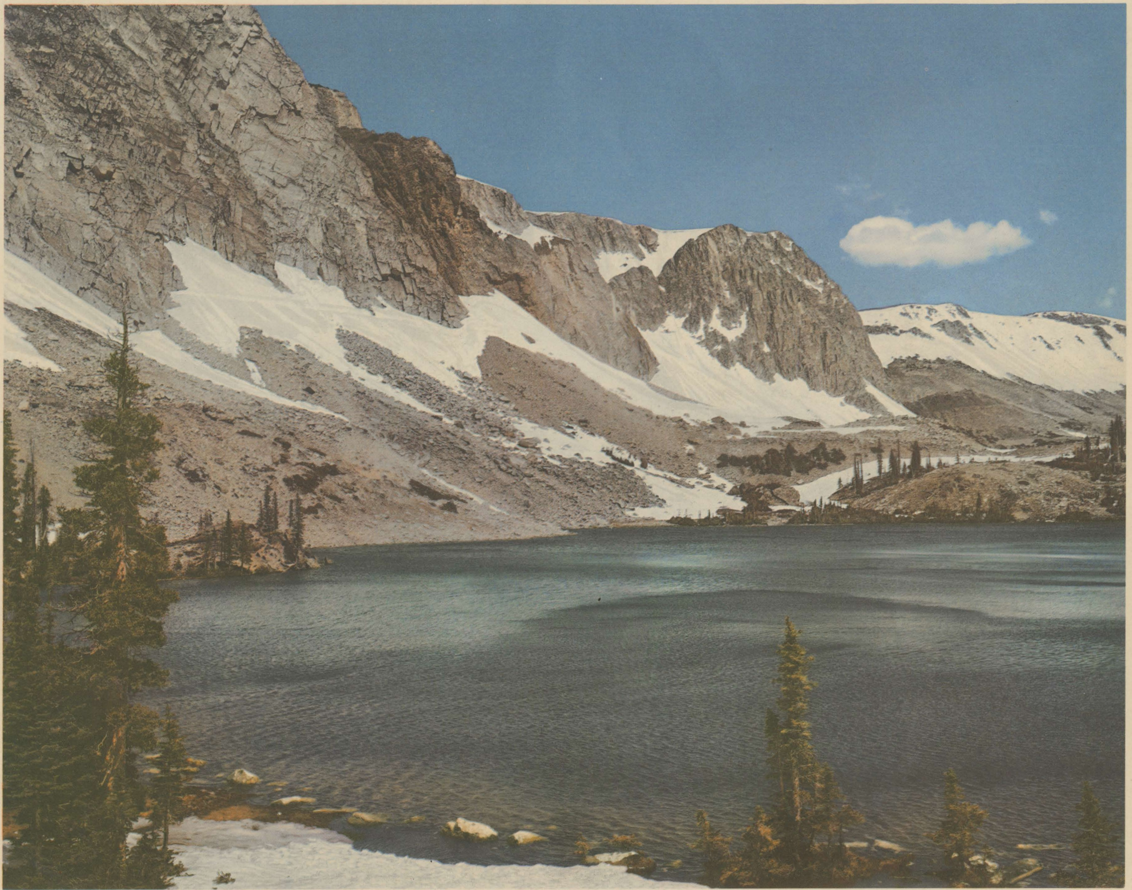
LOVELY LAKE MARIE IN THE SNOWY RANGE OF SOUTHERN WYOMING