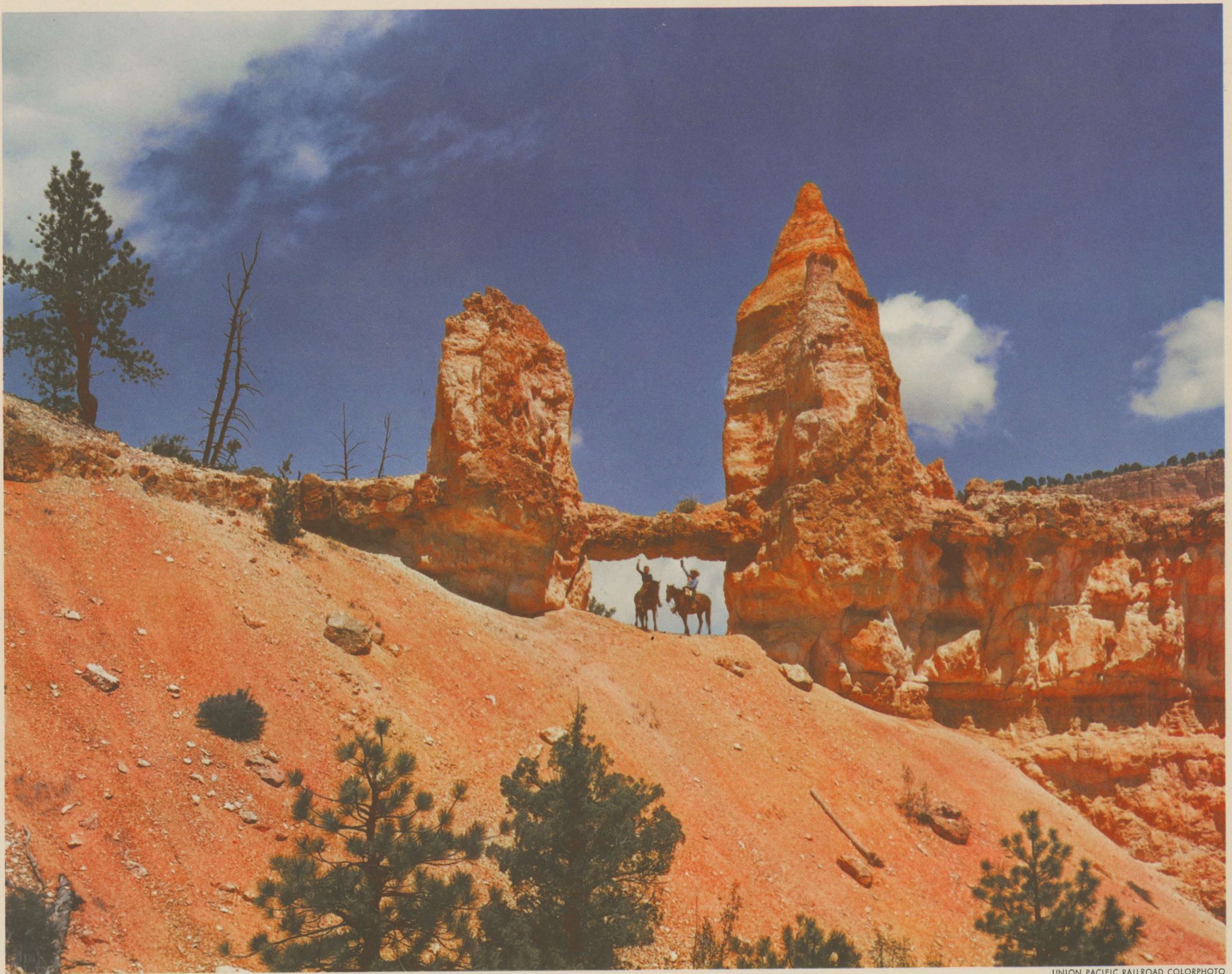
UNION PACIFIC RAILROAD COLORPHOTO