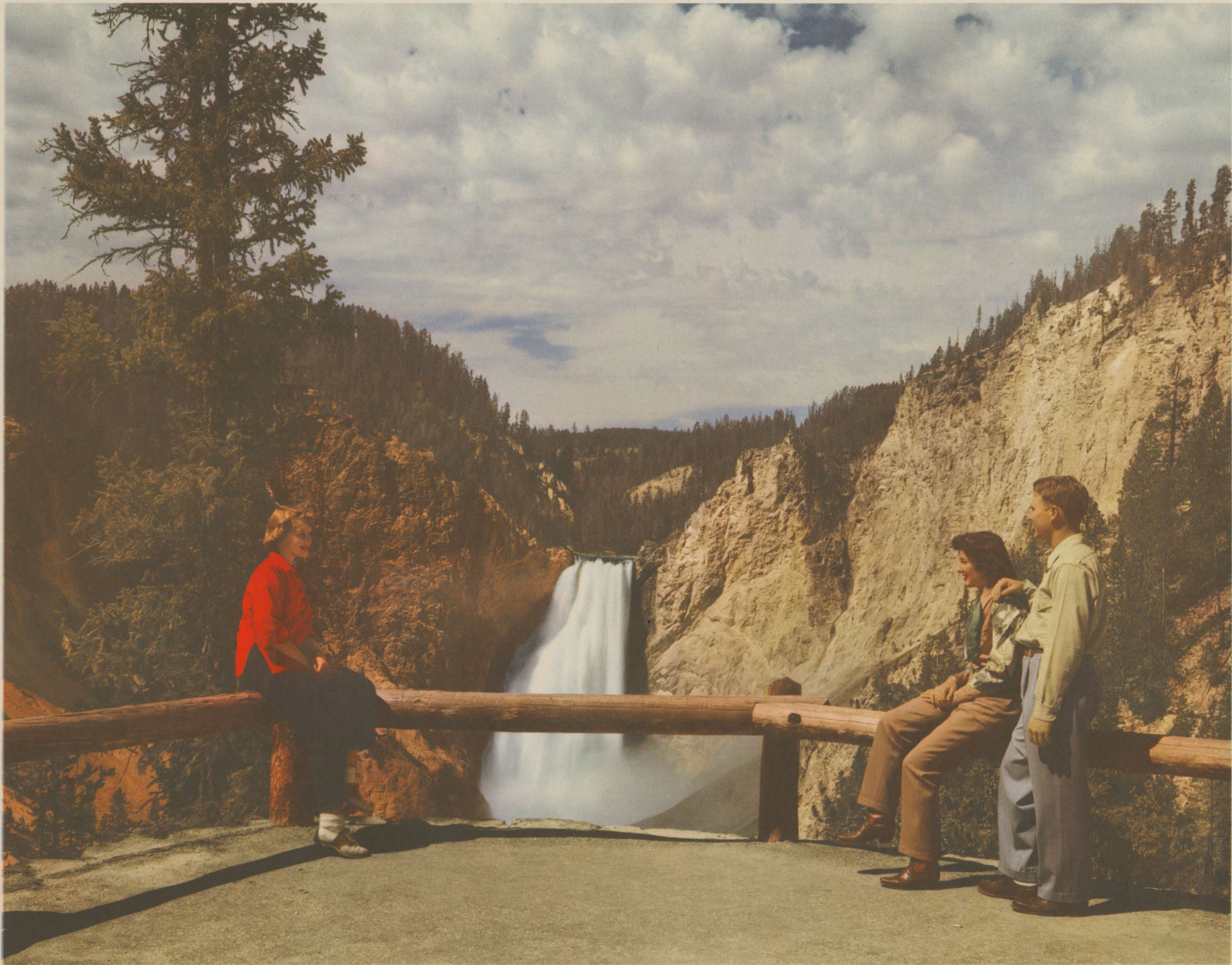
LOWER FALLS OF THE YELLOWSTONE RIVER, YELLOWSTONE NATIONAL PARK, WYOMING