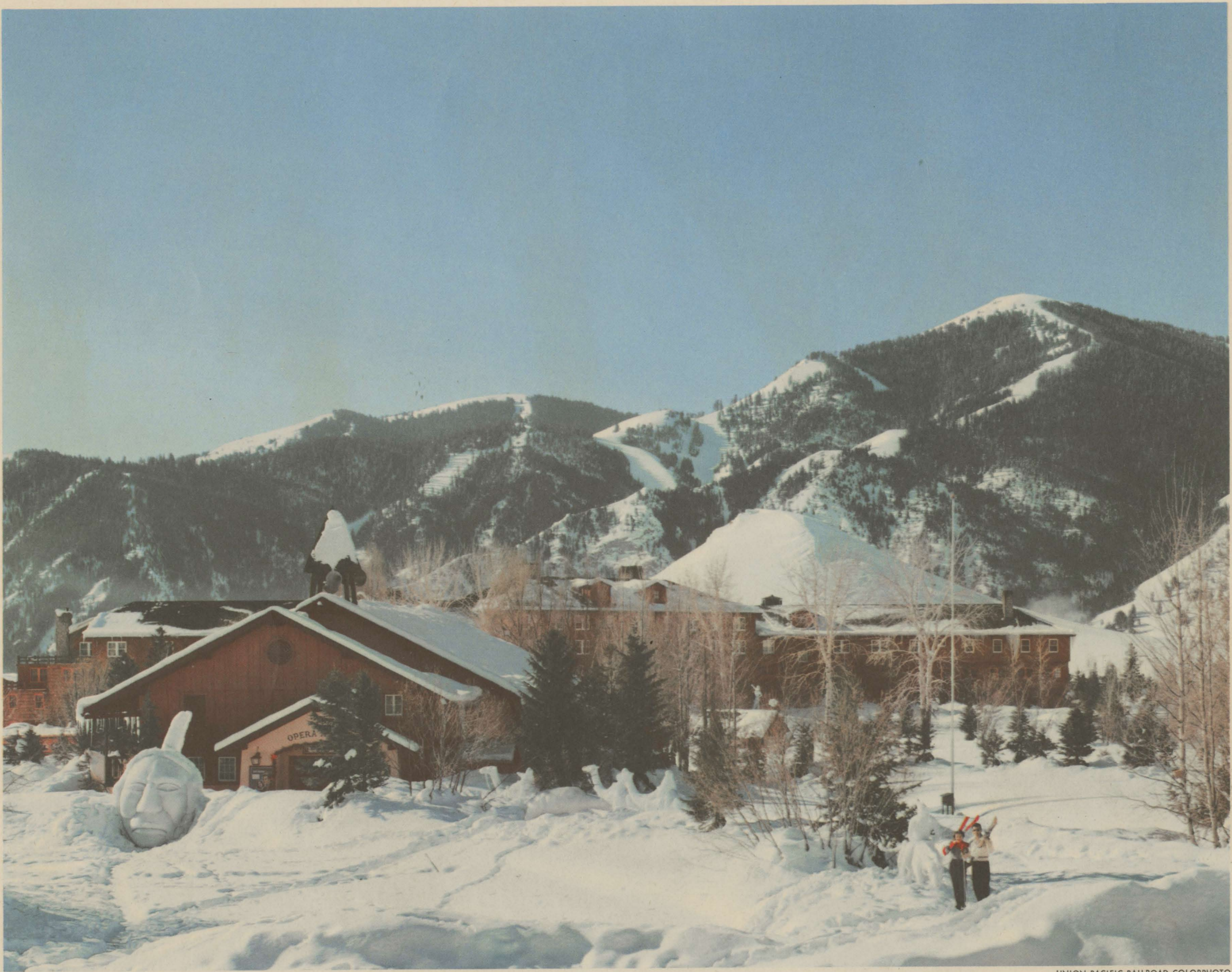
UNION PACIFIC RAILROAD COLORPHOTO