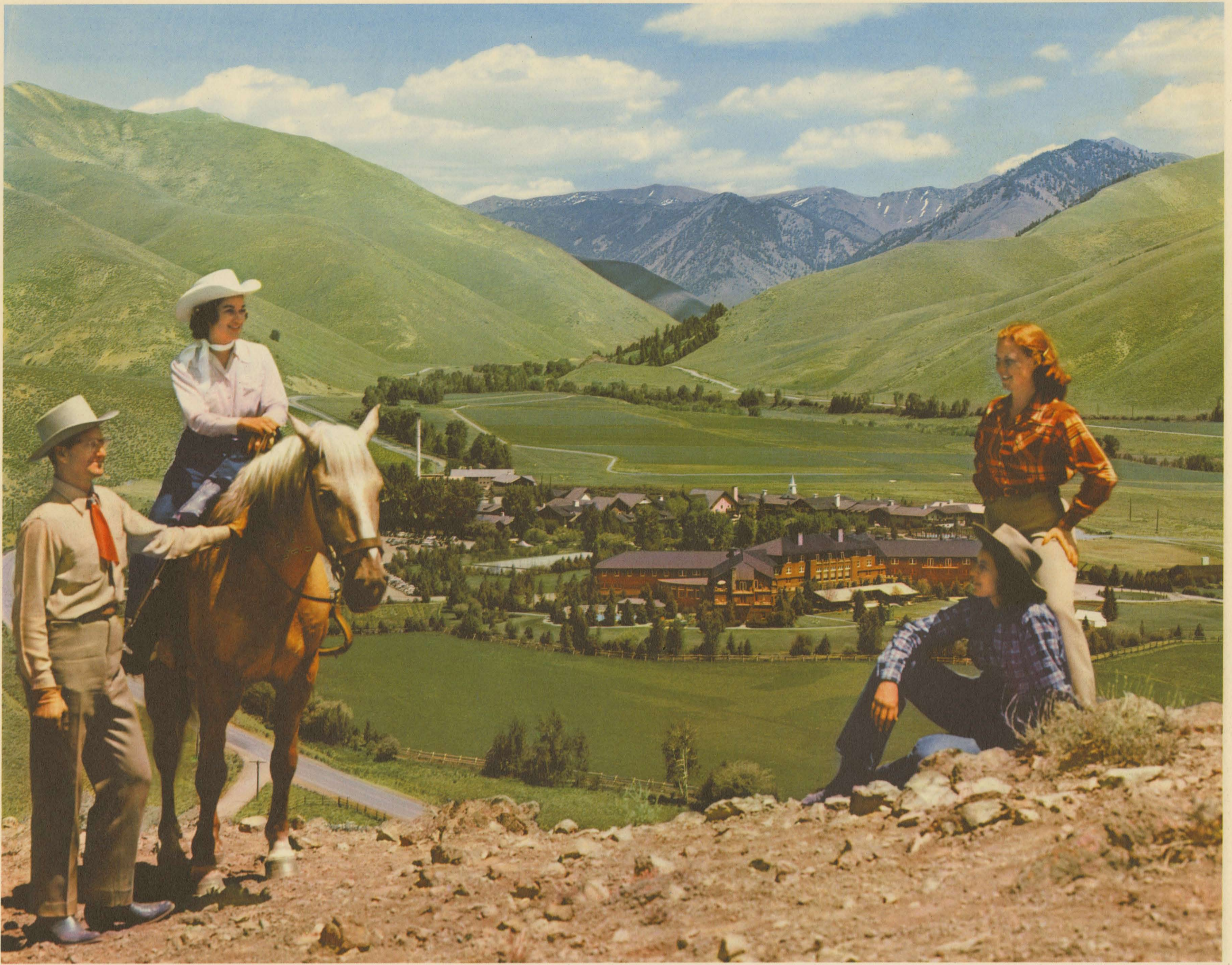
SUMMER GUESTS AT SUN VALLEY, IDAHO ENJOY ALL FORMS OF OUTDOOR RECREATION