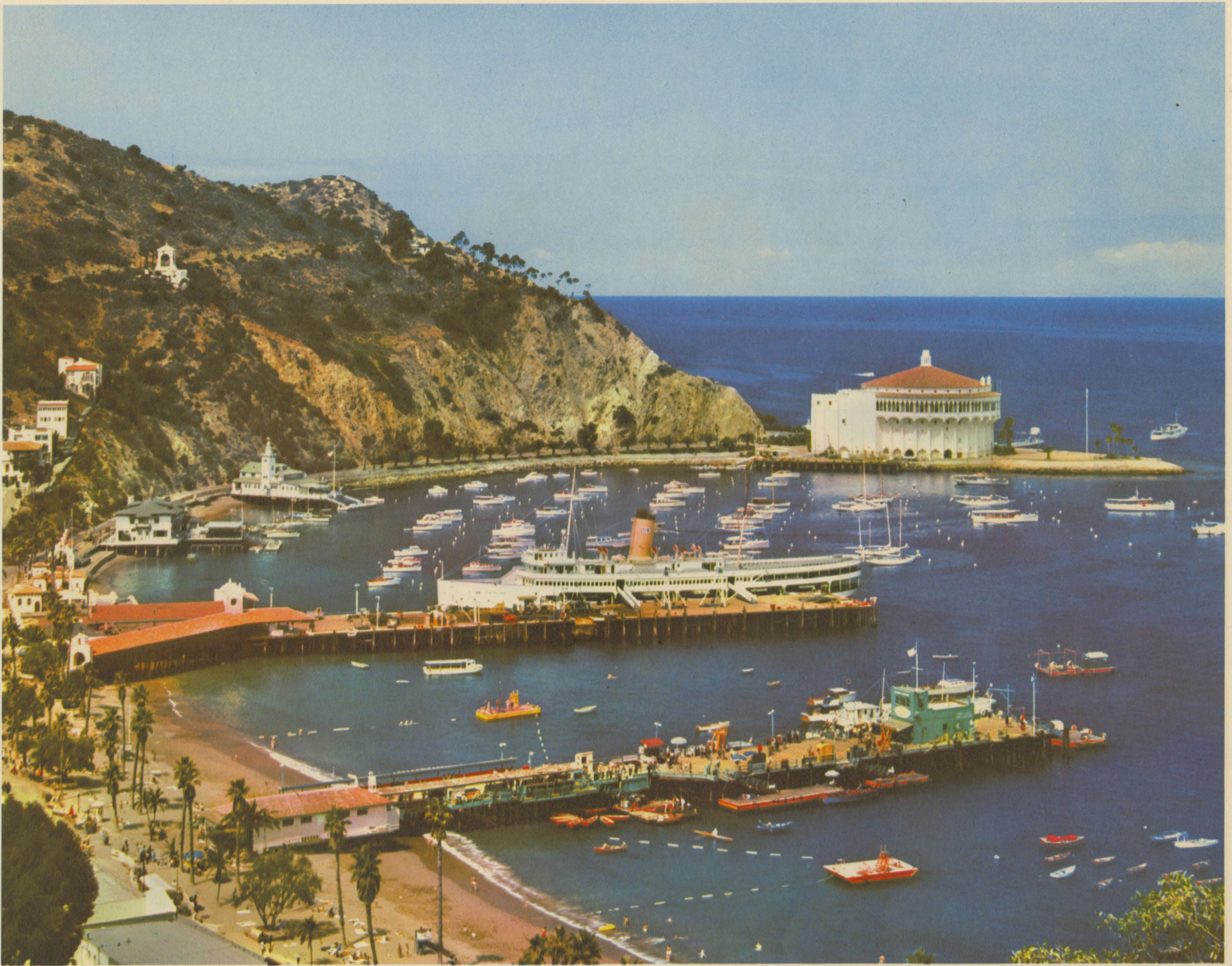
UNION PACIFIC RAILROAD COLORPHOTO