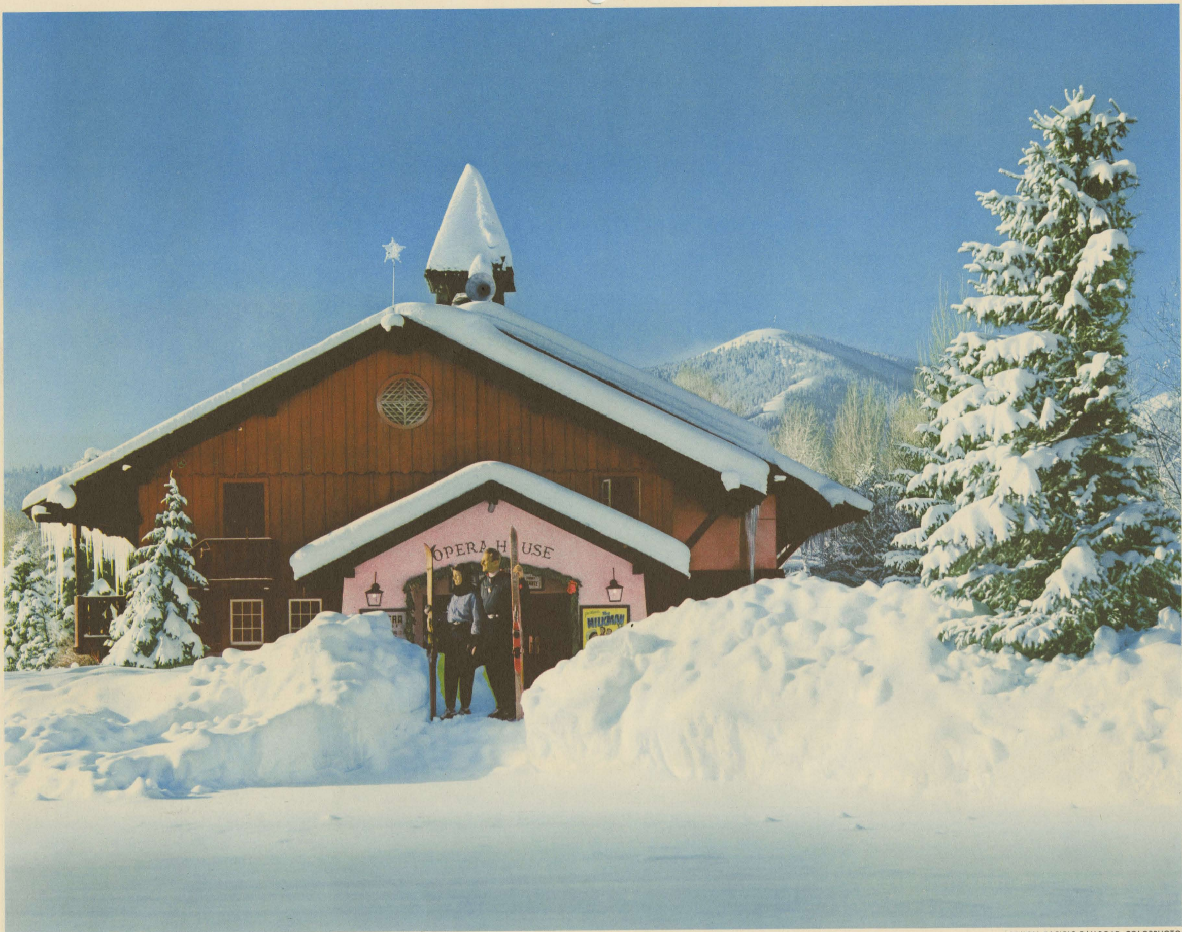
UNION PACIFIC RAILROAD COLORPHOTO