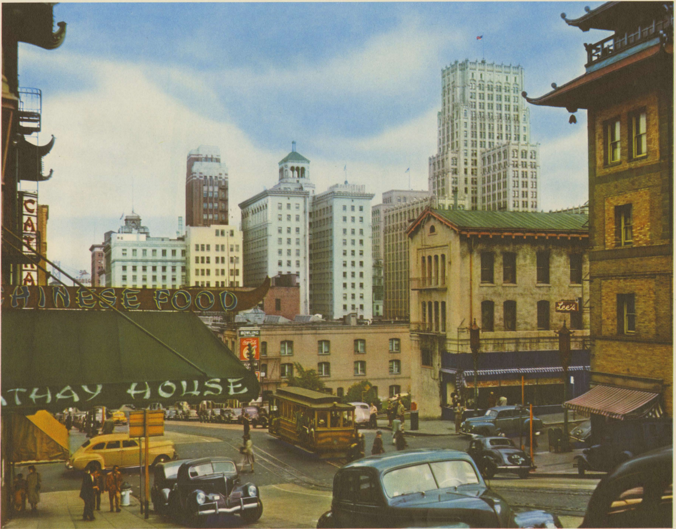
CHARMING CHINATOWN, WHERE EAST MEETS WEST, IN COSMOPOLITAN SAN FRANCISCO, CALIFORNIA