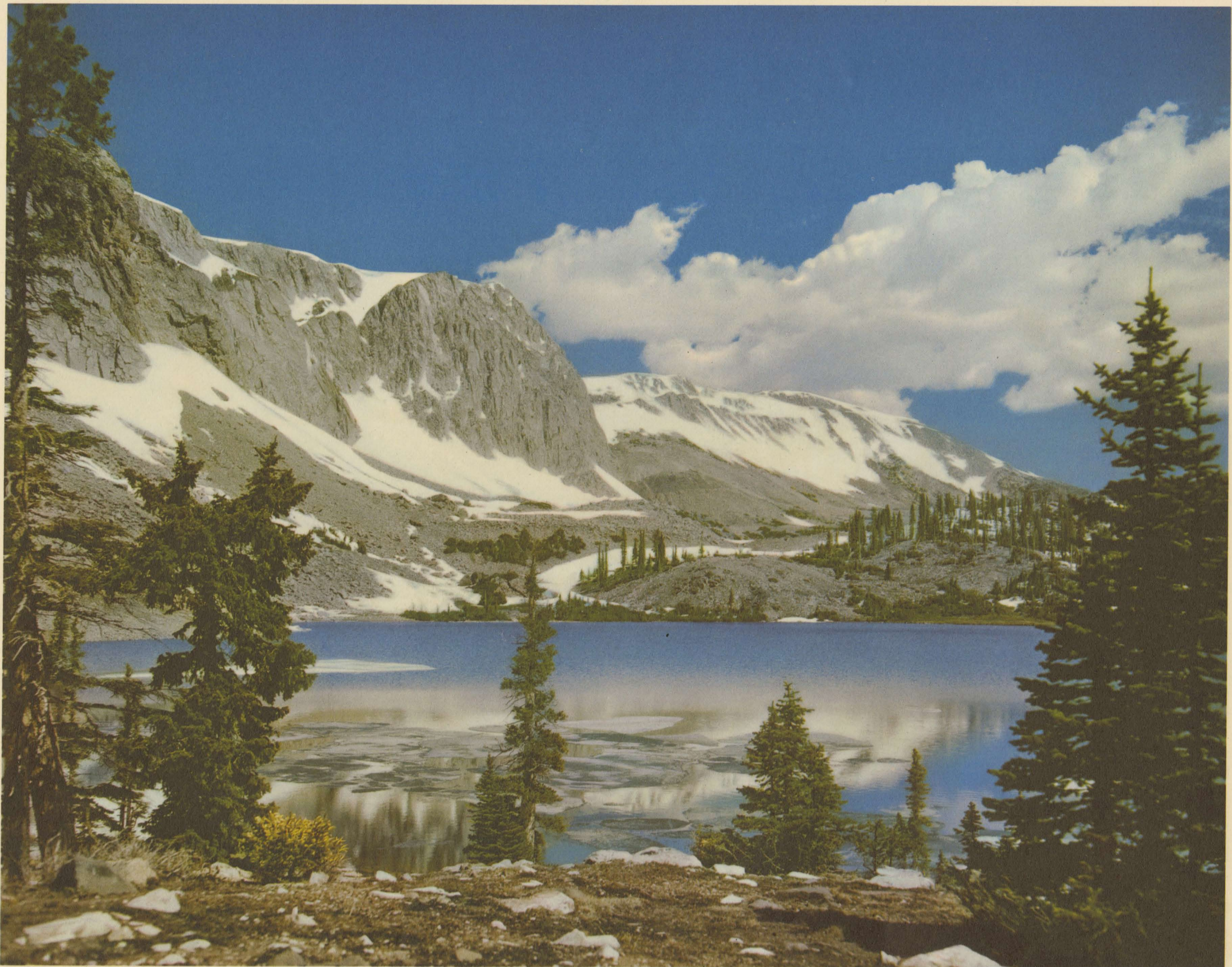
LOVELY LAKE MARIE IN THE SNOWY RANGE OF SOUTHERN WYOMING