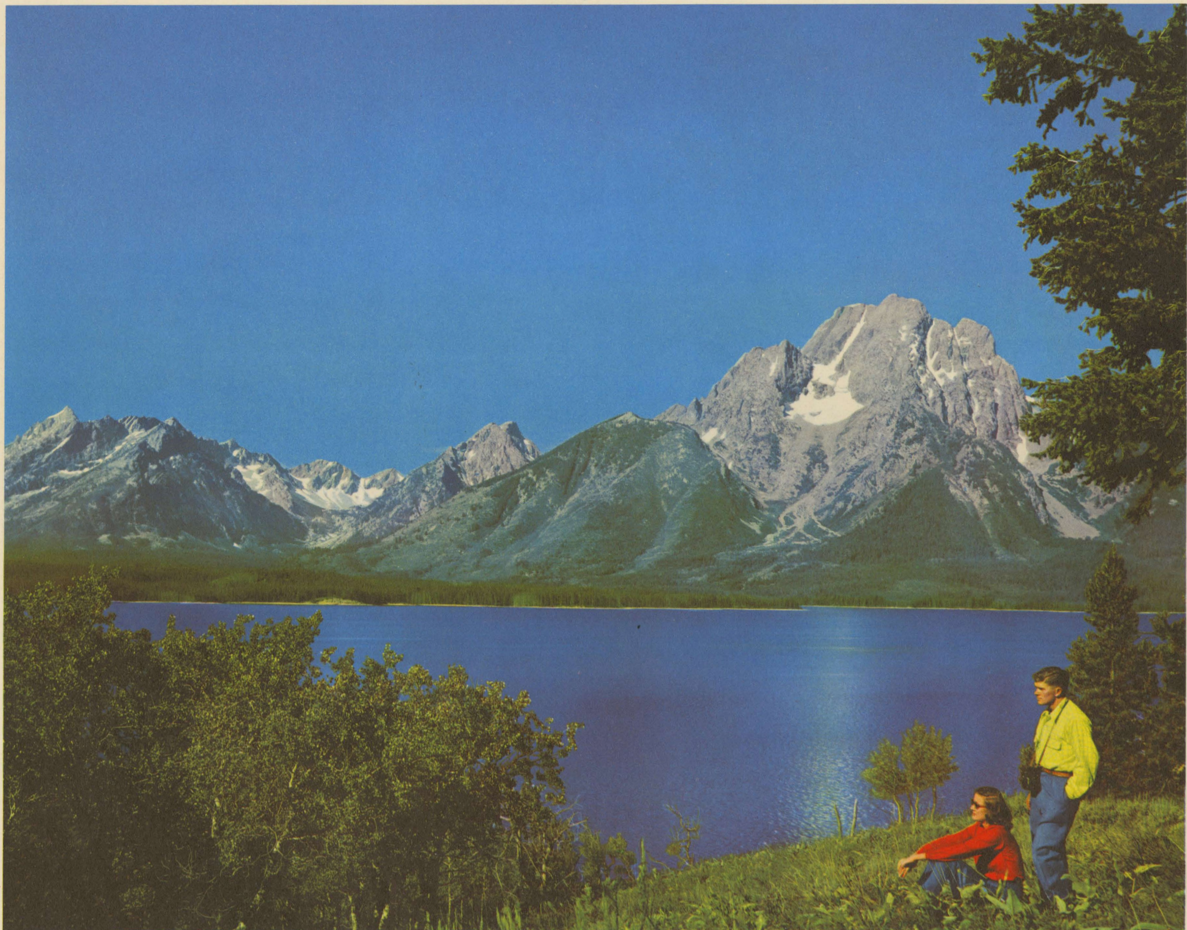
UNION PACIFIC RAILROAD COLORPHOTO