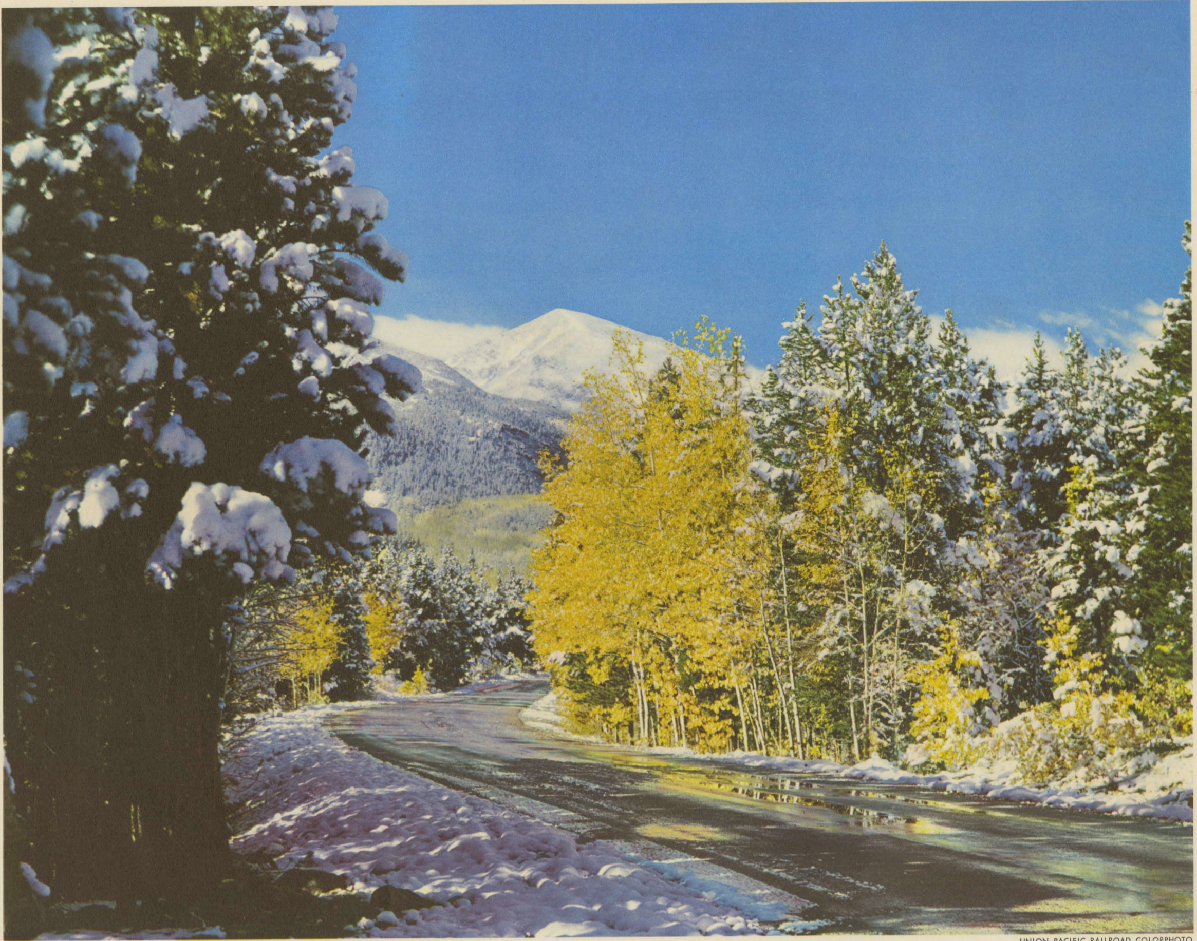
UNION PACIFIC RAILROAD COLORPHOTO