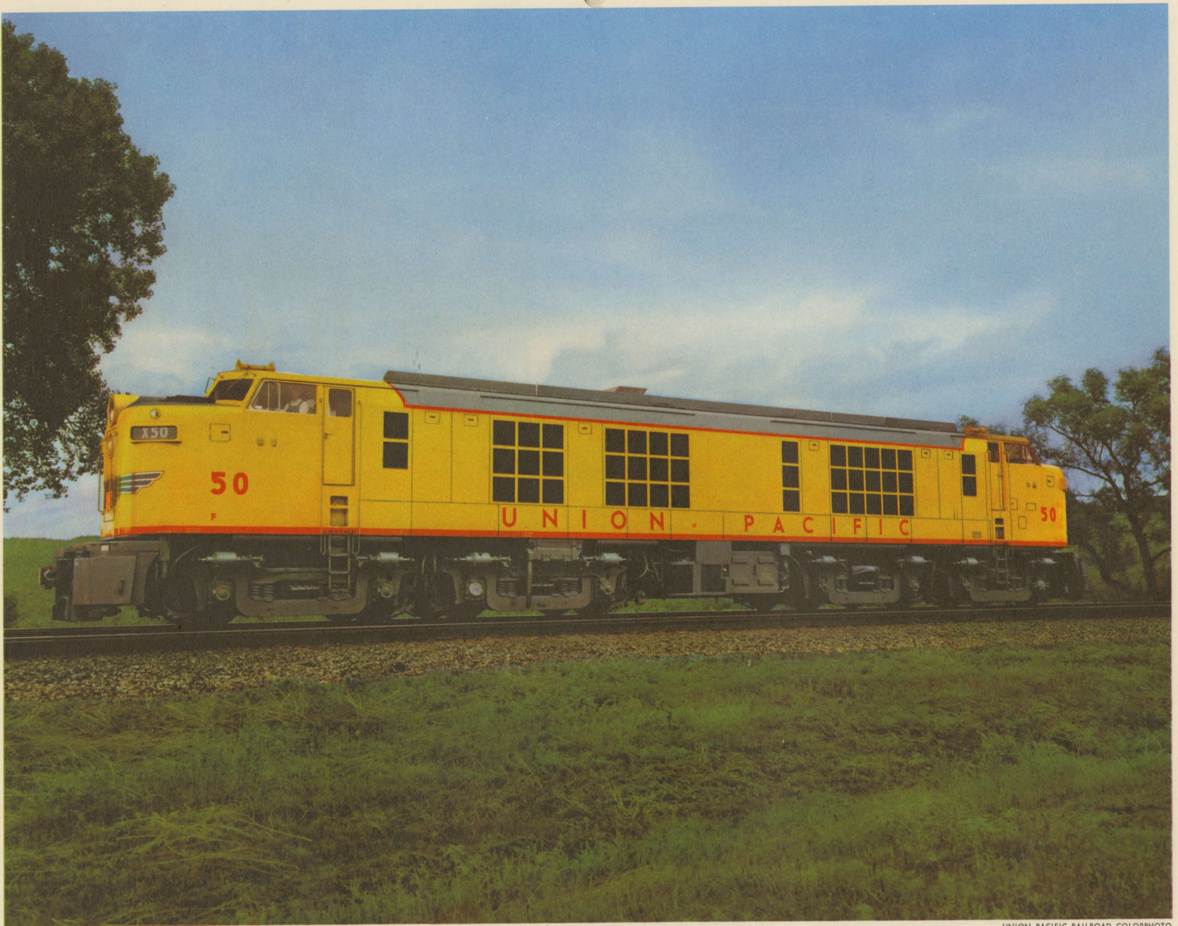
TYPE OF 4500 HP GAS TURBINE ELECTRIC LOCOMOTIVE IN UNION PACIFIC FREIGHT SERVICE