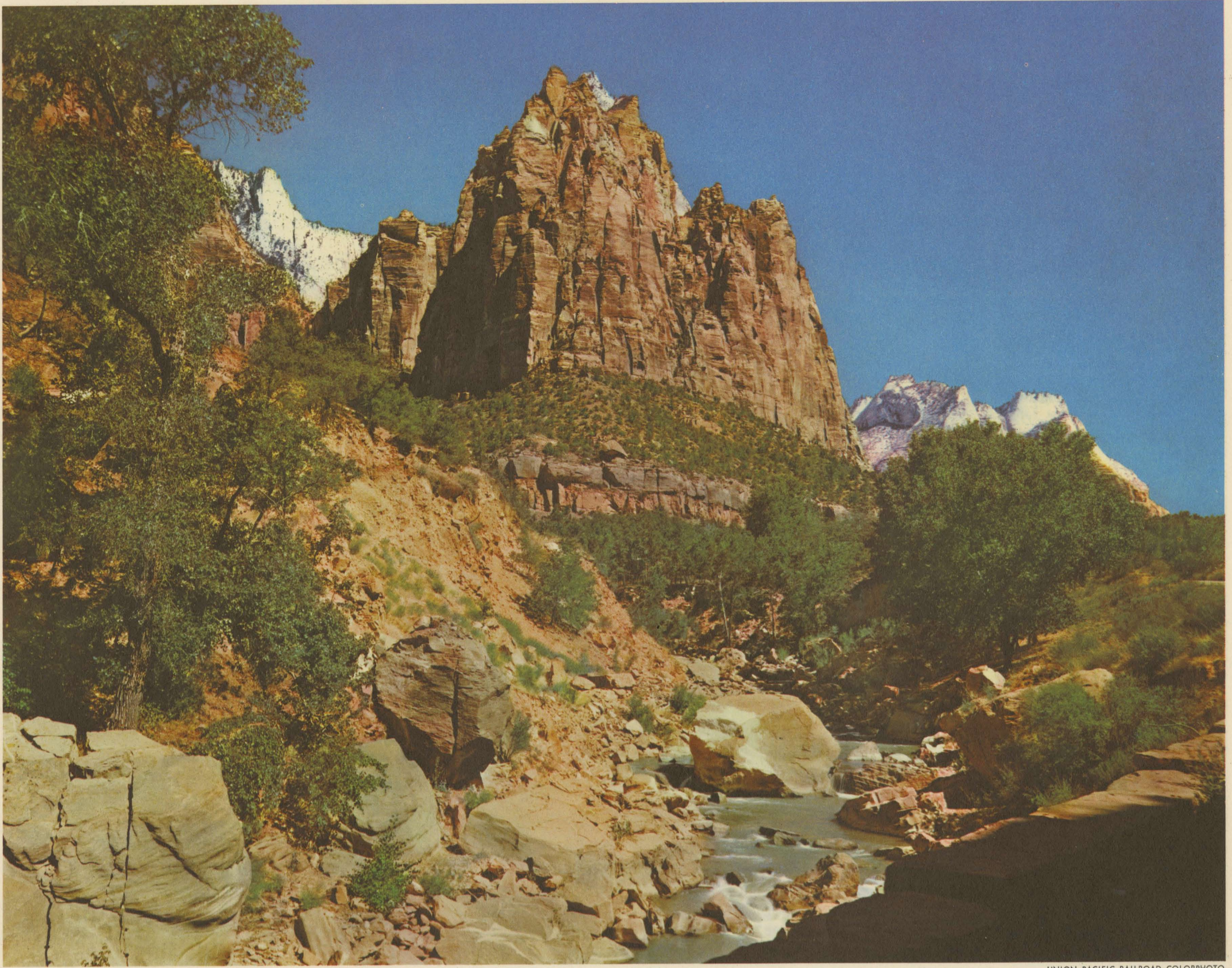
LOFTY SENTINEL PEAK IN WEST WALL OF ZION CANYON, ZION NATIONAL PARK, UTAH