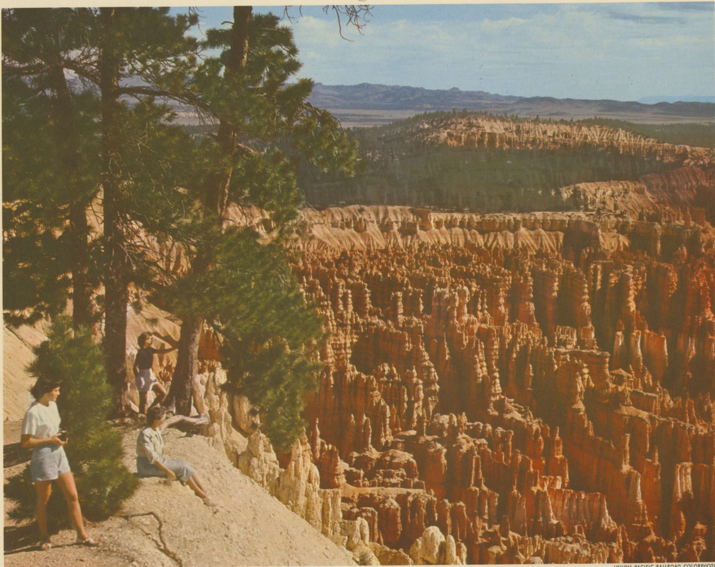
UNION PACIFIC RAILROAD COLORPHOTO