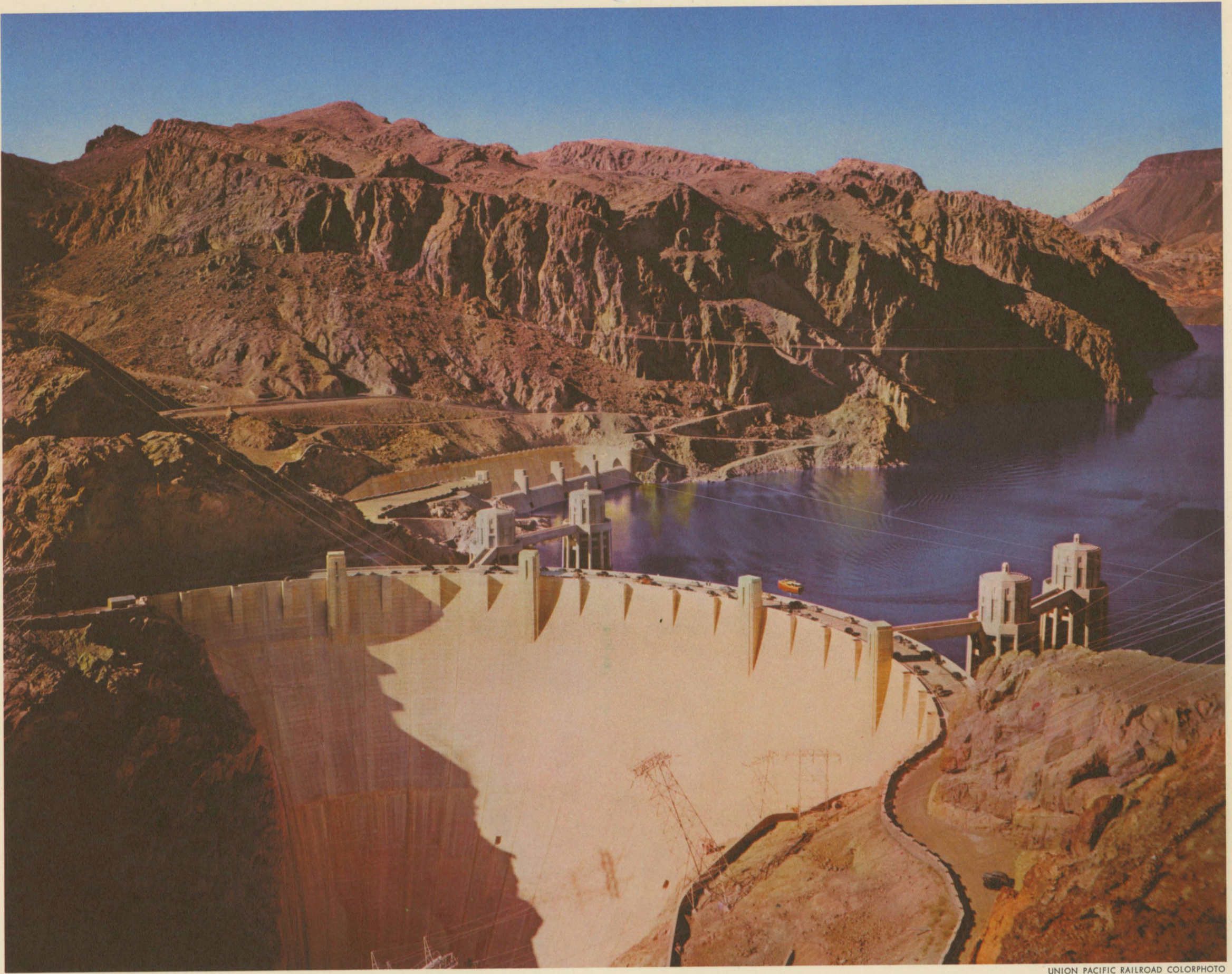
LOWER FACE AND CREST OF COLOSSAL HOOVER DAM, NEAR LAS VEGAS, NEVADA