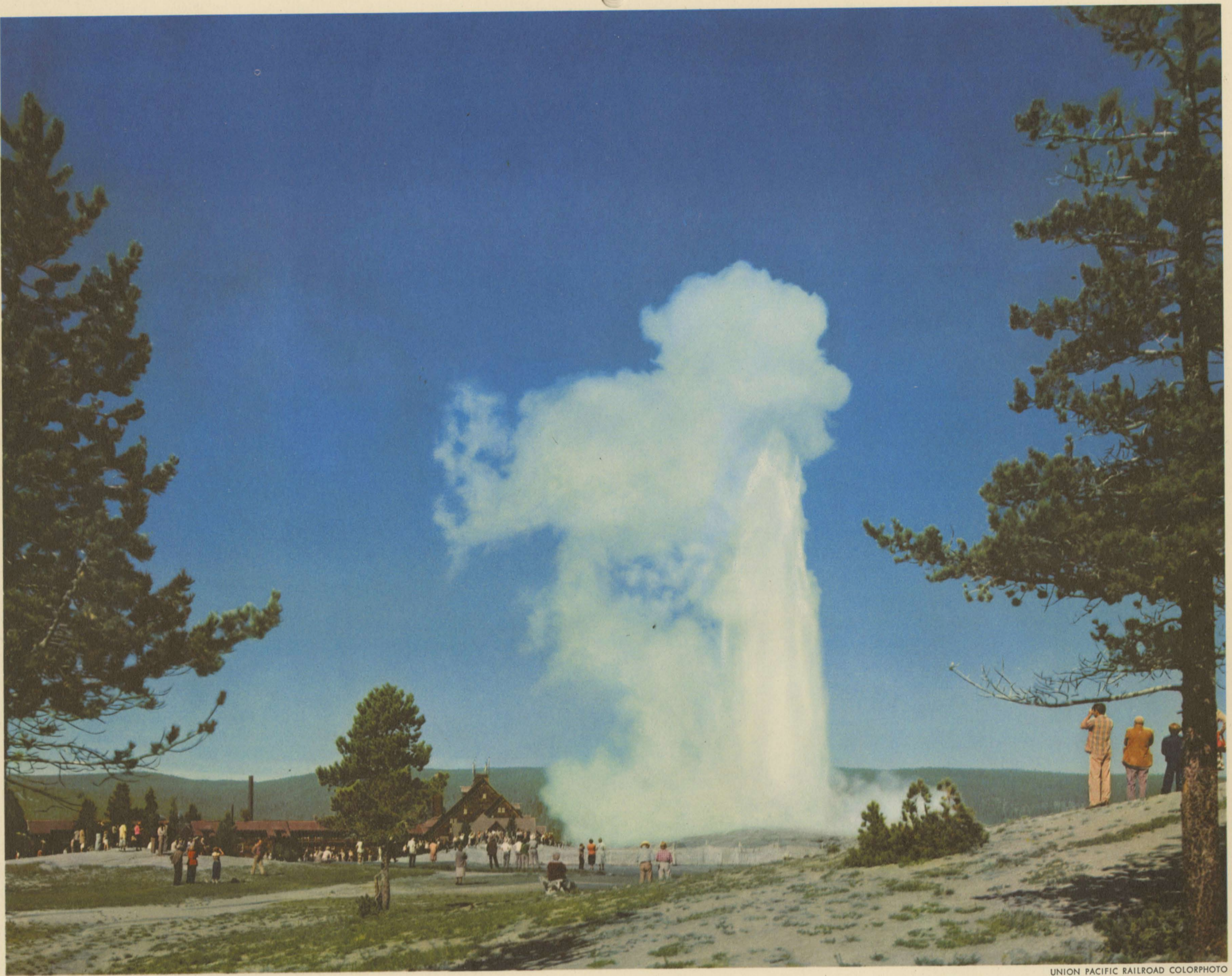
UNION PACIFIC RAILROAD COLORPHOTO