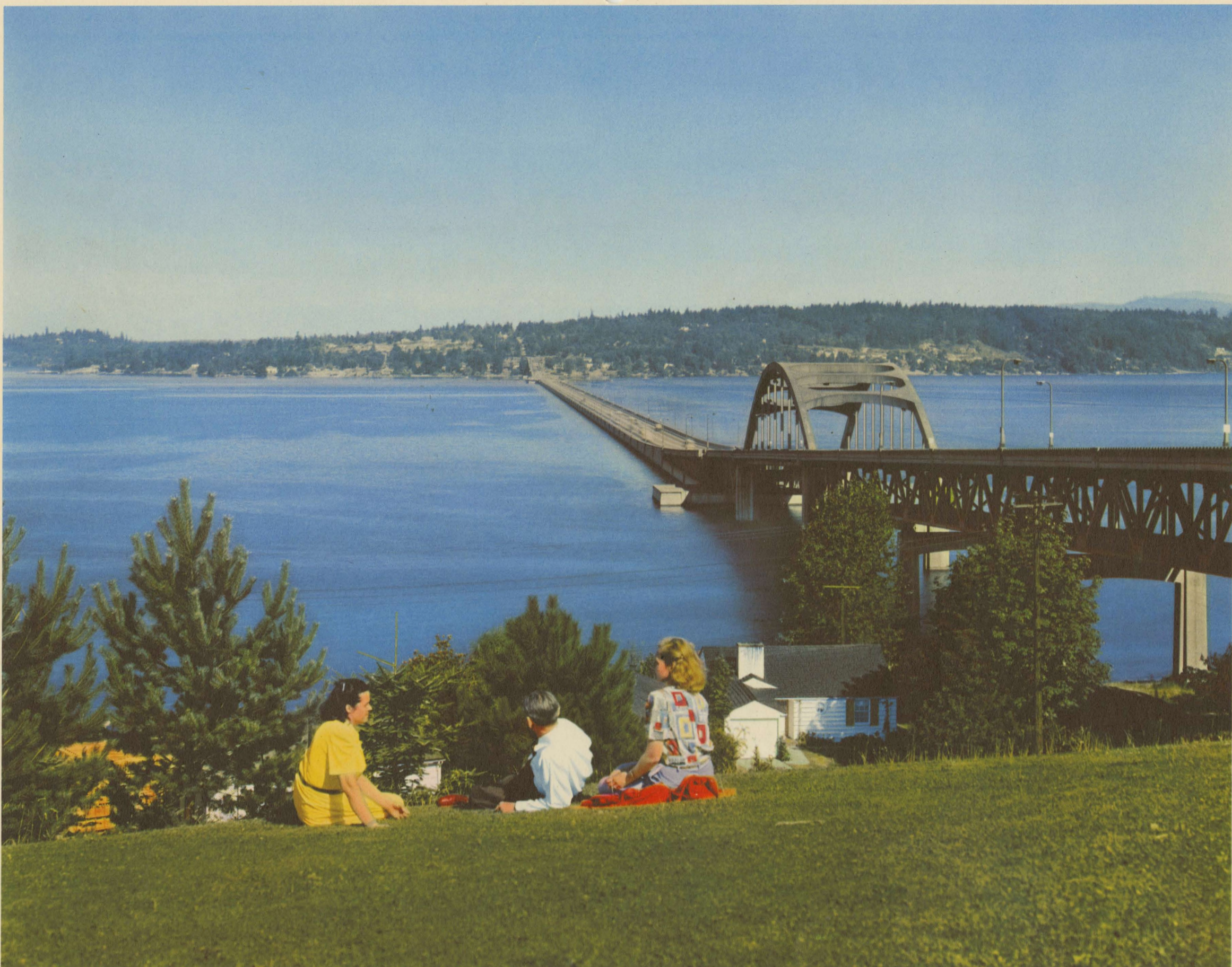
FLOATING BRIDGE ACROSS LAKE WASHINGTON, IN SEATTLE, WASHINGTON