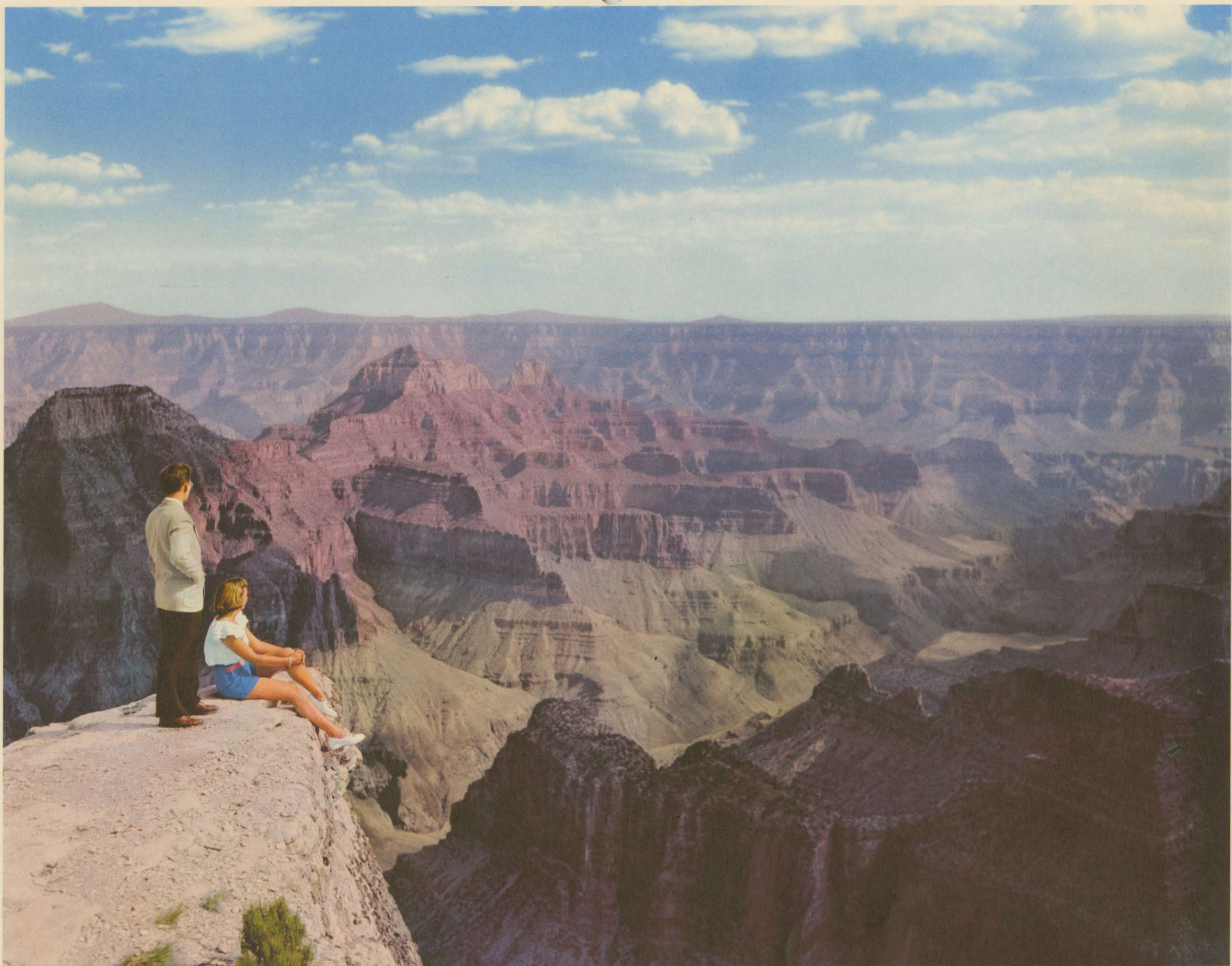
UNION PACIFIC RAILROAD COLORPHOTO