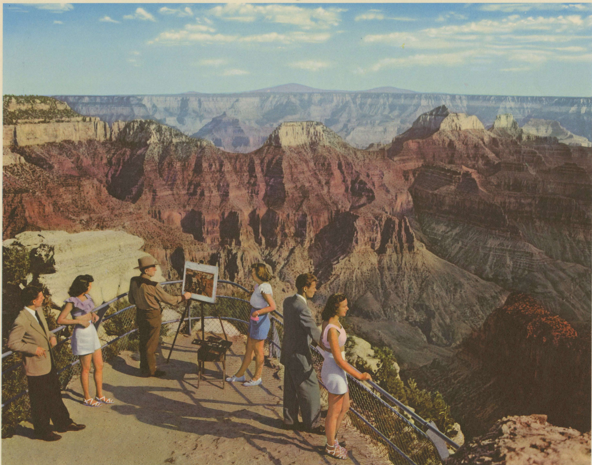
WORLD FAMOUS GRAND CANYON, FROM BRIGHT ANGEL POINT ON THE NORTH RIM