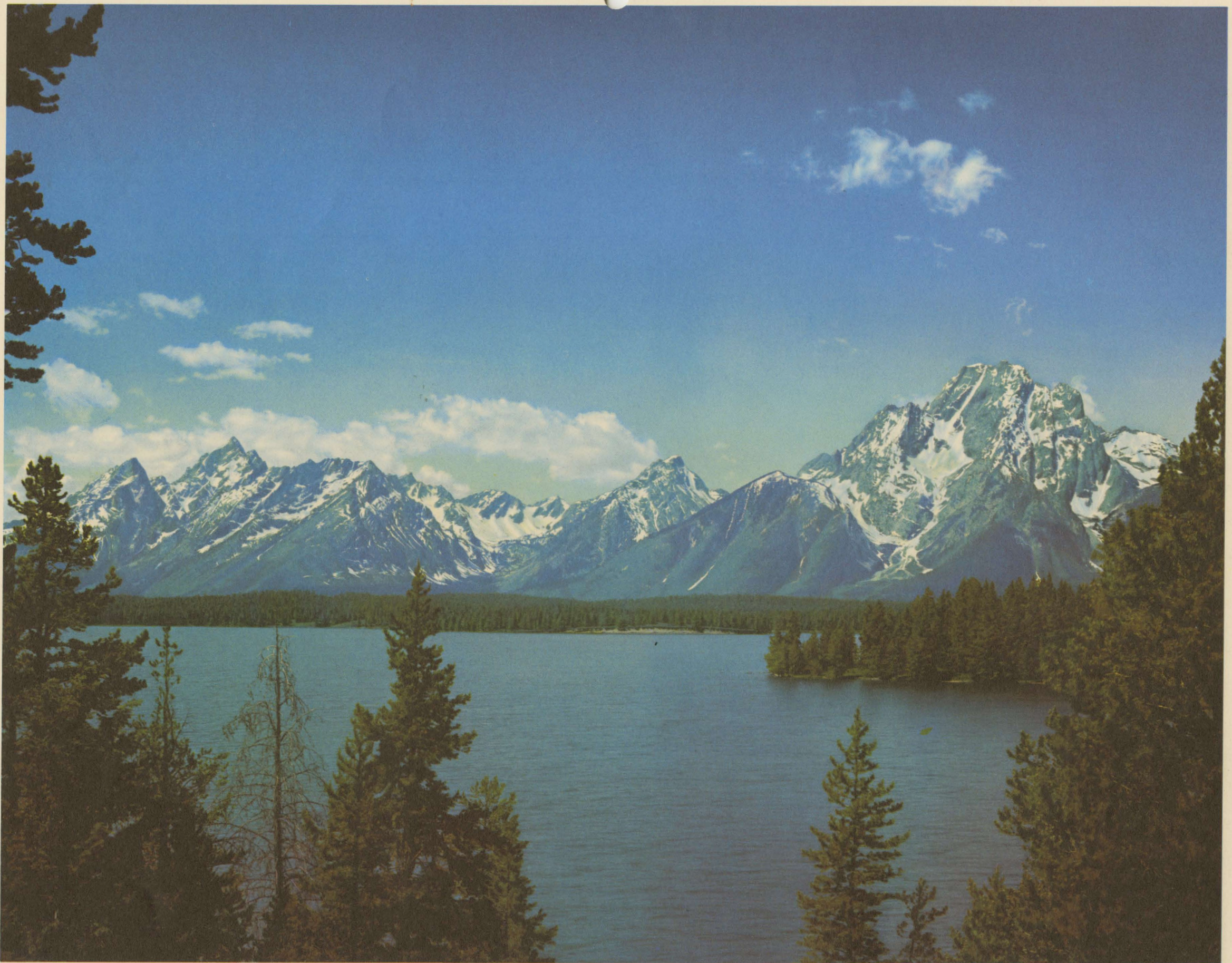
JACKSON LAKE AND THE TETON MOUNTAINS (MT. MORAN AT RIGHT) GRAND TETON NATIONAL PARK, WYOMING UNION PACIFIC RAILROAD COLORPHOTO