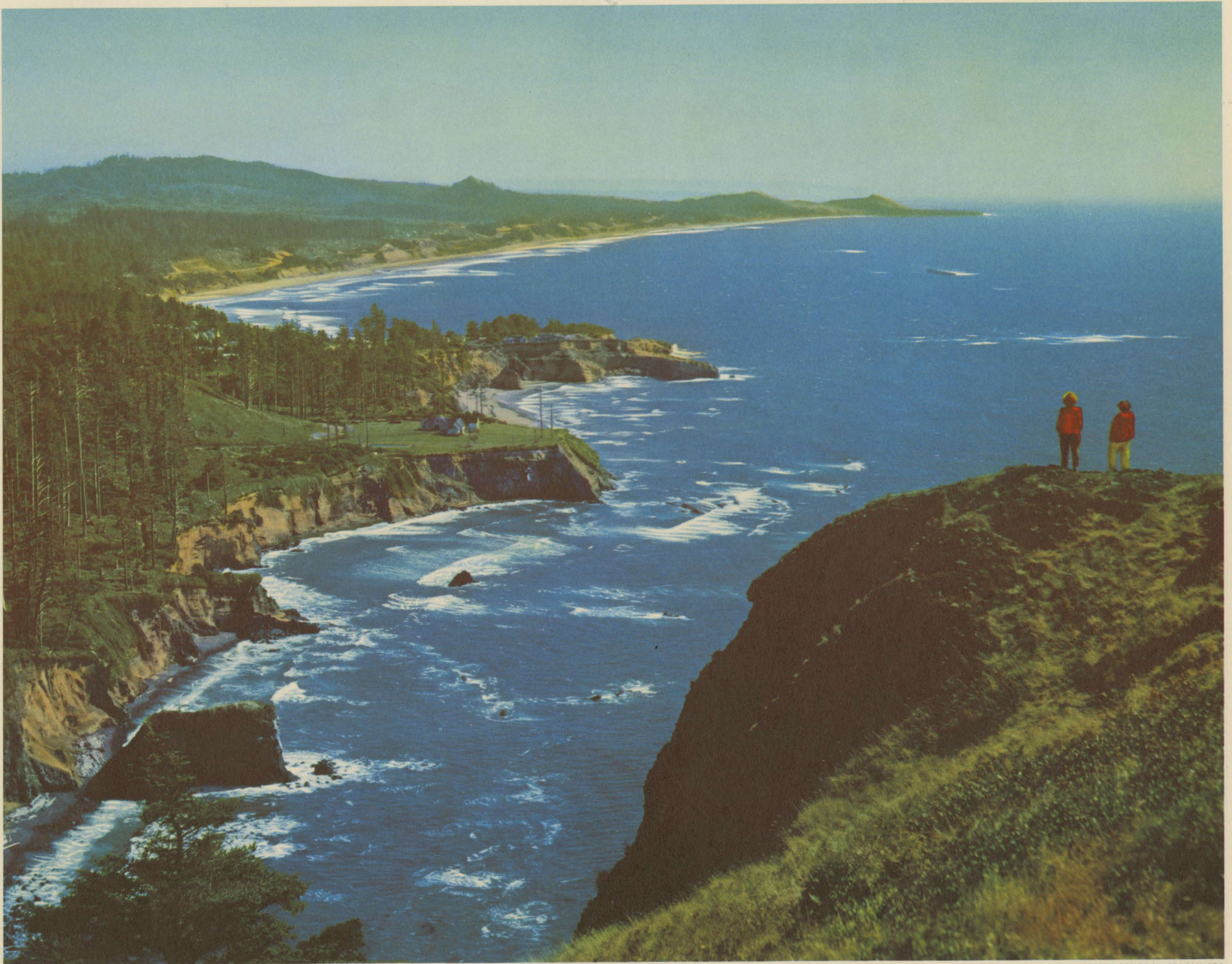
OTTER CREST STATE PARK, NEAR OTTER ROCK ON THE RUGGED OREGON COAST