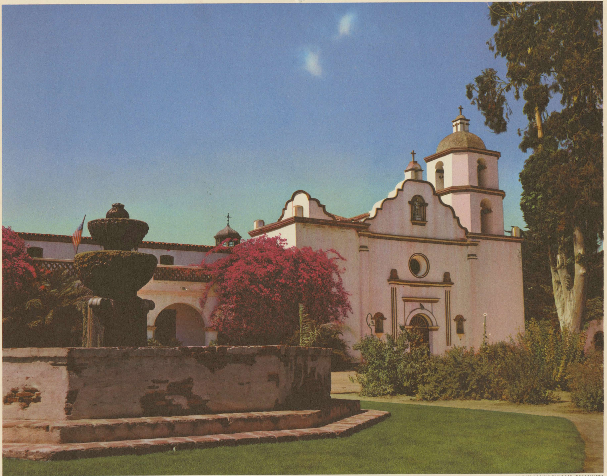
HISTORIC MISSION SAN LUIS REY, FOUR MILES NORTHEAST OF OCEANSIDE, CALIFORNIA