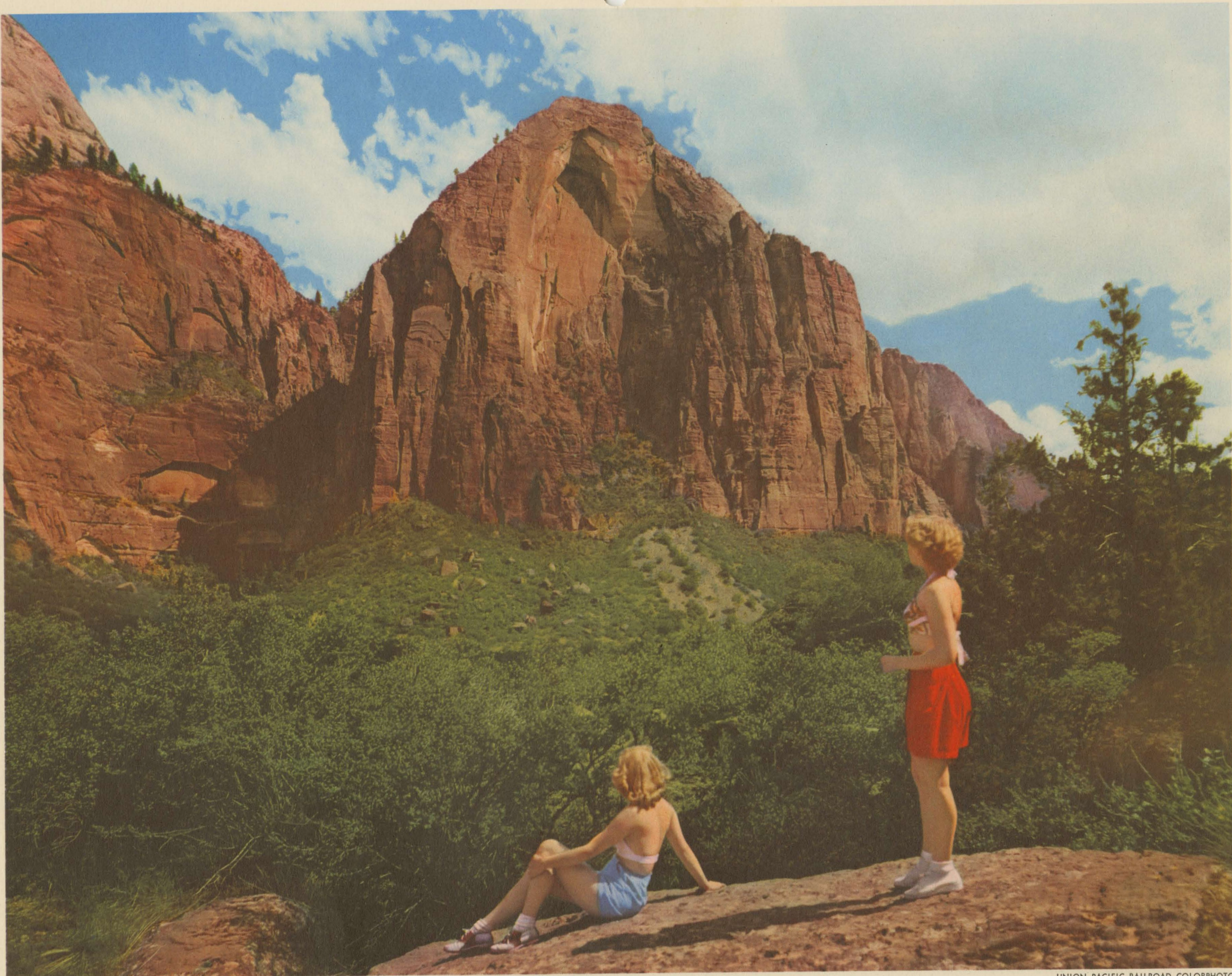
RED ARCH MOUNTAIN, NEAR ZION LODGE IN ZION NATIONAL PARK, UTAH