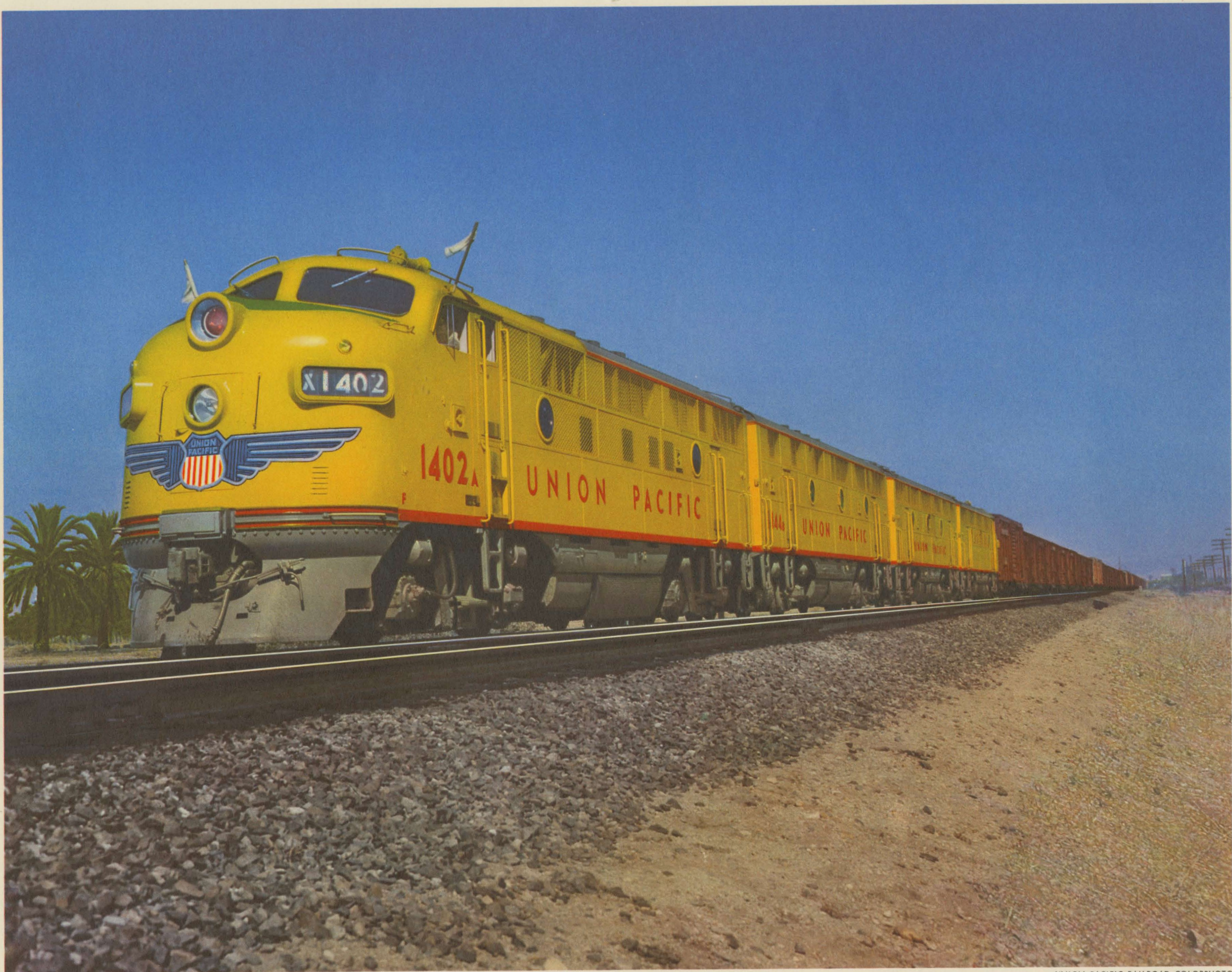
UNION PACIFIC FREIGHT TRAIN WITH MODERN DIESEL POWER