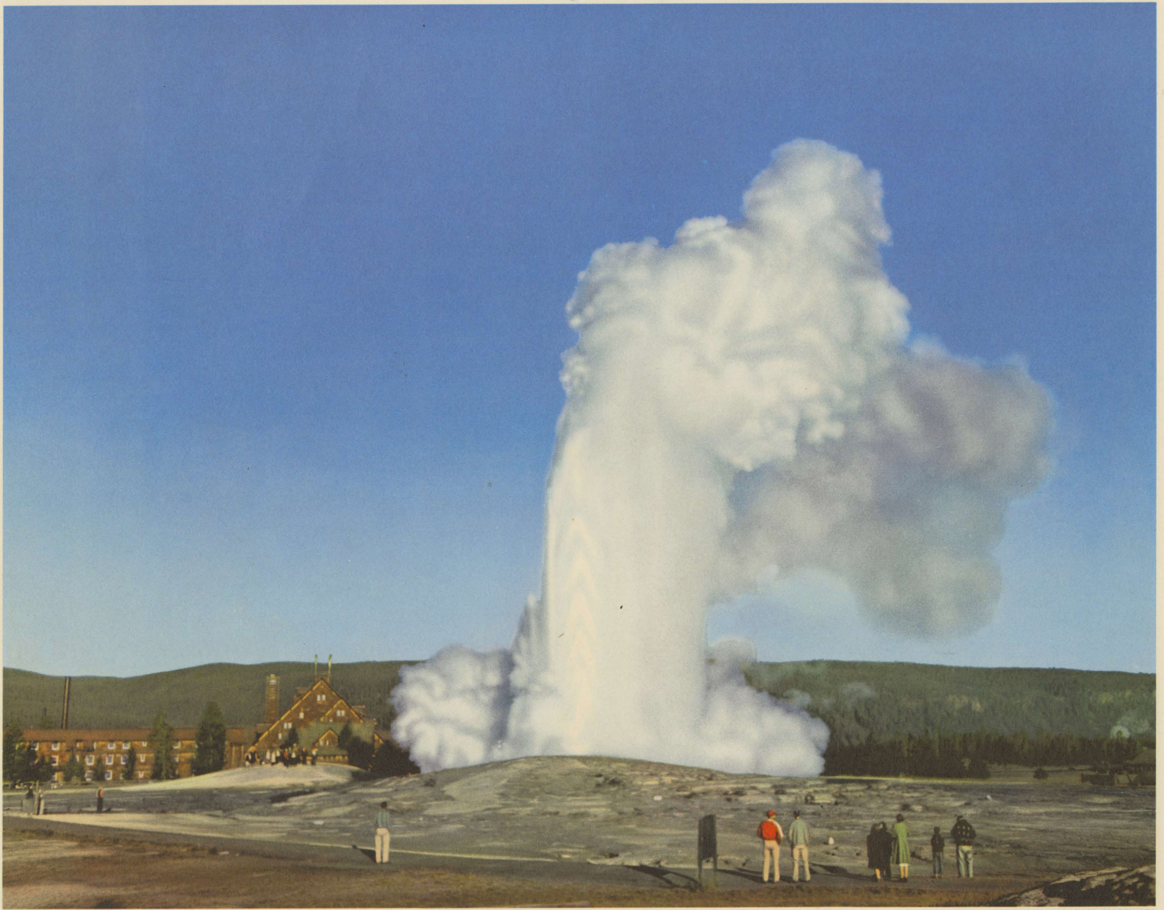
OLD FAITHFUL INN AND GEYSER OF WORLD RENOWN, YELLOWSTONE NATIONAL PARK, WYOMING