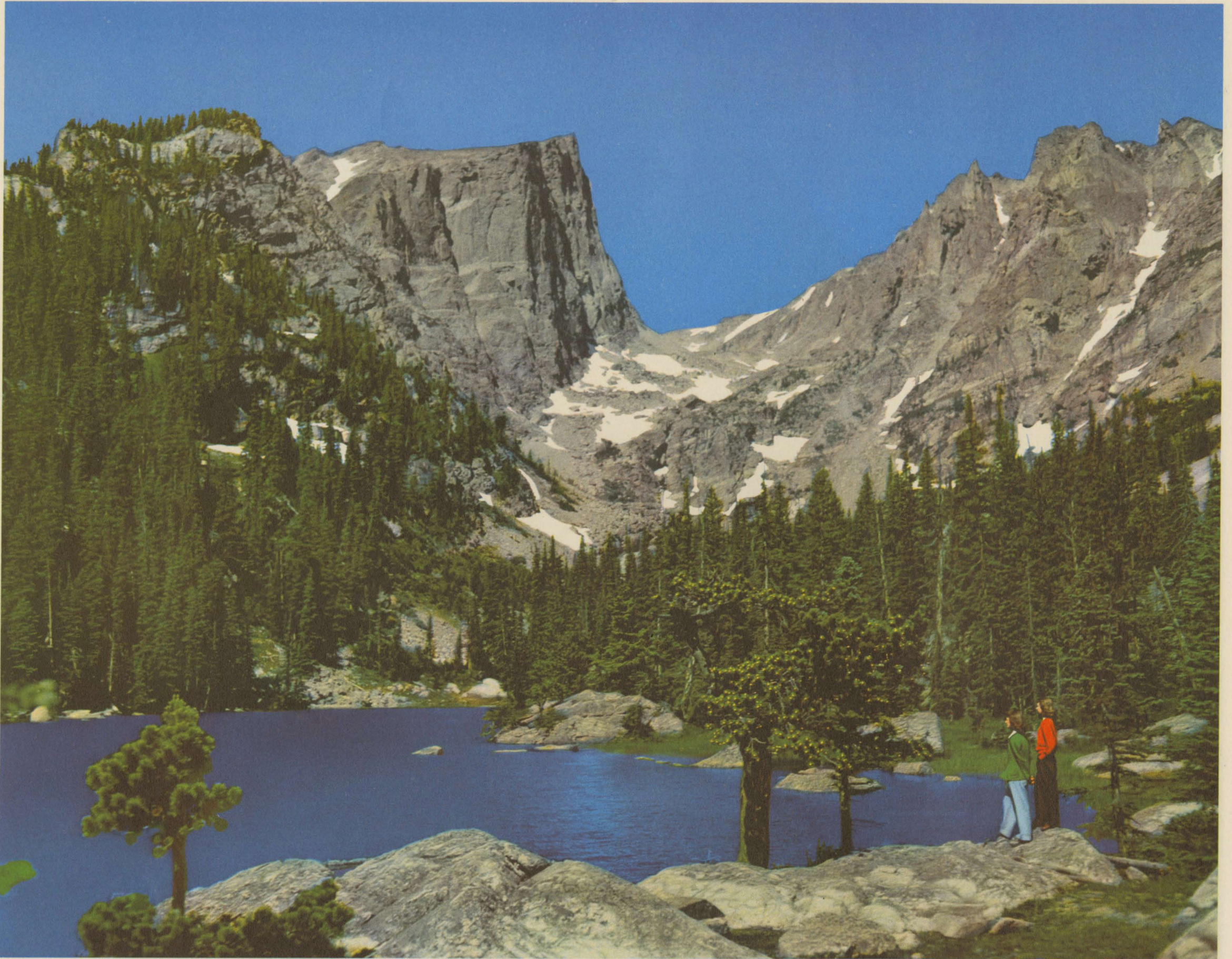
DREAM LAKE AND HALLETT PEAK, ROCKY MOUNTAIN NATIONAL PARK, COLORADO