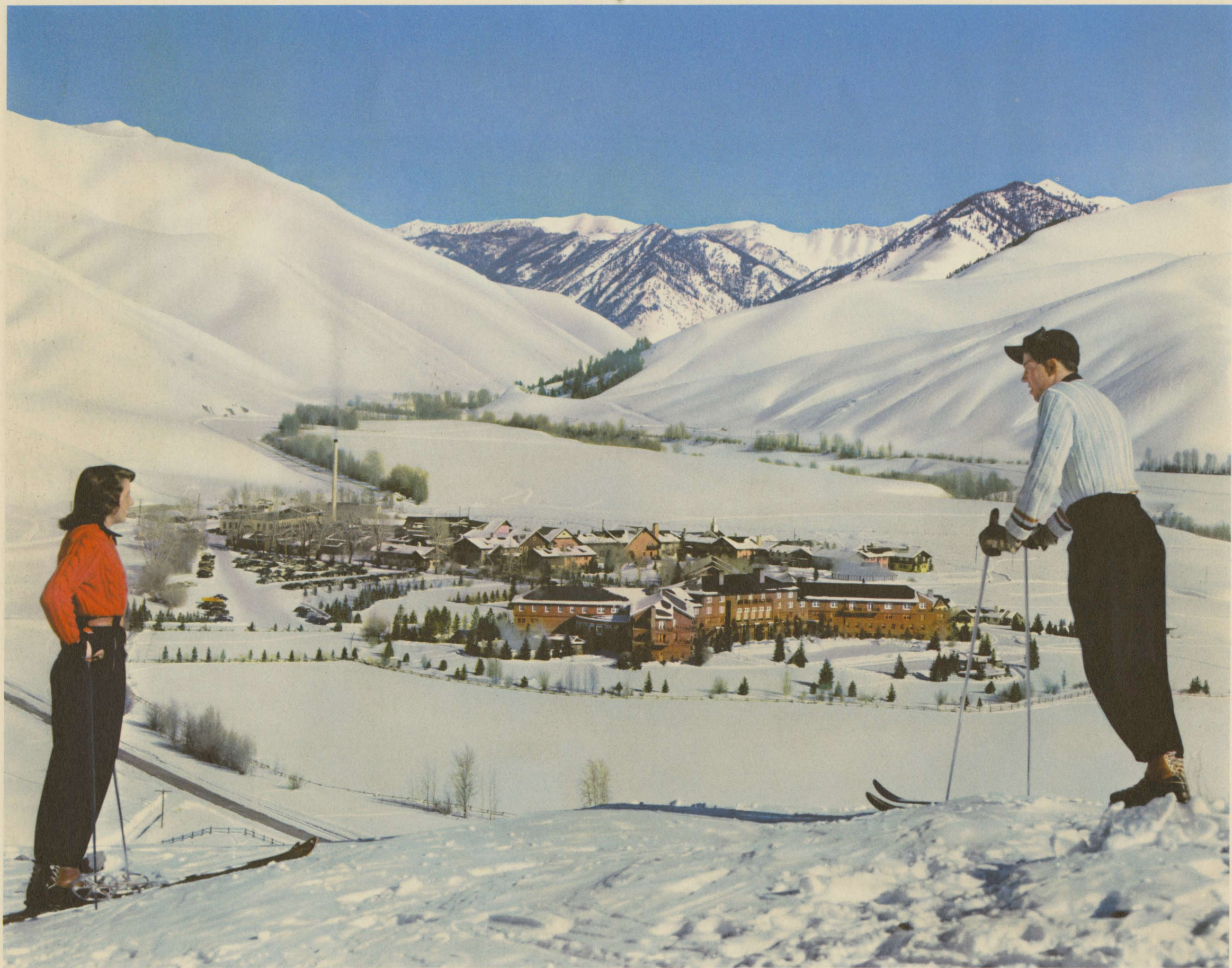
WINTER AT SUN VALLEY, IDAHO, AMERICA'S POPULAR SPORTS AND VACATION CENTER