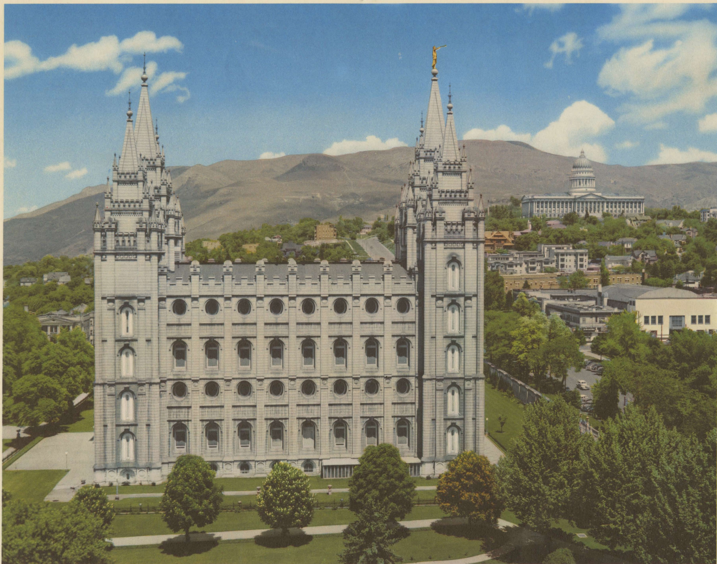
THE MORMON TEMPLE AND STATE CAPITOL, SALT LAKE CITY, UTAH