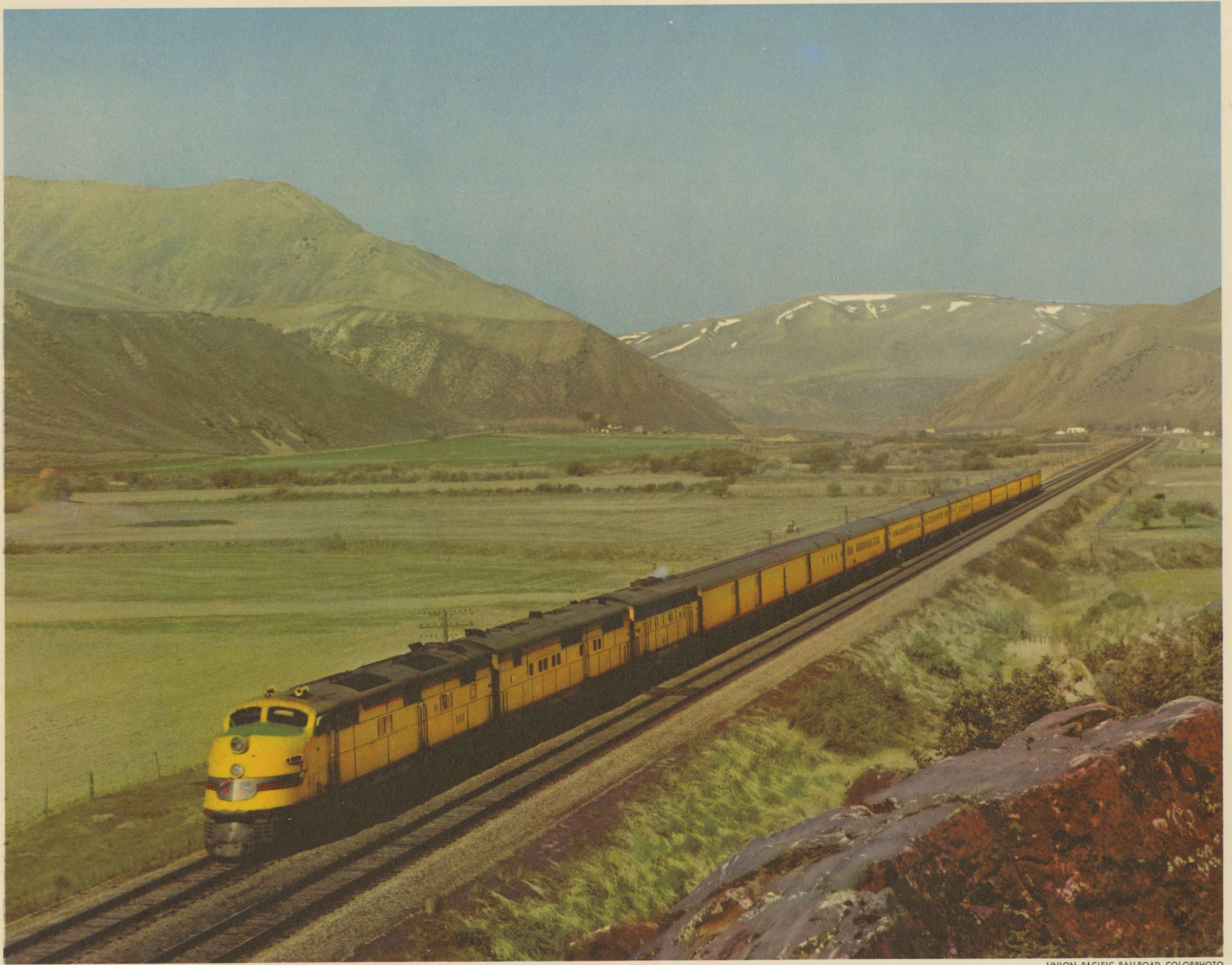
UNION PACIFIC STREAMLINER, CITY OF PORTLAND, NEAR POCA TELLO, IDAHO