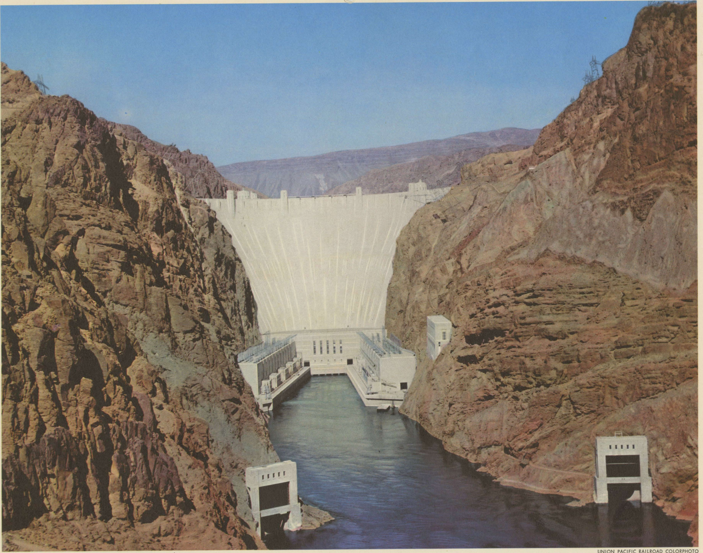
LOWER FACE OF COLOSSAL HOOVER DAM, NEAR LAS VEGAS, NEVADA