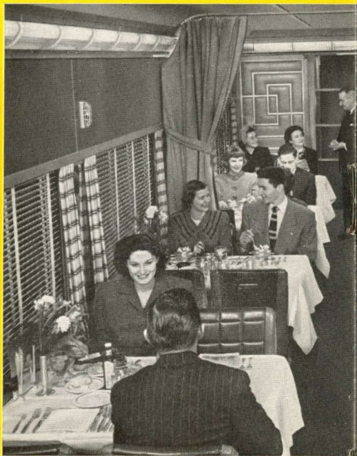
The main Dining Car is decorated in the modern mode

● ONE of the highlights of a trip on the "CITY OF PORTLAND" is dining in the charming atmosphere of the Streamliner Dining Car. Beautiful linens, and sparkling silver, fresh foods skill-