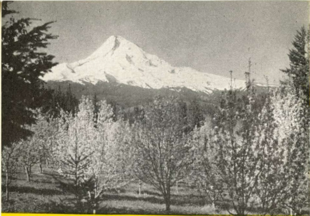
Magnificent Mt. Hood near Portland