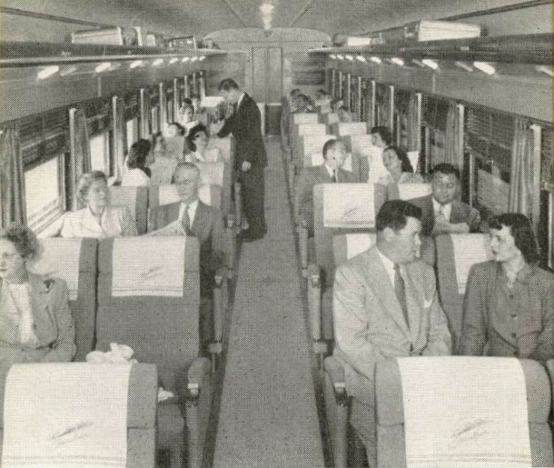
Coaches are of latest design

C OACH PASSENGERS on the Streamliner , "CITY OF PORTLAND" enjoy real travel luxury at low cost. For increased comfort the deep-cushioned individual seats are easily adjusted to a restful, reclining position. The seats in all regularly assigned coaches are equipped with padded leg-rests so you may stretch out full length and be completely comfortable night and day. Pillows may be obtained from the porter for a small charge, making