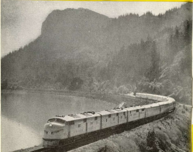
Streamliner "CITY OF PORTLAND" in the Columbia River Gorge