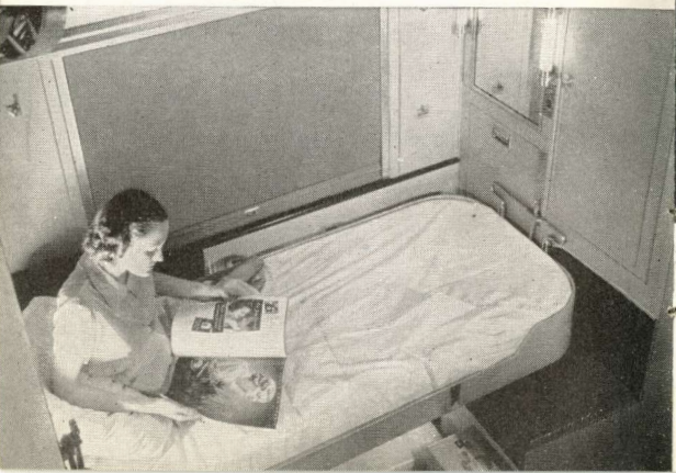
The popular Roomette

Drawing Room has a third bed which folds away into the wall when not in use. The comfortable lower makes up into a spacious sofa for daytime use. Some Bedrooms are separated by a folding partition which, when thrown open, permits the two rooms to be used en suite. The popular Roomette is a small private room designed for individual occupancy; the convenient folding bed is converted, when not in use, into a lounge seat.