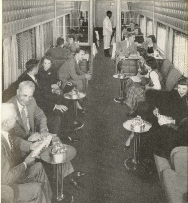
The lounge for Coach passengers

S EPARATED from the dining section by a decorative glass partition is the friendly lounge where time passes all too quickly in conversation with fellow passengers, reading current magazines, relaxing in comfort. There's a writing desk with distinctive Streamliner stationery, and a radio.