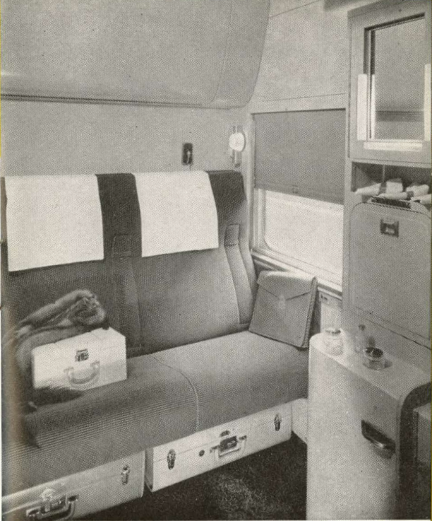
The Double Bedroom is spacious

body the most modern developments, created by top designers for the convenience and comfort of sleeping car passengers.