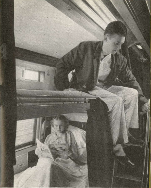
The open section Upper and Lower

All of the private rooms contain complete toilet facilities, electric outlets, mirrored cabinet for toilet articles, wardrobe, and ample luggage space. In the open section, sleeping car passengers may obtain comfortable upper or lower berths.