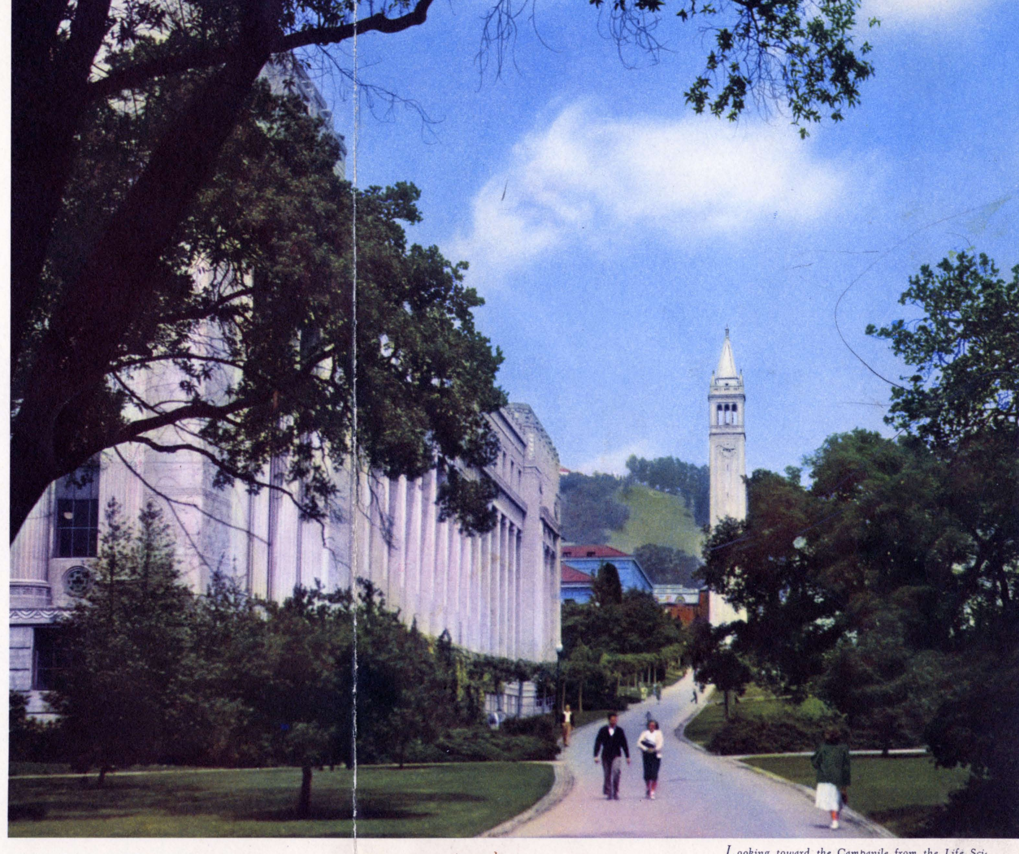
Looking toward the Campanile from the Life Sciences Building, University of California, Berkeley.

Other campuses which are integral parts of the University of California are the Medical Center, the California School of Fine Arts, and Hastings College of the Law, in San Francisco; the University of California at Los Angeles; the Scripps Institution of Oceanography at LaJolla; the Lick Observatory at Mount Hamilton; the Citrus Experiment Station at Riverside, and Santa Barbara College at Santa Barbara.