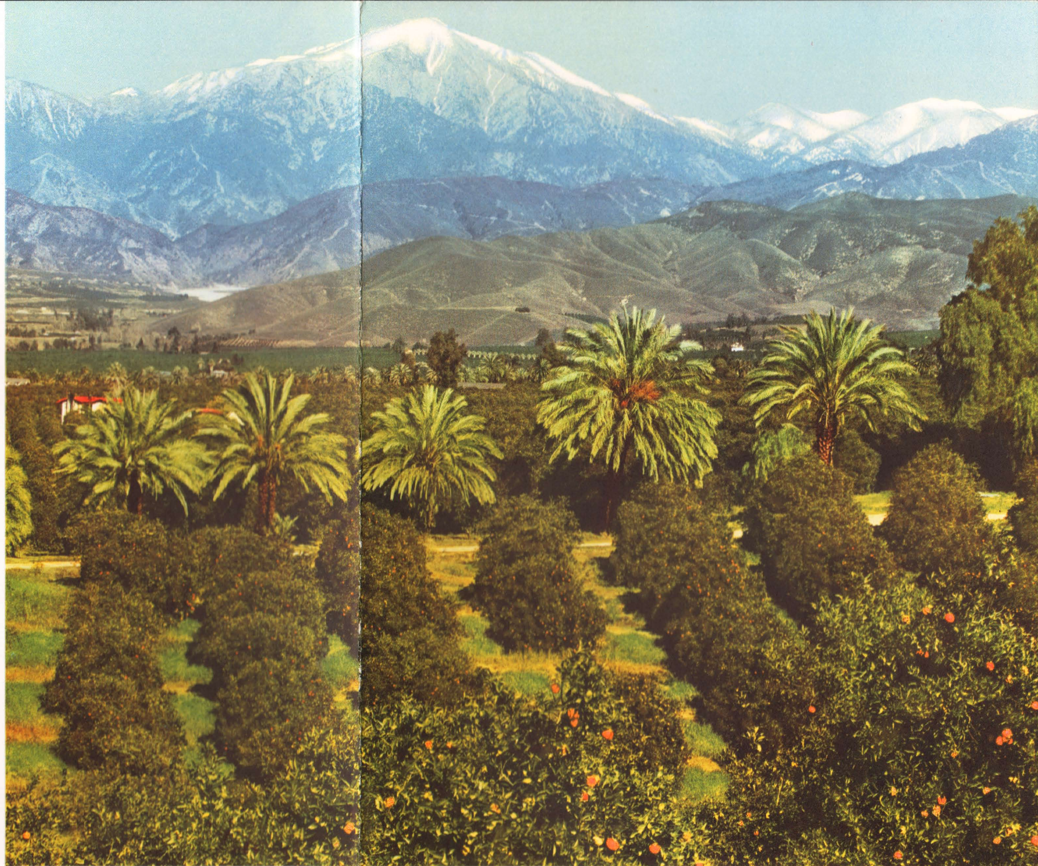
Orange Groves and Snowy Peaks—A delightful vista in Southern California's citrus fruit area.

The great cities of California are among the most interesting and romantic in the world, San Diego with its year around equable climate, Los Angeles with its nearby movie colonies, and San Francisco at the Golden Gate, redolent of pioneer and gold-rush days.