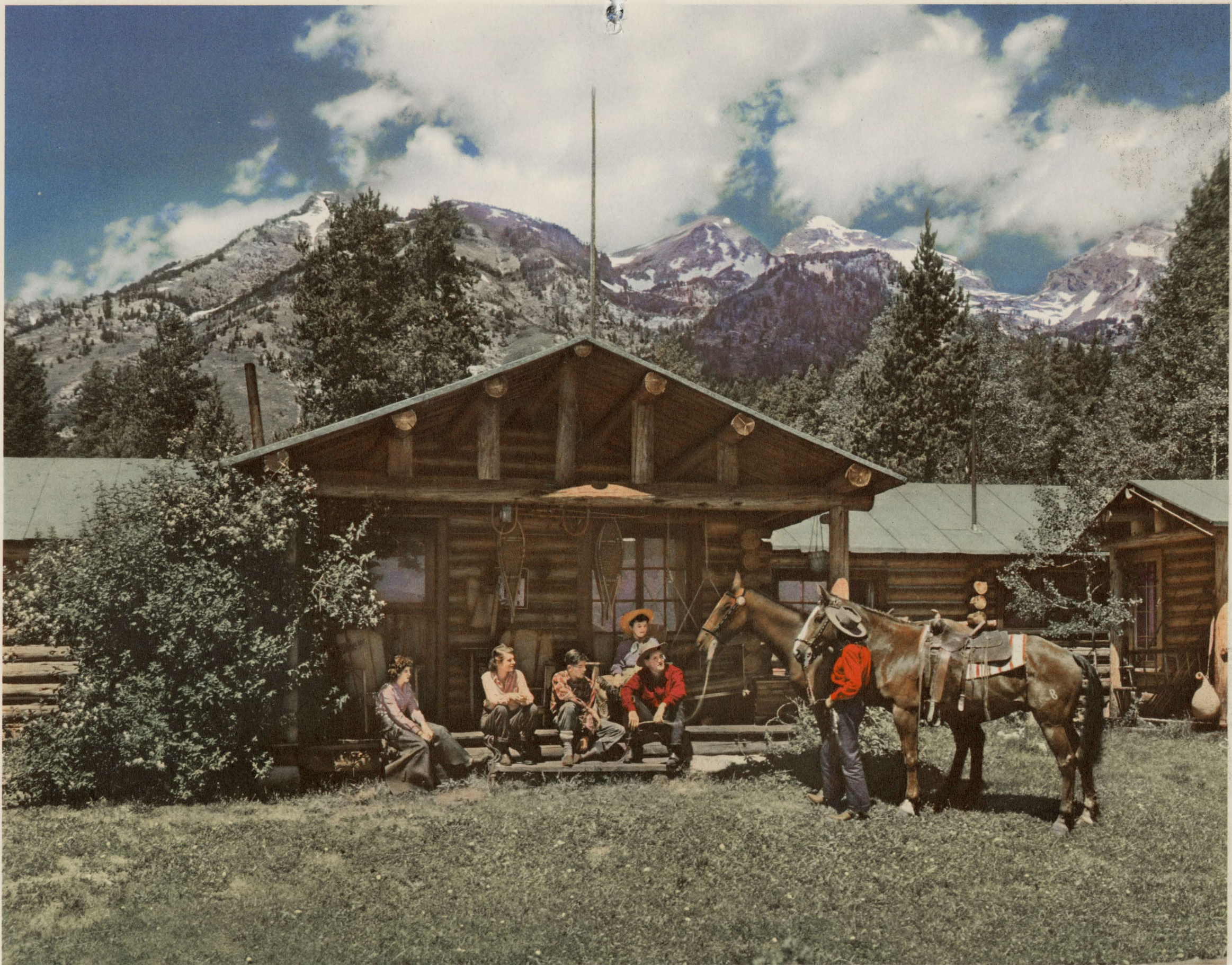
THIS INTRIGUING SCENE IN WYOMING TYPIFIES WESTERN DUDE RANCH LIFE