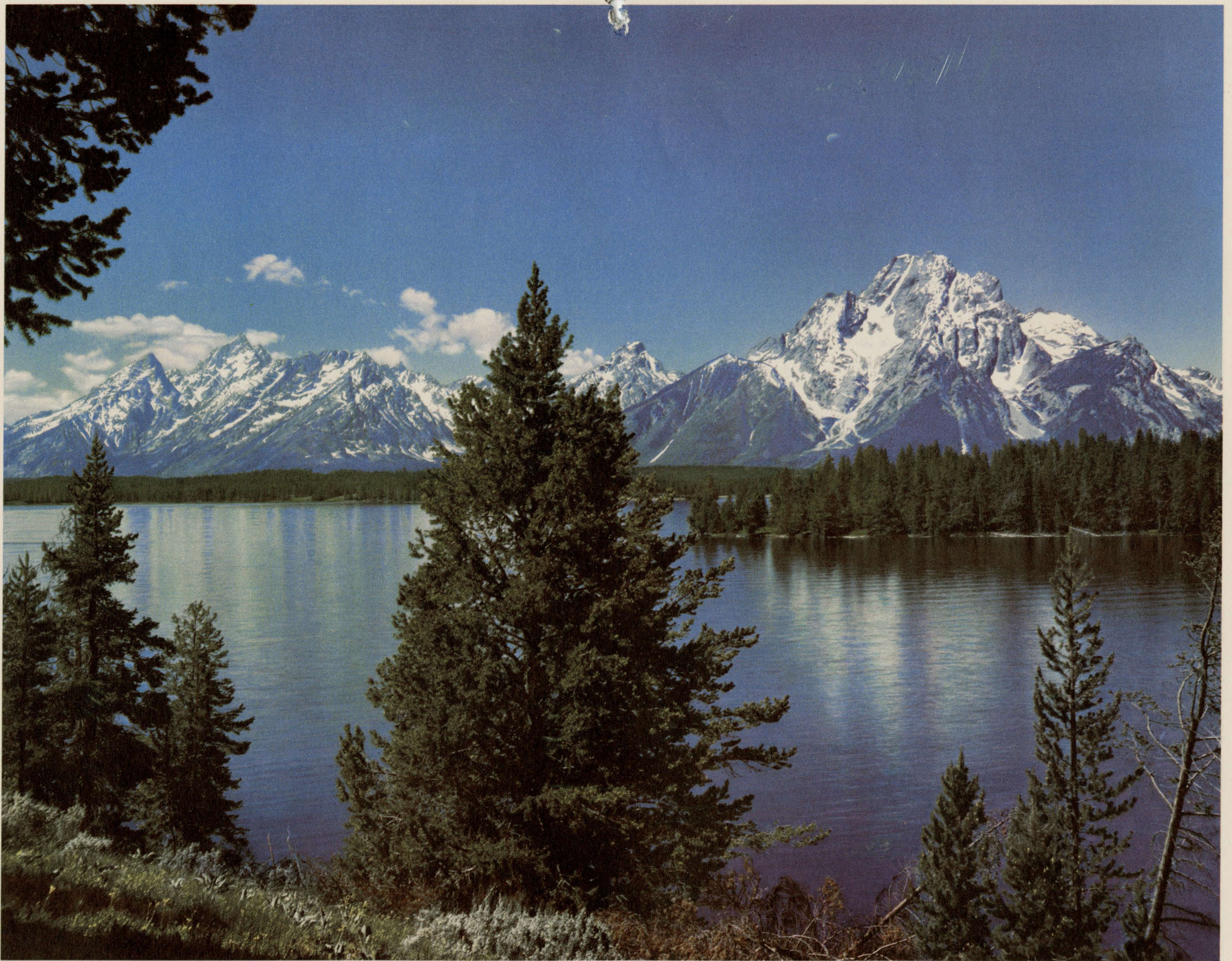
JACKSON LAKE AND TETON MOUNTAINS (MT. MORAN AT RIGHT), GRAND TETON NATIONAL PARK, WYO.