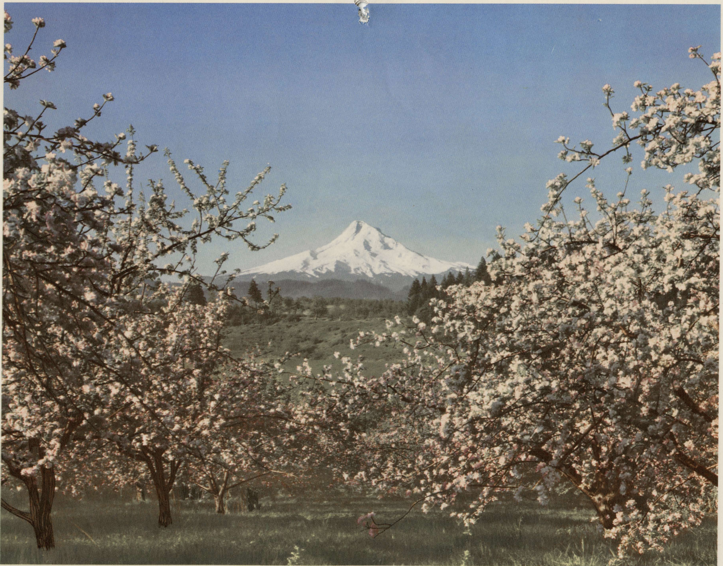
MOUNT HOOD, OREGON, VIEWED ACROSS THE FRUITFUL HOOD RIVER VALLEY