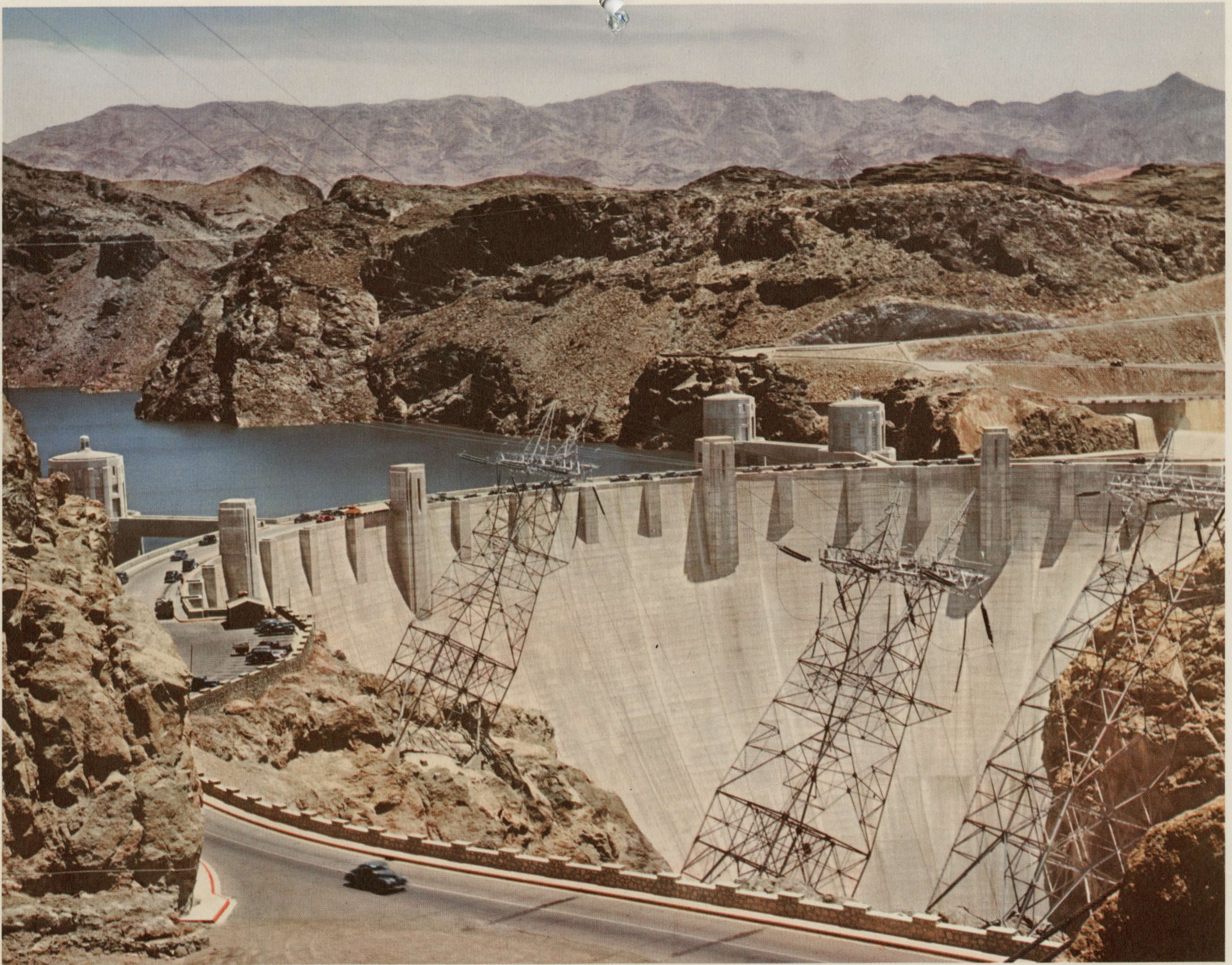
CREST AND PART OF LOWER FACE OF HOOVER DAM, NEAR LAS VEGAS, NEVADA