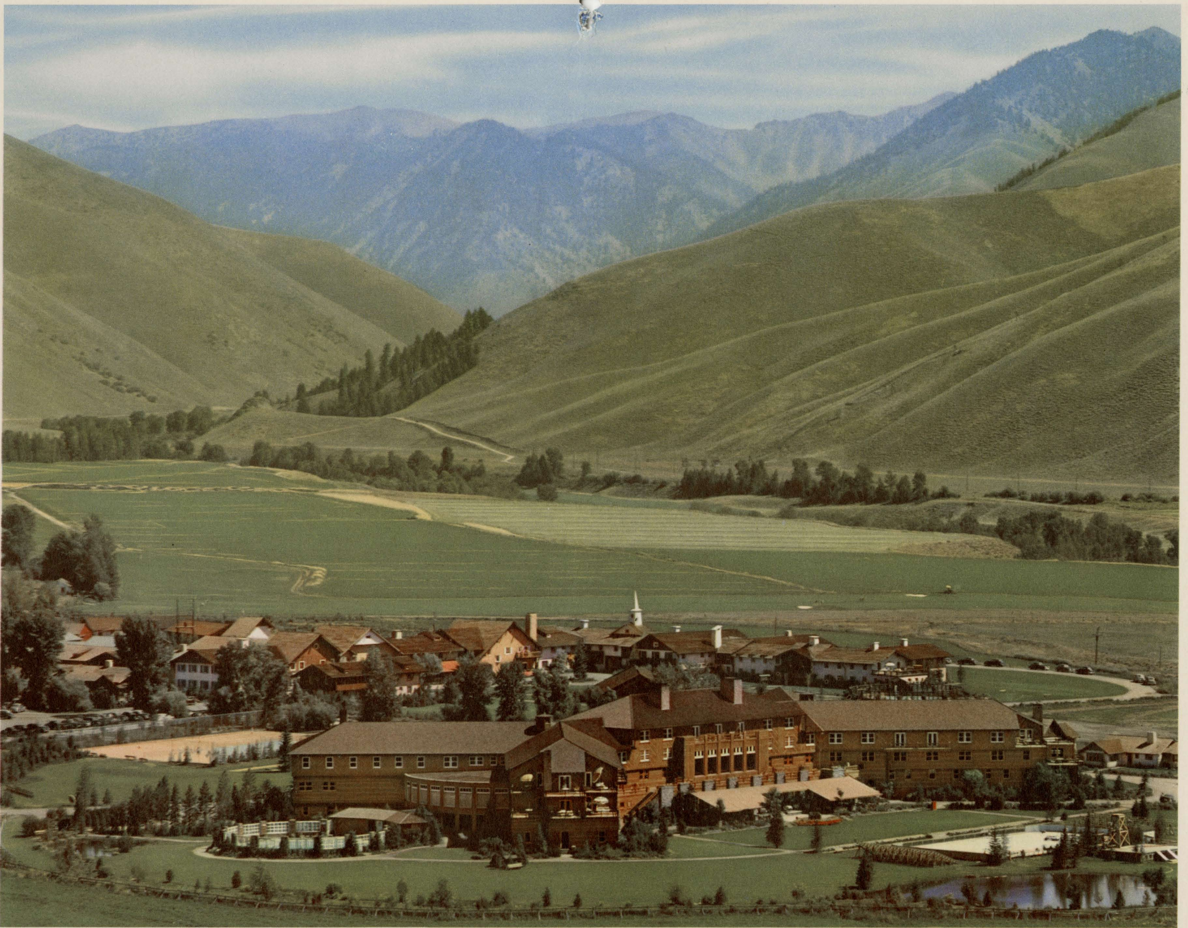
SUMMER VIEW OF THE LODGE AND CHALLENGER INN, SUN VALLEY, IDAHO