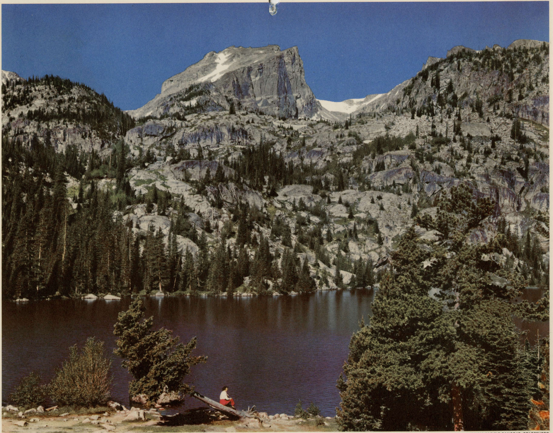
BEAR LAKE AND HALLETT PEAK, ROCKY MOUNTAIN NATIONAL PARK, COLORADO