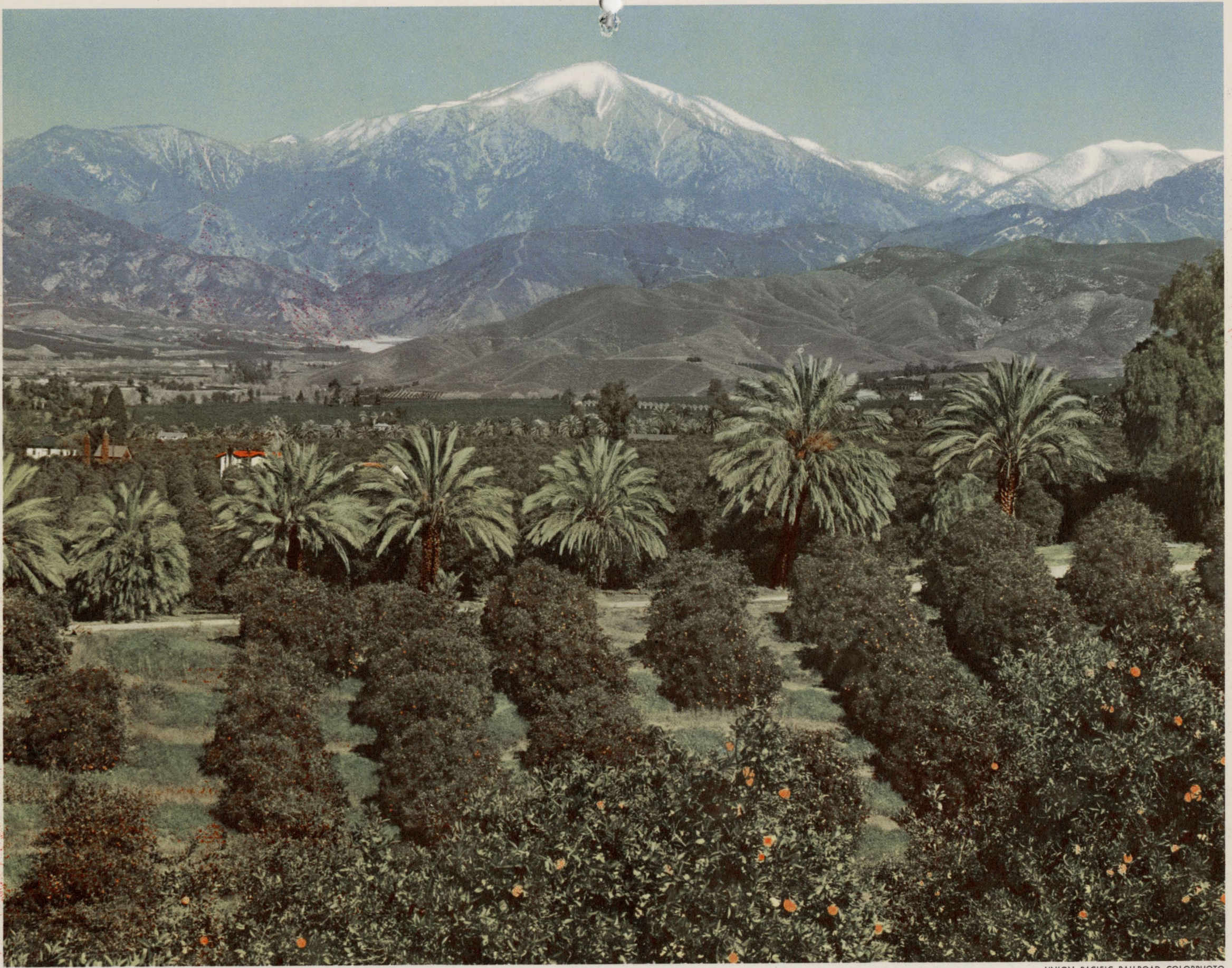
ORANGE GROVES AND SNOWY PEAKS, FROM A VANTAGE POINT NEAR REDLANDS, CALIF.