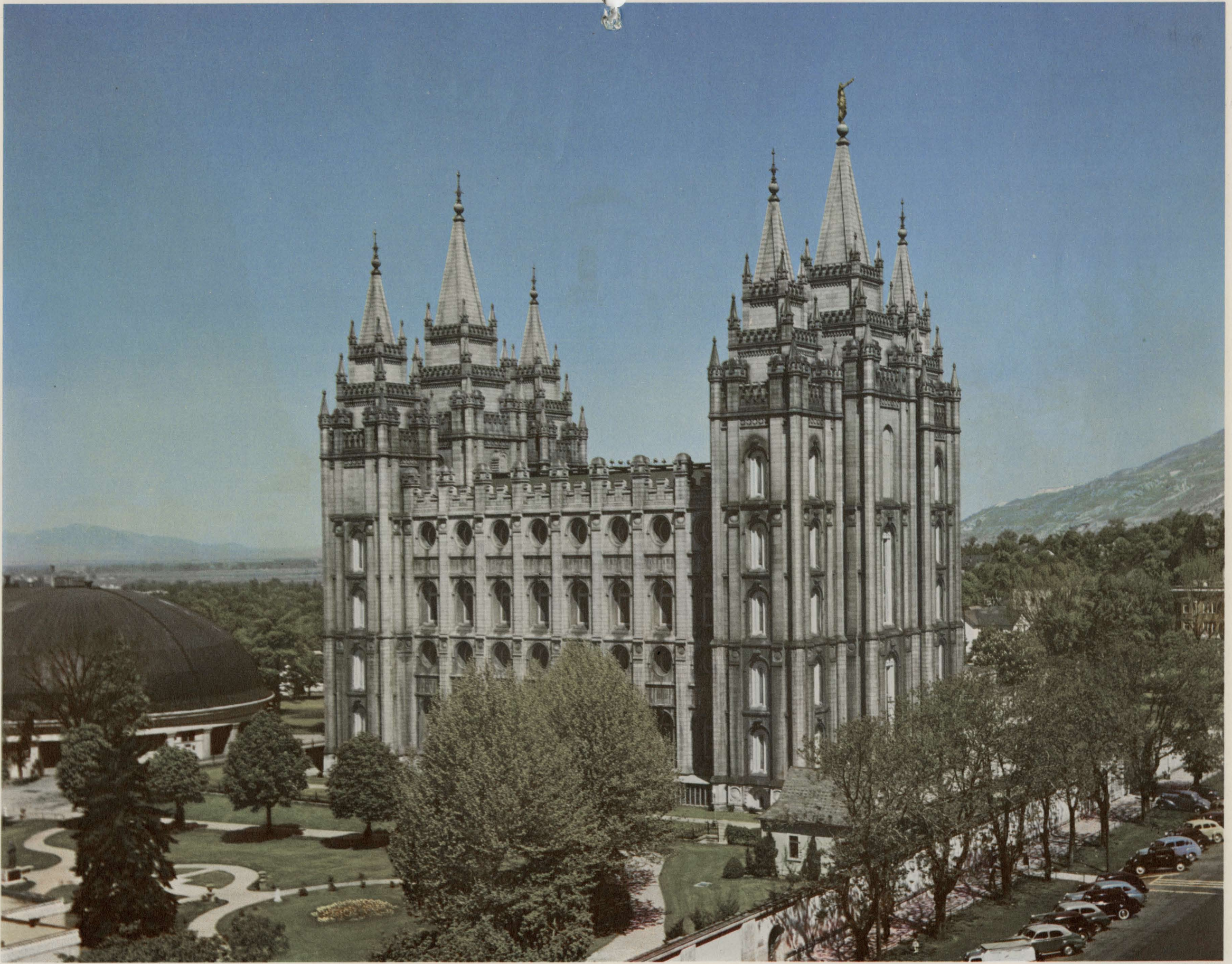
THE WORLD FAMOUS MORMON TEMPLE IN SALT LAKE CITY, UTAH