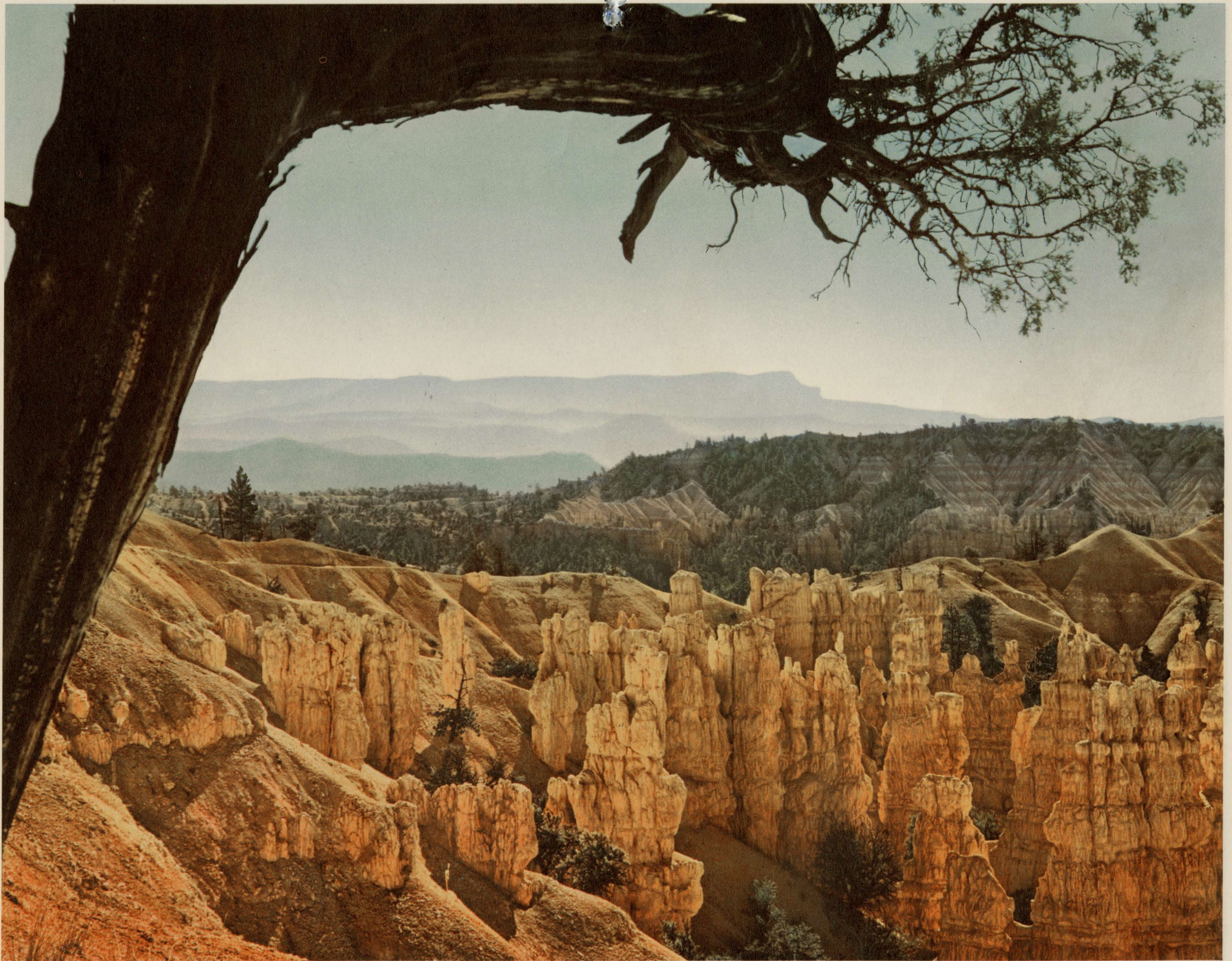
A GLIMPSE THAT REVEALS SOME OF THE GLORIES OF BRYCE CANYON NATIONAL PARK, UTAH