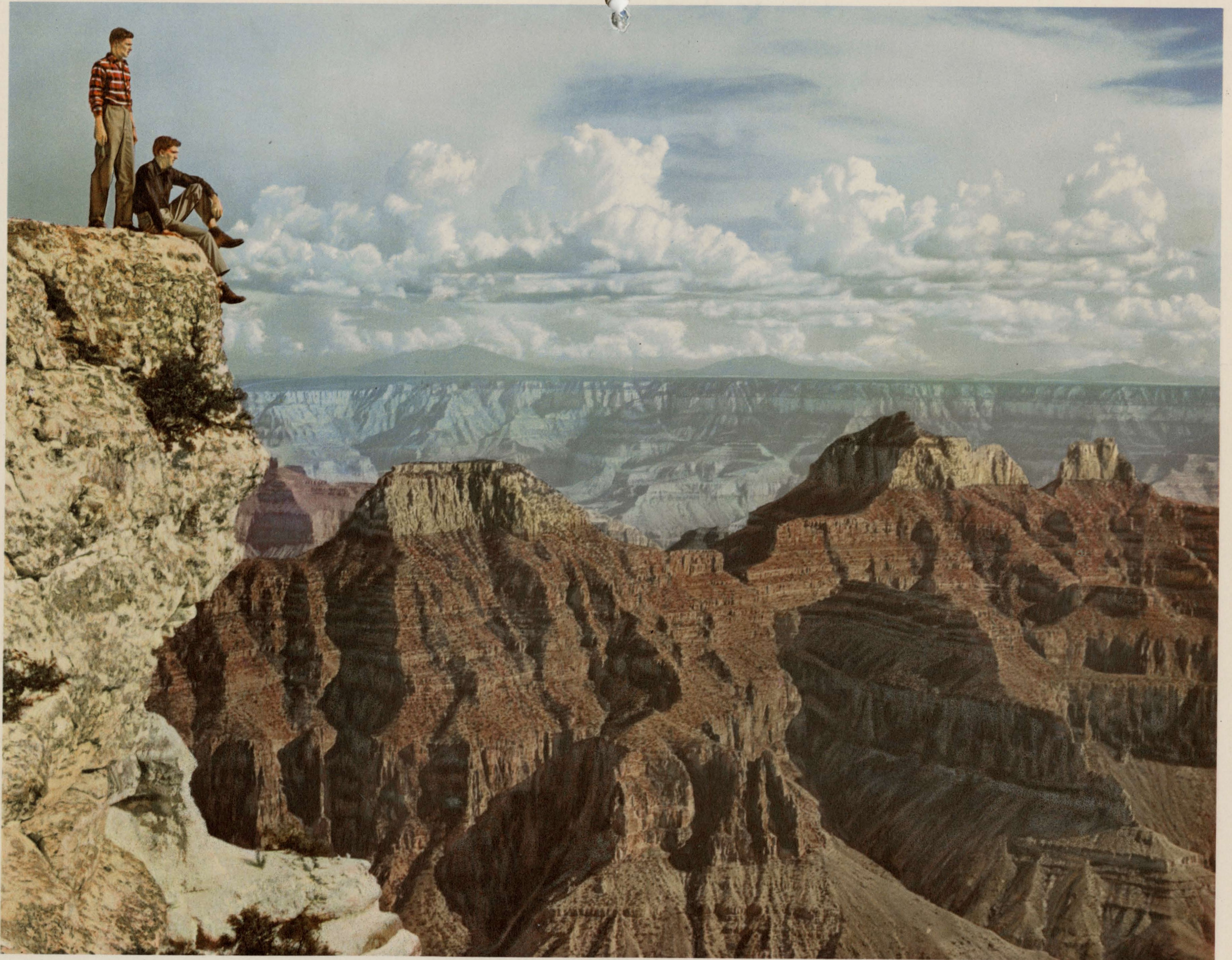
WORLD FAMOUS GRAND CANYON, ARIZONA, FROM BRIGHT ANGEL POINT ON THE NORTH RIM