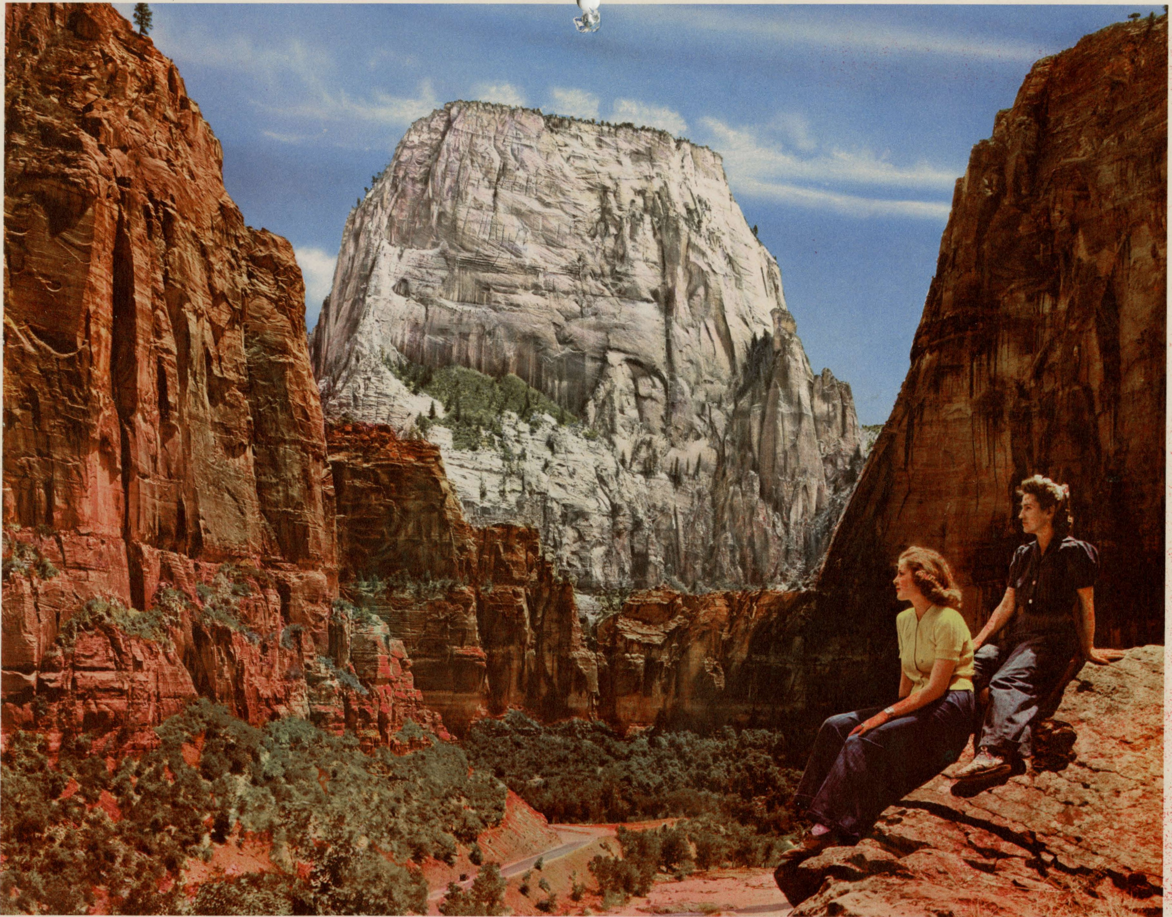
THE GREAT WHITE THRONE, ZION NATIONAL PARK, UTAH