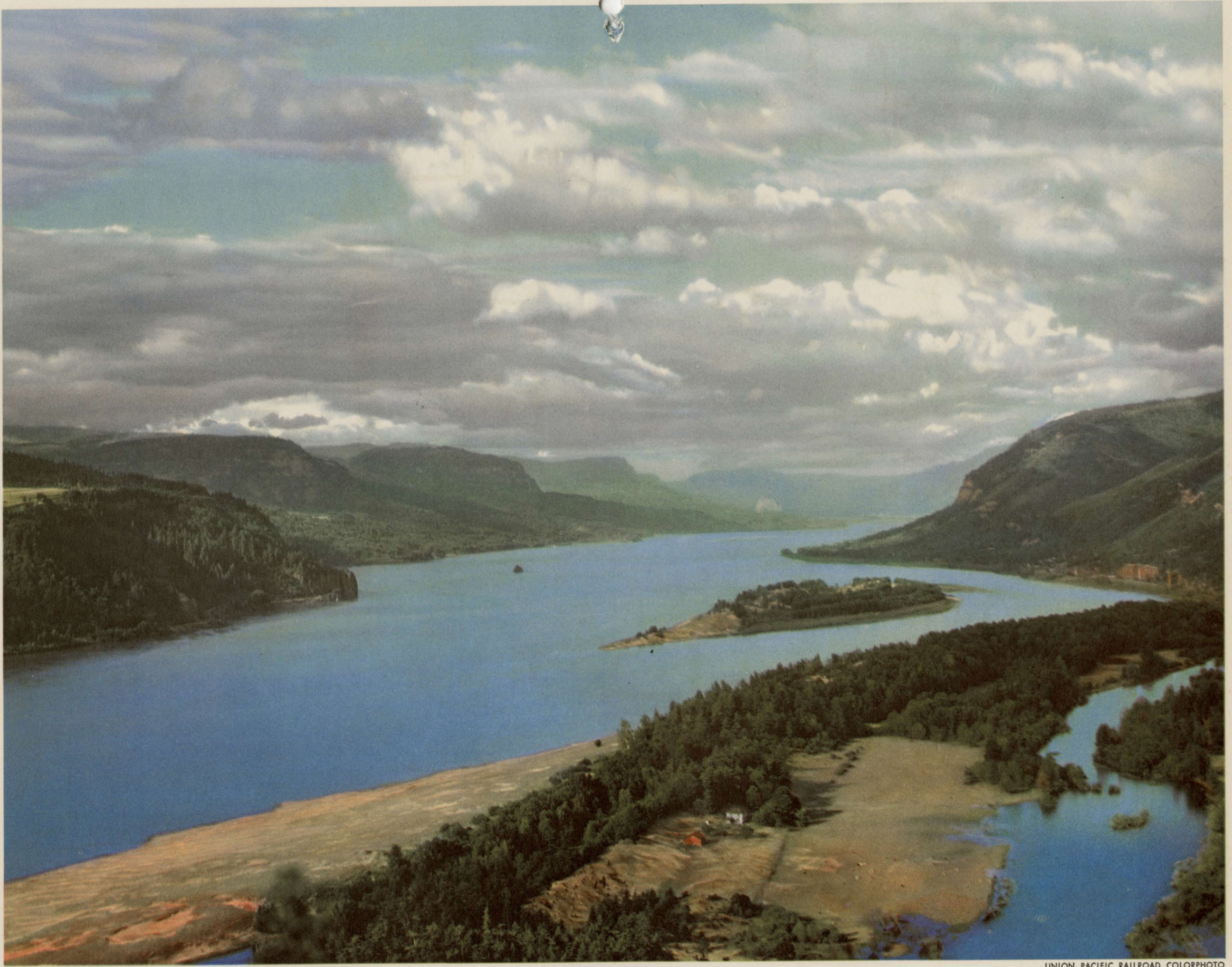
UNION PACIFIC RAILROAD COLORPHOTO