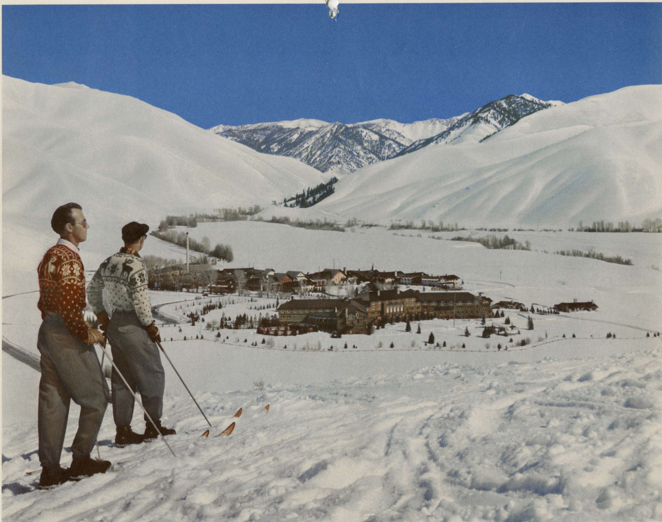
GENERAL VIEW OF SUN VALLEY, IDAHO, IN WINTER