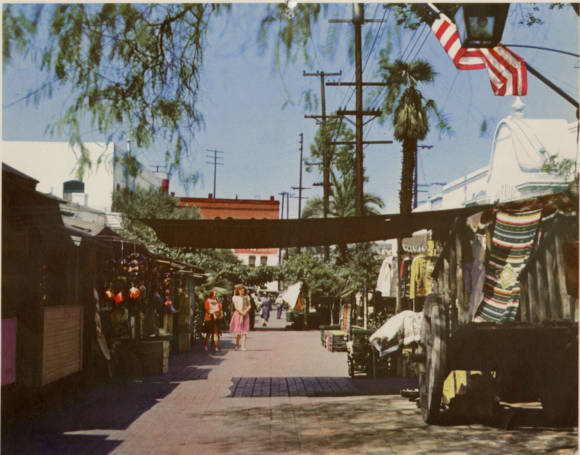
QUAINT OLVERA STREET IN DOWNTOWN LOS ANGELES, CALIF., IS REMINISCENT OF OLD MEXICO