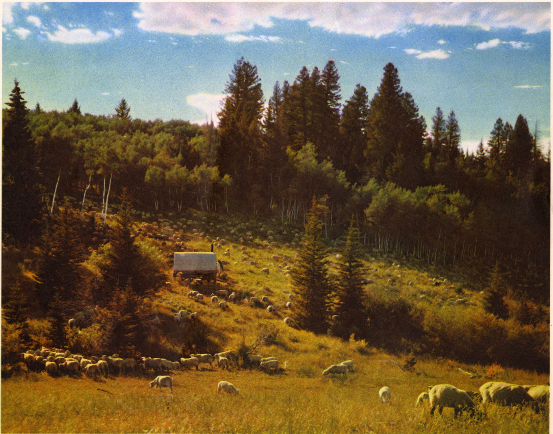
KODACHROME BY UNION PACIFIC

SHEEP RAISING IS AN IMPORTANT INDUSTRY IN THE UNION PACIFIC WEST