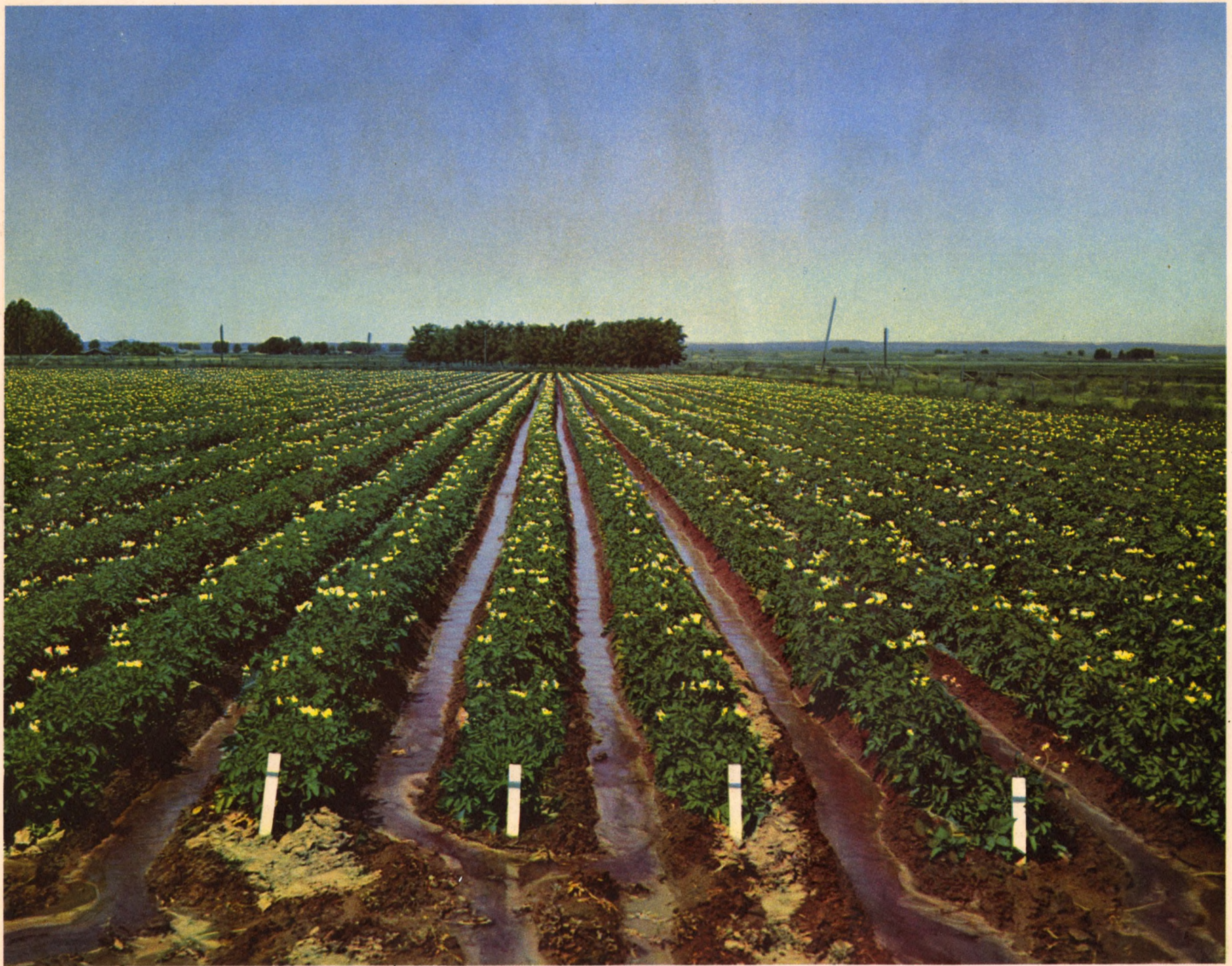
FAMOUS IDAHO POTATOES IN THE MAKING, UNDER MODERN IRRIGATION METHODS