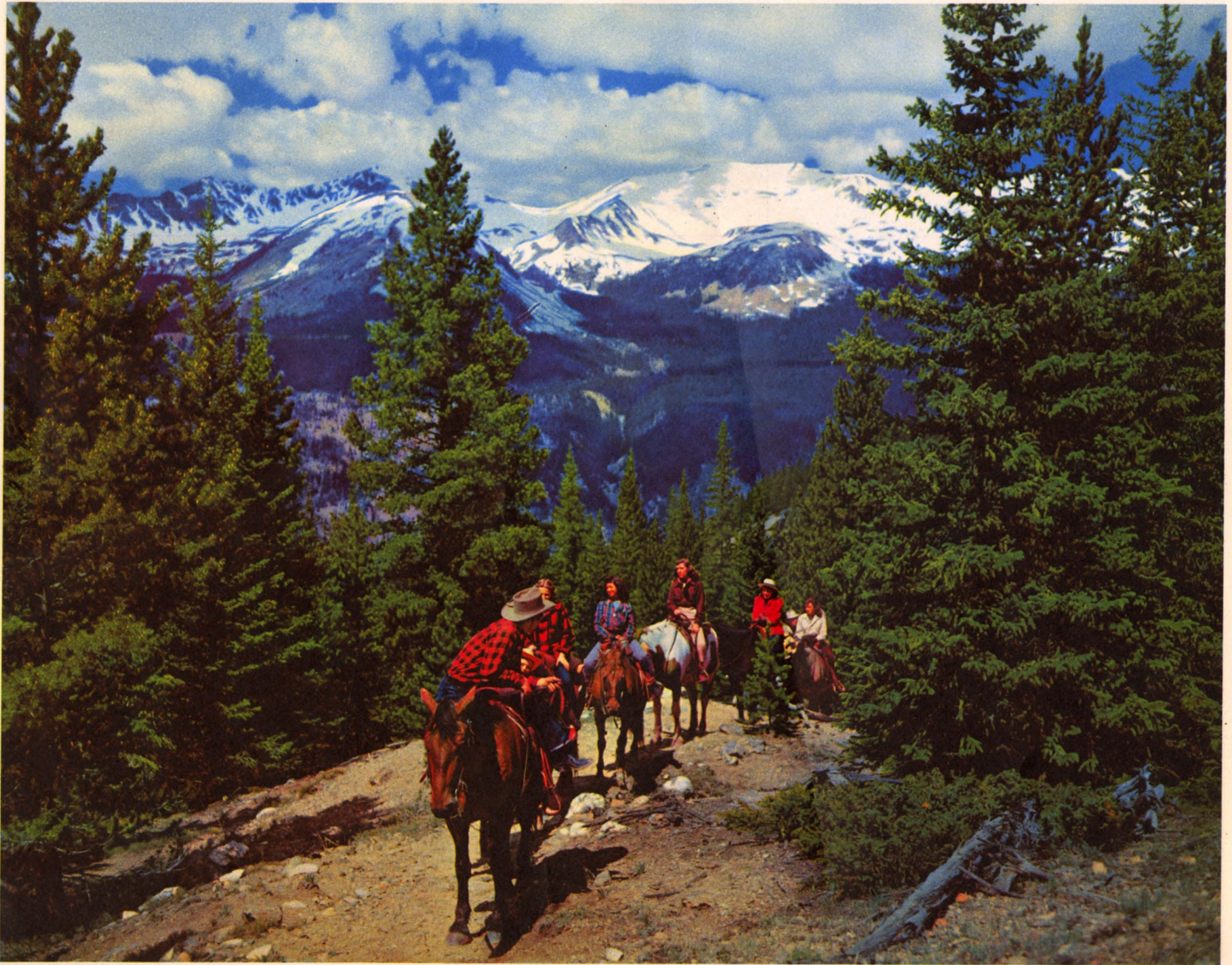
DUDE RANCH PARTY ON A MOUNTAIN TRAIL IN THE SCENIC WEST