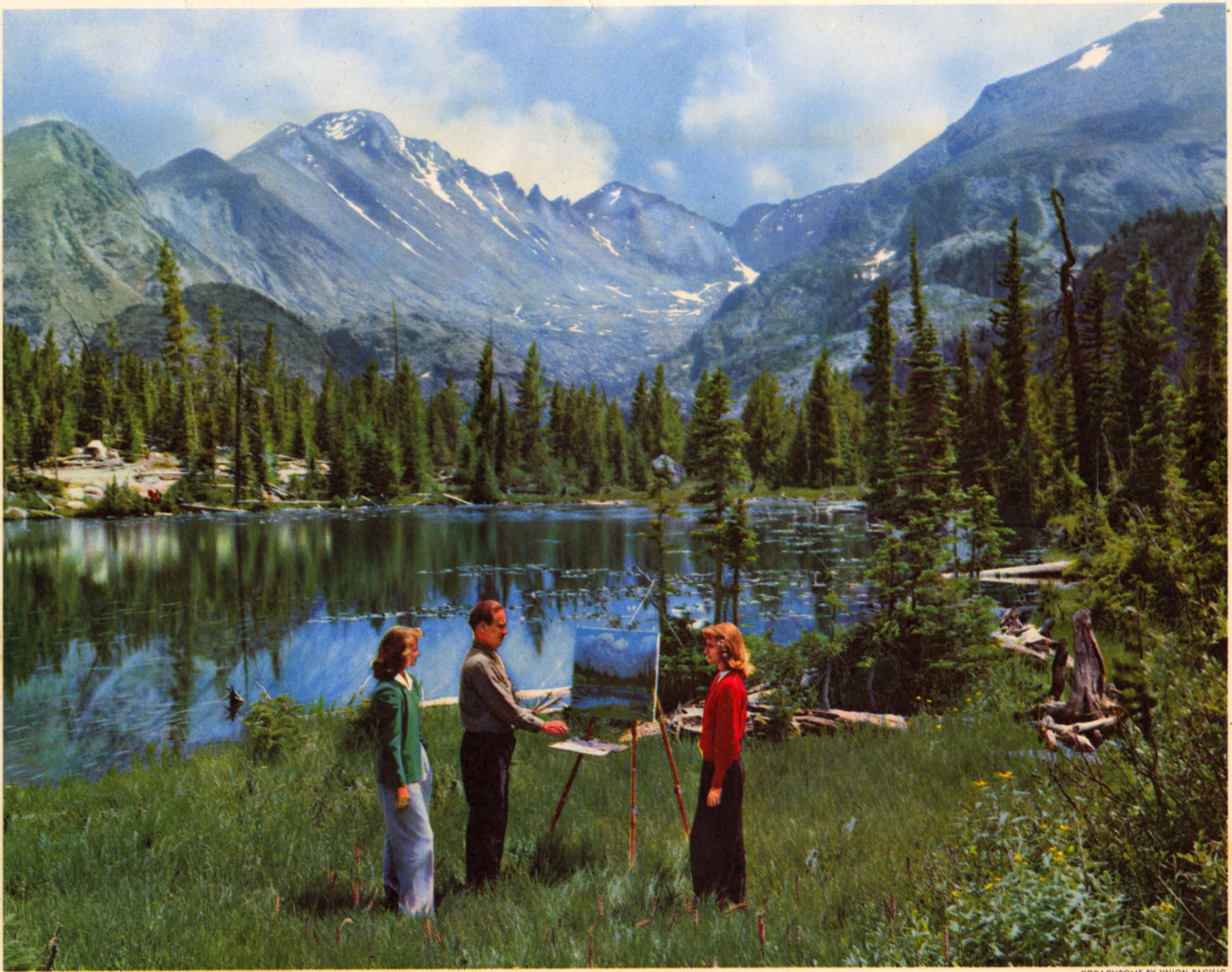
KODACHROME BY UNION PACIFIC