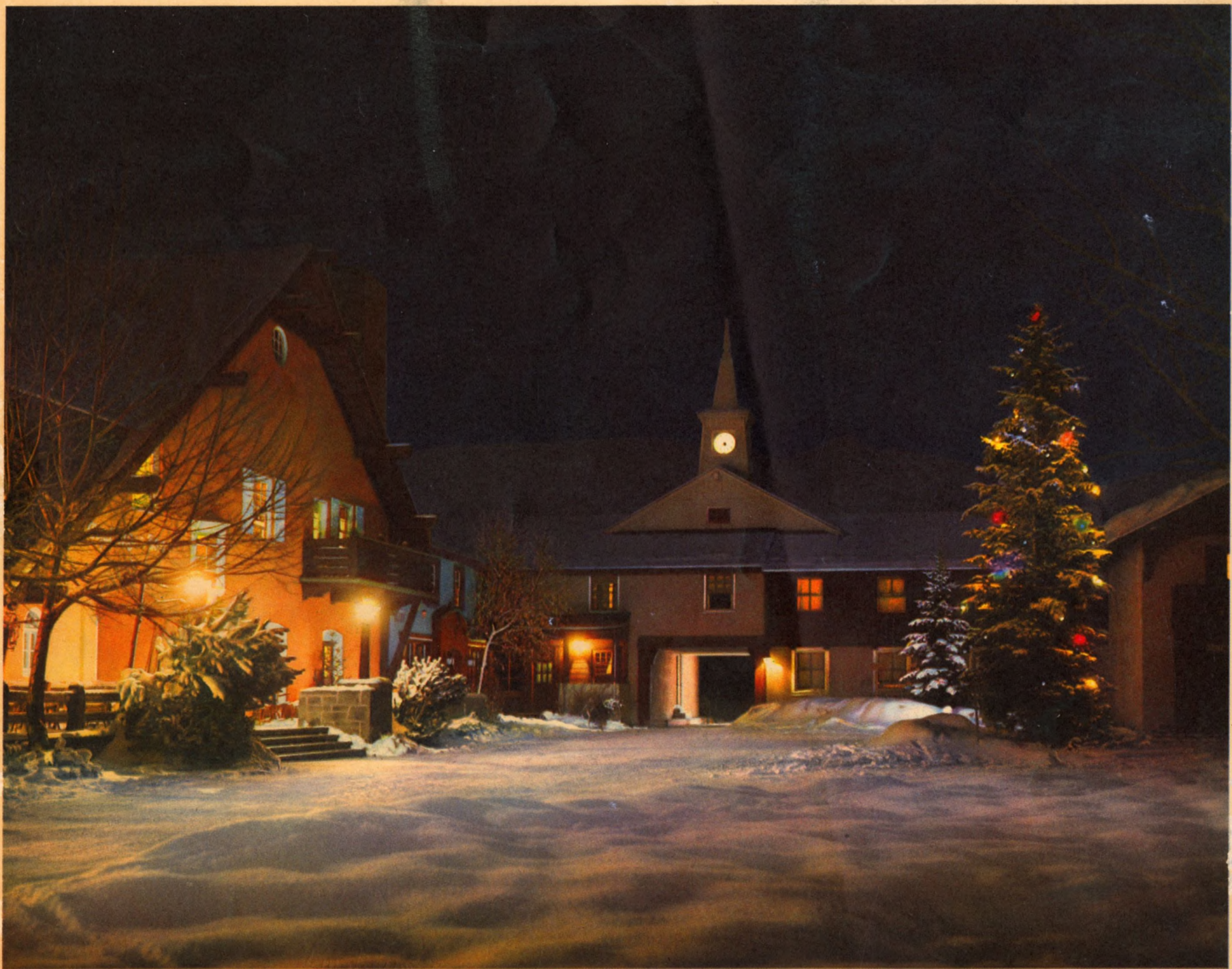
A "CHRISTMAS CARD" VIEW OF CHALLENGER INN, SUN VALLEY, IDAHO