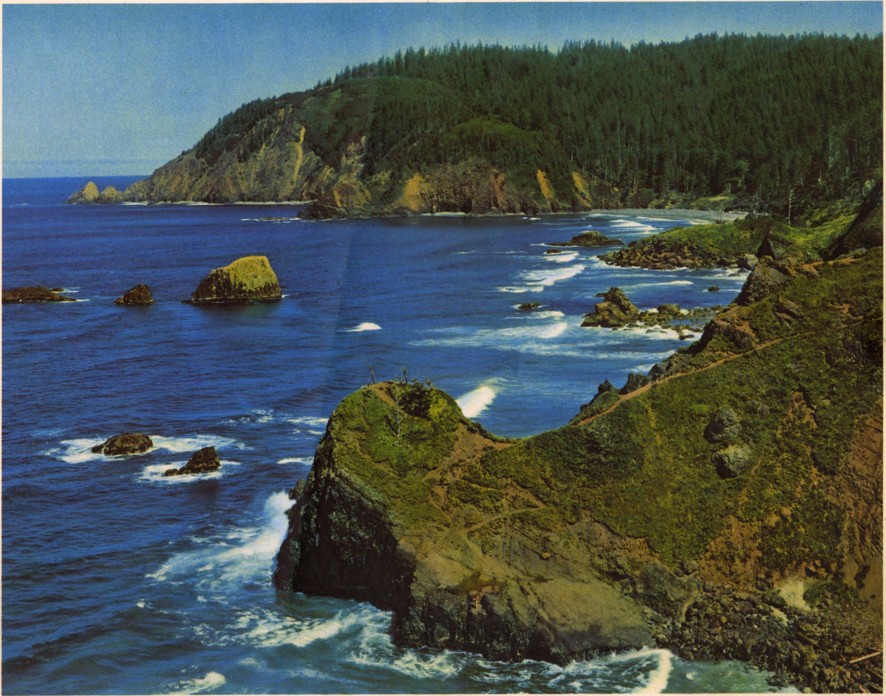
ALONG THE OREGON COASTLINE NEAR CANNON BEACH