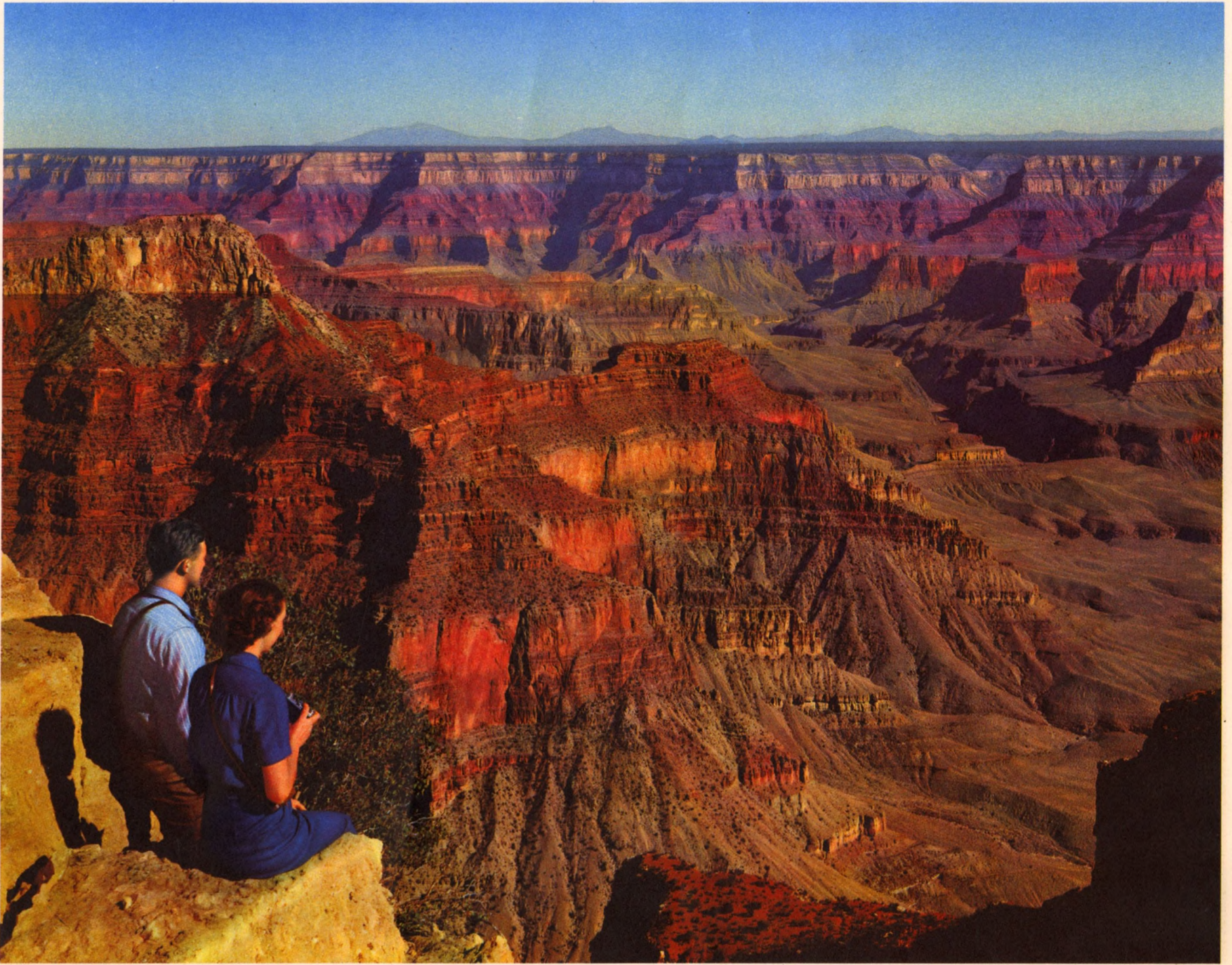
THE INCOMPARABLE GRAND CANYON FROM POINT SUBLIME ON THE NORTH RIM