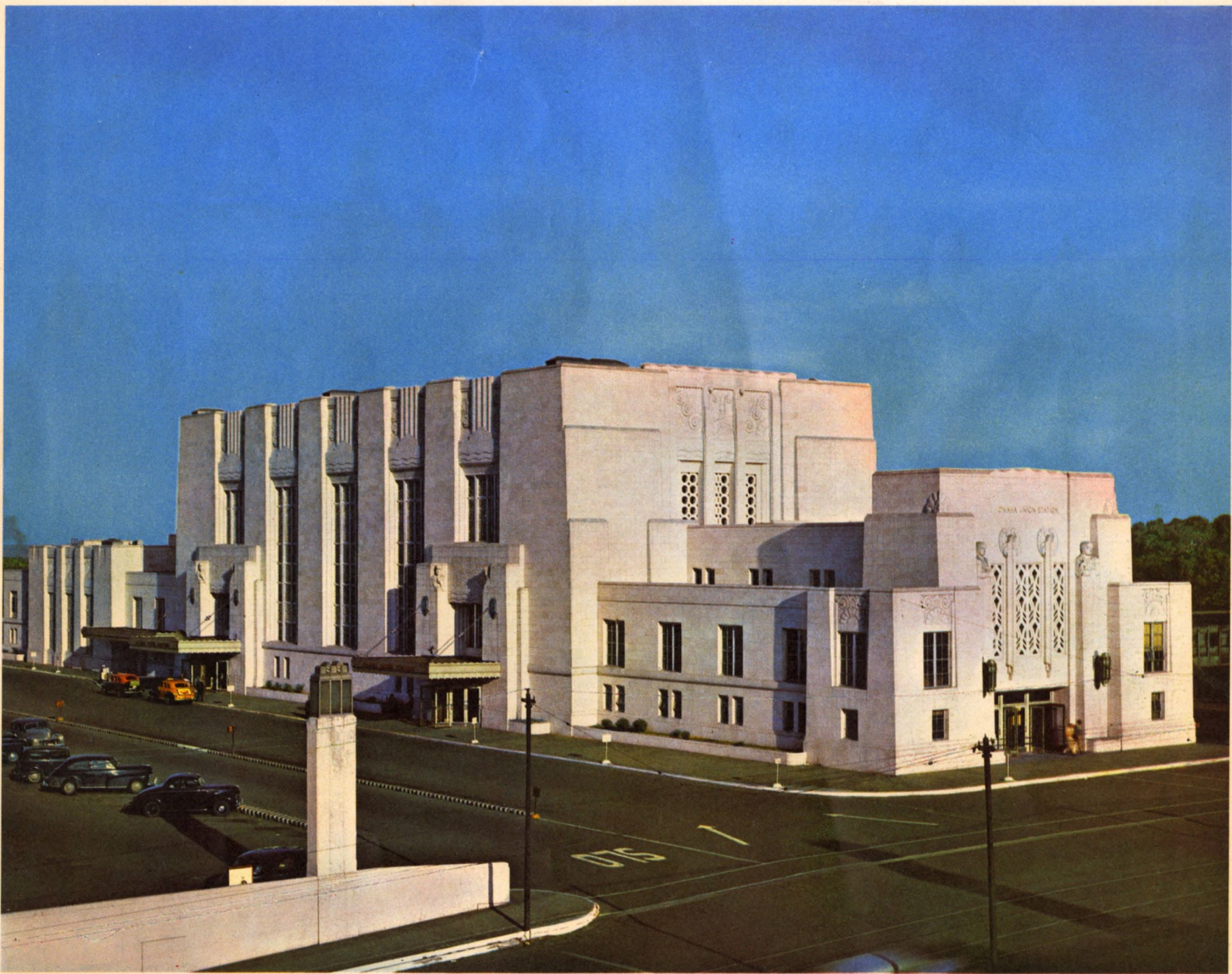
UNION STATION BUILDING OF MODERN DESIGN AT OMAHA, NEBRASKA