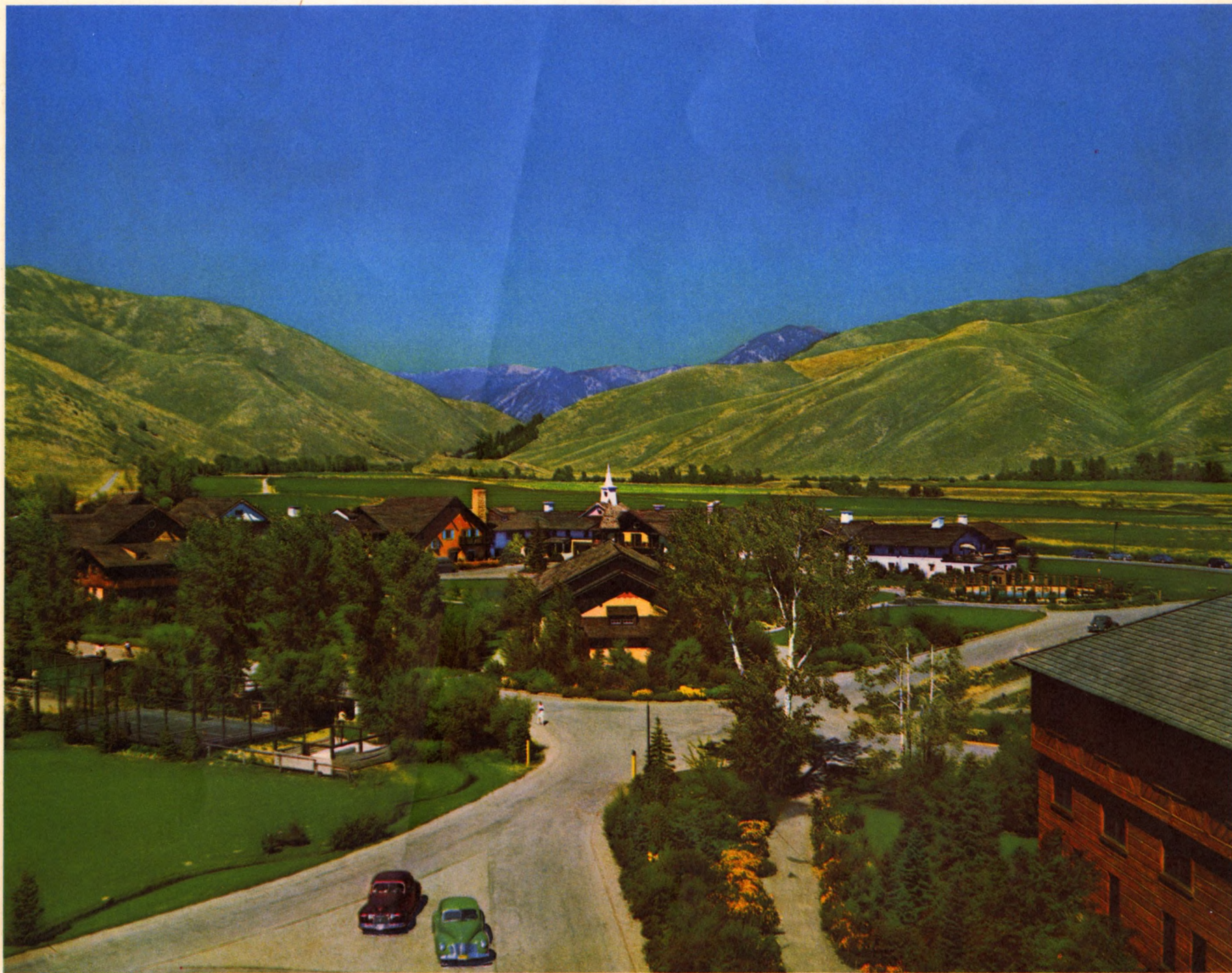
KODACHROME BY UNION PACIFIC