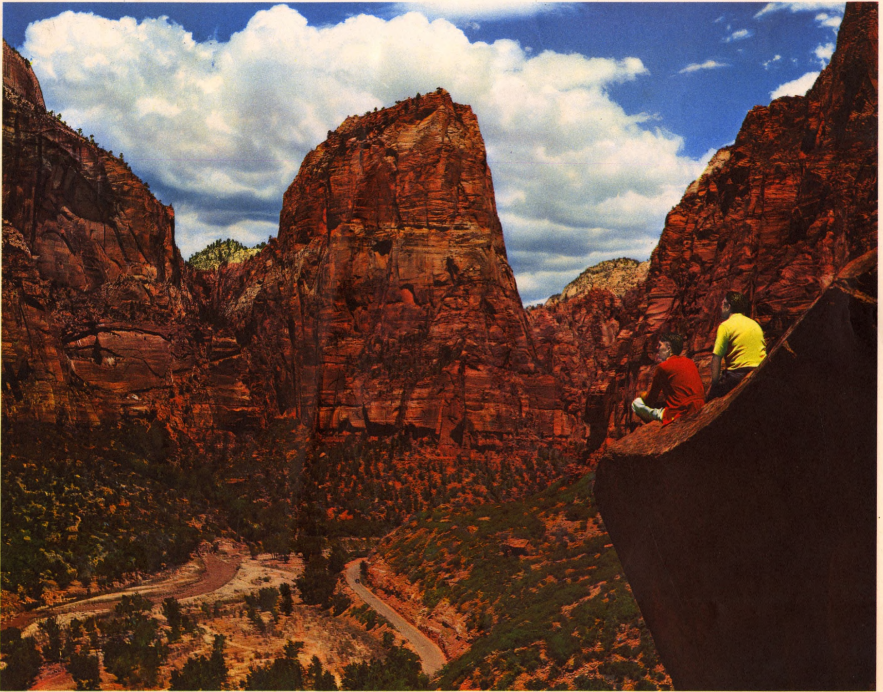
KODACHROME BY UNION PACIFIC