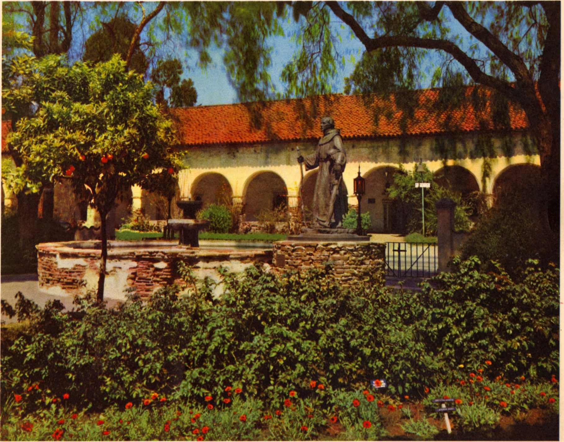
KODACHROME BY UNION PACIFIC