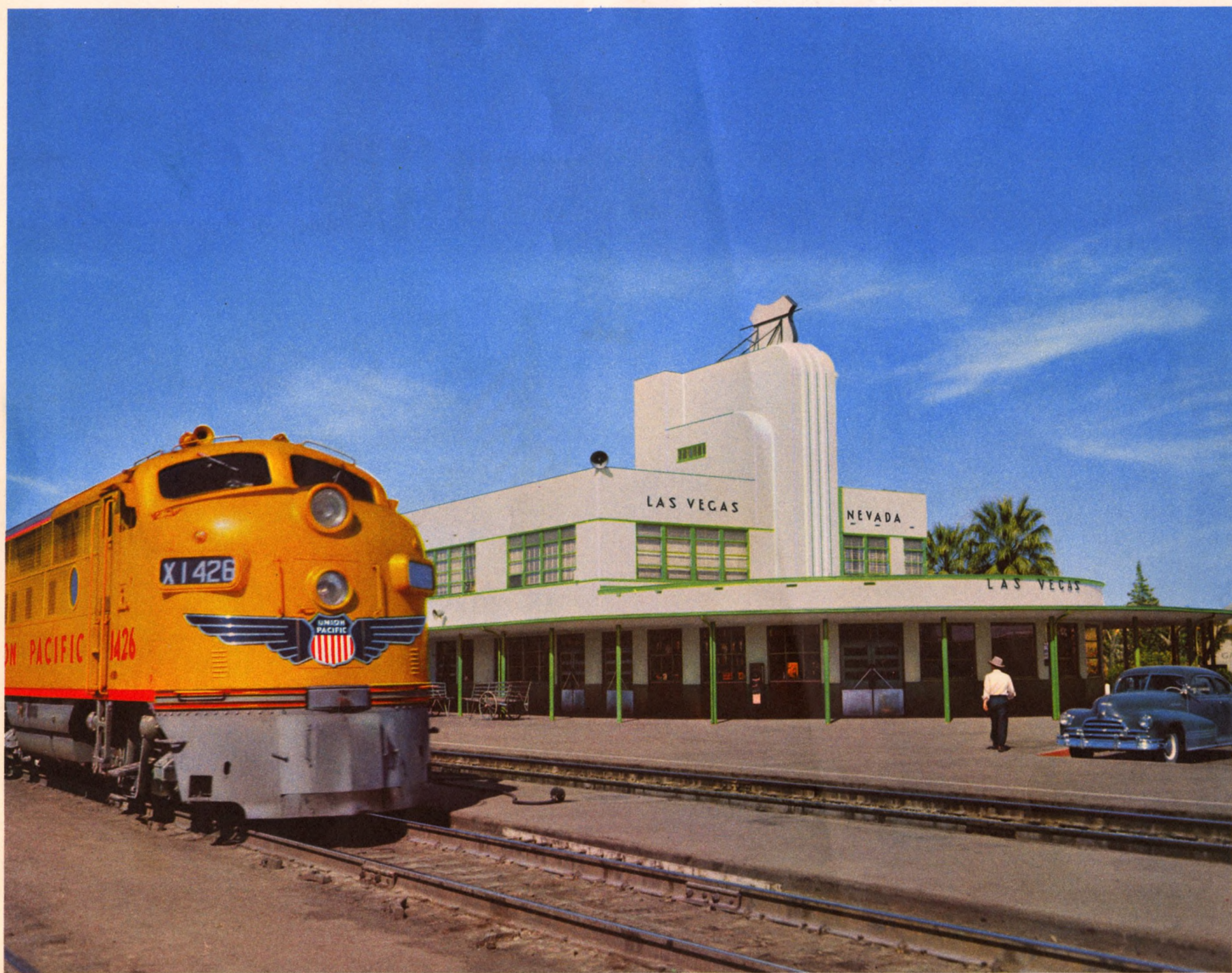
STREAMLINED UNION PACIFIC PASSENGER STATION, LAS VEGAS, NEVADA