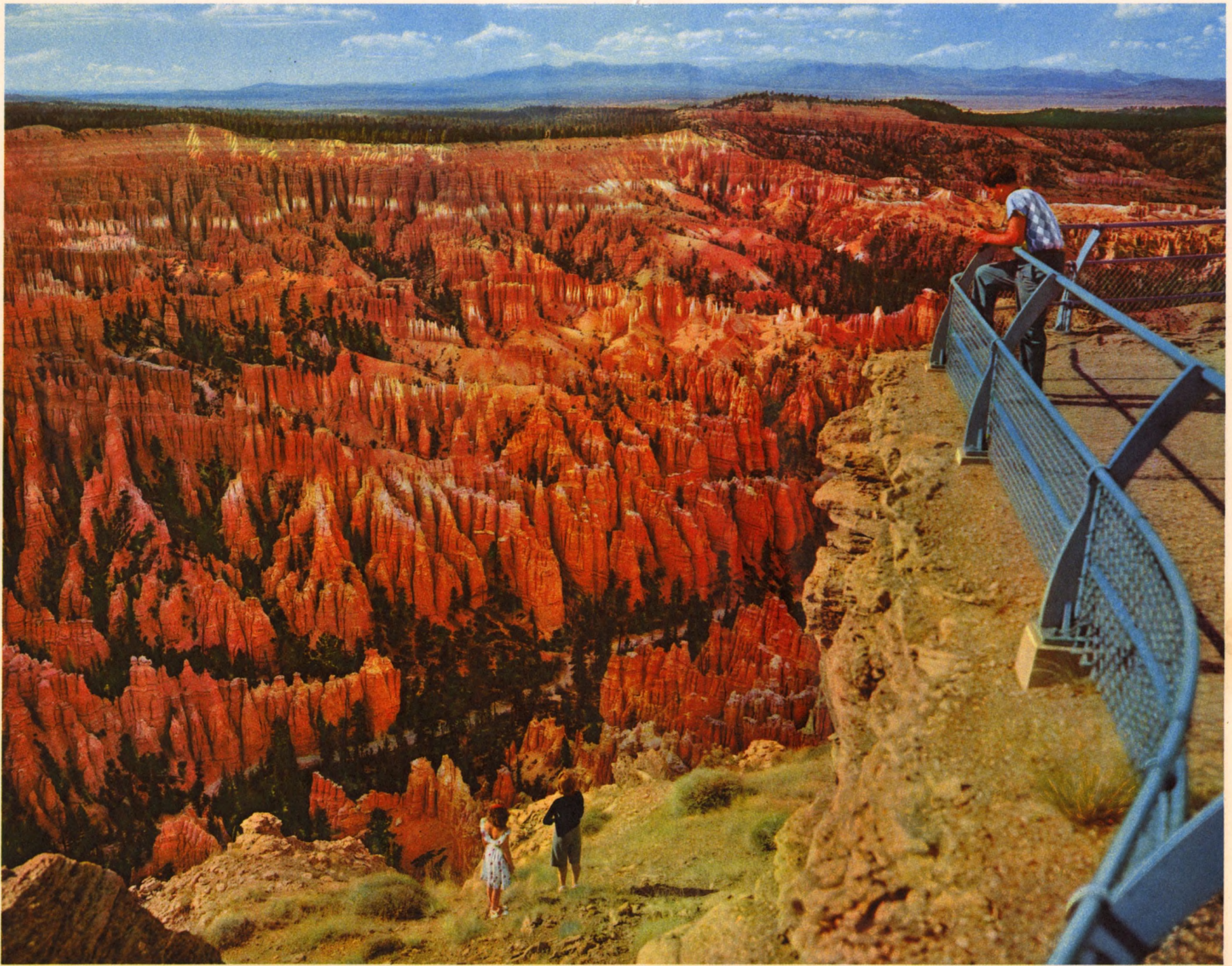
KODACHROME BY UNION PACIFIC