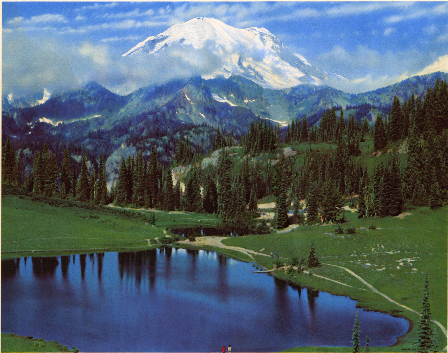
TIPSOO LAKE AND MOUNT RAINIER IN RAINIER NATIONAL PARK, WASHINGTON