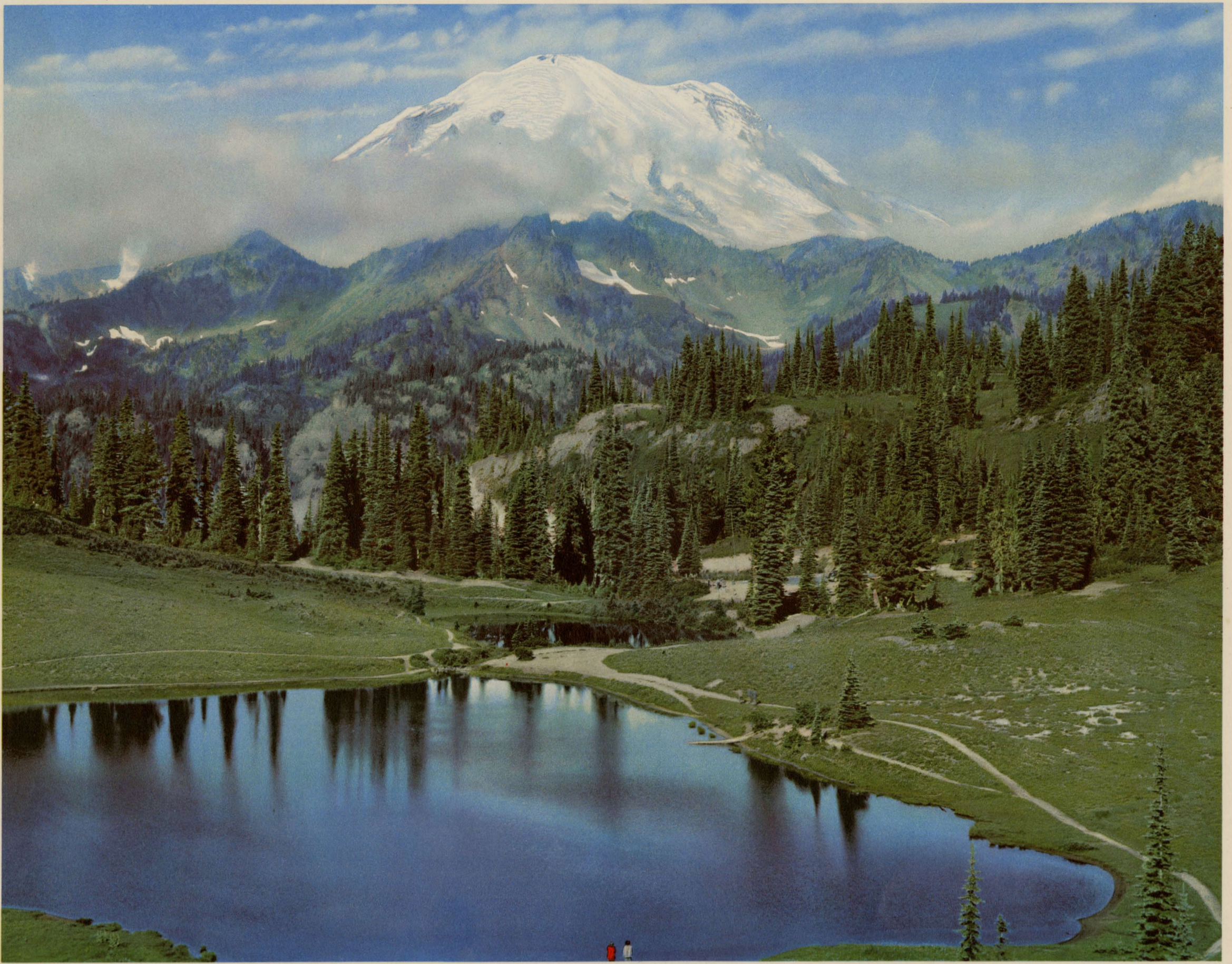
TIPSOO LAKE AND MOUNT RAINIER IN RAINIER NATIONAL PARK, WASHINGTON