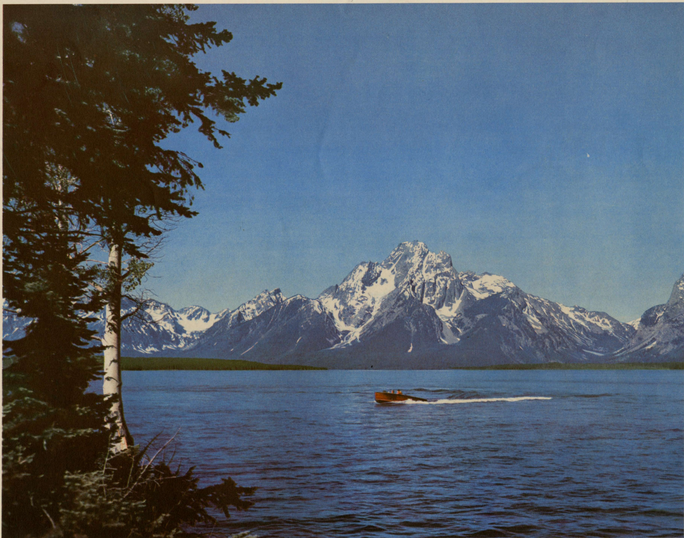
JACKSON LAKE, AND MOUNT MORAN IN GRAND TETON NATIONAL PARK, WYOMING