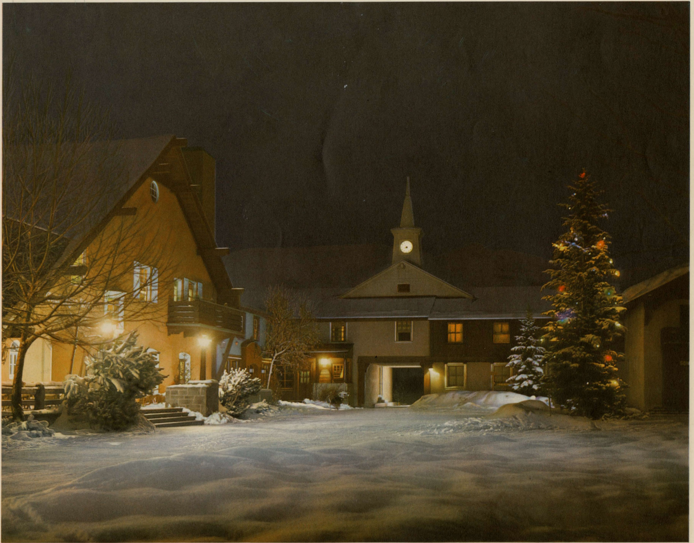
A "CHRISTMAS CARD" VIEW OF CHALLENGER INN, SUN VALLEY, IDAHO