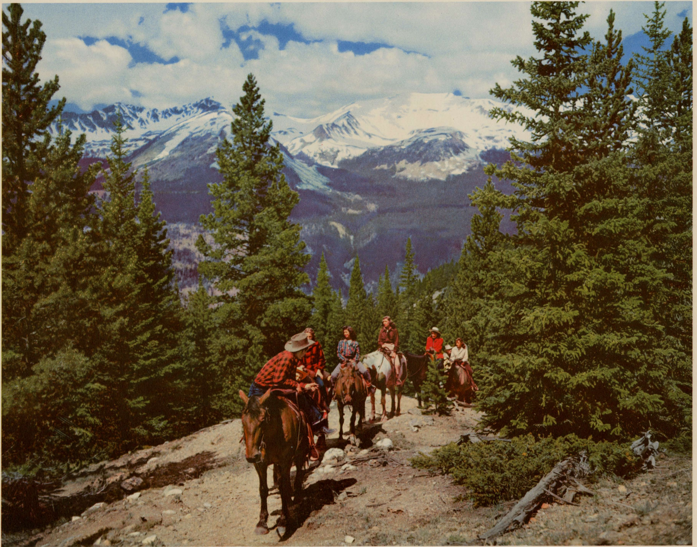
DUDE RANCH PARTY ON A MOUNTAIN TRAIL IN THE SCENIC WEST