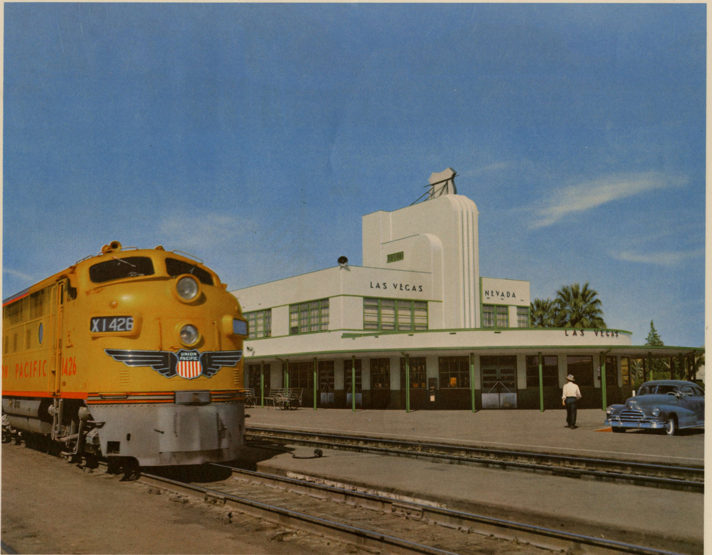
STREAMLINED UNION PACIFIC PASSENGER STATION, LAS VEGAS, NEVADA