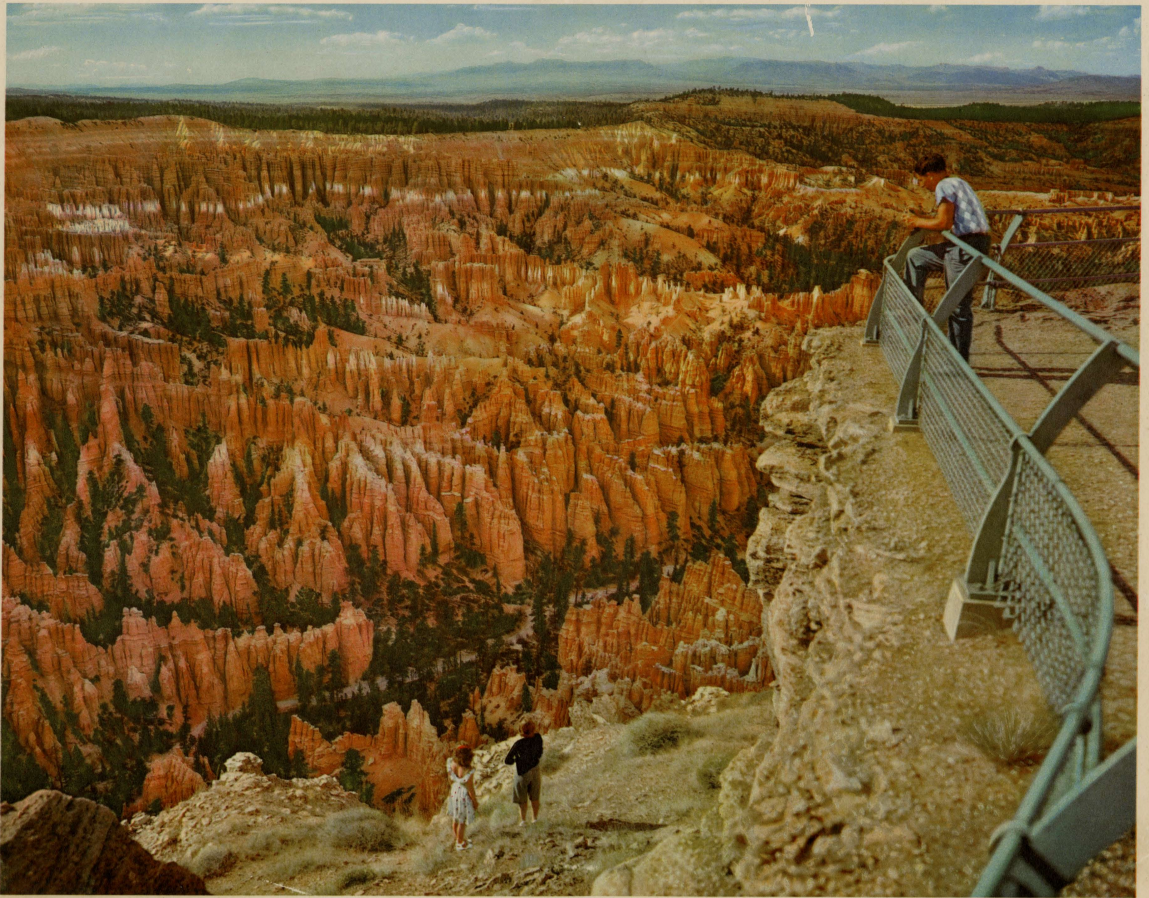
BRYCE CANYON NATIONAL PARK, UTAH, WHERE EROSION SCULPTURES FANTASTIC, COLORFUL FORMATIONS