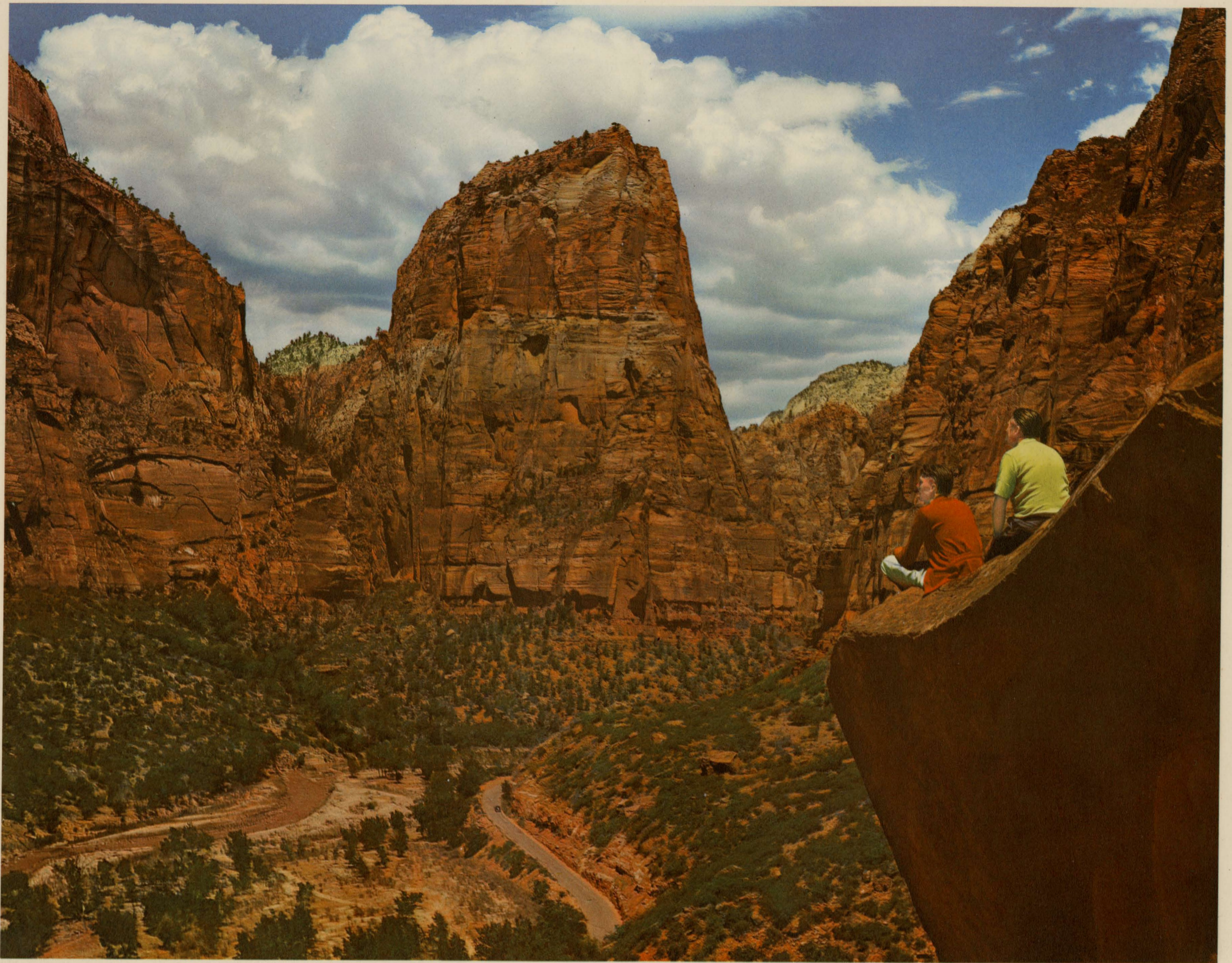
ANGELS LANDING, A SPECTACULAR LANDMARK IN ZION NATIONAL PARK, UTAH