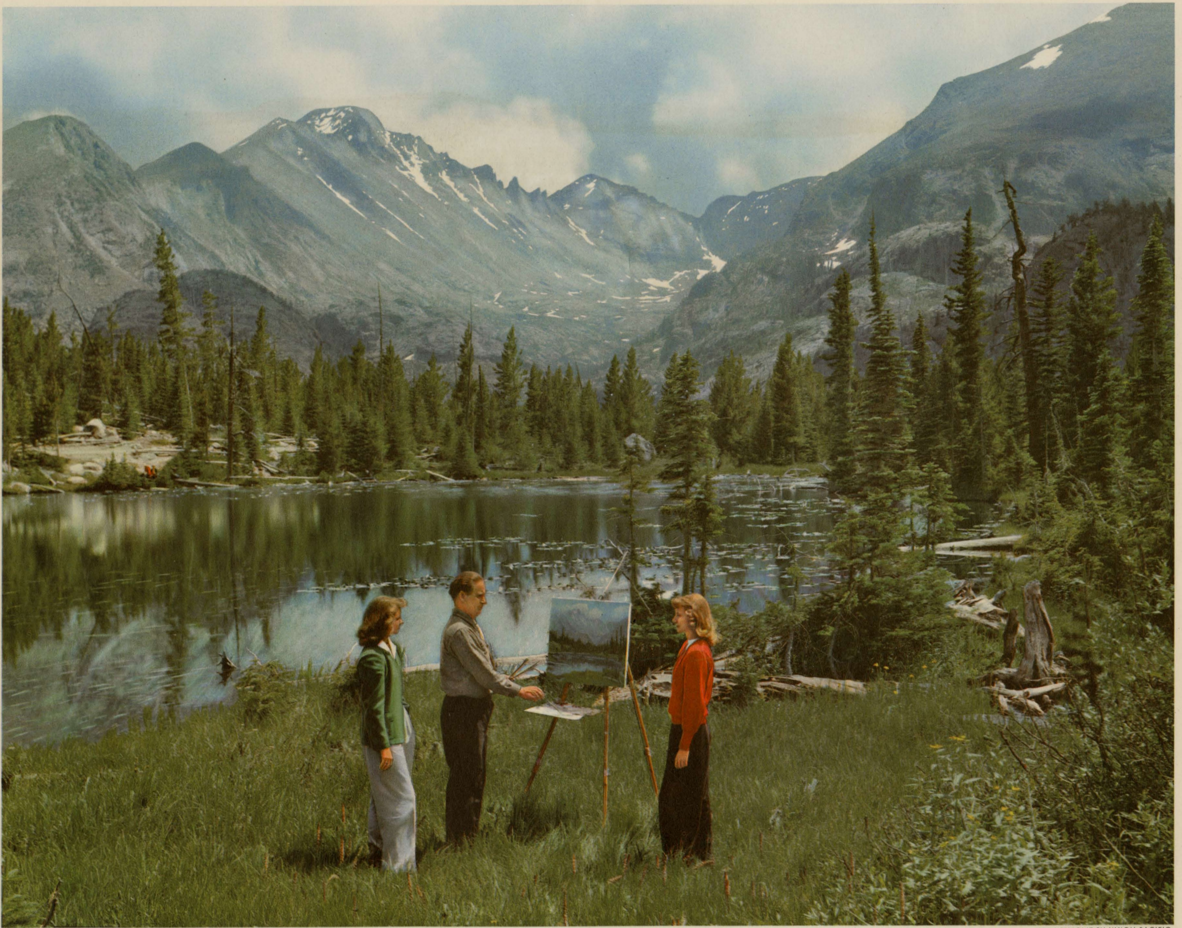
KODACHROME BY UNION PACIFIC