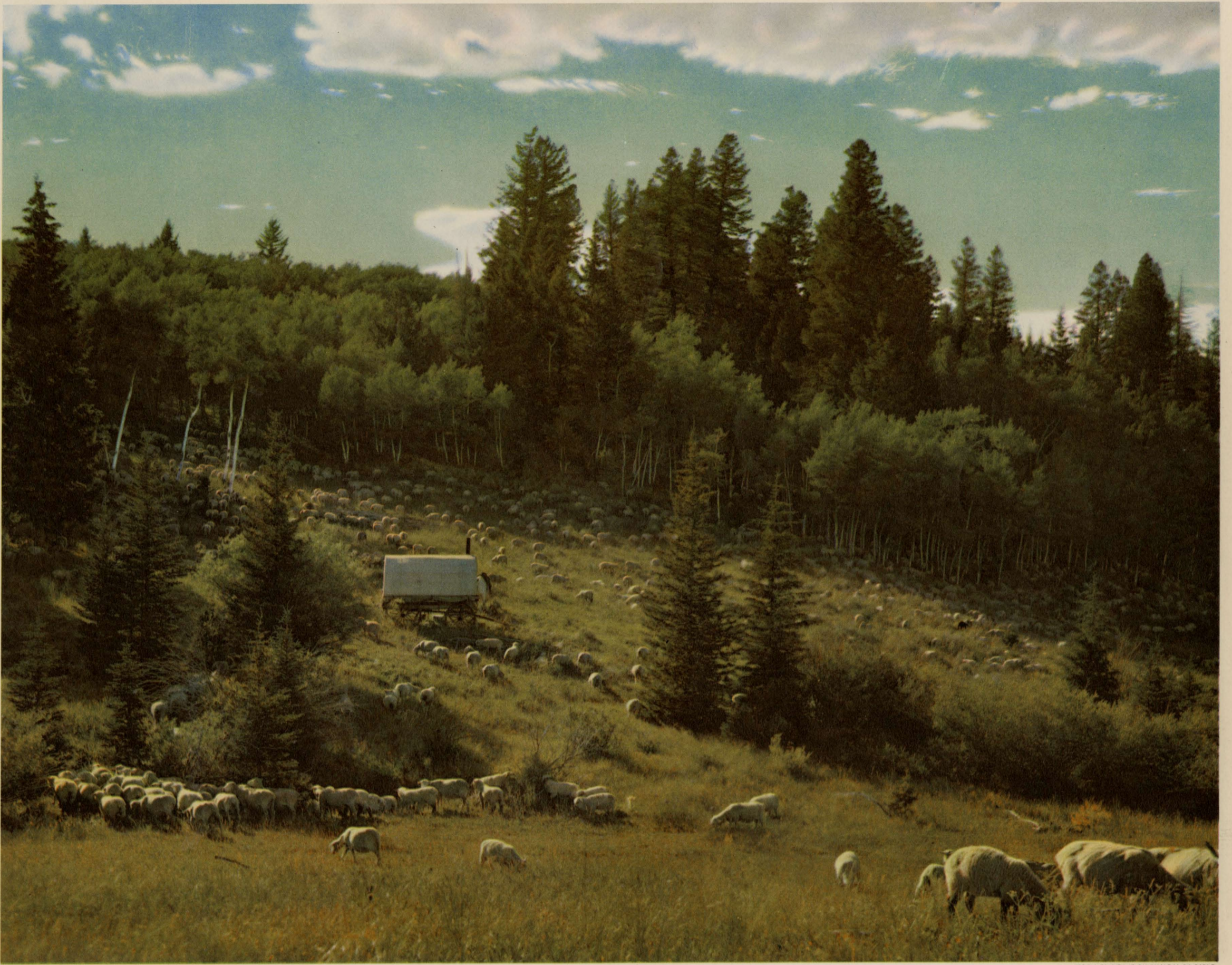
SHEEP RAISING IS AN IMPORTANT INDUSTRY IN THE UNION PACIFIC WEST