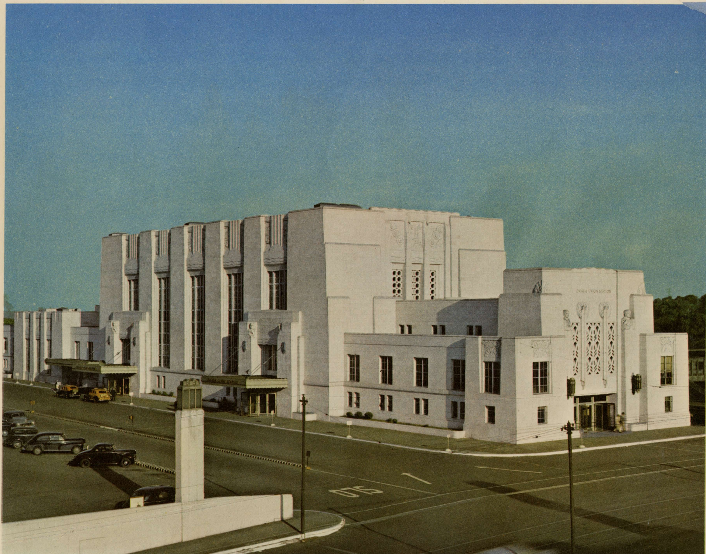
UNION STATION BUILDING OF MODERN DESIGN AT OMAHA, NEBRASKA