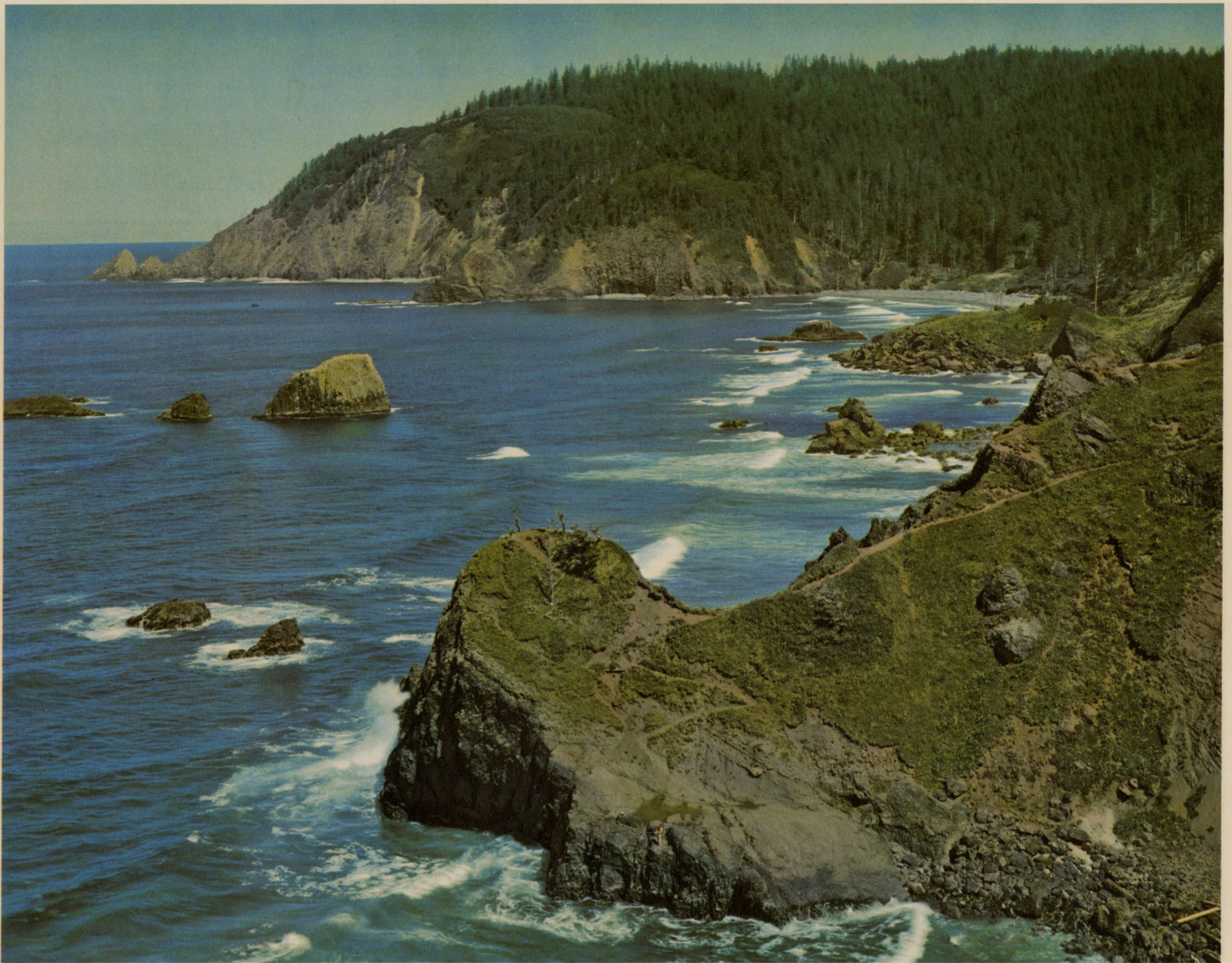
ALONG THE OREGON COASTLINE NEAR CANNON BEACH