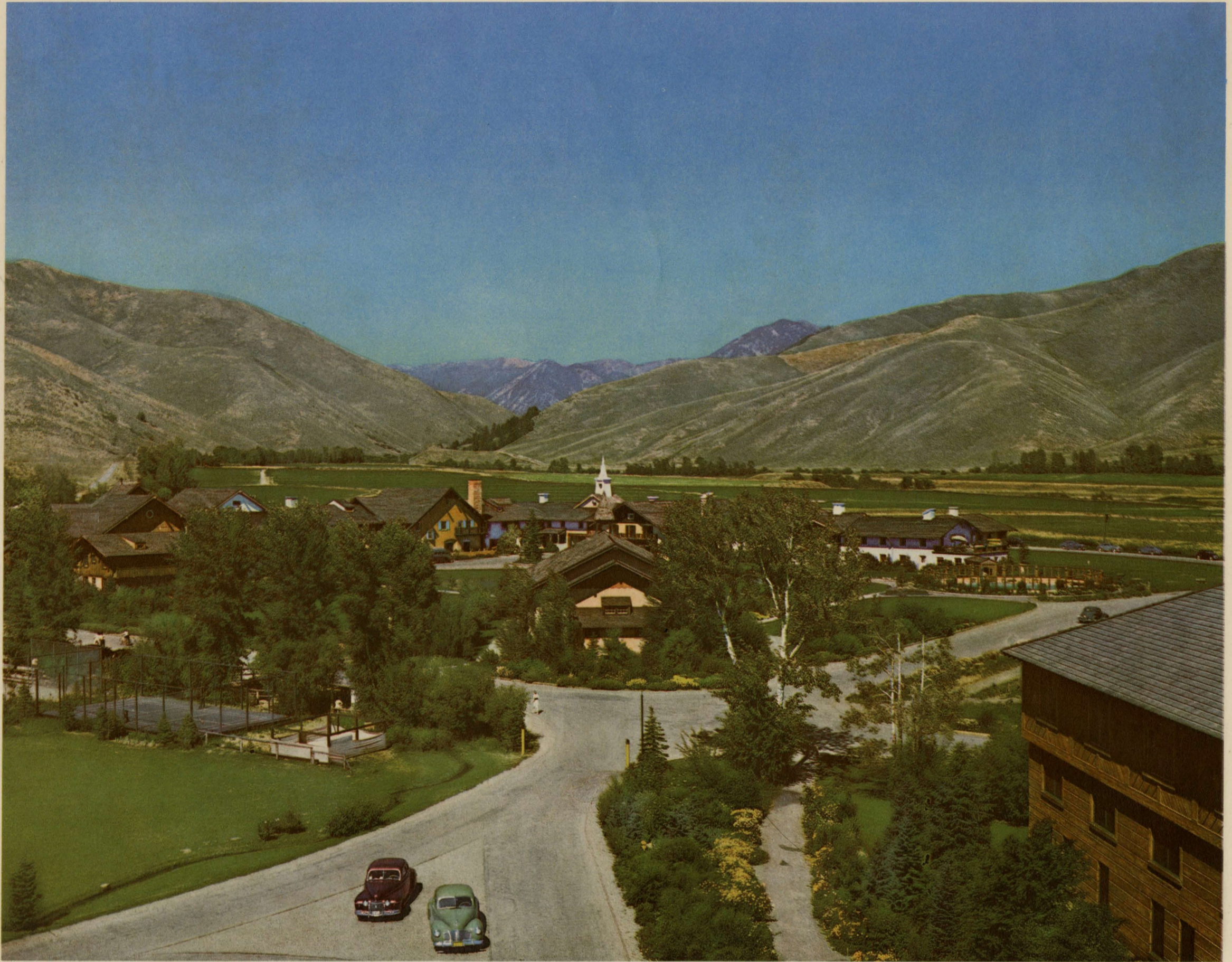
SUN VALLEY, IDAHO, A MECCA FOR SUMMER AND WINTER VACATION PILGRIMS