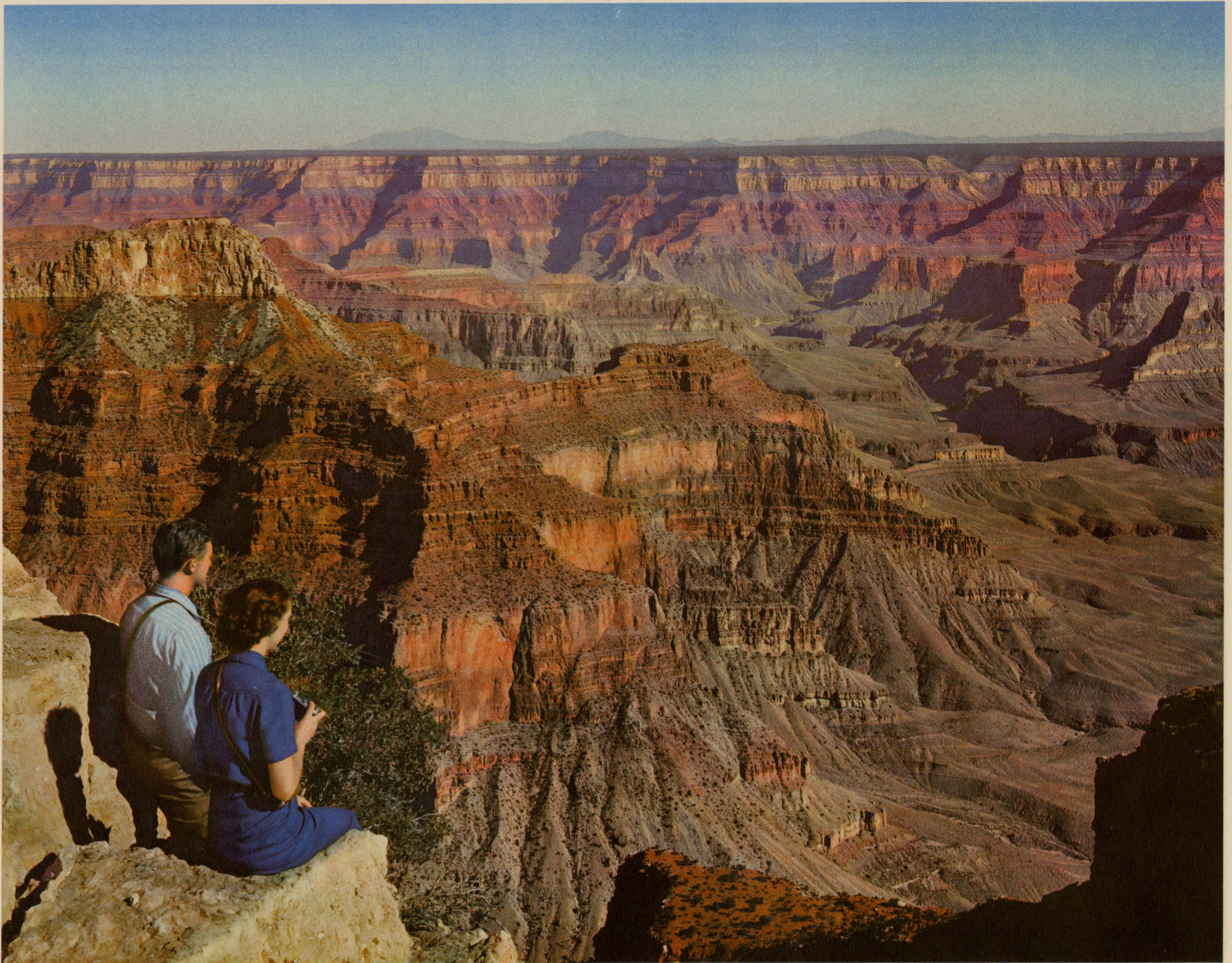
THE INCOMPARABLE GRAND CANYON FROM POINT SUBLIME ON THE NORTH RIM