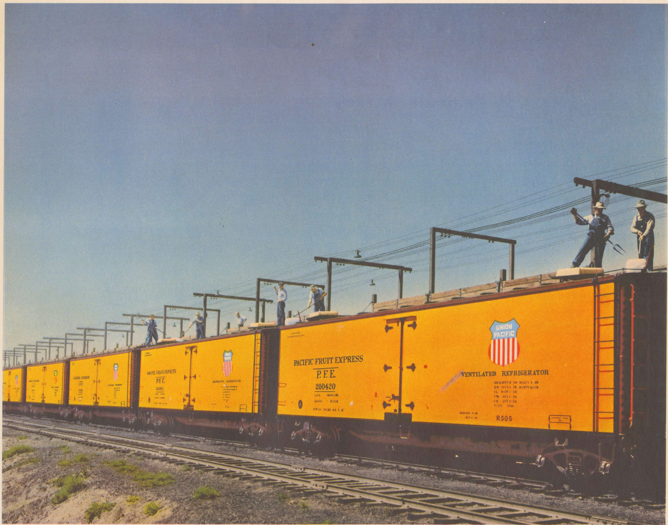
KODACHROME BY UNION PACIFIC