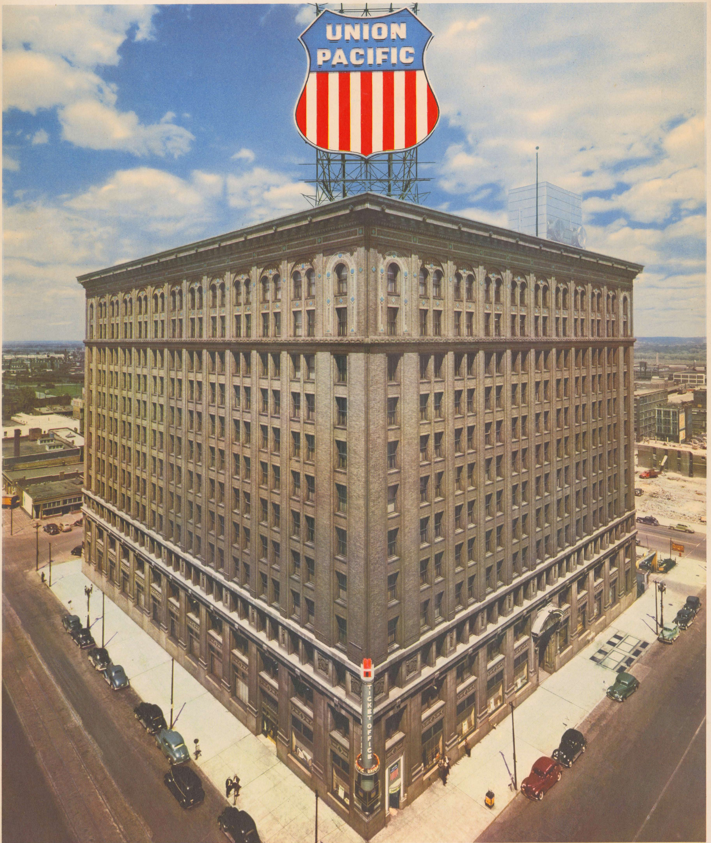
UNION PACIFIC BUILDING, OMAHA, NEBRASKA