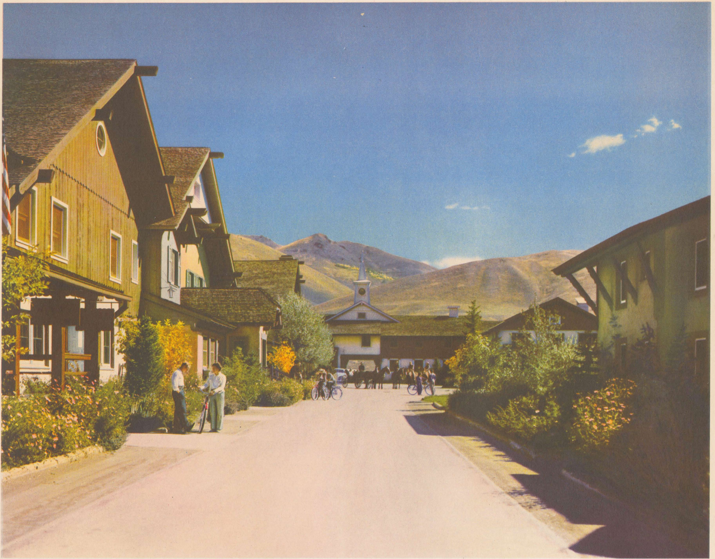
KODACHROME BY UNION PACIFIC

SUMMER VIEW OF CHALLENGER INN, SUN VALLEY, IDAHO IN THE FAMOUS SPORTS CENTER THIS POPULAR AND MODERATELY-PRICED HOSTELRY HAS A WIDE ATTRACTION FOR VACATIONISTS.