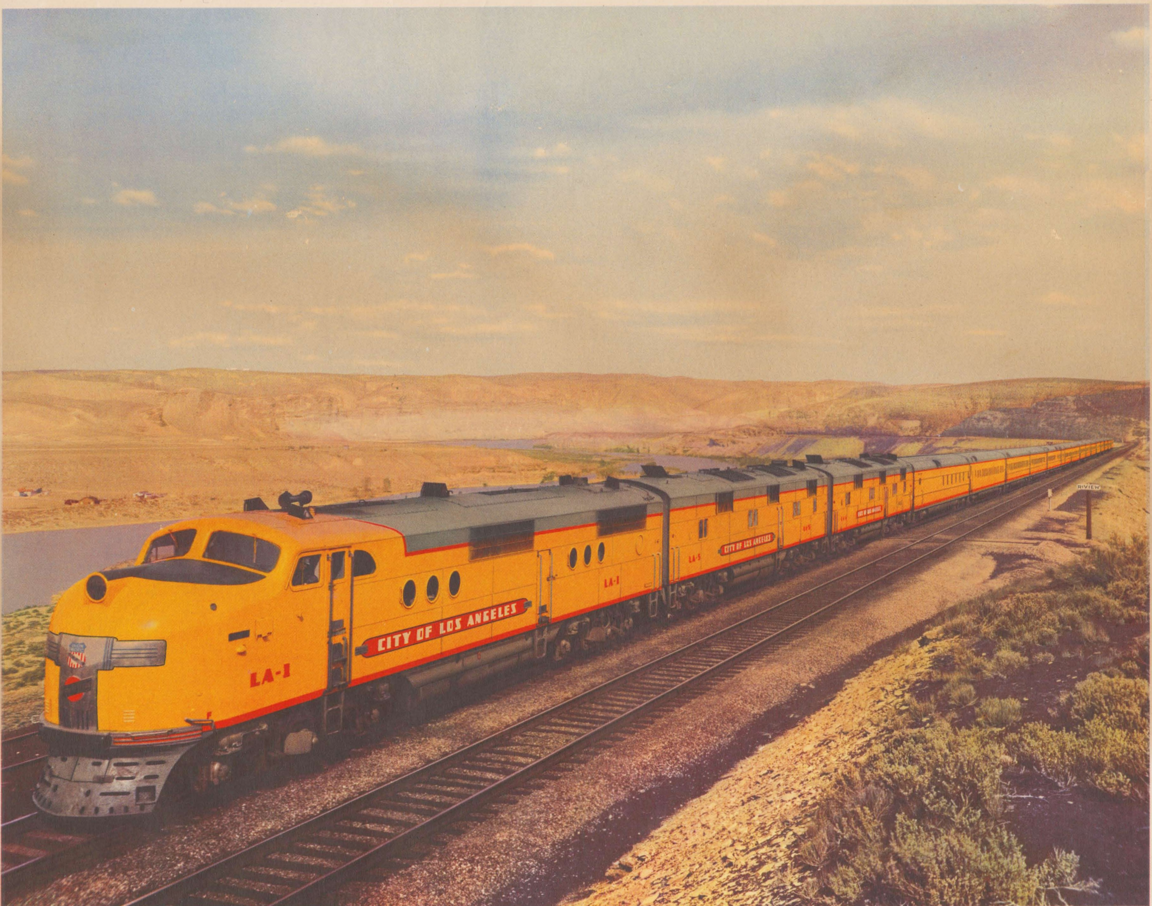
KODACHROME BY UNION PACIFIC