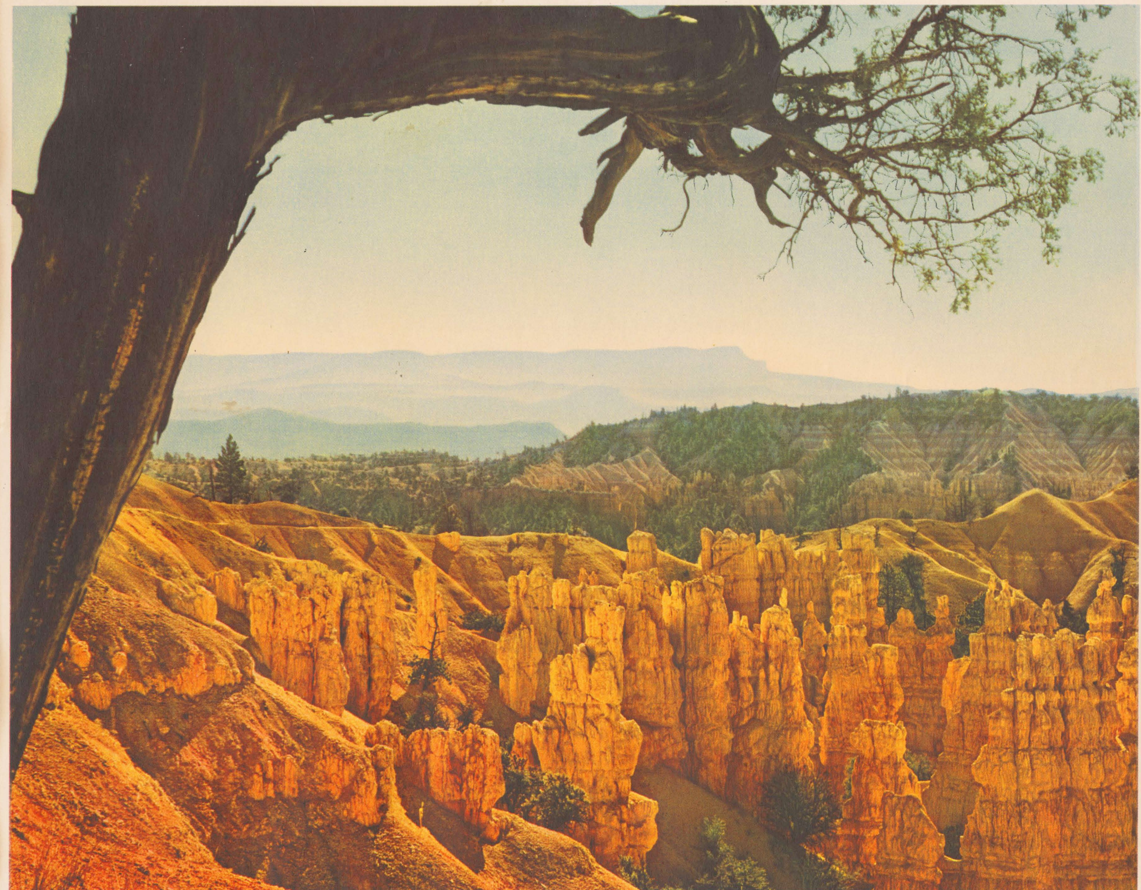
KODACHROME BY UNION PACIFIC

A CORNER OF BRYCE CANYON NATIONAL PARK, UTAH THIS GLIMPSE OF BRYCE IS REVEALING OF THE SCENIC GLORIES TO BE FOUND IN THIS BRIGHTEST JEWEL OF OUR NATIONAL PARKS.