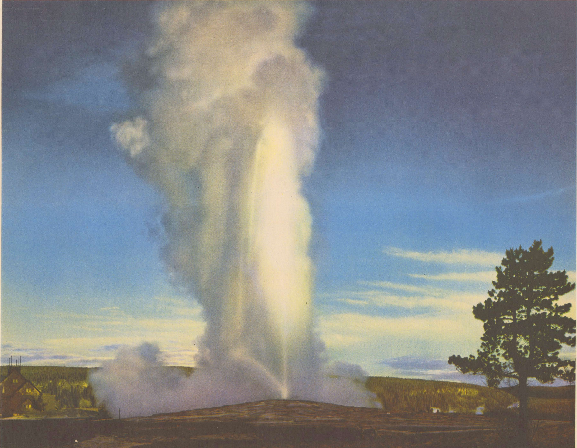
KODACHROME BY UNION PACIFIC