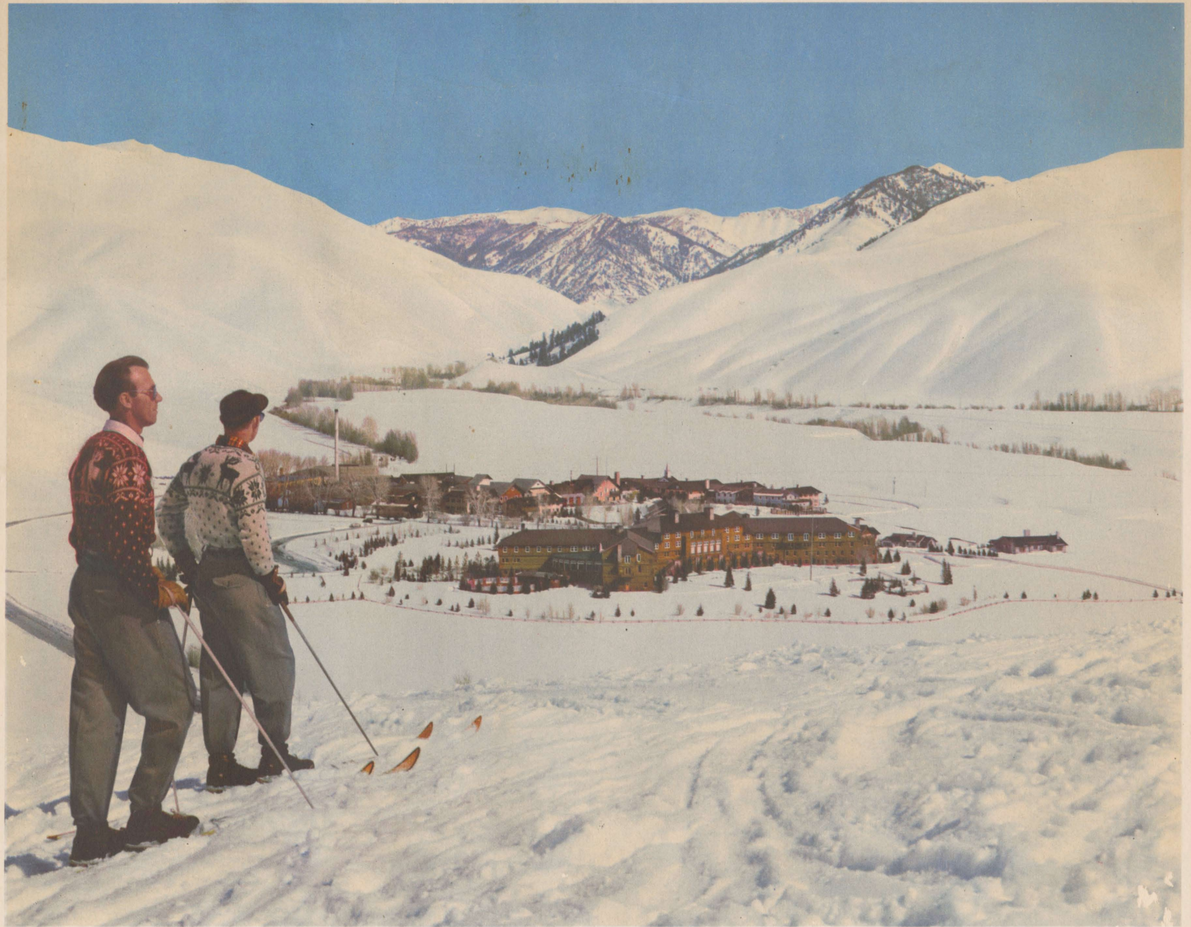
KODACHROME BY UNION PACIFIC