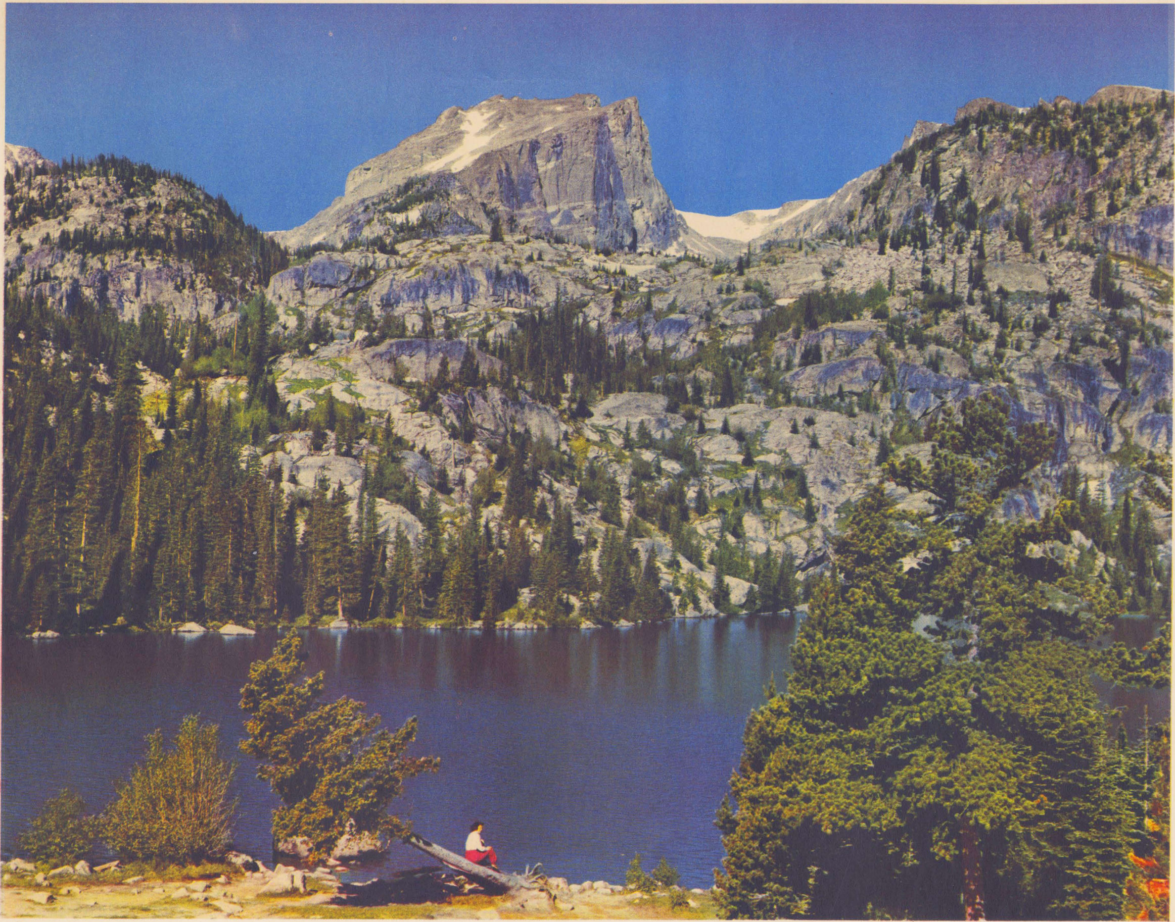
KODACHROME BY UNION PACIFIC