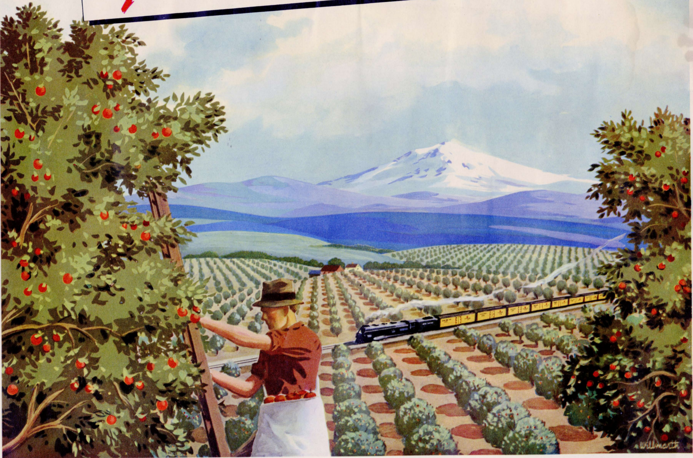
WASHINGTON . . . THE TOP STATE IN THE APPLE PRODUCTION. ITS FORESTS, FARMS, RANCHES, MINES AND FISHERIES CONTRIBUTE TO THE WEALTH OF THE NATION.