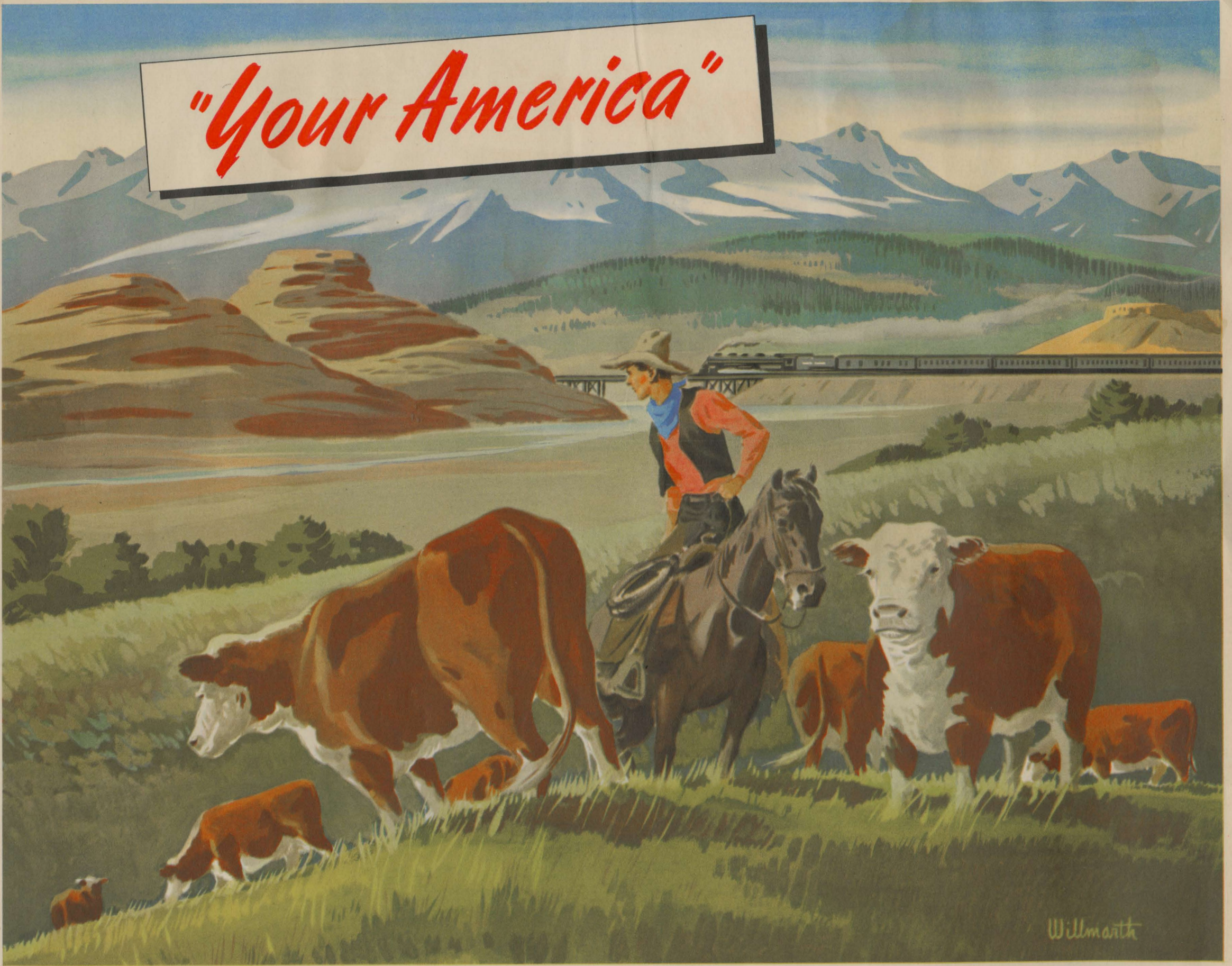
MONTANA . . . CATTLE AND SHEEP RANGE THE PICTURESQUE MOUNTAIN COUNTRY. AND OUT OF THE EARTH COME TIMBER, ORES, MINERALS AND PETROLEUM.