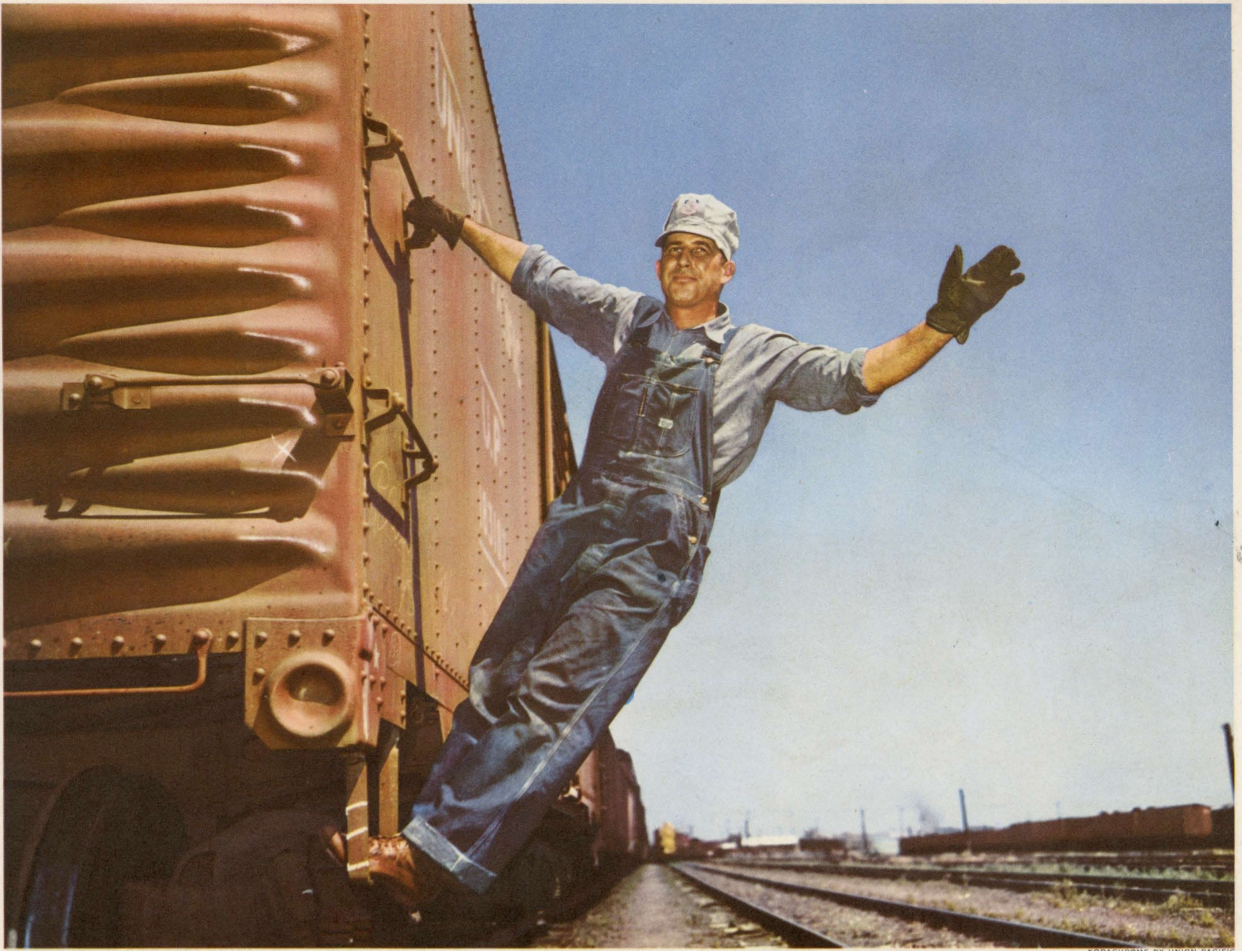
"KEEP 'EM COMING," SIGNALS THE BRAKEMAN TO THE ENGINEER IN TYPICAL RAILROAD LANGUAGE.