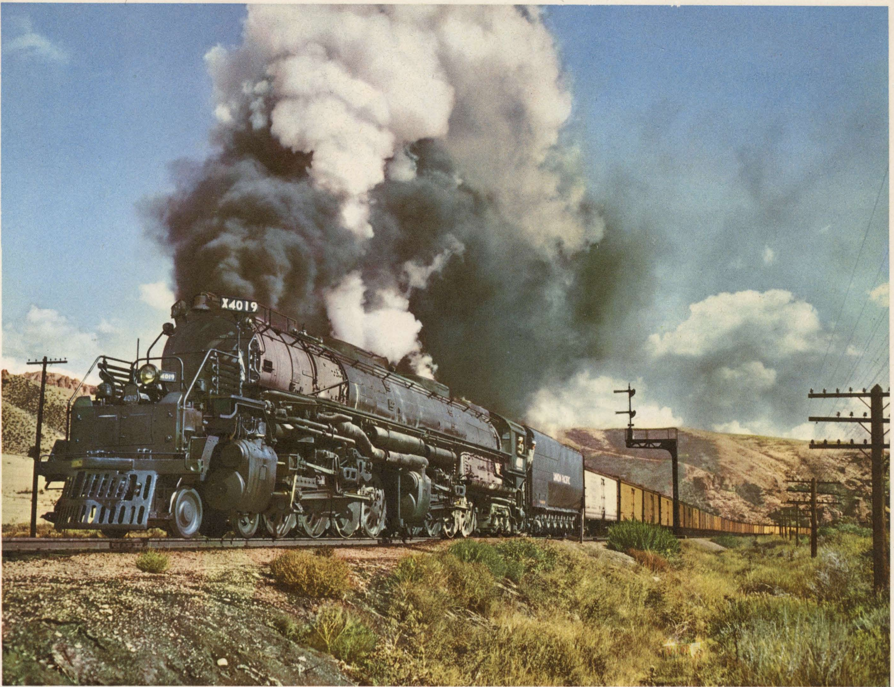
KODACHROME BY UNION PACIFIC