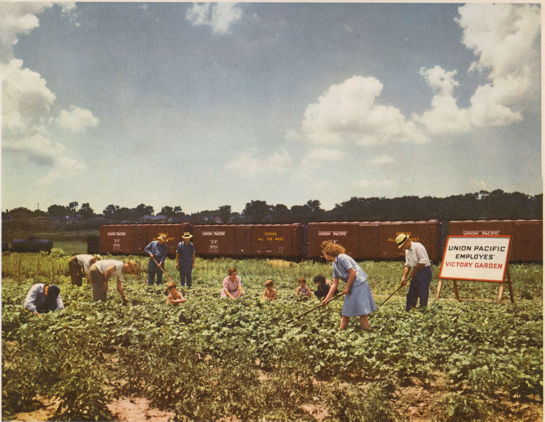
UNION PACIFIC EMPLOYEES NOT ONLY "KEEP 'EM ROLLING" BUT HAVE ENTHUSIASTICALLY SUPPORTED VARIOUS WAR EFFORTS SUCH AS VICTORY GARDENING.