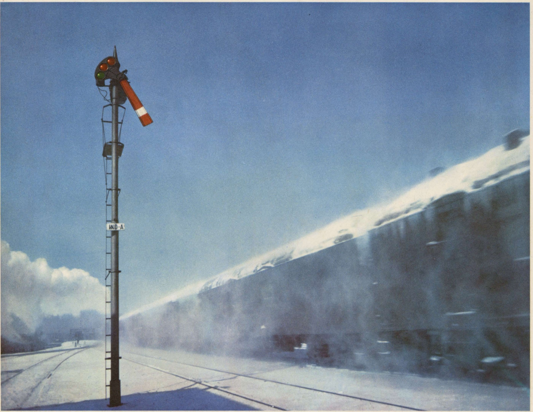
KODACHROME BY UNION PACIFIC