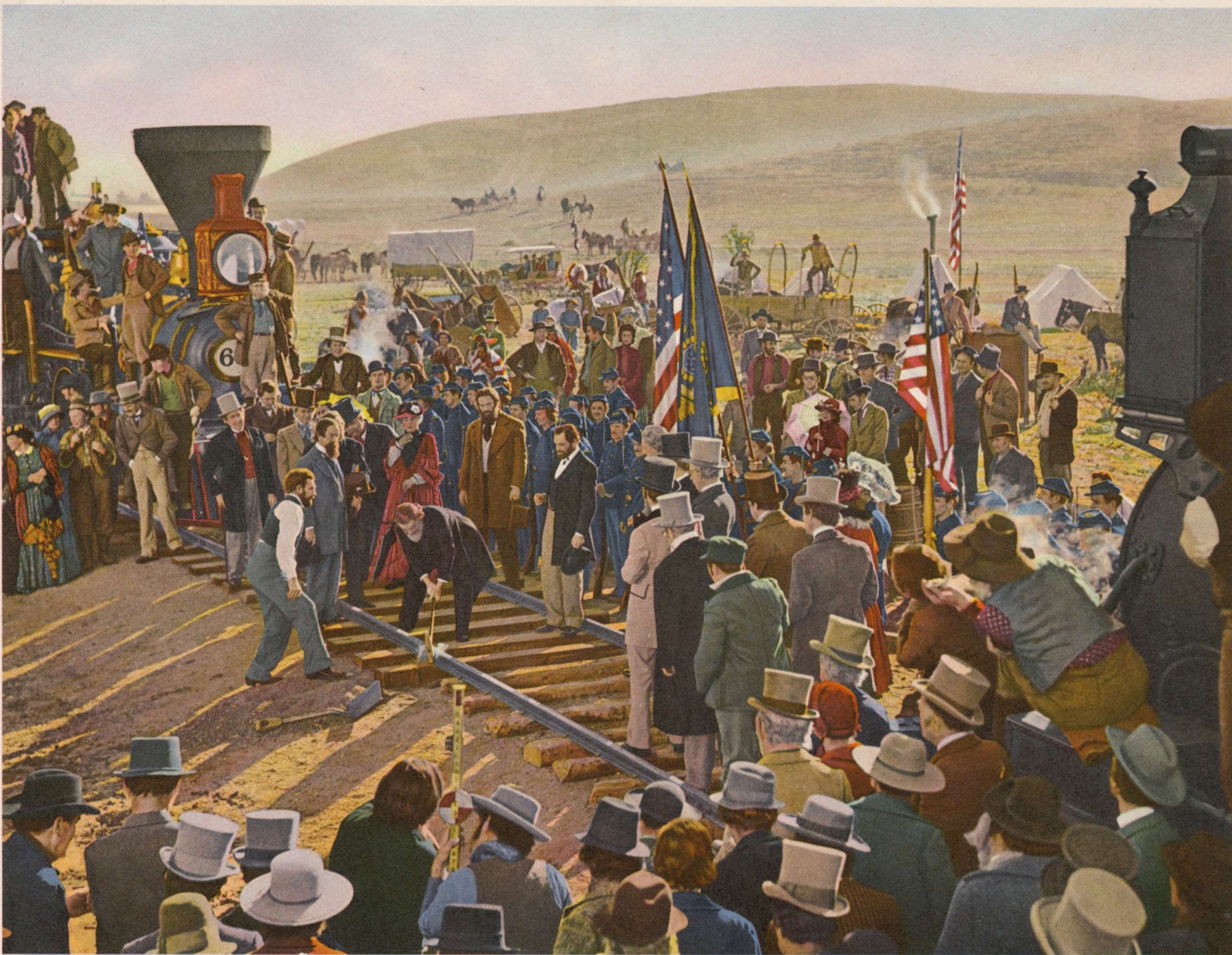
THE DRIVING OF THE GOLDEN SPIKE MAY 10, 1869, COMPLETED THE RAILROAD THAT HELPED TO UNIFY AMERICA. (FROM CECIL B. DEMILLE'S PARAMOUNT PICTURE, "UNION PACIFIC")