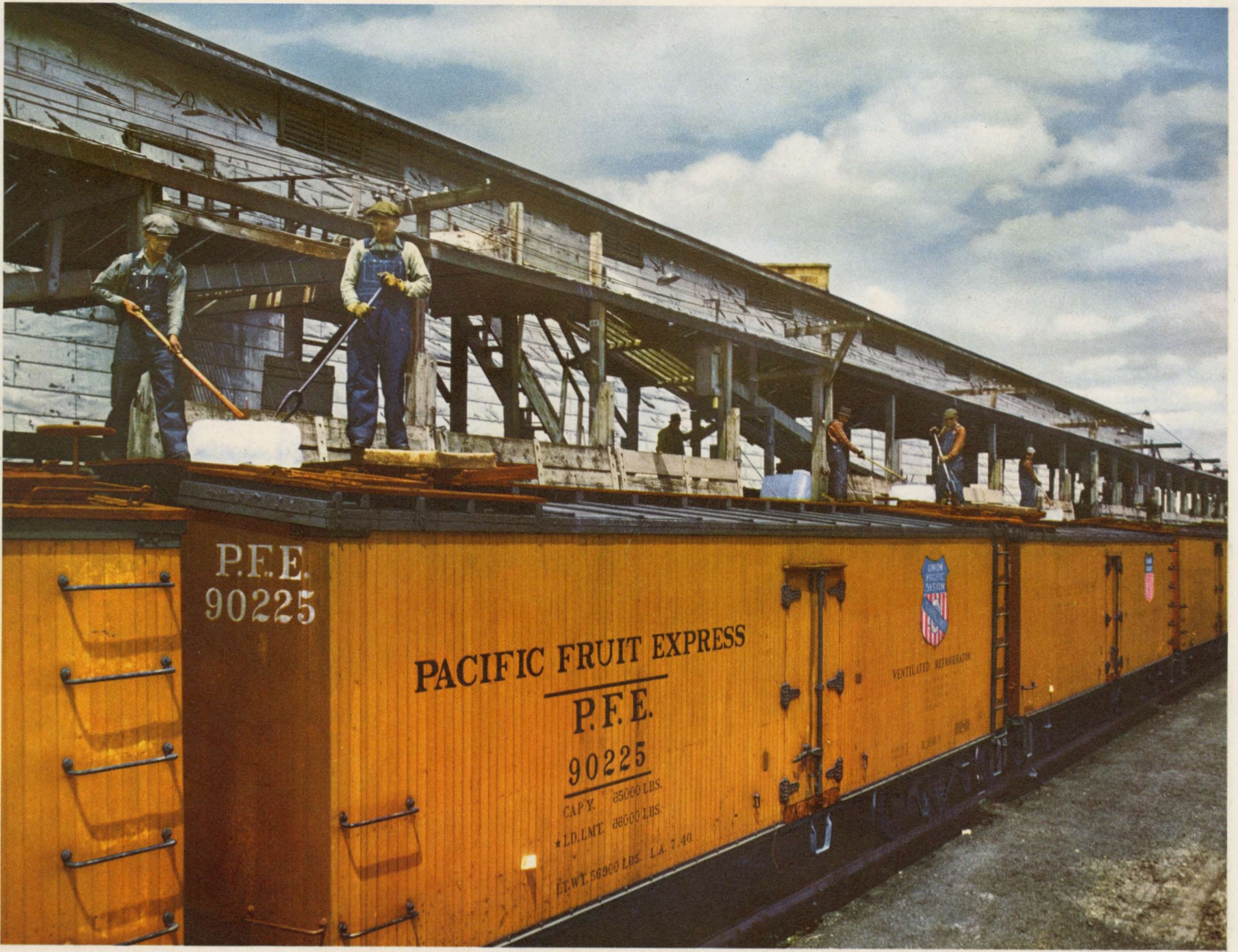
SCORES OF TRAINED WORKERS FEED ICE INTO REFRIGERATOR CARS TO KEEP PERISHABLE FOODS FRESH ON THEIR TRANSCONTINENTAL JOURNEY.