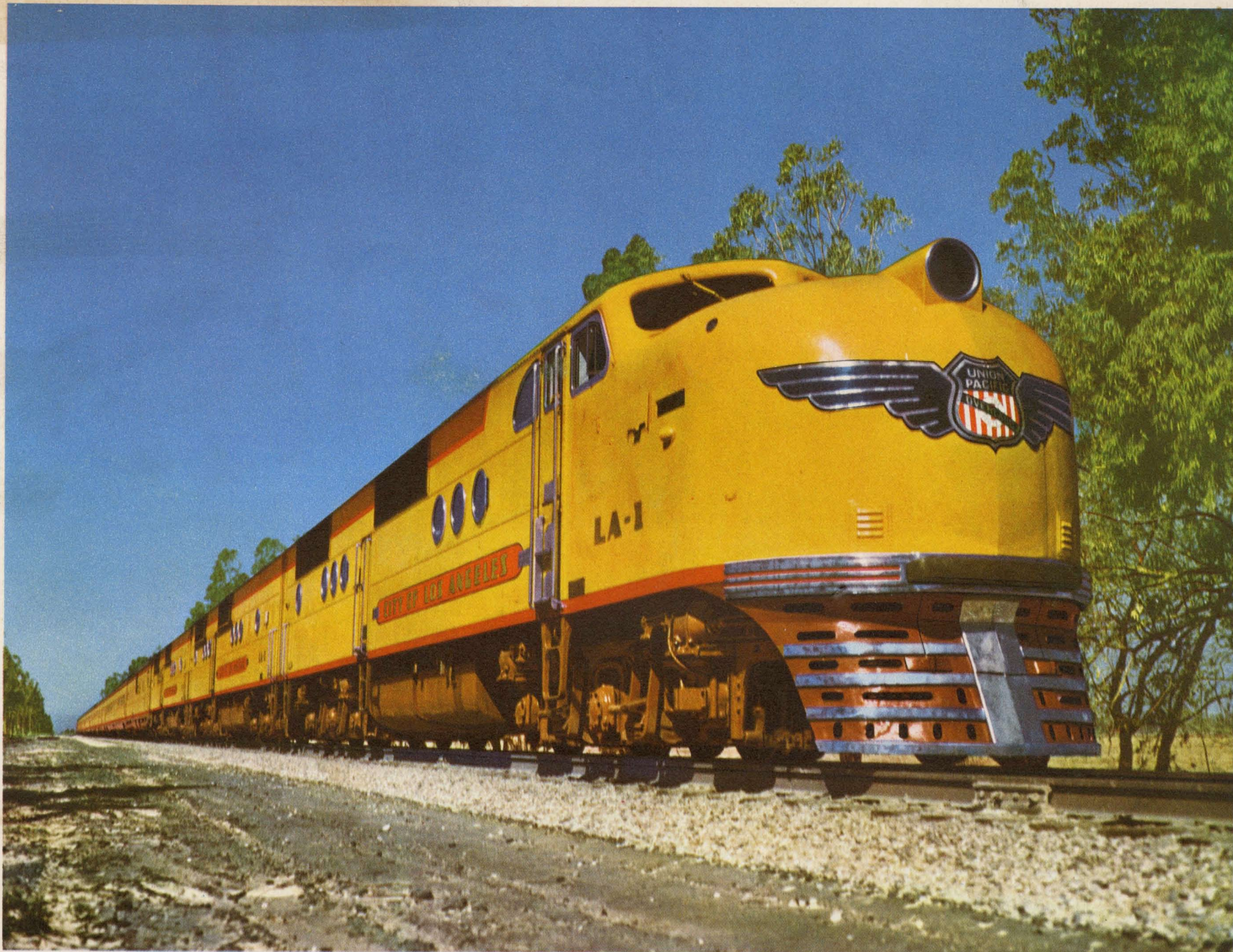
KODACHROME BY UNION PACIFIC