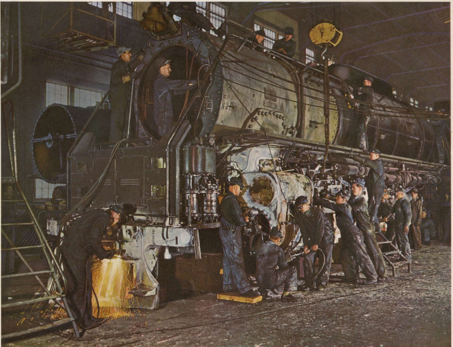
KODACHROME BY UNION PACIFIC