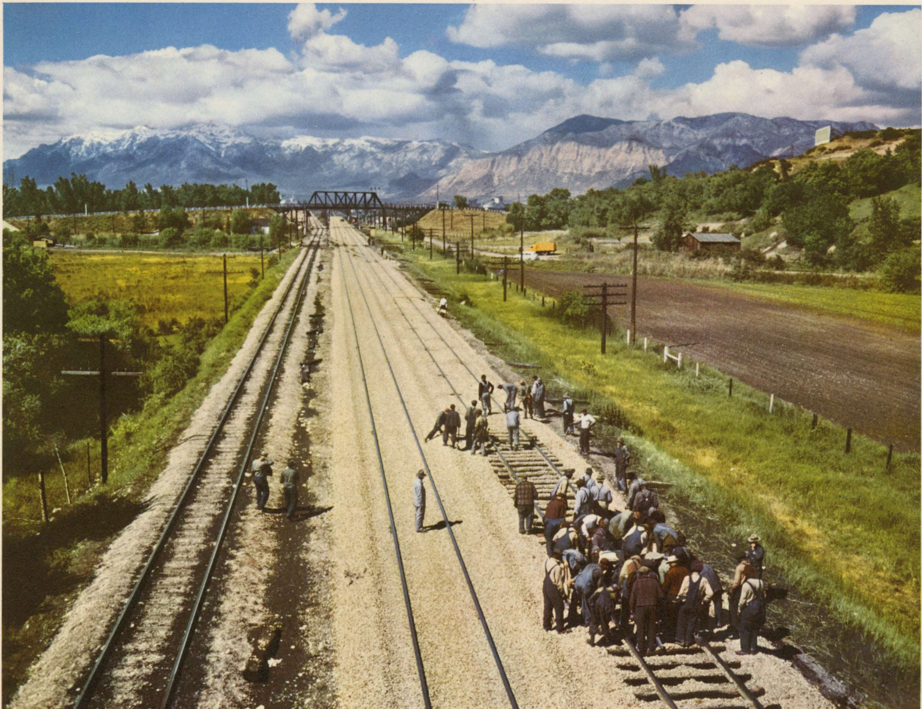
"GROUND CREWS" AT WORK. THEY'RE SKILLED IN THE "KNOW-HOW" OF MAINTAINING UNION PACIFIC'S STEEL HIGHWAY, FAMED FOR ITS SMOOTH, EASY RIDING QUALITIES.